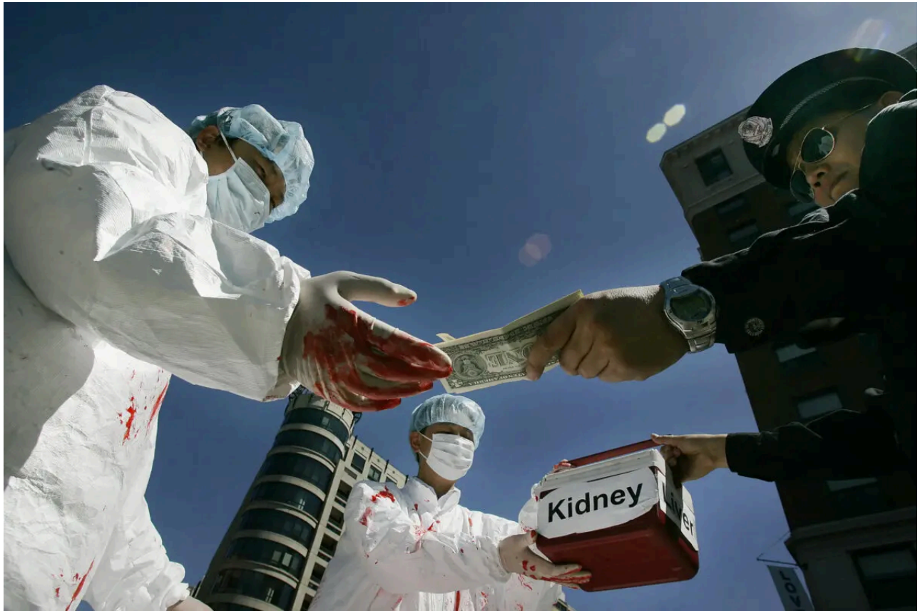
Falun Gong practitioners re-enact illegal payment for human organs in Washington on April 19, 2016.