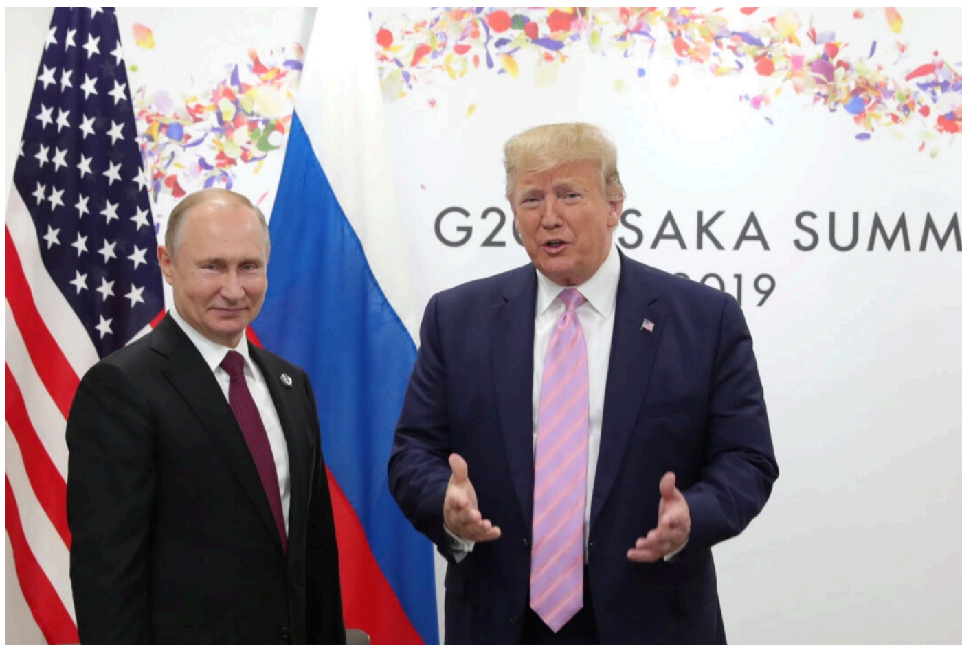
Russia's President Vladimir Putin and then U.S. President Donald Trump attend a meeting on the sidelines of the G20 summit in Osaka, Japan on June 28, 2019.