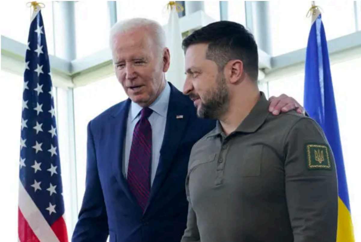
U.S. President Joe Biden (L) walks with Ukraine's President Volodymyr Zelenskyy ahead of a working session on Ukraine during the G-7 Leaders' Summit in Hiroshima, Japan, on May 21, 2023.

Trump has been heavily critical of the Biden administration's handling of the conflict.