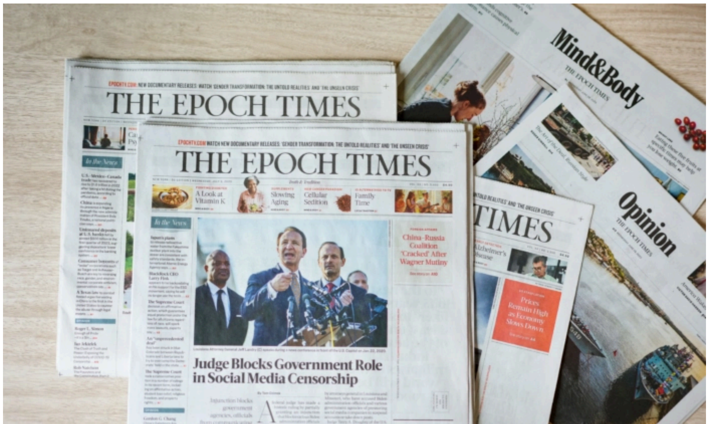
Stacks of The Epoch Times newspaper in New York City on July 13, 2023.