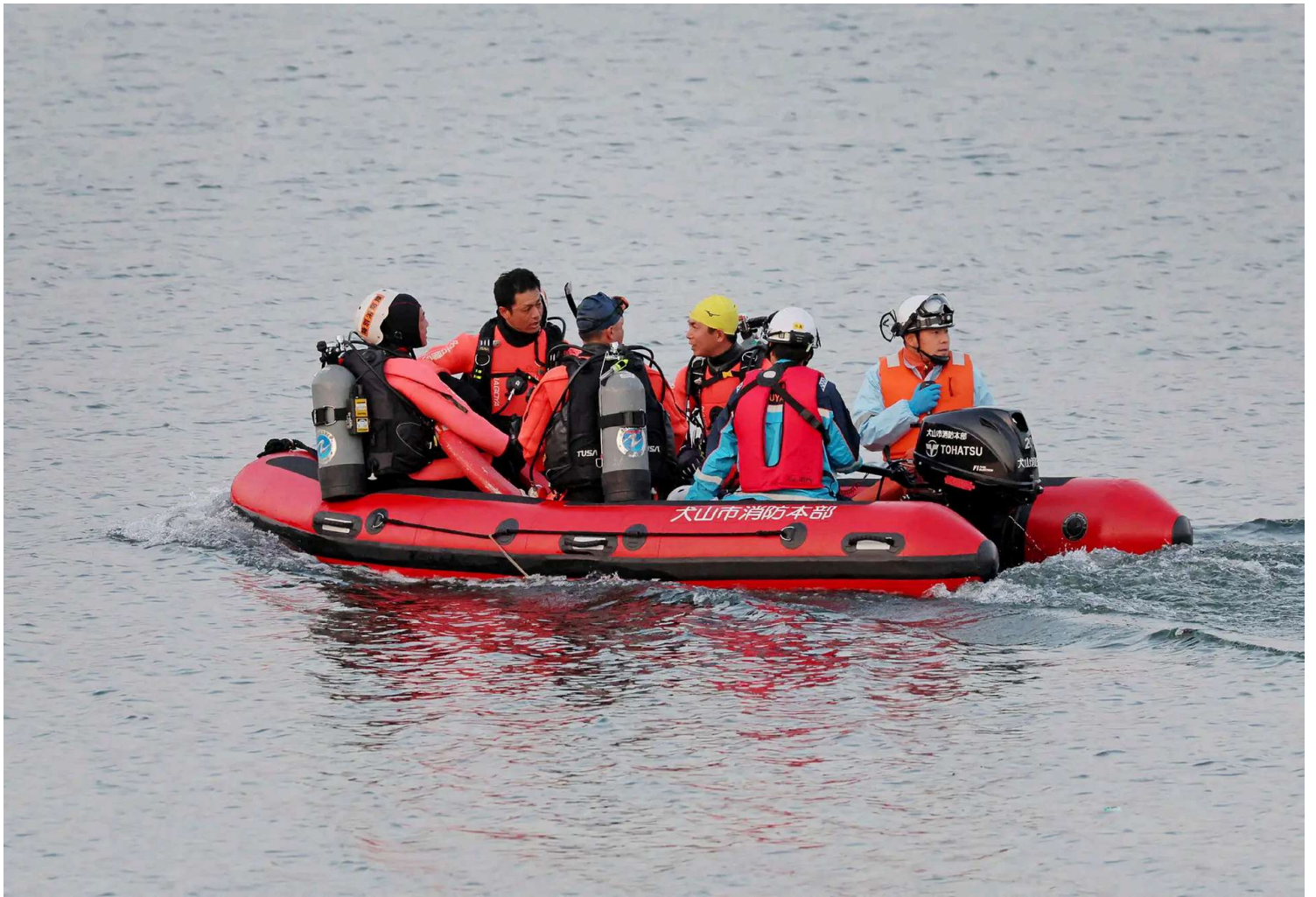
Firefighters search the area where a Japan Air Self-Defense Force training plane crashed, at Lake Iruka in Inuyama City, Japan, on May 14, 2025. The plane crashed near a lake shortly after takeoff with two people on board, authorities said on May 14.