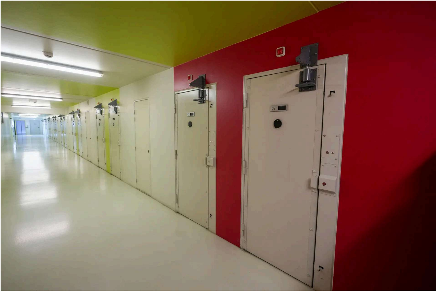
Cell doors are shown inside the prison center of Vendin-le-Vieil, France, currently being refurbished to become one of the country's two high-security prison centers adapted for prisoners linked to organized crime, on May 14, 2025. One year after an attack on a van carrying French convict and drug trafficker Mohamed Amra in an attempt to free him, French President Emmanuel Macron is making several visits on the theme of the fight against organized crime and commemorating the event that cost the lives of two prison officers.