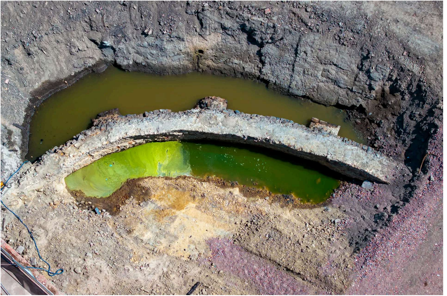
This aerial drone image shows the Motte archaeological site in Ieper, Belgium, on May 14, 2025. Archaeologists stumbled upon the remains of a medieval burial domain, dating back to the 12th century, during excavations. The unique find sheds new light on Ypres' earliest history and its role as one of Flanders' most important cities in the Middle Ages.