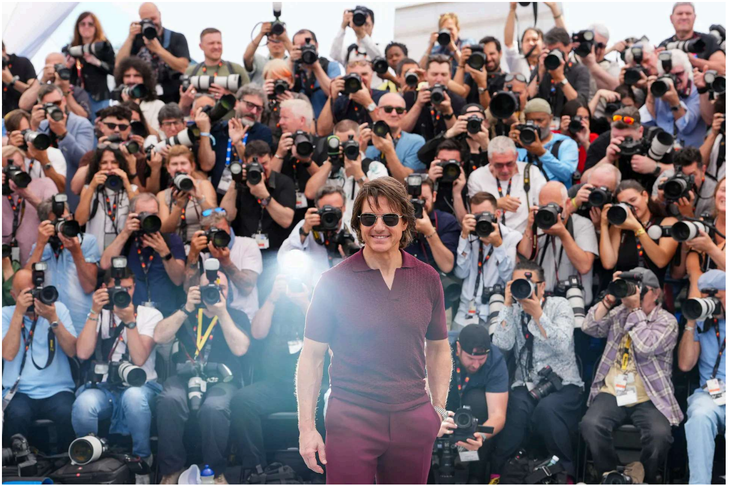
Tom Cruise poses for photographers during the photo call for the film 'Mission: Impossible – The Final Reckoning' at the 78th international film festival, Cannes, France, on May 14, 2025.