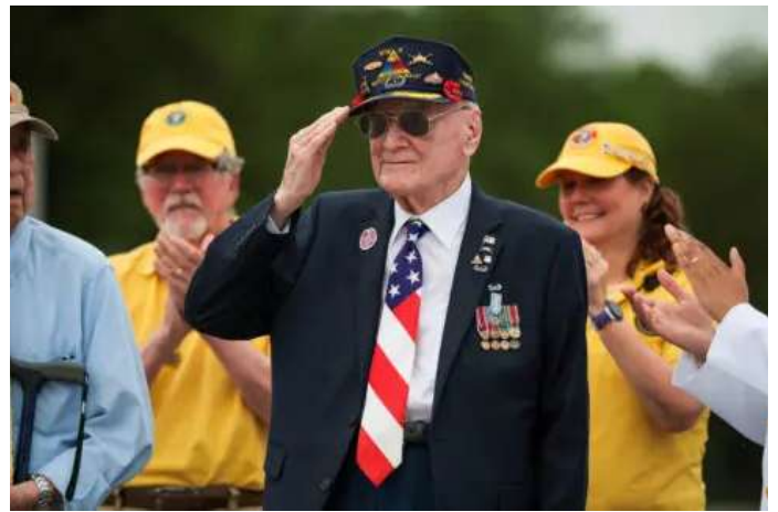
Day in Photos: Victory Day, Building Collapse in Senegal, and Traditional Wrestling Competition