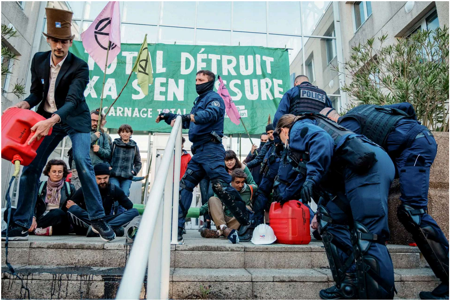
Police officers move toward a climate activist with a can of fake oil—black water-based paint—in front of the entrance to AXA's regional headquarters, blocked by a banner reading