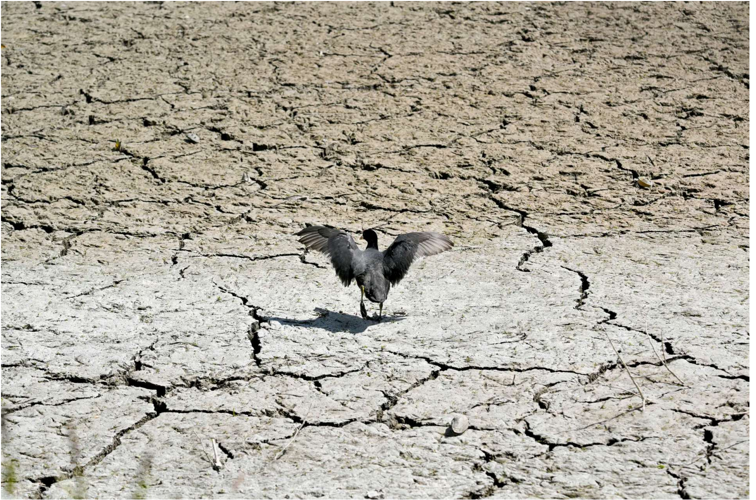
A Eurasian coot walks on an almost dry pond near Oud-Heverlee, Belgium, on May 14, 2025. According to weather experts, it has been at least 130 years since Belgium last experienced such a dry spring.