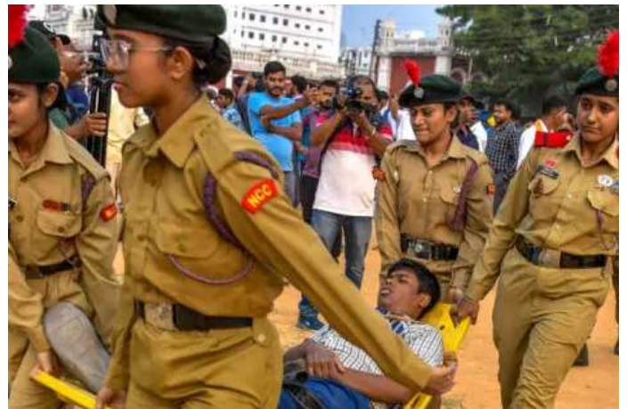
Day in Photos: Military Exercises in India, Strikes on Yemen, and Golden Snub-Nosed Monkeys