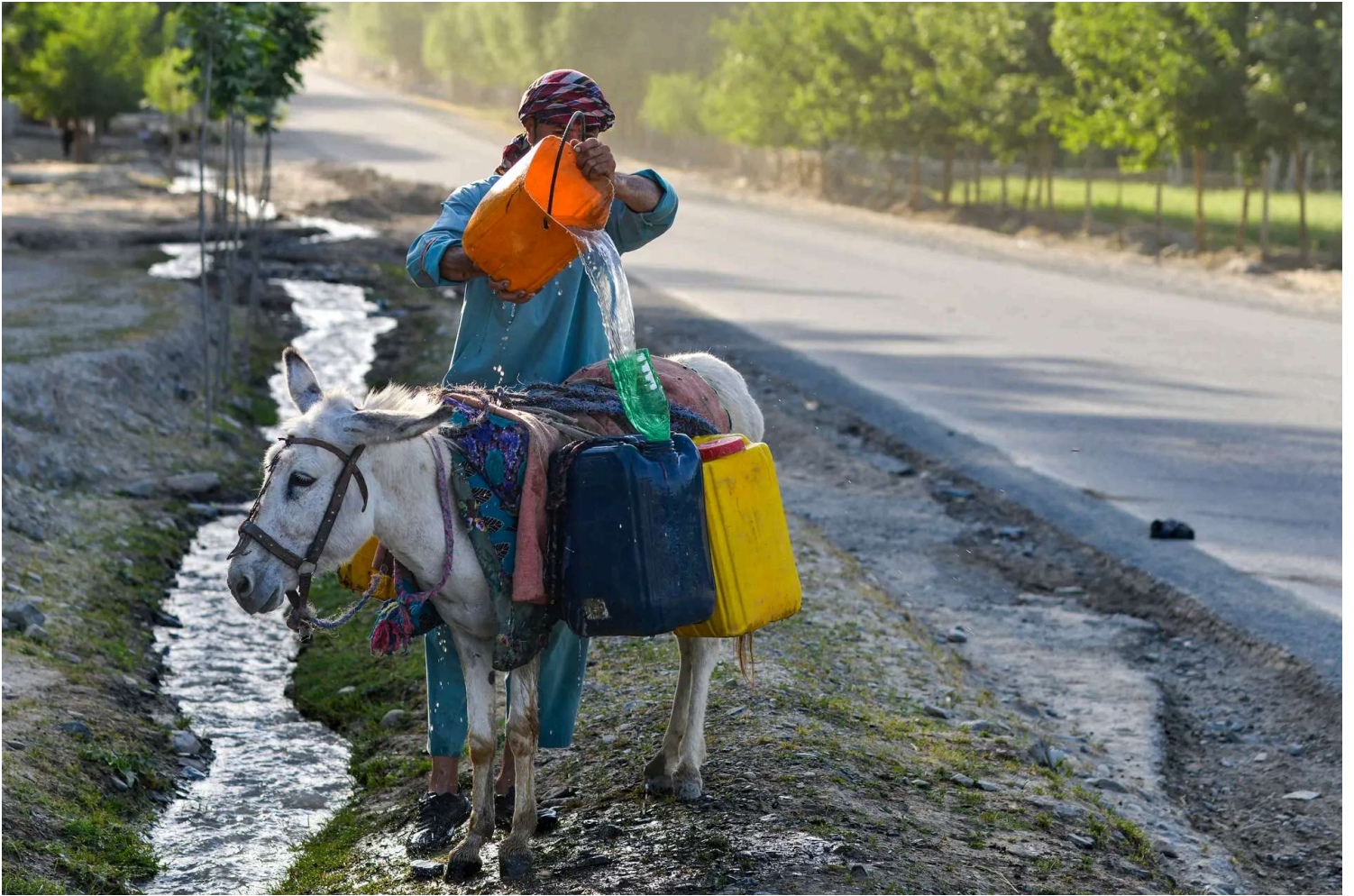
An Afghan man fills containers with water from a roadside stream, loading them onto a donkey's pack on the outskirts of the Fayzabad district, Badakhshan Province, on May 14, 2025.