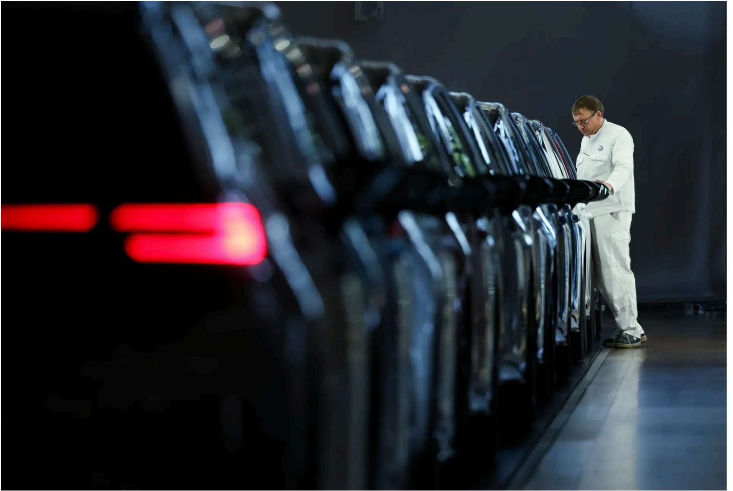
A worker performs a final check on new Volkswagen ID.3 electric cars at the Volkswagen plant in Dresden, Germany, on May 14, 2025. Volkswagen led electric car sales in Germany that rose 54 percent overall in April compared to April of last year.