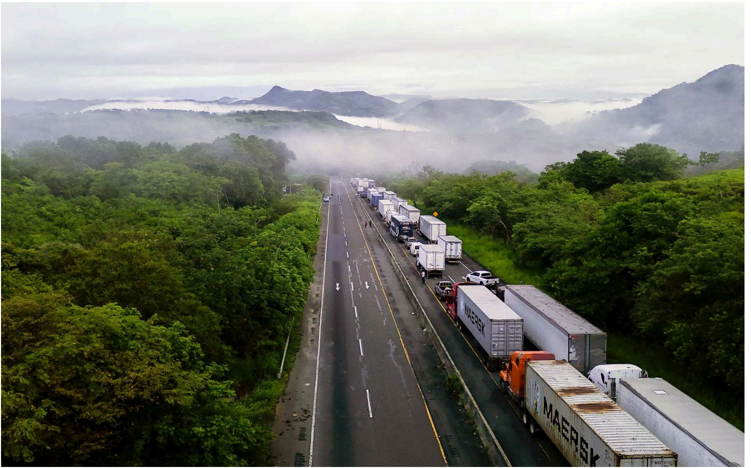
Hundreds of trucks are stranded by highway blockades protesting against the government of Jose Raul Mulino in Veraguas, located 150 km west of Panama City, on May 14, 2025.