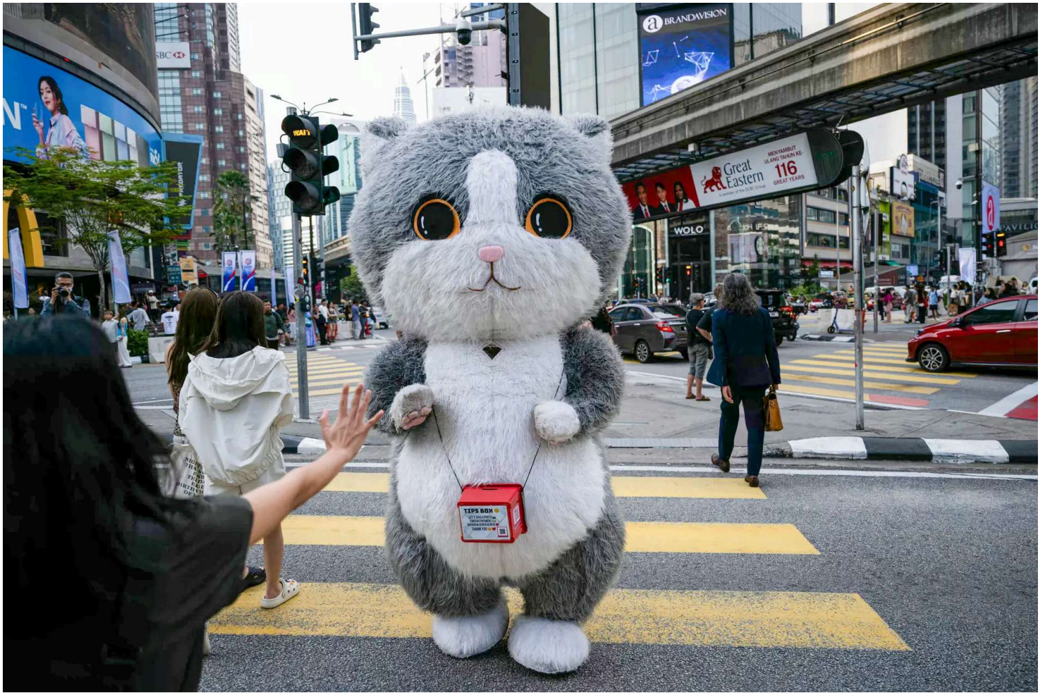
A woman playfully gestures at a person in a cat costume in Kuala Lumpur, Malaysia, on May 14, 2025.