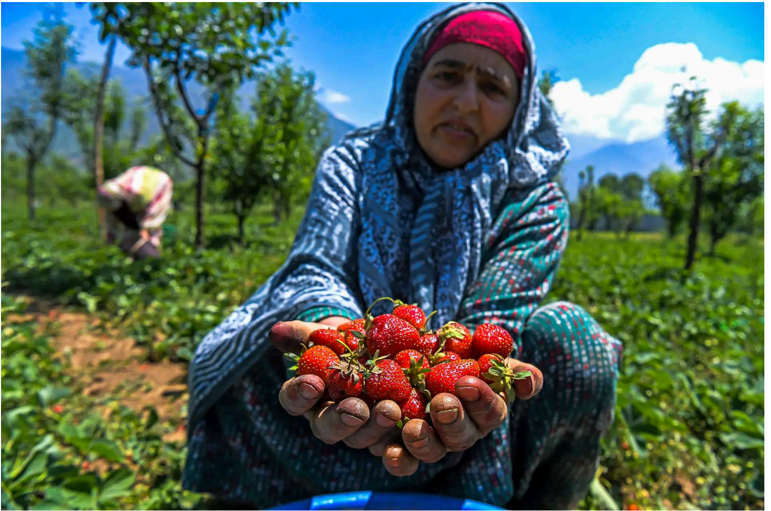
A woman holds freshly picked strawberries at a farm in Gassu on the outskirts of Srinagar, India, on May 14, 2025.