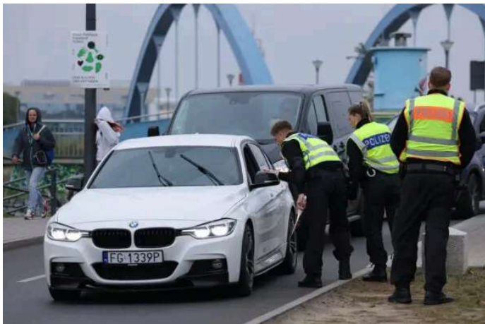
Germany to Turn Away More Asylum Seekers at Border