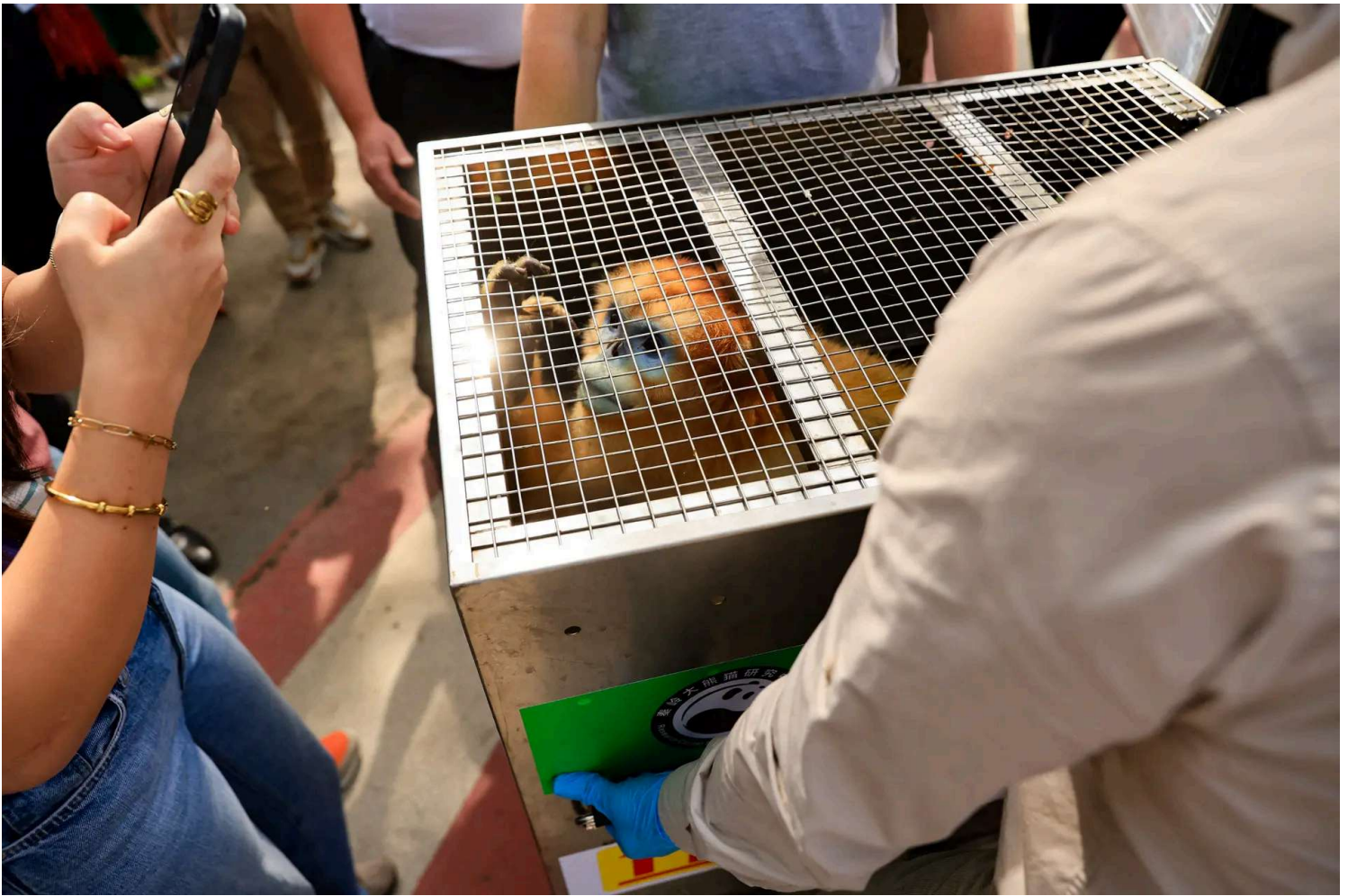
The first Qinling golden monkeys to arrive at Pairi Daiza animal park are welcome, in Brugelette, Belgium, on May 14, 2025. Pairi Daiza will become the first animal park in the world to welcome three representatives of this extremely rare subspecies of snub-nosed monkey.