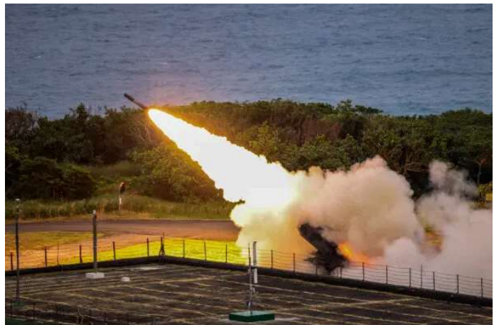
Day in Photos: Taiwan Missile Test, Finland's President in Kenya, and Hamas Releases Hostage