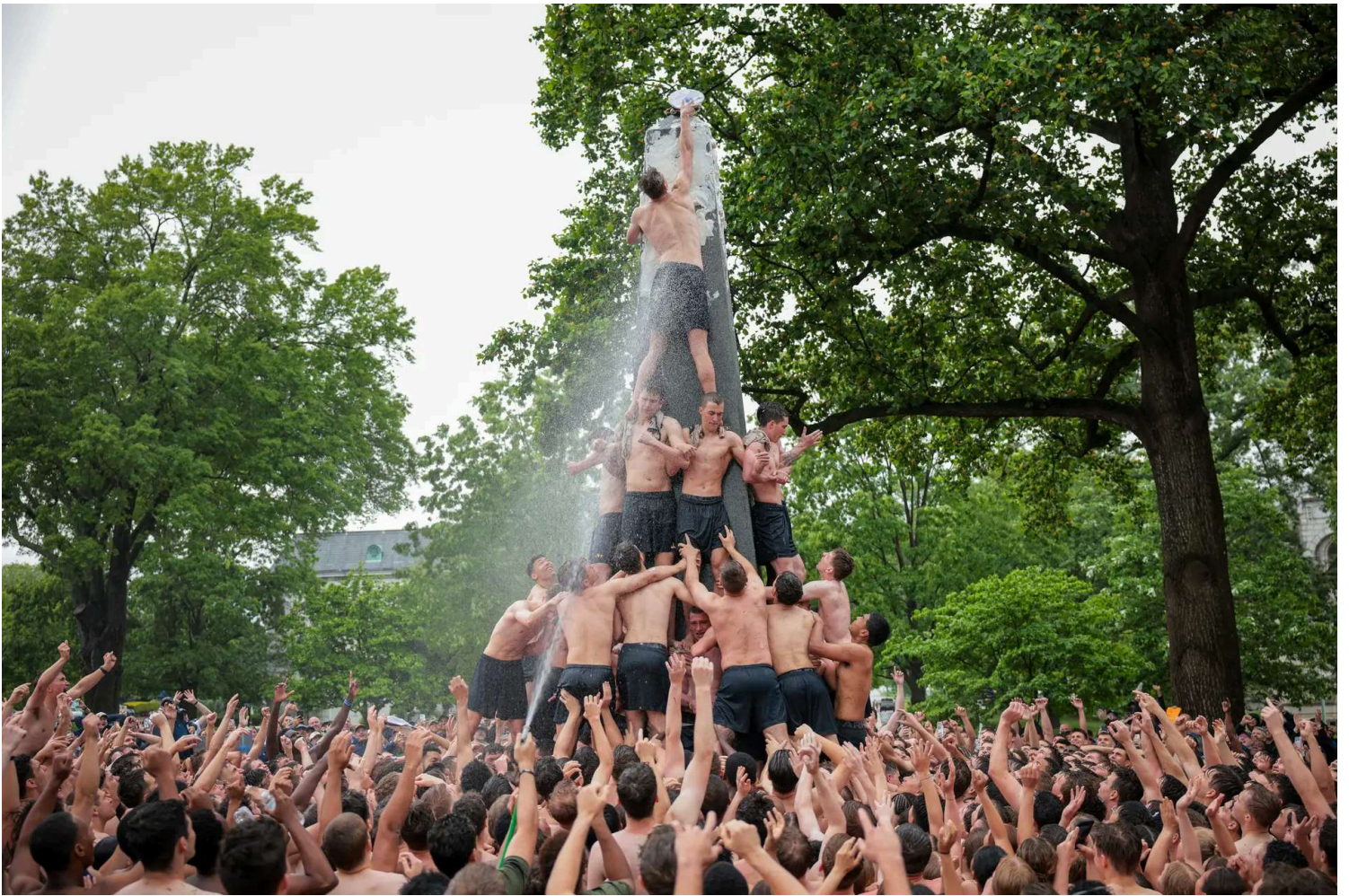
U.S. Naval Academy freshman ("plebes") are sprayed with water during the annual Herndon Monument climb at the U.S. Naval Academy in Annapolis, Md., on May 14, 2025. In the annual tradition, the plebes attempt to scale the 21-foot greased monument to knock off a "dixie cup" hat and replace it with an upperclassman's hat. The 2028 midshipmen's class took 2 hours, 27 minutes and 31 seconds to scale the monument and replace the hat.