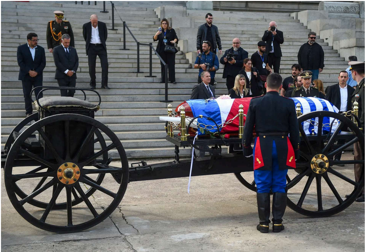
Uruguay's President Yamandu Orsi (2nd L) and Presidency Secretary Alejandro Sanchez (L) pay respects to the funeral cortege of Uruguay's former President Jose 'Pepe' Mujica at the Palacio Legislativo in Montevideo, on May 14, 2025, a day after his death. Mujica, an ex-guerrilla fighter and hero of the Latin American left, died on May 13, 2025, at the age of 89.