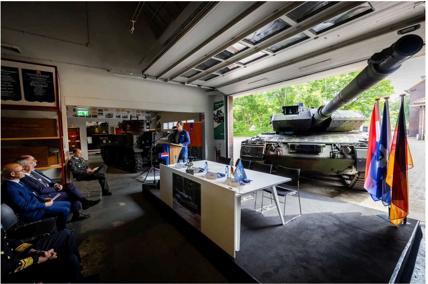
Netherlands' Defense Minister Gijs Tuinman speaks during a contract signing for new German-made Leopard battle tanks in Amersfoort, Netherlands, on May 14, 2025.