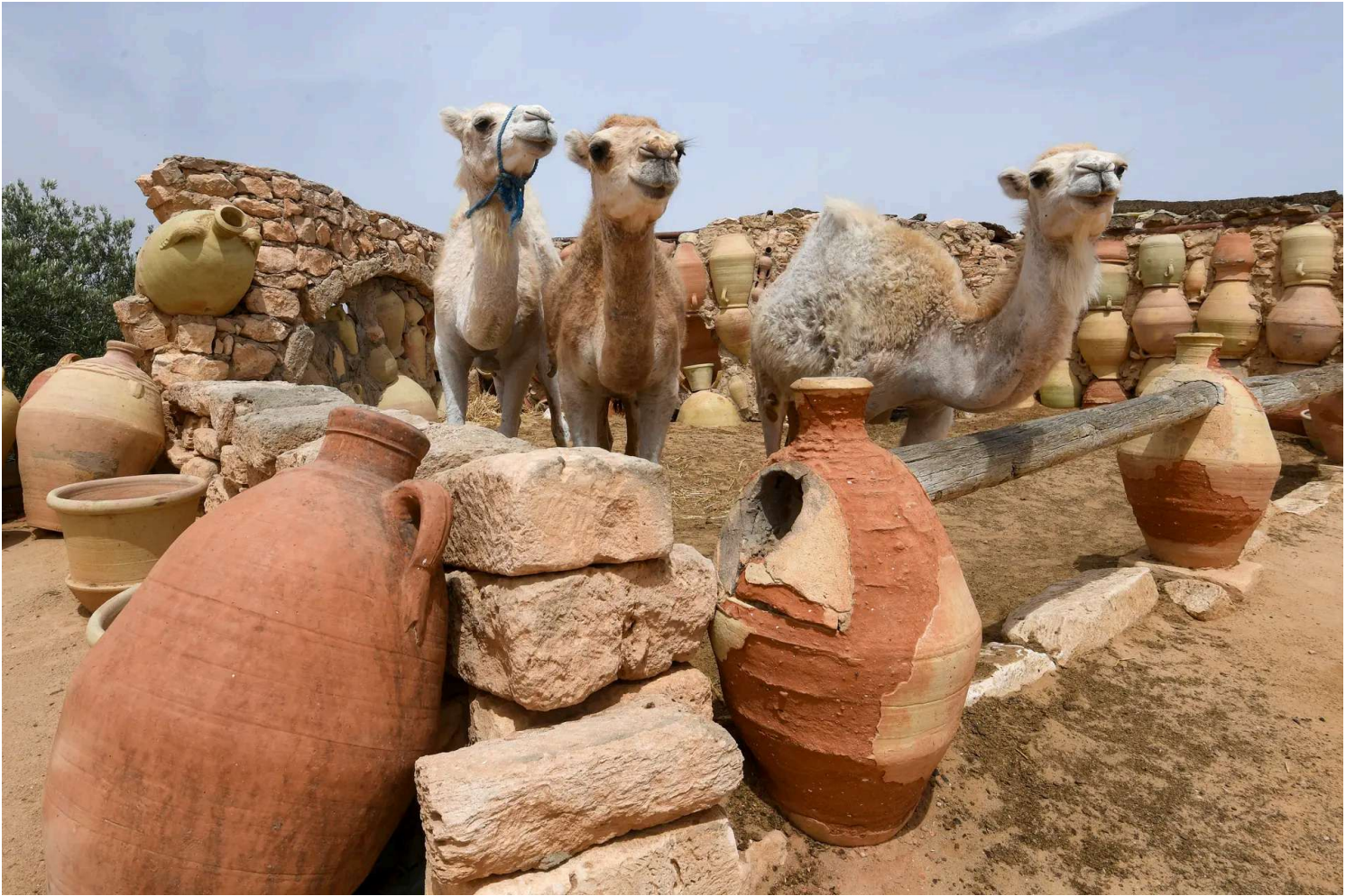
Camels stand in their pen at an 800-year-old pottery workshop in Guellala on the southern Mediterranean resort island of Djerba, Tunisia, on May 14, 2025.