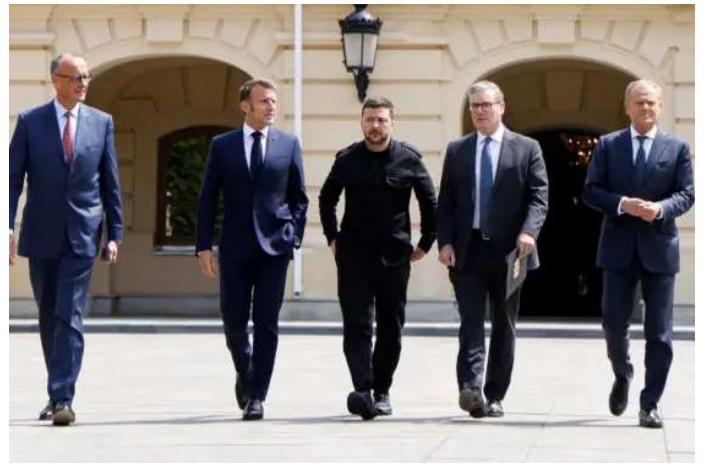
Day in Photos: European Leaders in Kyiv, Toxic Fire in Spain, and Tartan Day Parade