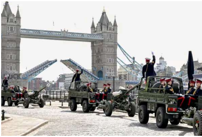
Day in Photos: Royal Gun Salute, Drone Strike on Airport, and Bus Crash