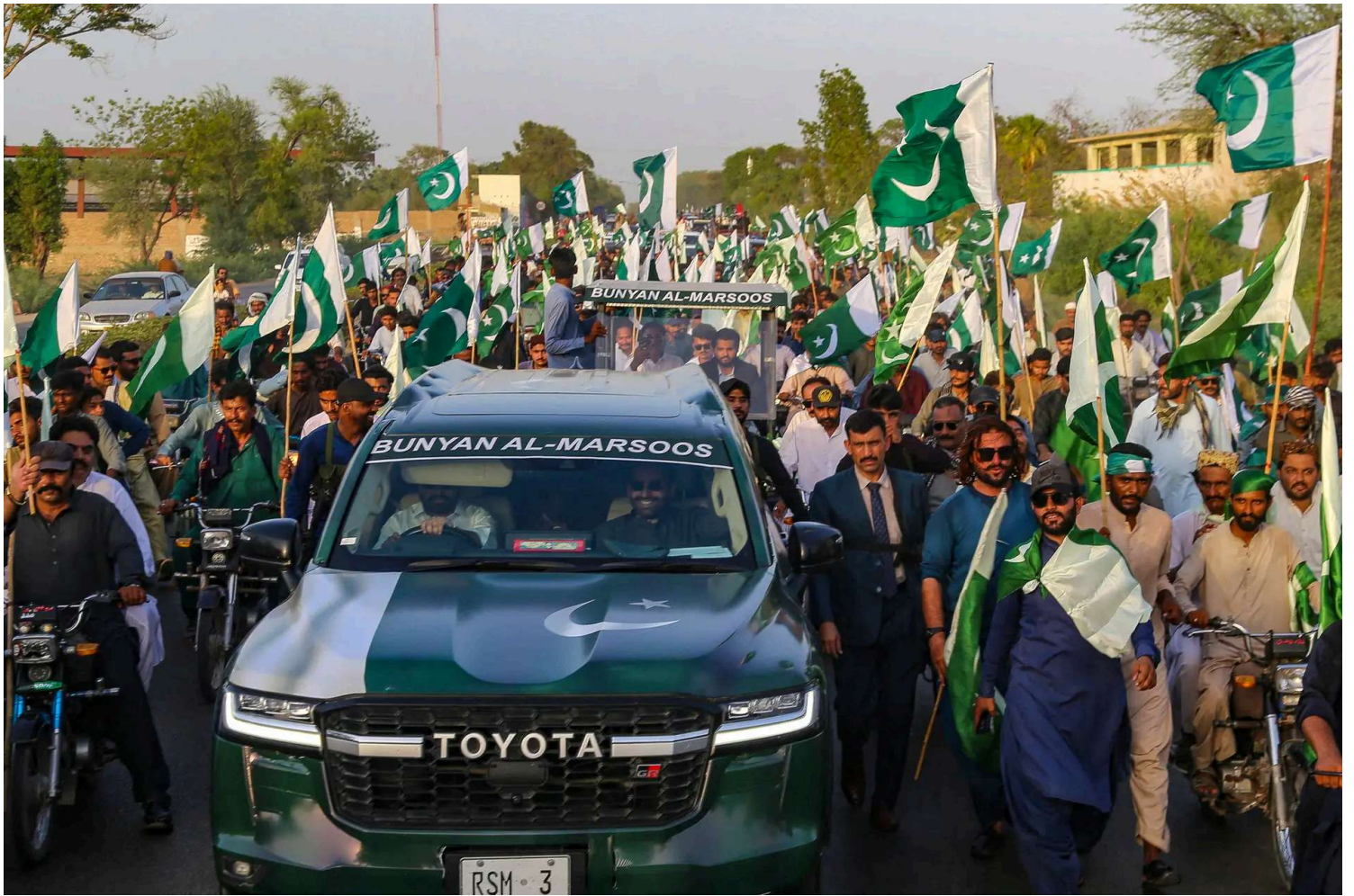
People hold Pakistan's national flags during a rally to express solidarity with Pakistan's armed forces, in Hyderabad, Sindh province, on May 14, 2025.