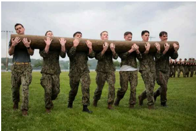
Day in Photos: Sea Trials, Donald Trump in Riyadh, and International Film Festival