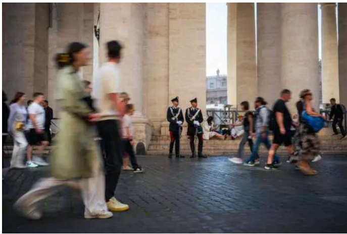
Day in Photos: India-Pakistan Conflict, WWII Anniversary, 'Habemus Papam'