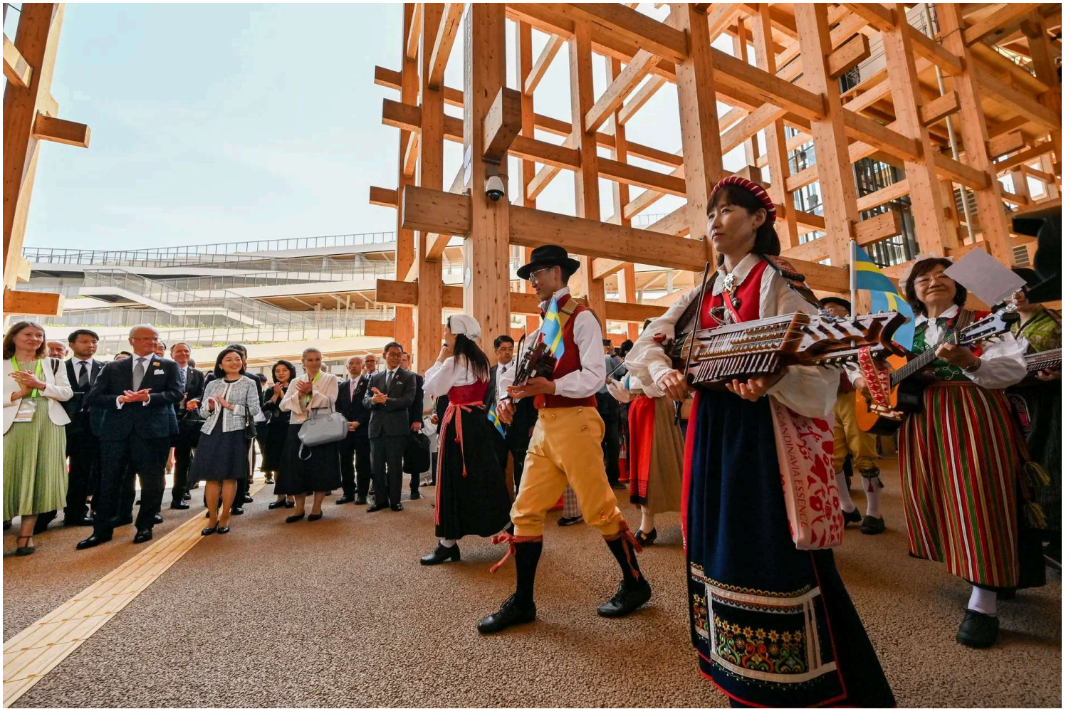
Sweden's King Carl XVI Gustaf (2nd L-front) and Japan's Princess Akiko of Mikasa (3rd L-front) watch a parade pass by during ceremonies to mark Sweden's National Day during his visit to the Osaka Expo in Osaka, on May 14, 2025.