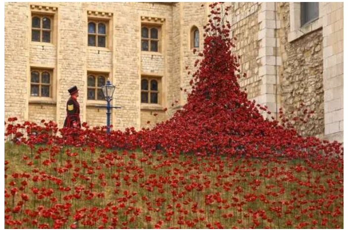
Day in Photos: Ceramic Poppies, Drone Attack in Sudan, and Grand Egyptian Museum

Copyright © 2000 - 2025 The Epoch Times Association Inc. All Rights Reserved.