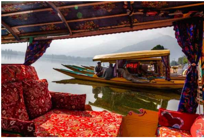
Day in Photos: Kashmiri Boatmen, March of the Living, and Kanda Festival