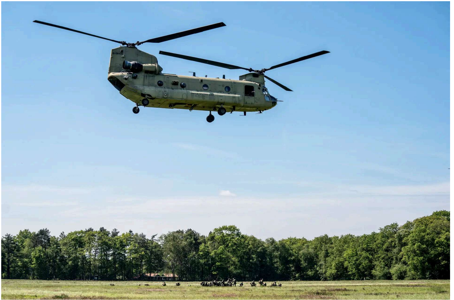
A CH-47 Chinook helicopter takes part in a large-scale military drill at the Oudemolen military complex as part of Exercise Falcon, in Drenthe, Netherlands, on May 14, 2025.