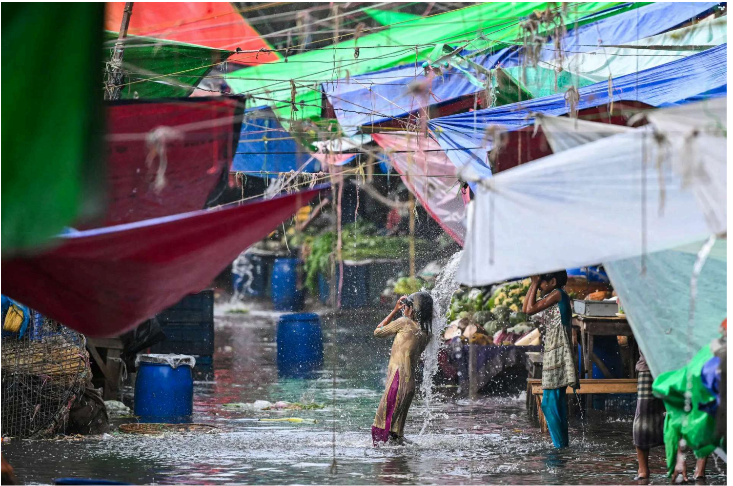
A child plays in the rain in Dhaka, Bangladesh, on May 14, 2025.