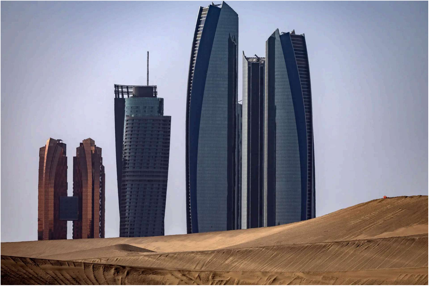
This picture shows a view of the Abu Dhabi skyline, United Arab Emirates, on May 14, 2025.