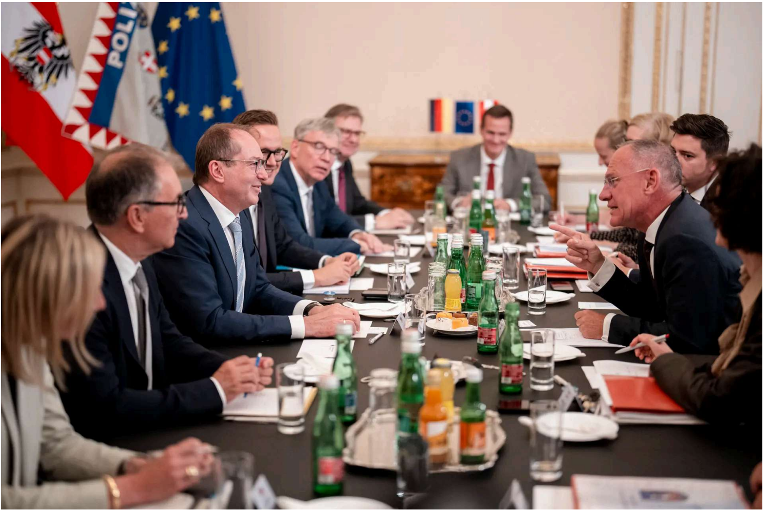
German Interior Minister Alexander Dobrindt (3rd L) and Austrian Interior Minister Gerhard Karner (R) talk during a meeting in Vienna, Austria, on May 16, 2025.