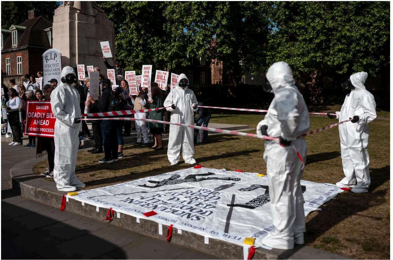
People take part in a demonstration against assisted dying in London, England, on May 16, 2025. MPs are debating amendments to the Terminally Ill Adults (End of Life) Bill, which, if made into law, would give people who meet certain criteria in England and Wales the right to end their lives at a time of their choosing, subject to safeguards and protections.