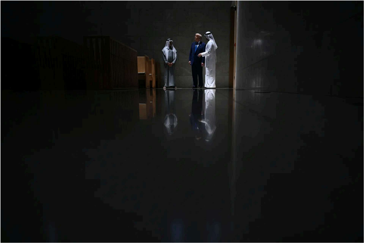
President Donald Trump visits the synagogue at the Abrahamic Family House, an interfaith complex in Abu Dhabi, United Arab Emirates, on May 16, 2025.