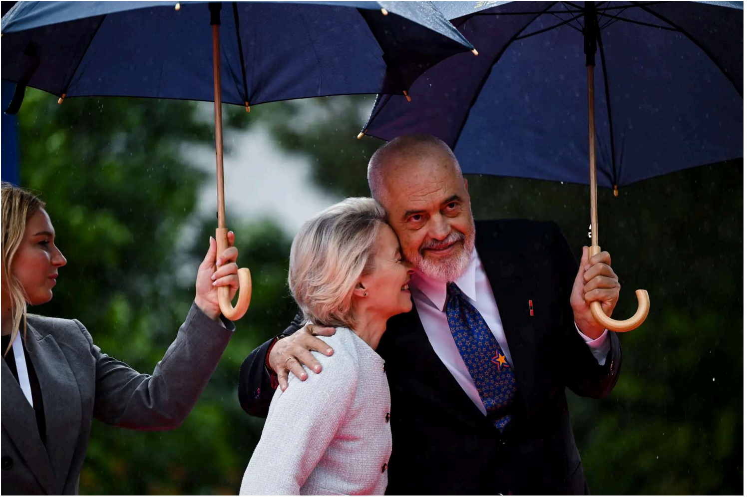
Albania's Prime Minister Edi Rama (R) welcomes European Commission President Ursula Von der Leyen (C) ahead of the European Political Community summit, in Tirana, Albania, on May 16, 2025.