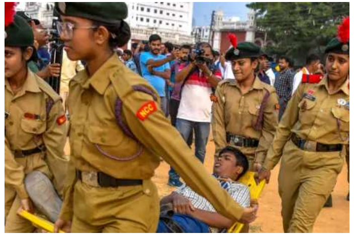
Day in Photos: Military Exercises in India, Strikes on Yemen, and Golden Snub-Nosed Monkeys

Copyright © 2000 - 2025 The Epoch Times Association Inc. All Rights Reserved.