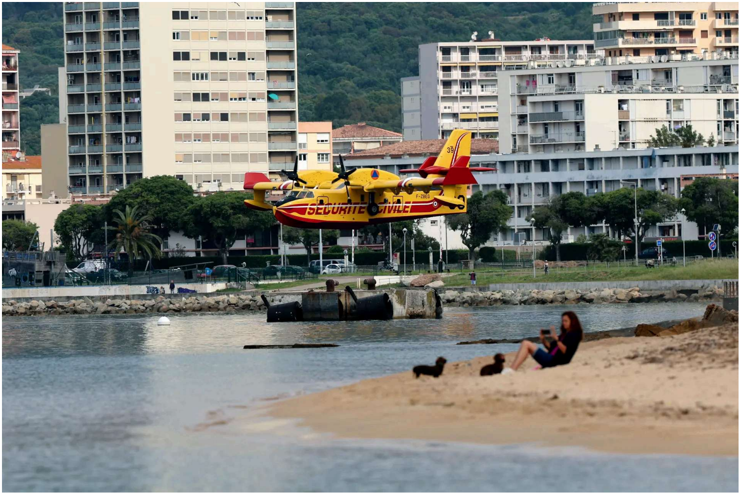
A French Civil Defense (Securite Civile) Canadair CL-415 aerial firefighting plane takes part in a training session in the Ajaccio Gulf, on the French Mediterranean island of Corsica on May 16, 2025.

Sign up for the News Alerts newsletter. You'll get the biggest developing stories so you can stay ahead of the game. Sign up with 1-click >>