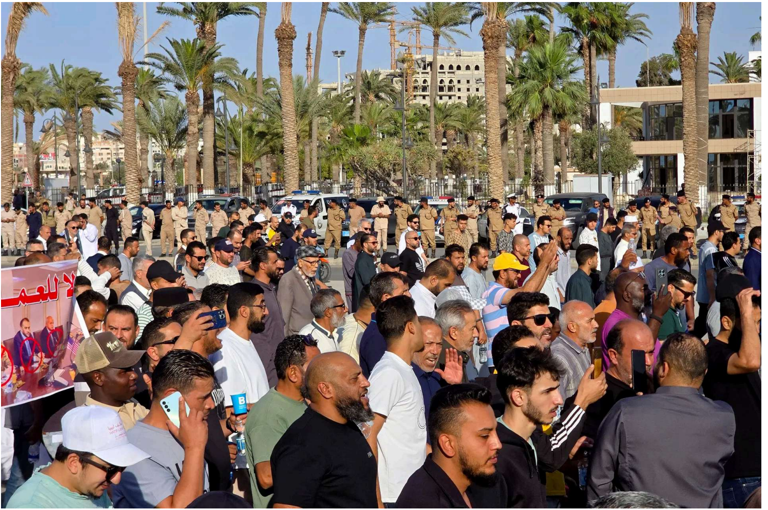
Libyan protesters gather in Tripoli's Martyrs Square to call for the resignation of the national unity government on May 16, 2025. Flights resumed on May 16 at Tripoli's airport as businesses and markets reopened after days of deadly fighting between armed groups in the Libyan capital. The violence in Tripoli was sparked by the killing of Abdelghani al-Kikli, head of the Support and Stability Apparatus faction, by the Dbeibah-aligned 444 Brigade.