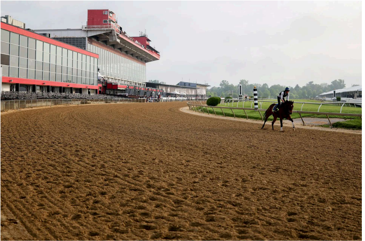
A jockey and horse are seen in front of the grandstand a day prior to the 150th Preakness Stakes at Pimlico Race Course in Baltimore, Md., on May 16, 2025.