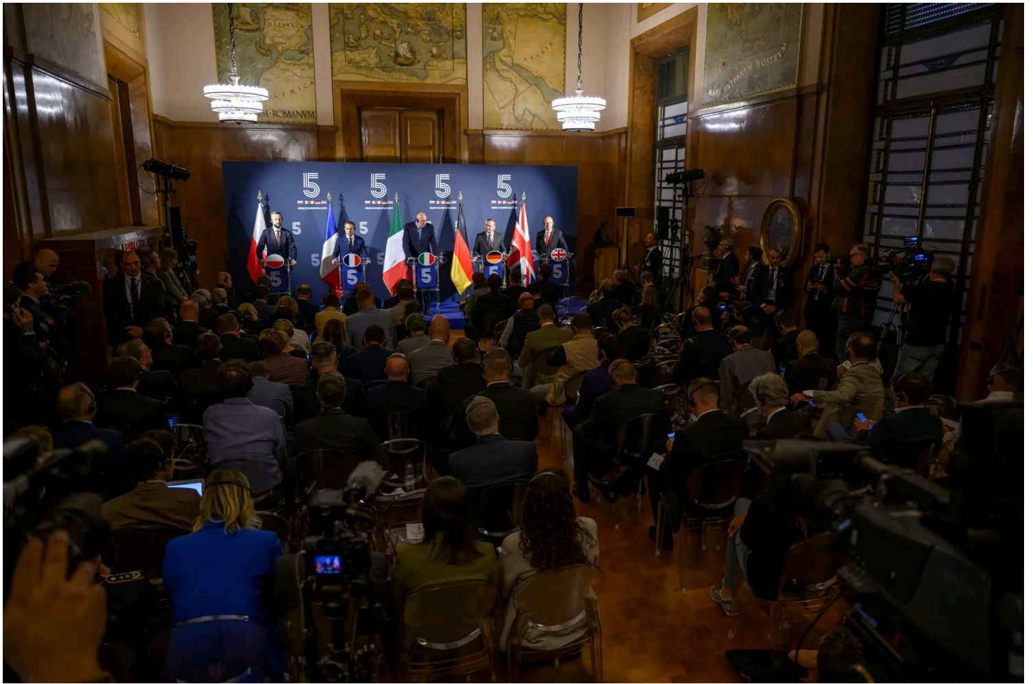
(L-R) Polish Defence Minister Wladyslaw Kosiniak-Kamysz, French Defence Minister Sebastien Lecornu, Italian Defence Minister Guido Crosetto, German Defence Minister Boris Pistorius and British Defence Secretary John Healey hold a joint press conference after the E5 'Group of Five' meeting, in Rome, Italy, on May 16, 2025. The five ministers are meeting as Europe faces a new common defence landscape following U.S. President Donald Trump's call for European countries to shoulder more defense responsibilities for themselves.