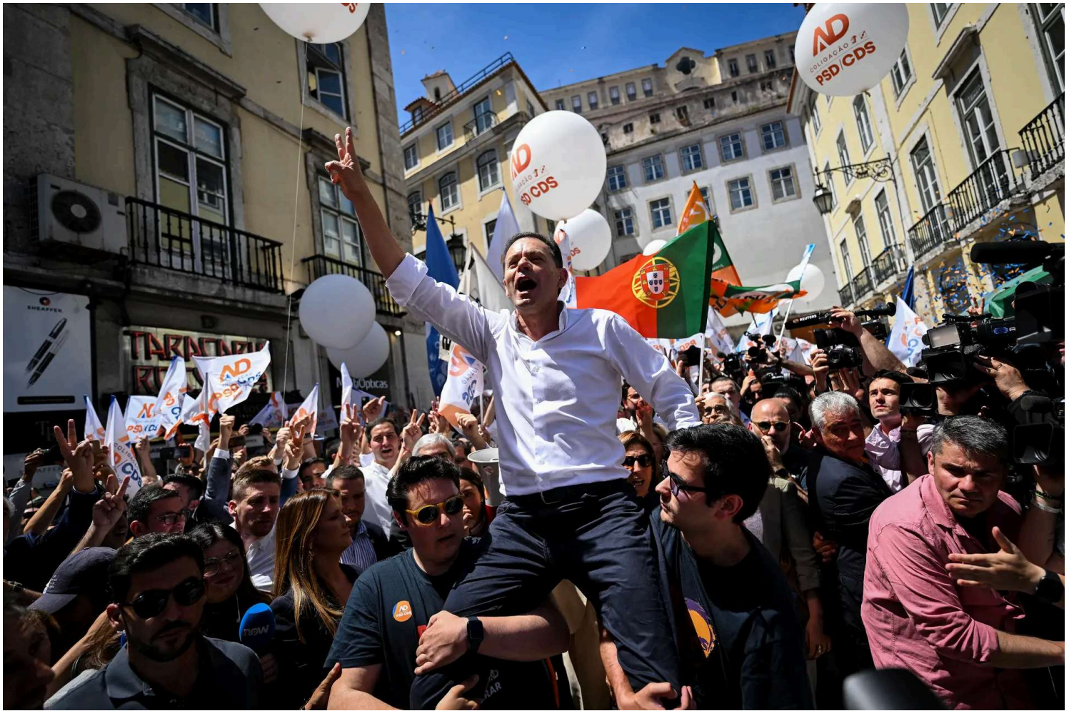
Democratic Alliance party leader and Portuguese Prime Minister Luis Montenegro gestures as he takes part in a street rally in Lisbon, Spain, on May 16, 2025, on the last day of the electoral campaign ahead of the snap elections on Sunday.