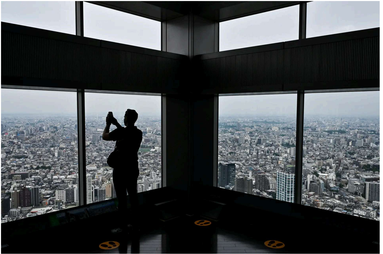
A foreign visitor takes a photo out the windows of the urban sprawl below during a visit to one of the Tokyo Metropolitan Government Building observation decks in the Shinjuku district of central Tokyo, Japan, on May 16, 2025.