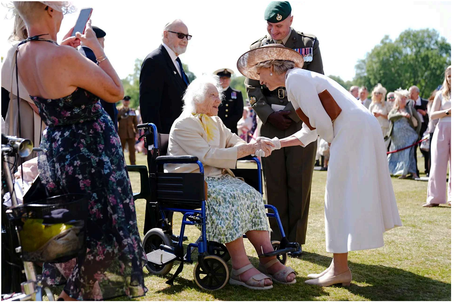
Birgitte, Duchess of Gloucester speaks to 100-year-old Betty Withers during the Not Forgotten Association Annual Garden Party at Buckingham Palace in London, England, on May 16, 2025.