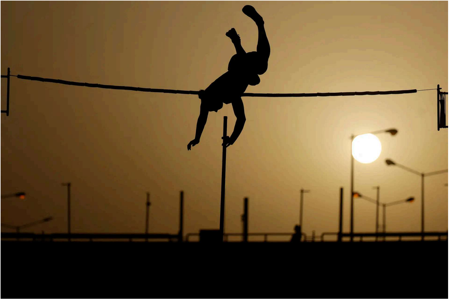
An athlete warms up ahead of the women's Pole Vault final during the IAAF Diamond League competition at the Suheim Bin Hamad Stadium in Doha, Qatar, on May 16, 2025.