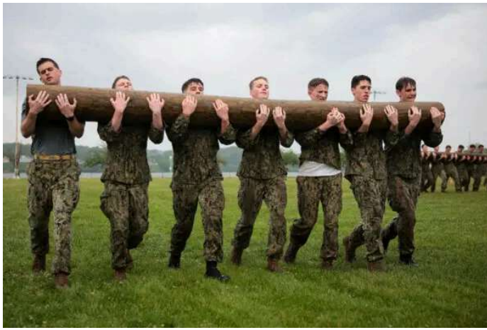
Day in Photos: Sea Trials, Donald Trump in Riyadh, and International Film Festival