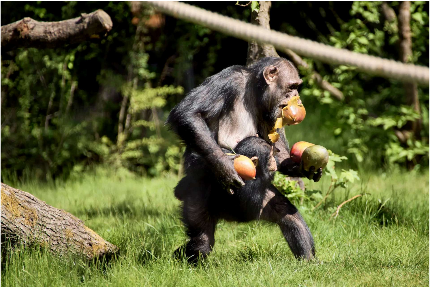
A chimpanzee with a chimpanzee baby in the new outdoor facility at the Zoo in Copenhagen, Denmark, on May 16, 2025.