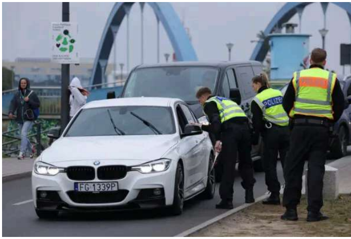
Germany to Turn Away More Asylum Seekers at Border