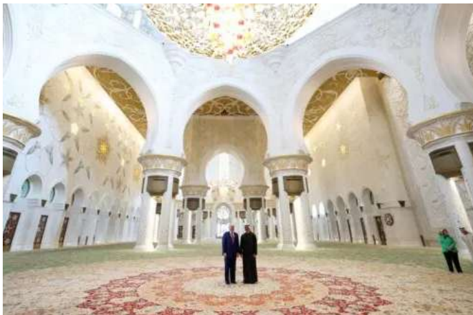
Day in Photos: Donald Trump in UAE, Fire in Abidjan, and Colorful Village