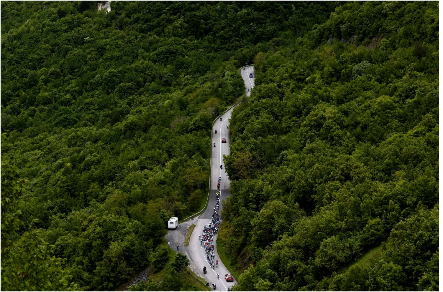
The peloton rides during the 7th stage of the 108th Giro d'Italia cycling race 168 kms from Castel di Sangro to Tagliacozzo, Italy, on May 16, 2025.