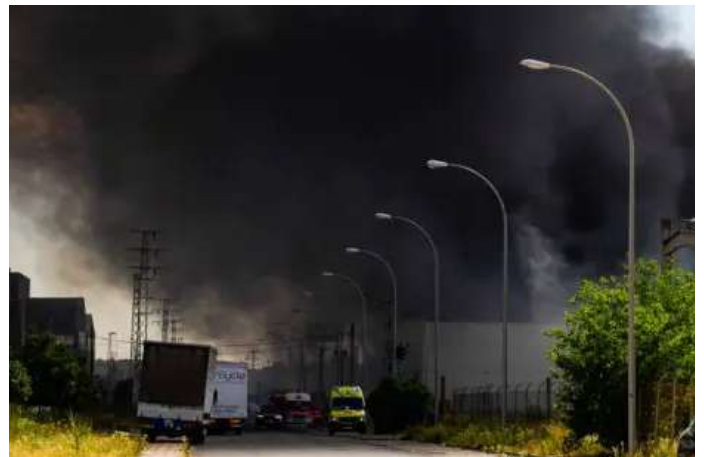
Day in Photos: Chemicals Burn in Spain, Strawberry Picking in India, and Golden Monkeys