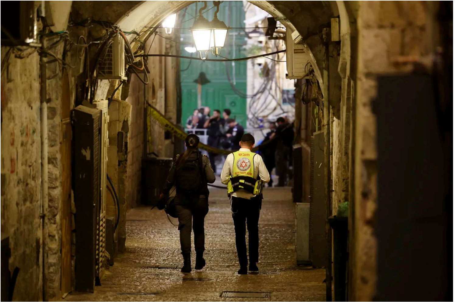
Israeli security forces and emergency services close-off an alley following a reported attack in Jerusalem on May 16, 2025.