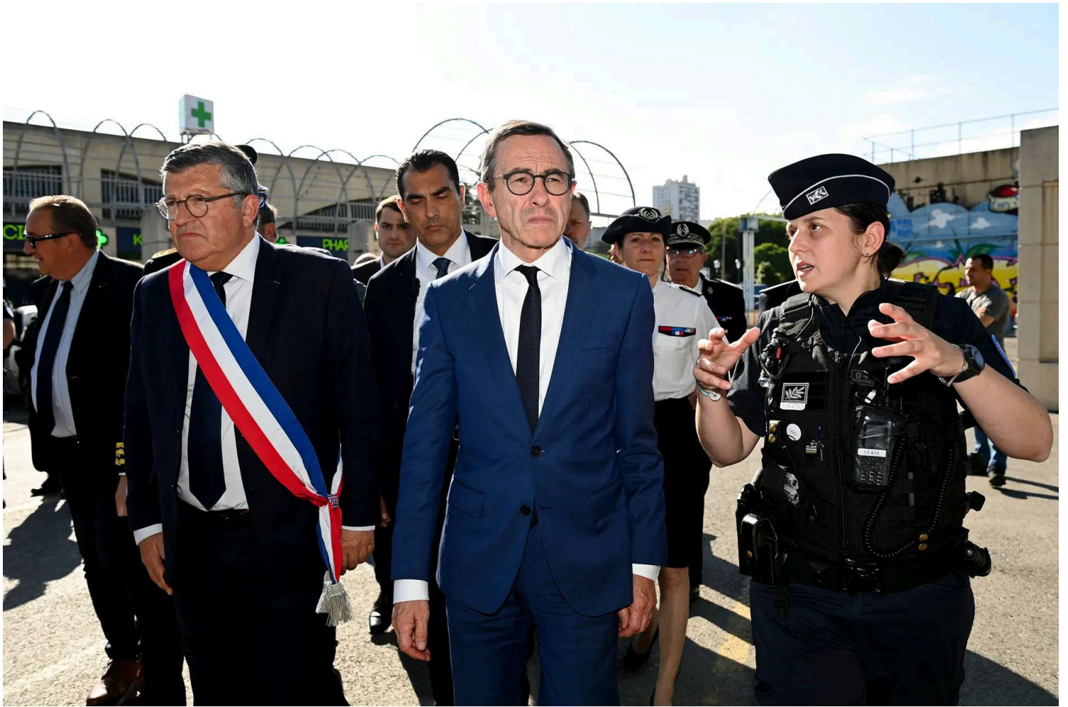
France's Minister of the Interior Bruno Retailleau (C), next to a police commissioner, arrives for a visit to the Pissevin district in Nîmes, southeastern France, on May 16, 2025.