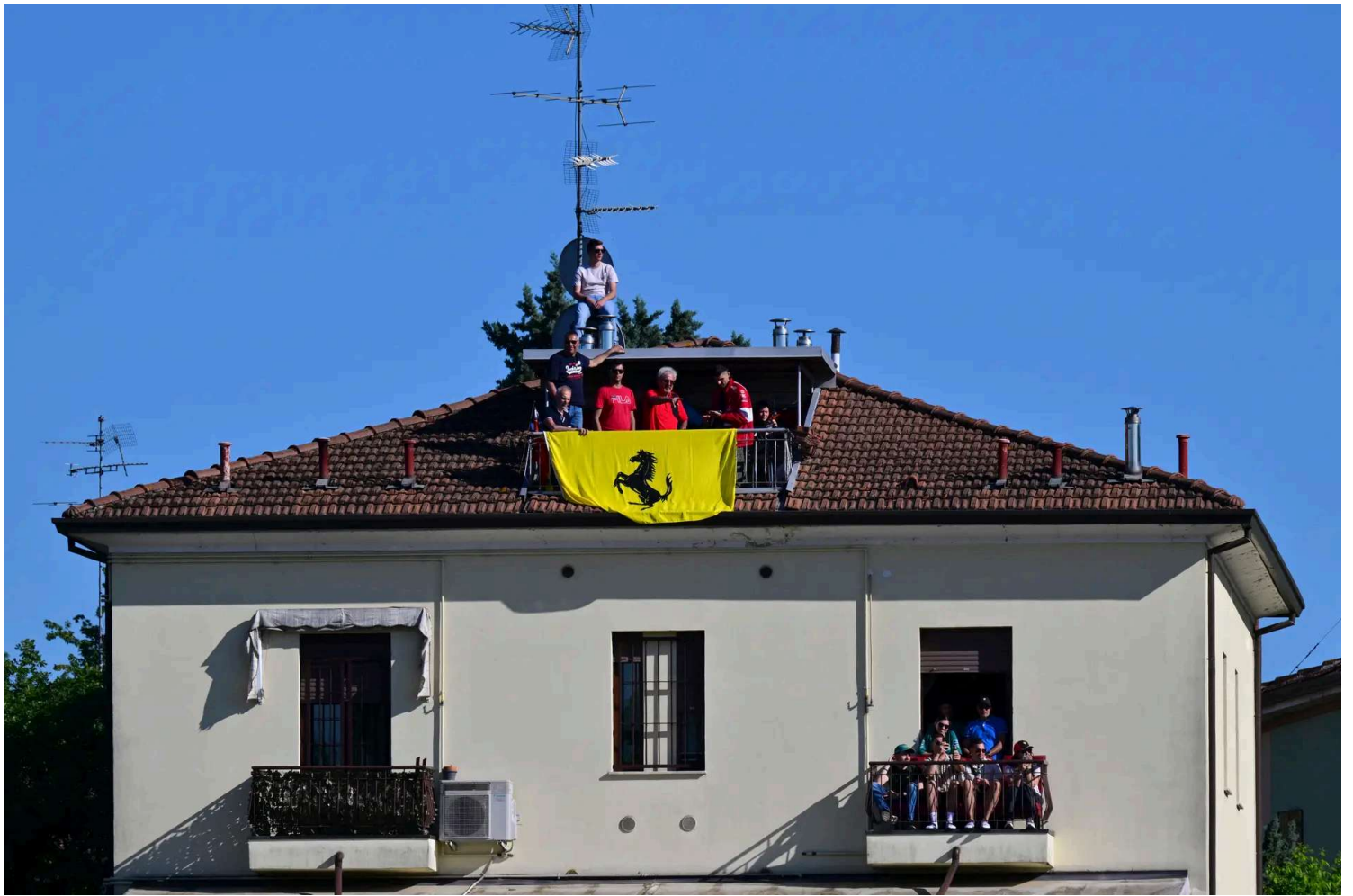
Ferrari fans watch from their balcony the second practice session for the 2025 Emilia Romagna Formula One Grand Prix at the Imola autodrome in Imola, Italy, on May 16, 2025.