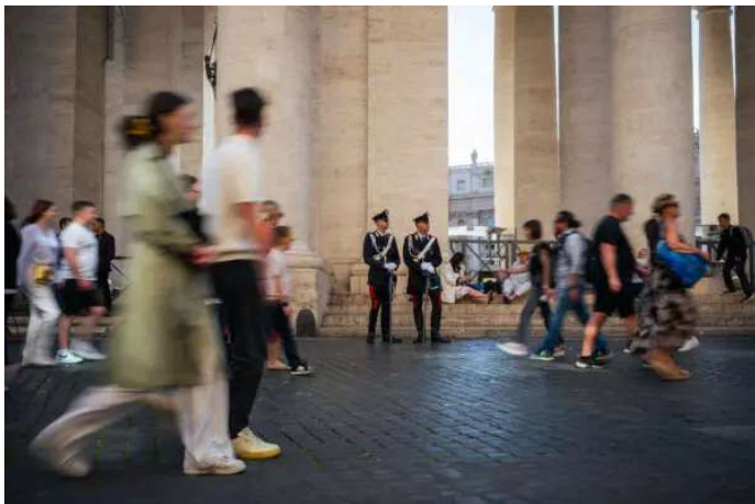
Day in Photos: India-Pakistan Conflict, WWII Anniversary, 'Habemus Papam'