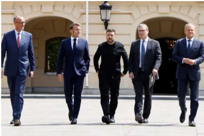
Day in Photos: European Leaders in Kyiv, Toxic Fire in Spain, and Tartan Day Parade