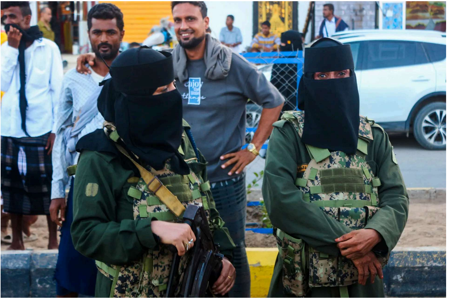
Women security officers stand guard during a protest calling on Yemen's Aden-based government for basic services and rights, such as education, water, electricity, and protesting high prices and tough living conditions, in the southern city of Lahj, Yemen, on May 17, 2025, in a reported series of recent protests held by women in several main cities in southern Yemen.