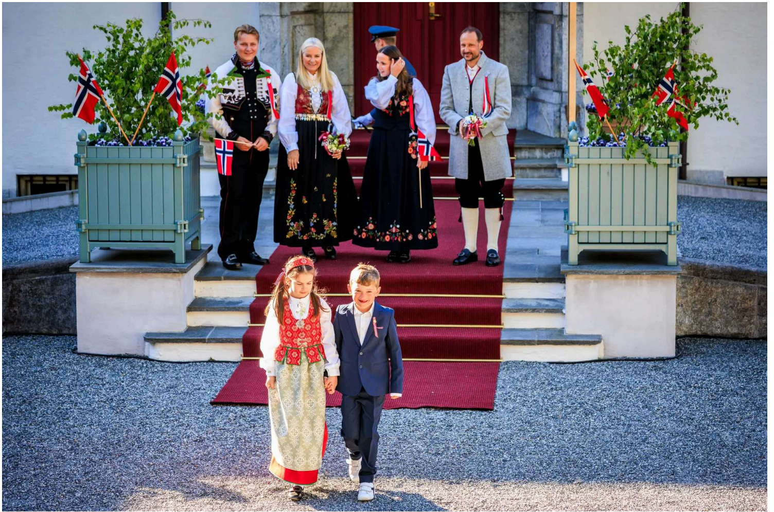
(L-R) Prince Sverre Magnus, Crown Princess Mette Marit, Princess Ingrid Alexandra, and Crown Prince Hakon Magnus of Norway attend the Norwegian Constitution Day with the children's parade at their Skaugum Estate in Oslo, Norway, on May 17, 2025.