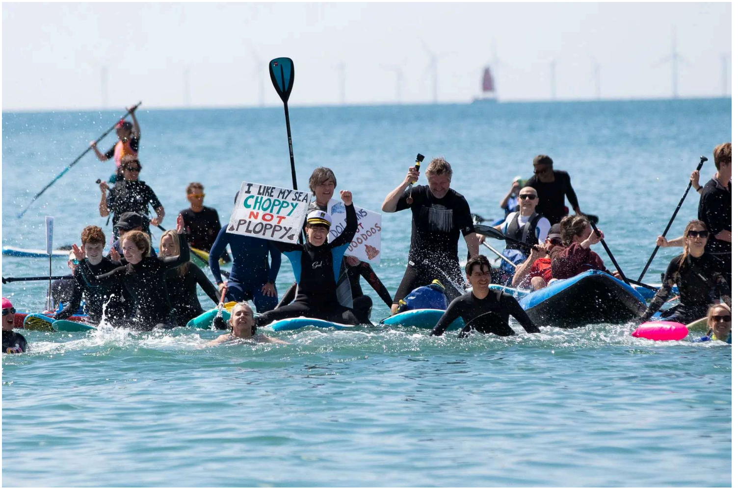
Members of the public are seen in the water protesting in Brighton, England, on May 17, 2025. Surfers Against Sewage are staging 'Paddle Out' protests across the UK to demonstrate against the levels of sewage in British waterways. For England alone, the Environment Agency reported a total of 450,398 discharges, accounting for 3.6 million hours of raw sewage being spilled into rivers. The protests come amid a growing crisis in management and regulation of UK water companies, which are responsible for self-reporting sewage spills.