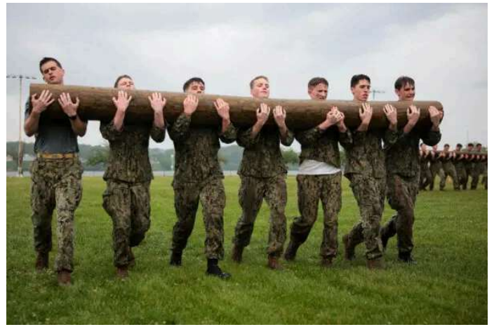
Day in Photos: Sea Trials, Donald Trump in Riyadh, and International Film Festival