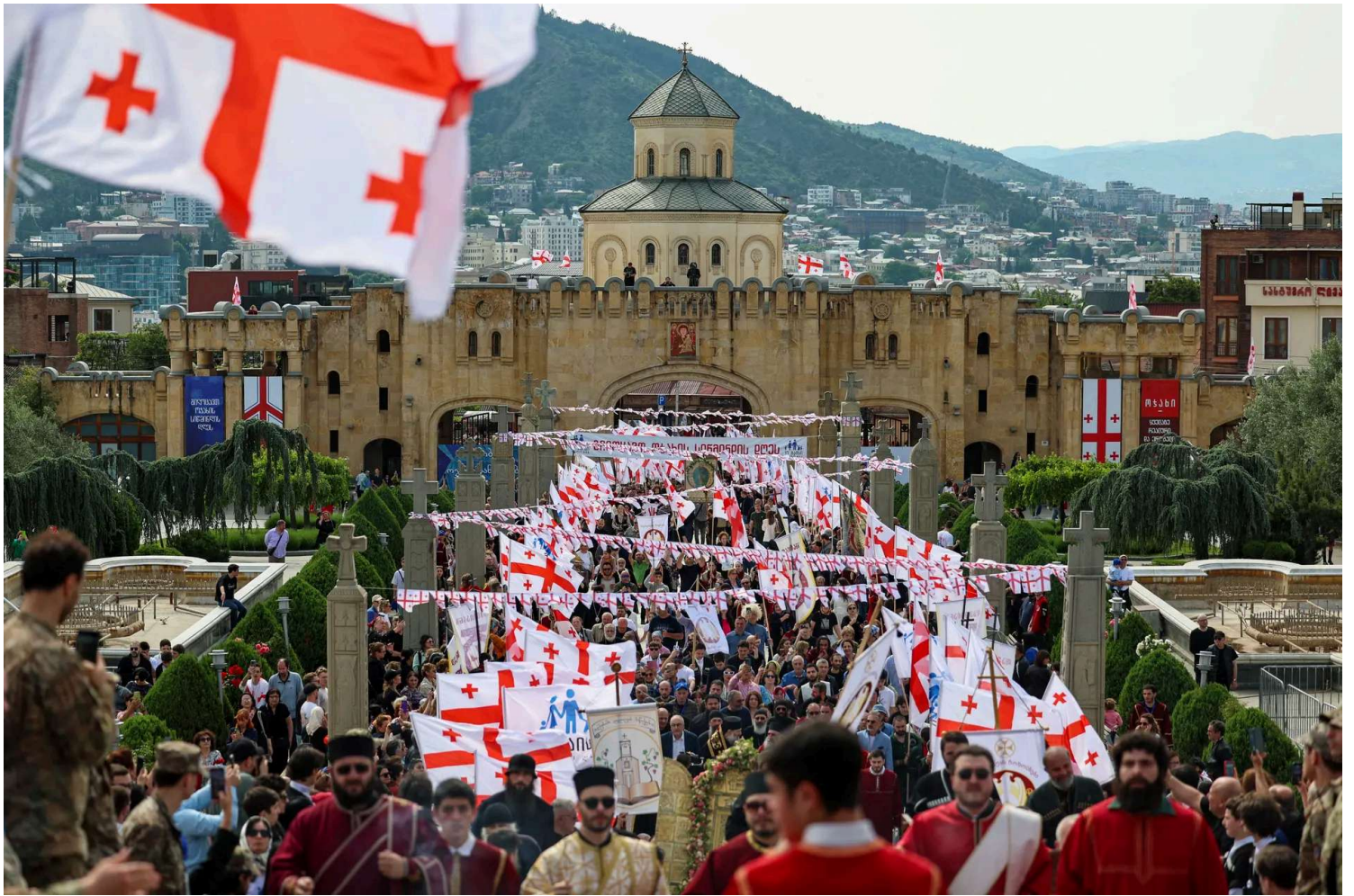
People attend a rally celebrating Georgia's Family Purity Day, which is designed to promote traditional family values, in downtown Tbilisi, Georgia, on May 17, 2025.