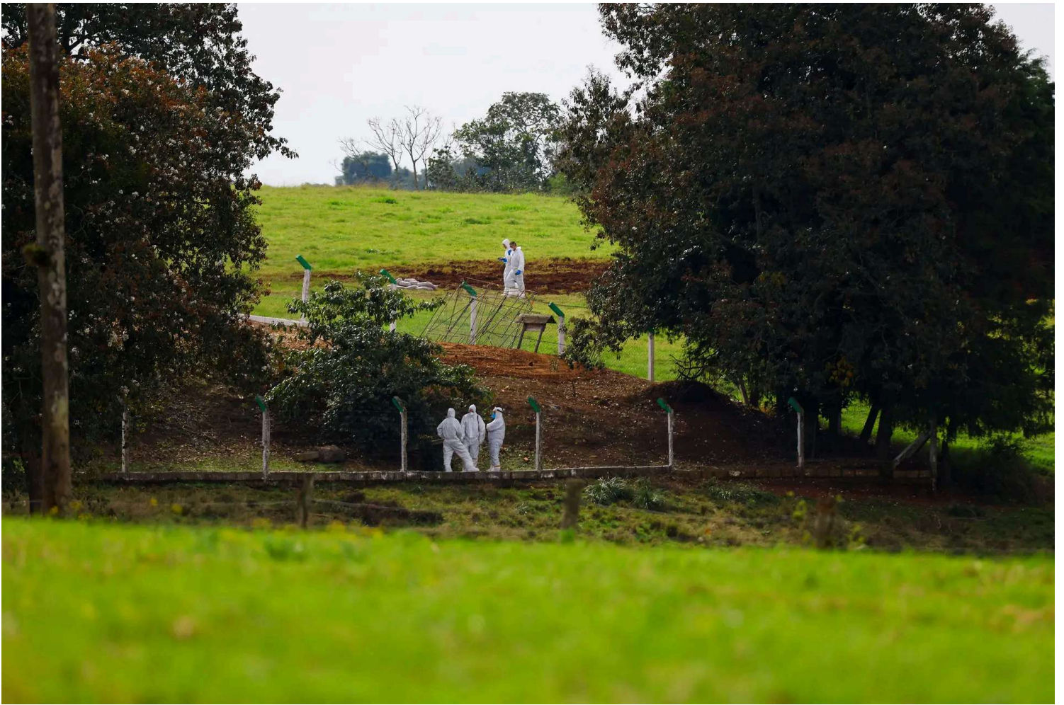
Workers wearing protective suits work at a commercial poultry farm, site of the country's first bird flu outbreak, in Montenegro, Rio Grande do Sul state, Brazil, on May 17, 2025.