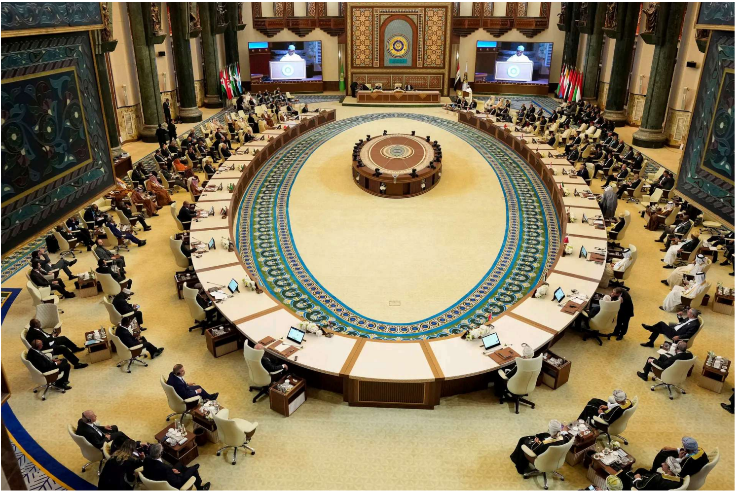
Arab leaders attend the opening session of the 34th Arab League summit in Baghdad, Iraq, on May 17, 2025.