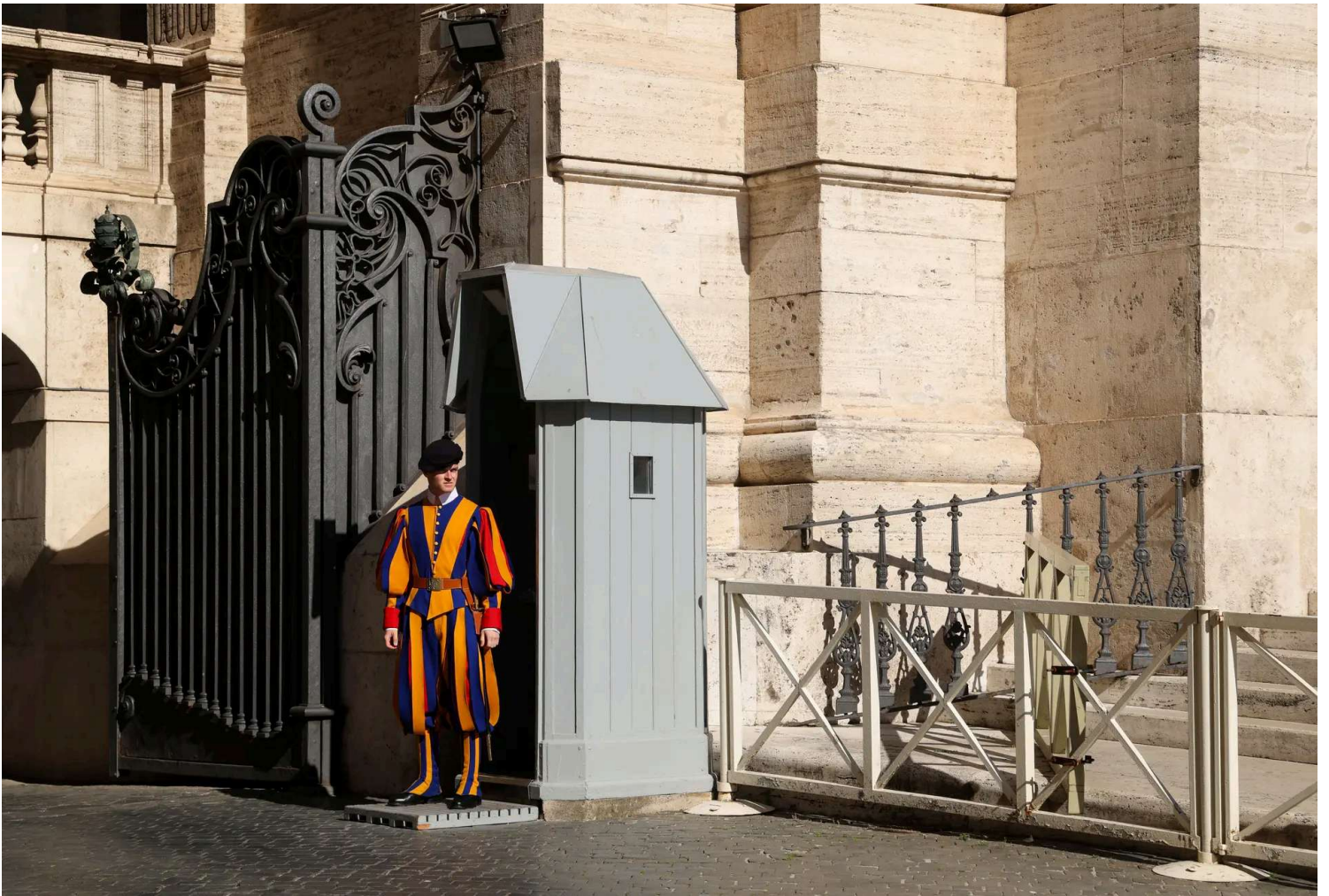
A member of the Swiss Guard stands guard at an entrance to the Vatican ahead of Sunday's outdoor mass with new Pope Leo XIV during the Jubilee of Confraternities in Vatican City, Vatican, on May 17, 2025.

Sign up for the Epoch Opinion newsletter. Our team of Canadian and international thought leaders take you beyond the headlines and trends that shape our world.