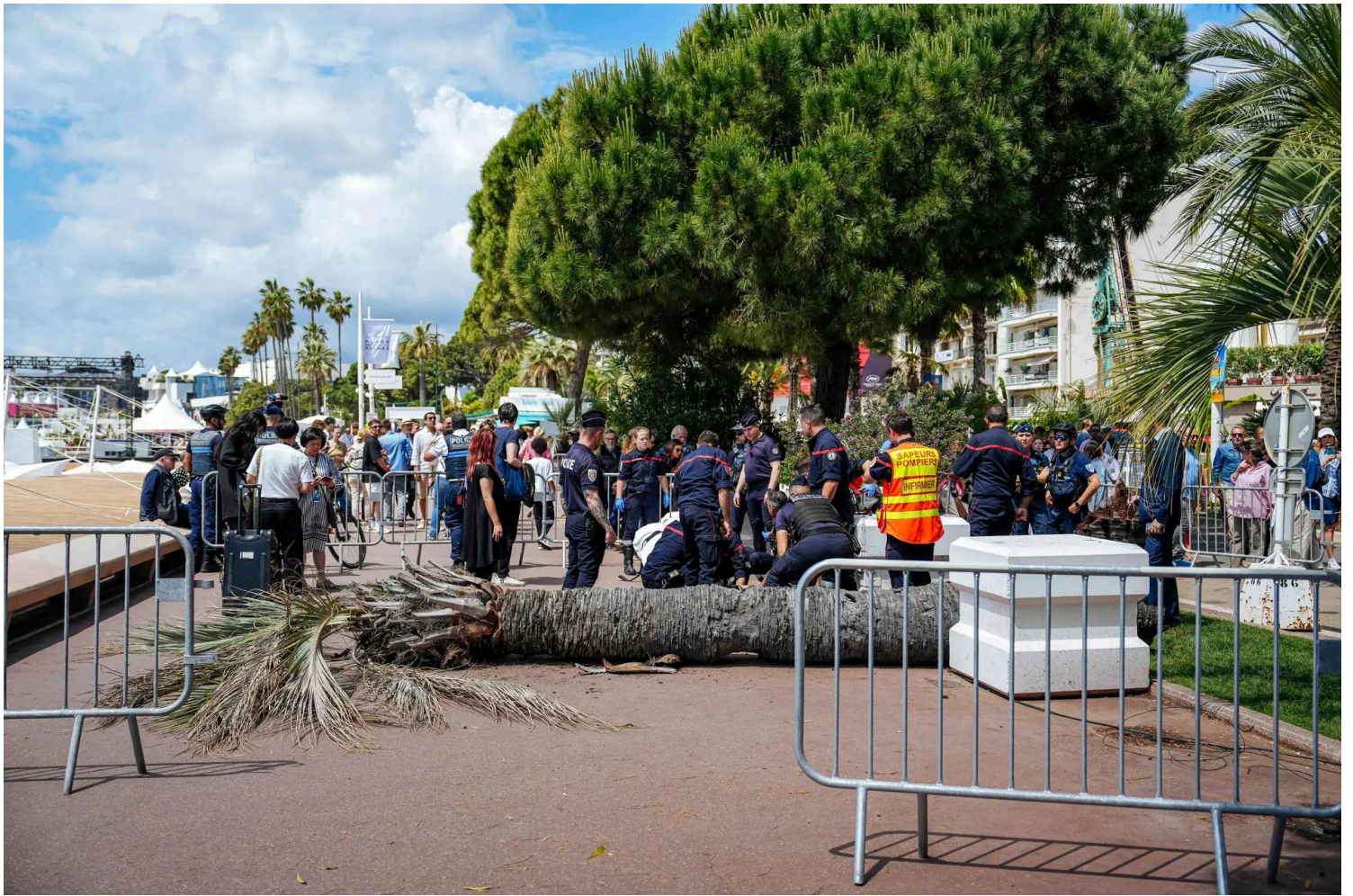
A palm tree falls and injures a person on the Boulevard of La Croisette during the 78th international film festival, Cannes, France, on May 17, 2025.