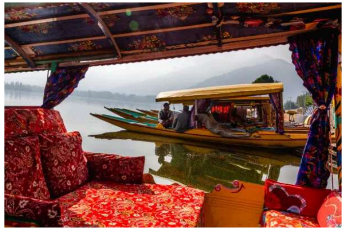
Day in Photos: Kashmiri Boatmen, March of the Living, and Kanda Festival