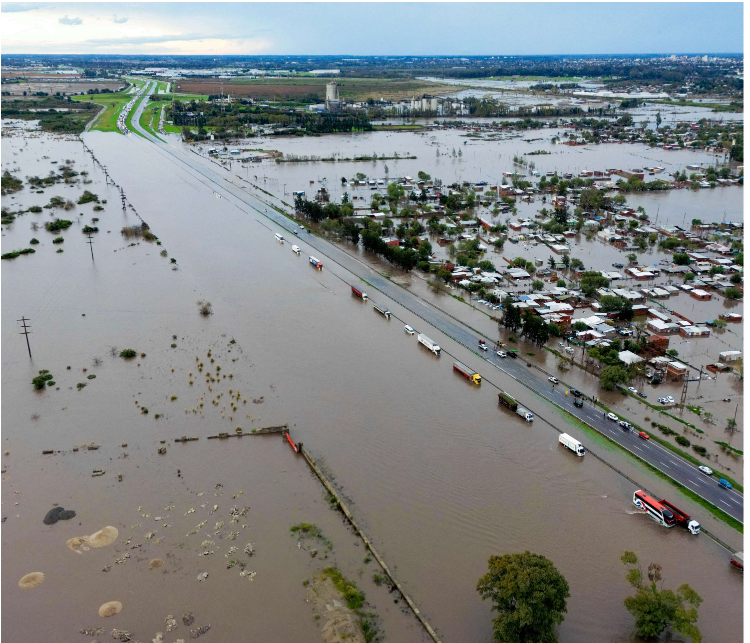
Aerial view showing a flooded area following heavy rainstorms in Campana, Buenos Aires province, on May 17, 2025. More than a thousand people have been evacuated in Argentina due to flooding caused by heavy rains that have been lashing the province of Buenos Aires for more than 24 hours, in a storm that is expected to intensify on Saturday, local authorities said.