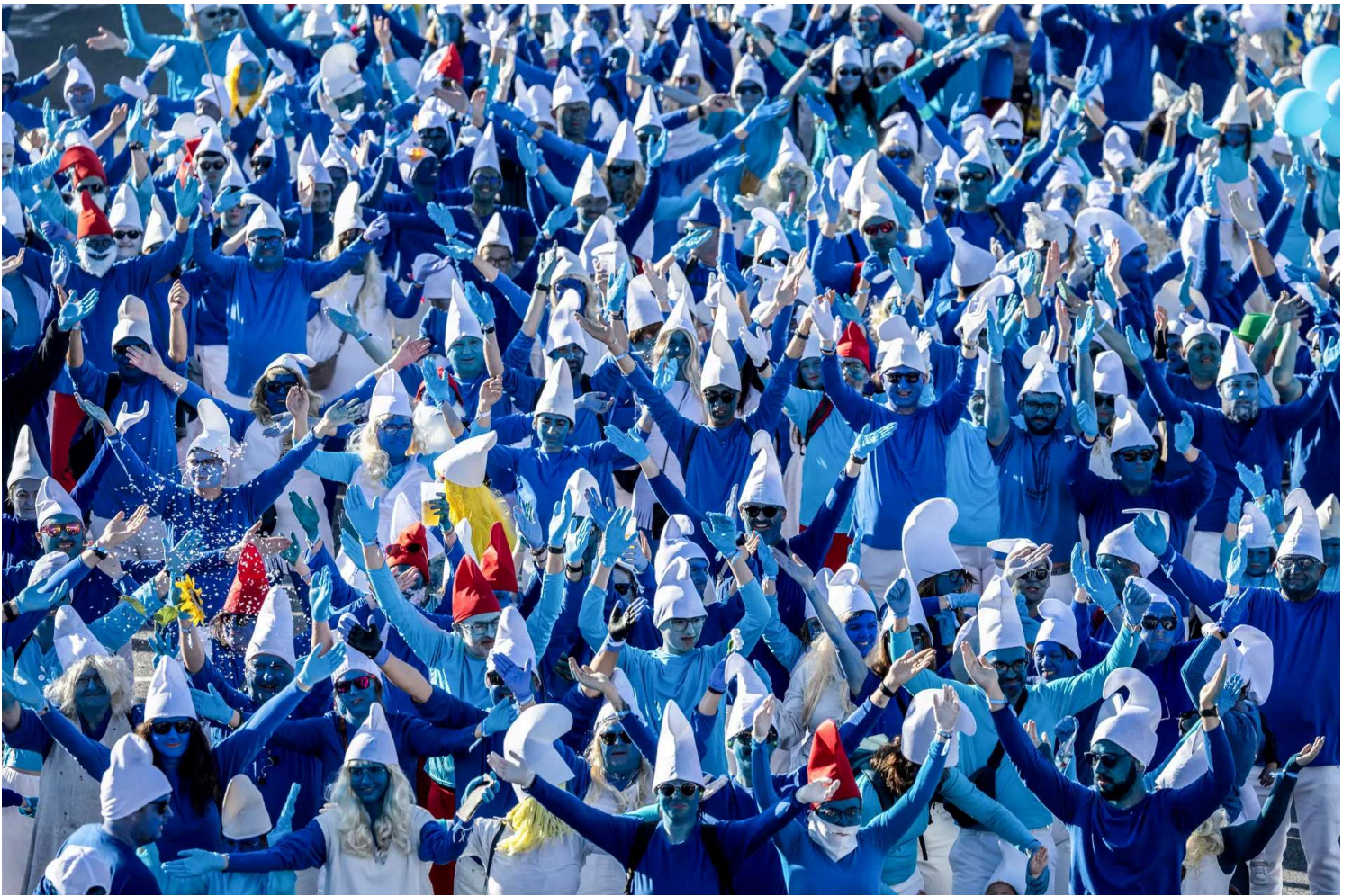
Participants wearing smurf (schtroumpf) costumes take part in an attempt to break the world record for the largest gathering of Smurfs in Landerneau, France, on May 17, 2025. Landerneau on May 17 attempts to break the world record for the largest Smurfs gathering, a record held by Lauchringen in Germany, after two failed attempts over five years.