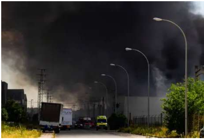
Day in Photos: Chemicals Burn in Spain, Strawberry Picking in India, and Golden Monkeys