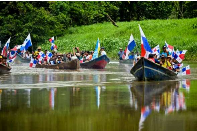
Day in Photos: Protests in Panama, European Political Community Summit, and the Peloton Ride