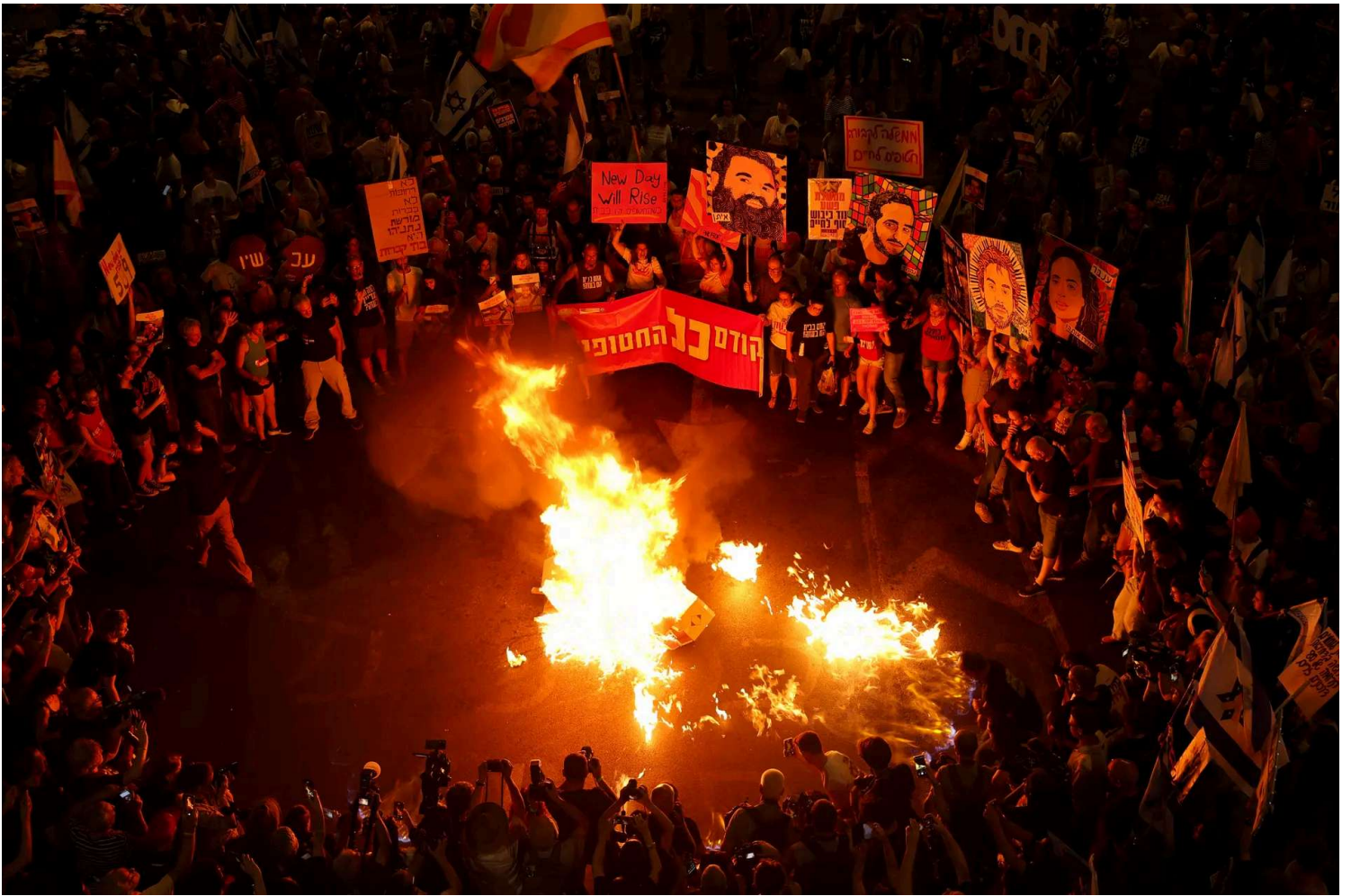
Israelis make a fire during an anti-government protest calling for the end of the war and for action to secure the release of hostages held in the Gaza Strip since the Oct. 7, 2023 attacks by Hamas terrorists, in front of the Israeli Defence Ministry in Tel Aviv, on May 17, 2025.