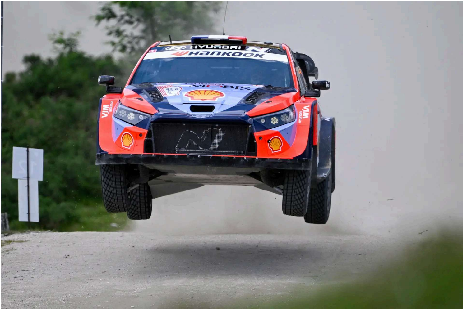
French driver Adrien Fourmaux and co-driver Alexandre Coria steer their Hyundai i20 N Rally 1 during the SS15 stage of the World Rally Championship Rally of Portugal in Vieira do Minho, on May 17, 2025.