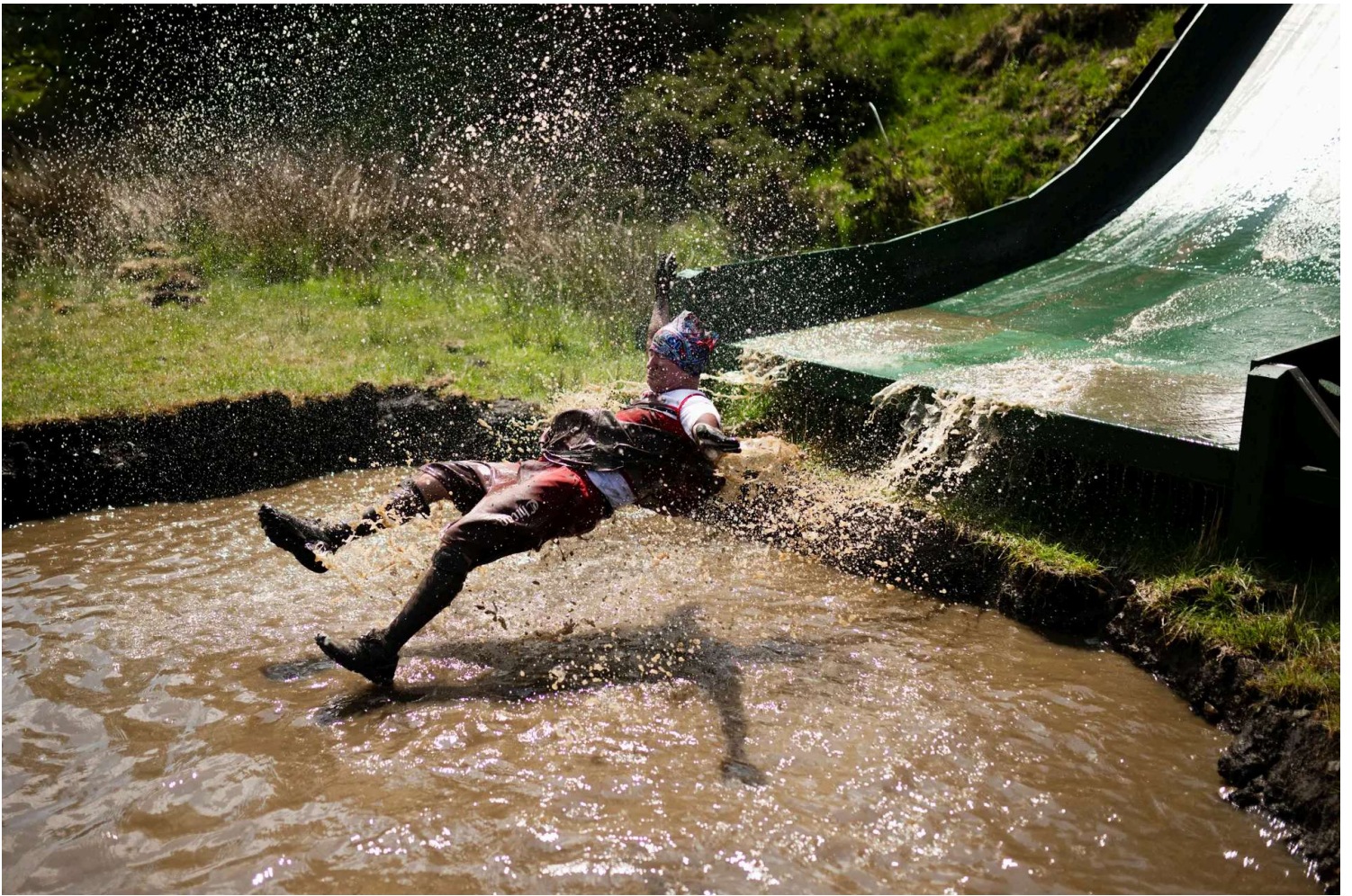
Competitors take part in the Bog Commander endurance event near Ashbourne, in the Peak District moorlands, in northern England, on May 17, 2025. Featuring over 30 man-made obstacles, the Bog Commander is a 6 km muddy obstacle race through the Peak District's Manifold Valley that started in 2014.