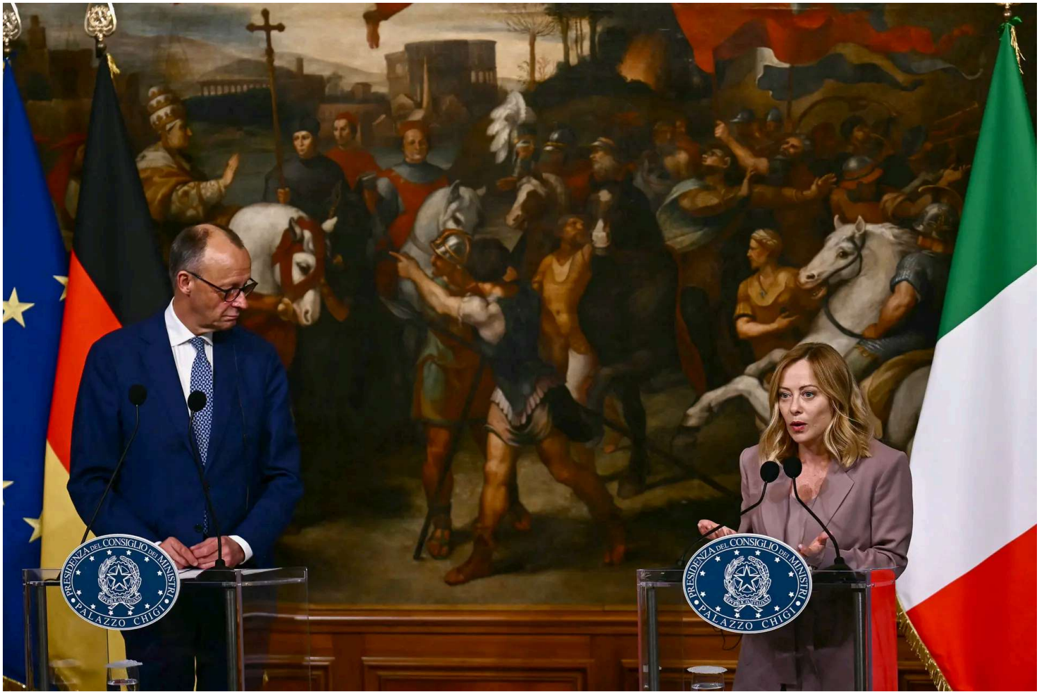
Italy's Prime Minister, Giorgia Meloni and Germany's Chancellor Friedrich Merz give a press conference at Palazzo Chigi after their meeting in Rome, on May 17, 2025.