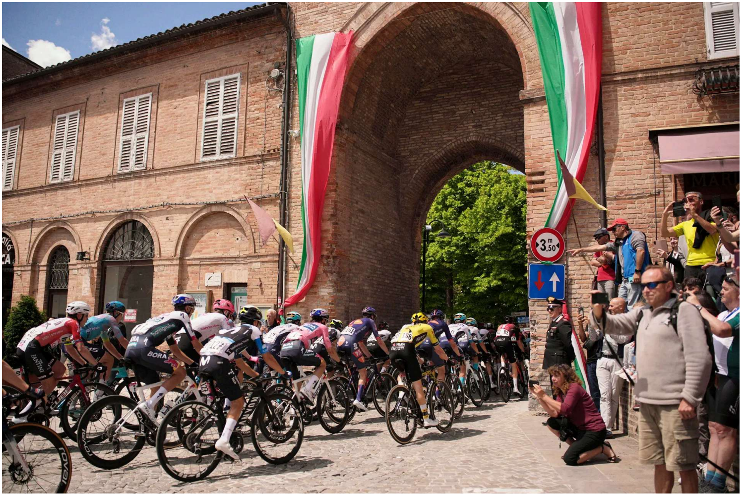
The pack rides during the 8th stage of the Giro d'Italia from Giulianova to Castelraimondo, Italy, on May 17, 2025.