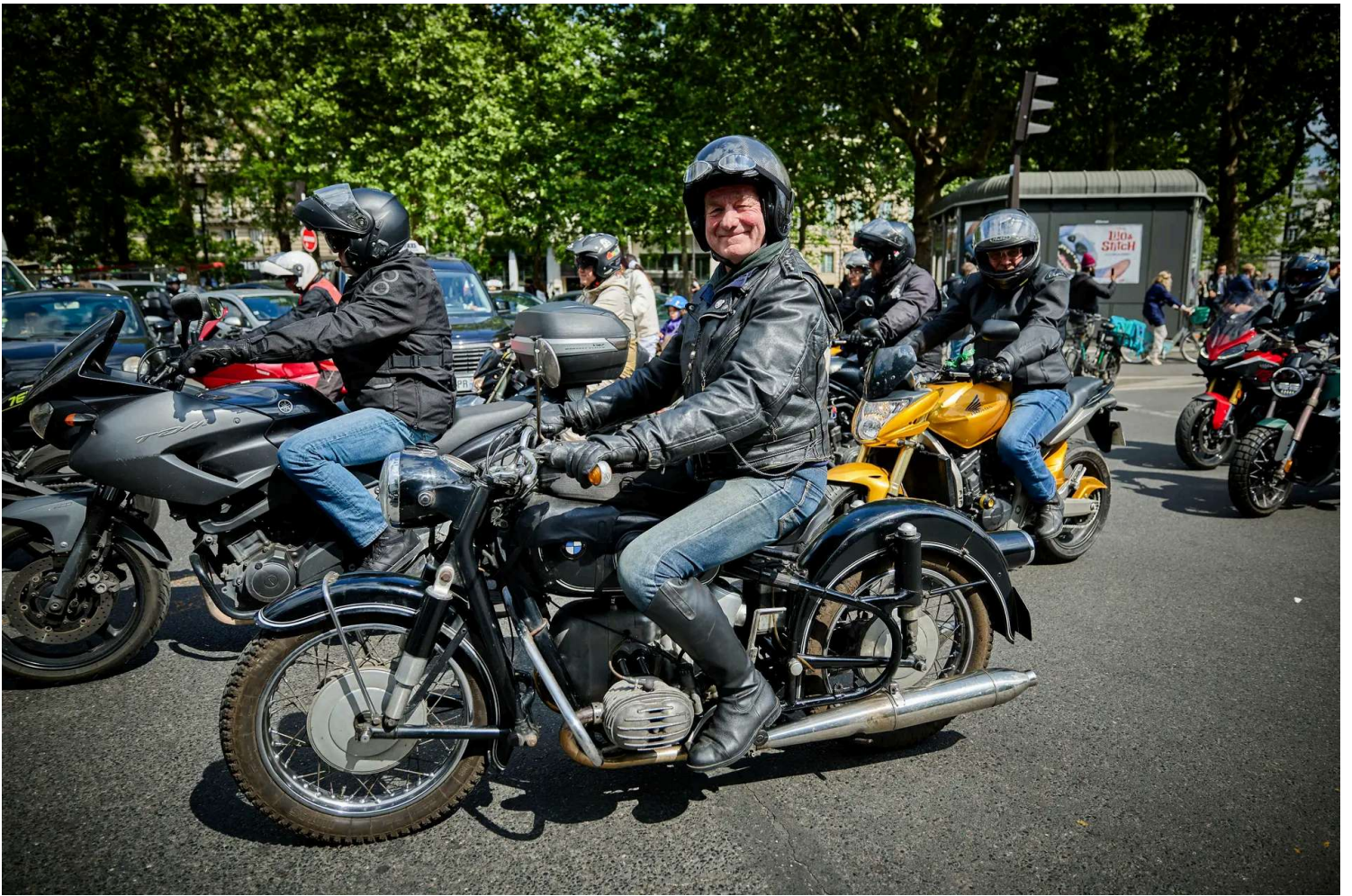
A biker smiles as he rides a classic BMW motorcycle as hundreds of motorcyclists ride through central Paris in protest against against low-emission zones (Zone a Faible Emission, ZFE) in a demonstration organized by the French Federation of Angry Bikers (Federation Française des Motards en Colere), in Paris, on May 17, 2025.