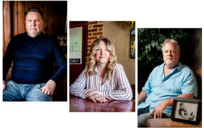
Parents of Autistic Children Weigh In on RFK Jr.'s Plan to Find the Cause