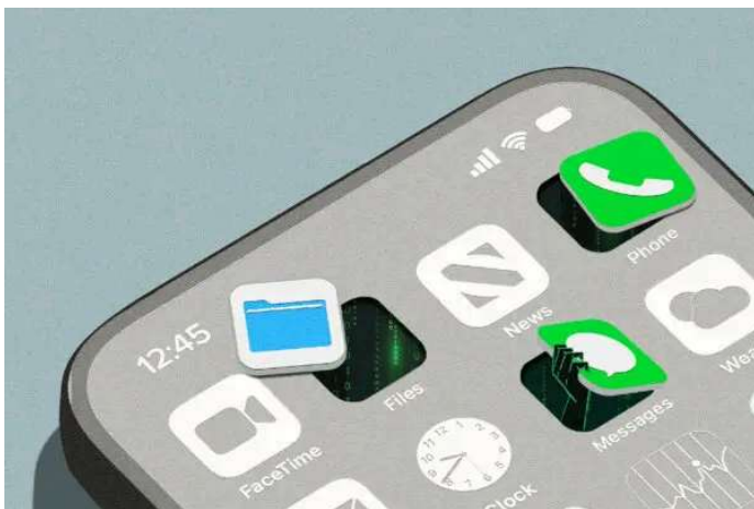
How Hackers Can Control Your Phone Without You Clicking on a Link