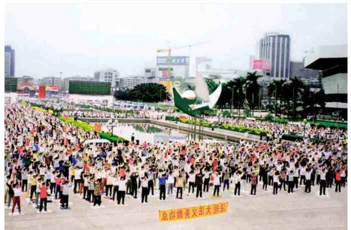
How Falun Gong Spread and Transformed China in the '90s