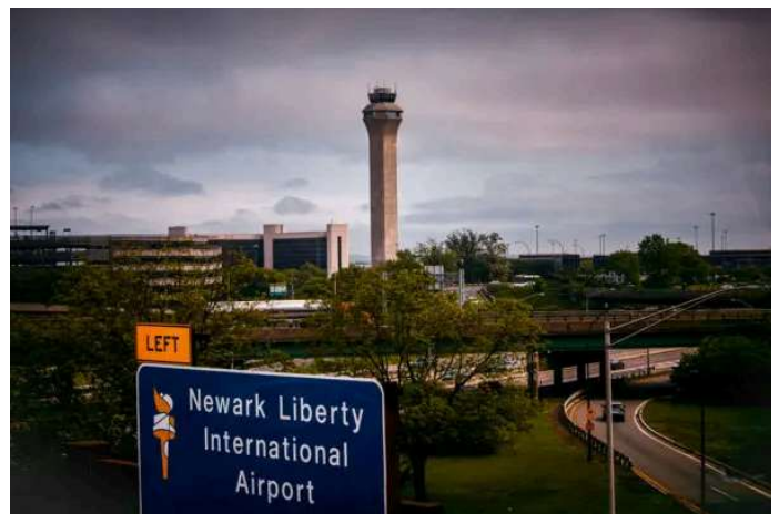
What to Know About the Problems in Newark's Airspace