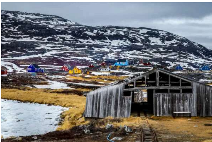
Greenland's Mineral Wealth Could Pave Way to Independent Future