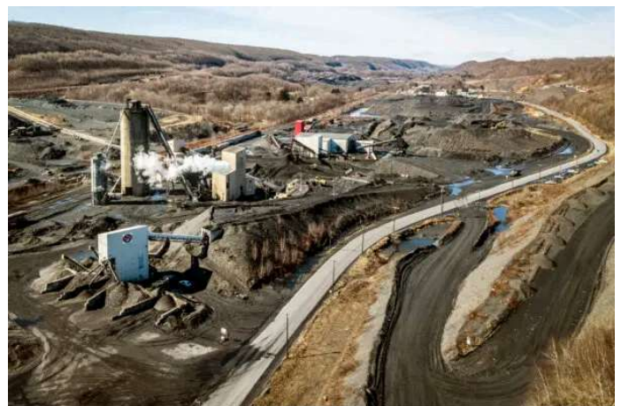
Even With Trump's Orders, an Uncertain Future for Pennsylvania's Coal Miners