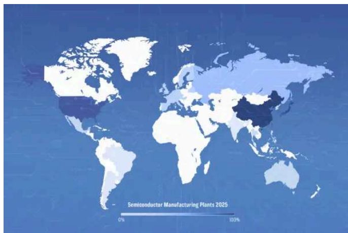
Trump Admin Eyes Semiconductor Tariffs—Here's What to Know