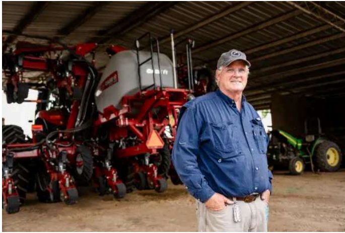
How Legal Immigration Is Keeping Farms Afloat