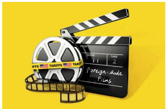
Hollywood Unions Cautiously Welcome Trump's Movie Tariff Proposal