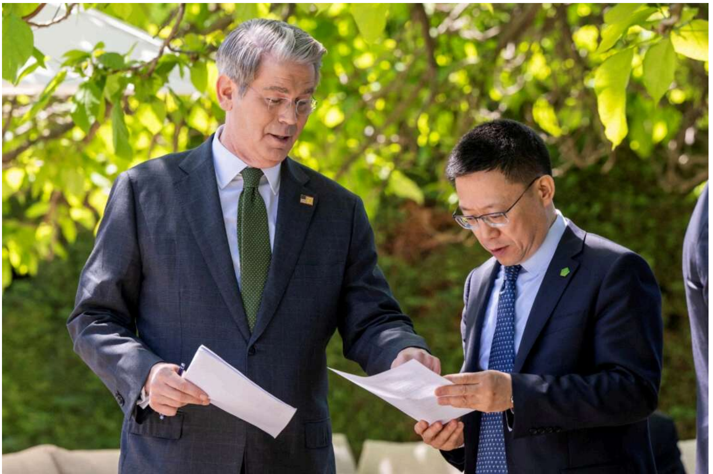
U.S. Secretary of the Treasury Scott Bessent speaks with Chinese Vice Minister of Finance Liao Min, on the day of a bilateral meeting between the United States and China, in Geneva, Switzerland, on May 11, 2025.