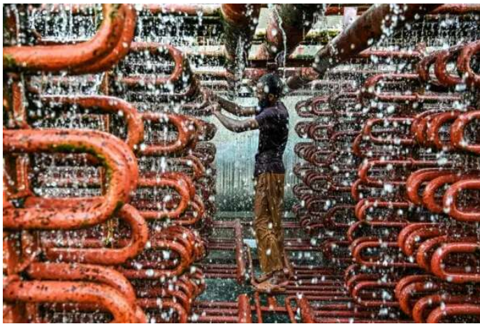
Day in Photos: Ice Factory, Patrol Plane Crashed, and Royal Agricultural Show