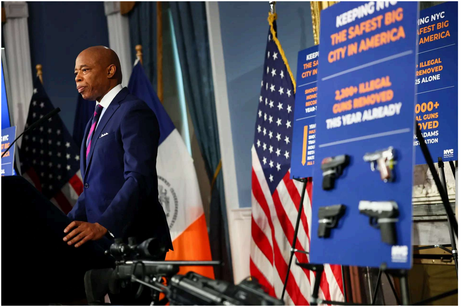
New York Mayor Eric Adams speaks during a press conference on Public Safety at City Hall in New York City, on June 3, 2025. Adams and NYPD Commissioner Jessica Tisch held a press conference announcing the lowest number of shootings and homicides in recorded history during the first five months of 2025.