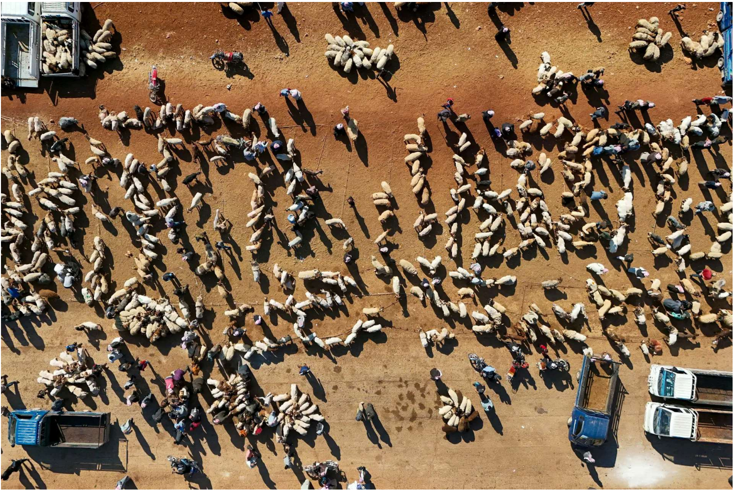
People gather at a livestock market ahead of the Muslim festival of Eid al-Adha in Maarrat Misrin, Syria, on June 3, 2025.