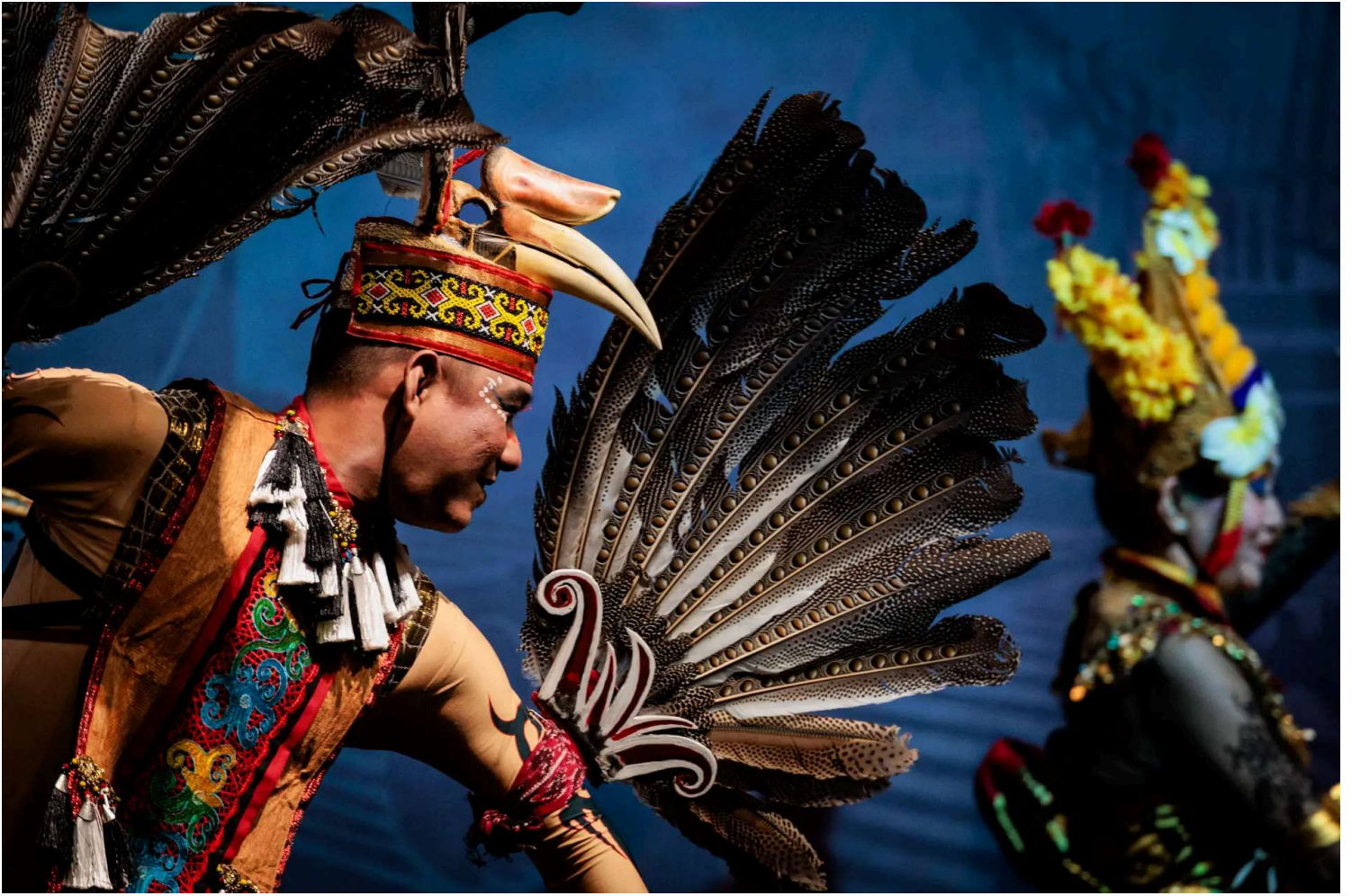
Performers dance during the opening of the Indonesia Critical Minerals Conference & Expo 2025 in Jakarta, Indonesia, on June 3, 2025.