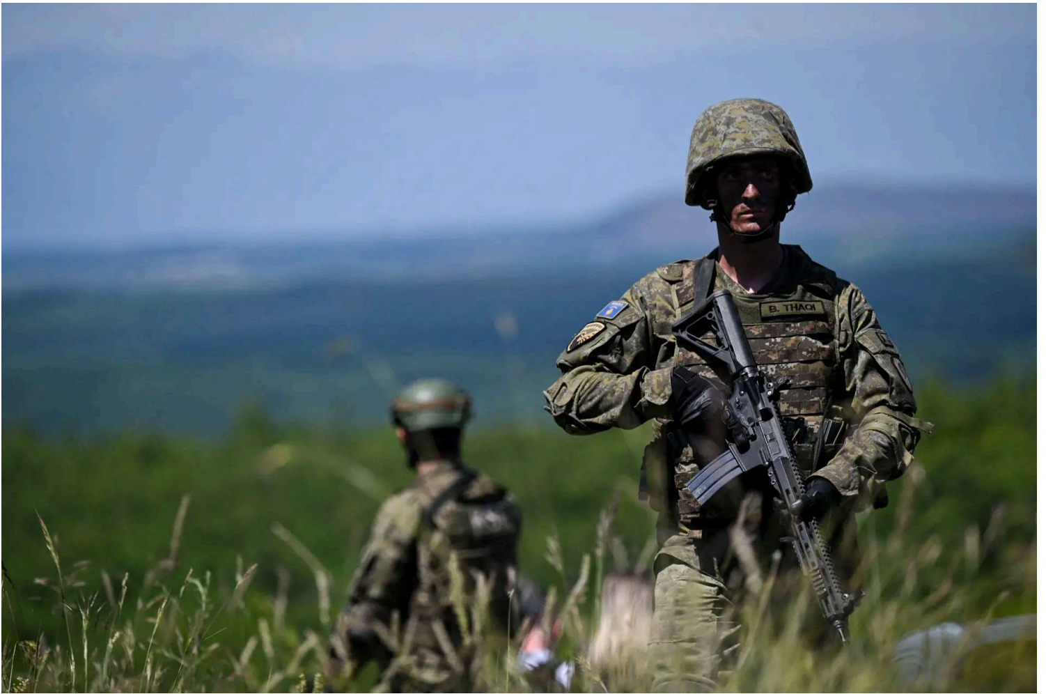
Members of the Kosovo Security Force take part in a joint military exercise with U.S. military personnel in the village of Babaj Bokes, Kosovo, on June 3, 2025.