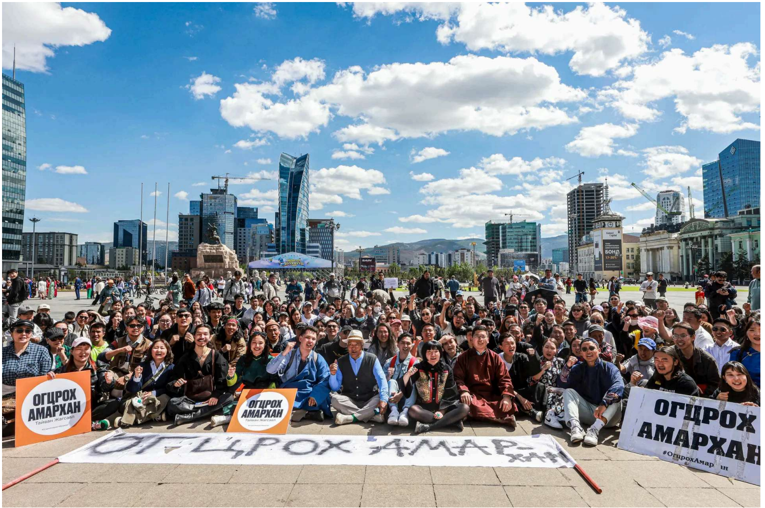
People gather to celebrate after the resignation of Mongolia's Prime Minister Luvsannamsrain Oyun-Erdene, at Sukhbaatar Square in Ulaanbaatar, Mongolia, on June 3, 2025. Oyun-Erdene resigned on June 3 after losing a confidence vote among lawmakers, according to a parliamentary statement, following weeks of anti-corruption protests in the country's capital Ulaanbaatar.

Sign up for the Morning Brief newsletter. Join 200,000+ Canadians who receive truthful news without bias or agenda, investigative reporting that matters, and important stories other media ignore. Sign up with 1-click >>