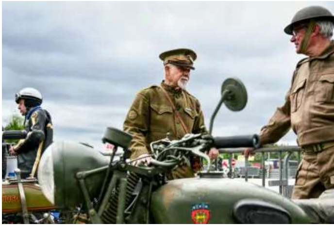
Day in Photos: Vintage Motorcycle Race, Jerusalem Day, and Kristi Noem in Bahrain