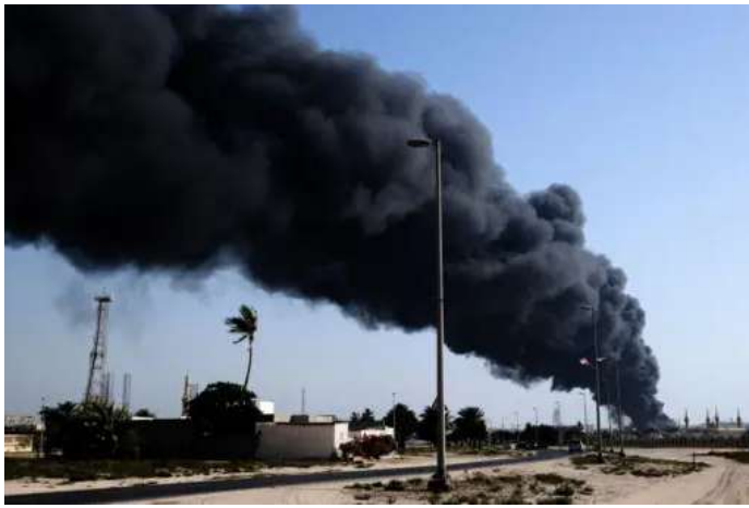
Day in Photos: Fire At Fuel Warehouse, Pink Soup Festival, and Mango Harvest