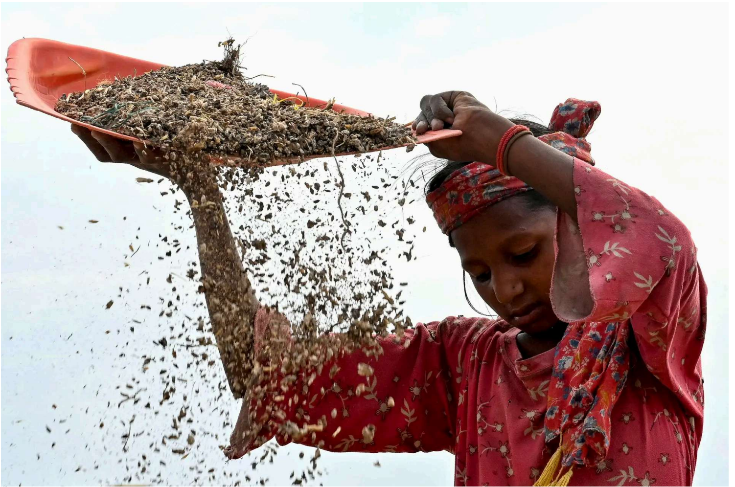
A girl sieves wheat grains from husks at a wholesale market on the outskirts of Amritsar, India, on June 3, 2025.