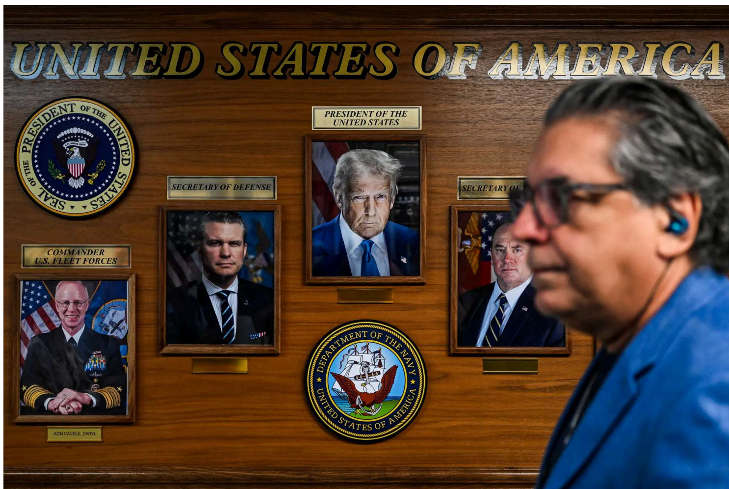
A portrait of President Donald Trump hangs on the wall inside the U.S. Navy hospital ship USNS Comfort while docked at Port Miami, Biscayne Bay, Miami, on June 3, 2025. The vessel is scheduled to deploy to Latin America and the Caribbean on June 4, embarking on a 10-week humanitarian aid mission. Its itinerary includes planned visits to Colombia, Costa Rica, the Dominican Republic, Grenada, Panama, and Ecuador.