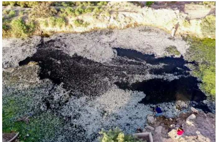
Day in Photos: Mass Fish Die-Off, Fire at Geriatric Ward, and Aurora Australis