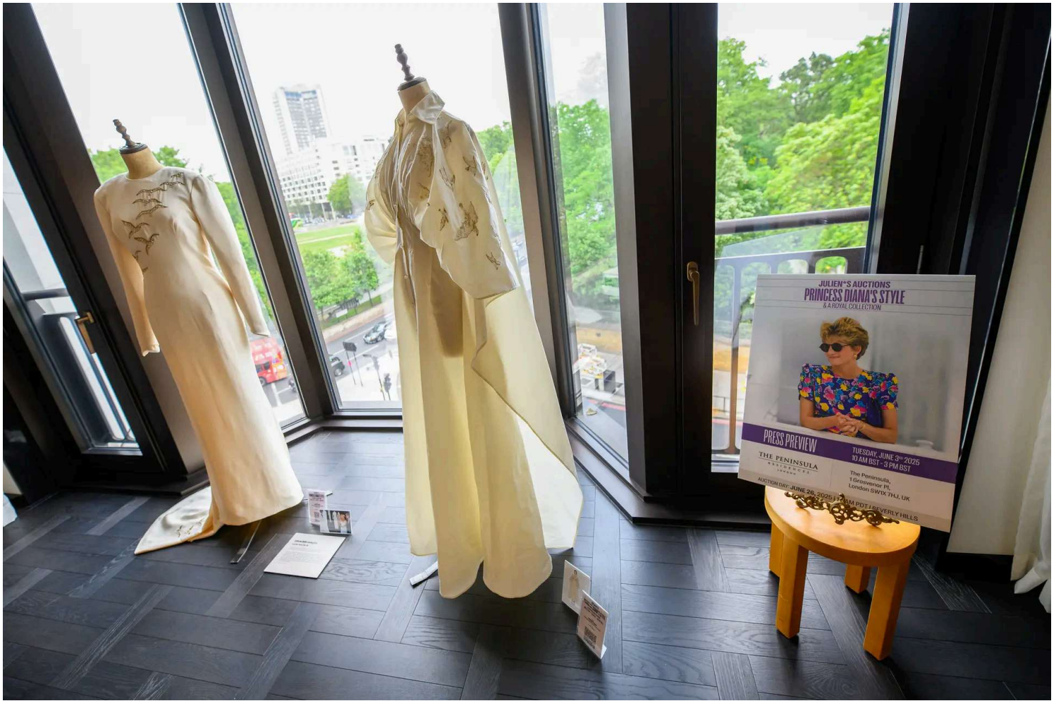
Various items of clothing worn by Diana, Princess of Wales, are displayed at the Peninsula Hotel in London on June 3, 2025. The collection, the largest of Diana's clothing collections to be auctioned, will move to the Peninsula Beverley Hills for auction.