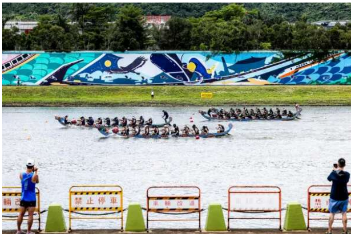
Day in Photos: Dragon Boat Race, Heavy Rainfall in Pakistan, and Young Malay Bear