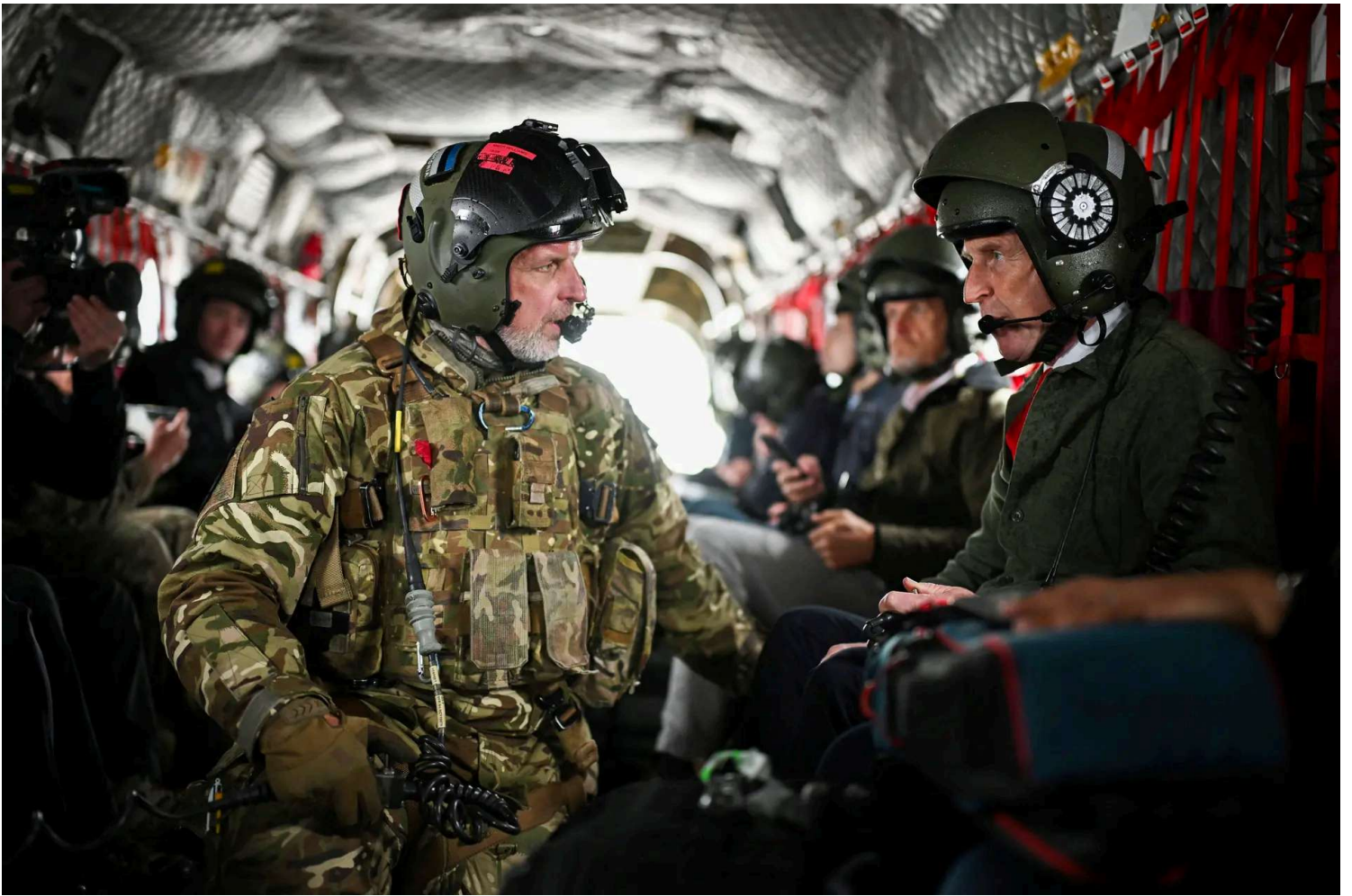
Britain's Defense Secretary John Healey speaks with members of staff as he sits in a helicopter upon arrival at the Warminster Garrison in Warminster, England, on June 3, 2025. Britain announced on June 2 that it would build 12 new attack submarines as it launched a major defense review to move the country to war-fighting readiness. Addressing parliament later on June 2, Healey said the world had entered a new era and vowed to make the UK army '10 times more lethal' by combining future drone technology and artificial intelligence with the 'heavy metal of tanks and artillery.'