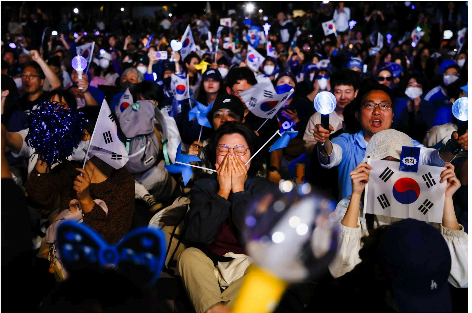
Supporters of Democratic Party presidential candidate Lee Jae-myung celebrate updated election result news in front of the National Assembly in Seoul, South Korea, on June 3, 2025. Lee won the presidential election with over half the vote.