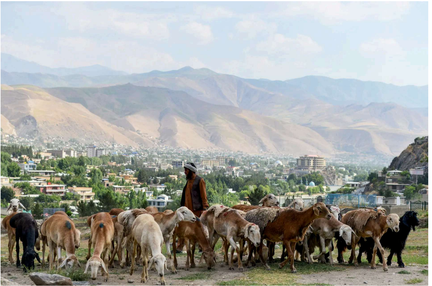
An Afghan livestock vendor stands behind his cattle as he waits for customers ahead of the Muslim festival of Eid al-Adha, on the outskirts of the Fayzabad district in Badakhshan province, on June 3, 2025.