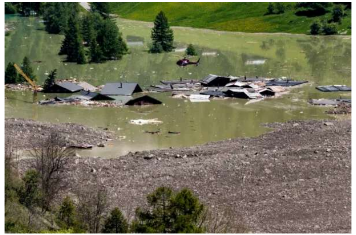
Day in Photos: Collapsed Glacier, Landslide on Excavation Site, and Last Day of Underground School