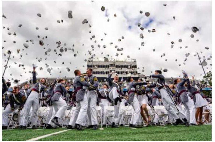
Day in Photos: West Point Graduation, Ukraine-Russia Prisoner Exchange, and Noem in Bahrain