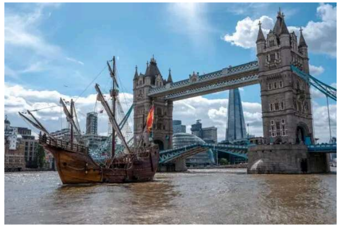
Day in Photos: Ship of Christopher Columbus, Protests in Bangladesh, and Glacier Collapse in Switzerland