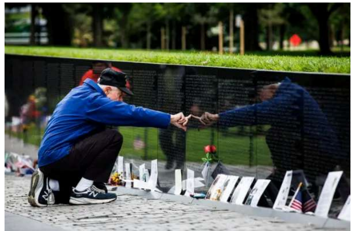
Day in Photos: Memorial Day, Car Strikes Sports Fans, and Tornado in Chile