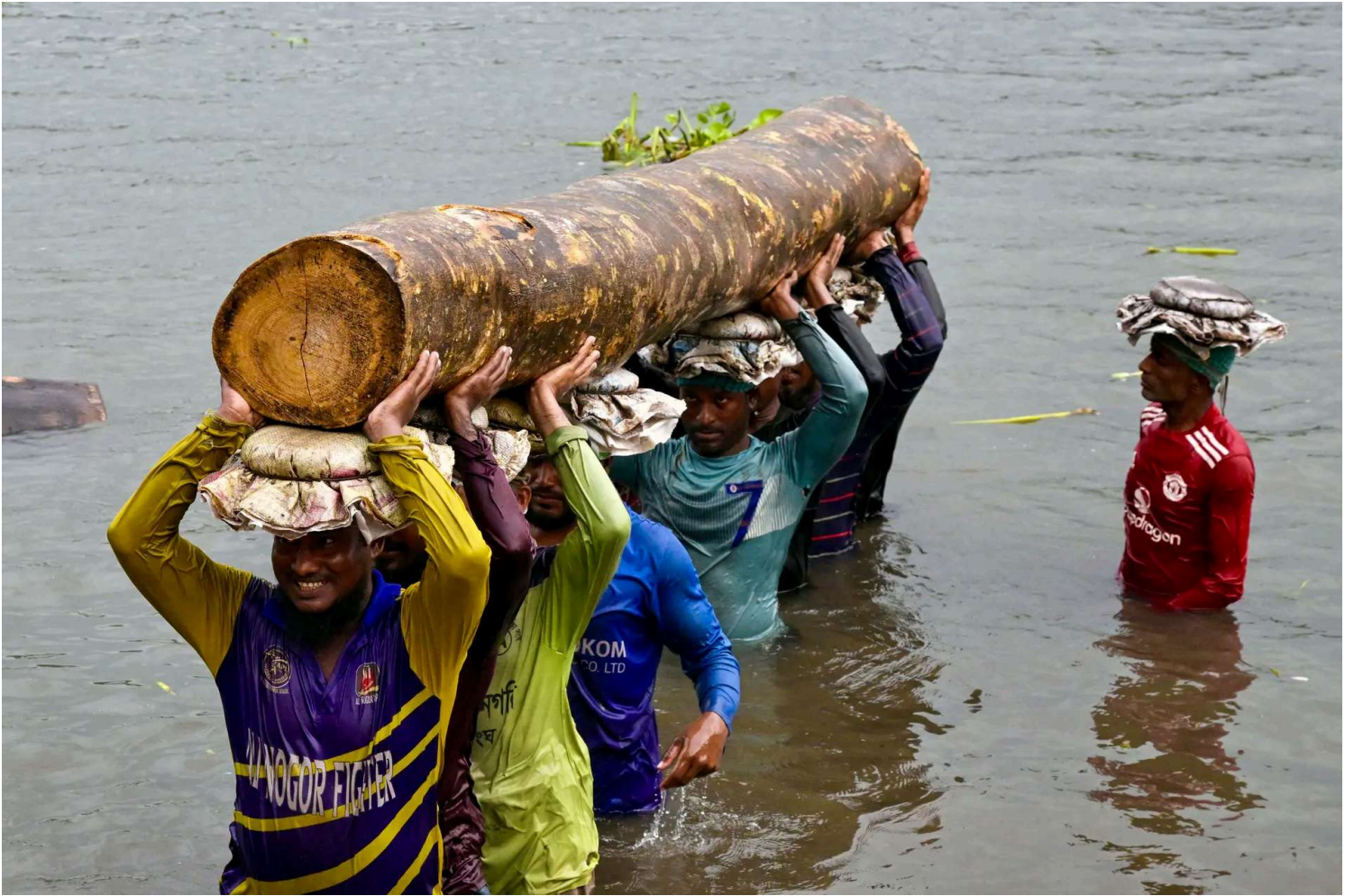
Laborers carry a wooden log along the banks of the Buriganga river in Dhaka, Bangladesh, on June 3, 2025.