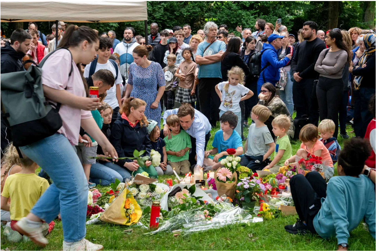
People gather with flowers and candles during a silent vigil for an 11-year-old boy who died in a collision with a police car, in Ganshoren, Brussels, on June 3, 2025.