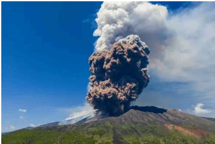
Day in Photos: Etna Eruption, Rockfall in Indonesia, and Schwarzenegger in Austria