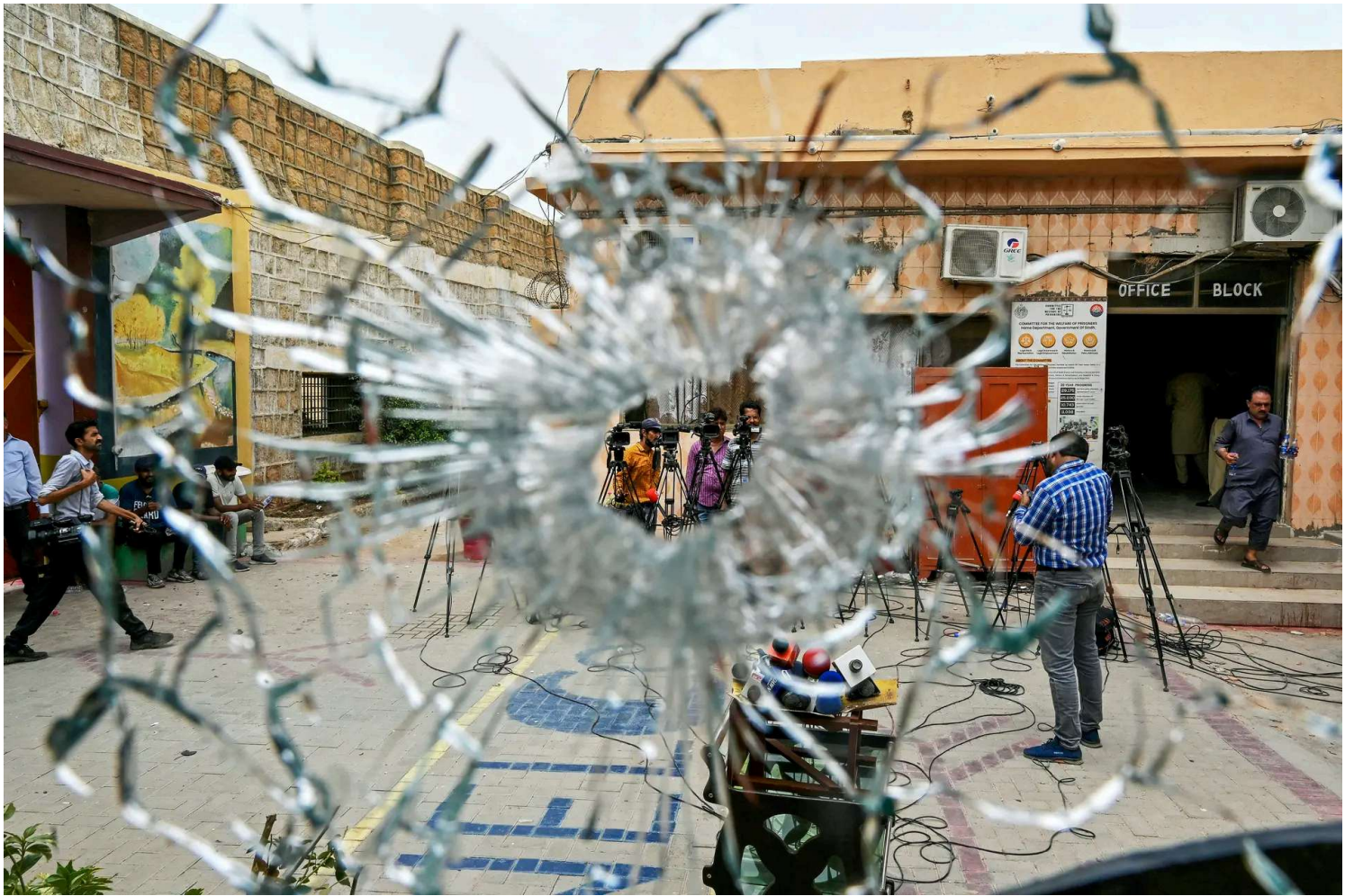
Media personnel are seen through a damaged, bullet-ridden glass window at a prison facility in the Malir district of Karachi, Pakistan, on June 3, 2025, after prisoners escaped overnight owing to earthquake panic. More than 200 Pakistani inmates escaped from the jail in the coastal city after several earthquake tremors, government officials said.