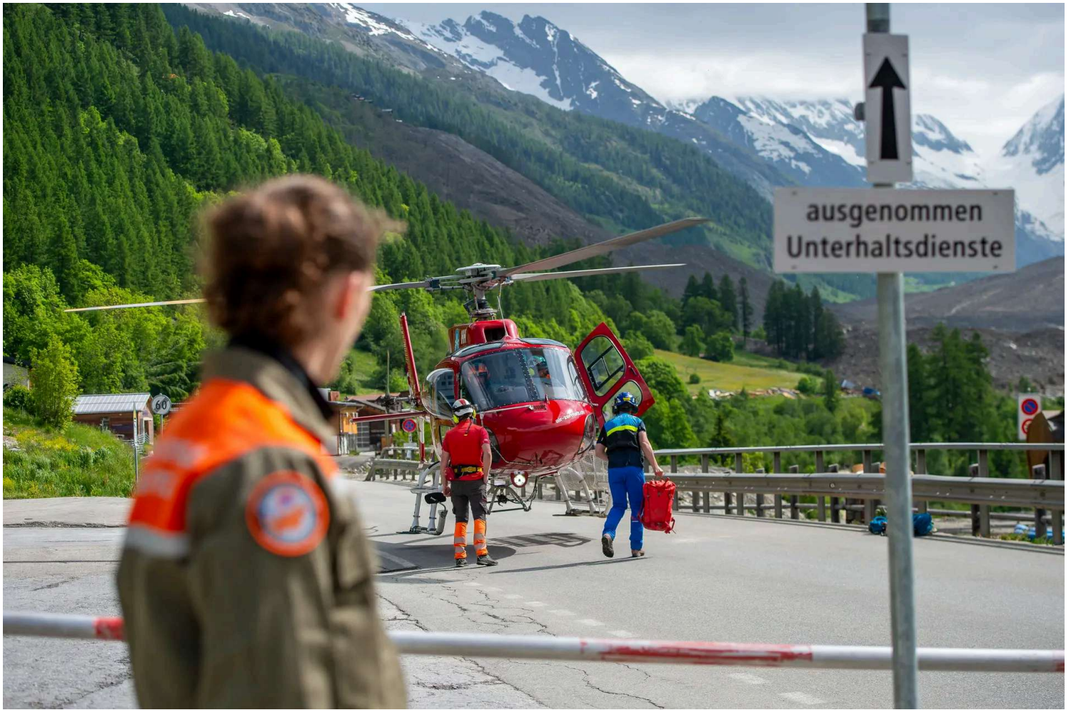
Air-Zermatt staff help with the helicopter at the Loetschental valley following last week's landslide at Blatten, Switzerland, on June 3, 2025. Over nine million cubic meters of rubble, mud, and ice fell onto Blatten on May 28, following days of instability at Kleiner Nesthorn peak and underlying Birch glacier. Blatten's 300 residents evacuated before the avalanche and are safe, though one man remains missing, and most of the village is obliterated. Authorities say rock at the Kleines Nesthorn remains unstable and more rubble could still fall into the valley.