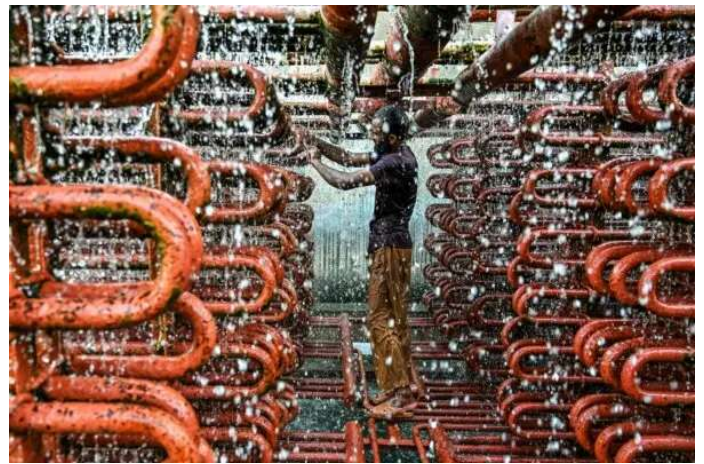
Day in Photos: Ice Factory, Patrol Plane Crashed, and Royal Agricultural Show