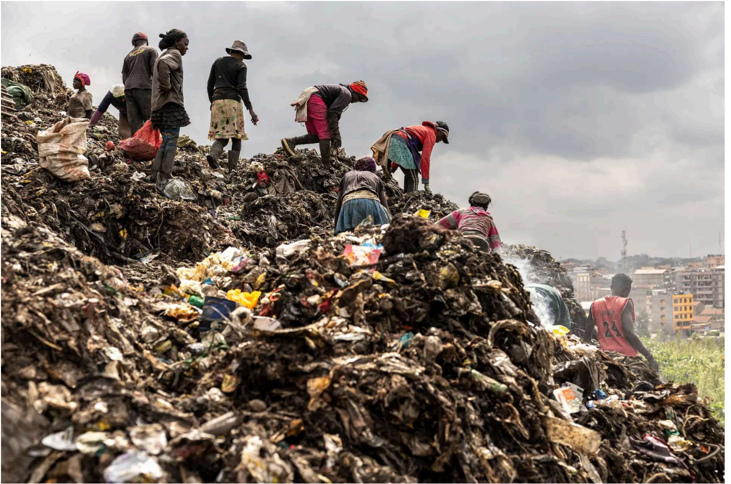
Women recyclers collect garbage at the dump near the Dandora settlement in Nairobi, Kenya, on June 4, 2025. World Environment Day is celebrated annually on June 5, encouraging protection of the environment.