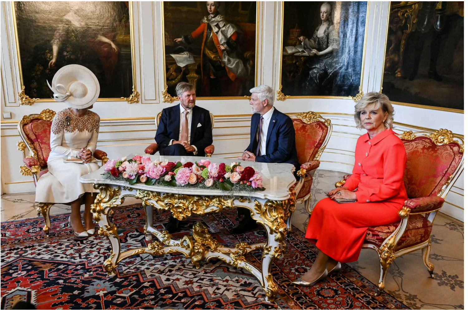
Czech Republic President Petr Pavel (2nd R) and his wife Eva Pavlova (R) with King Willem-Alexander of the Netherlands (2n L) and his wife Queen Maxima (L) pose for a photo during a welcome ceremony in the Prague Castle on June 4, 2025.