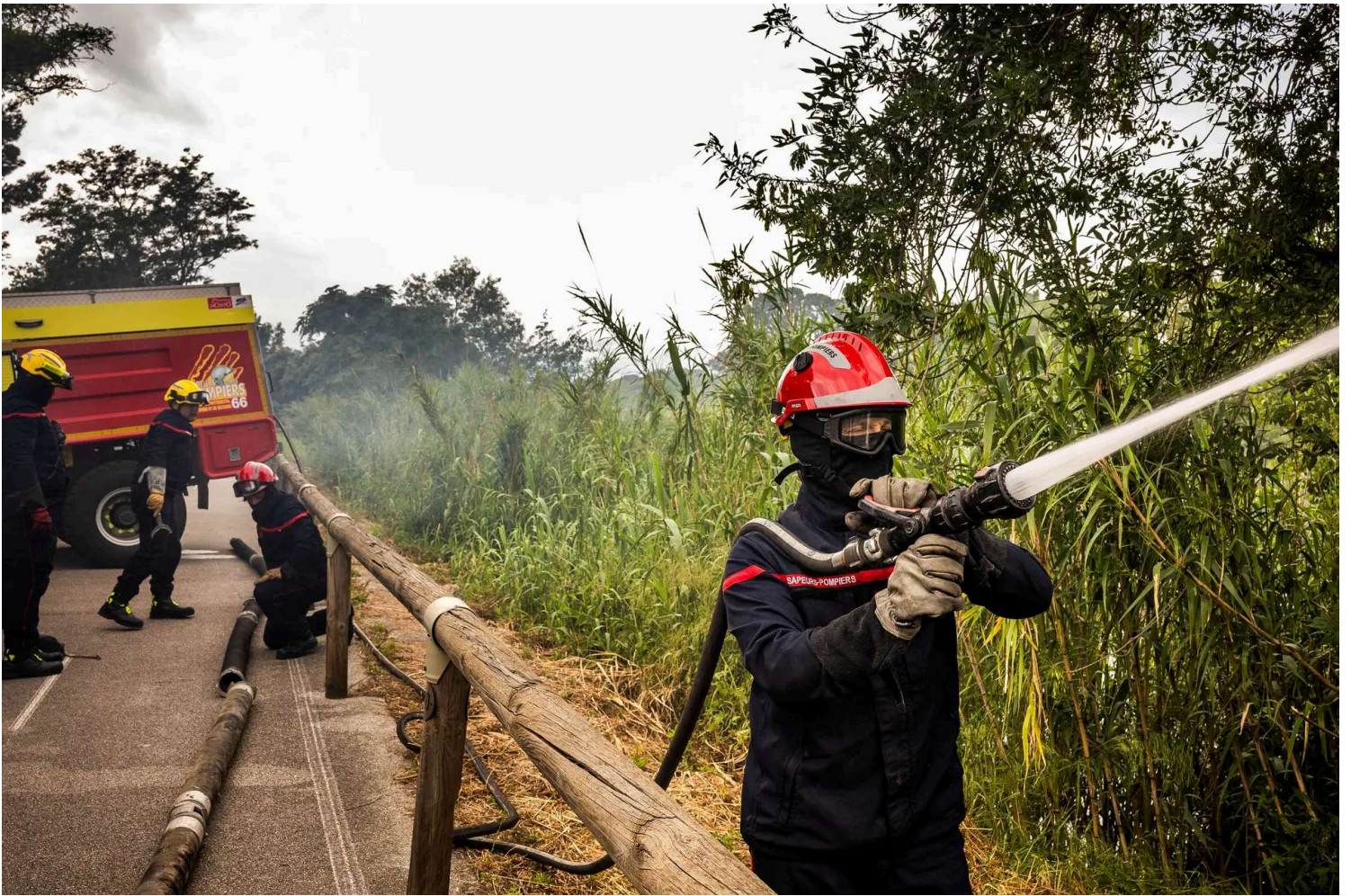
A firefighter battles a blaze at Le Brasilia campsite in Canet en Roussillon in the Pyrenees-Orientales department of southern France on June 4, 2025. Every year, Le Brasilia, with the help of the fire department, organizes an evacuation exercise in a simulated forest fire to practice the steps to take in the event of a rapid fire on the tourist site.