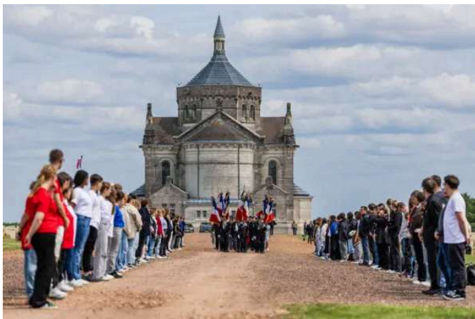
Day in Photos: Burial of Soldiers of the First World War, Prison Escape in Pakistan, and Princess Diana's Clothing Auction