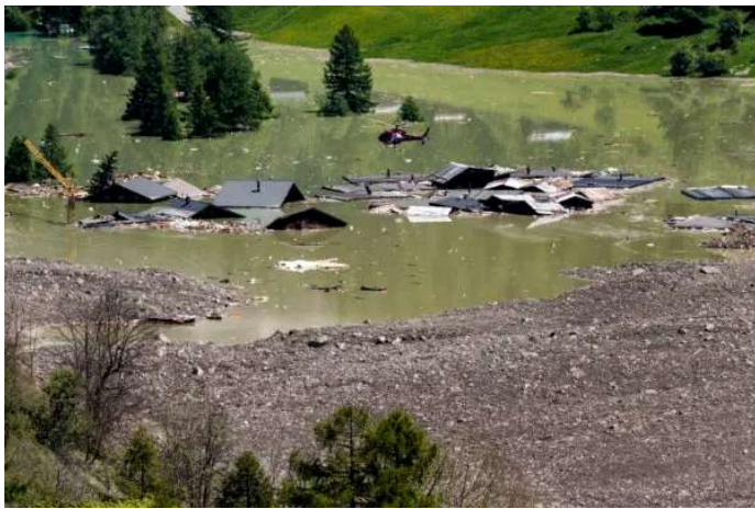
Day in Photos: Collapsed Glacier, Landslide on Excavation Site, and Last Day of Underground School