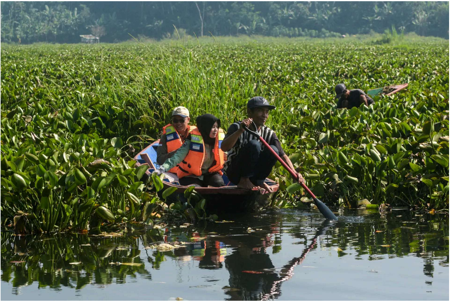
Local activists and volunteers navigate a boat to clean up floating debris and water hyacinth covering the Citarum River in Bandung, West Java, Indonesia, on June 4, 2025.