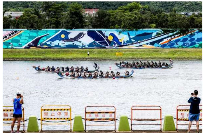
Day in Photos: Dragon Boat Race, Heavy Rainfall in Pakistan, and Young Malay Bear