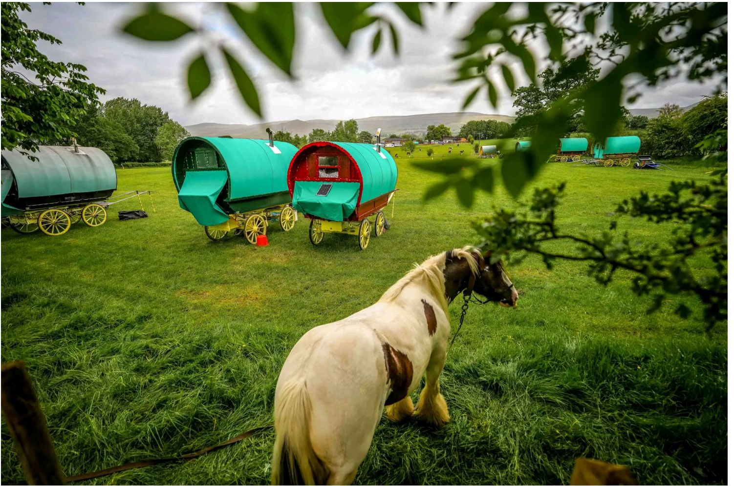
Caravans set up camp for the Appleby Horse Fair in England, on June 4, 2025. The annual gathering of Gypsy, Romany and Traveler communities, which starts Thursday, dates back to 1685 and is under the protection of a charter granted by James II. The event remains one of the key meeting points for Traveler communities in the UK. Thousands of people are expected to attend, mainly to buy and sell horses and socialize.