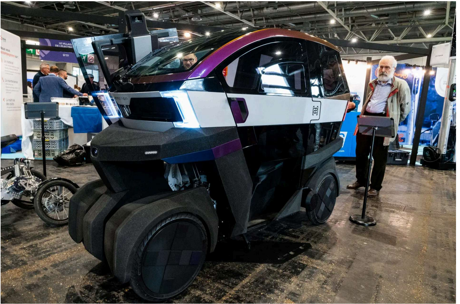
The Drive to Zero exhibit promoting carbon-free transportation at Paris Expo Porte de Versailles in Paris on June 4, 2025.