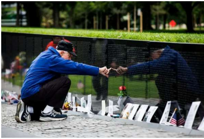
Day in Photos: Memorial Day, Car Strikes Sports Fans, and Tornado in Chile