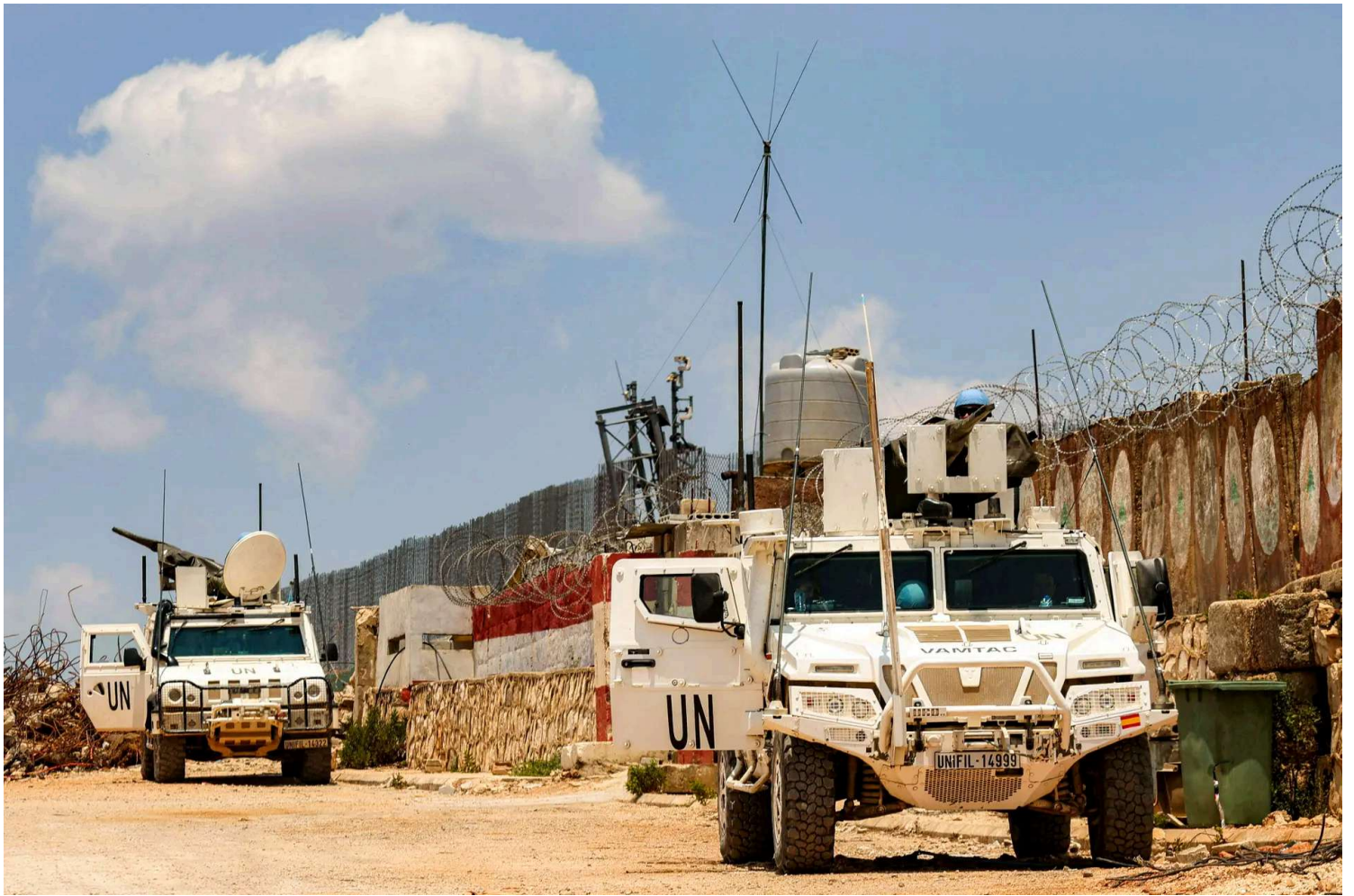
Peacekeepers of the U.N. Interim Force in Lebanon patrol the Israeli border near the village of Kfar Kila on June 4, 2025.