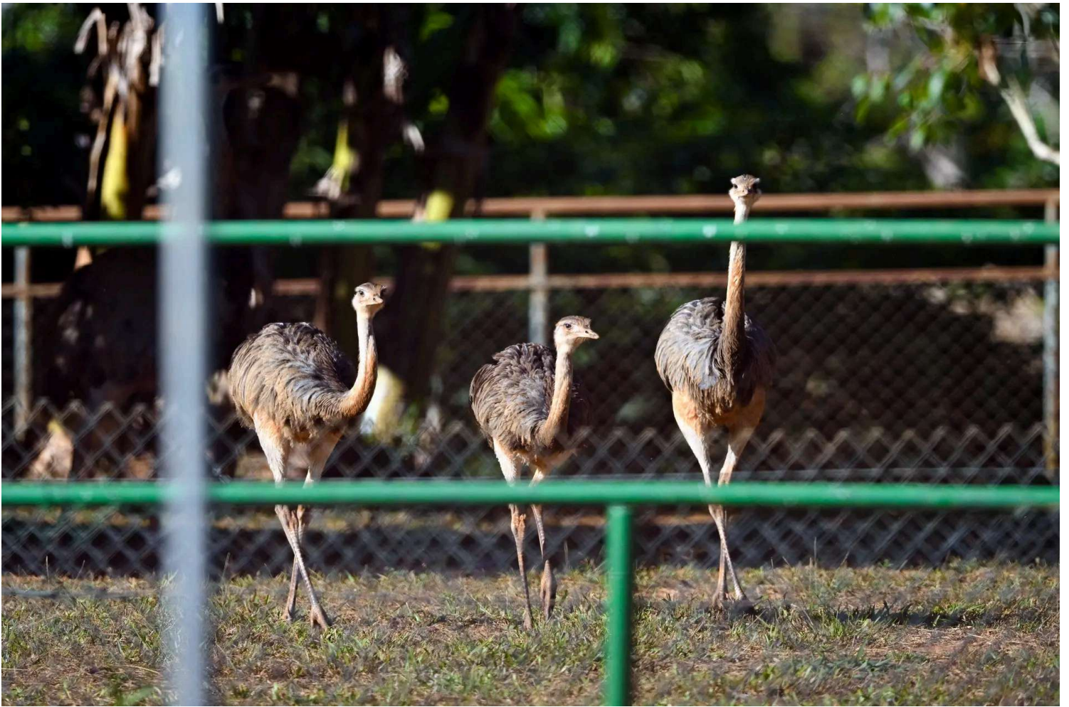
Greater rheas ( Rhea americana ) are seen in their enclosure at the Brasilia Zoo in Brazil on June 4, 2025. Brazil, the world's top exporter of chicken meat, has suspended its shipments to more than 20 countries due to an avian flu outbreak that began in mid-May. Brasilia's zoo closed on May 28 after finding a dead pigeon and dead duck that it suspected were cases of the disease.