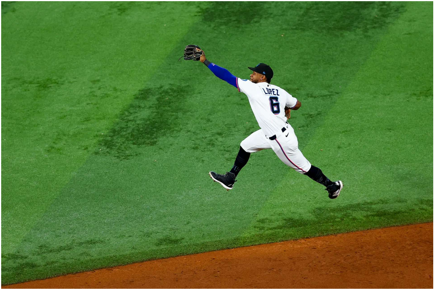
Otto Lopez (#6) of the Miami Marlins catches the ball for an out against the Colorado Rockies in the second inning of a game at LoanDepot Park in Miami on June 4, 2025.