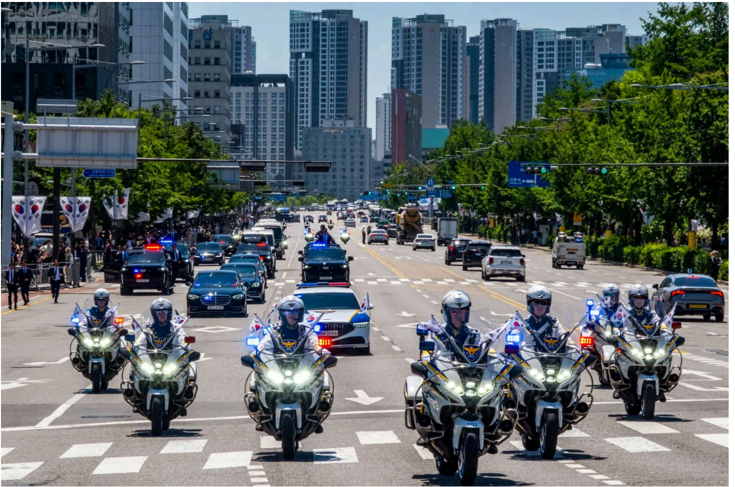
The motorcade transporting South Korea's President Lee Jae-myung heads to the presidential office from the National Assembly following his inauguration in Seoul on June 4, 2025.