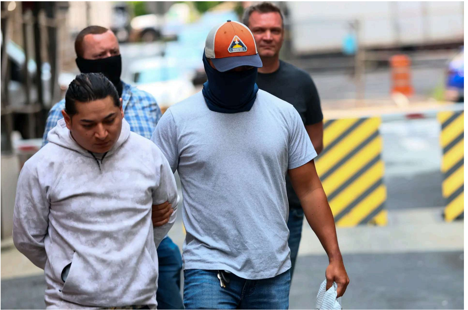
Federal agents escort detainees to vehicles after exiting an Immigration and Customs Enforcement (ICE) supervision office in New York City on June 4, 2025. Federal agents are arresting illegal immigrants during mandatory check-ins as ICE ramps up enforcement following immigration court hearings. The Trump administration has ordered officials to increase detentions to 3,000 illegal immigrants per day.