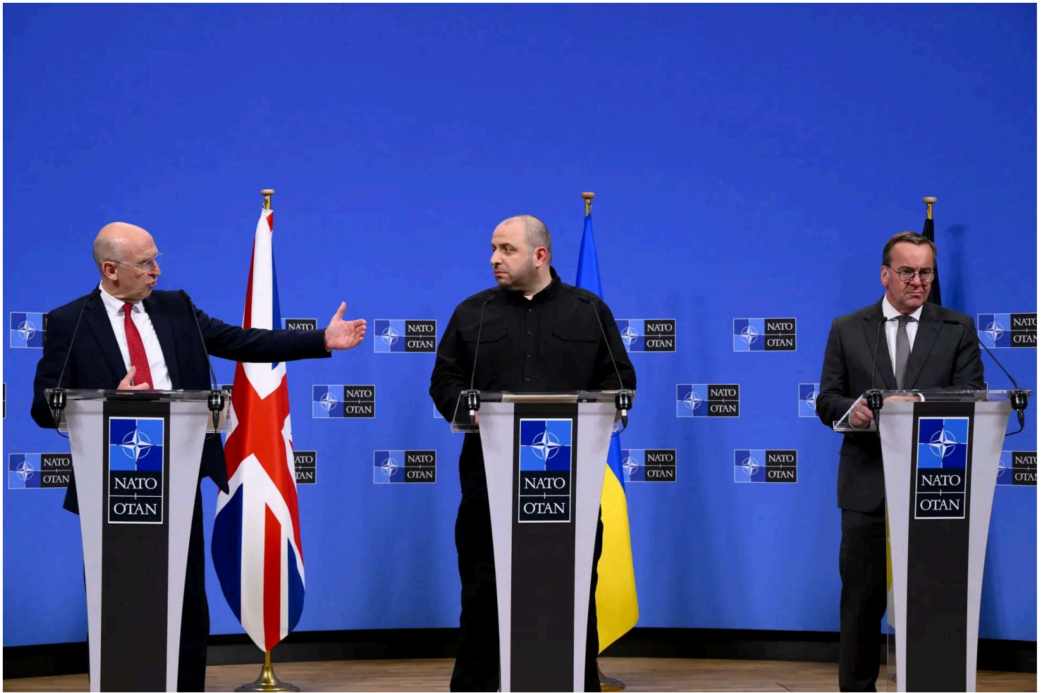
Britain's Defense Secretary John Healey (L), Ukraine's Defense Minister Rustem Umerov (C) and Germany's Defense Minister Boris Pistorius (R) hold a joint press conference following the Meeting of the Ukraine Defense Contact Group at NATO headquarters in Brussels on June 4, 2025.