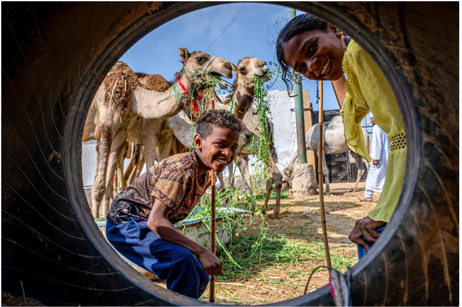
Children standing next to camels peek through the hole of a discarded tire at the Birqash camel market on the northeastern outskirts of Giza, Egypt, on June 4, 2025, ahead of Eid al-Adha, the Muslim feast of sacrifice.