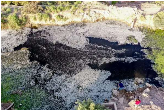
Day in Photos: Mass Fish Die-Off, Fire at Geriatric Ward, and Aurora Australis