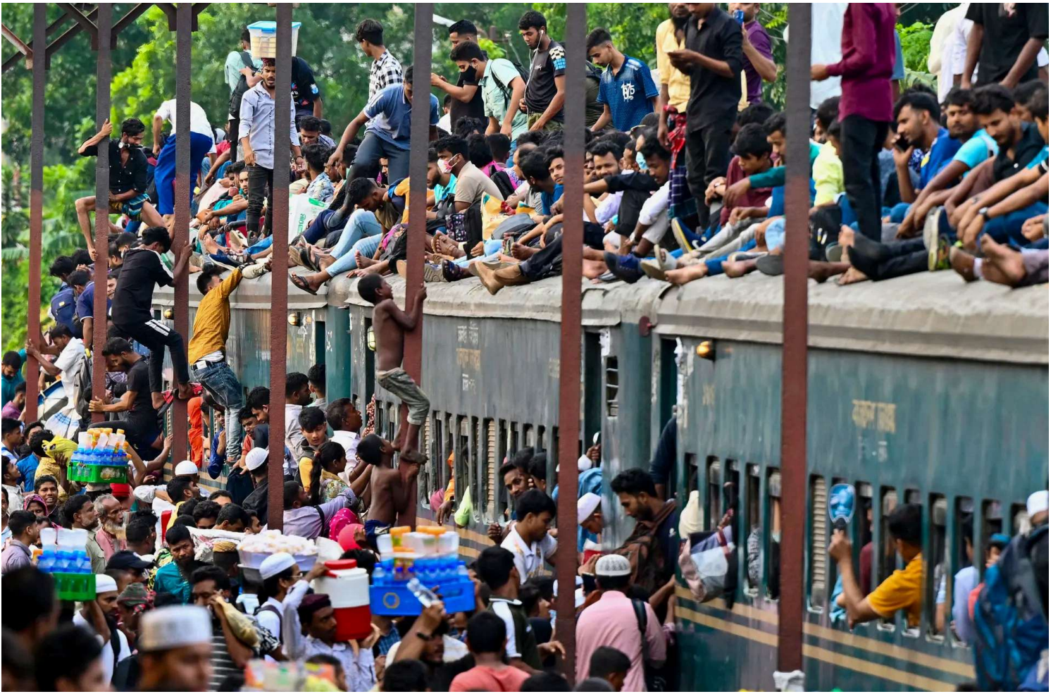
Bangladeshis board a train at a railway station on the outskirts of Dhaka on June 4, 2025, as they travel to their hometowns to celebrate Eid al-Adha with their families.