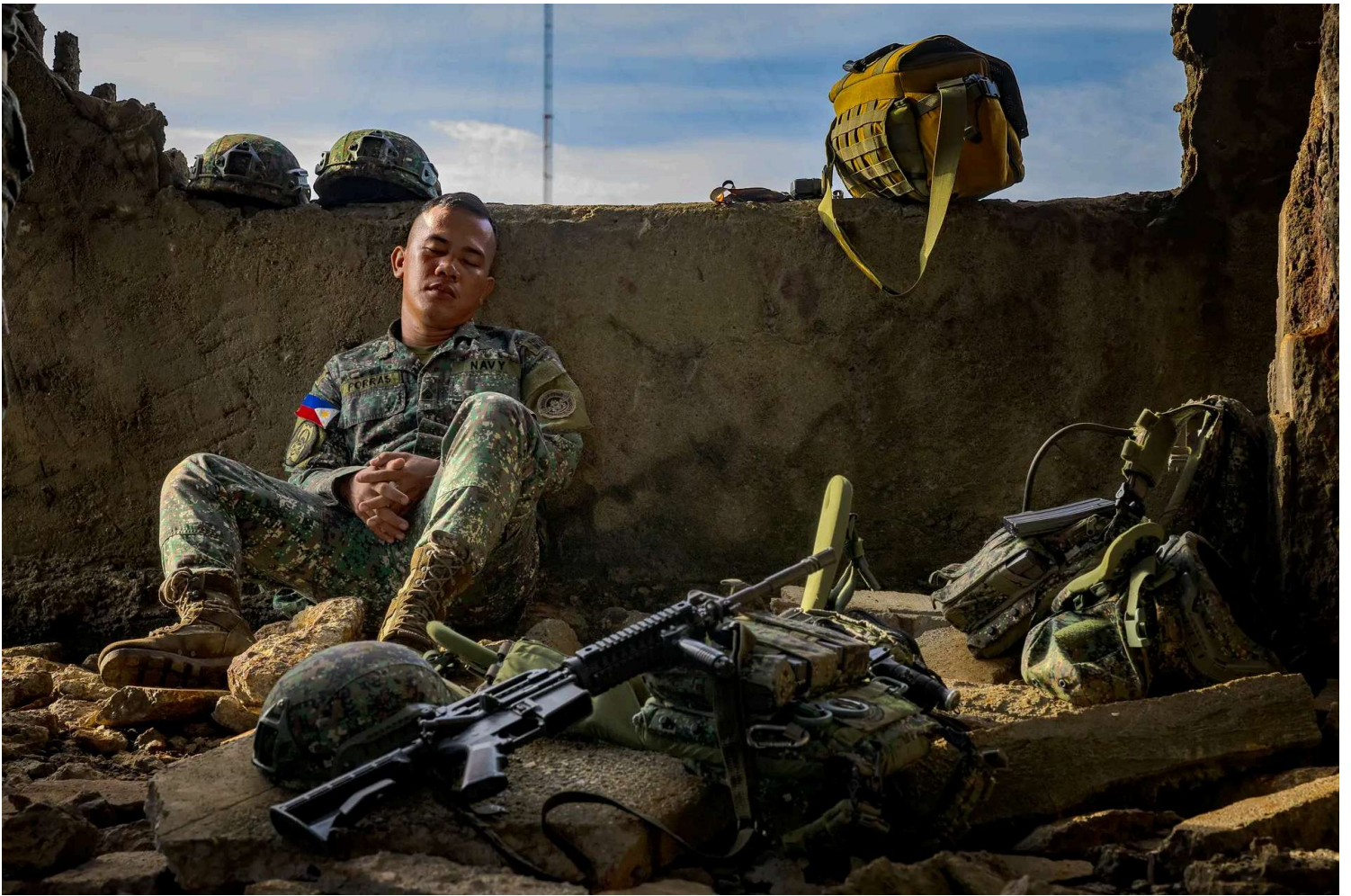
A Philippine marine soldier rests as he takes part in the Kamandag (cooperation of the warriors of the sea) live fire exercises between U.S. and Philippine marines in Burgos, Philippines, on June 4, 2025. During last week's Shangri-La Dialogue, Manila's defense chief Gilberto Teodoro responded to Beijing's warnings of a brewing proxy war in Asia by saying that "China has a lot of trust-building to do," amid growing U.S. arms sales to the region and the expansion of American military bases in the Philippines.