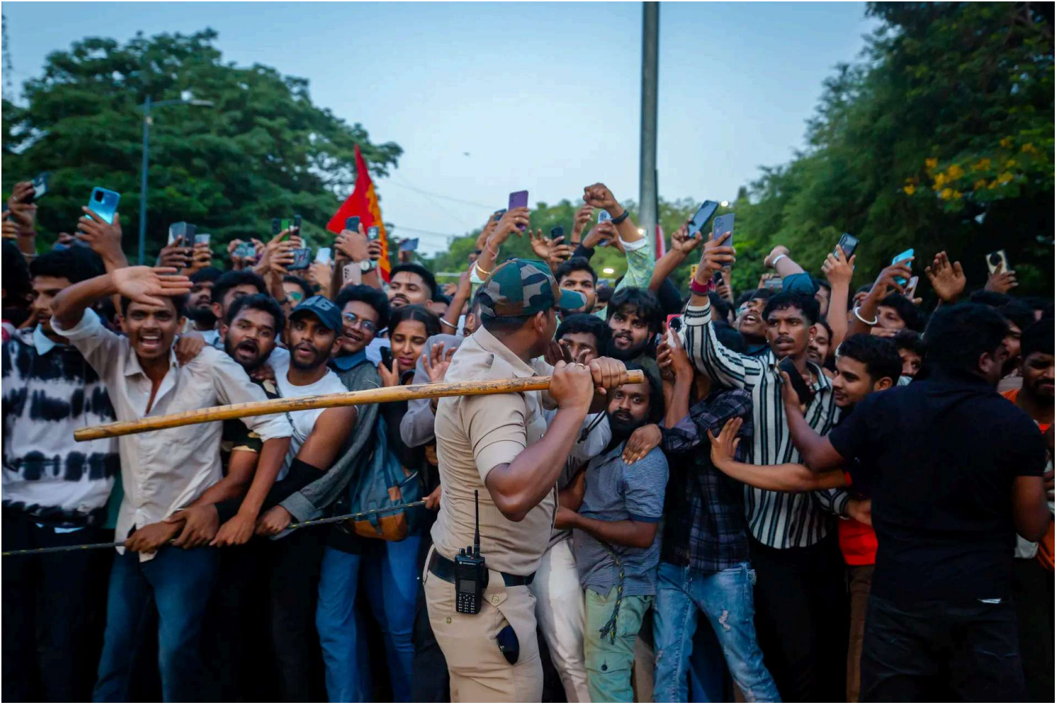
Police officers try to control fans of the Royal Challengers Bengaluru and get them to disperse from outside the M. Chinnaswamy Stadium in Bengaluru, India, on June 4, 2025. During the celebrations surrounding Royal Challengers Bengaluru's first Indian Premier League title, reports say a stampede near the stadium left over 50 fans injured and at least 11 feared dead. The incident took place during a public event held to mark Royal Challengers 2025 victory.