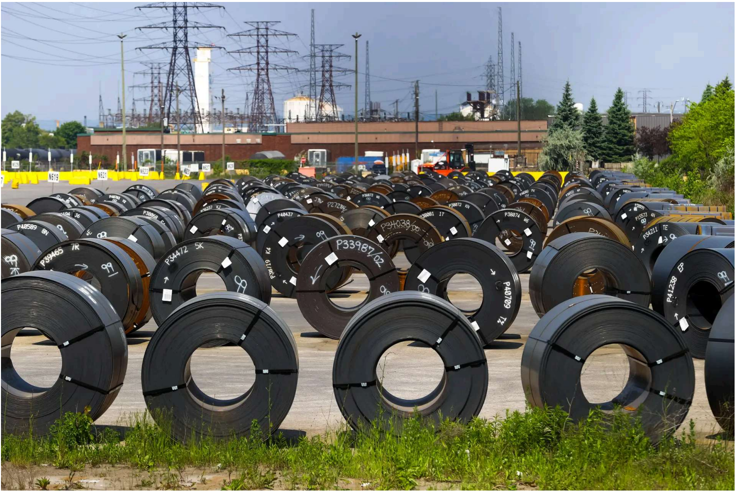
Coils of steel are seen in a yard outside one of ArcelorMittal Dofasco's steel manufacturing buildings in Hamilton, Ontario, Canada, on June 4, 2025. Canadian Prime Minister Mark Carney on Wednesday denounced President Donald Trump's doubling of tariffs on steel and aluminum to 50 percent, calling the levies "unjustified and illegal."