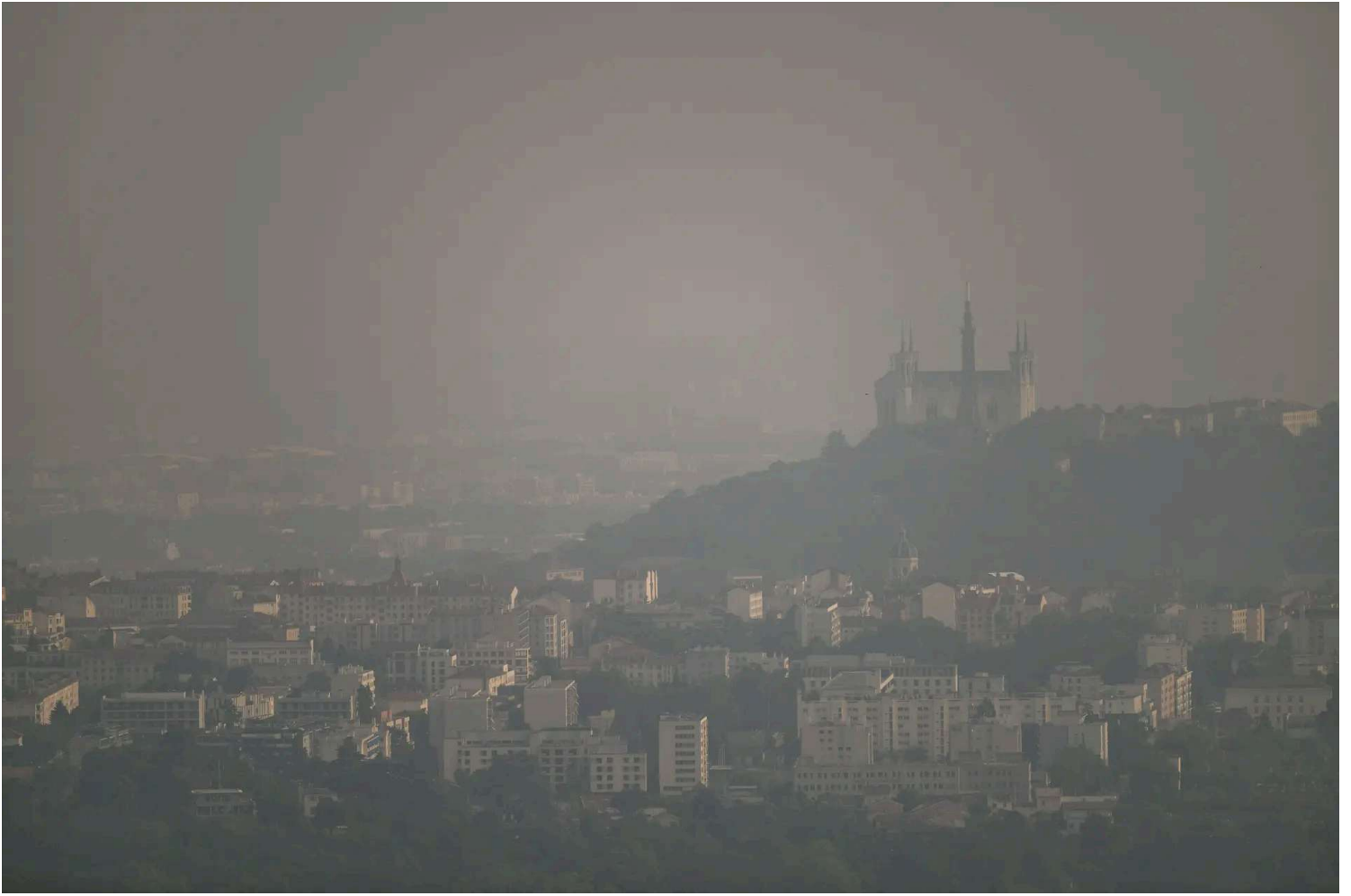
The Basilica of Notre-Dame de Fourvière, the city of Lyon, and the surrounding area are seen in a thick mist, on the day heavy smoke from intense wildfires in Canada reached France, according to Meteo-France, on June 10, 2025.