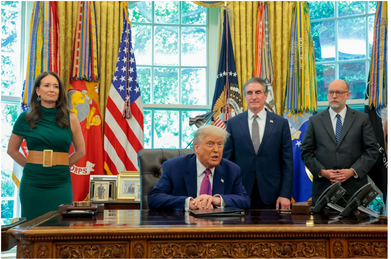
President Donald Trump, joined by Agriculture Secretary Brooke Rollins, Interior Secretary Doug Burgum and Director of the Office of Management and Budget Russell Vought, delivers a statement on natural disaster preparedness in the Oval Office at the White House in Washington on June 10, 2025. Trump said he wants to eliminate the Federal Emergency Management Agency (FEMA) and return its function to the state level.