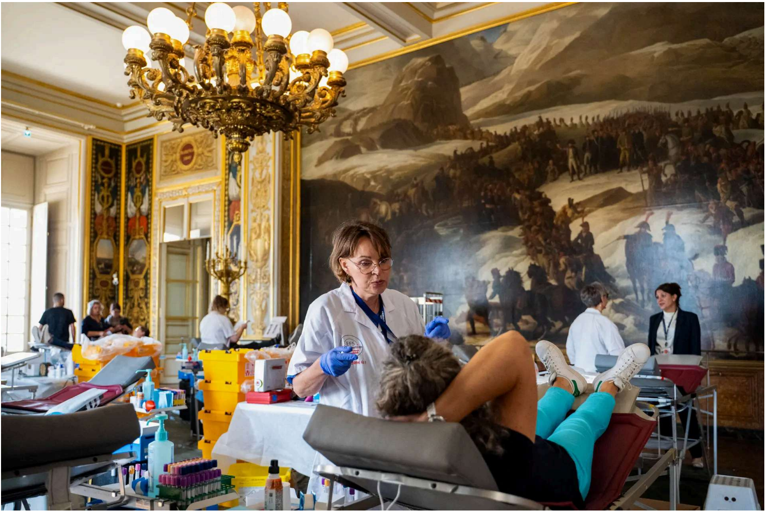
A nurse speaks to a woman during a blood donation organized by the 'Etablissement Français du Sang d'Ile-de-France' (French Blood Establishment of Ile-de-France) in the Marengo Room, one of the Empires Rooms at the Palace of Versailles, in Versailles, near Paris, on June 10, 2025. This is the first time that the Palace of Versailles has hosted such a blood donation in one of its historic rooms.