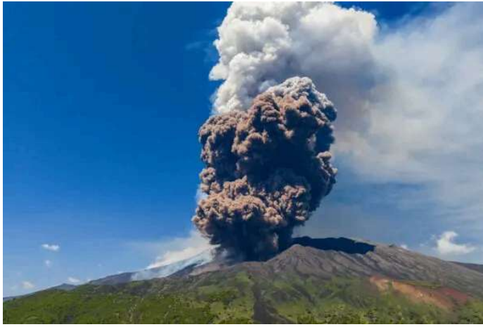
Day in Photos: Etna Eruption, Rockfall in Indonesia, and Schwarzenegger in Austria