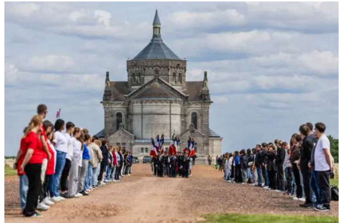
Day in Photos: Burial of Soldiers of the First World War, Prison Escape in Pakistan, and Princess Diana's Clothing Auction