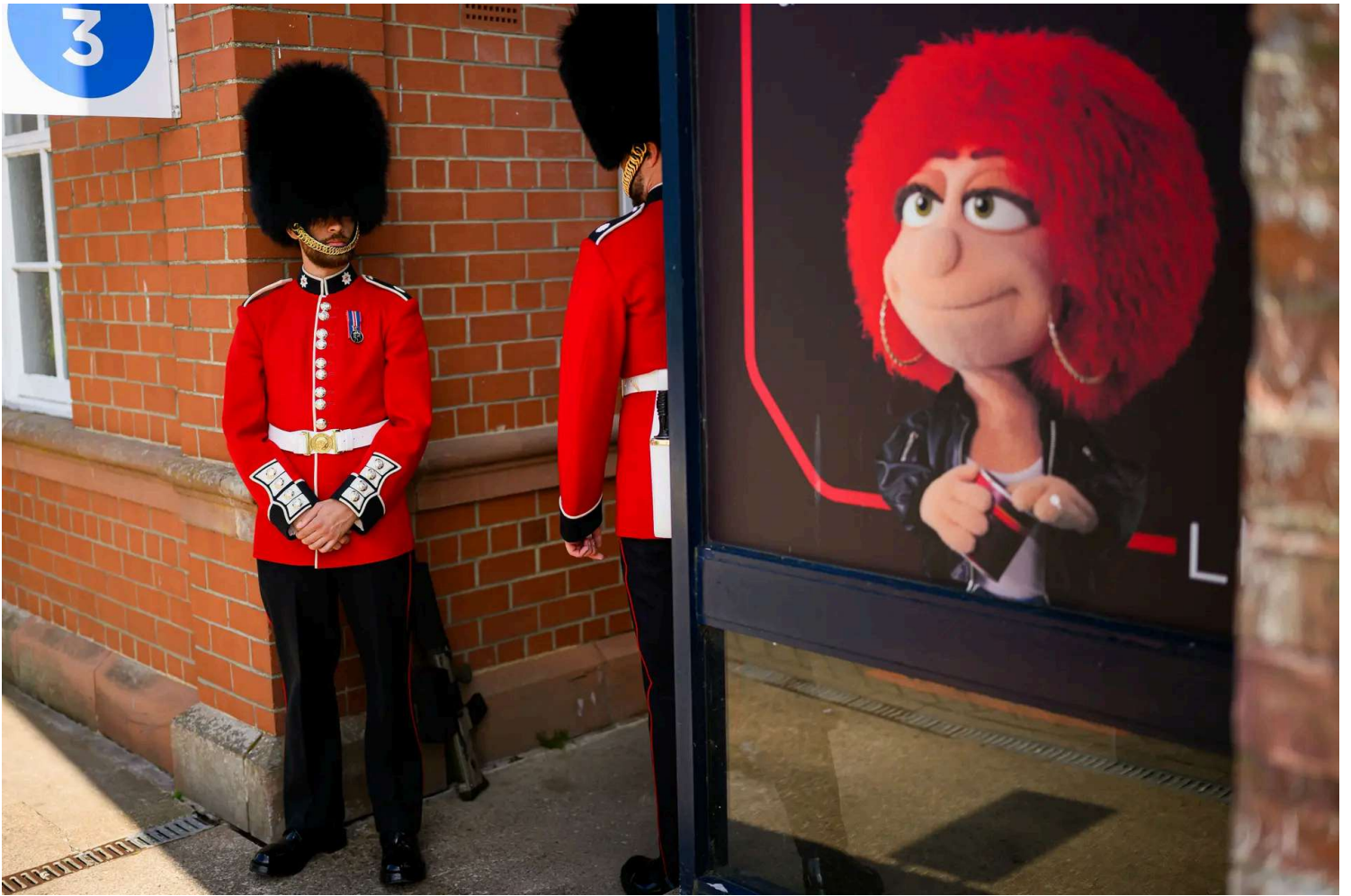
Members of the Coldstream Guards wait for their return train in the railway station on June 10, 2025, in Berwick-Upon-Tweed, United Kingdom. Members of the Regiment made the rail journey from London to parade through their birthplace in Berwick to mark the 375th Anniversary of their formation there in 1650.