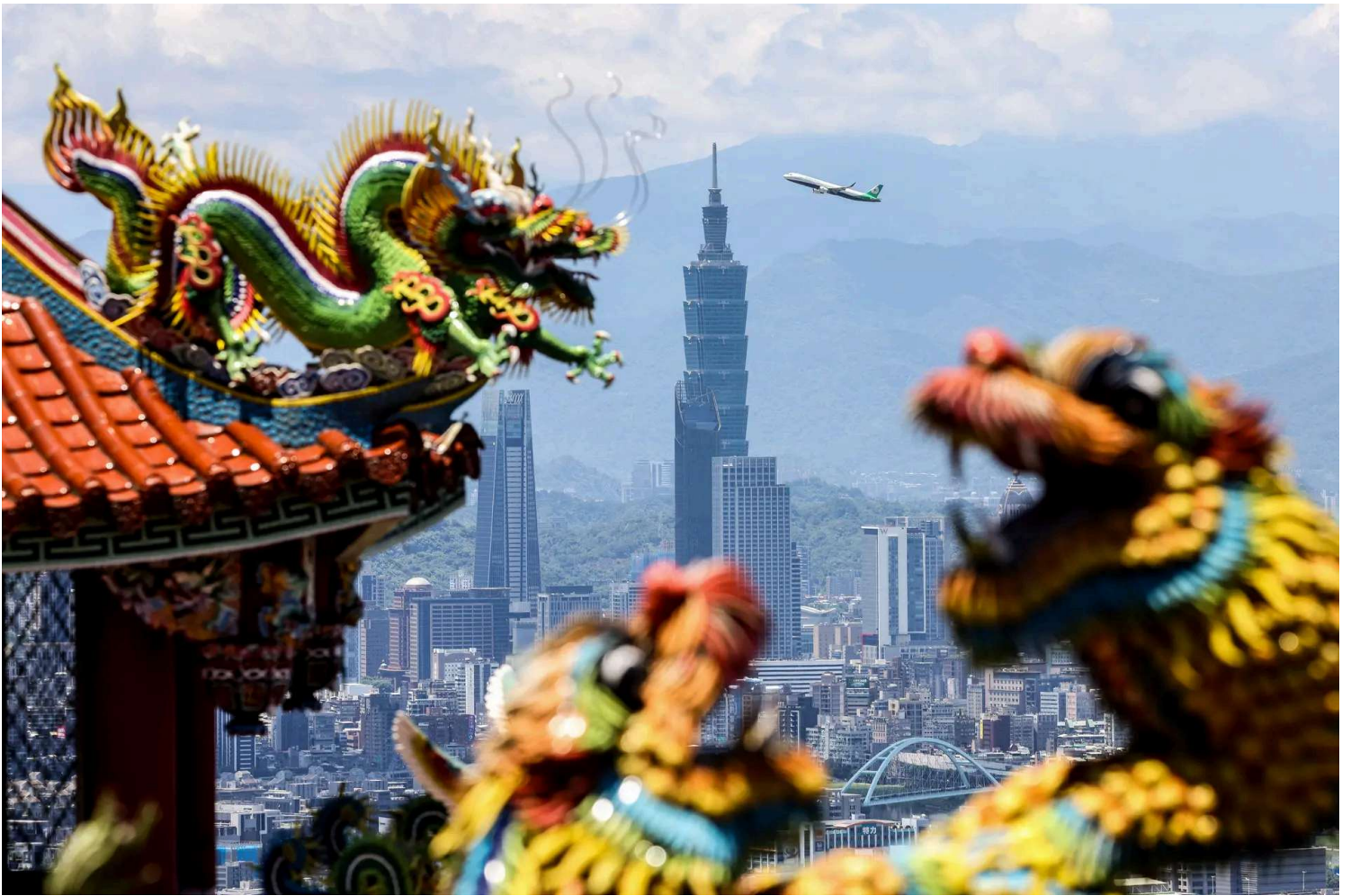
A view of the Taipei 101 building is seen from a local temple in Taipei, Taiwan, on June 10, 2025.