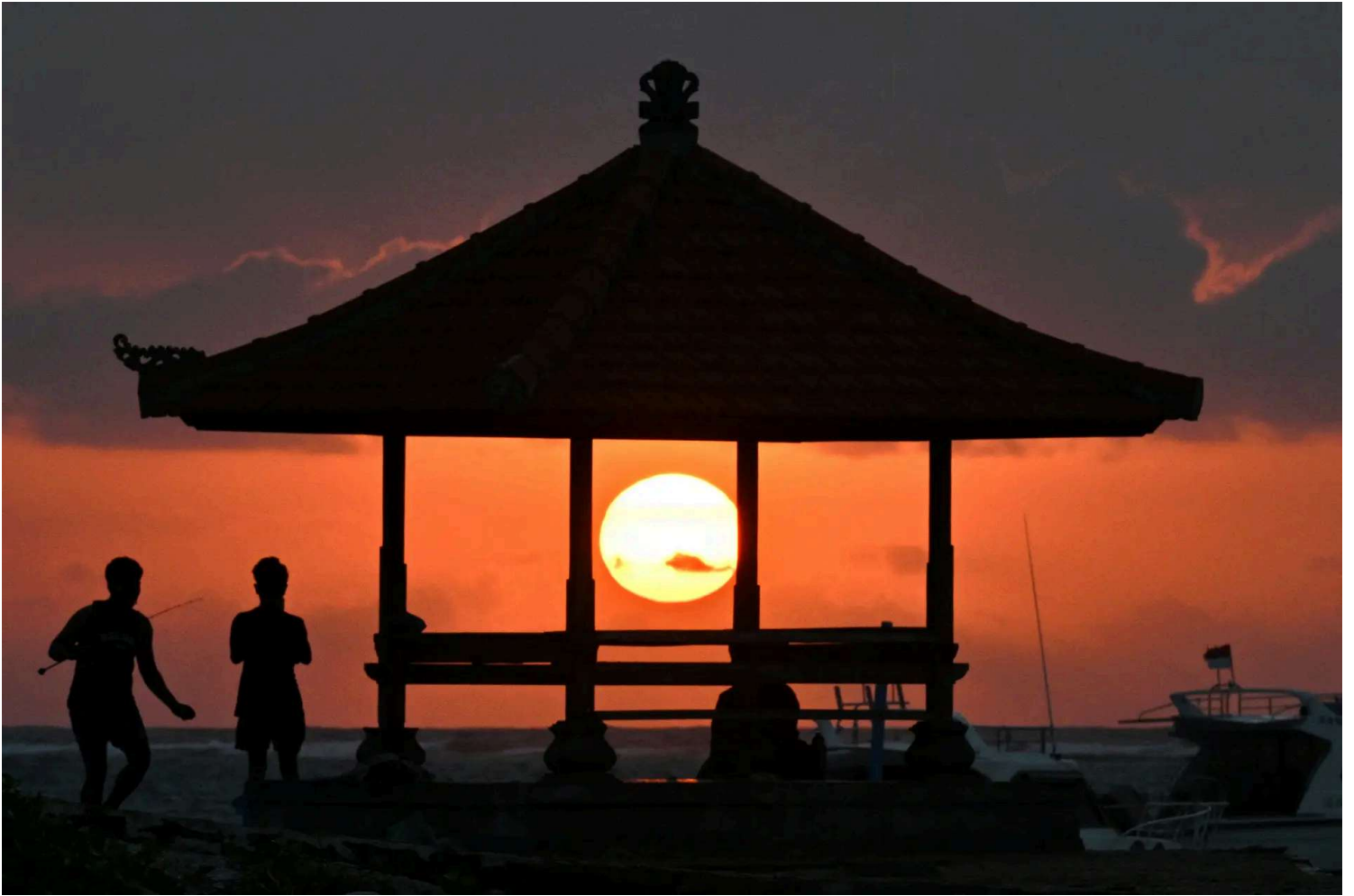
Anglers are seen beside a gazebo as they prepare to fish during sunrise at a beach in Sanur, Indonesia's Bali island, on June 10, 2025.