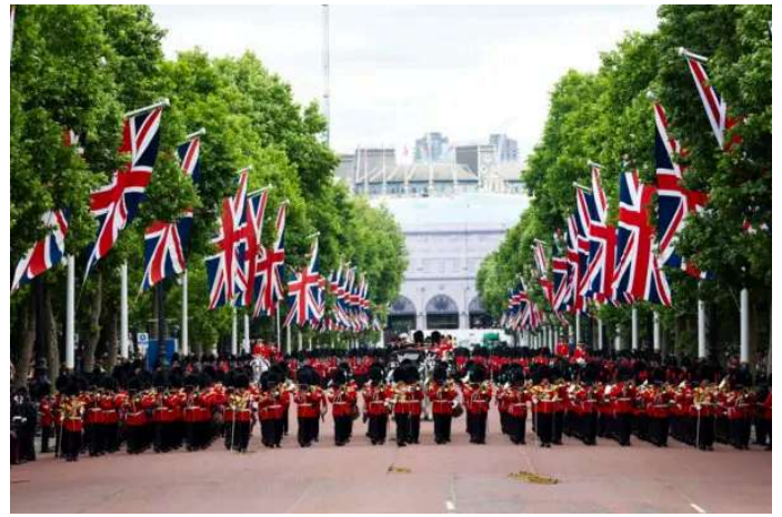
Day in Photos: The Colonel's Review, Landslide in India, and Rehabilitation of Prisoners in El Salvador