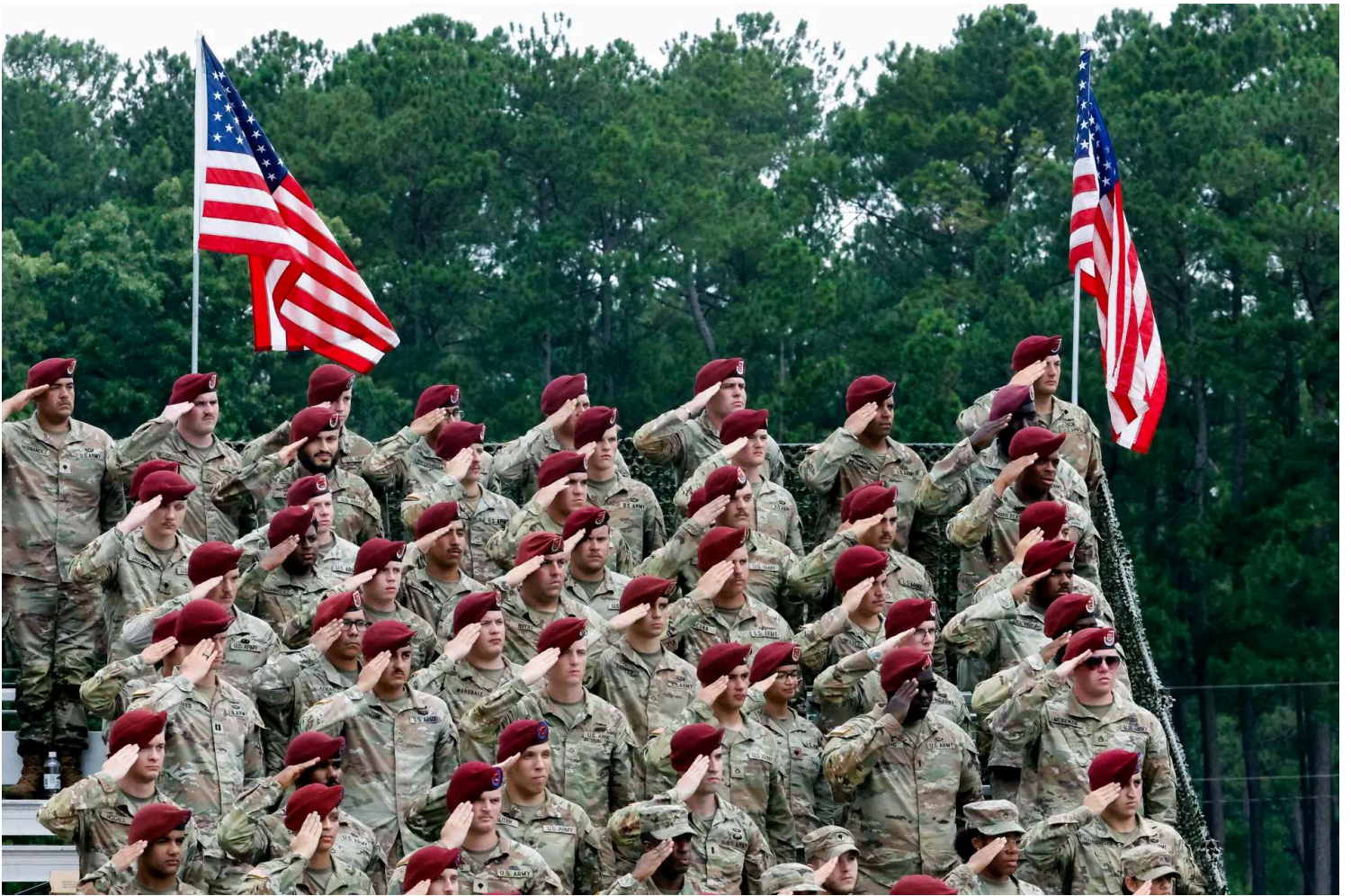
Soldiers of Fort Bragg stand in salute during the playing of the national anthem at The America 250 Celebration at Fort Bragg in Fayetteville, N.C., on June 10, 2025.