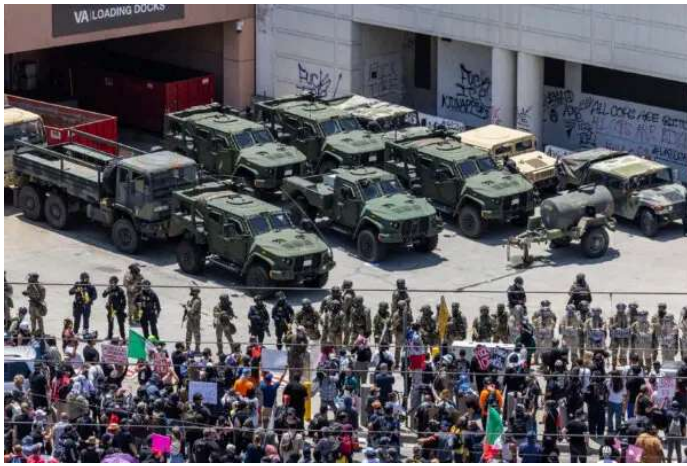
Day in Photos: Protests in Los Angeles, BET Awards, and World Oceans Day