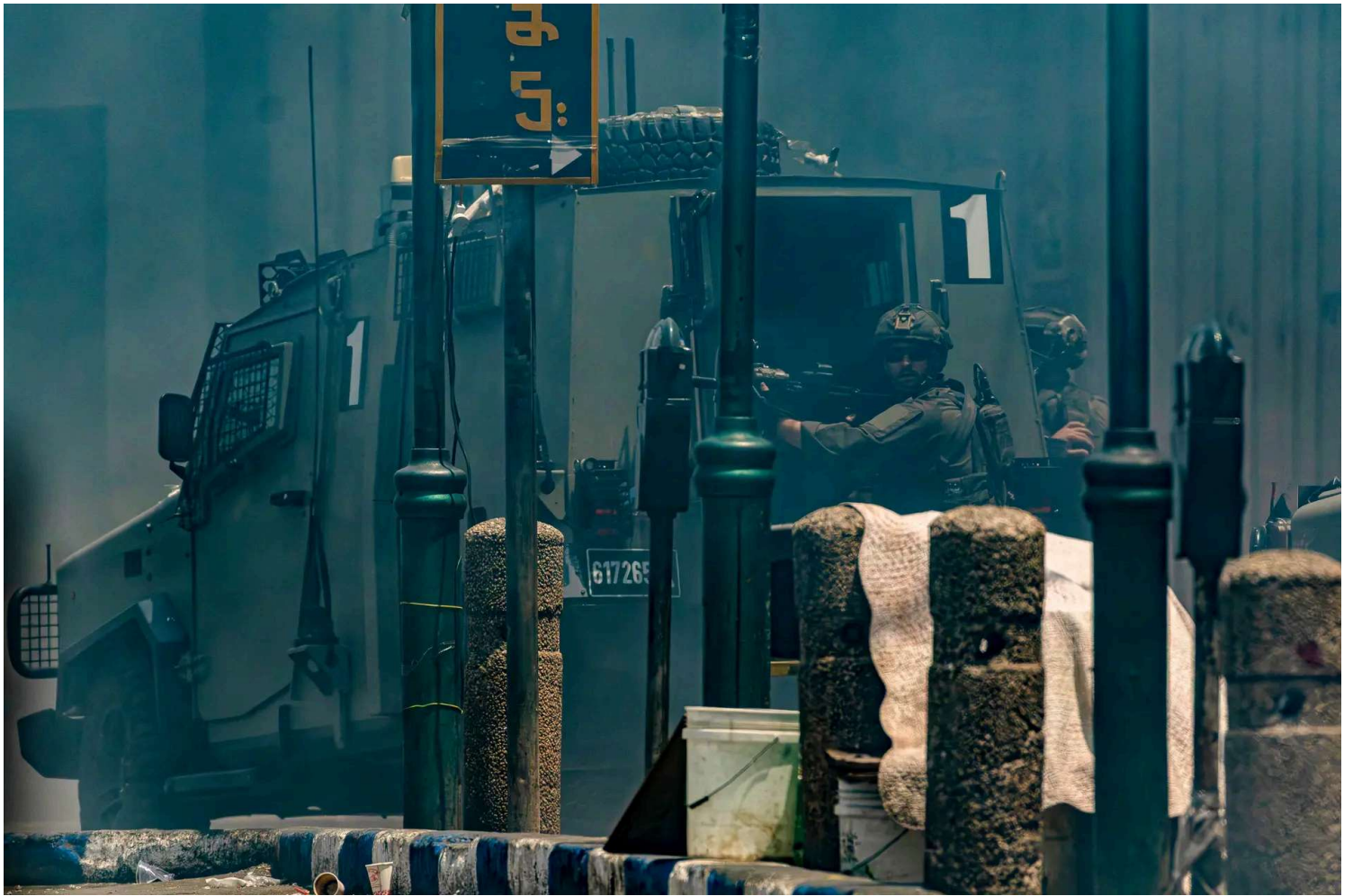
Israeli soldiers are at the scene during a raid that killed two Palestinian men in the old town of Nablus, West Bank, on June 10, 2025. According to reports, the two Palestinians tried to steal a soldier's weapon.