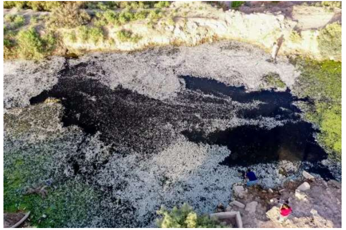
Day in Photos: Mass Fish Die-Off, Fire at Geriatric Ward, and Aurora Australis

Copyright © 2000 – 2025 The Epoch Times Association Inc. All Rights Reserved.