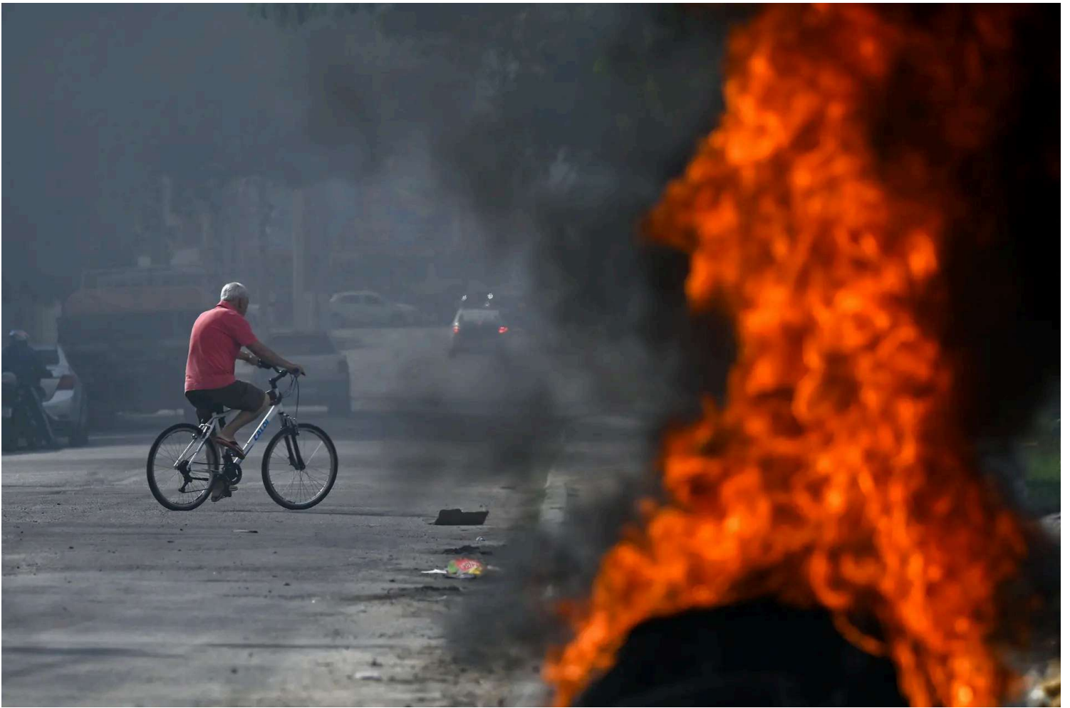
A man rides a bicycle past burning tires during an operation targeting drug trafficking at Cidade Alta favela, part of the Israel Complex, in Rio de Janeiro, Brazil, on June 10, 2025.