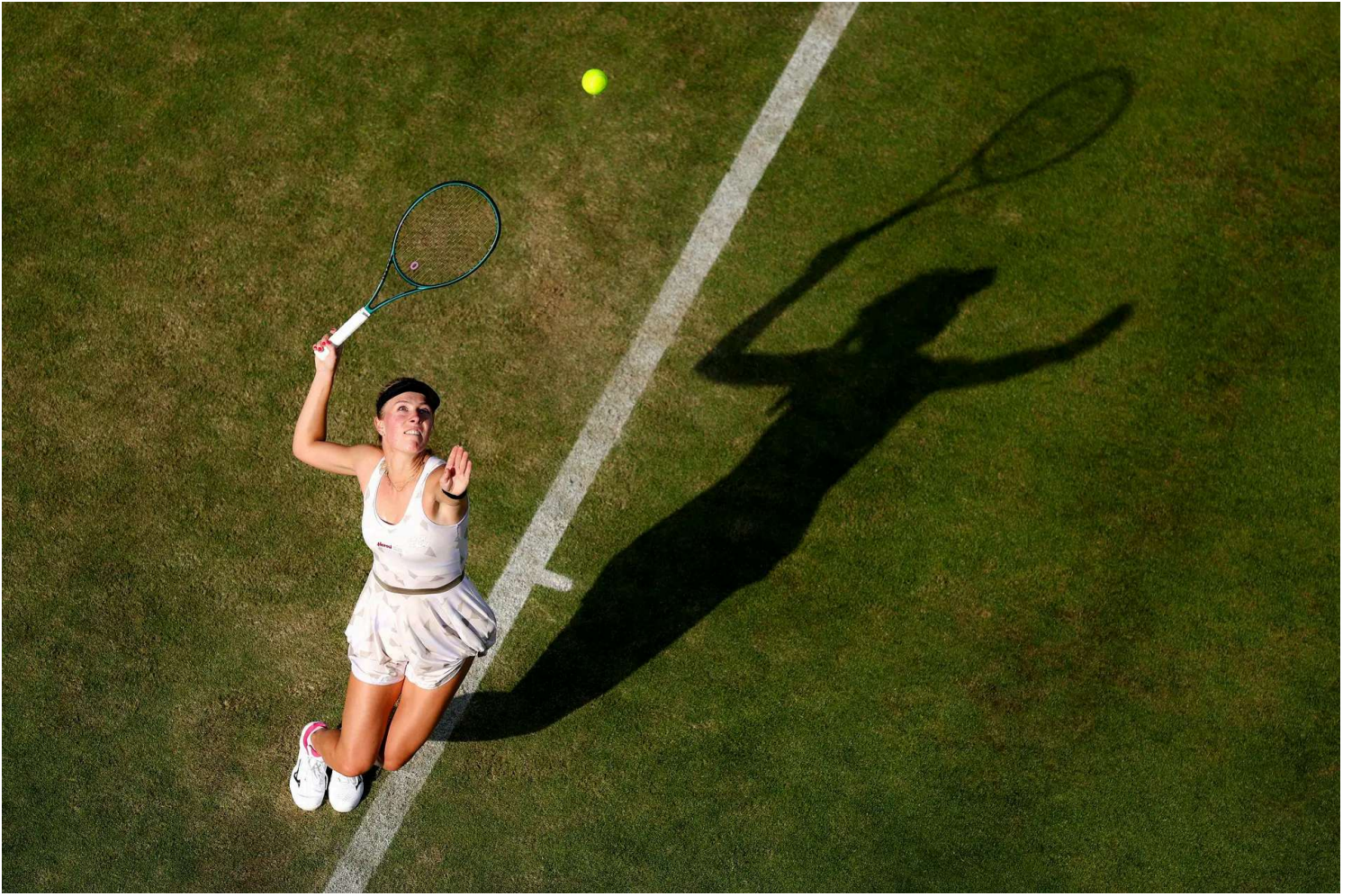
Magdalena Frech of Poland serves against Diana Shnaider during the Women's Singles First Round match on Day Two of the 2025 HSBC Championships at The Queen's Club in London, England, on June 10, 2025.