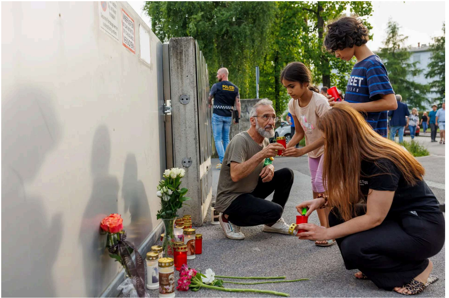
People light candles at a school where a shooting took place in Graz, Austria, on June 10, 2025. Austria's interior ministry has confirmed nine fatalities, including children between 14 and 18 years old, at a shooting at the Bundes-oberstufenrealgymnasium Dreierschützengasse school. The shooter is believed to be among the dead.