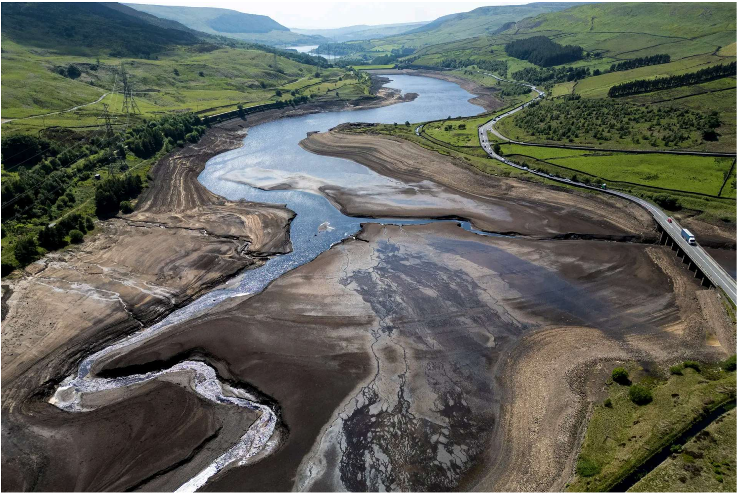
An aerial photograph taken on June 10, 2025, shows the partially revealed bed of Woodhead Reservoir following a falling water level, near Glossop, England.