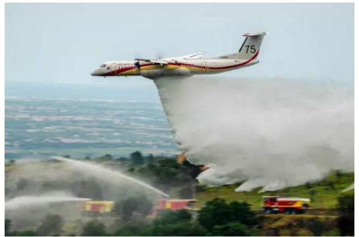
Day in Photos: Firefighting Demonstration, Casting Ballots in Burundi, and Gendarme Dog