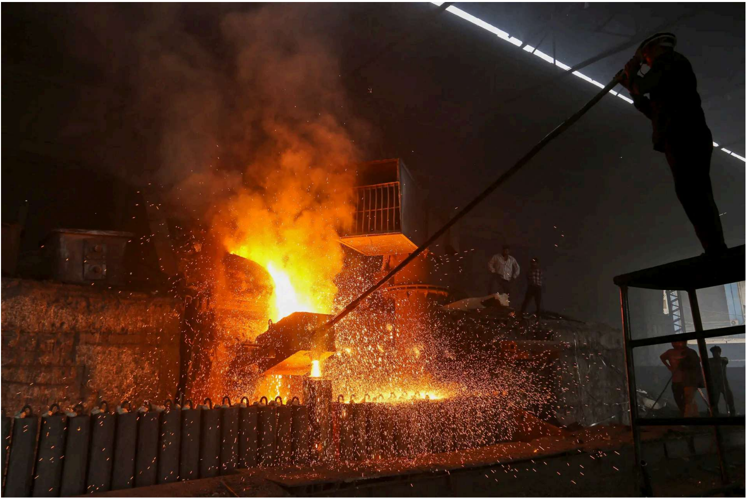
A laborer works inside a steel factory on a hot summer day on the outskirts of Jammu, India, on June 10, 2025.

Sign up for the Epoch Opinion newsletter. Our team of Canadian and international thought leaders take you beyond the headlines and trends that shape our world. Sign up with 1-click >>