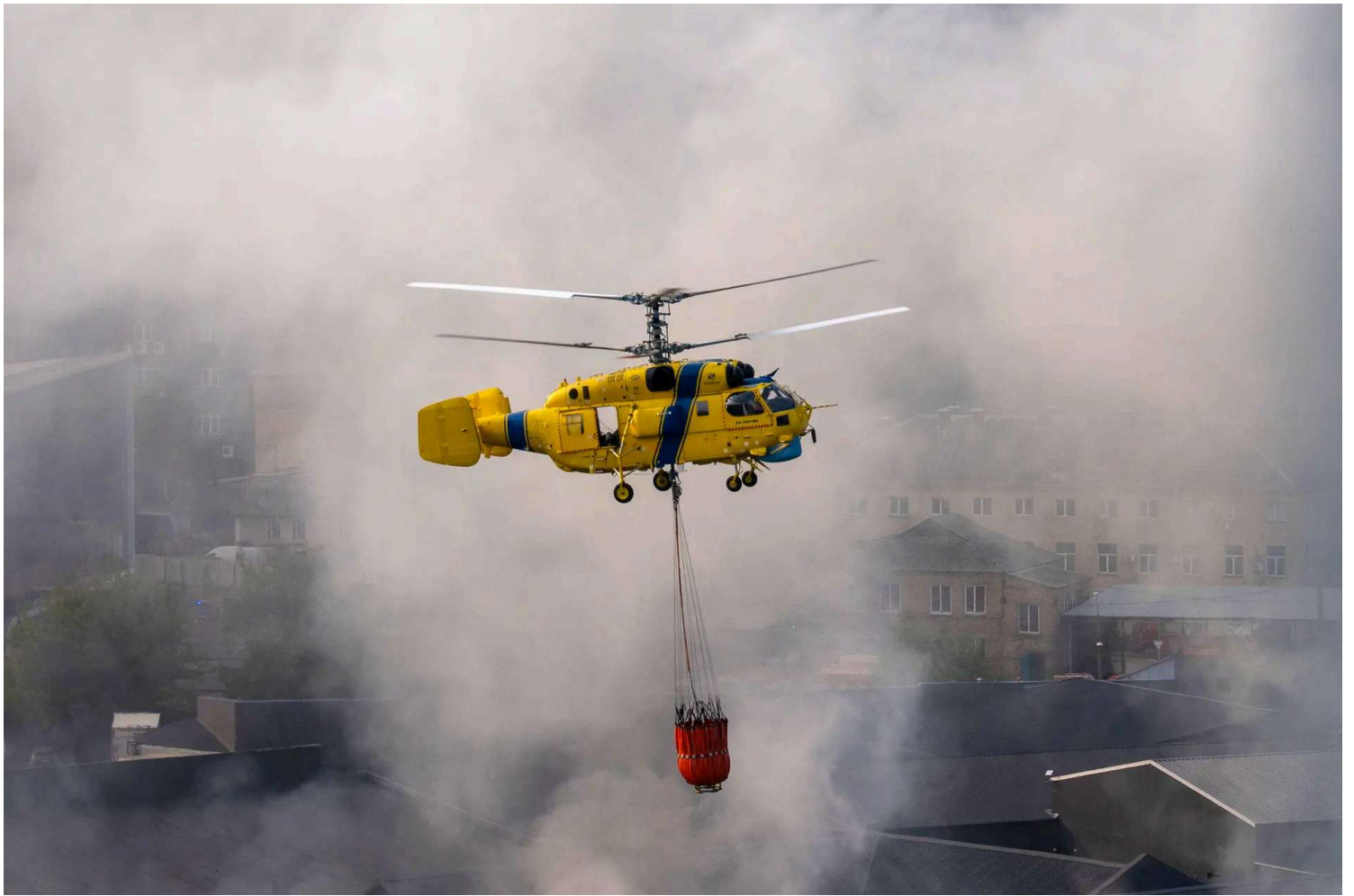
A firefighting helicopter flies as smoke rises above buildings following a drone strike in Kyiv, on June 10, 2025, amid the Russian invasion in Ukraine. Russia carried out “massive” drone attacks on Ukraine’s capital Kyiv and port city of Odesa early on June 10, killing one person and hitting a maternity hospital, Ukrainian officials said, calling for further sanctions.