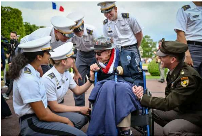
Day in Photos: D-Day Landing Anniversary, ICE Detention, and Train Strike