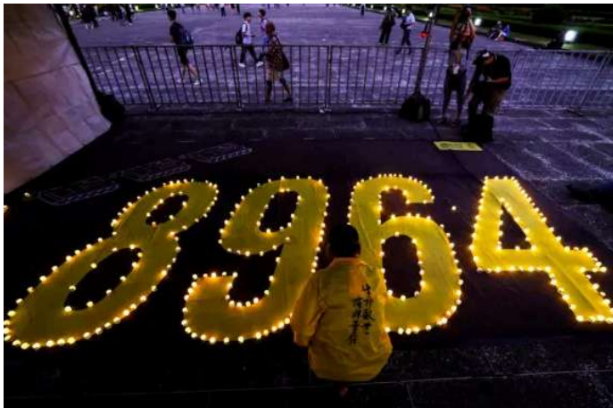
Day in Photos: Tiananmen Massacre Anniversary, Stampede in India, Bird Flu in Brazil