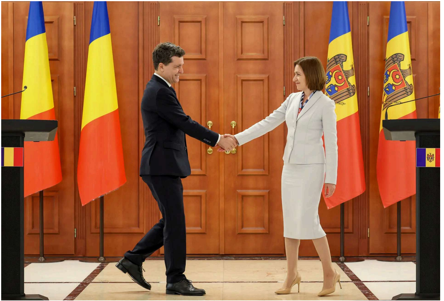
Moldova's President Maia Sandu and Romania's President Nicusor Dan shake hands during a joint press conference following a meeting at the presidency headquarters in Chisinau, Moldova, on June 10, 2025.