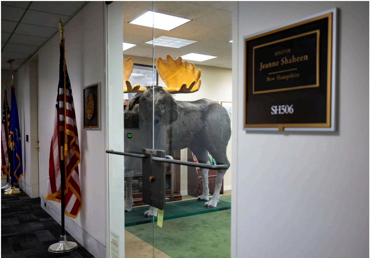
"Marty" the stuffed moose stands inside U.S. Sen. Jeanne Shaheen's (D-N.H.) office in Washington, DC, on June 10, 2025. "Marty the Moose" and "Kodak the Bear" were driven from their home at White Mountain Attractions in North Woodstock, N.H., to attend the "Experience New Hampshire" reception.