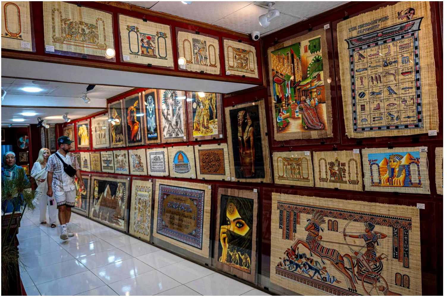
Tourists visit a papyrus shop near the Great Pyramids plateau in Giza, south of Cairo, Egypt, on June 10, 2025.