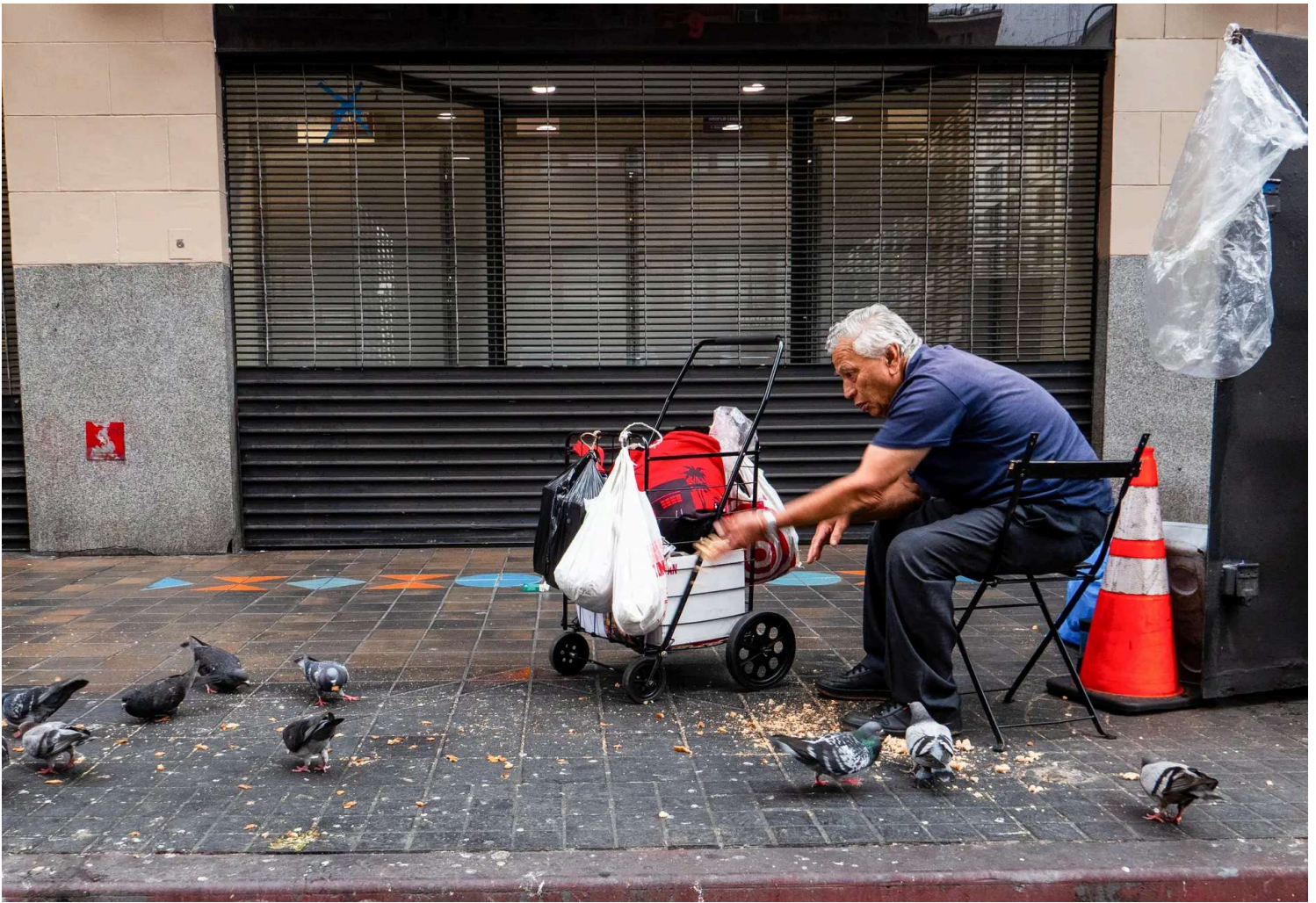
A man feeds pigeons in downtown Los Angeles following the lifting of an overnight curfew after numerous businesses were broken into on June 9, as protests continue in Los Angeles on June 11, 2025.