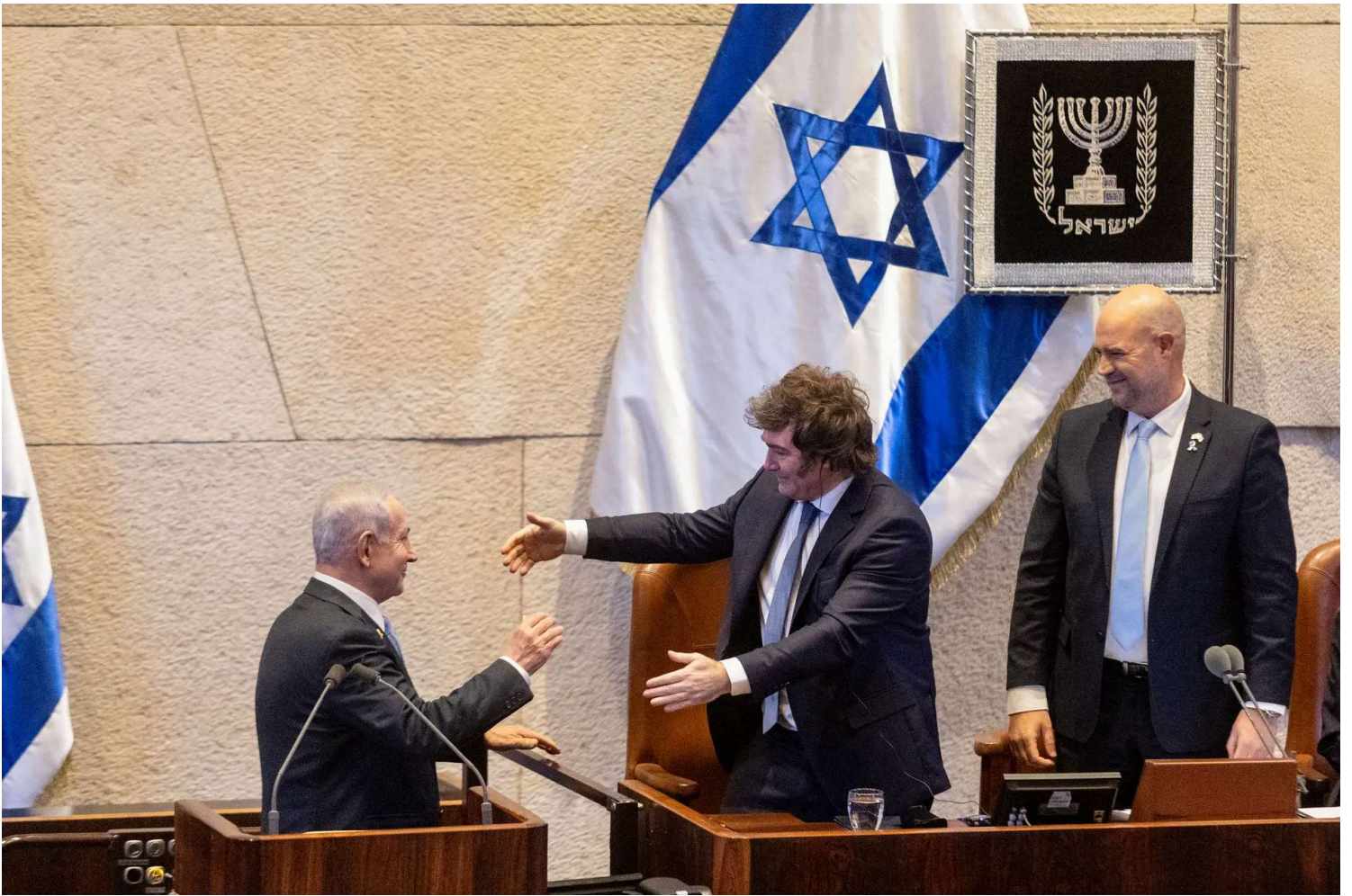
Israeli Prime Minister Benjamin Netanyahu greets Argentinian President Javier Milei as the latter attends a special address to the Israeli Knesset in Jerusalem on June 11, 2025.