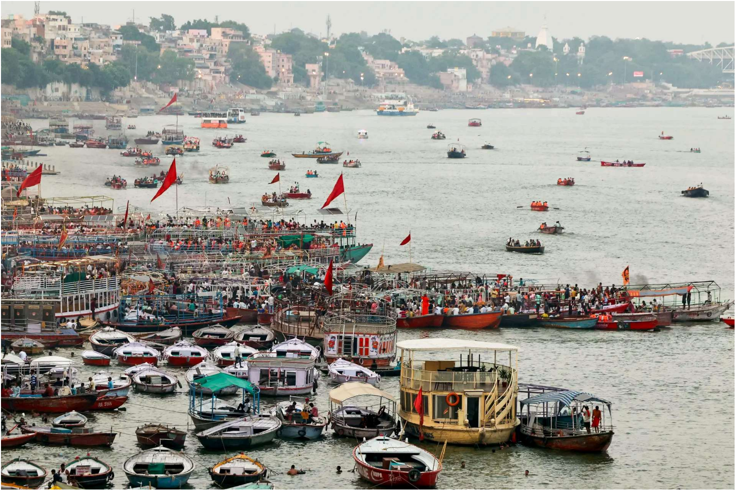
Visitors gather for boat rides along the banks of river Ganges in Varanasi, India, on June 11, 2025.