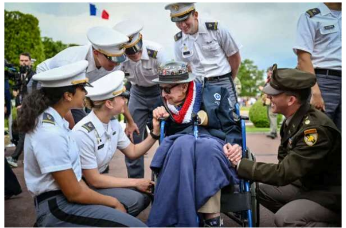
Day in Photos: D-Day Landing Anniversary, ICE Detention, and Train Strike