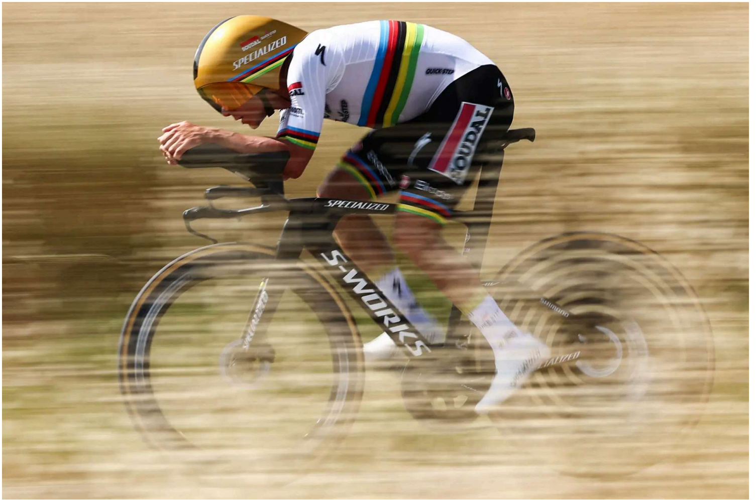
Soudal Quick-Step's Belgian rider Remco Evenepoel cycles during the fourth stage of the 77th edition of the Criterium du Dauphine cycling race, a 10.8-mile individual time trial between Charmes-sur-Rhône and Saint-Péray, France, on June 11, 2025.