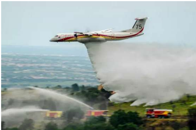
Day in Photos: Firefighting Demonstration, Casting Ballots in Burundi, and Gendarme Dog