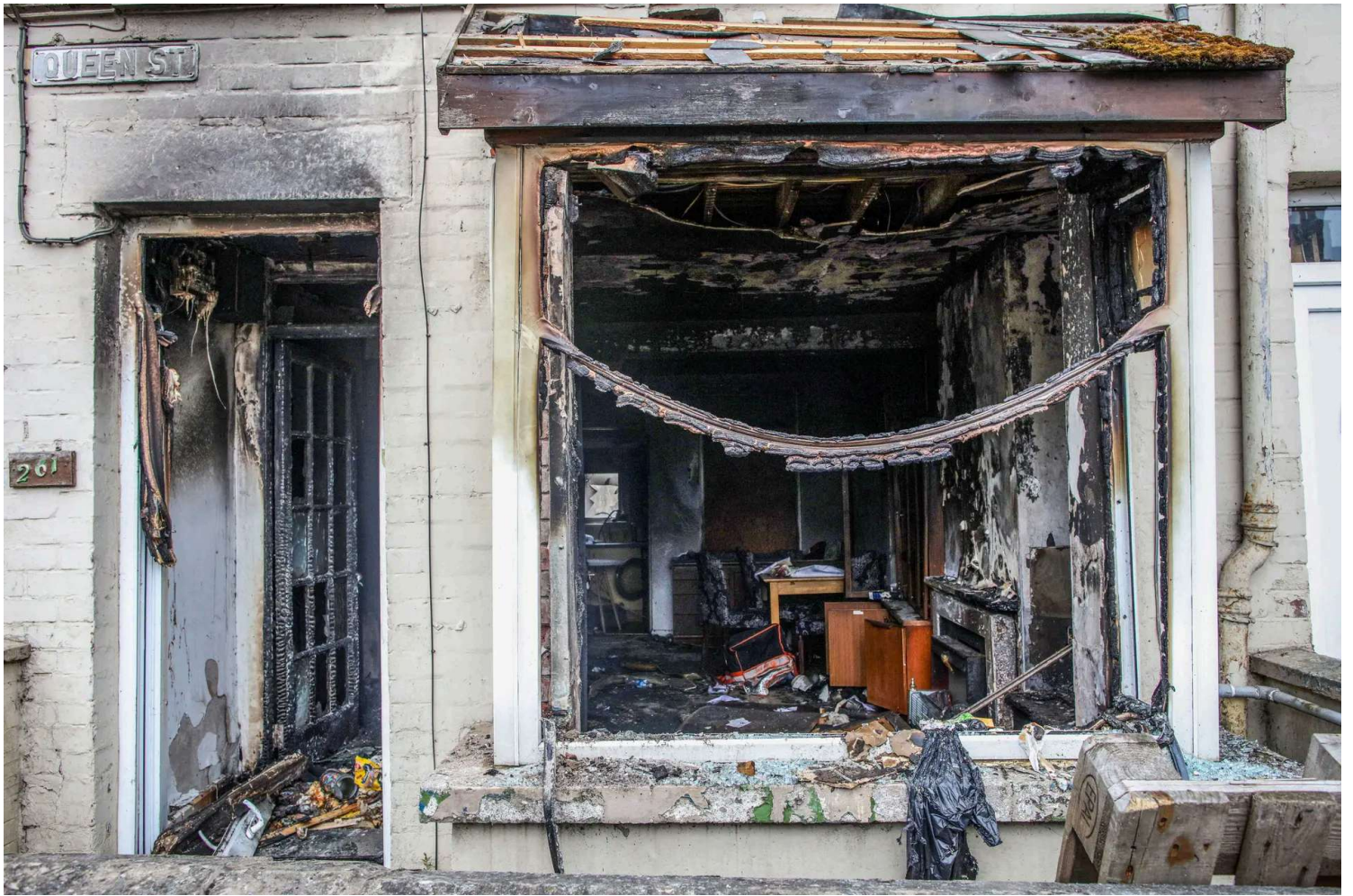
A house with a window broken after a second night of an anti-illegal immigration demonstration in Ballymena, Northern Ireland, on June 11, 2025.