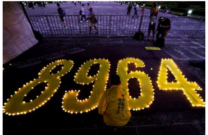
Day in Photos: Tiananmen Massacre Anniversary, Stampede in India, Bird Flu in Brazil