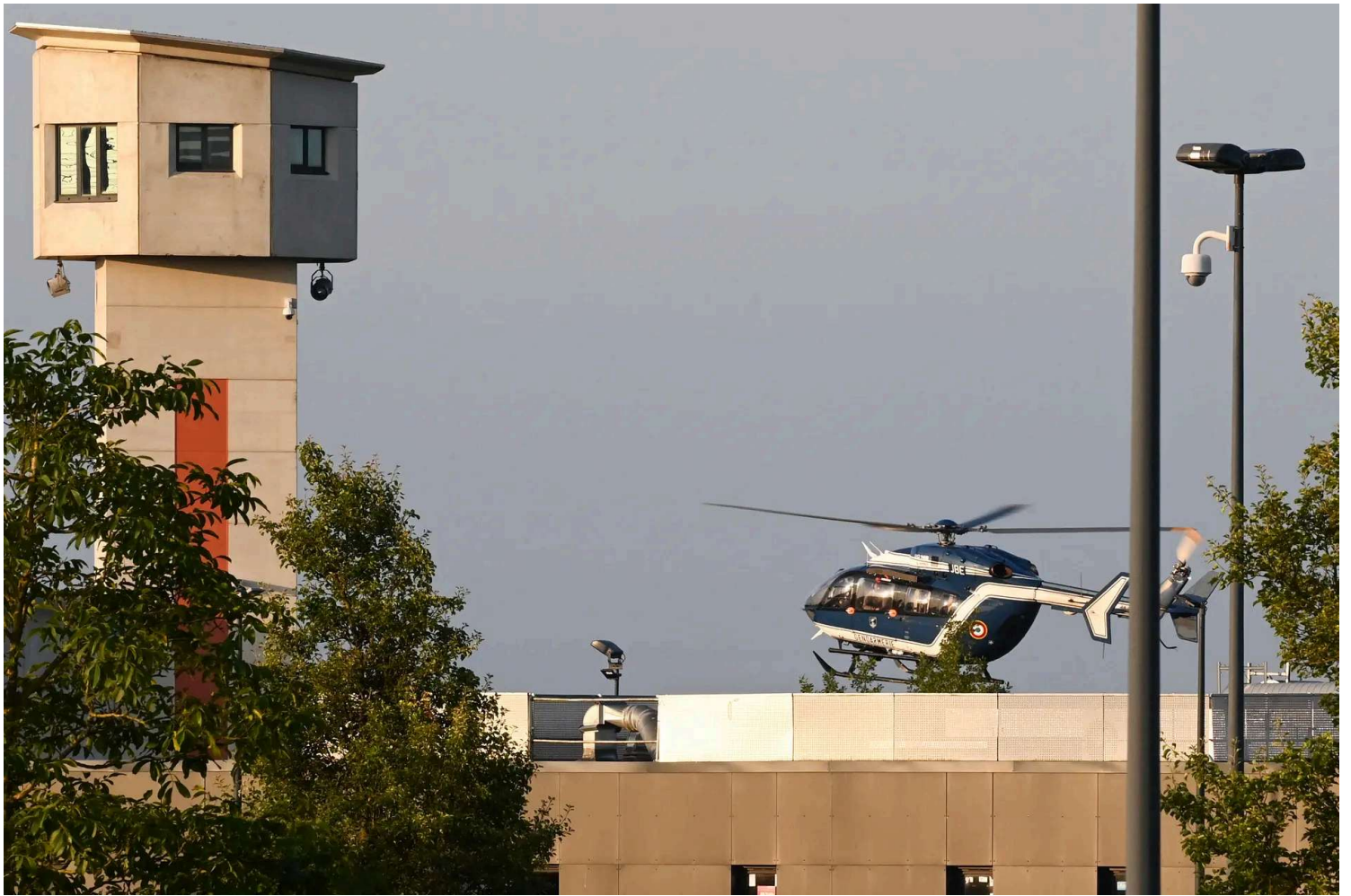
A Gendarmerie helicopter prepares to land at the prison in Conde-sur-Sarthe, ahead of the transfer of convicted drug trafficker Mohamed Amra from the facility in northern France for a court appearance at Palais de Justice in Paris on June 11, 2025.