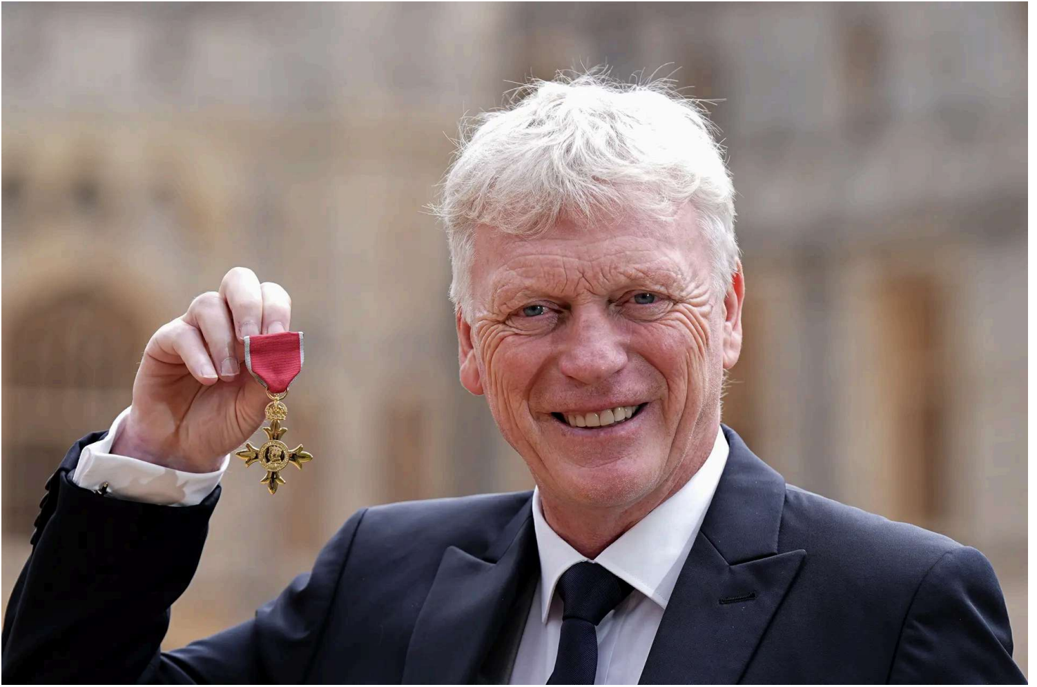
David Moyes after being made an Officer of the Order of the British Empire during an Investiture ceremony at Windsor Castle in Windsor, England, on June 11, 2025.