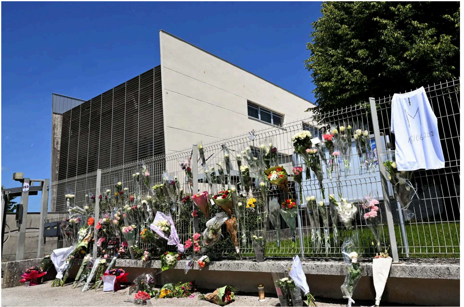
Flowers on the fence of Francoise Dolto middle school in Nogent, France, on June 11, 2025, a day after a secondary school pupil was arrested after killing a 31-year-old school assistant with a knife during a bag search.