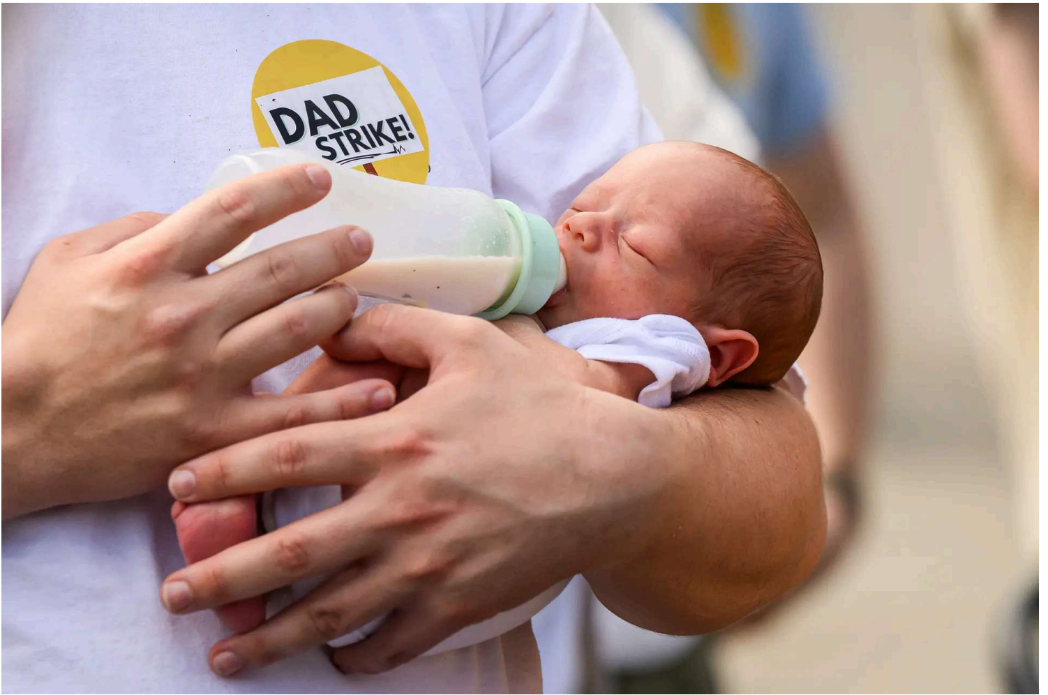
A man feeds his baby during a protest calling for longer paternity leave for fathers in London on June 11, 2025. Campaigners have expressed concerns about the UK's statutory two-week paternity leave, which is paid at less than 50 percent of the national living wage.