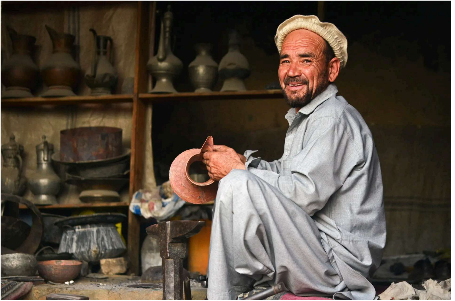
An coppersmith reacts to the camera while working in his shop in Fayzabad district of Badakhshan Province, Afghanistan, on June 11, 2025.