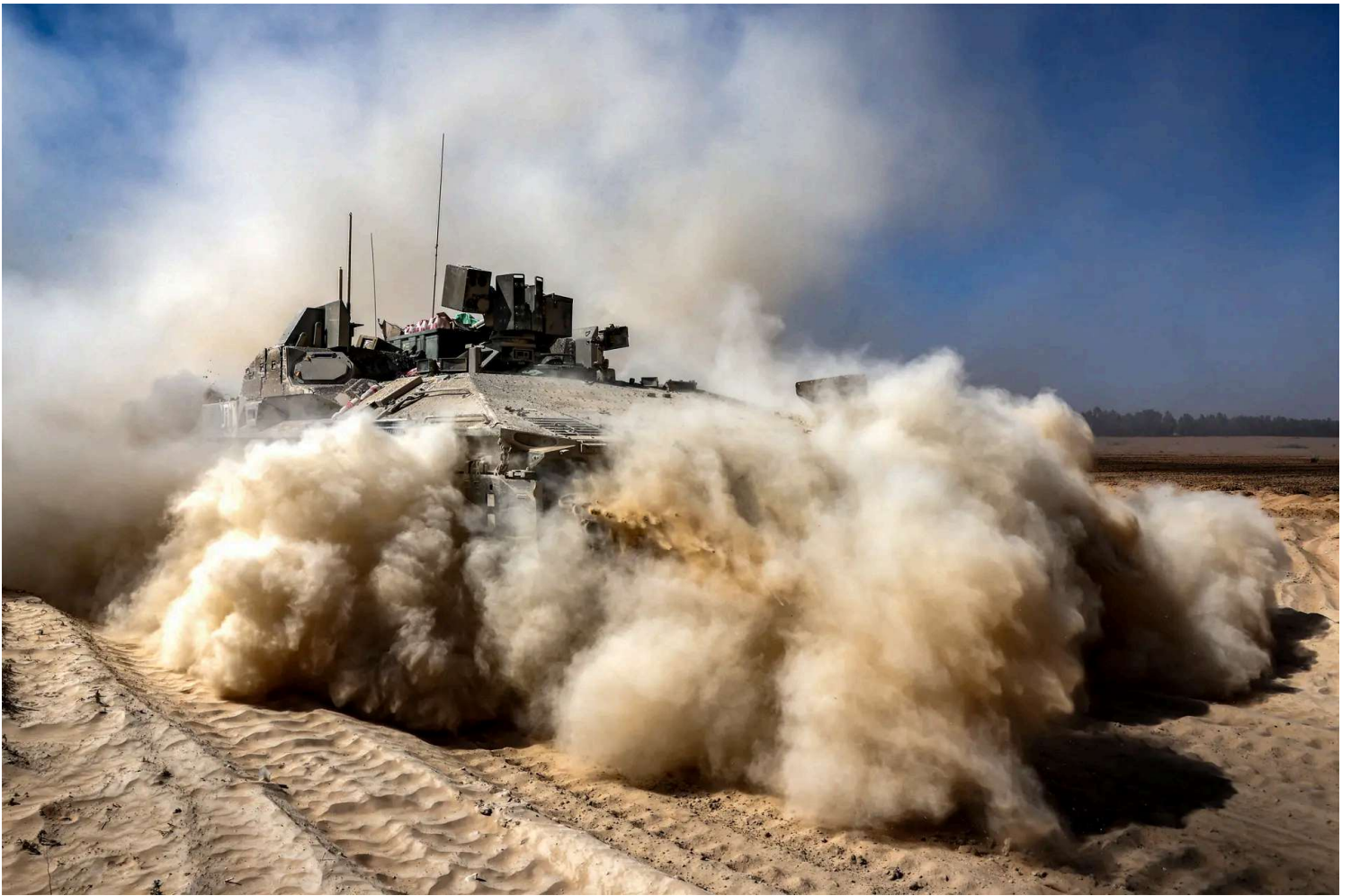
An Israeli army armored personnel carrier (APC) moves at a position in southern Israel along the border with the Gaza Strip on June 11, 2025.