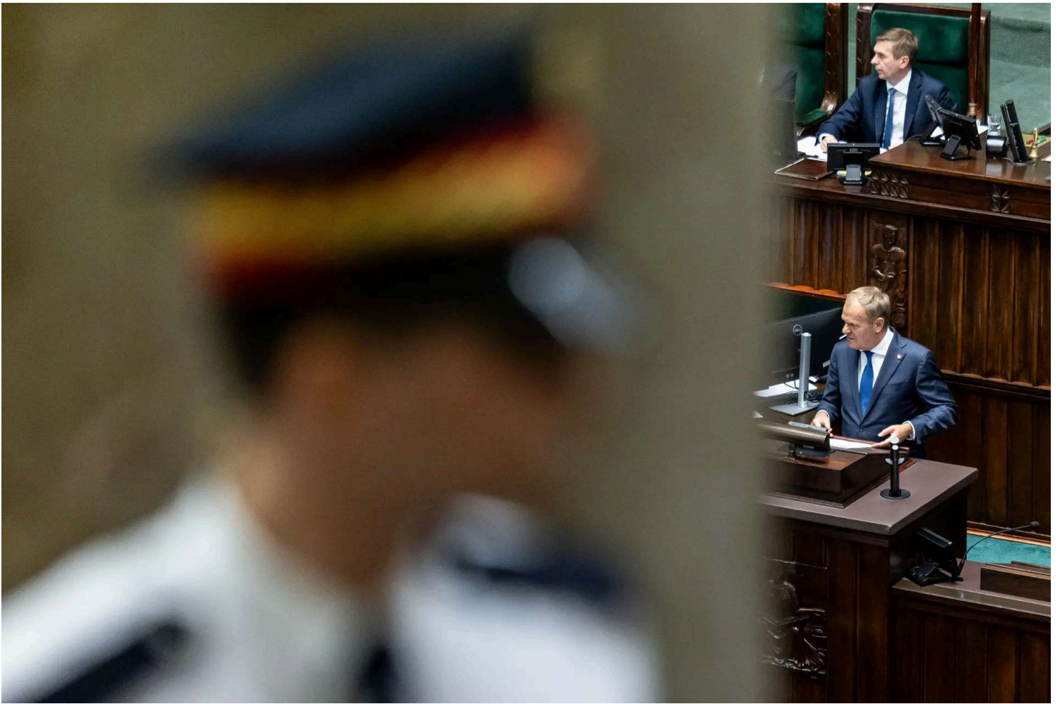
Poland's Prime Minister Donald Tusk answers MPs' questions, prior to a vote of confidence for his cabinet, at the Parliament in Warsaw on June 11, 2025. Poland's pro-EU government won the confidence vote as it attempted to demonstrate it still had majority support, despite suffering a major blow in this month's presidential election.