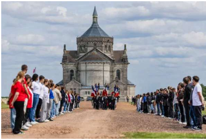
Day in Photos: Burial of Soldiers of the First World War, Prison Escape in Pakistan, and Princess Diana's Clothing Auction