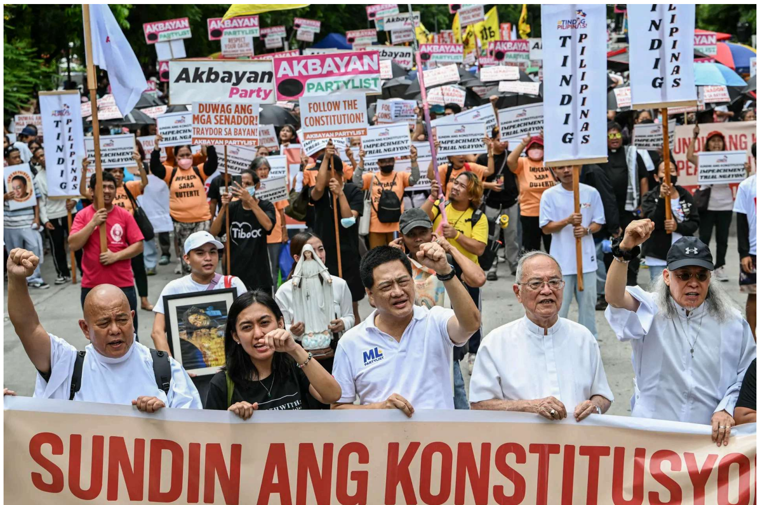
People hold placards and shout slogans as they protest following the Senate's decision on the impeachment trial of Philippine Vice President Sara Duterte, outside the Senate of the Philippines in Pasay on June 11, 2025.