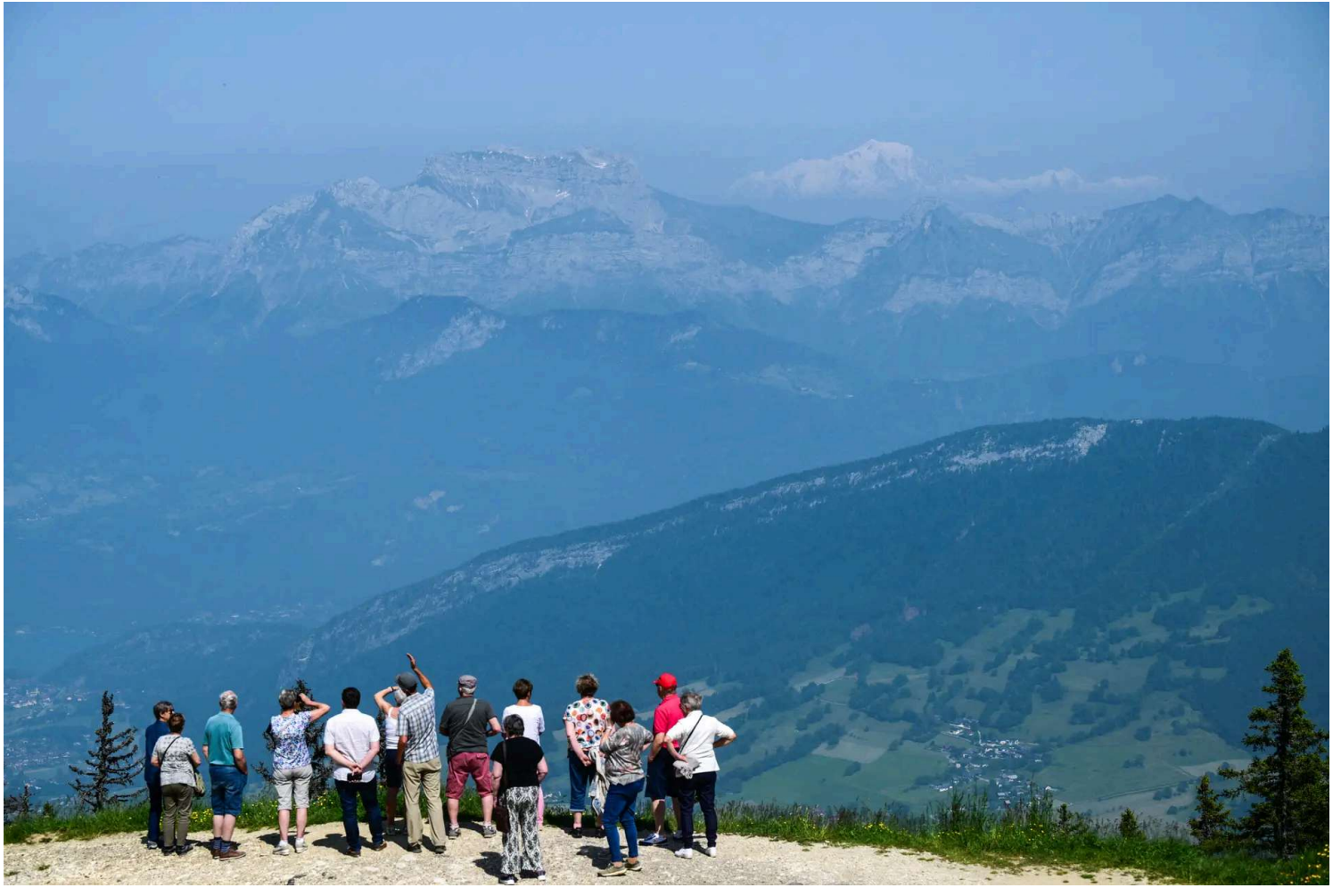
Tourists look out towards the Parmelan mountain from Semnoz Mountain, on a day that heavy smoke from intense wildfires in Canada reached France, in the French Bauges Mountain range, on June 11, 2025.