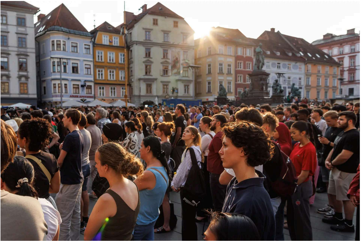
People gather at an event to honor shooting victims in the main square on June 11, 2025 in Graz, Austria. Authorities have confirmed that 11 people died and more are being treated for injuries, following a shooting at a secondary school on June 10. The 21-year-old suspected shooter is believed to have taken his own life, according to police.