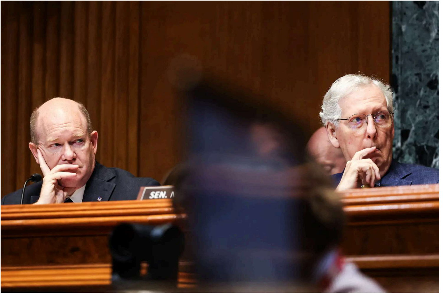
Sen. Chris Coons (D-Del.), and Sen. Mitch McConnell (R-Ky.) listen as Secretary of Defense Pete Hegseth testifies at a Senate Appropriations Committee Defense Subcommittee hearing in Washington on June 11, 2025.