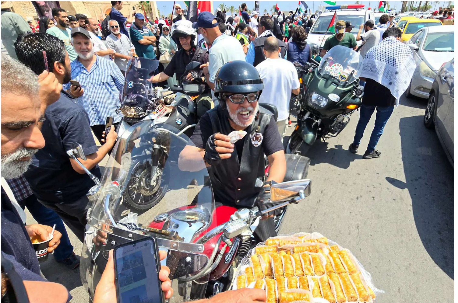
Activists from a convoy traveling from North Africa to the Gaza Strip, are greeted by Libyans in Tripoli's Martyrs Square on June 11, 2025.