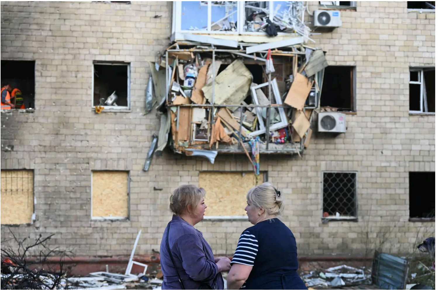
Women stand near a damaged residential building following a Russian drone strike in Kharkiv, Ukraine, on June 11, 2025.