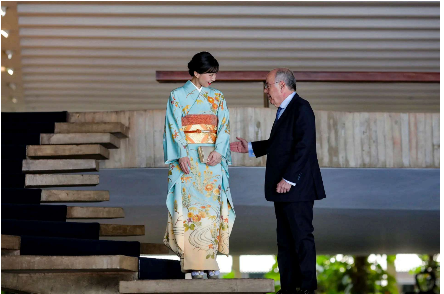
Brazil's Foreign Minister Mauro Vieira welcomes Japan's Princess Kako of Akishino before a meeting at the Itamaraty Palace in the framework of the 130th anniversary of diplomatic relations between Brazil and Japan in Brasilia, Brazil, on June 11, 2025.