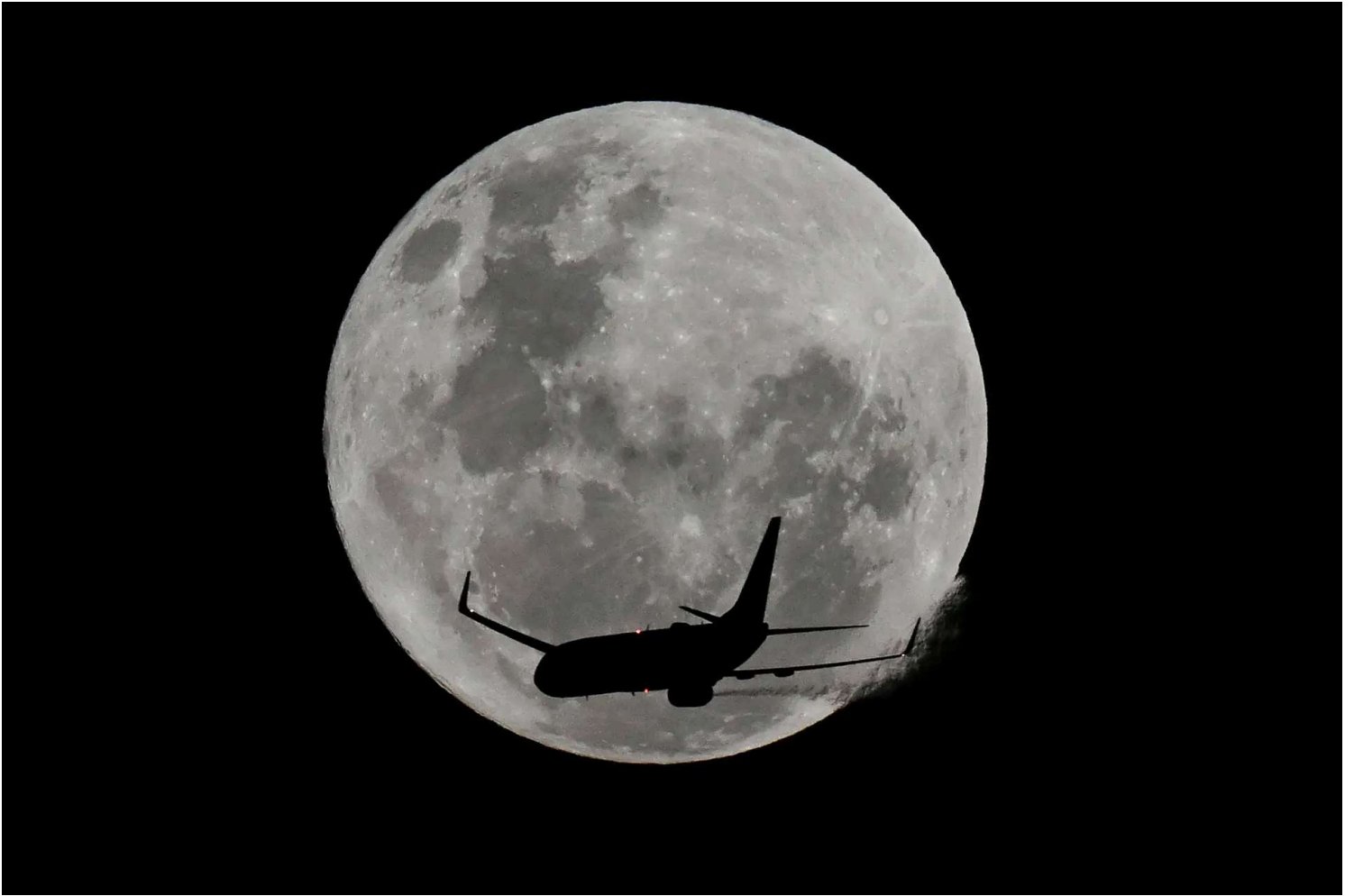
An aircraft passes in front of the full moon, known as the Strawberry Moon over Coogee Beach in Sydney, Australia, on June 11, 2025.