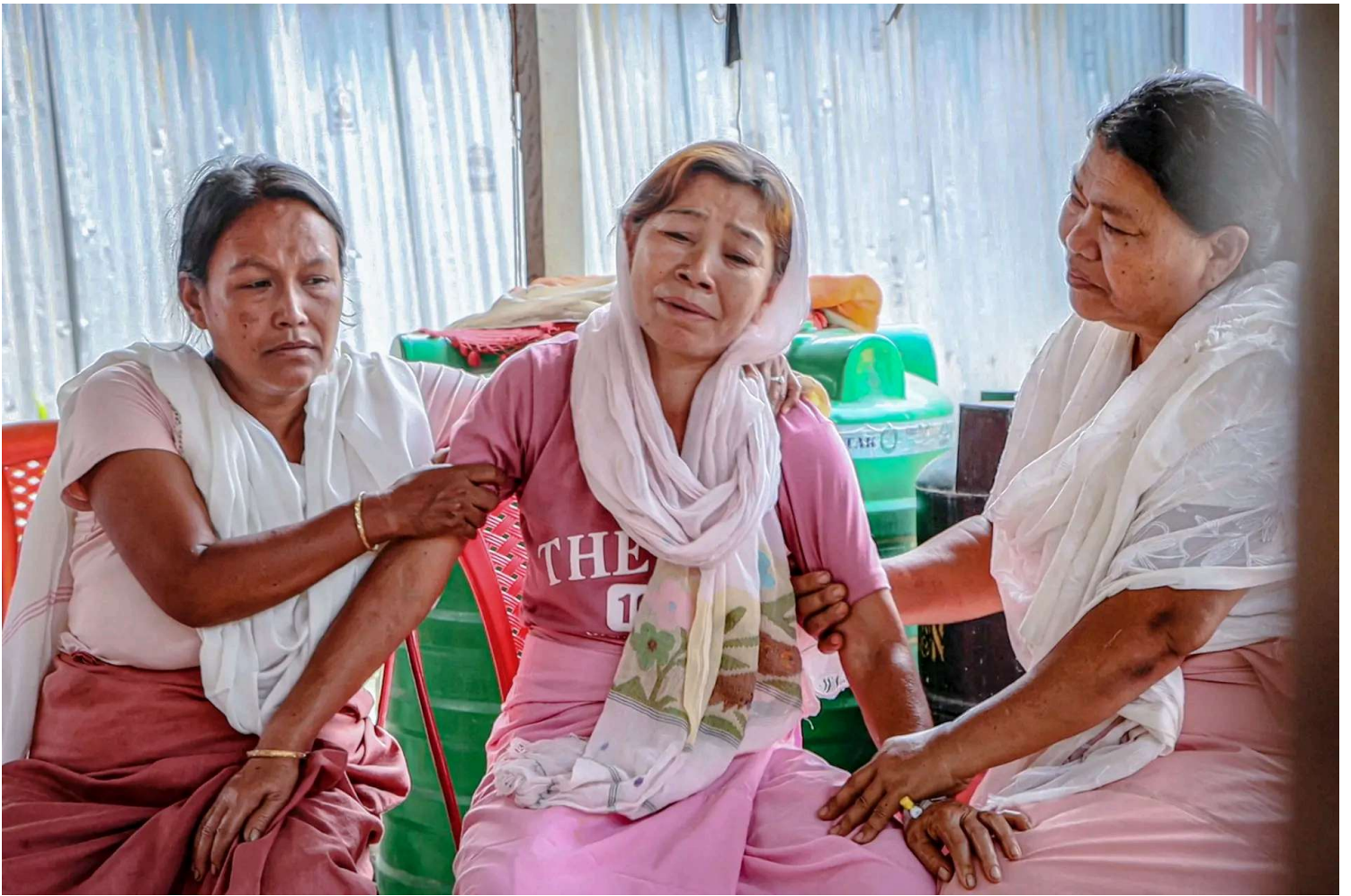
Family members of one of the crew members of Air India flight 171 mourn at their house in Thoubal Mayai Leikai near Imphal, India, on June 13, 2025, a day after the plane crashed in a residential area near the airport in Ahmedabad.