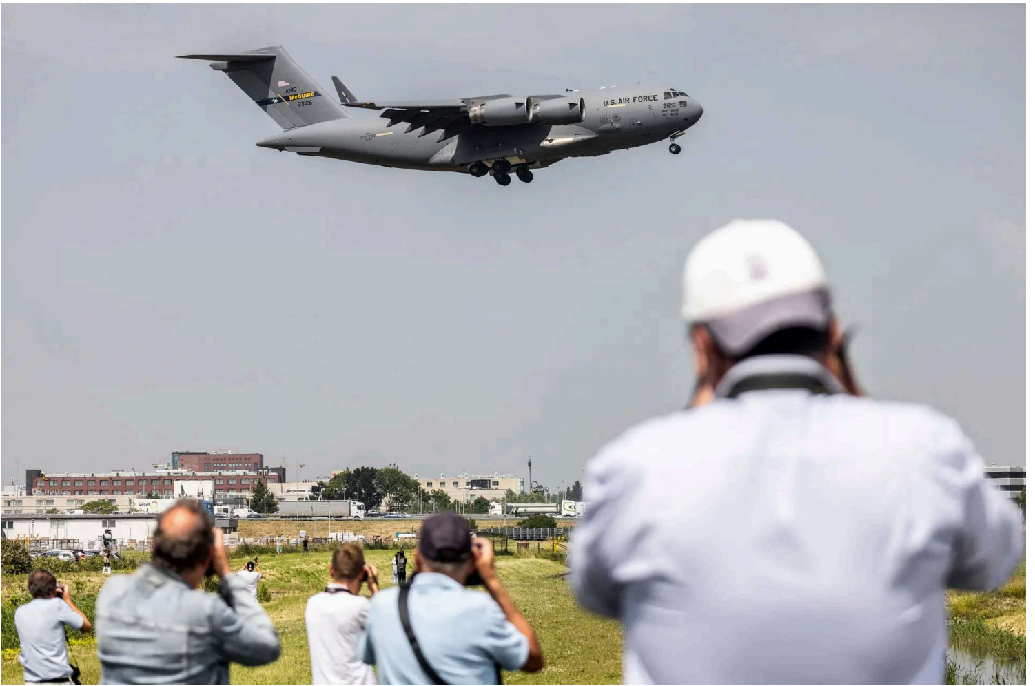
People take pictures of a Boeing C-17 Globemaster III transport plane, landing at Schiphol Airport near Amsterdam on June 13, 2025.