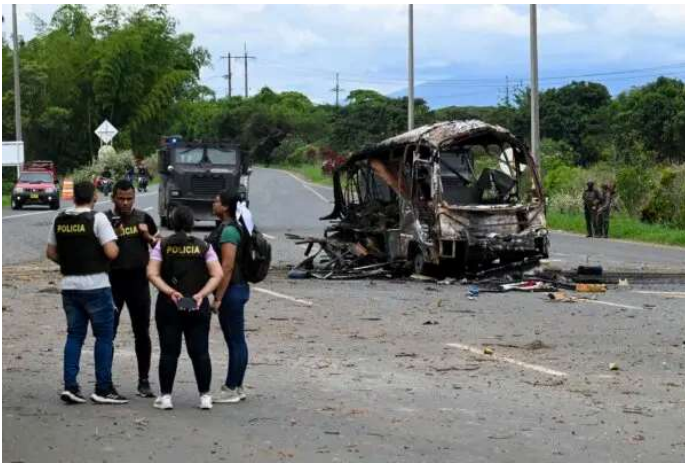
Day in Photos: Series of Attacks in Colombia, Police Operation in Brazil, School Shooting in Austria