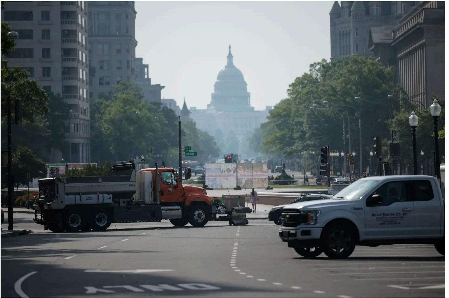
Security fencing ahead of the Army's 250th birthday parade and celebration around the National Mall in Washington on June 13, 2025.