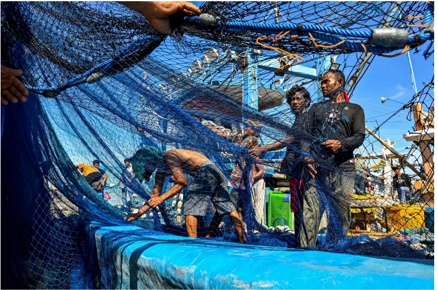
Fishermen load nets onto a boat at a port in Banda Aceh, Indonesia, on June 13, 2025.