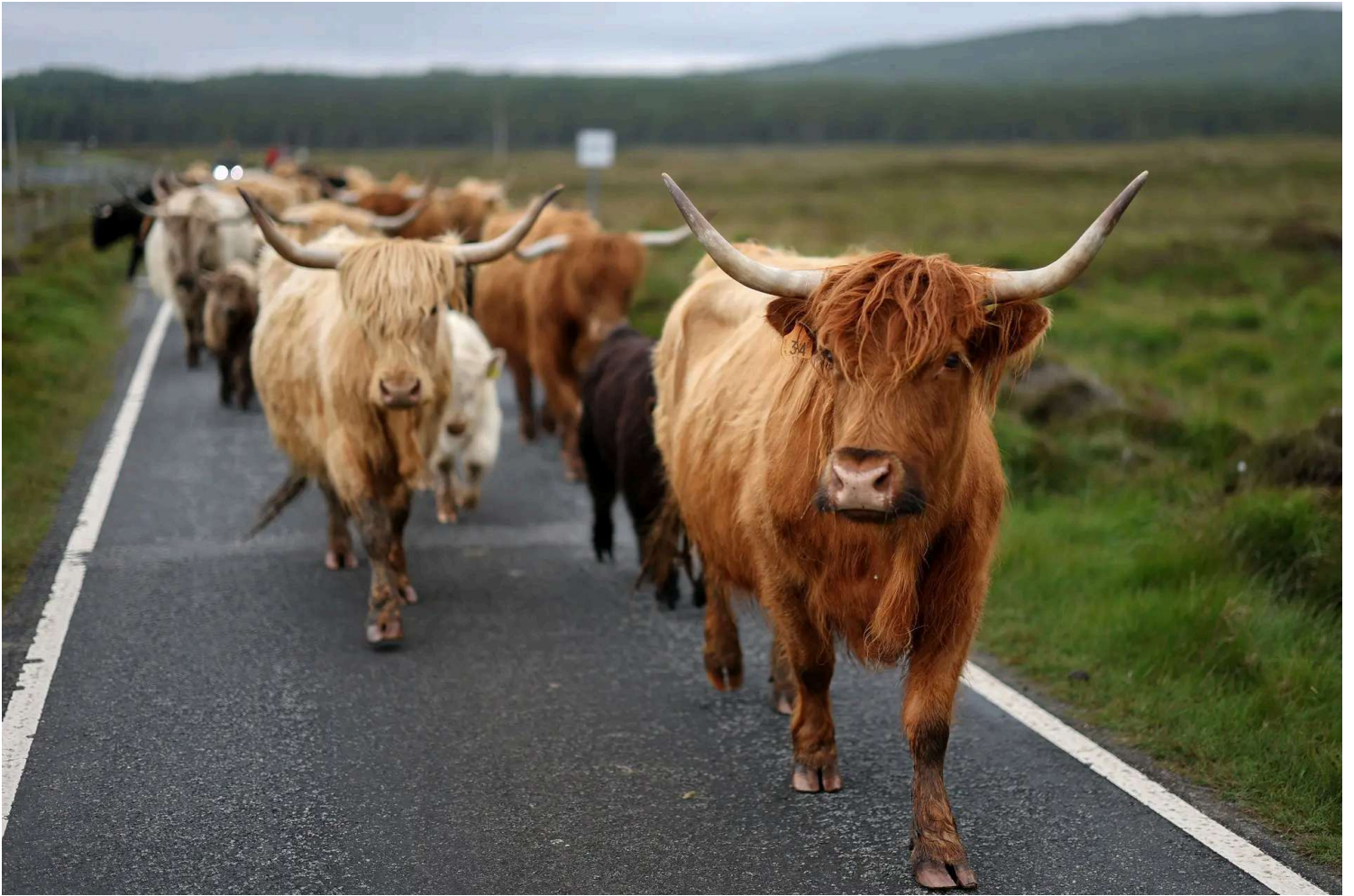
Highland cows are herded along a road after crossing from Vallay at low tide in Sollas, Scotland, on June 13, 2025. Every June, the Ardbhan herd of Highland cattle makes the two-mile journey across the sea at low tide from the Hebridean island of Vallay, to North Uist on the mainland, where they give birth before returning to graze the island's nutritious machair grassland over the winter.