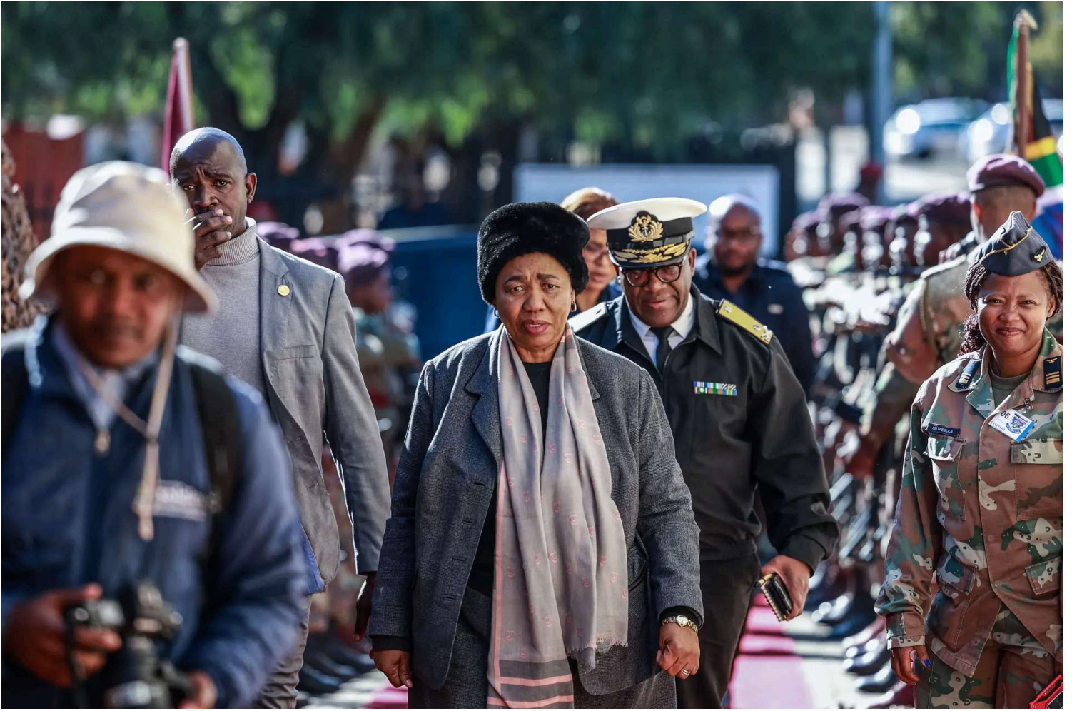
South African Minister of Defense Angie Motshekga (C) arrives for a press conference at Tembe Military Base prior to the expected arrival of South African National Defense Force soldiers following their deployment to the eastern Democratic Republic of Congo (DRC) in Bloemfontein, South Africa, on June 13, 2025. South African troops deployed in the conflict-plagued eastern DRC as part of a regional mission began withdrawing on June 12, 2025, and the first are due home on June 13, 2025, authorities said.