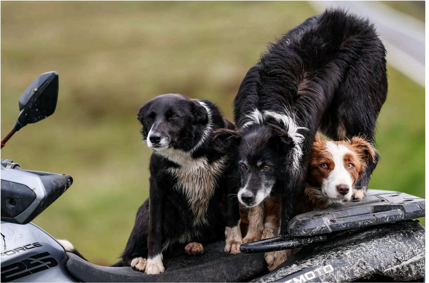
Dogs watch as highland cows are herded from Vallay at low tide in Sollas, Scotland, on June 13, 2025.