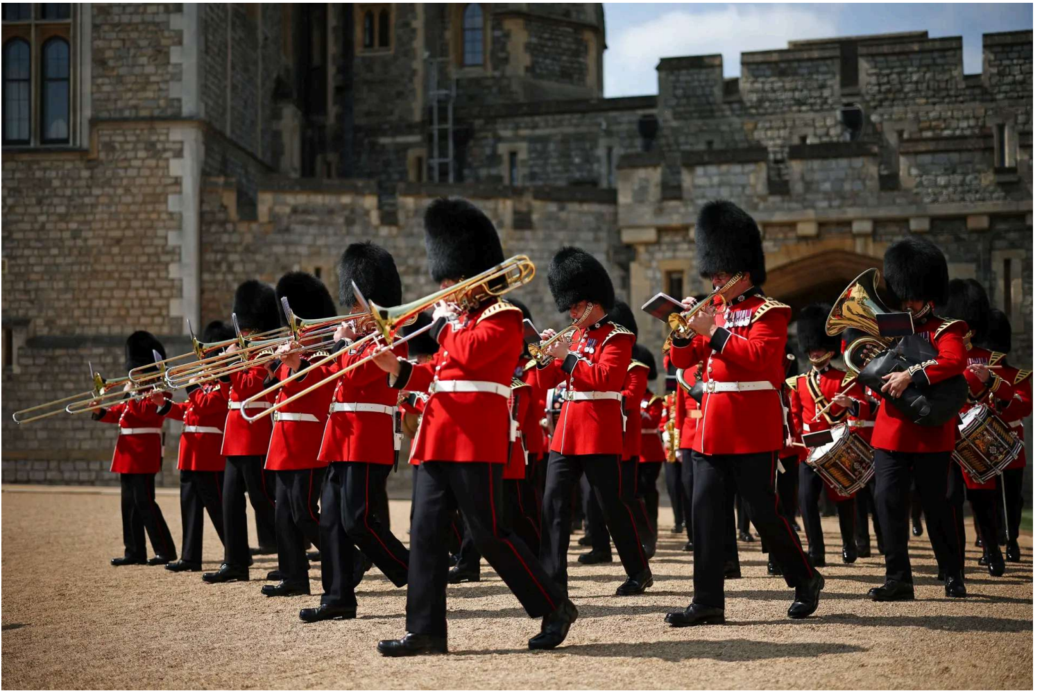
The Band of The Coldstream Guards enters the Quadrangle during a ceremony to present new Colours to the 1st and 2nd Battalion at Windsor Castle in Windsor, England, on June 13, 2025.