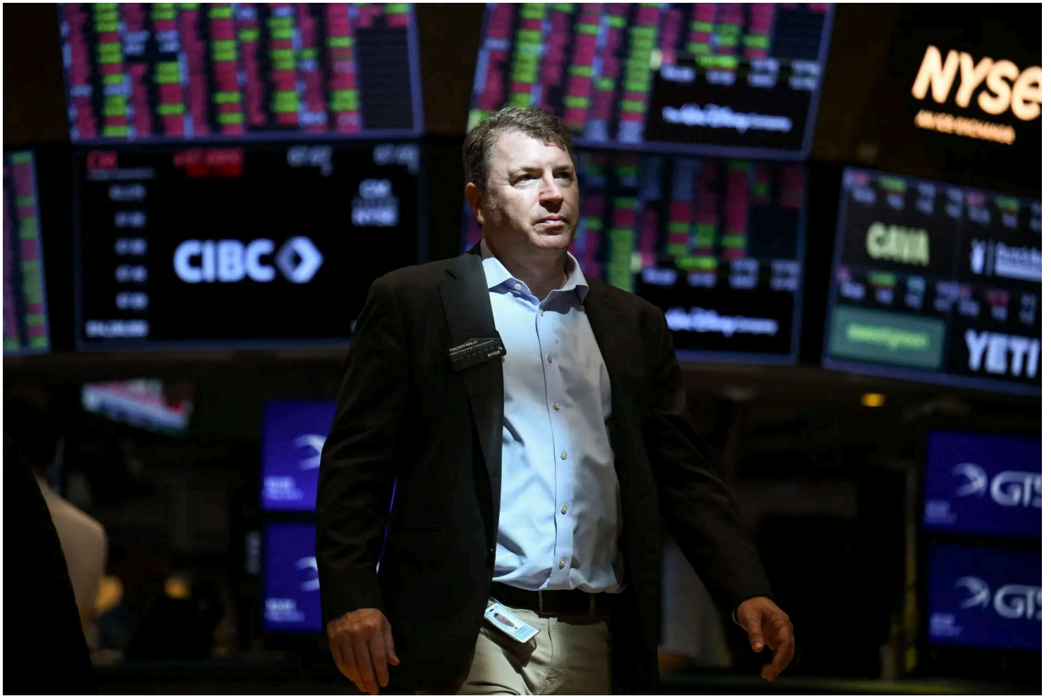
A trader works on the floor of the New York Stock Exchange at the opening bell on June 13, 2025. Oil prices soared and stocks sank Friday after Israel launched strikes on nuclear and military sites in Iran, stoking fears of a full-blown war.