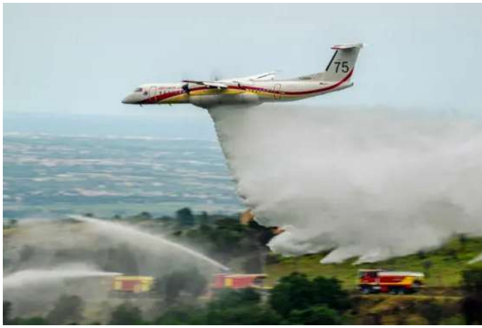
Day in Photos: Firefighting Demonstration, Casting Ballots in Burundi, and Gendarme Dog