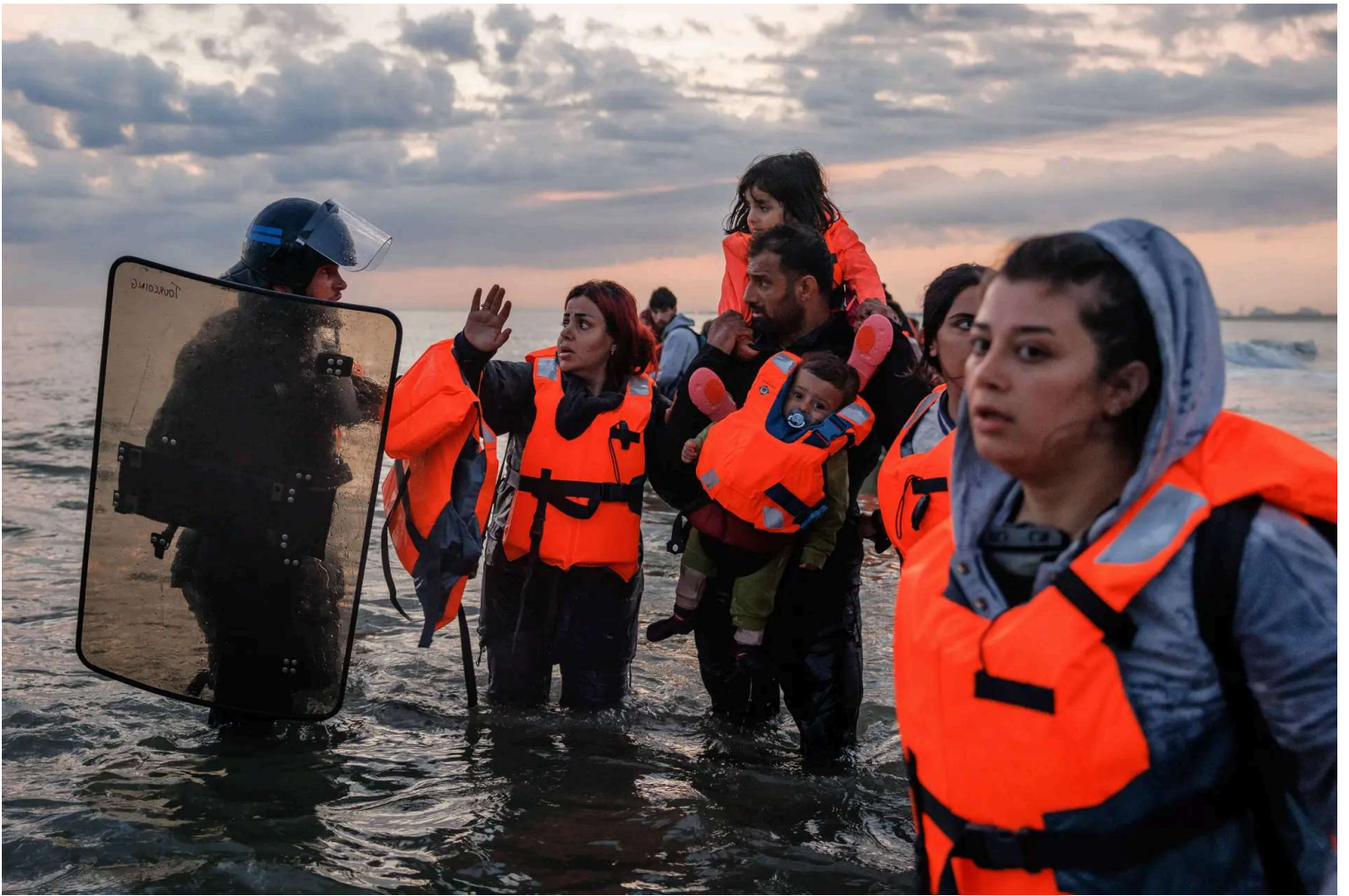
French police enter the water to try to stop migrants boarding small boats that had come to collect them from down the coast in Gravelines, France, on June 13, 2025. Police used tear gas and pepper spray to disperse hundreds of migrants aiming to board several boats, but were ultimately overwhelmed by the sheer number of people. A record number of migrants have left the northern French coastline and arrived in the UK so far this year, with figures surpassing the 15,000 mark.