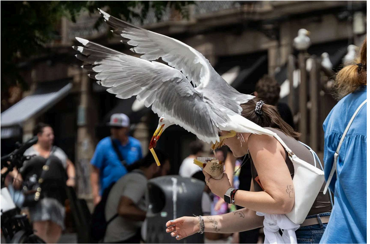
A seagull flies away with a piece of ham and potato after swooping in on a woman's takeaway food in a square near the Boqueria market in Barcelona, Spain, on June 13, 2025.