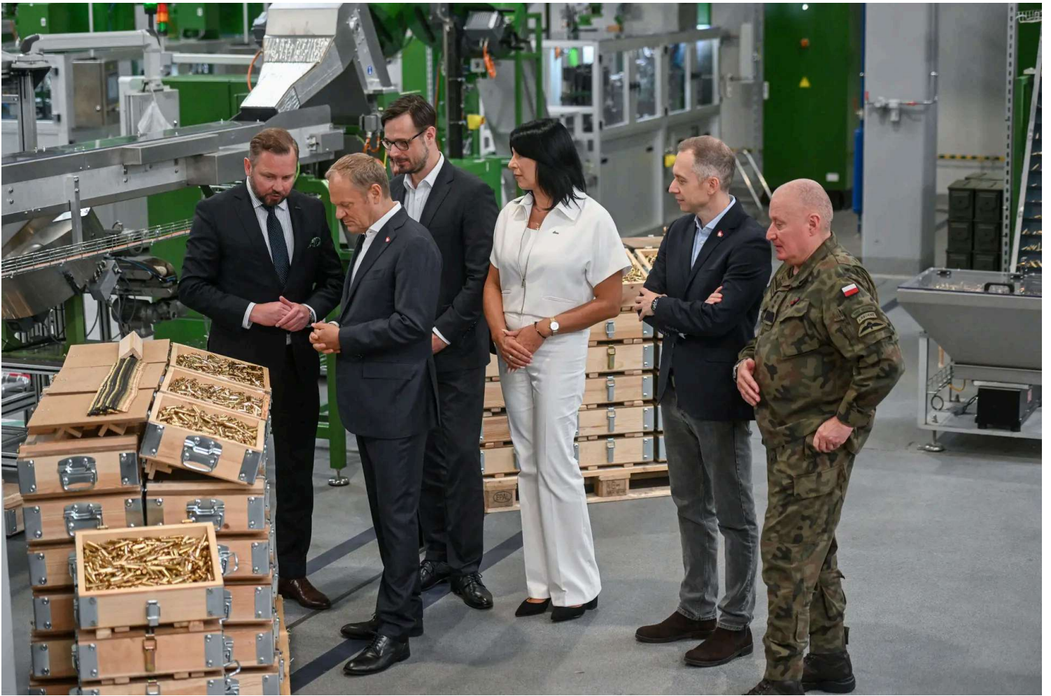
Polish Prime Minister Donald Tusk inspects small caliber ammunition during the opening of Mesko SA's New Ammunition Production Hall in Skarzysko-Kamienna, Poland, on June 13, 2025.