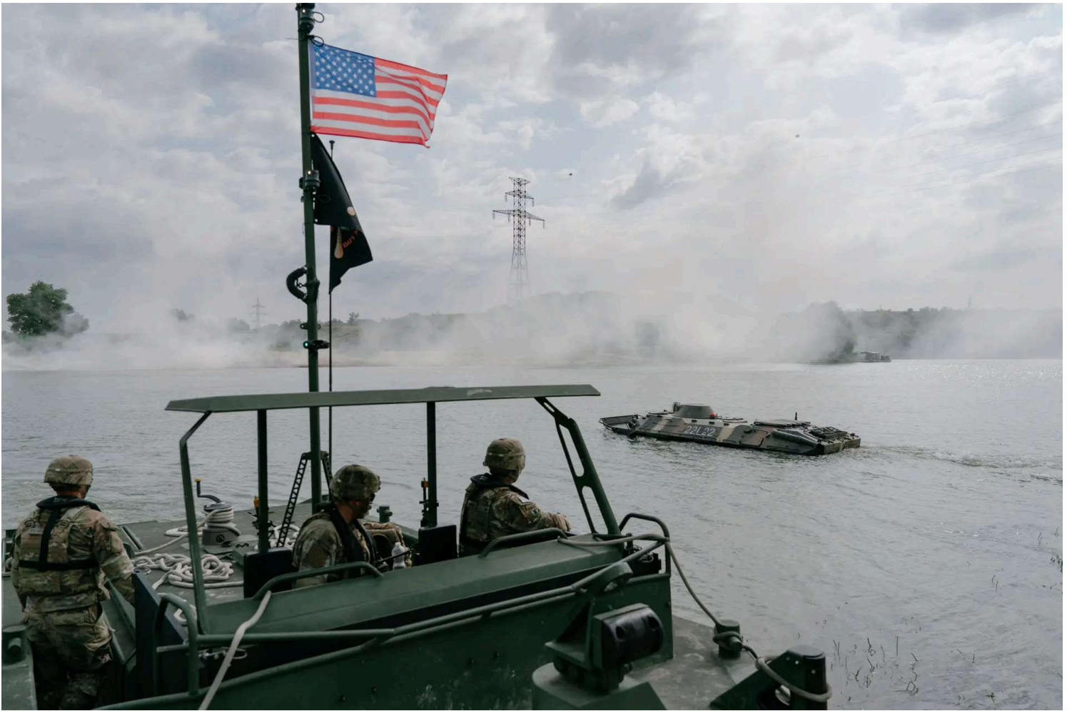
U.S. and Romanian soldiers take part in a military exercise in Frecatei, Romania, on June 13, 2025. Over 700 personnel from Italy, Romania, and the United States are participating in military exercises on the Danube River, followed by further exercises on the Siret River. The scenario they are role playing involves hundreds of pieces of technical equipment as they force a watercourse onto one of the branches of the Danube.