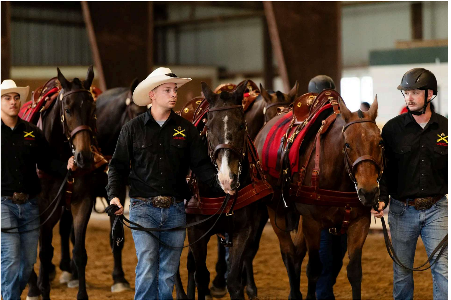
Soldiers with Ft. Still Artillery Half Section walk their horses inside a barn at the Frying Pan Farm Park in Herndon, Va., on June 13, 2025. Horses with the equine unit will pull a 3,500-pound cannon during the Army's 250th Anniversary Military Parade in Washington.