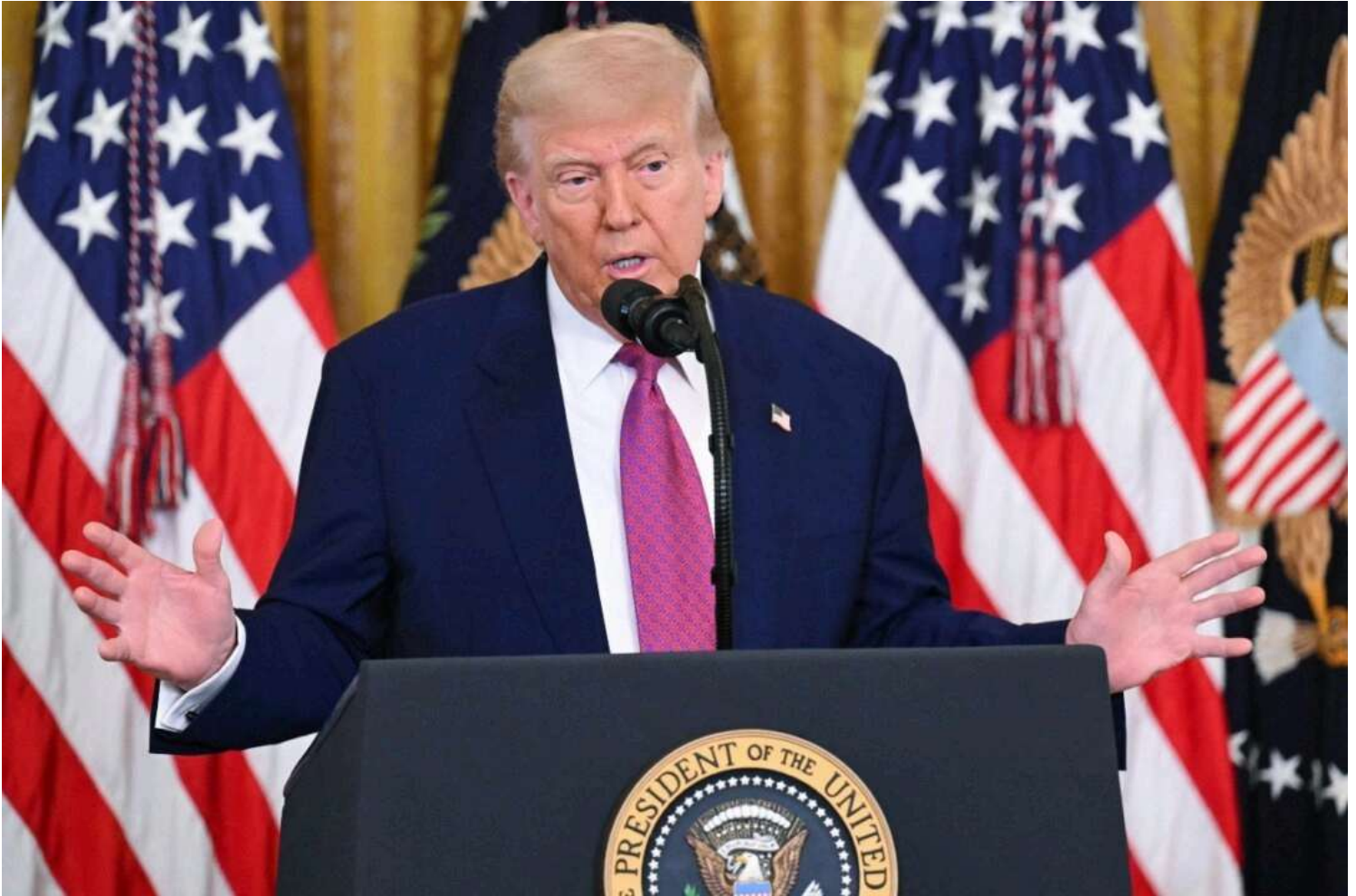
President Donald Trump speaks in the East Room of the White House on June 12, 2025.

The president also suggested that both nations stop the aerial assaults and attempt to hash out a deal on Iran's nuclear program.