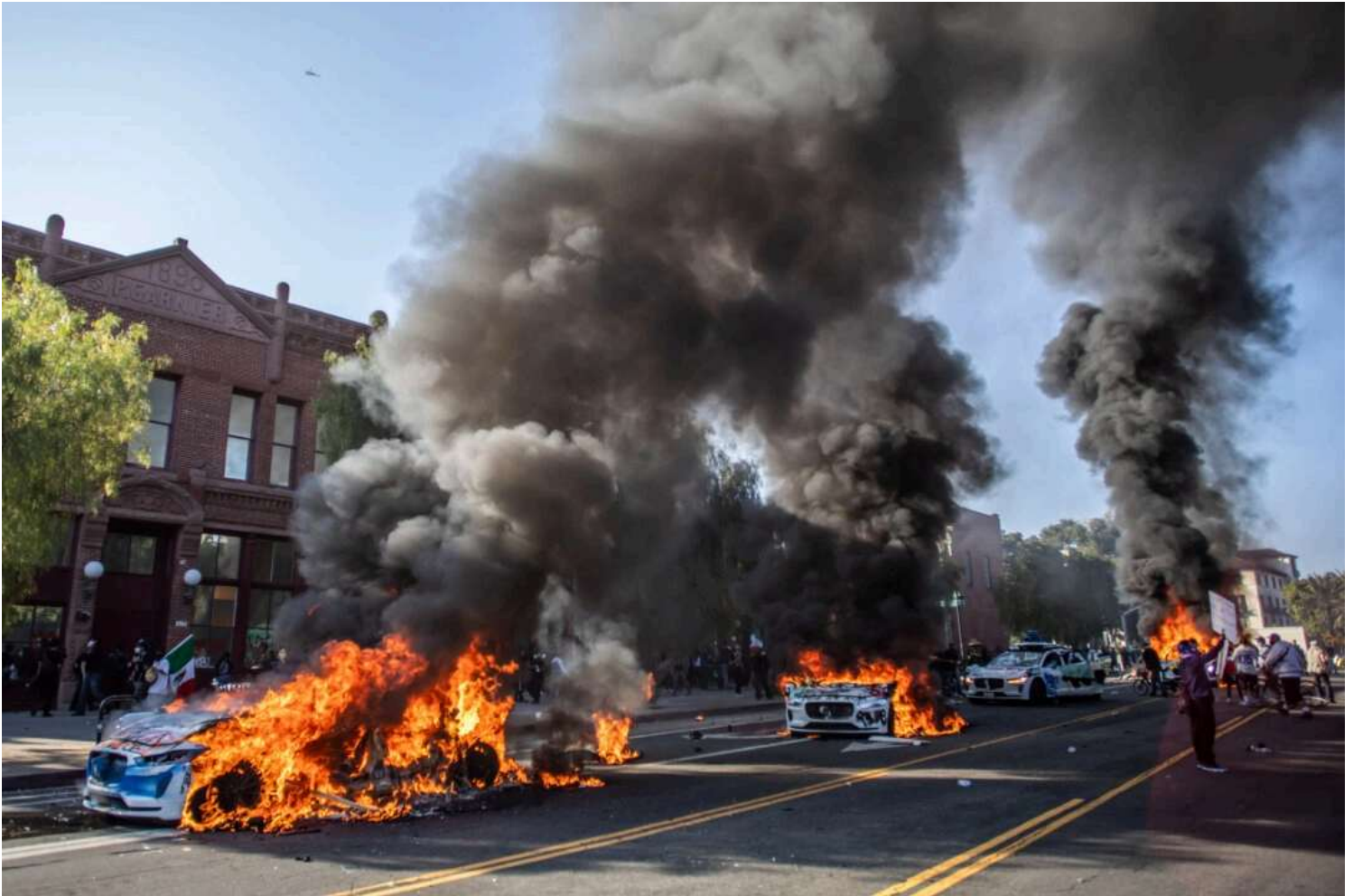
Self-driving cars are set on fire in Los Angeles on June 8, 2025.

Congressional leaders have called for investigations into groups with ties to the Chinese Communist Party.