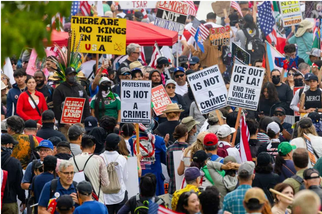
People gather for "No Kings Day" in Los Angeles on June 14, 2025.