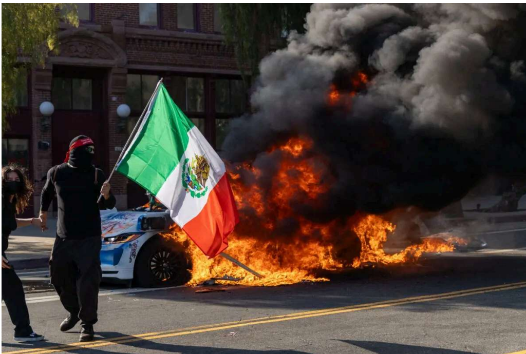
A demonstrator waves a Mexican flag in front of a burning vehicle during a protest in Los Angeles, California, on June 8, 2025.