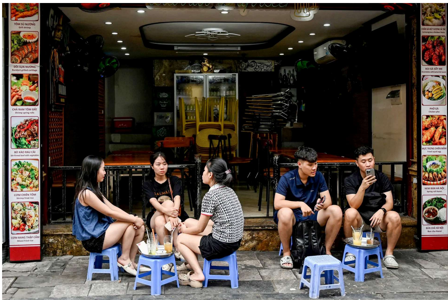
People sit on plastic stools as they chat in the Old Quarter of Hanoi, Vietnam, on June 16, 2025.