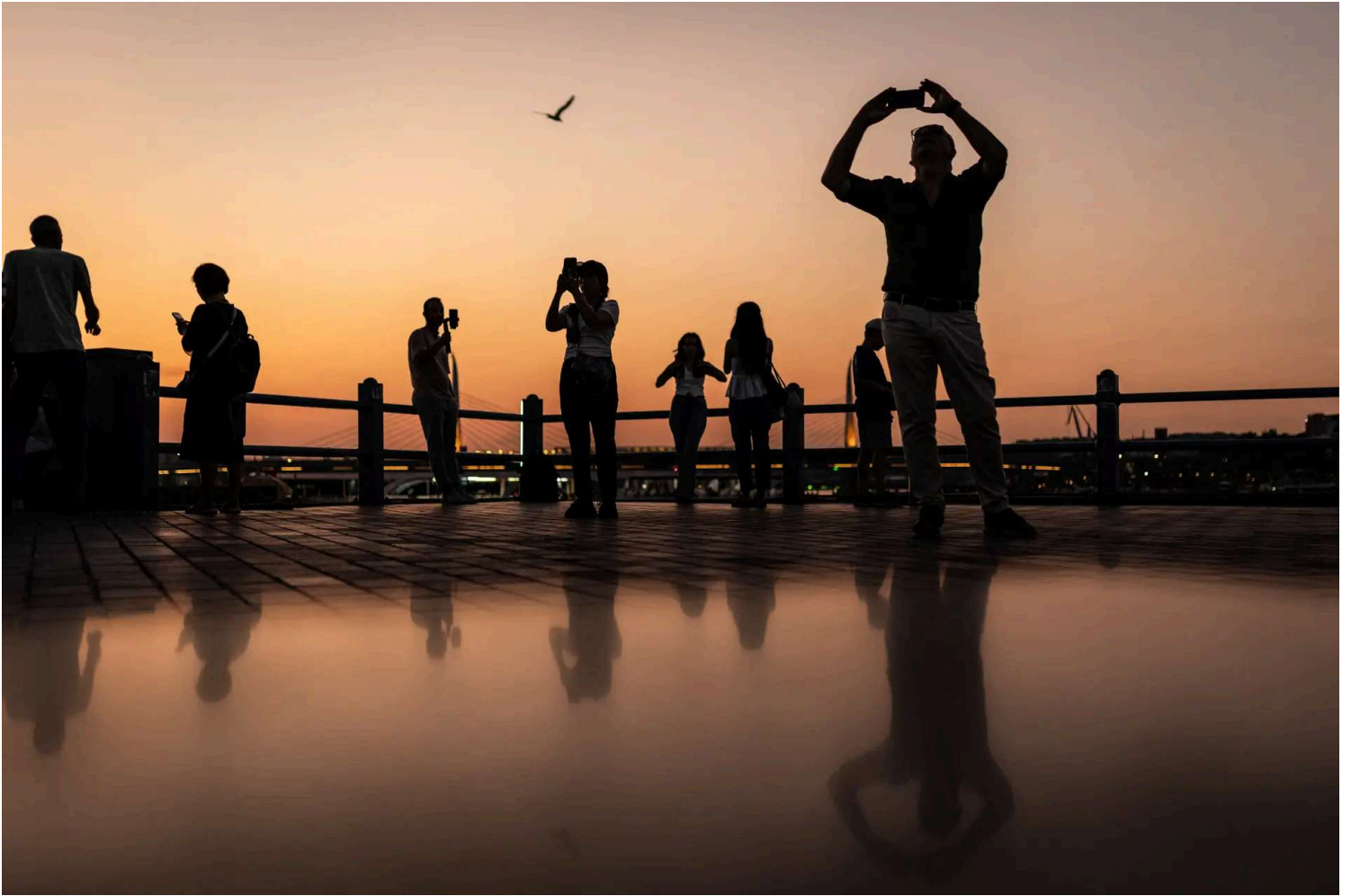
People walk along the Galata Bridge, in the Golden Horn bay of Istanbul, Turkey, on June 16, 2024.