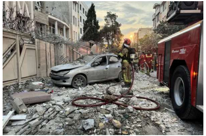
Day in Photos: Israel Attacks Iran, Military Parade Preparations in Washington, India Mourns Plane Crash