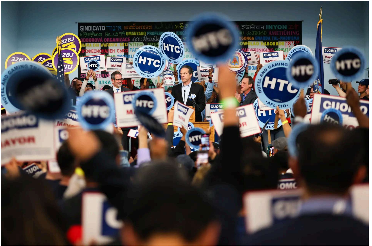
New York City mayoral candidate, former New York Gov. Andrew Cuomo, speaks during a Get Out the Vote rally at the Hotel & Gaming Trades Council building in New York City on June 16, 2025.