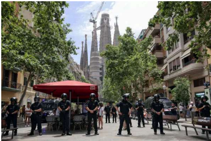
Day in Photos: Protests in Spain, First Veterans Day in Germany, Iran-Israel Strikes Continue