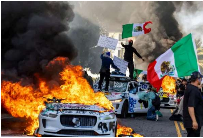
In Photos: Anti-ICE Riots in Los Angeles