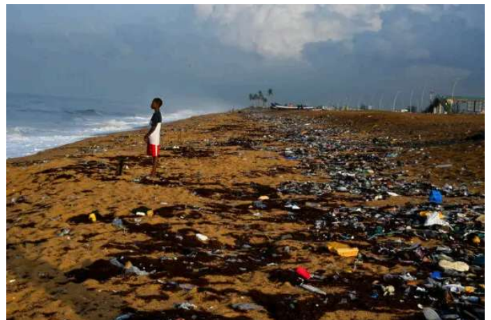
Day in Photos: Pollution on the Ivory Coast, Forest Fires in Israel, and Elephant Island