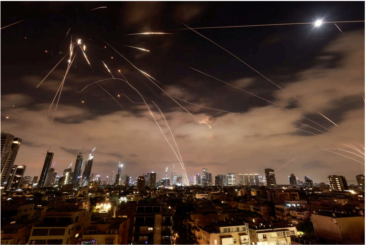
Israeli air defense systems are activated to intercept Iranian missiles over the Israeli city of Tel Aviv amid a fresh barrage of Iranian rockets on June 16, 2025. The Israeli military said early on June 16 that it was striking surface-to-surface missile sites in Iran, its latest move in three days of escalating conflict between the rival states.