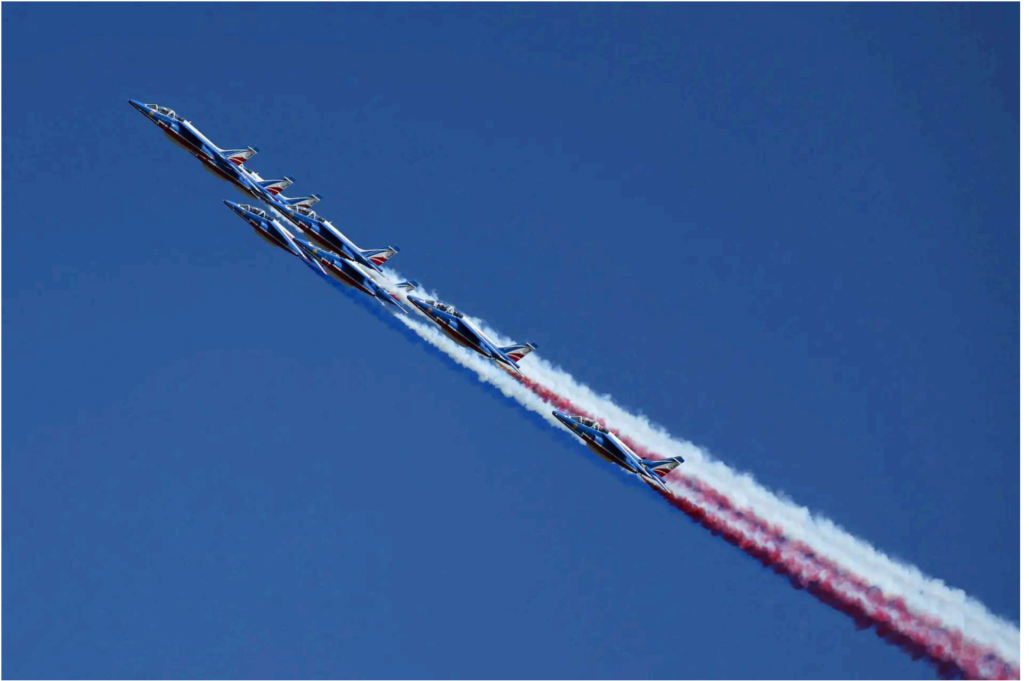
Alpha Jets of the French Air Force Elite aerobatic flying team "Patrouille de France" perform an exhibition flight demonstration during the 55th edition of the International Paris Air Show at the ParisLe Bourget Airport in Le Bourget suburb of Paris on June 16, 2025.