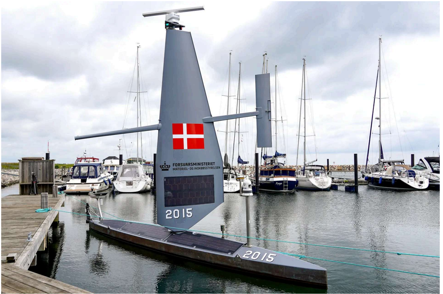
A Saildrone Voyager uncrewed surface vehicle, is moored at the Kobe Marina in Koge, eastern Denmark, on June 16, 2025. The deployment of the two unmanned surface vessels of the Saildrone Voyager type is part of the Danish Defense's operational testing of unmanned maritime units.

Sign up for the Epoch Weekly Debrief newsletter. Get an easy, digestible roundup of 2 to 3 of the most important stories from the past week. Sign up with 1-click >>