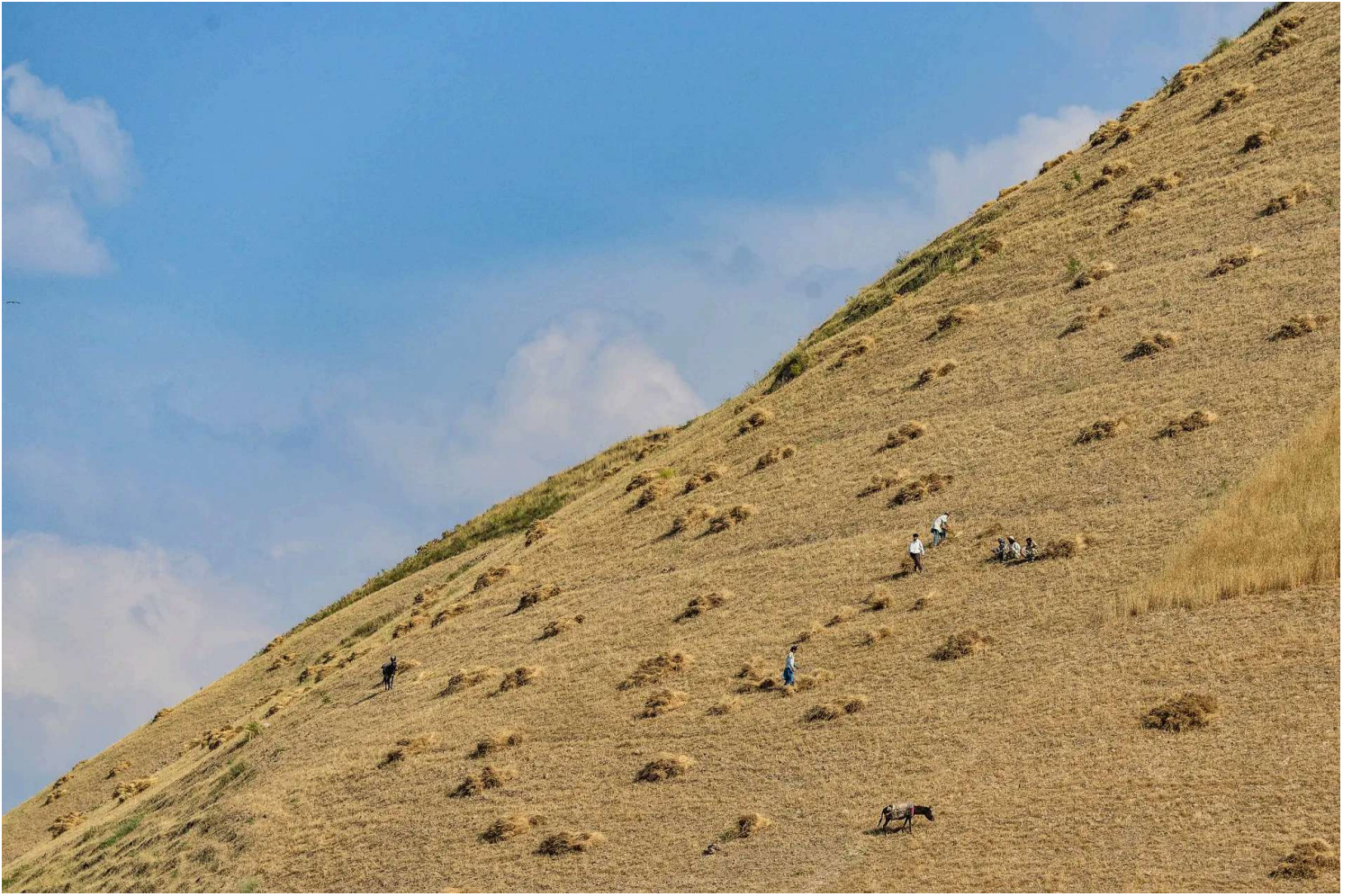
Afghan farmers harvest wheat on a hillside on the outskirts of Fayzabad, Afghanistan, on June 16, 2025.