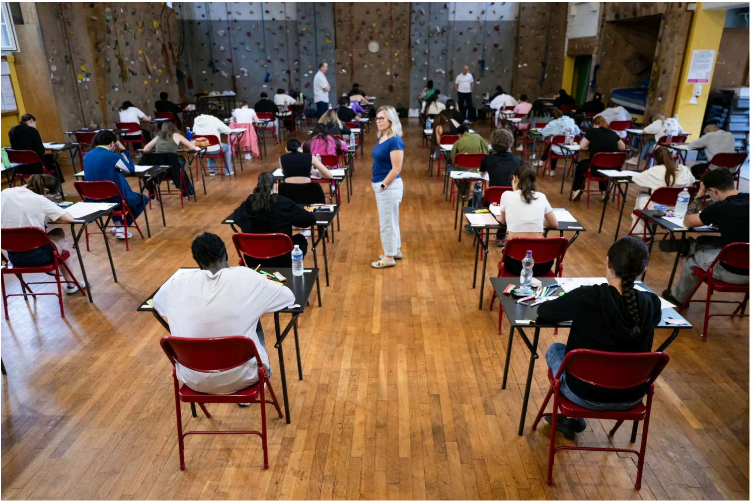
A professor looks on as pupils take part in the baccalaureate philosophy exam at the Lycee Michel de Montaigne in Mulhouse, eastern France, on June 16, 2025.