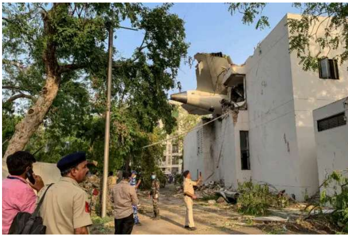
Day in Photos: India Plane Crash, London's Personalized Museum, and Flooding in San Antonio