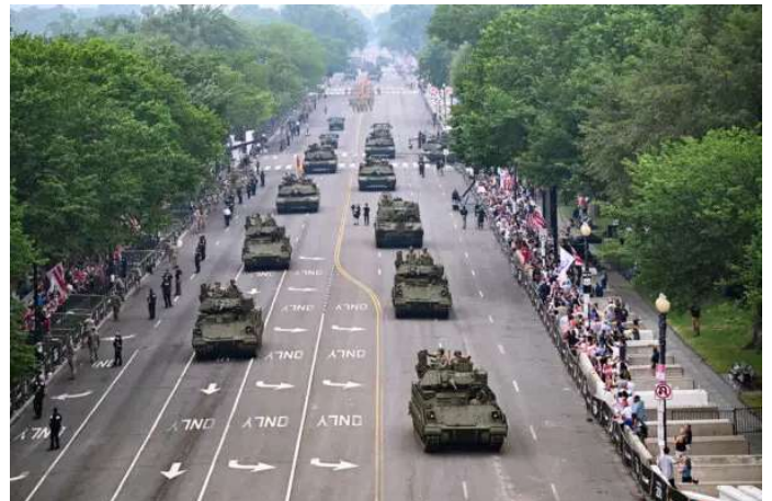
In Photos: US Army's 250th Birthday Parade in Washington