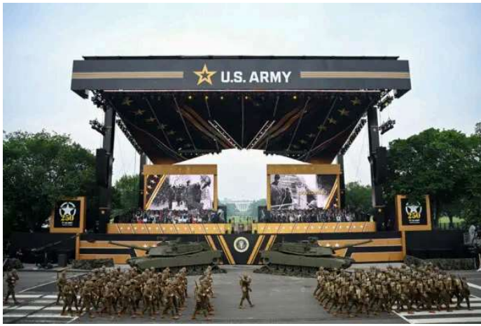
Day in Photos: Army's 250th Birthday Parade, Ivory Coast Protests, and Srinagar Views