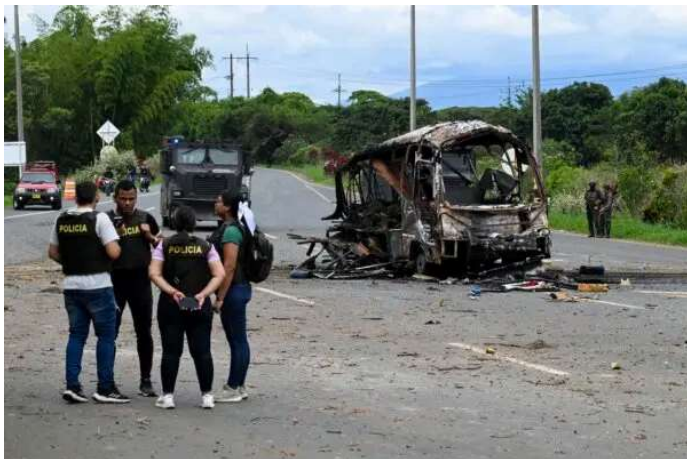
Day in Photos: Series of Attacks in Colombia, Police Operation in Brazil, School Shooting in Austria