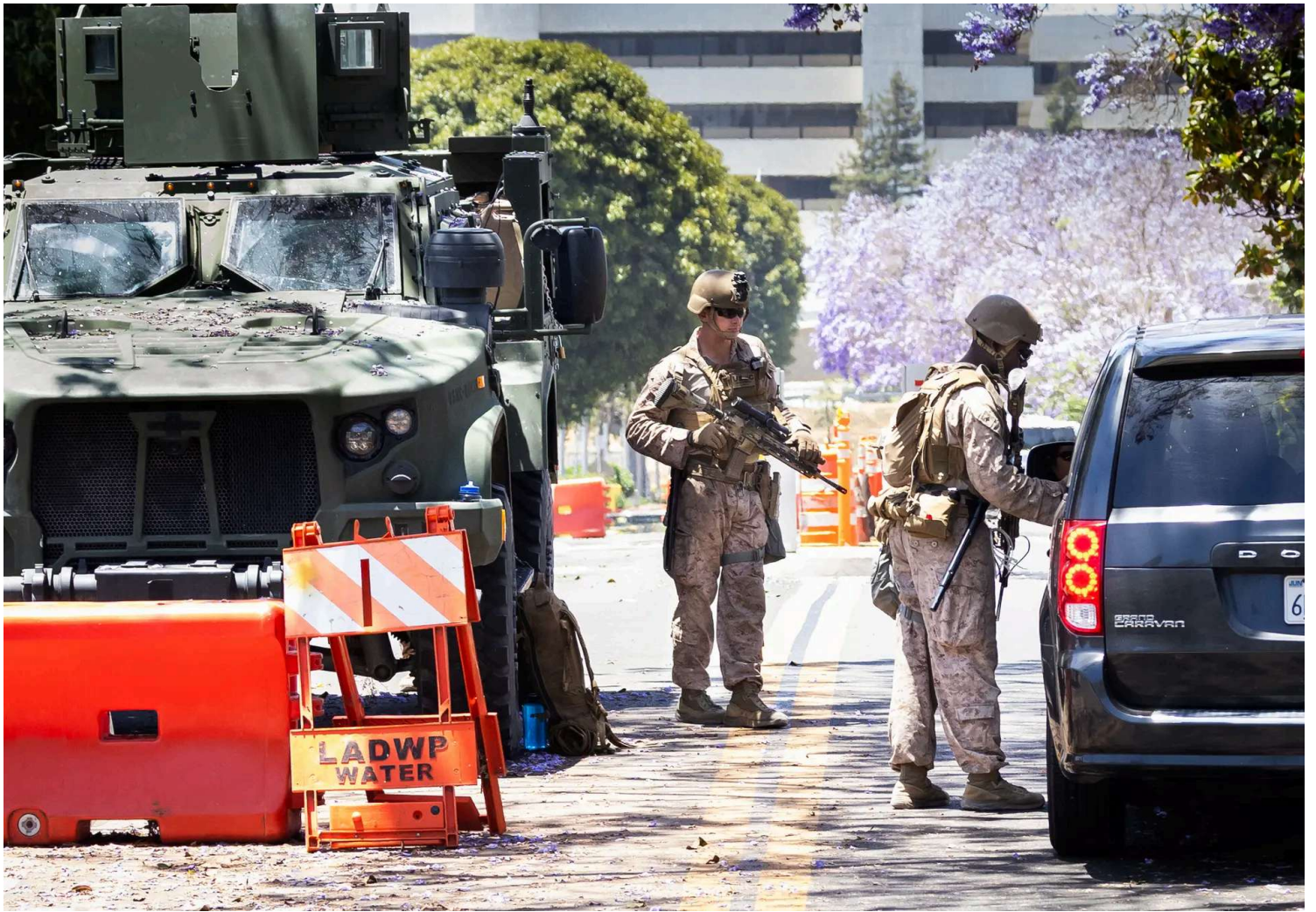
Military personnel with the U.S. Marine Corp provide security for a federal facility near Los Angeles on June 16, 2025.