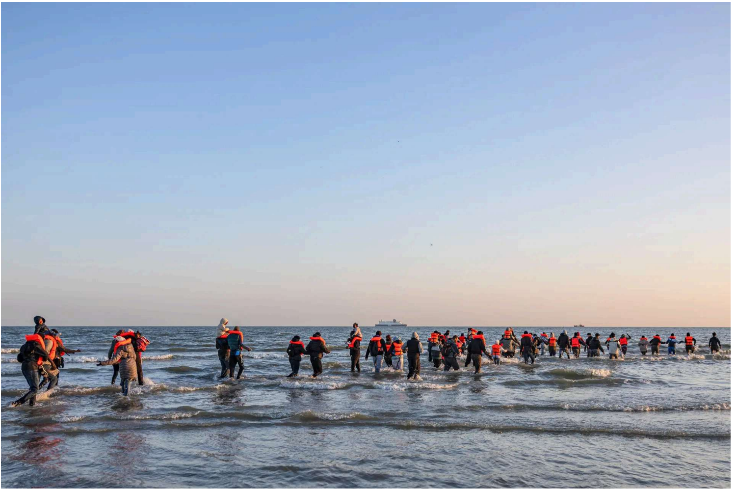
Migrants walk in the water to board a smuggler's boat in an attempt to cross the English Channel off the beach of Gravelines, northern France, on June 16, 2025.