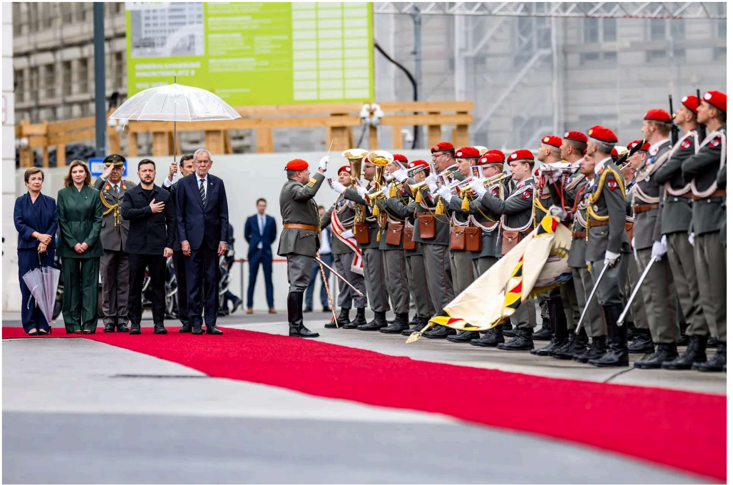
(L–R) Austrian First Lady Doris Schmidauer, Ukrainian First Lady Olena Zelenska, Ukrainian President Volodymyr Zelensky and Austrian President Alexander van der Bellen observe the honorary guard at the Presidential Chancellery in Vienna on June 16, 2025.