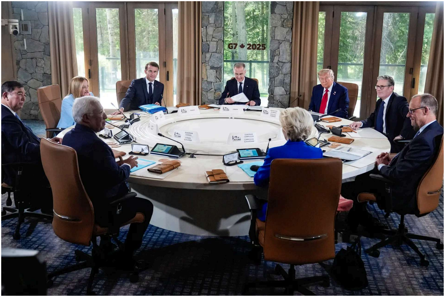
Japan's Prime Minister Shigeru Ishiba, from left, Italy's Prime Minister Giorgia Meloni, France's President Emmanuel Macron, Canada's Prime Minister Mark Carney, President Donald Trump, Britain's Prime Minister Keir Starmer, Germany's Chancellor Friedrich Merz, and in foreground left, European Council President Antonio Costa and foreground right, European Commission President Ursula von der Leyen, participate in a session of the G7 in Kananaskis, Canada, on June 16, 2025.