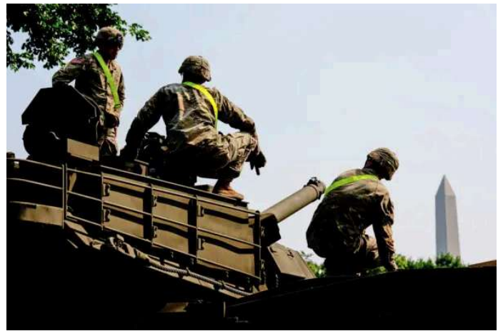
Day in Photos: U.S. Military Parade Preparations, Dad Strike, and Princess in Brazil