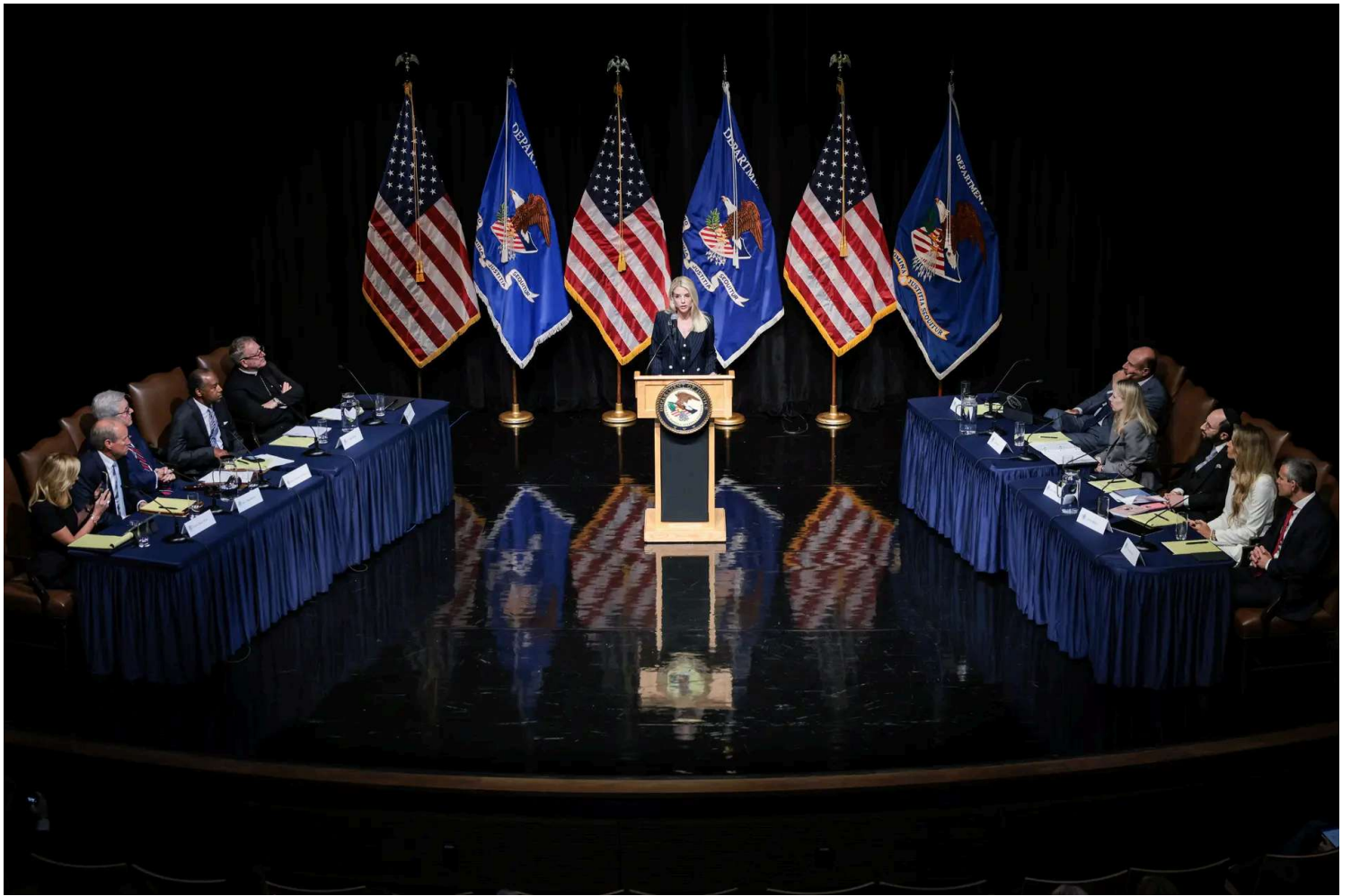
Attorney General Pam Bondi speaks during the first hearing of the Religious Liberty Commission on "the importance of faith to American success" at the Museum of the Bible in Washington on June 16, 2025. The Religious Liberty Commission was established on May 1 following an executive order signed by President Donald Trump during the National Day of Prayer event at the White House.