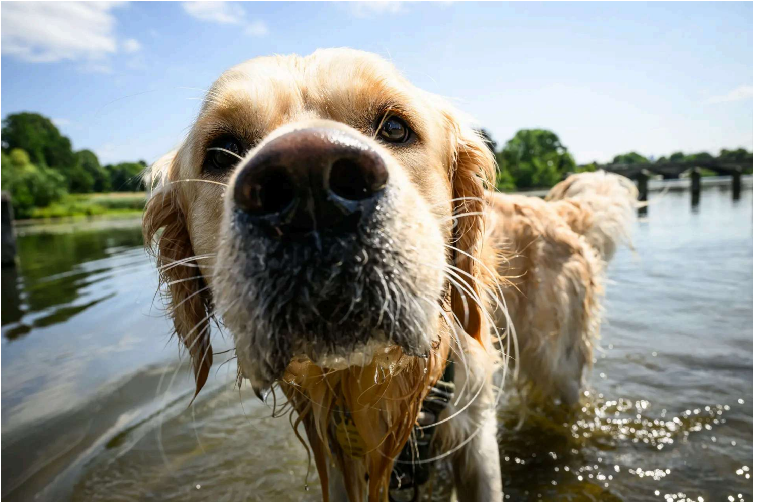
Kohei the Labrador enjoys the cool water of the Serpentine as temperatures start to rise in London on June 16, 2025.