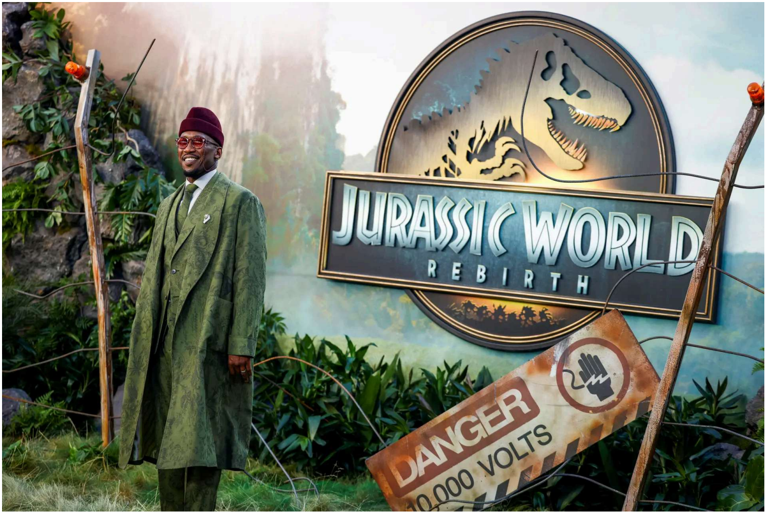
U.S. actor Mahershala Ali poses on the red carpet for the World premiere of the film "Jurassic World Rebirth" in central London, on June 17, 2025.