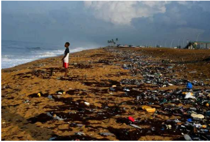
Day in Photos: Pollution on the Ivory Coast, Forest Fires in Israel, and Elephant Island