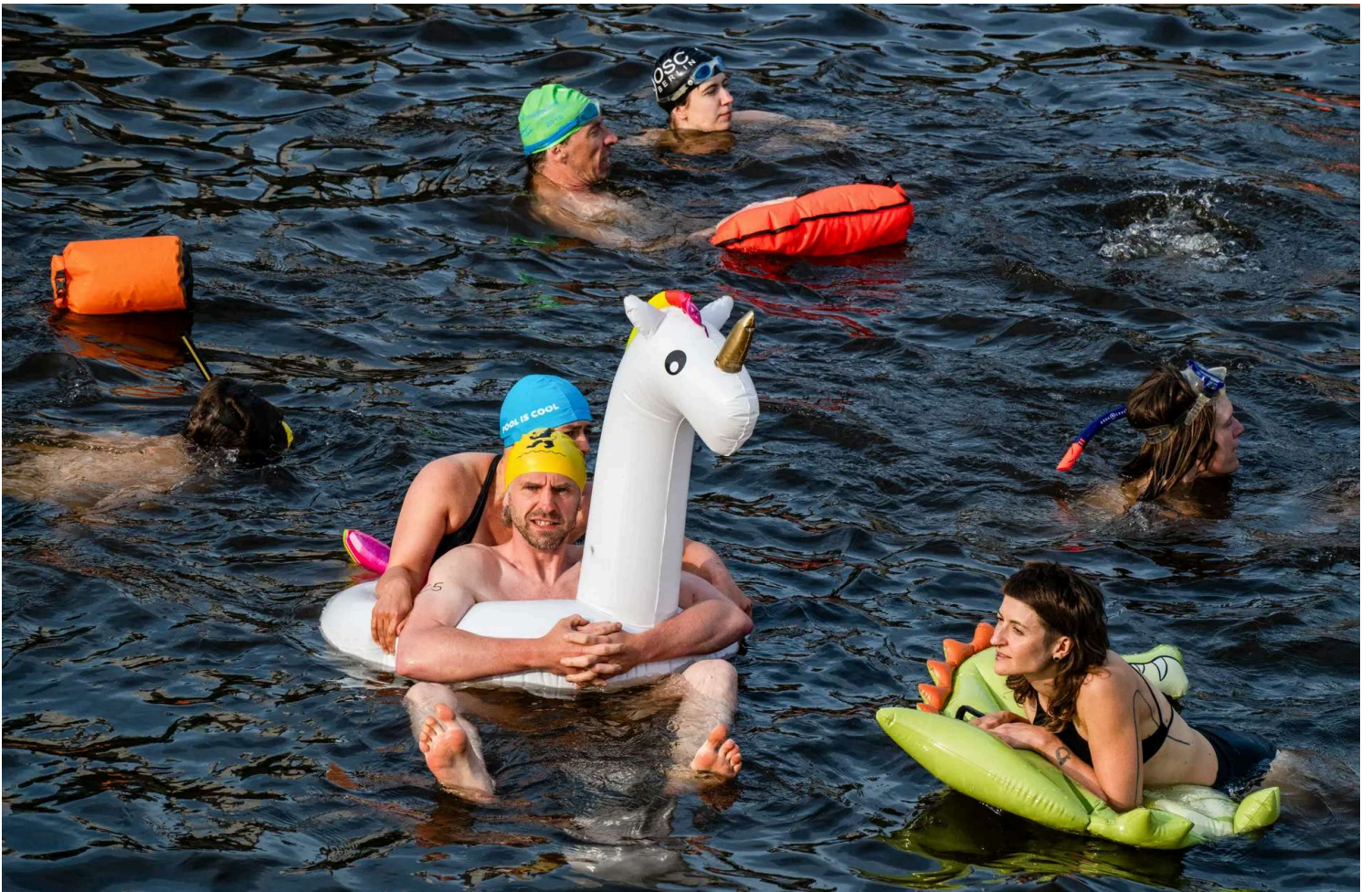
Swimmers bathe in the Spree canal during a demonstration to mark the 100th anniversary of a ban on swimming in the Spree river, in Berlin, on June 17, 2025. The demonstrators are pleading for an end to the ban.