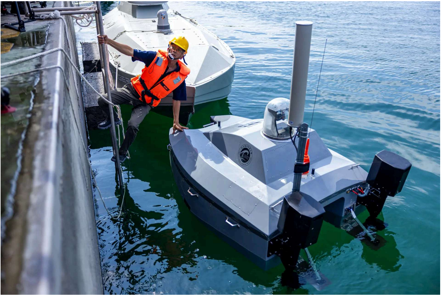
The technical personnel of Carbon-Based Technology Inc. casts off the Unmanned Surface Vessel, Carbon Voyager I, before the demonstration during a media tour in Yilan, Taiwan, on June 17, 2025. The Taiwan government is ramping up cooperation with democratic partners on drone technology.