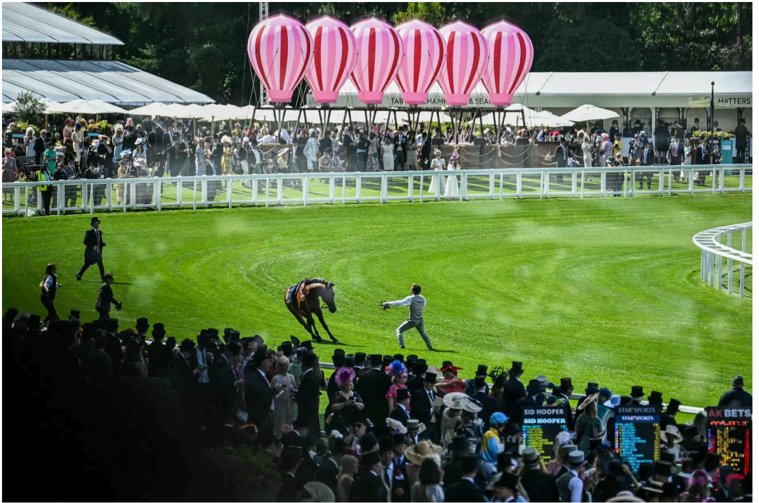
A member of the ground staff attempts to catch a horse running loose ahead of the King Charles III stakes on the first day of the Royal Ascot horse race meeting in Ascot, west of London, on June 17, 2025.