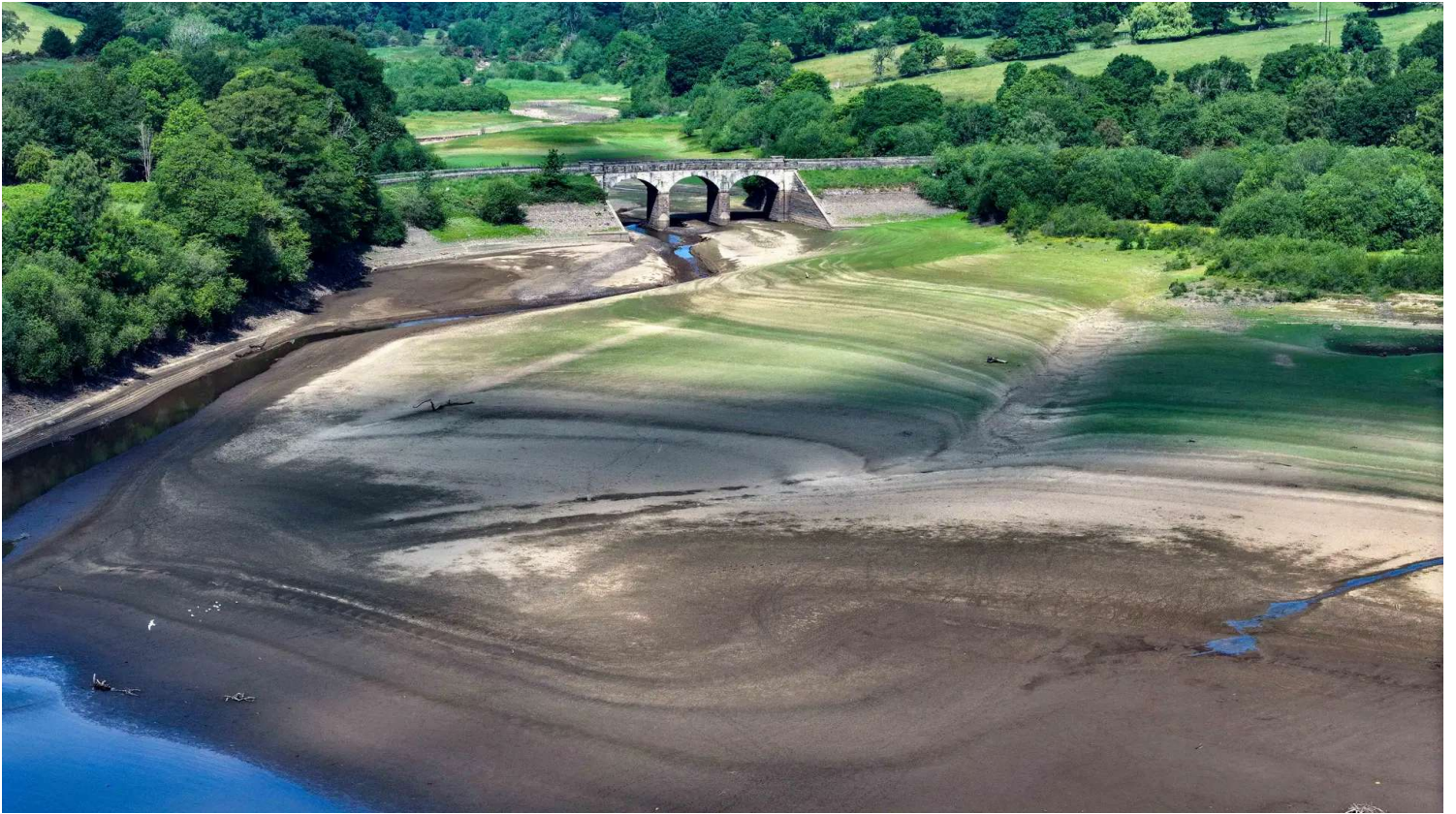
In this aerial view, low water levels reveal the reservoir bed at Lindley Wood Reservoir in Yorkshire after the driest spring in 132 years in Otley, England, on June 17, 2025. Yorkshire has become the second region to be declared in drought status by the Environment Agency after low rainfall this year and reservoirs at 64.6 percent capacity, below the expected 80–85 percent at this time of year.