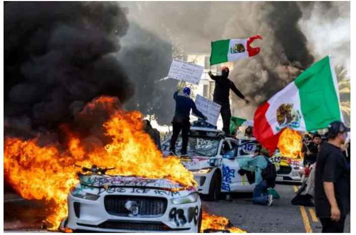
In Photos: Anti-ICE Riots in Los Angeles

Copyright © 2000 – 2025 The Epoch Times Association Inc. All Rights Reserved.