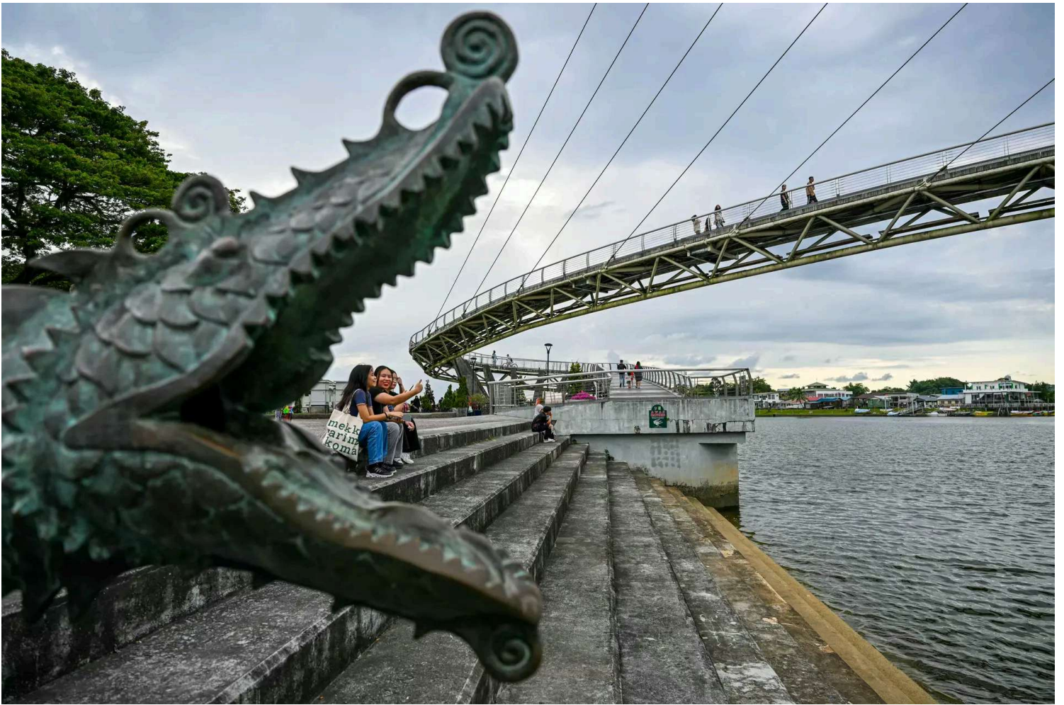
People sit by the Sarawak river in Kuching, capital of the Malaysian state of Sarawak on the island of Borneo, Malaysia, on June 17, 2025.