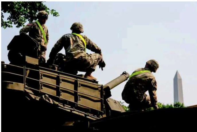
Day in Photos: U.S. Military Parade Preparations, Dad Strike, and Princess in Brazil