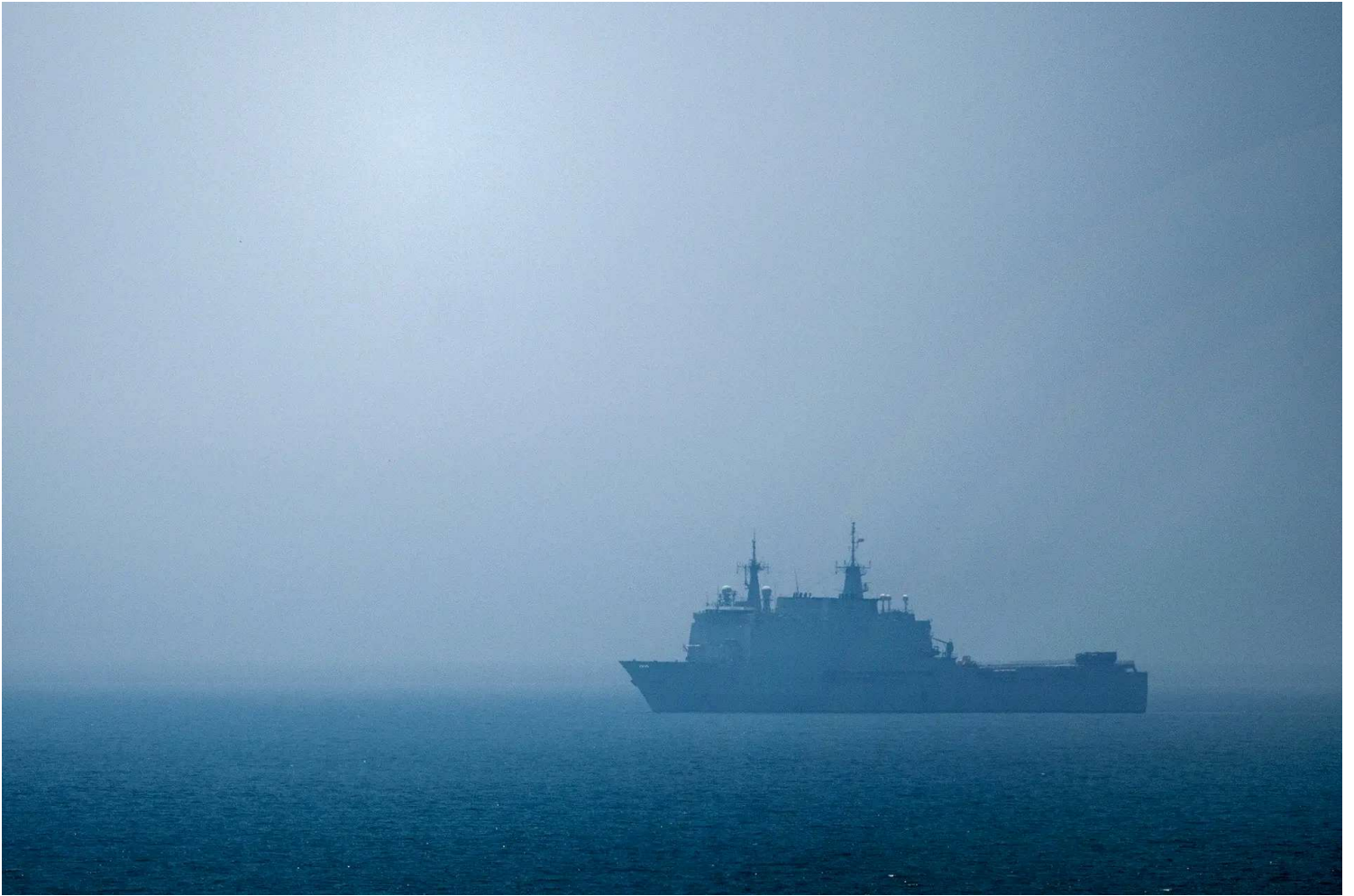
A military vessel sails off the coast of Rota, Spain, on June 17, 2025.

Sign up for the News Alerts newsletter. You'll get the biggest developing stories so you can stay ahead of the game. Sign up with 1-click >>