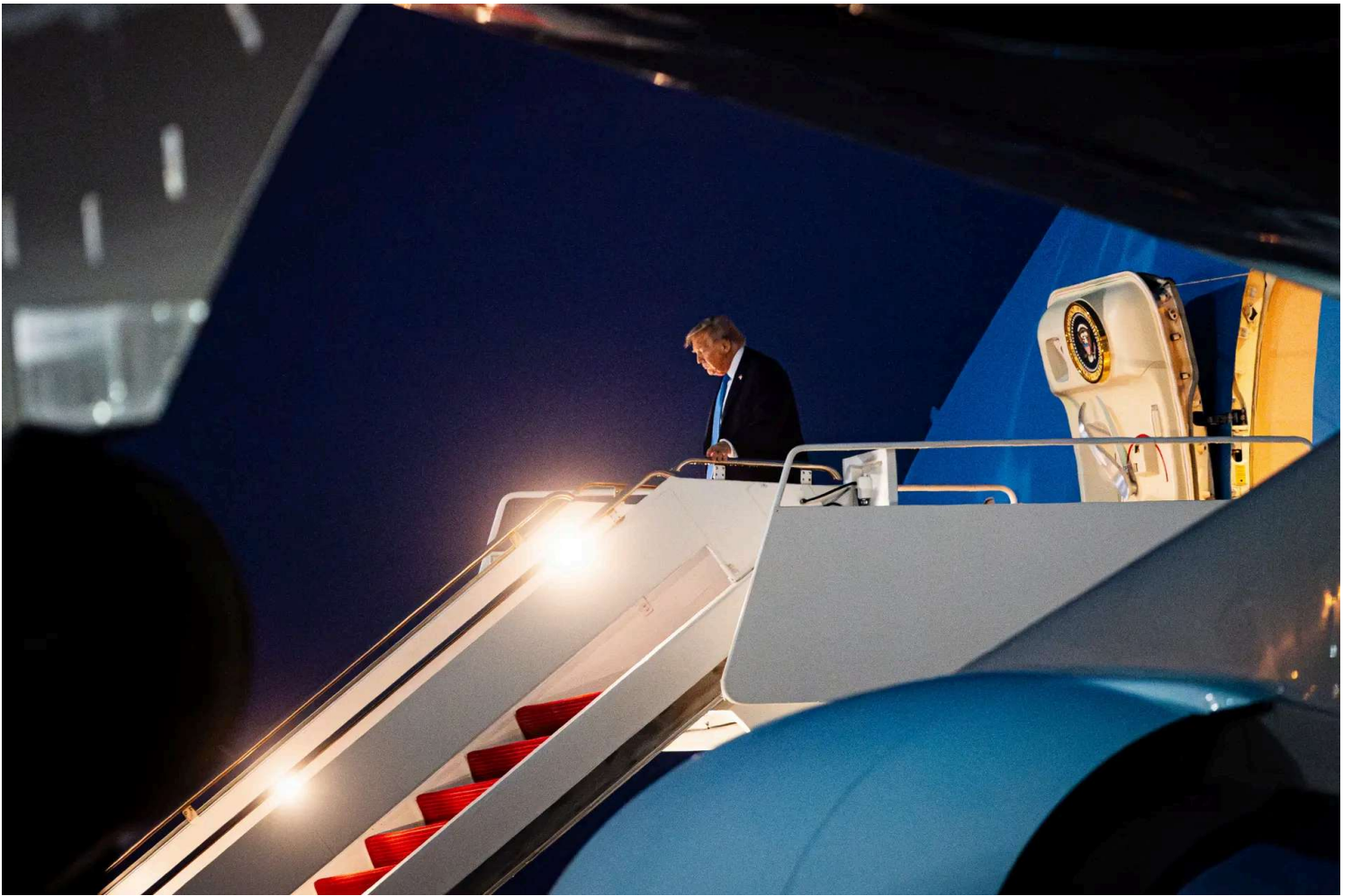
President Donald Trump alights from Air Force One after arriving at Joint Base Andrews, Md., on June 17, 2025. Trump said he left the G7 Leaders' Summit a day early to return to Washington to try to deal with the conflict between Israel and Iran.