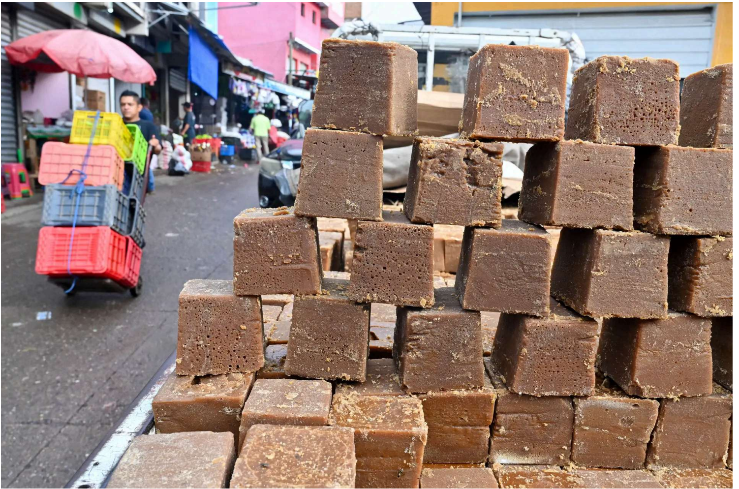
A man walks past several blocks of panela—a traditional sweet made from sugarcane juice—at the Belen Market in Tegucigalpa, Honduras, on June 17, 2025. The Belen market receives thousands of people daily, considered one of the largest in Tegucigalpa.