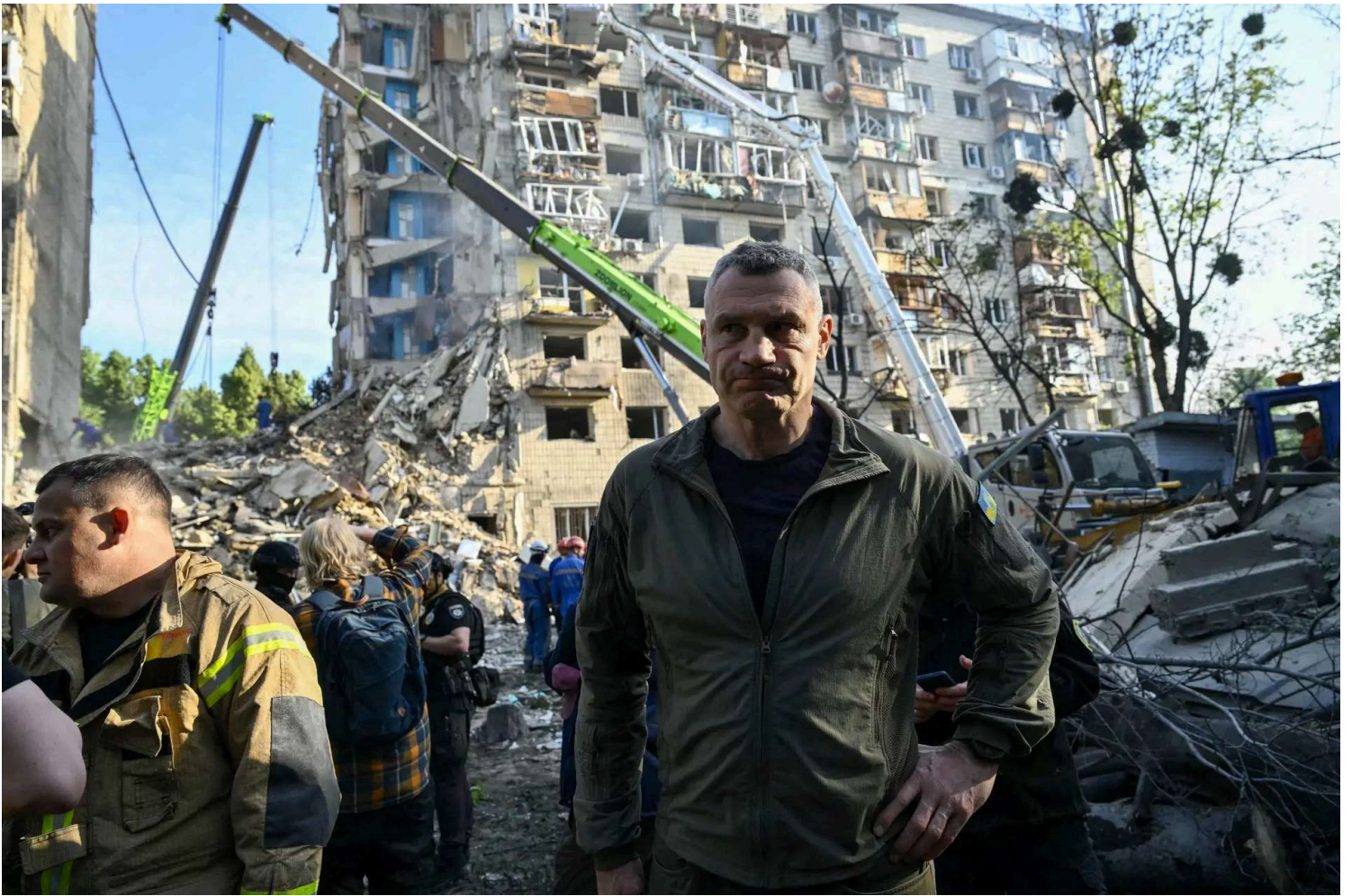
Kyiv's mayor Vitali Klitschko visits the site of a missile attack as Ukrainian rescuers conduct a search and rescue work in a heavily damaged residential building following the Russian missile strike in Kyiv, on June 17, 2025. A Russian attack killed at least 14 people and wounded dozens in the Ukrainian capital, authorities said on June 17, with more wounded reported in the Odesa and Chernigiv regions.