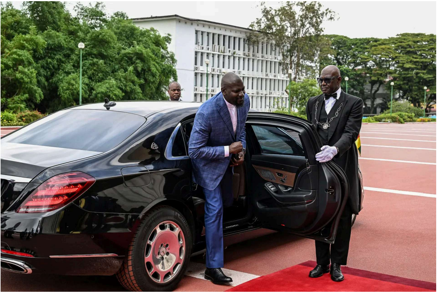
President of the Republic of Guinea Mamady Doumbouya arrives to meet with Ivory Coast's President at the presidential palace during a visit in Abidjan, Ivory Coast, on June 17, 2025.