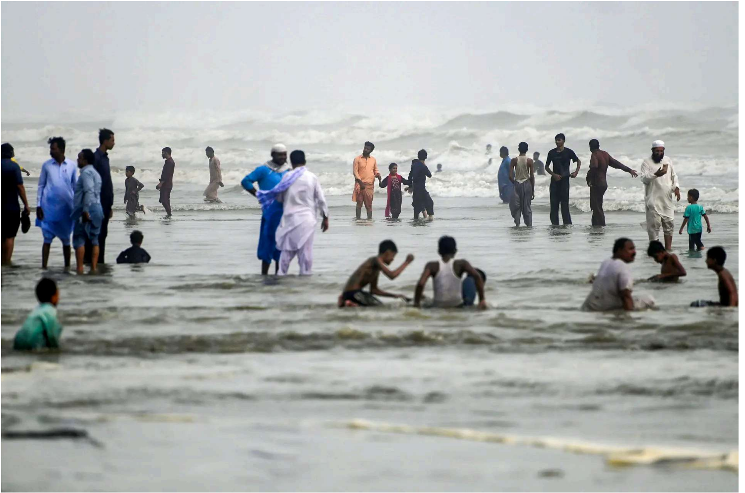
People cool off in the Arabian Sea during a hot summer day in Karachi, Pakistan, on June 17, 2025.