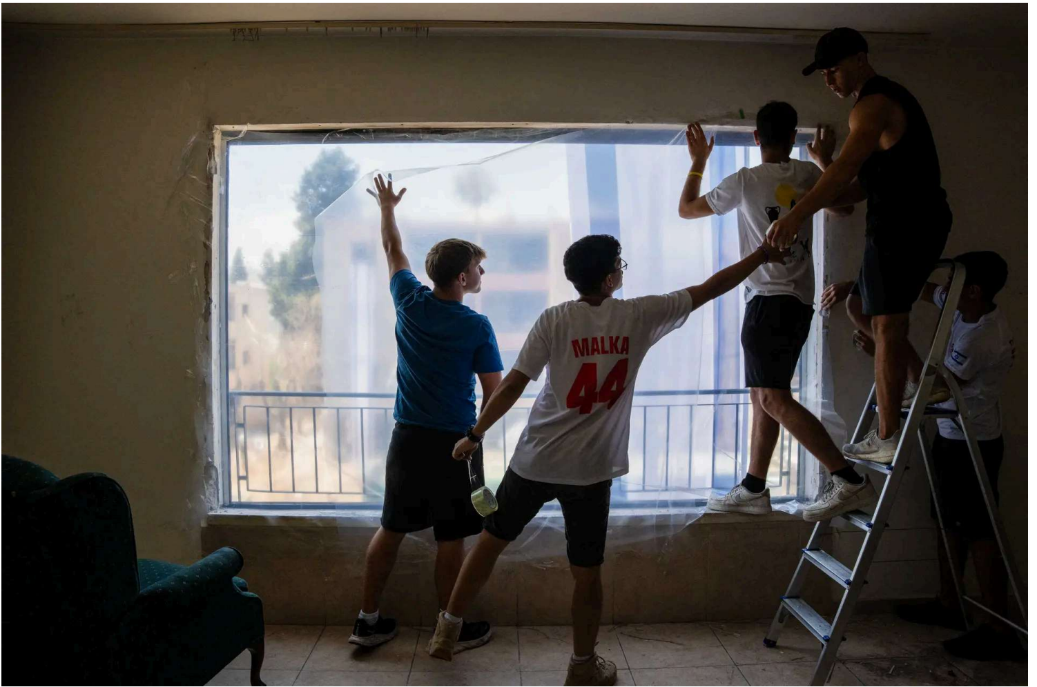
Volunteers help cover windows with plastic after they were bombed out in an Iranian missile strike in Haifa, on June 17, 2025. Israel and Iran traded deadly fire for a fifth day on June 17 in their most intense confrontation in history, fuelling fears of a drawn-out conflict that could engulf the Middle East.