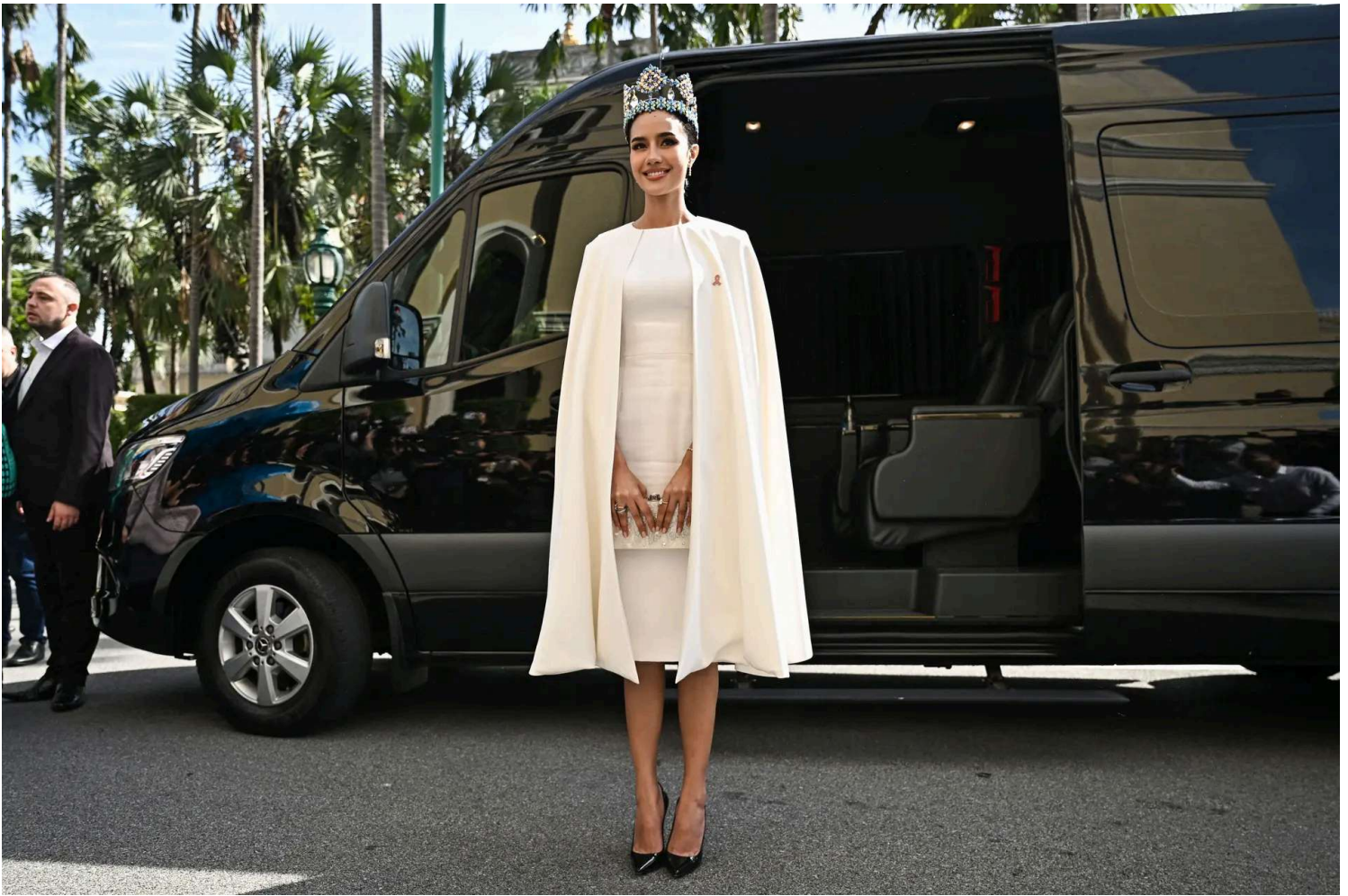
Thai beauty pageant contestant and recently crowned Miss World 2025 Suchata "Opal" Chuangsri arrives at Government House in Bangkok, on June 17, 2025.