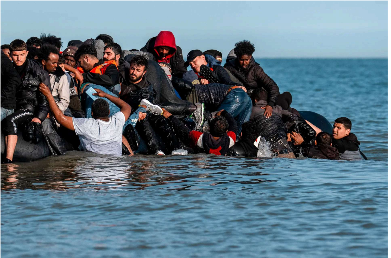
Migrants board a dinghy to sail into the English Channel in Gravelines, France, on June 17, 2025. A record number of migrants have made the illegal crossing from France to the UK via small boats so far this year. Figures surpassed the 16,000 mark last week, which is 42 percent more than the same point last year.