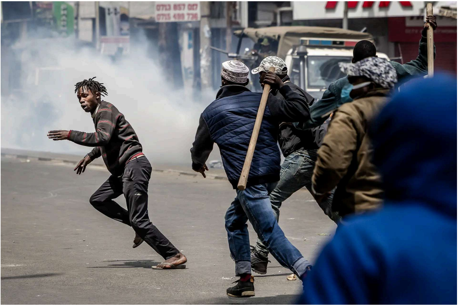
Men armed with sticks and clubs chase a protester during clashes sparked by the death of Kenyan blogger Albert Ojwang, who died in police custody, in downtown Nairobi, on June 17, 2025. At least nine people were wounded as security services and hundreds of men armed with whips and clubs clashed with protesters in Kenya on June 17.