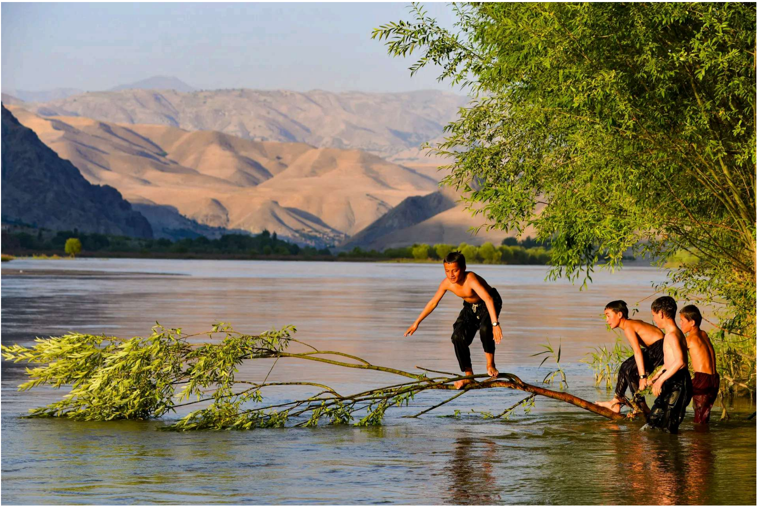
Afghan boys dive into the Kokcha river in Argo district, Afghanistan, on June 17, 2025.