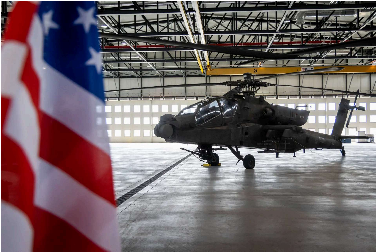
An AH-64D APACHE helicopter stands in the hangar during a ceremony marking the delivery of the first helicopters of this kind to the Polish Armed Forces under a lease agreement with the U.S. Army, at the 56th Air Base in Inowrocaw, Poland, on June 17, 2025.