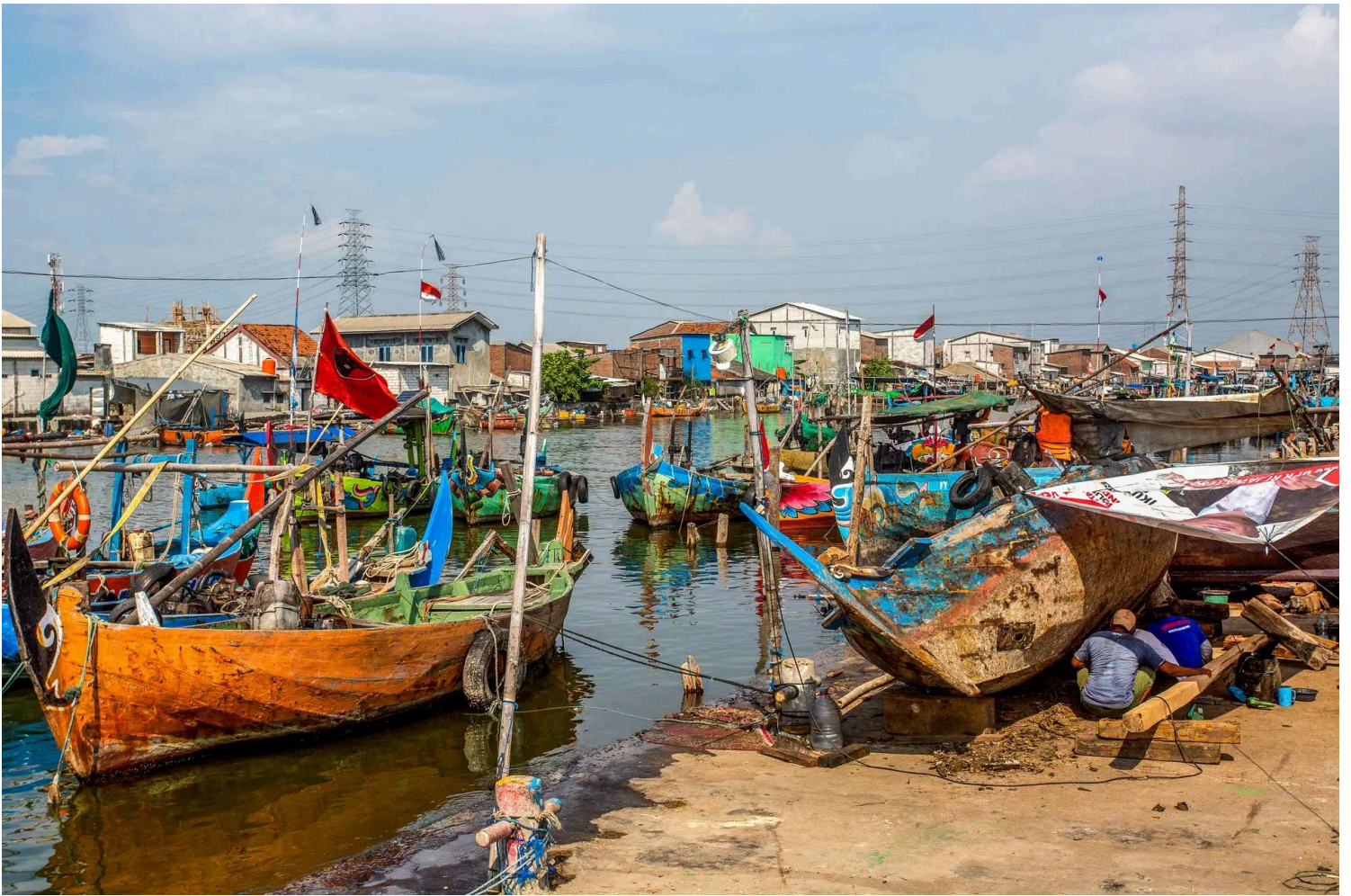
Fishermen anchor their boat next to a seawall that prevents seawater from entering residential areas, in the coastal village of Tambaklorok, in Semarang, Central Java, Indonesia, on June 17, 2025.