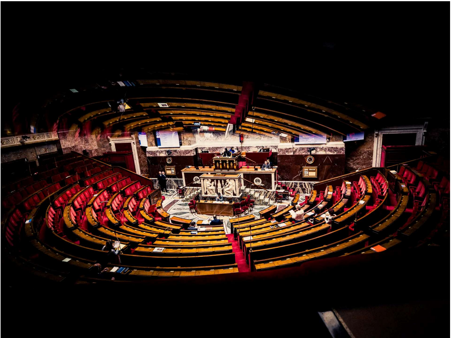
A panoramic view of the benches of the political groups during the public session of oral questions without debate in the hemicycle of the National Assembly in Paris on June 17, 2025.