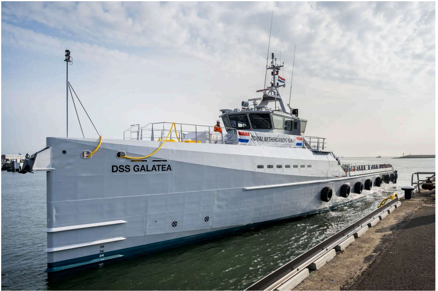
Dutch vessel DSS Galatea, which has recently integrated the Dutch navy fleet to monitor submarine activity in the North sea, enters the port of Den Helder, the Netherlands, on June 18, 2025.

Sign up for the News Alerts newsletter. You'll get the biggest developing stories so you can stay ahead of the game. Sign up with 1-click >>