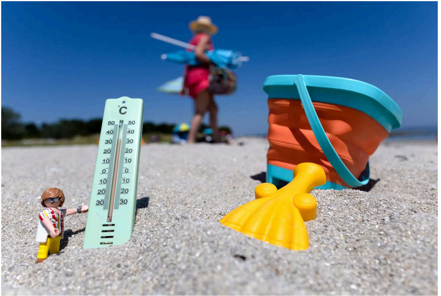
A thermometer indicates a temperature of 35 degrees Celsius (95 degrees Fahrenheit) at the beach of Ile-Tudy in Combrit, France, on June 18, 2025. Temperatures will rise significantly in France in the coming days up to 38 degrees Celsius (100 degrees Fahrenheit) in a heat wave that will reach its peak on June 21, before a cooling expected the following day, France's weather service Meteo-France announced.