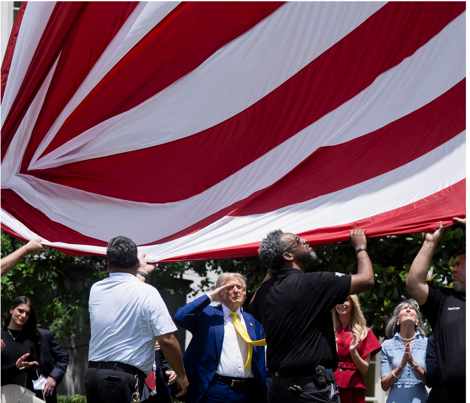
President Donald Trump salutes as a U.S. flag is raised on a newly installed flagpole on the South Lawn of the White House in Washington on June 18, 2025.