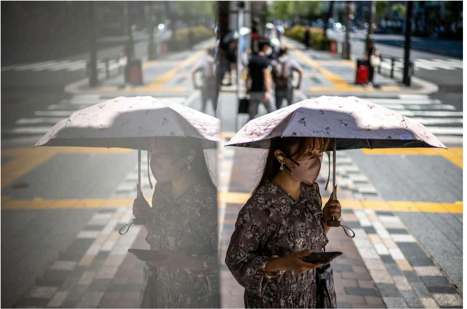
A woman uses an umbrella as a shield from the sun as she walks down a street in the Yurakucho district in Tokyo, where temperatures have topped 34 degrees Celsius (93 degrees Fahrenheit) on June 18, 2025.