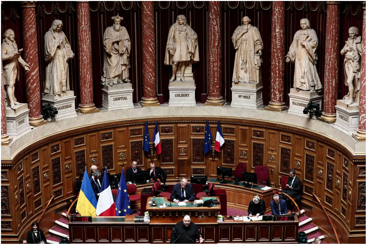
Chairman of the Verkhovna Rada of Ukraine Ruslan Stefanchuk, next to President of the French Senate Gerard Larcher (top), addresses the audience during a session as part of his visit to the French Senate in Paris on June 18, 2025. Ruslan Stefanchouk addressed the French senators with a “Call of June 18,” 85 years after that of General de Gaulle, urging France to “defend Ukraine with as much tenacity as Russia wants to destroy it.”