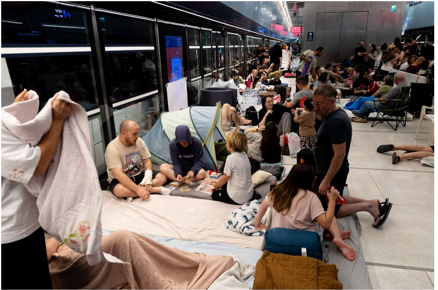
People take cover in an underground train station transformed into a public shelter following reports of an incoming missile fired from Iran, in Ramat Gan, Israel, on June 18, 2025. Iran launched a retaliatory missile strike on Israel starting late on June 13, after a series of Israeli airstrikes earlier in the day targeted Iranian military and nuclear sites, as well as top military officials.