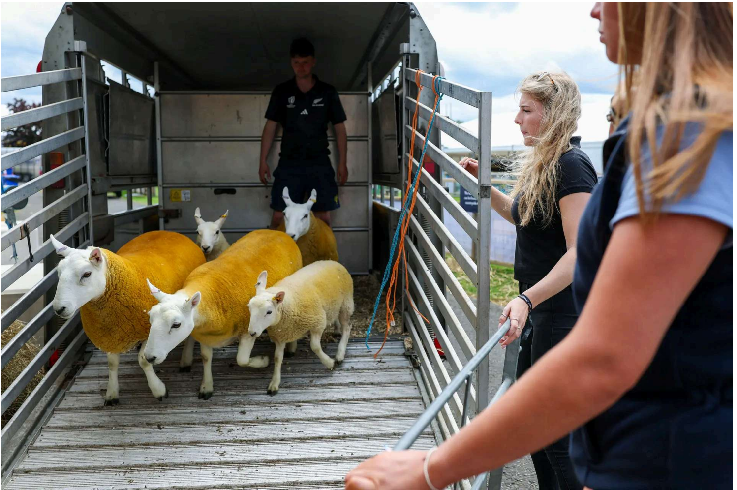
Sheep arrive ahead of the start of the Royal Highland Show in Edinburgh, Scotland, on June 18, 2025. The Royal Highland Show is an annual event showcasing the best of food, farming, and rural life from the Highlands of Scotland. This year's show takes place from June 19 to 22.