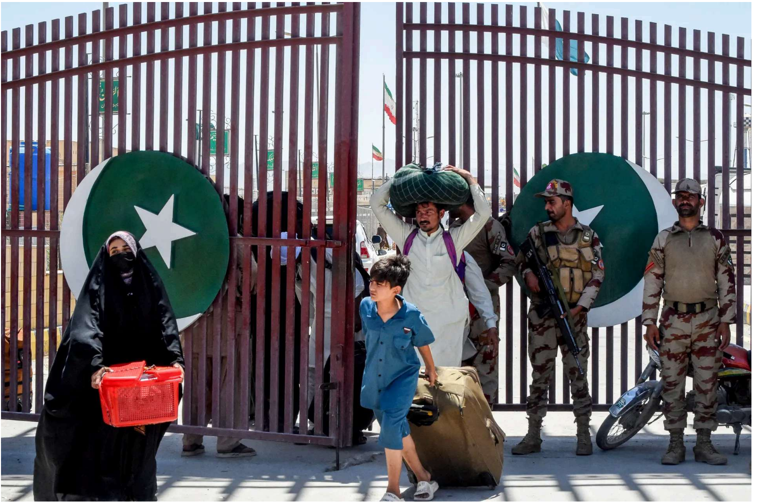
Pakistani pilgrims evacuated from Iran walk across the Pakistan-Iran border at Taftan, Balochistan province on June 18, 2025, amid the ongoing conflict between Israel and Iran. Pakistan has closed all its border crossings with neighboring Iran for an indefinite period, provincial officials said on June 16, as Israel and Iran trade intense strikes and threaten further attacks.