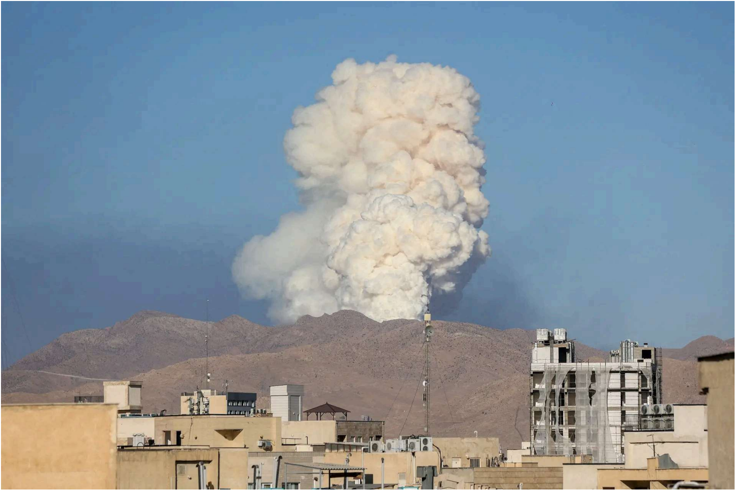
Smoke rises following an Israeli attack in Tehran, Iran, on June 18, 2025.