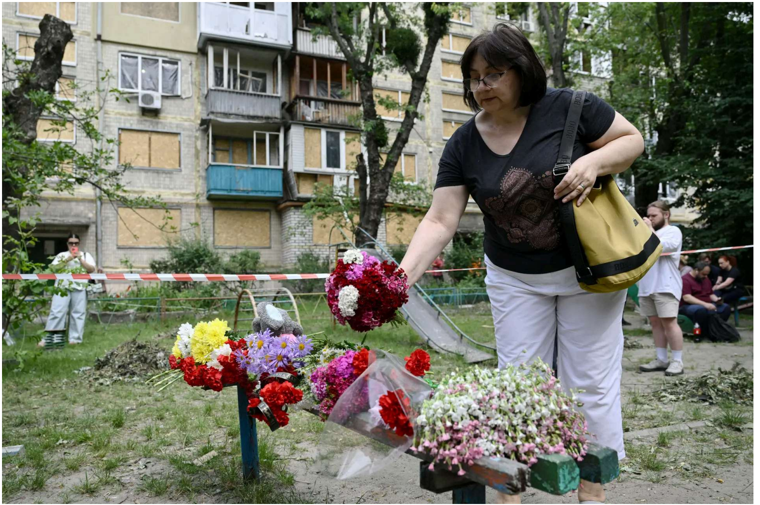
A woman lays flowers on a bench at a playground close to a residential building, heavily damaged following a Russian missile strike the previous day, in Kyiv on June 18, 2025, amid the Russian invasion of Ukraine. Rescuers in Kyiv said on June 18 that the death toll from a major Russian attack on Ukraine's capital the previous day had risen to 21, with more than 130 people wounded.