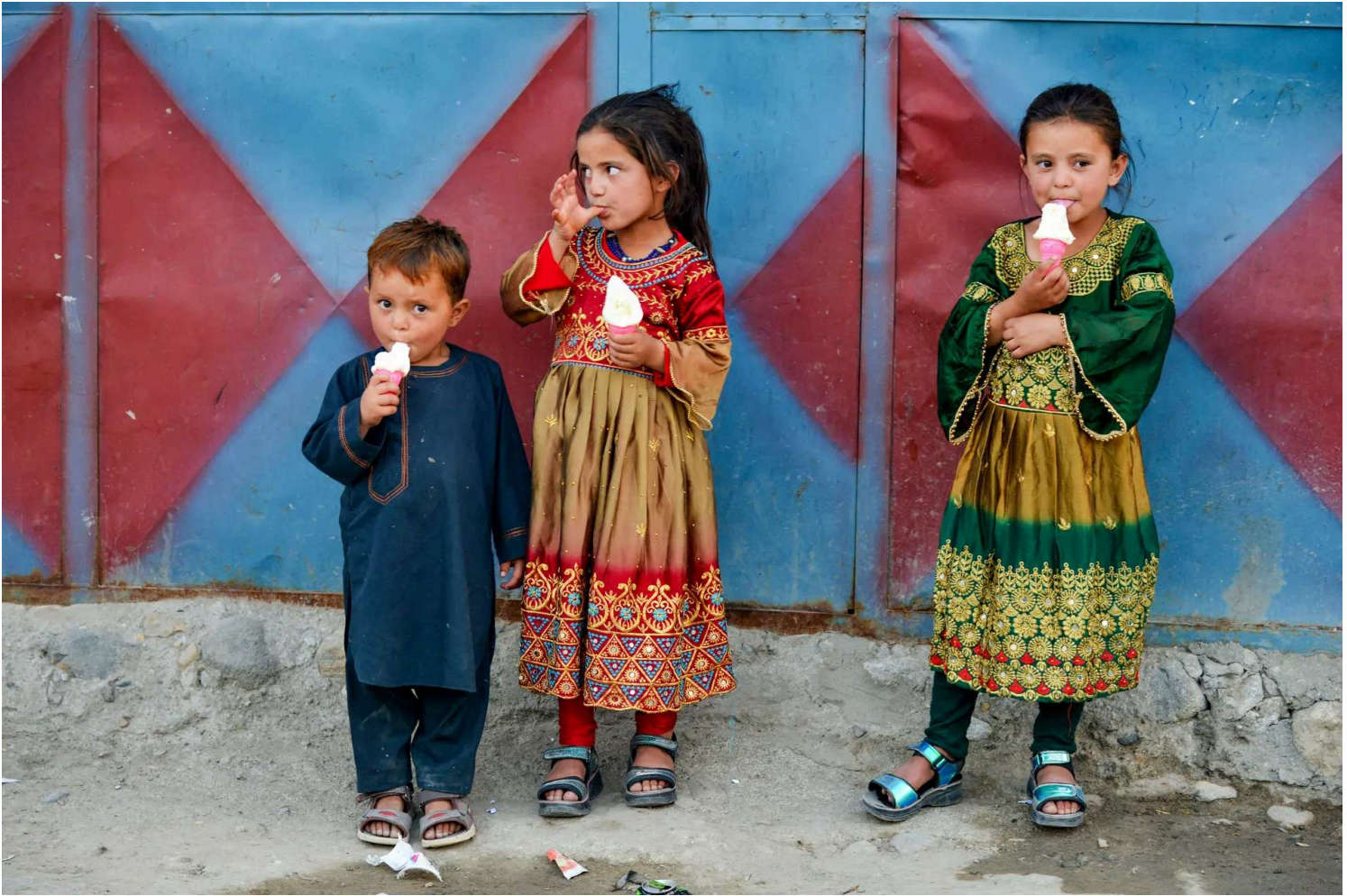
Afghan children eat ice cream at Baharak district in Badakhshan province on June 18, 2025.