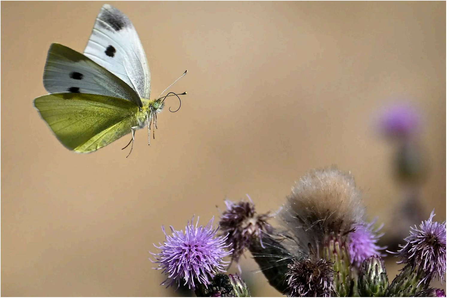
A Pieris rapae butterfly flies through a field in Soultz-Haut-Rhin, France, on June 18, 2025.