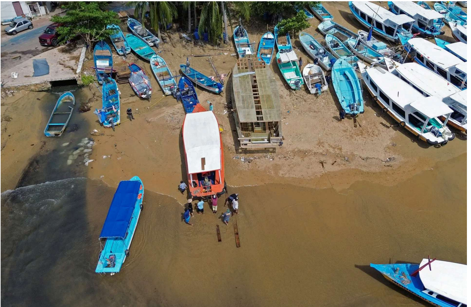
A boat is taken out from the sea as preparations are made for the arrival of Hurricane Erick at Manzanillo Beach in Acapulco, Guerrero State, Mexico, on June 18, 2025. Storm Erick has strengthened to a Category 2 hurricane as it races towards Mexico's Pacific coast, the U.S. National Hurricane Center said.