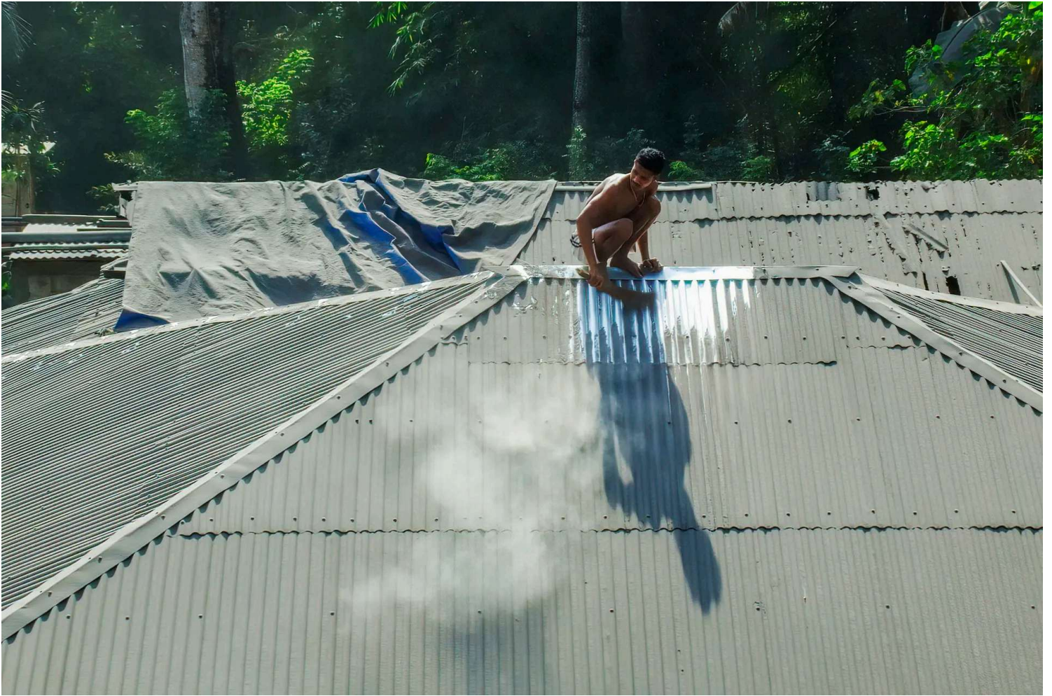
A villager cleans the roof of his home from volcanic ash a day after Mount Lewotobi Laki-Laki spewed ashes more than 10 kilometers (six miles) into the air in Sikka in East Nusa Tenggara, Indonesia, on June 18, 2025.