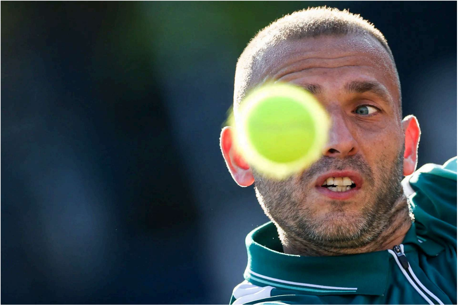
Britain's Daniel Evans eyes the ball as he plays a backhand return to Brandon Nakashima of the U.S. during their men's singles round of 16 tennis match at the HSBC ATP tennis Championships at Queen's Club in west London, on June 18, 2025.