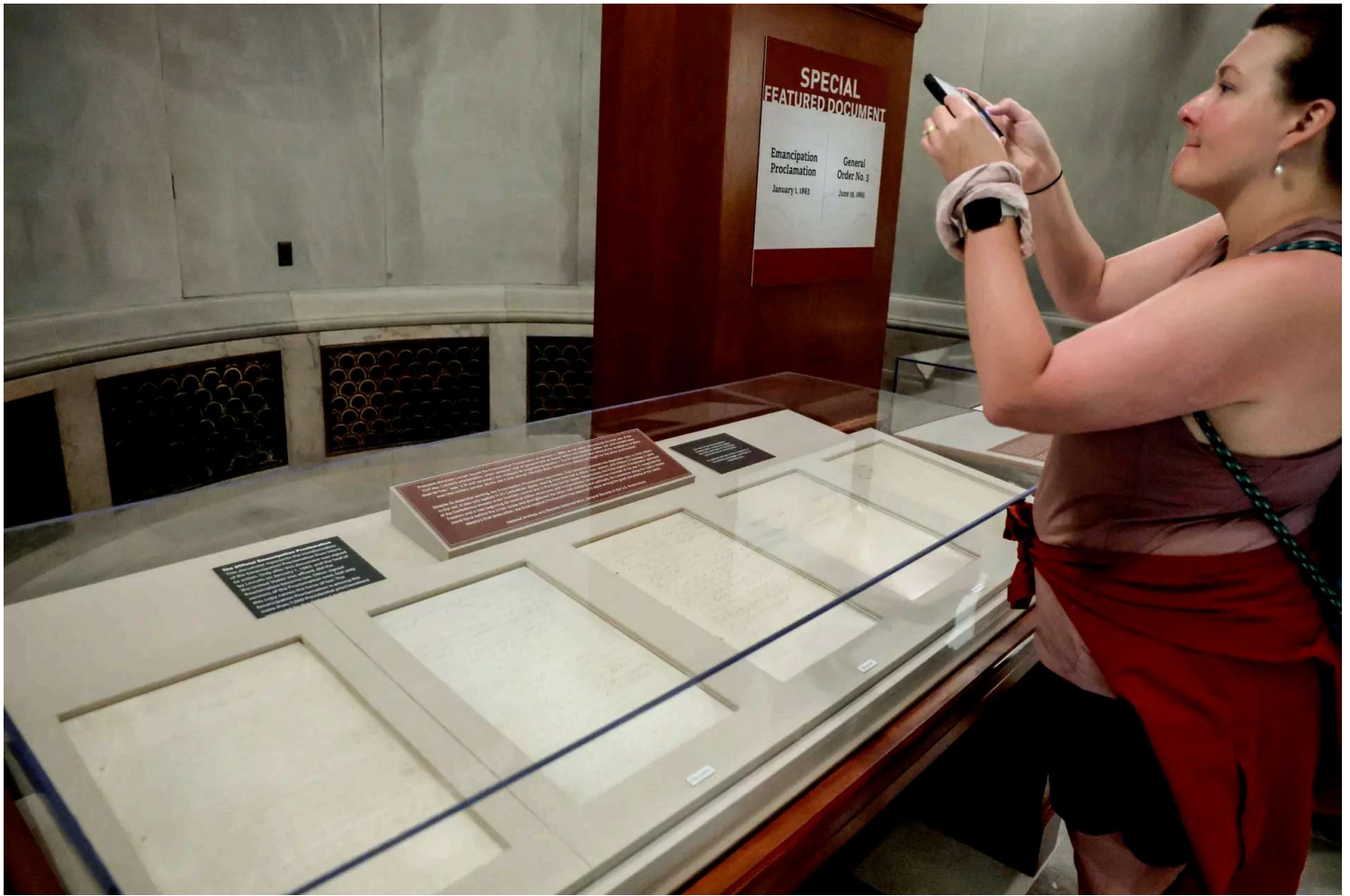
People view the Emancipation Proclamation at the National Archives in Washington on June 19, 2025. The documents are displayed to the public for only three days a year.

Sign up for the News Alerts newsletter. You'll get the biggest developing stories so you can stay ahead of the game. Sign up with 1-click >>