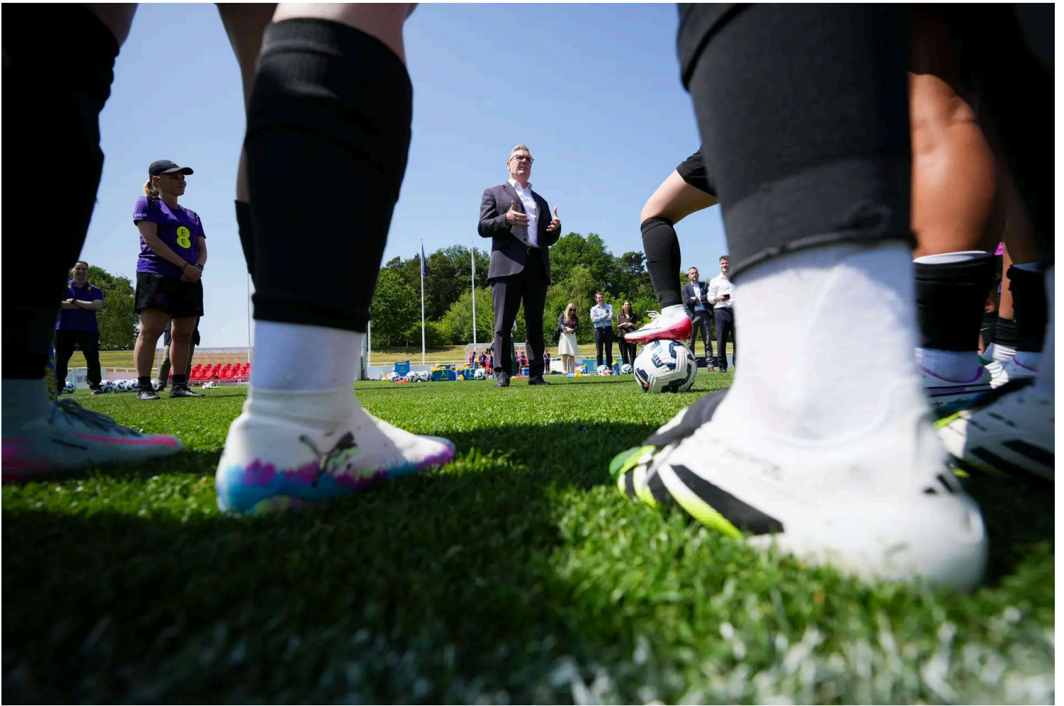
British Prime Minister Sir Keir Starmer meets with the England Women's football team, the Lionesses, where he set out new plans to give every child across the country equal access to high quality PE and sports at St George's Park in Staffordshire, England, on June 19, 2025.