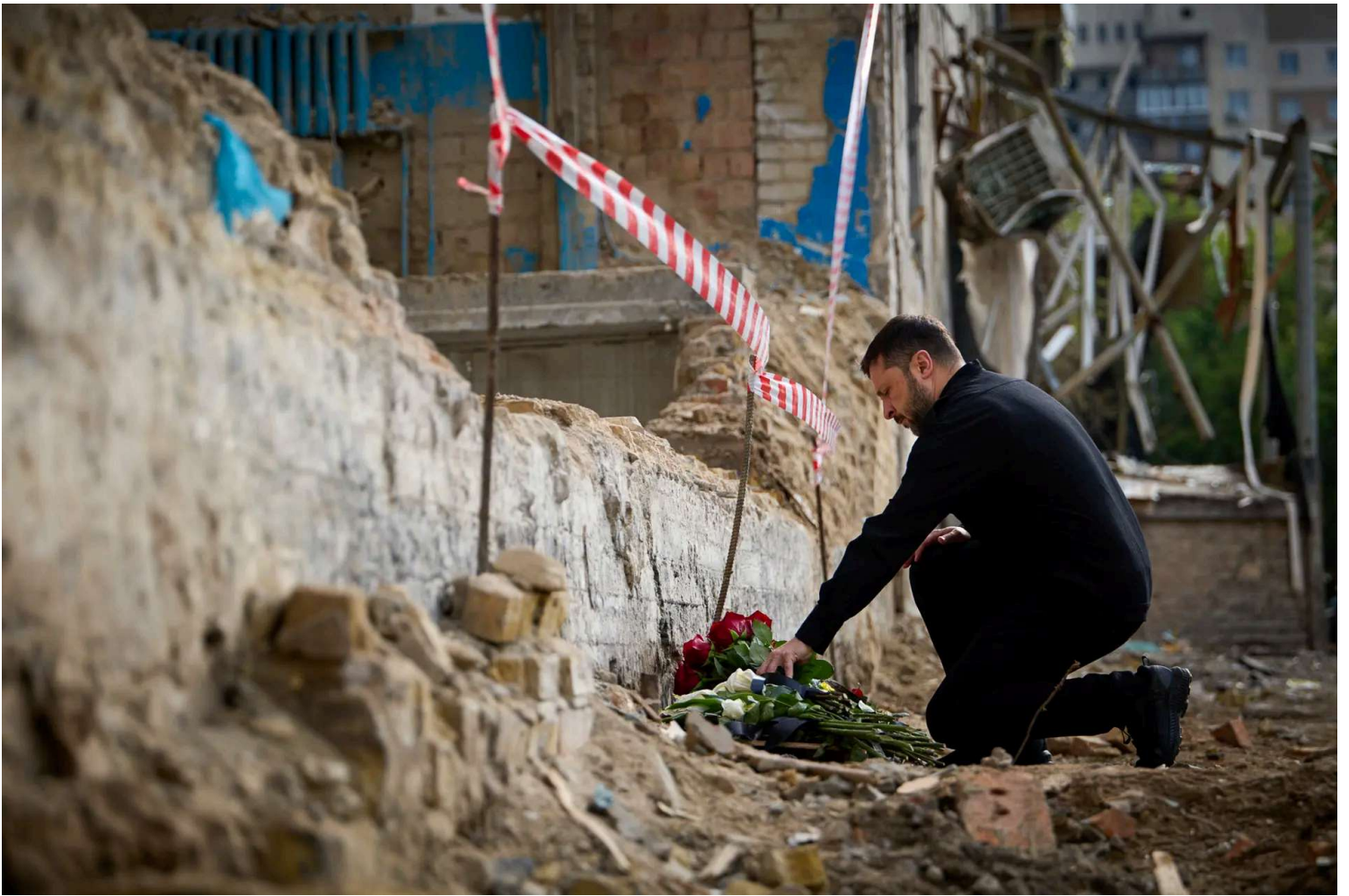
Ukrainian President Volodymyr Zelenskyy lays flowers at the site of Russia's deadly missile attack Tuesday that ruined a multistory residential building, in Kyiv, Ukraine, on June 19, 2025.