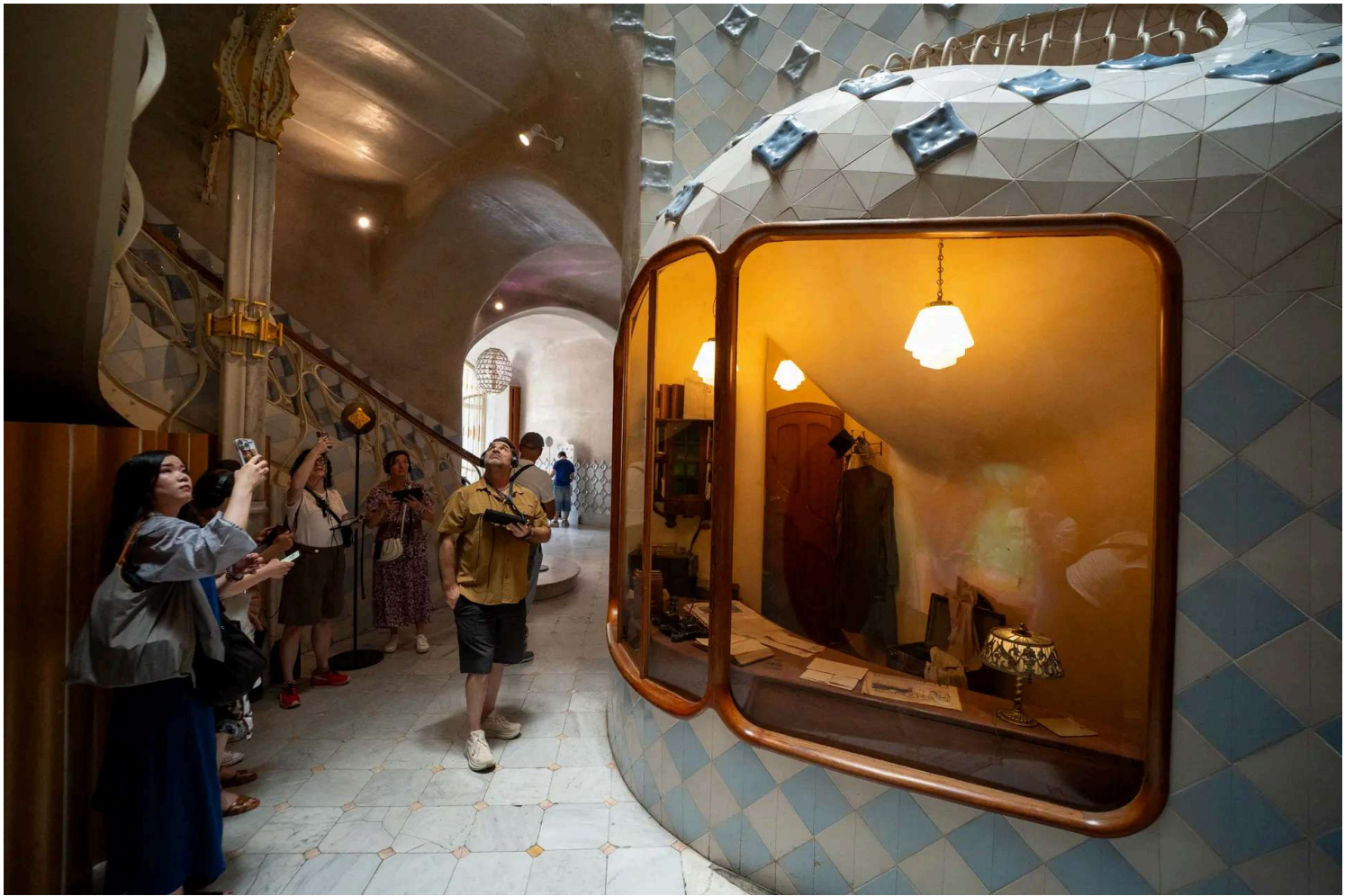
Visitors admire the interior of Casa Batlló during the official opening of the building's newly restored back facade, following recent renovation works, in Barcelona, on June 19, 2025. Barcelona's iconic Casa Batlló has unveiled the restored rear facade and main garden, which have been returned to their original Gaudi-era appearance after years of damage from pollution and previous alterations. The renovation recovers key elements of the building's modernist identity, staying faithful to the architect's original version.