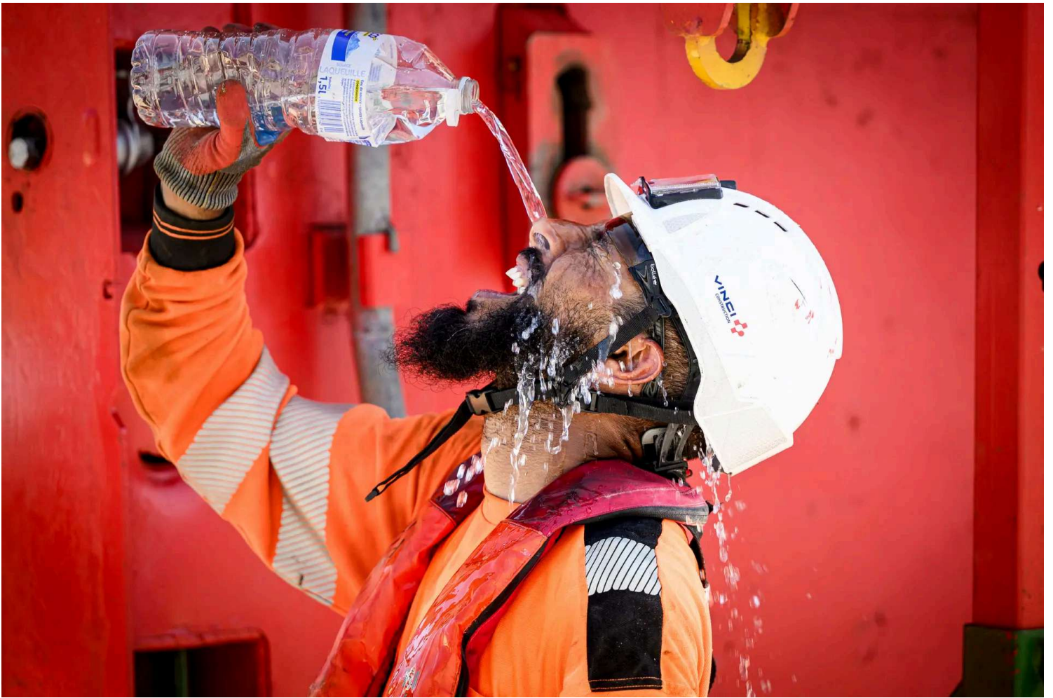
A worker cools off at a construction site as a heatwave hits Nantes, France, on June 19, 2025.