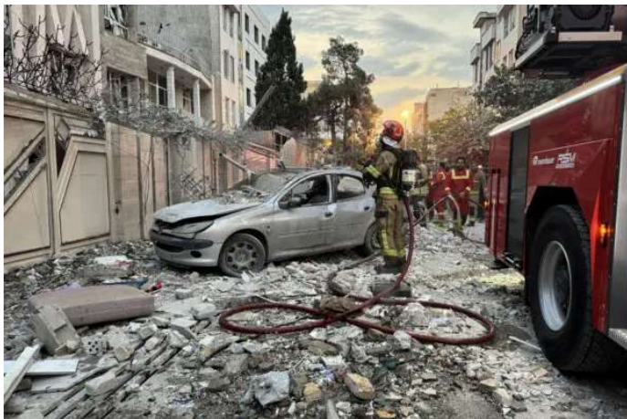
Day in Photos: Israel Attacks Iran, Military Parade Preparations in Washington, India Mourns Plane Crash