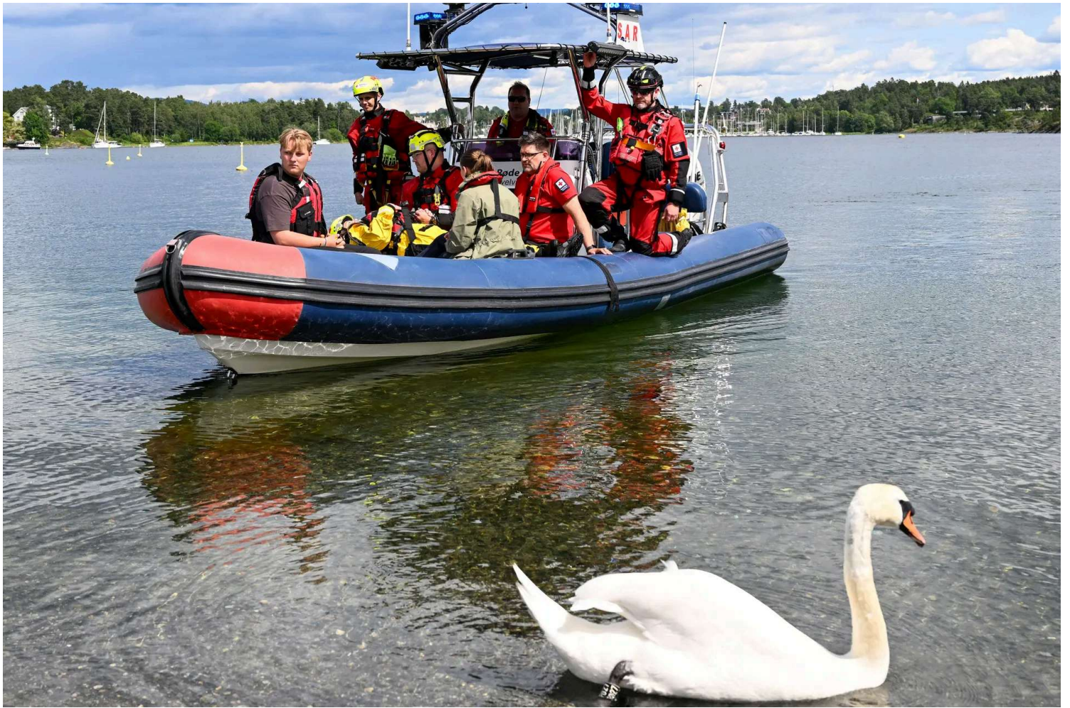
Norwegian Princess Ingrid Alexandra and Prince Sverre Magnus take part in a lifesaving exercise during their visit to the Red Cross Summer Emergency Response Unit at Kadettangen in Sandvika, Norway, on June 19, 2025.