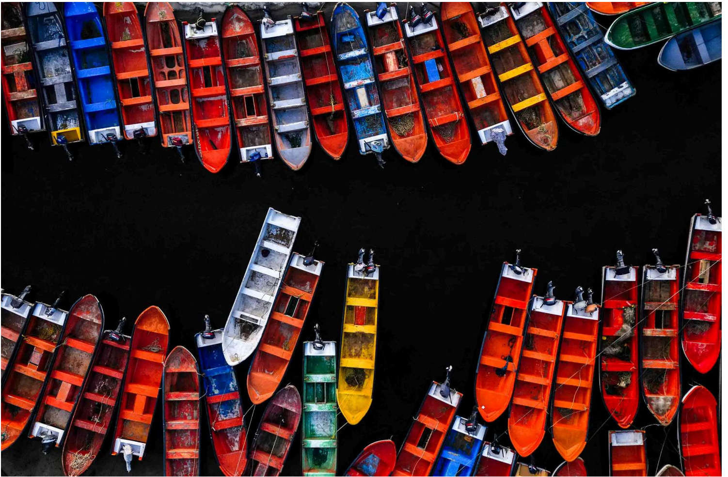
Fishing boats at the Chuao beach, state of Aragua, Venezuela, on June 18, 2025.