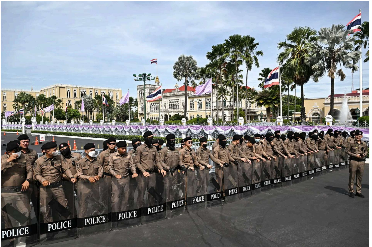
Thai police stand outside the Government House in Bangkok in anticipation of Thai royalists protesting to call for the government's resignation, on June 19, 2025. Thai Prime Minister Paetongtarn Shinawatra faced mounting calls to resign on June 19 after a leaked phone call she had with former Cambodian leader Hun Sen provoked widespread anger and a key coalition partner to quit.