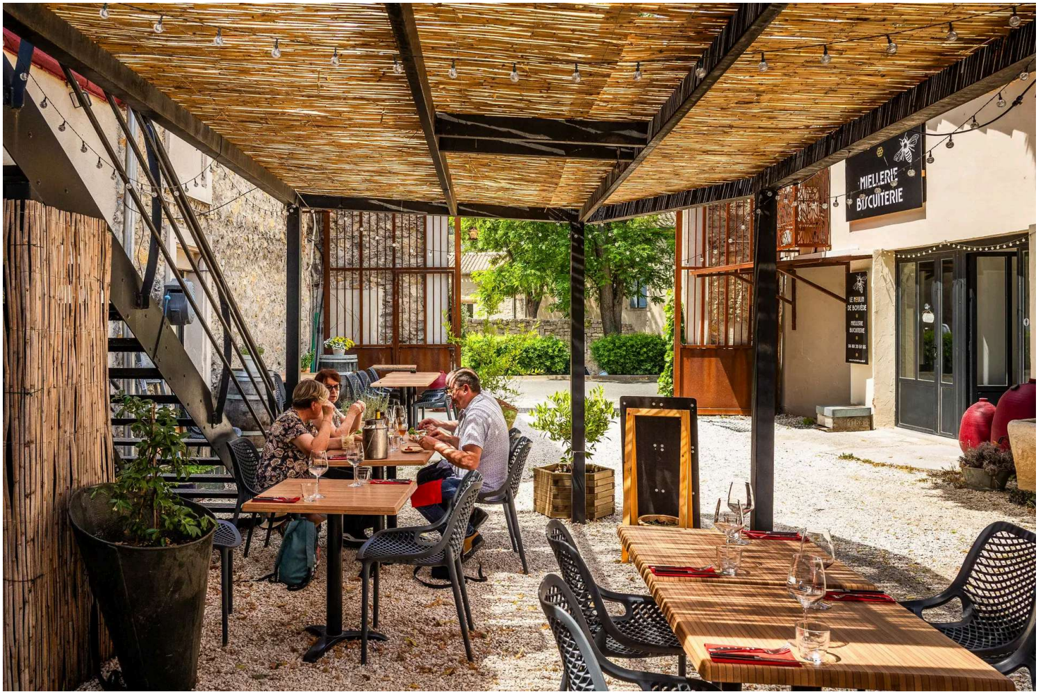
Two couples lunch on the terrace of La Basse Cours restaurant in the Cour des Saveurs, in Lagrasse in the department of Aude in the south of France, on June 19, 2025.