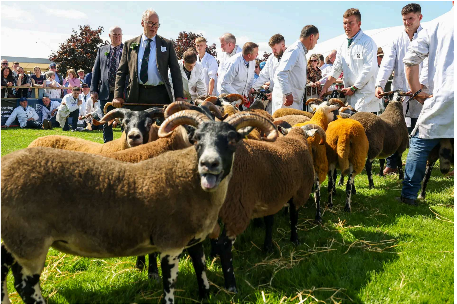
Blackface sheep are judged on the first day of the Royal Highland Show in Edinburgh, Scotland, on June 19, 2025. The event showcases the best of food, farming, and rural life from the Highlands of Scotland. This year's show takes place from June 19 to 22.