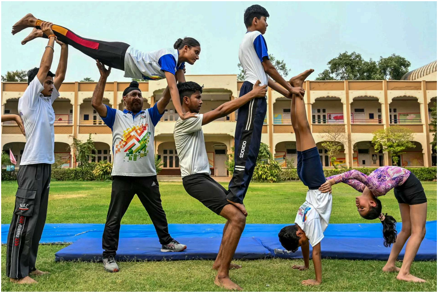
Yoga enthusiasts perform during a rehearsal for an event ahead of the International Day of Yoga in Amritsar, India, on June 19, 2025.