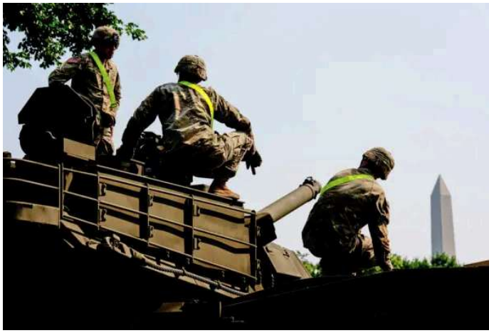
Day in Photos: U.S. Military Parade Preparations, Dad Strike, and Princess in Brazil