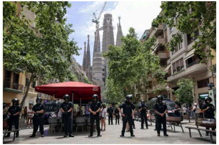
Day in Photos: Protests in Spain, First Veterans Day in Germany, Iran-Israel Strikes Continue