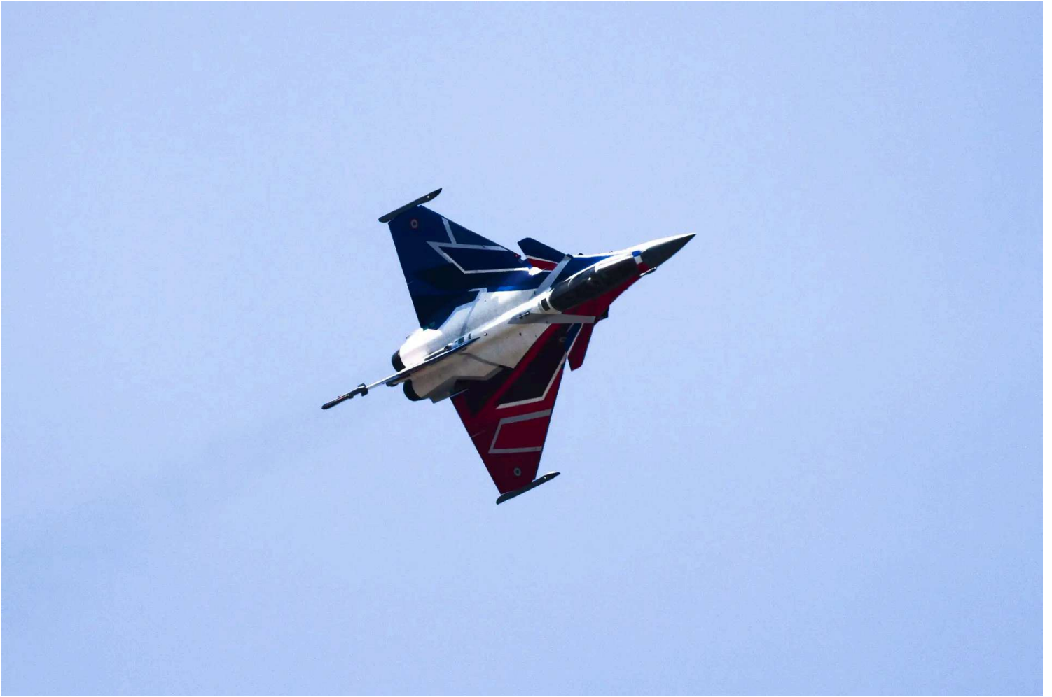
A French Air Force Dassault Rafale fighter jet performs a flight demonstration as part of the 55th edition of the International Paris Air Show at the Paris-Le Bourget Airport north of Paris on June 19, 2025.