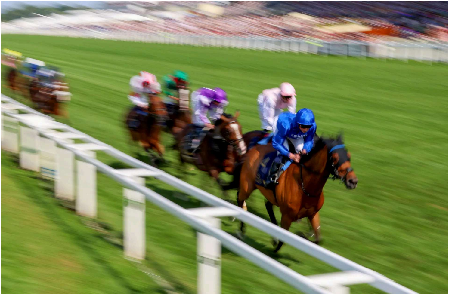
William Buick riding Trawlerman wins The Gold Cup on Day 3 during Royal Ascot 2025 at Ascot Racecourse in Ascot, England, on June 19, 2025.