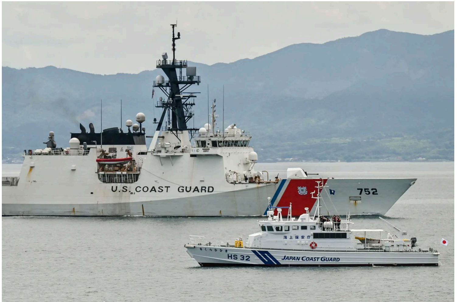
The United States Coast Guard ship Cutter Stratton (L) sails past a smaller Japanese coast guard support ship during exercises in the waters around the southern city of Kagoshima, Japan, on June 20, 2025. The joint exercises with the United States and the Philippines are seen as a show of unity against Chinese activity in disputed regional waters.