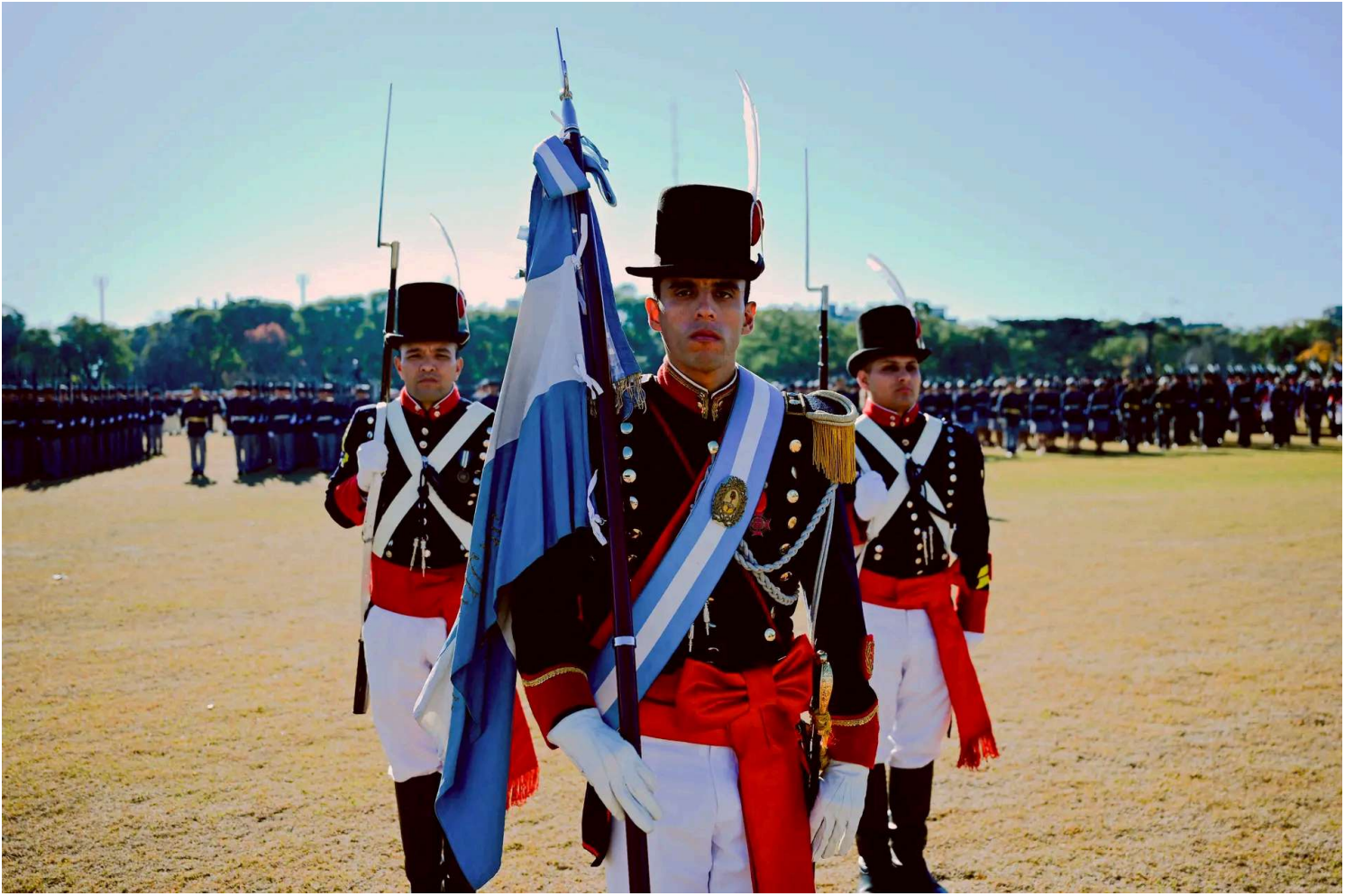
Argentine soldiers attend the Flag Day commemoration at the Argentine Polo Field in Buenos Aires on June 20, 2025.