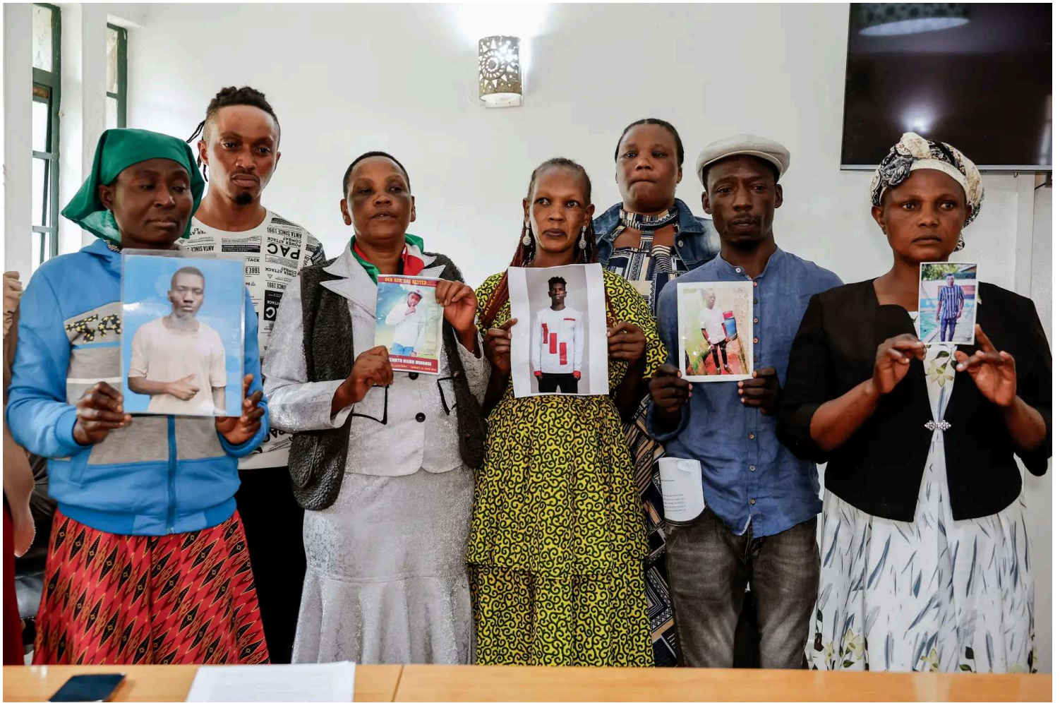
Family members hold photos of the victims of last year's Gen Z protest after addressing the media in Nairobi on June 20, 2025, ahead of the first anniversary of the protest on June 25. Families and lawyers on Friday urged Kenyan police and politicians to allow a peaceful march in memory of those killed during mass protests last year. The East African country has seen violent clashes between protesters, paid agitators, and the police in the run-up to the anniversary of the Gen Z-led demonstrations. Those rallies peaked on June 25, 2024, when protesters stormed parliament, angry over proposed tax rises and corruption, and were met with live fire from security forces.