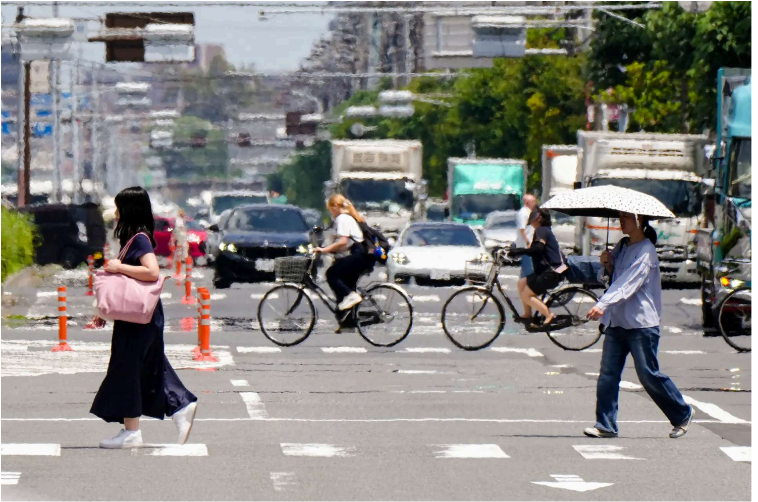
People cross a street under the hot sun in Tokyo on June 20, 2025.