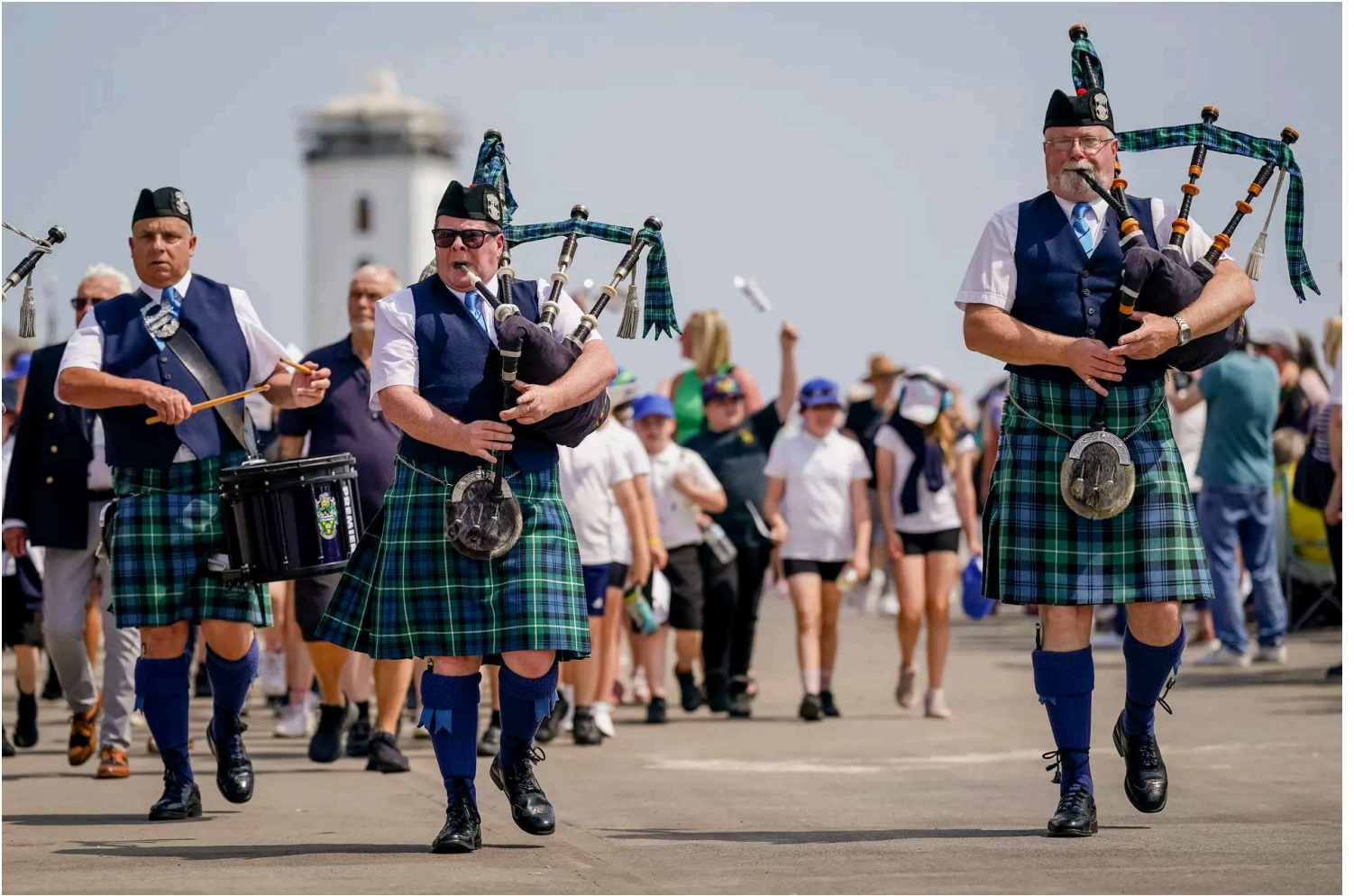
Bagpipers lead a procession of 300 school children along the Fish Quay during the Parade of Boats in North Shields, England, on June 20, 2025. The town is hosting a year of celebrations for its 800th anniversary.