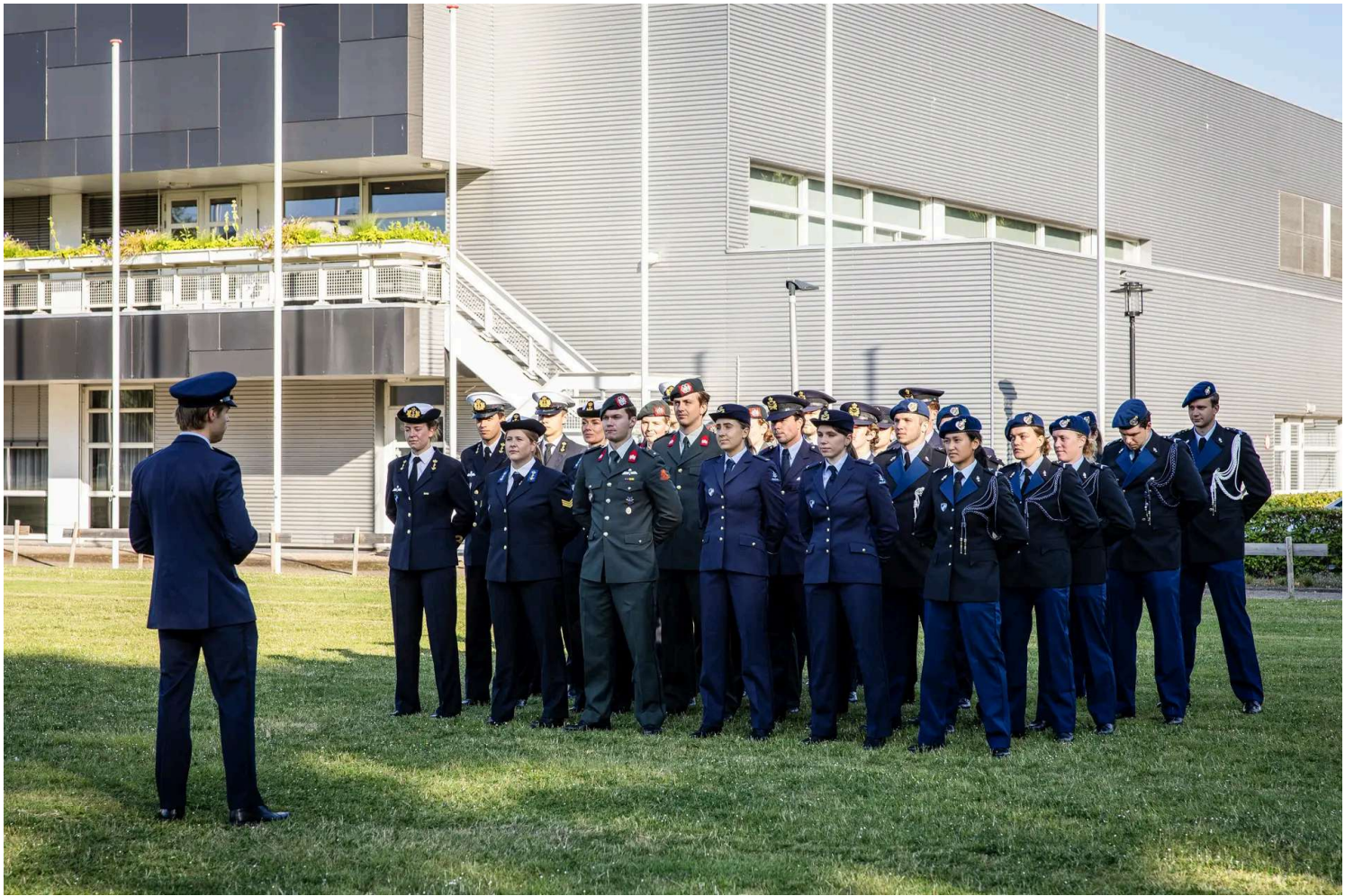
Cadets from the Defensity College—the work-study program of the Netherlands' Ministry of Defense—stand in formation during training ahead of the NATO Summit next week at the World Forum in The Hague, in Amsterdam, on June 20, 2025.