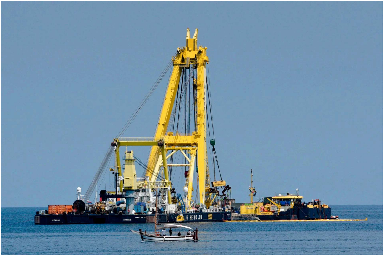
Crane ships raise the superyacht Bayesian, which sank off Sicily last year, killing British tech tycoon Mike Lynch, his teenage daughter, and five others, near Palermo, on June 20, 2025. The yacht was struck by a pre-dawn storm in August last year while at anchor. It sank within minutes.