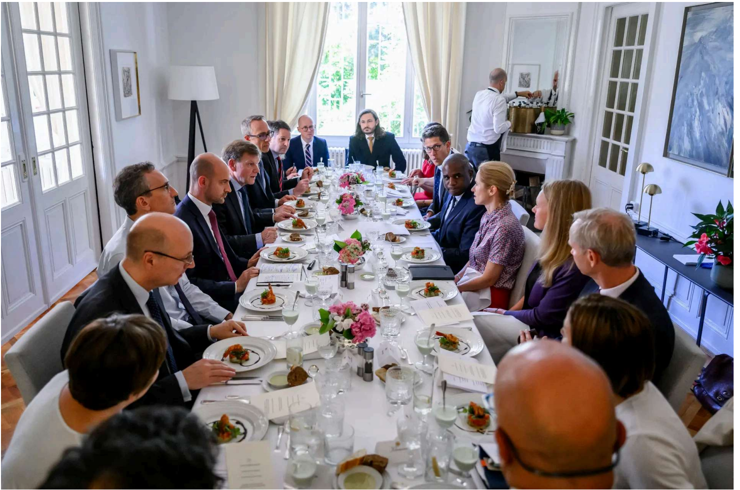
French Minister for Europe and Foreign Affairs Jean-Noel Barrot (4th L), British Foreign Secretary David Lammy (6th R), German Foreign Minister Johann Wadephul (5th L), and EU High Representative for Foreign Affairs and Security Policy Kaja Kallas (5th R) attend a working lunch at the offices of the honorary Consul of the Federal Republic of Germany, during a meeting of European Foreign Ministers, as European countries call for de-escalation of tensions after Israeli bombings aimed at breaking Iran's nuclear program, in Geneva, on June 20, 2025.