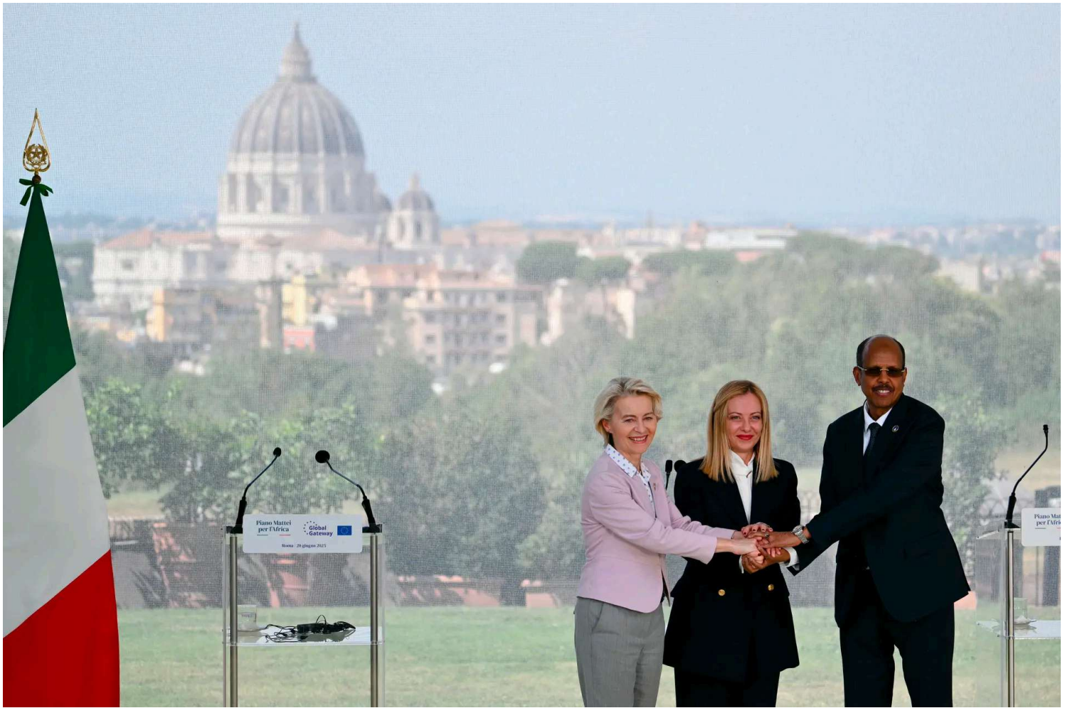
Italian Prime Minister Giorgia Meloni (C) poses with European Commission President Ursula von der Leyen and African Union Commission Chairperson Mahmoud Ali Youssouf at the end of 'The Mattei Plan for Africa and the Global Gateway: A common effort with the African Continent' summit, at Villa Doria Pamphili in Rome on June 20, 2025.