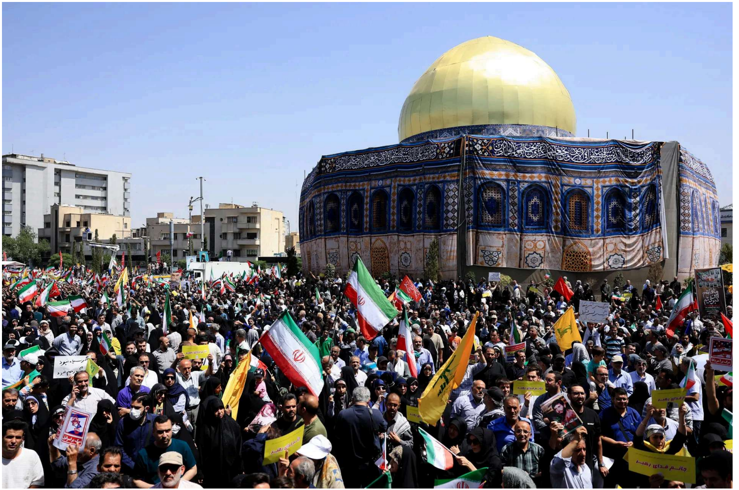
Iranians wave the Iranian flag and chant slogans next to a replica of the Dome of the Rock mosque during an anti-Israeli rally in Tehran, Iran, on June 20, 2025. Israel and Iran exchanged fire again on June 20, a week into the war between the longtime enemies.