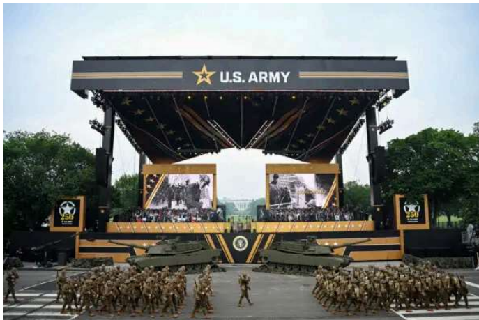
Day in Photos: Army's 250th Birthday Parade, Ivory Coast Protests, and Srinagar Views