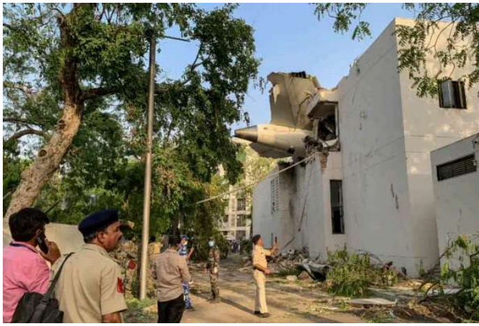
Day in Photos: India Plane Crash, London's Personalized Museum, and Flooding in San Antonio