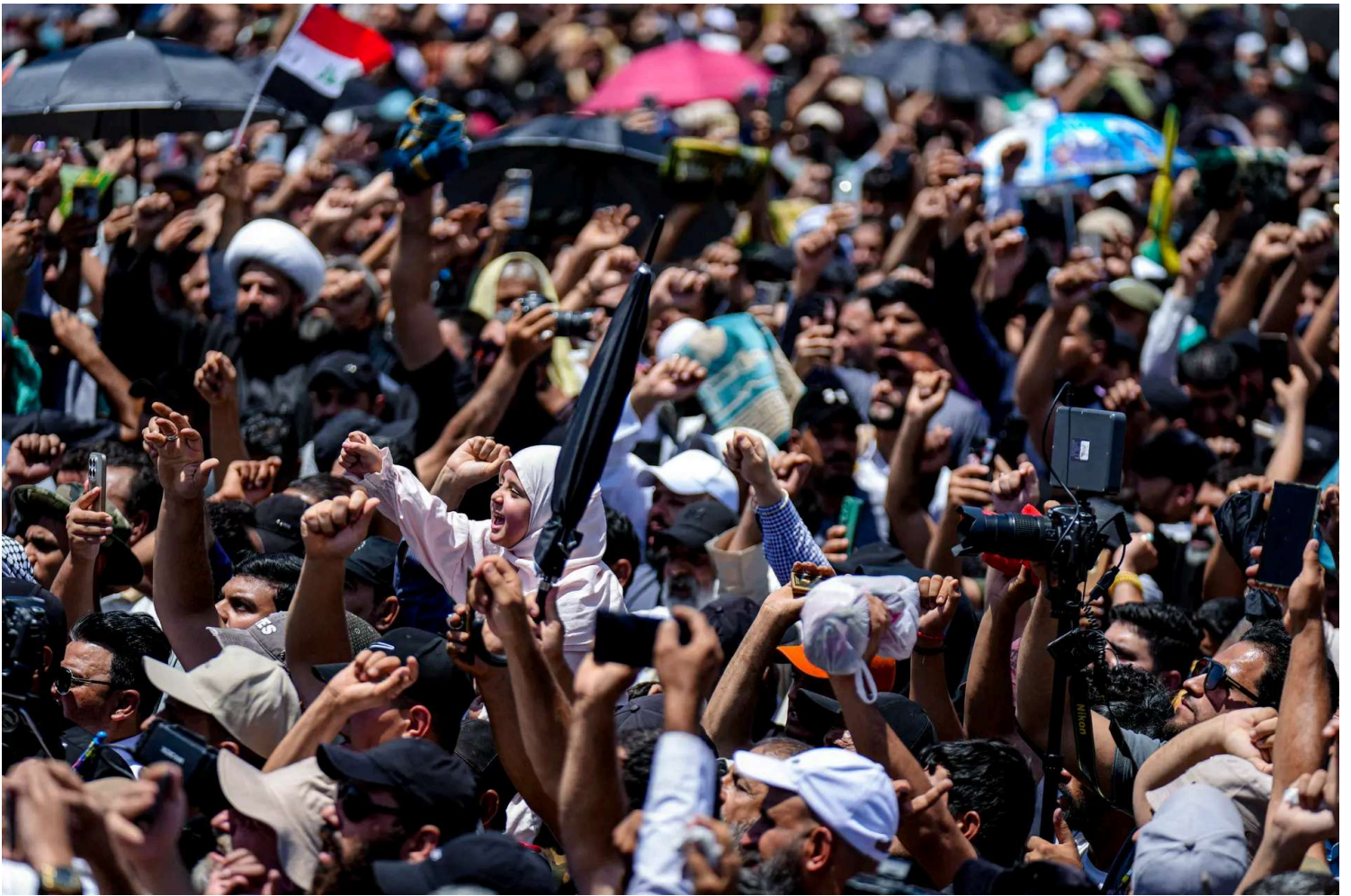
Supporters of Iraqi Shiite Muslim cleric Muqtada al-Sadr protest Israel's strikes on Iran, following Friday noon prayers in the Baghdad suburb of Sadr City, on June 20, 2025.