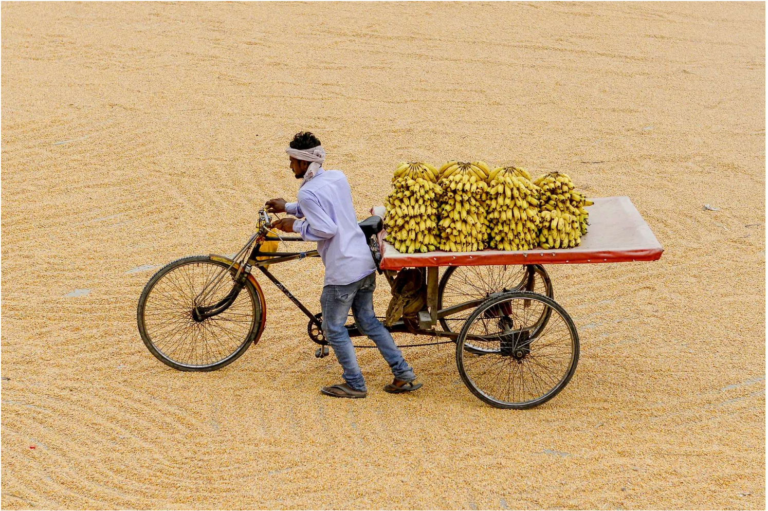
A vendor pulls a cart loaded with bananas through scattered maize for drying at a wholesale grain market in Jalandhar, in India's state of Punjab, on June 20, 2025.