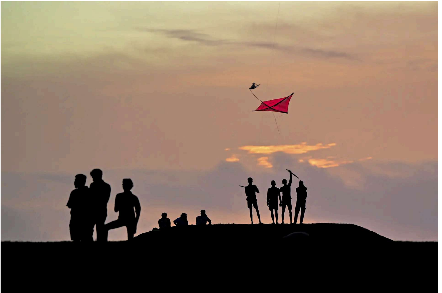
Boys fly a kite as tourists visit Galle Fort during sunset in Galle, Sri Lanka, on June 20, 2025.