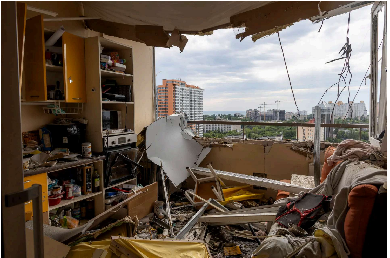
An apartment kitchen in a damaged residential high-rise building following a Russian drone attack in Odesa, Ukraine, on June 20, 2025.