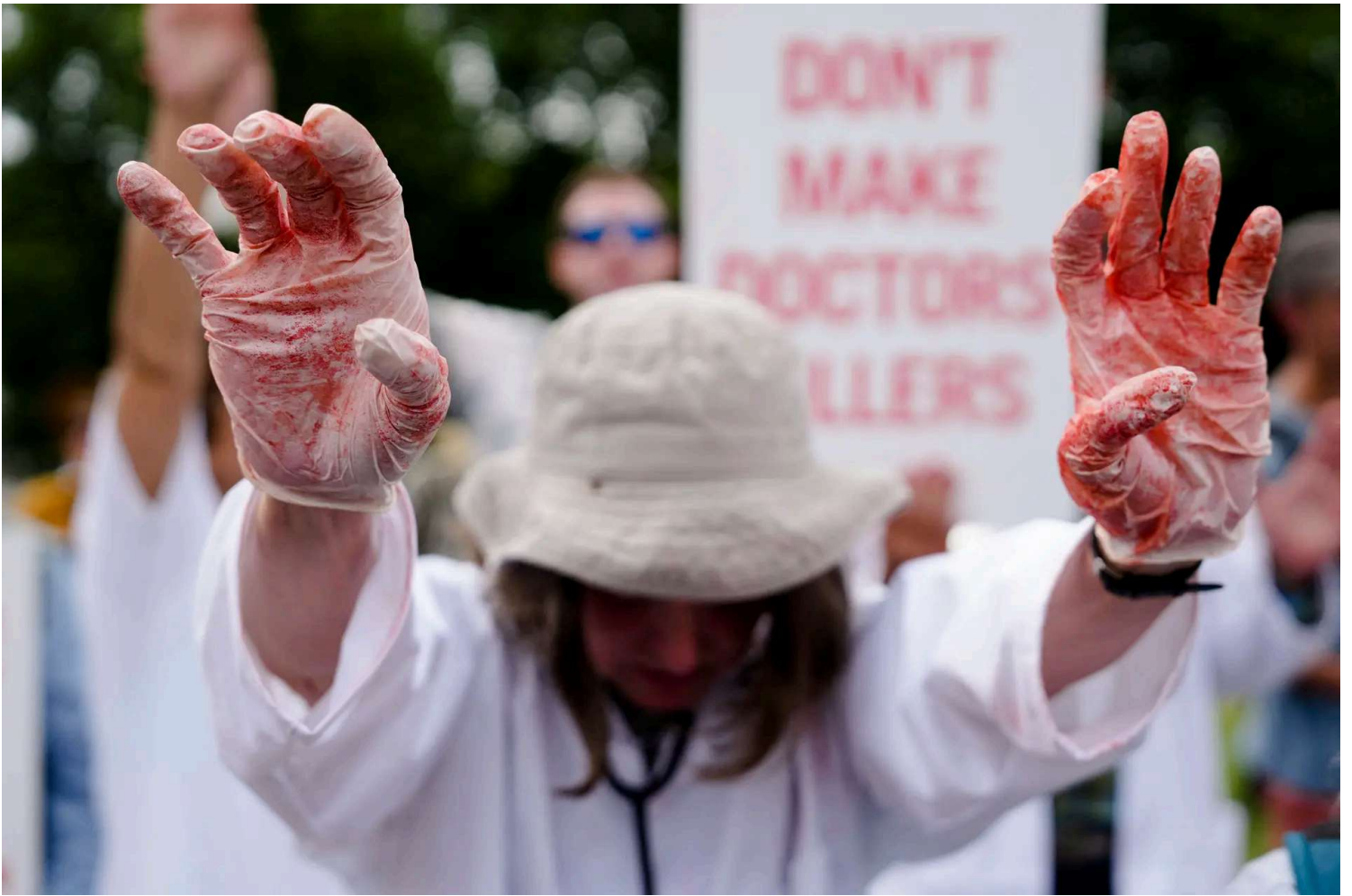
Protesters against a change in the law on assisted suicide hold placards during a demonstration outside the Palace of Westminster, home to the Houses of Parliament, as MPs hold a knife-edge vote on whether to allow assisted suicide for terminally ill people, in London on June 20, 2025.