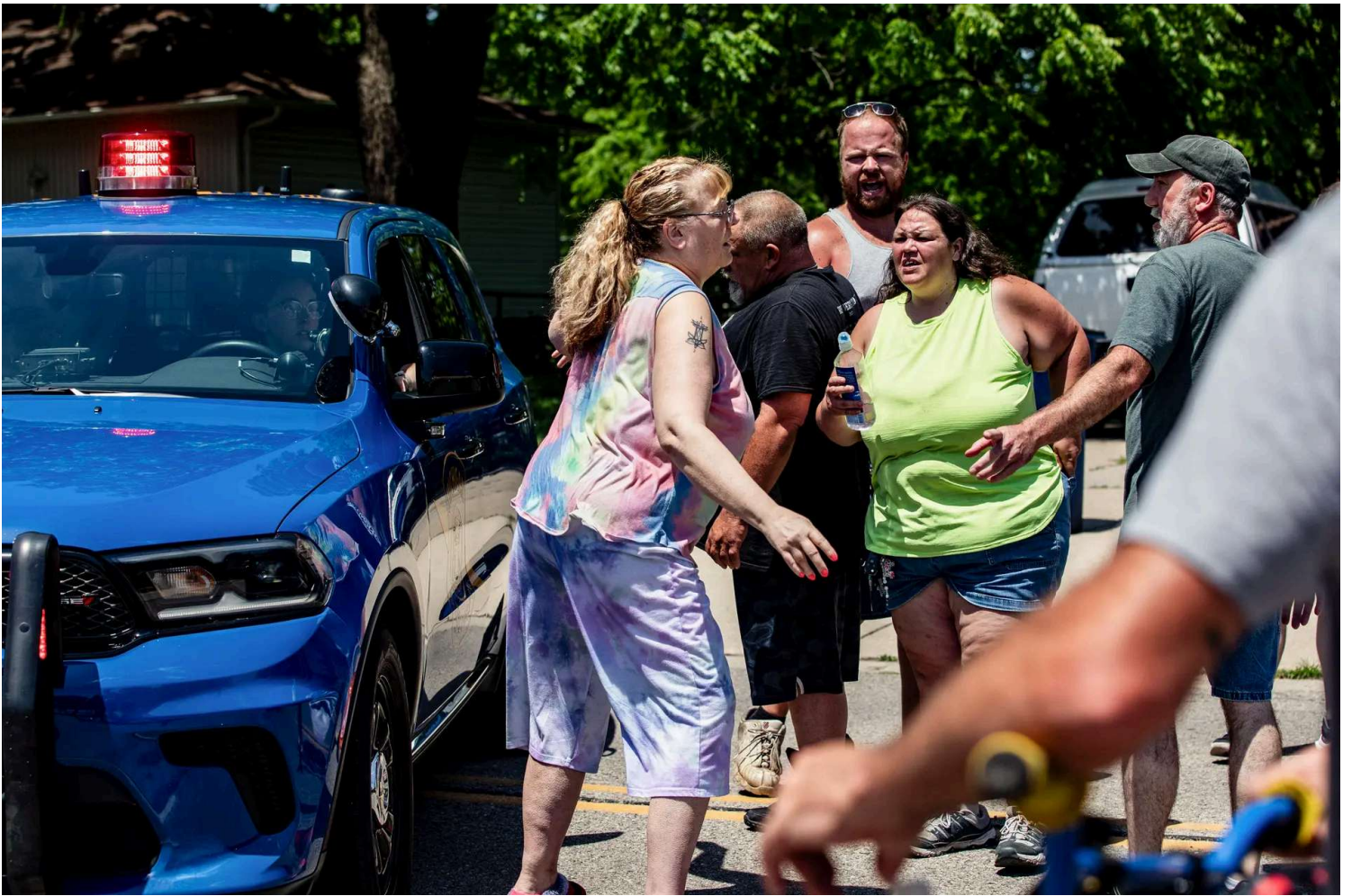
A woman asks a police officer where she can find out more information about her loved ones at the scene of a shooting at CrossPointe Community Church in Wayne, Mich., on June 22, 2025. Police report that a shooting suspect was fatally shot by a security guard after opening fire at the church and injuring one person injured.