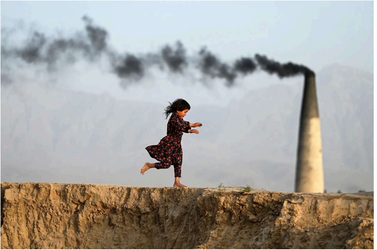
A girl runs across a brick kiln on the outskirts of Mazar-i-Sharif, Afghanistan, on June 22, 2025.