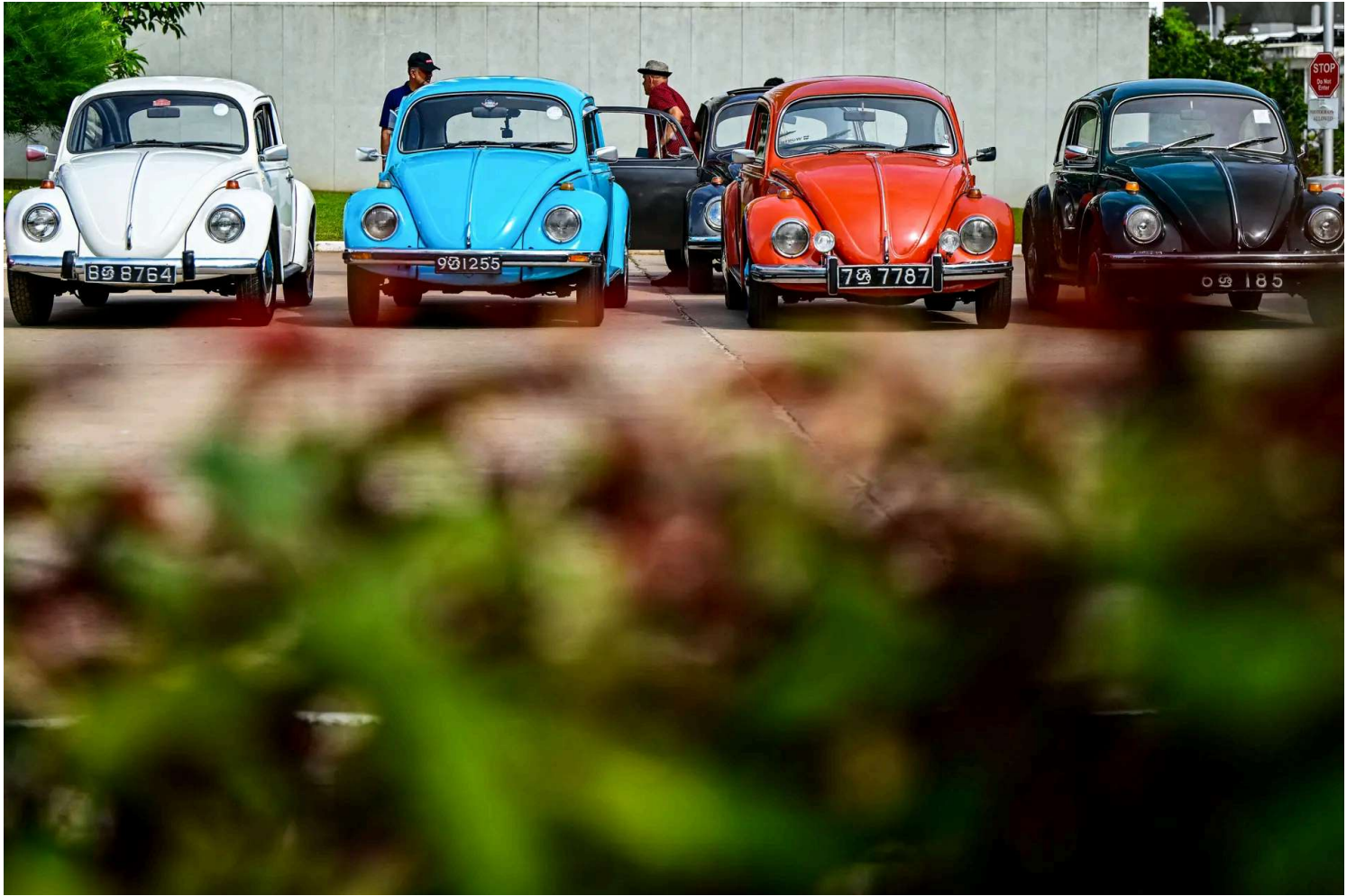
Vintage Volkswagen Beetles are parked outside the Bandaranaike Memorial International Conference Hall during celebrations to mark World Volkswagen Day in Colombo, Sri Lanka, on June 22, 2025.