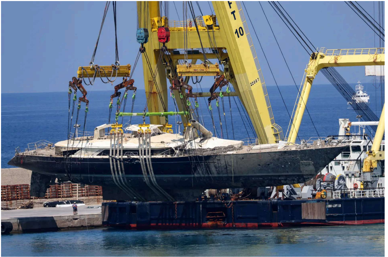
A crane ship raises the wreck of the superyacht Bayesian, which sank off Sicily on Aug. 19, 2024, off Porticello, in Termini Imerese Italy, on June 22, 2025.