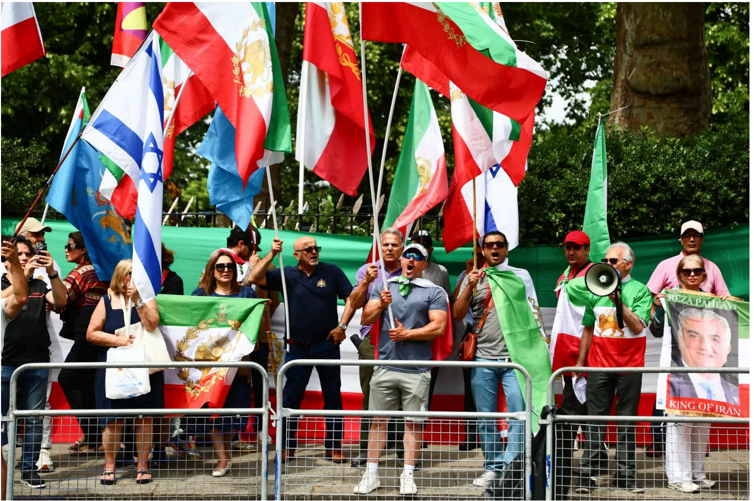
People protest outside the Iranian Embassy in London on June 22, 2025. Police had imposed restrictions on gatherings outside the embassy until Sunday afternoon, following violent clashes that broke out nearby on Friday night among what is believed to have been both pro- and anti-Iranian regime groups of demonstrators. Eight Iranian nationals were arrested in connection with the incident.