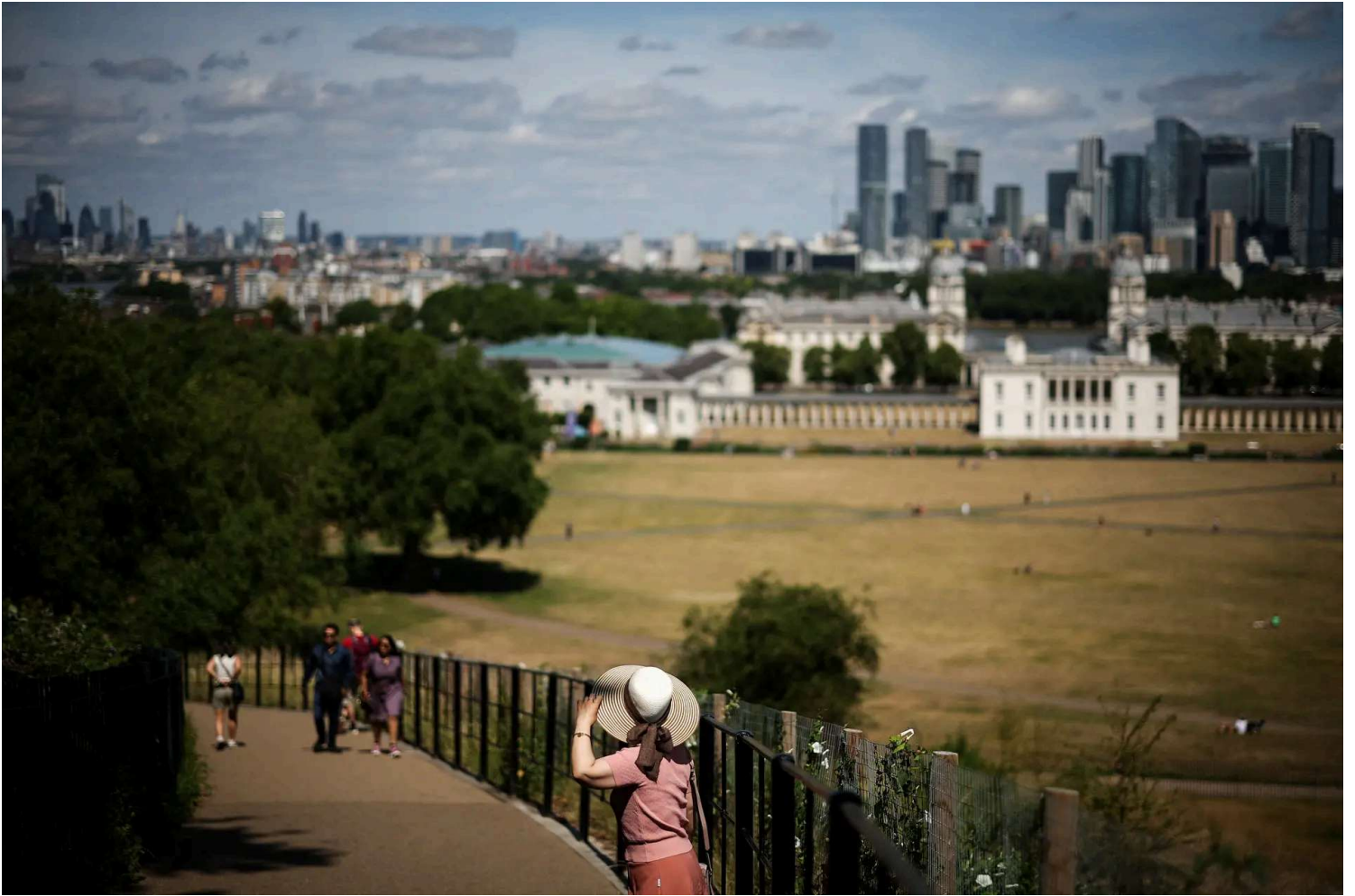
People enjoy warm weather and sun at Greenwich Park in front of the National Maritime Museum, with the Canary Wharf financial district in the distance, in London, on June 22, 2025.