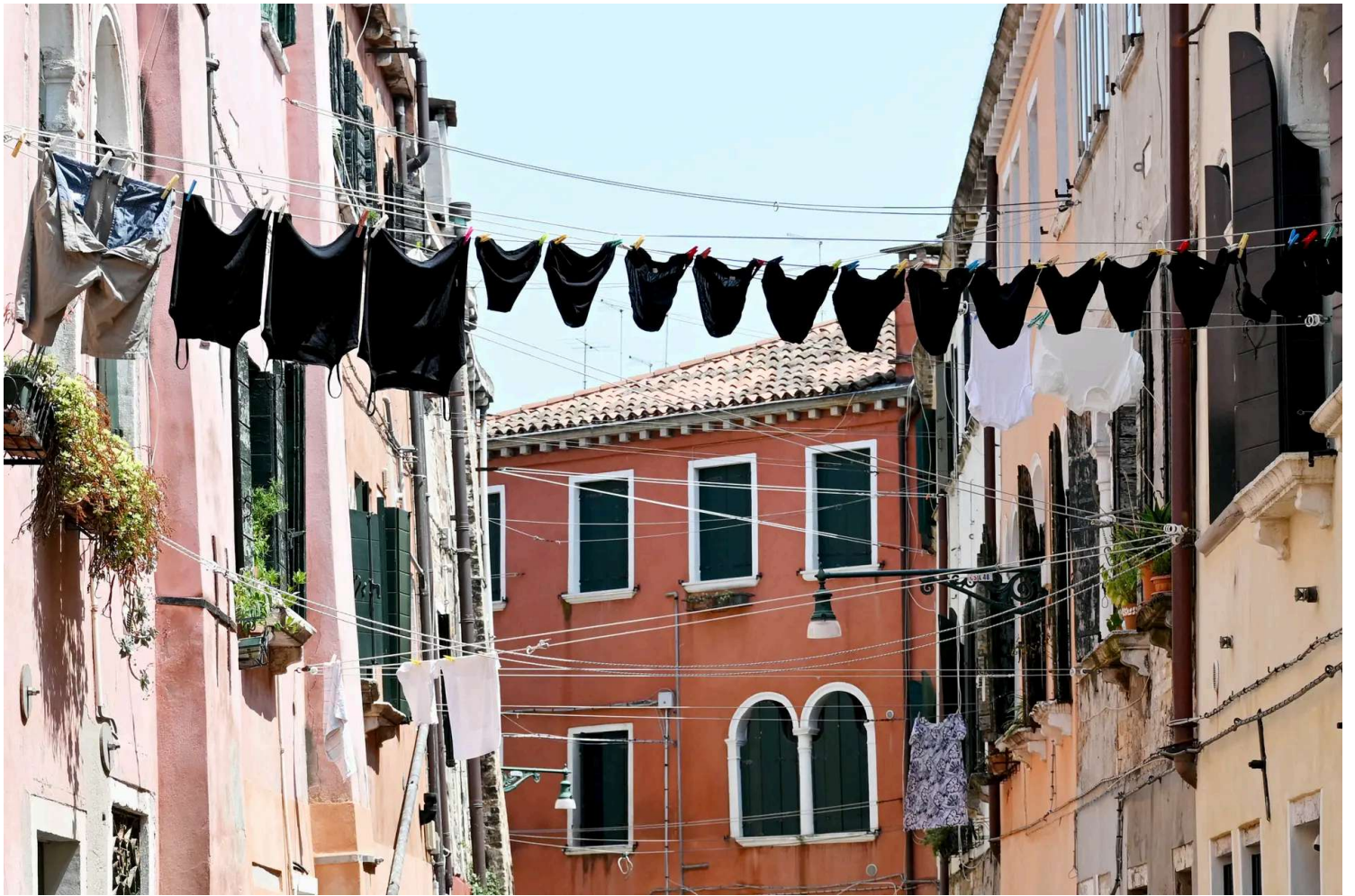
Clothing dries on a line between two houses in Venice on June 22, 2025.