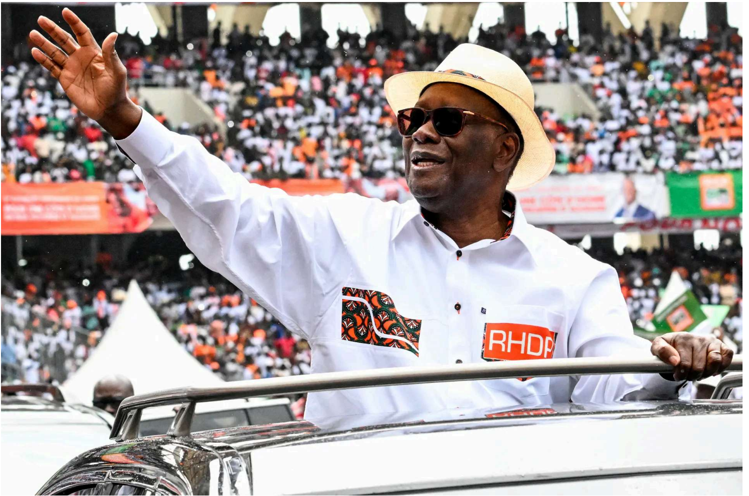
Ivory Coast President Alassane Ouattara gestures as he arrives at the Ebimpe Olympic Stadium for a meeting in Abidjan, Ivory Coast, on June 22, 2025. Ouattara continues to maintain suspense in Côte d'Ivoire: he announced on Sunday that he would make a decision "in the coming days" regarding his candidacy in the October presidential election to seek a fourth term as head of the country.