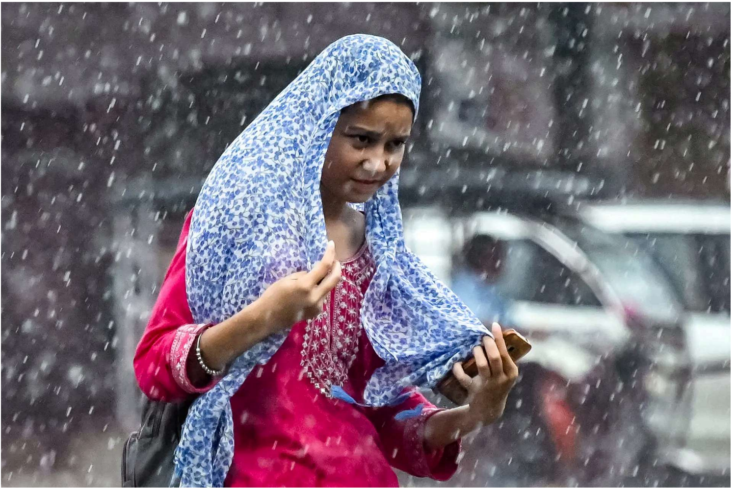
A woman crosses a street during rainfall in Amritsar, India, on June 22, 2025.

Sign up for the Epoch Opinion newsletter. Our team of Canadian and international thought leaders take you beyond the headlines and trends that shape our world. Sign up with 1-click >>