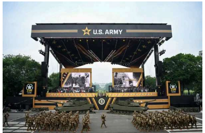
Day in Photos: Army's 250th Birthday Parade, Ivory Coast Protests, and Srinagar Views