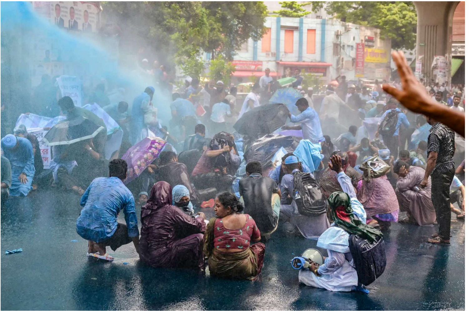
Police personnel use a water cannon to disperse demonstrators in Dhaka, Bangladesh, on June 22, 2025, during a protest by candidates for the 18th Non-Government Teachers' Registration Examination.