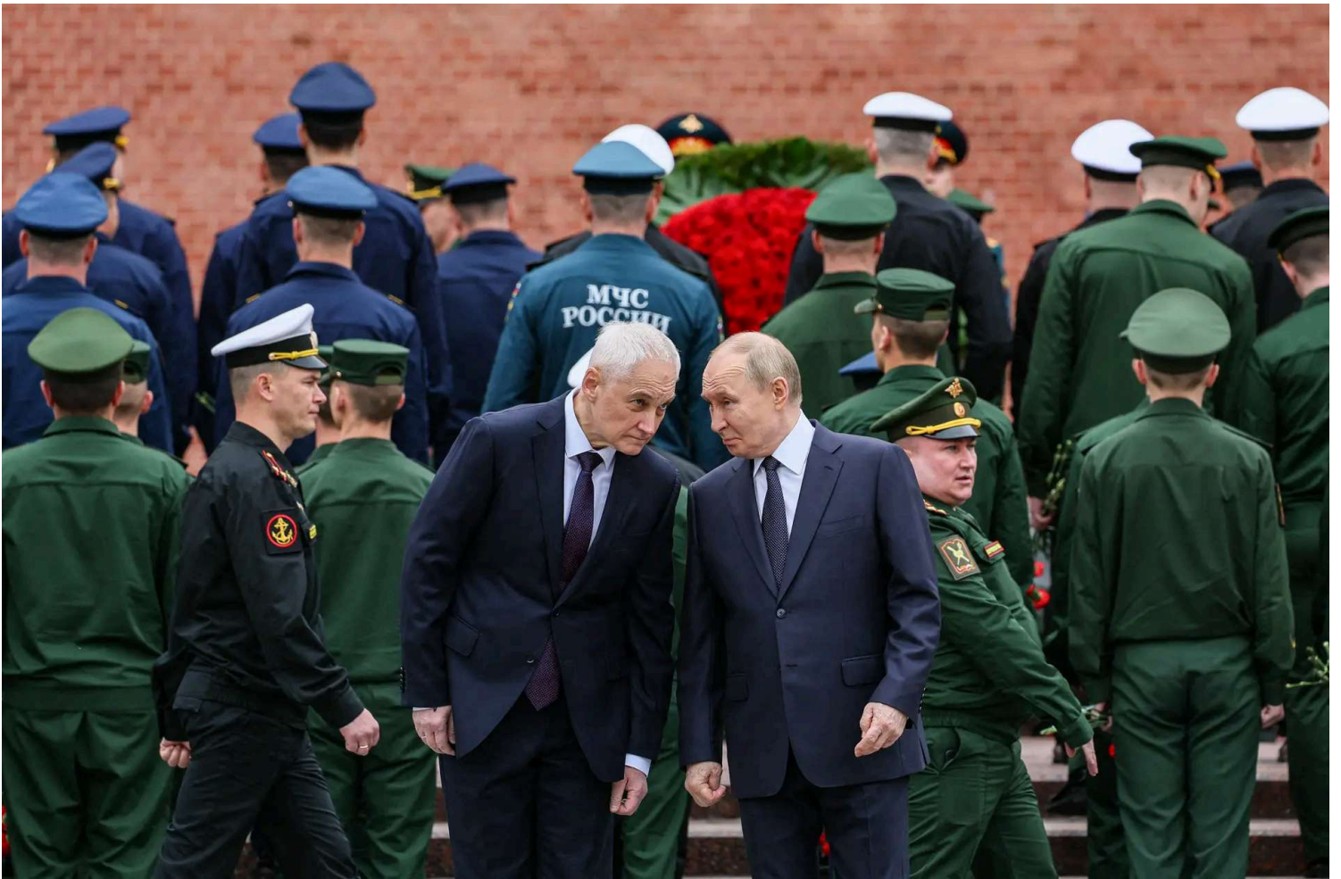
Russia's President Vladimir Putin (R) and Russian Defense Minister Andrei Belousov (L) attend a wreath-laying ceremony at the Tomb of the Unknown Soldier, to commemorate the 84th anniversary of Nazi Germany's invasion of the Soviet Union, during the Memory and Sorrow Day in Moscow on June 22, 2025.