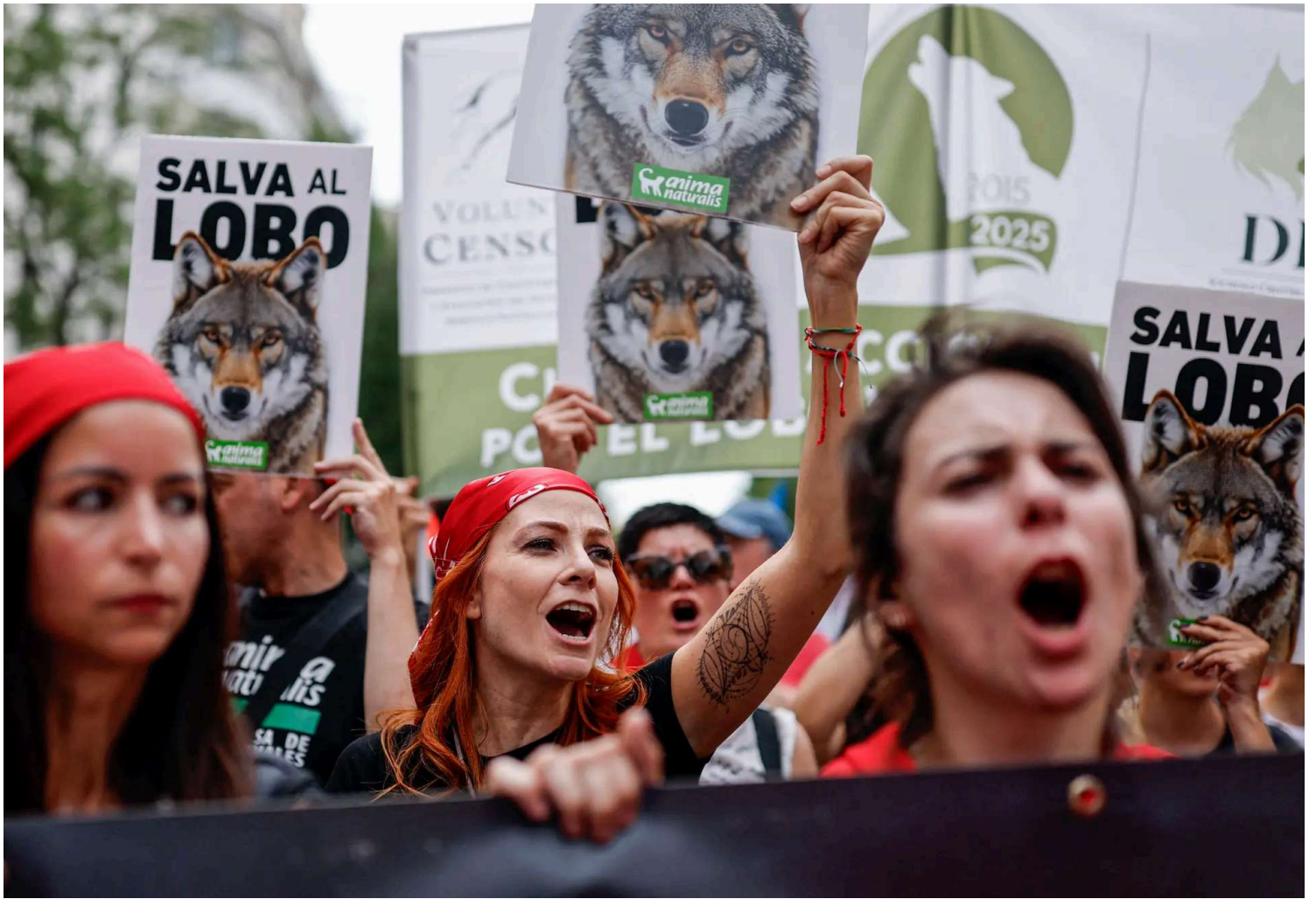
Demonstrators hold placards and shout slogans during a protest demanding full legal protection for the Iberian wolf species, in Madrid on June 22, 2025.