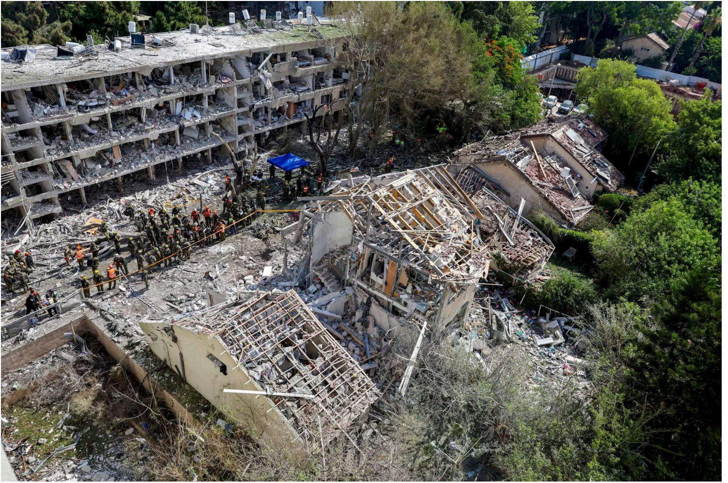
Israeli security forces and first responders gather at the site of an Iranian strike that hit a residential neighborhood in the Ramat Aviv area in Tel Aviv on June 22, 2025. At least 16 people were hurt and at least one impact was reported in central Israel after Iran launched two waves of missiles at the country following the U.S. bombing of its nuclear sites, rescue services and reports said.