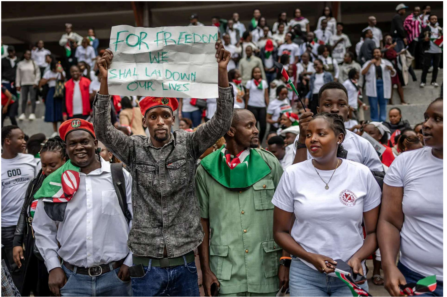
An activist holds a banner as young people leave an interdenominational service held to honor those who were killed in Kenya's historic Gen Z-led protests last year, at All Saints Cathedral in Nairobi, Kenya, on June 22, 2025.