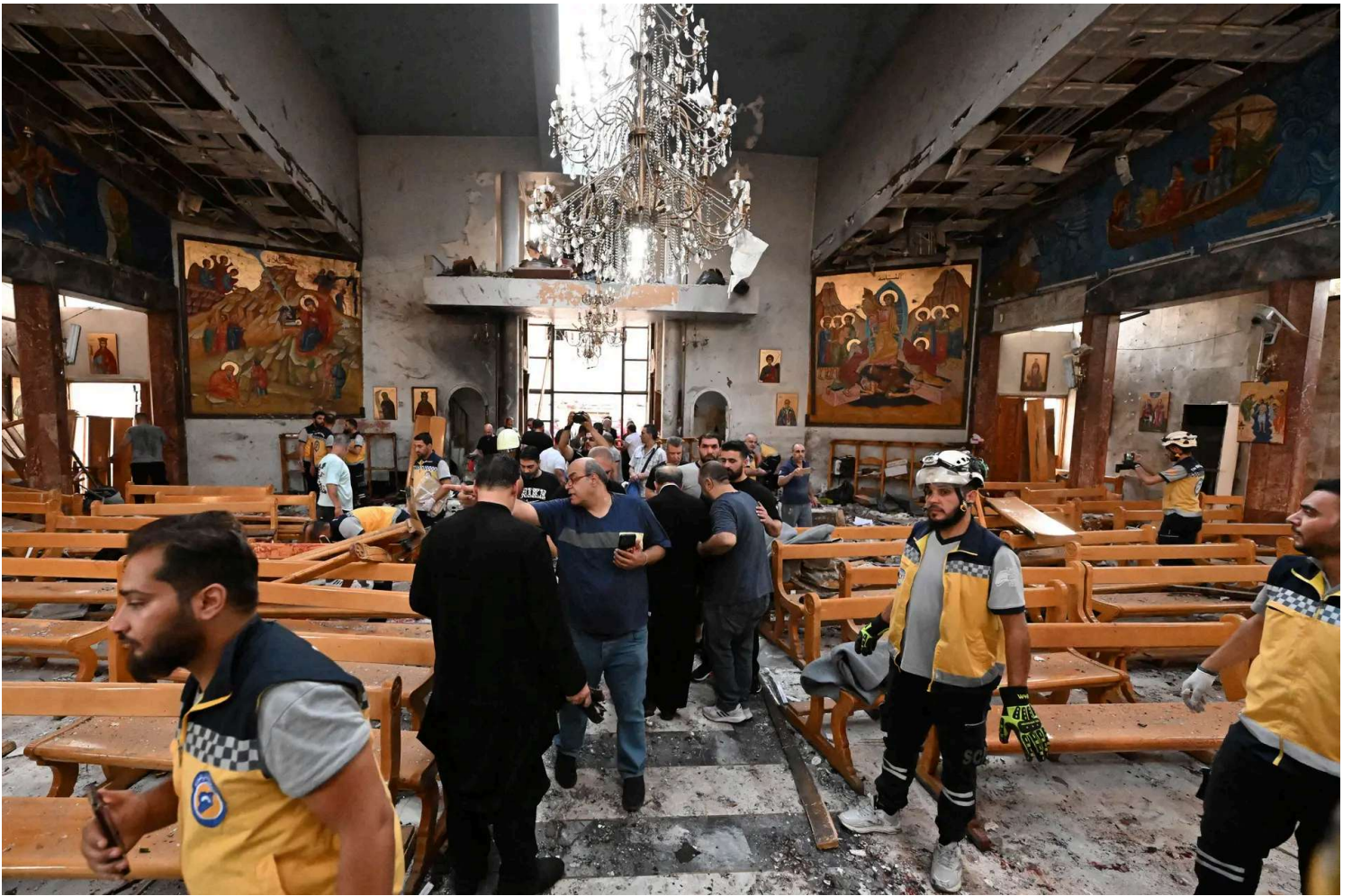
People and rescuers inspect damage at the site of a reported suicide attack at Saint Elias church in Damascus, Syria, on June 22, 2025.