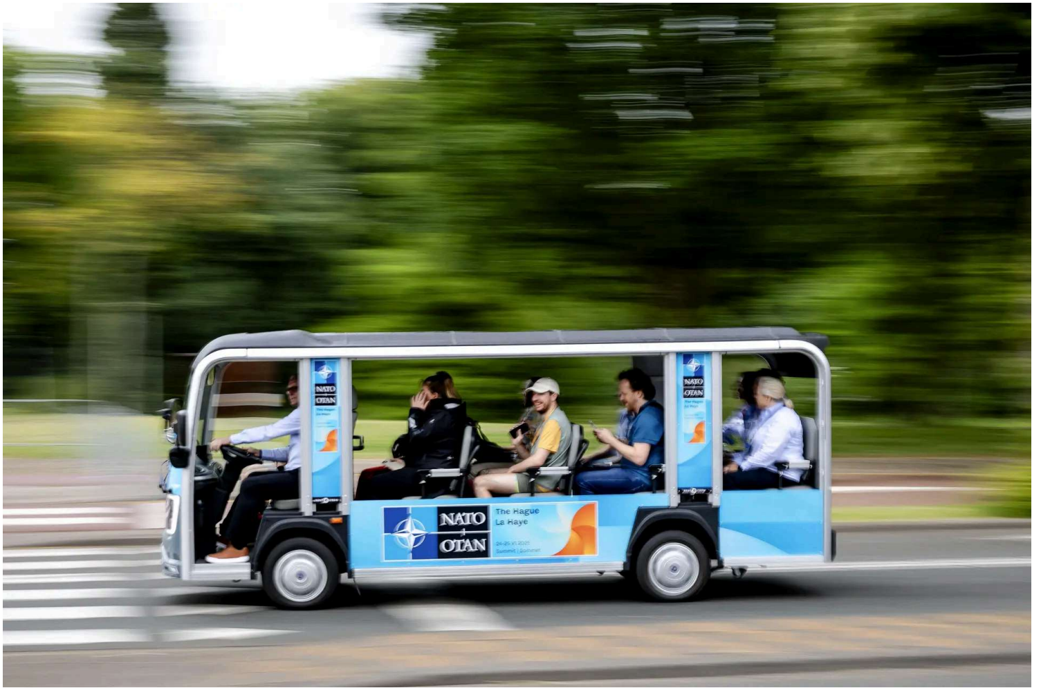
A mini-bus transports visitors on the grounds of the NATO summit, at the World Forum, in The Hague, on June 22, 2025.