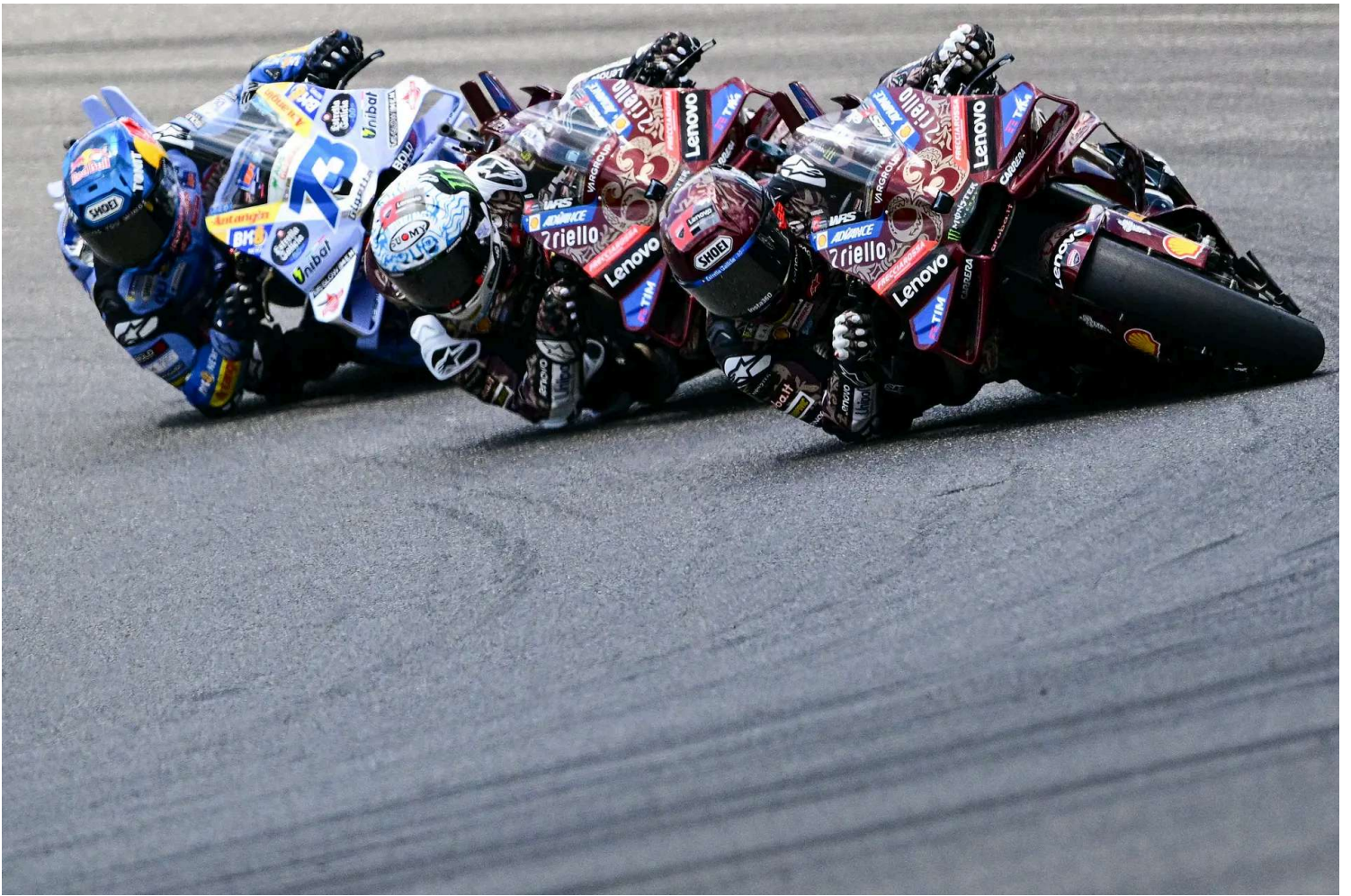
Ducati Lenovoi Team's Spanish MotoGP rider Marc Marquez steers his motorbike ahead of the team's Italian MotoGP rider Francesco Bagnaia (C) and BK8 Gresini Racing MotoGP team's Spanish MotoGP rider Alex Marquez, during the Italian Moto GP Grand Prix in Mugello, near Florence, Italy, on June 22, 2025.