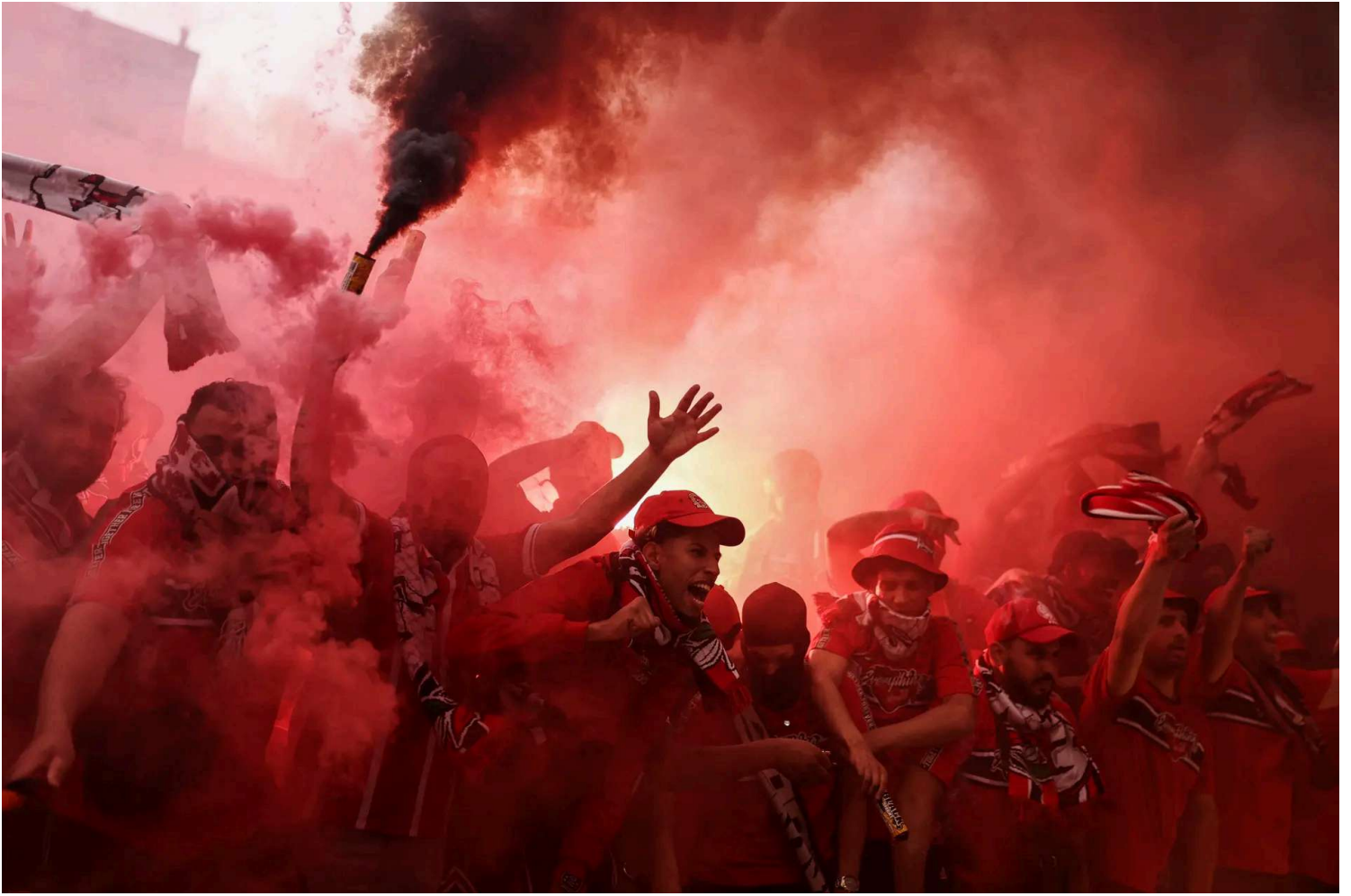
Fans of Wydad celebrate after their team's first goal during the FIFA Club World Cup 2025 Group G football match between the team and Italy's Juventus, at the Lincoln Financial Field stadium in Philadelphia on June 22, 2025.