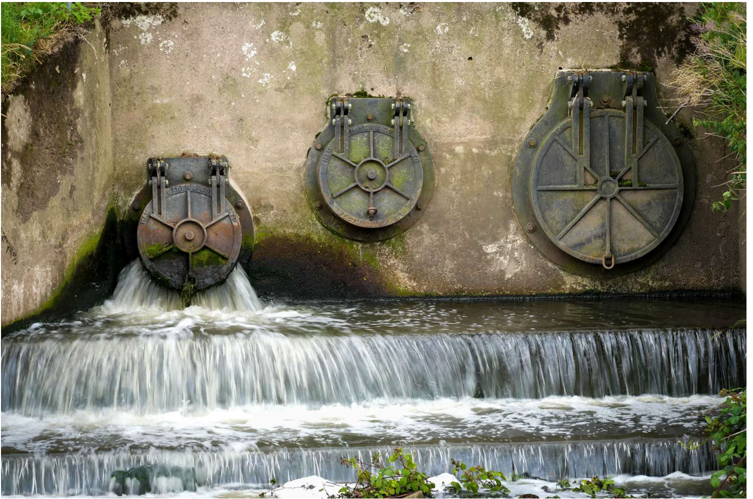
Water discharges from an outlet pipe into the River Mersey next to the United Utilities wastewater treatment plant in Stretford, in Manchester, England, on June 23, 2025. Starting June 23, water companies will have to use nature-based solutions when a law managing wastewater comes into force.