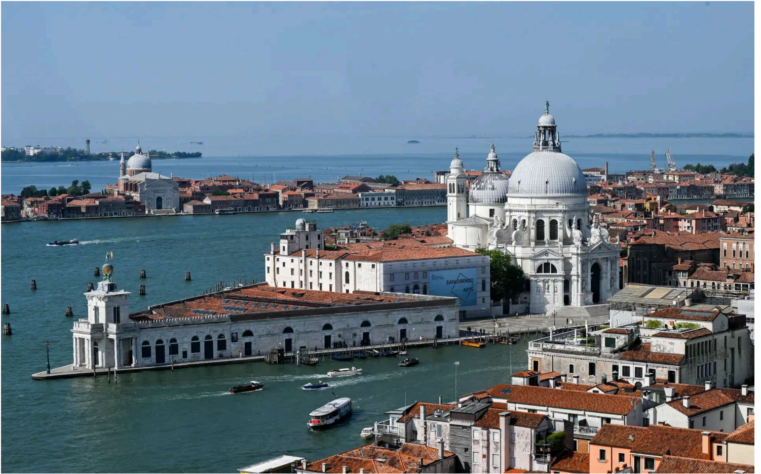
Palazzo Grassi and Punta della Dogana, the two museums of the Pinault Collection in Venice lagoon, Italy, on June 23, 2025. Venice will host the wedding of Amazon founder and CEO Jeff Bezos and journalist Lauren Sanchez before the end of the month with more than 200 guests expected to attend.