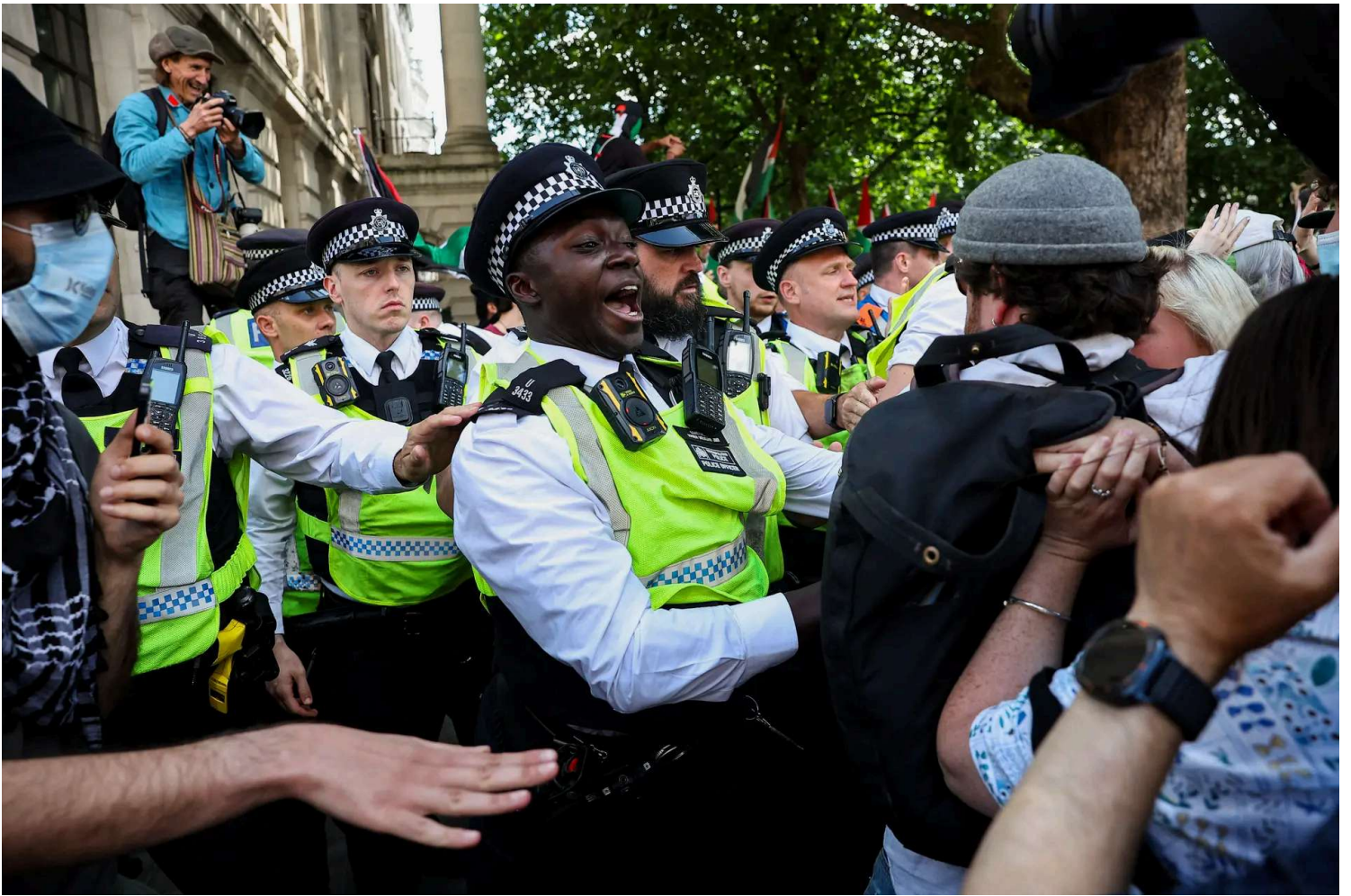
Protesters and police clash at a pro-Palestinian rally in London's Trafalgar Square on June 23, 2025, after the British government announced a ban on the group Palestine Action. British Interior Minister Yvette Cooper announced a ban on the group after its activists broke into the UK's largest air force base last week. Cooper said the vandalism of two planes at RAF Brize Norton in southern England on June 20 was "disgraceful" and the group had a "long history of unacceptable criminal damage."