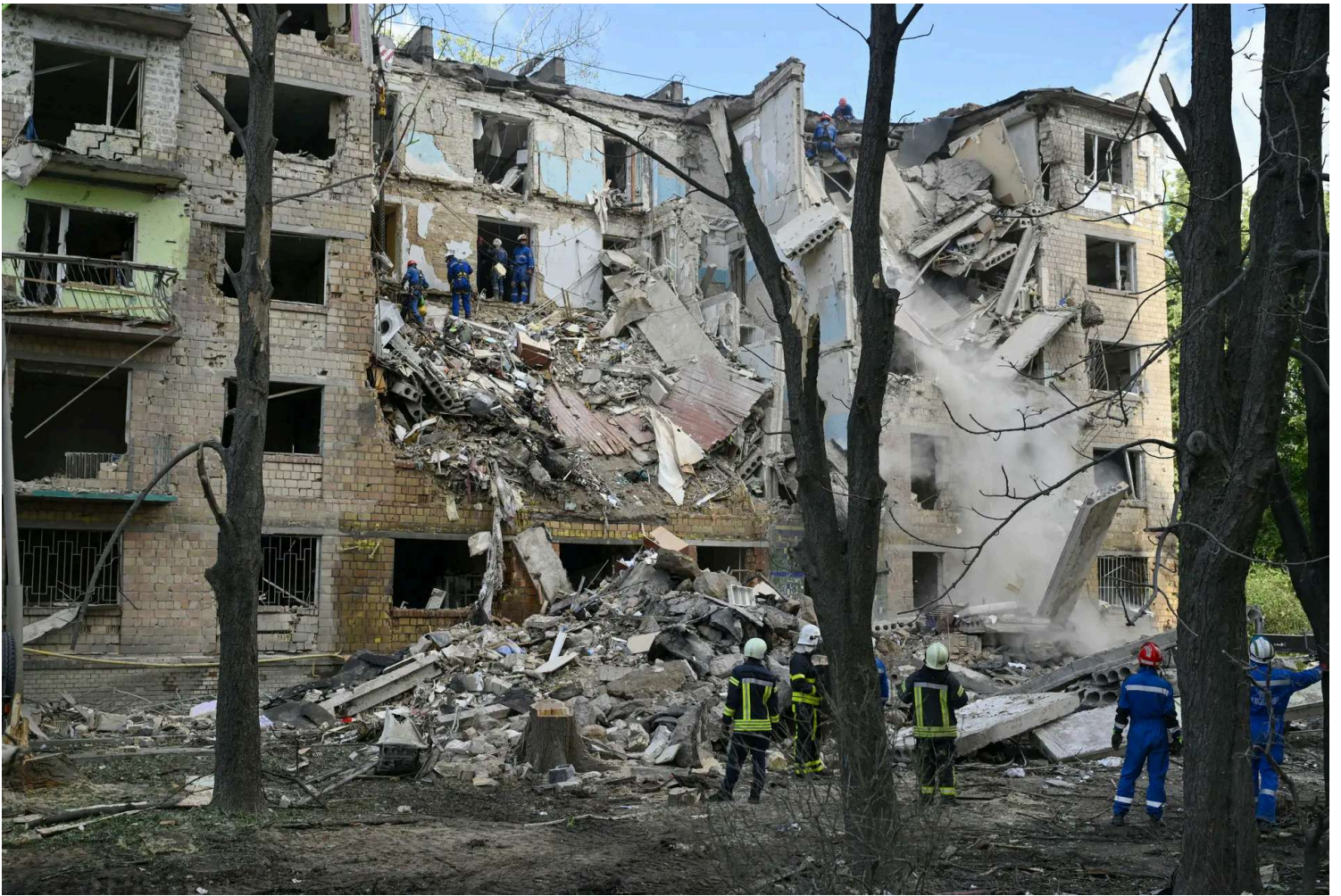
Ukrainian rescuers work at the bottom of a residential building damaged in an attack in Kyiv on June 23, 2025. Russia fired 352 drones and 16 missiles at Ukraine overnight, killing at least seven people in the capital and its suburbs, Ukrainian President Volodymyr Zelenskyy said.