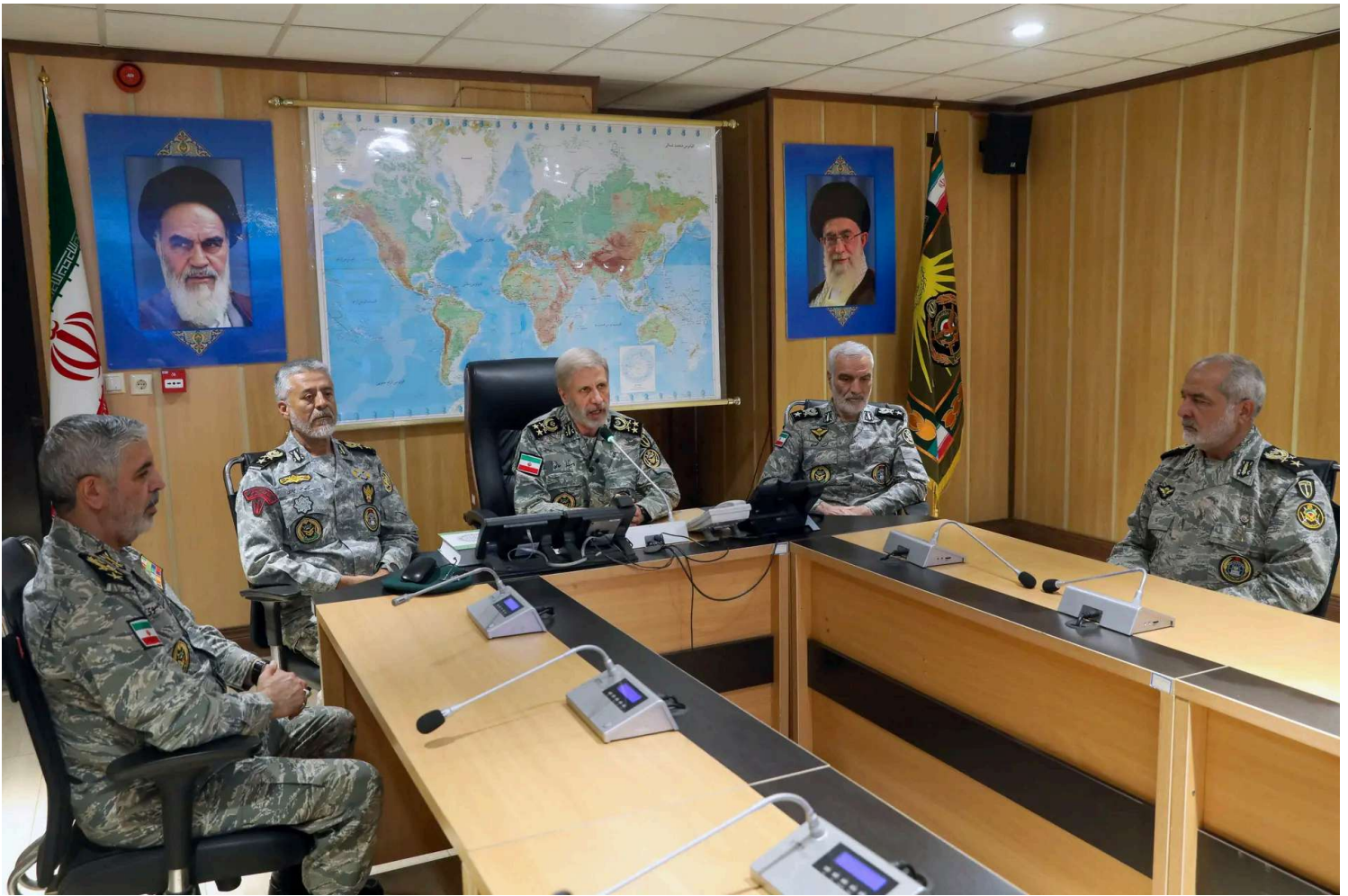
Iran's army commander-in-chief Gen. Amir Hatami (C), accompanied by army commanders, speaks in a video call with other top commanders of the army in Zolfaghar central headquarters, Iran, as portraits of the late revolutionary founder Ayatollah Khomeini, left, and leader Ayatollah Ali Khamenei hang on the wall, on June 23, 2025.