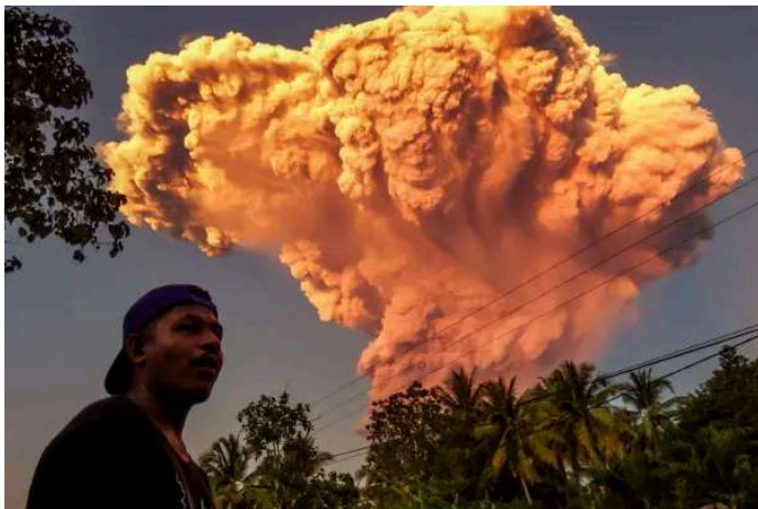
Day in Photos: Volcanic Eruption in Indonesia, Protests in Kenya, and Royal Races