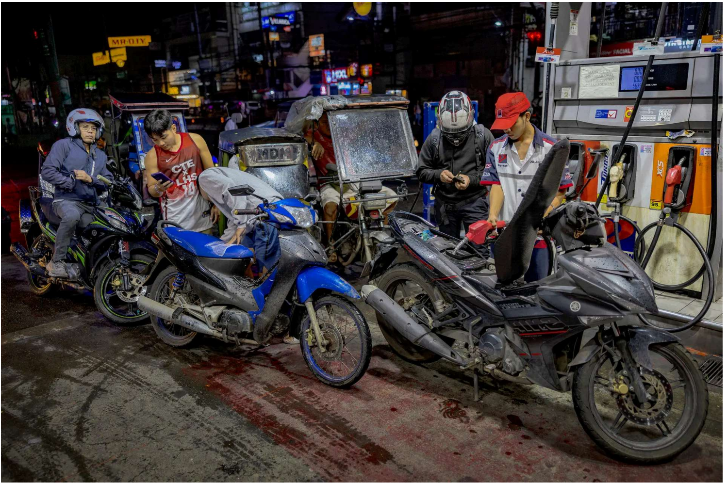
A worker fills a motorcycle at a gas station a day before price hikes on petroleum products are expected to take effect in Cavite, Philippines, on June 23, 2025. Global markets wavered on Monday amid fears of escalating conflict in the Middle East after the U.S. struck three nuclear sites in Iran. Oil supply routes in the region could be disrupted, sending energy prices soaring.