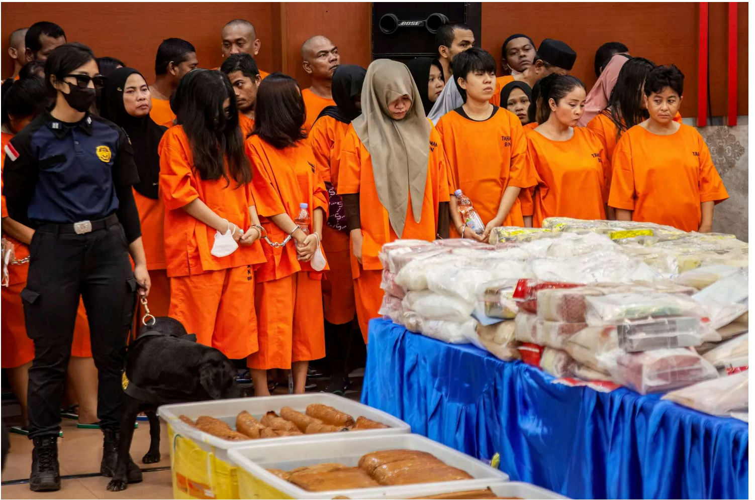
A number of suspected drug smugglers are presented to the media during a press conference at the Indonesian Customs Office in Jakarta on June 23, 2025, following the uncovering of some 172 international drug smuggling cases from April to June, with a total of 285 suspects arrested.