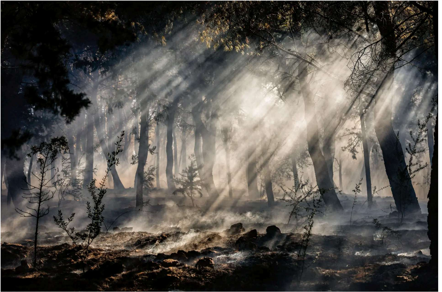
Smoke rises in the undergrowth of a forest during a wildfire on the Greek island of Chios on June 23, 2025. Greece said it had put the Mediterranean island under a state of emergency because of major fires that have raged since the weekend. Some 190 firefighters, 38 vehicles, 12 helicopters and four water-bombers have been deployed to tackle the flames, the fire service said.