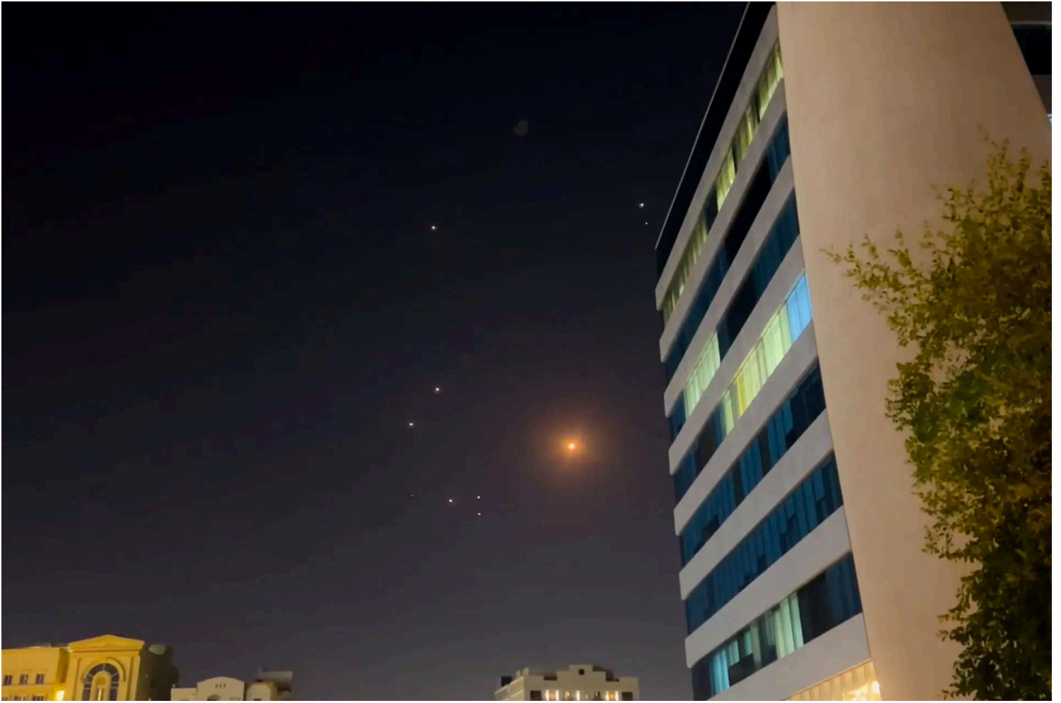
In this frame grab made from video, missiles and air-defense interceptors illuminate the night sky over Doha, Qatar, after Iran launched an attack on U.S. forces at Al Udeid Air Base in Doha on June 23, 2025. The Qatari government said that it intercepted all of Iran's missiles, which were launched in retaliation for the recent U.S. attack on Iranian nuclear facilities.