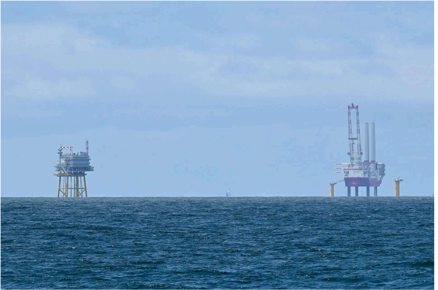
This photograph shows the jack-up installation vessel "Vole au vent" at the Yeu-Noirmoutier offshore windmills farm off the coast of France's Yeu Island on June 23, 2025.