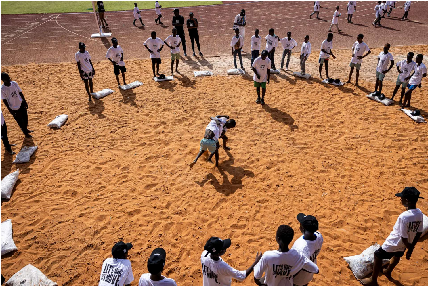
Students practice traditional wrestling, locally known as Lamb, during the Olympic Day celebrations at the Leopold Sedar Senghor Stadium in Dakar on June 23, 2025. Senegal will be the first African country to host the Summer Youth Olympic Games in 2026.