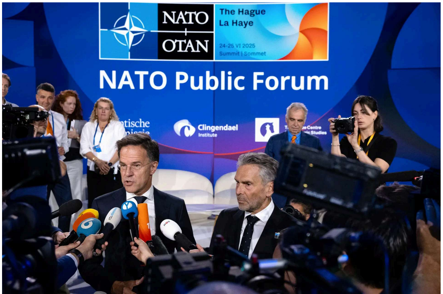
NATO Secretary General Mark Rutte (L) and Dick Schoof, Prime Minister of the Netherlands, speak to the press in the room where the public forum will be held during the NATO World Forum in The Hague, Netherlands, on June 23, 2025. Allied leaders will gather from June 24 to 26, marking the first time the Netherlands is hosting a NATO summit.