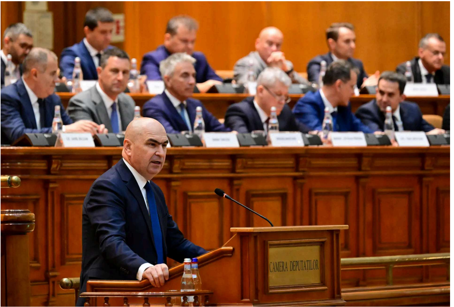
Romania's designated Prime Minister Ilie Bolojan speaks at the Palace of the Parliament in Bucharest on June 23, 2025. Romanian President Nicusor Dan named Bolojan as prime minister on June 20, following weeks of talks aimed at appointing a new government to end months of political turmoil. Bolojan, leader of the liberal party, will be tasked with tackling Romania's dire finances and reconciling the divided EU member. His appointment will need to be confirmed by parliament, where he hopes to secure the support of four pro-European parties and form a government next week.