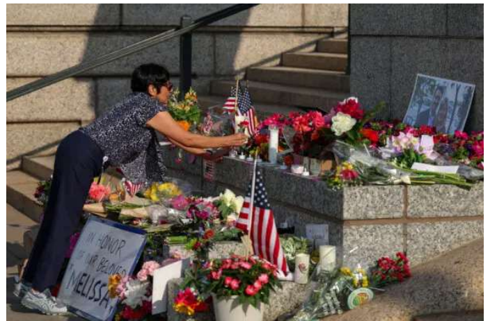
Day in Photos: Minnesota Shooting Victim Memorial, G7 in Canada, and Aerobatic Flying