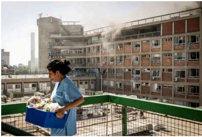
Day in Photos: Attack on Hospital in Israel, Hurricane Erick, and Heat in Europe