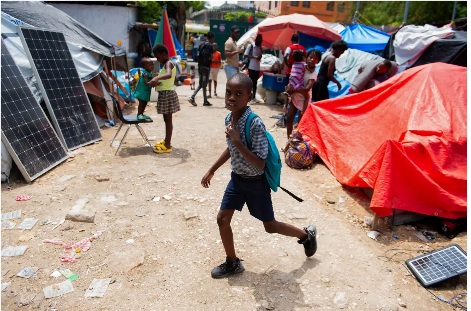
A child leaves for school from a displaced-persons camp in Port-au-Prince, Haiti, on June 23, 2025. A record number of people—almost 1.3 million—have been internally displaced in Haiti due to violence, the United Nations said on June 11. Haiti, the poorest state in the Americas, has long suffered from the violence of criminal gangs, accused of murders, rapes, pillaging and kidnappings, amid political instability.