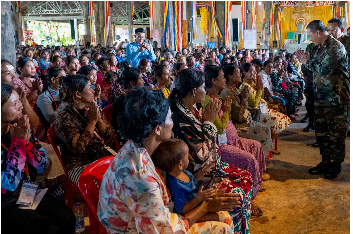
Cambodian Prime Minister Hun Manet (R) greets people who voluntarily evacuated from their homes near the Cambodia–Thailand border to a safety center in Preah Vihear province on June 23, 2025.