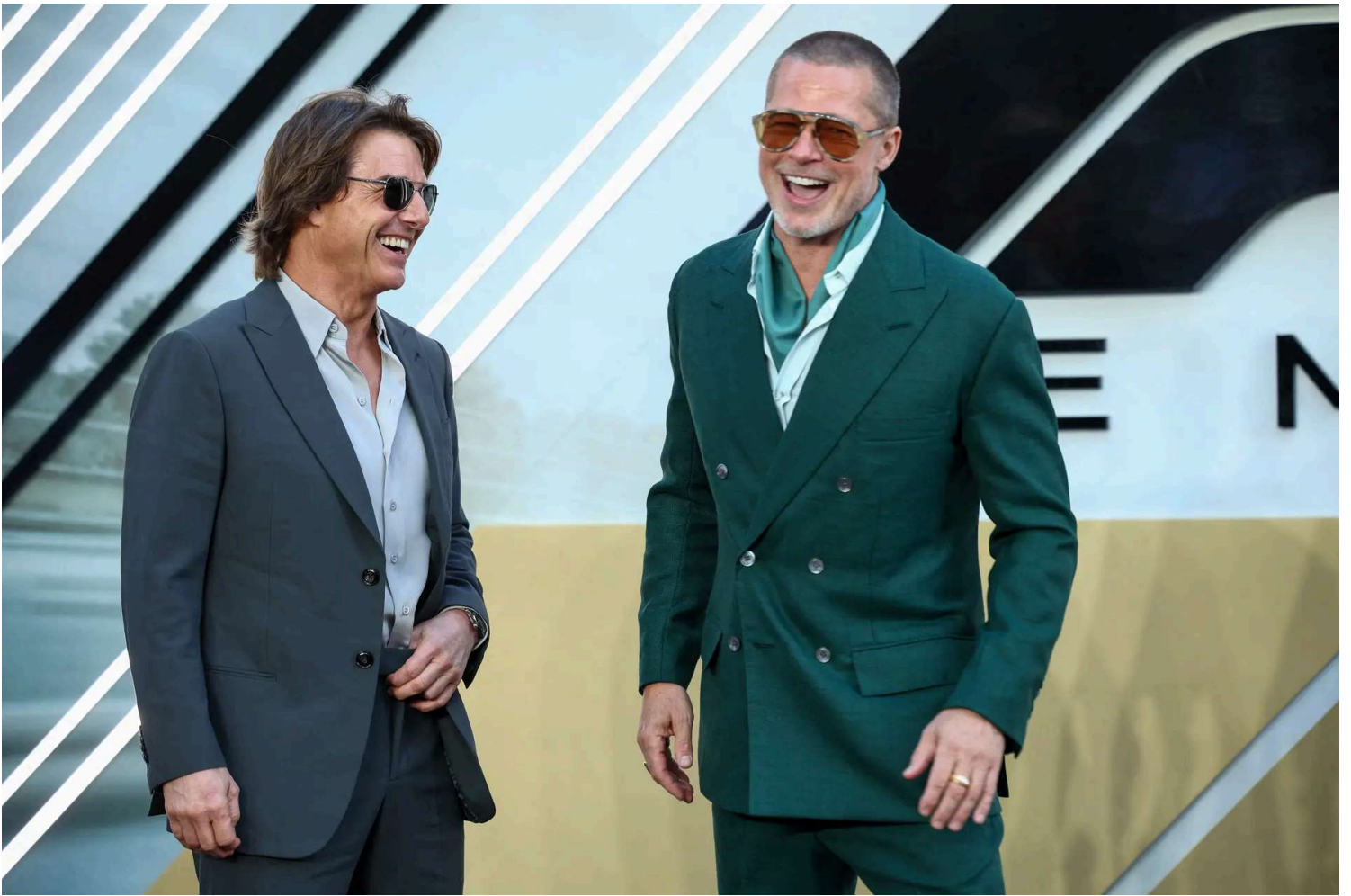
Brad Pitt speaks with Tom Cruise upon arrival for the European premiere of the film

Sign up for Epoch Focus newsletter. Focusing on one key topic at a time, diving into the critical issues shaping our world. Sign up with 1-click >>