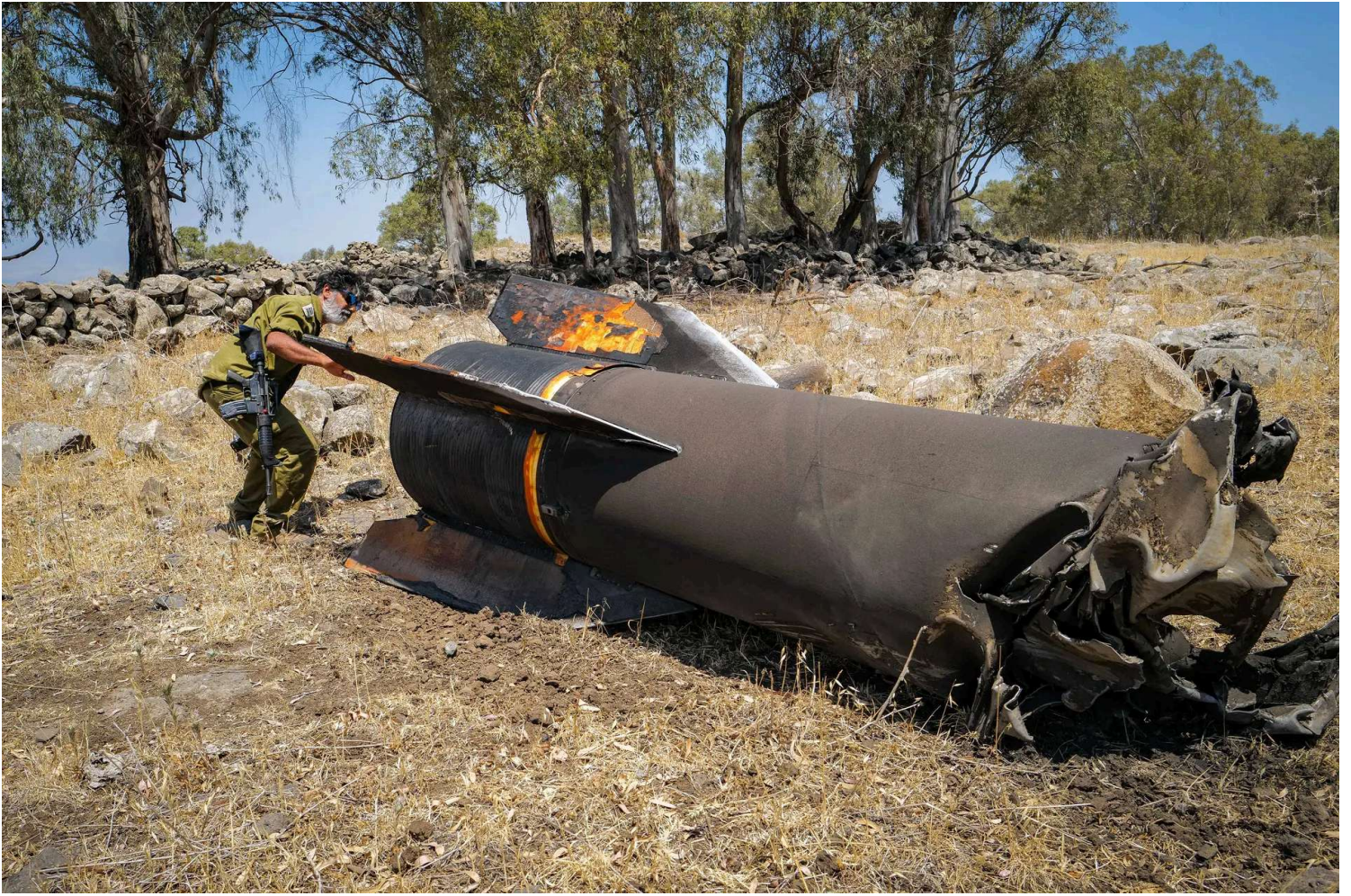
Members of the Israeli security forces check the apparent remains of an Iranian ballistic missile lying on the ground on the outskirts of Qatzrin, Golan Heights, Israel, on June 23, 2025.