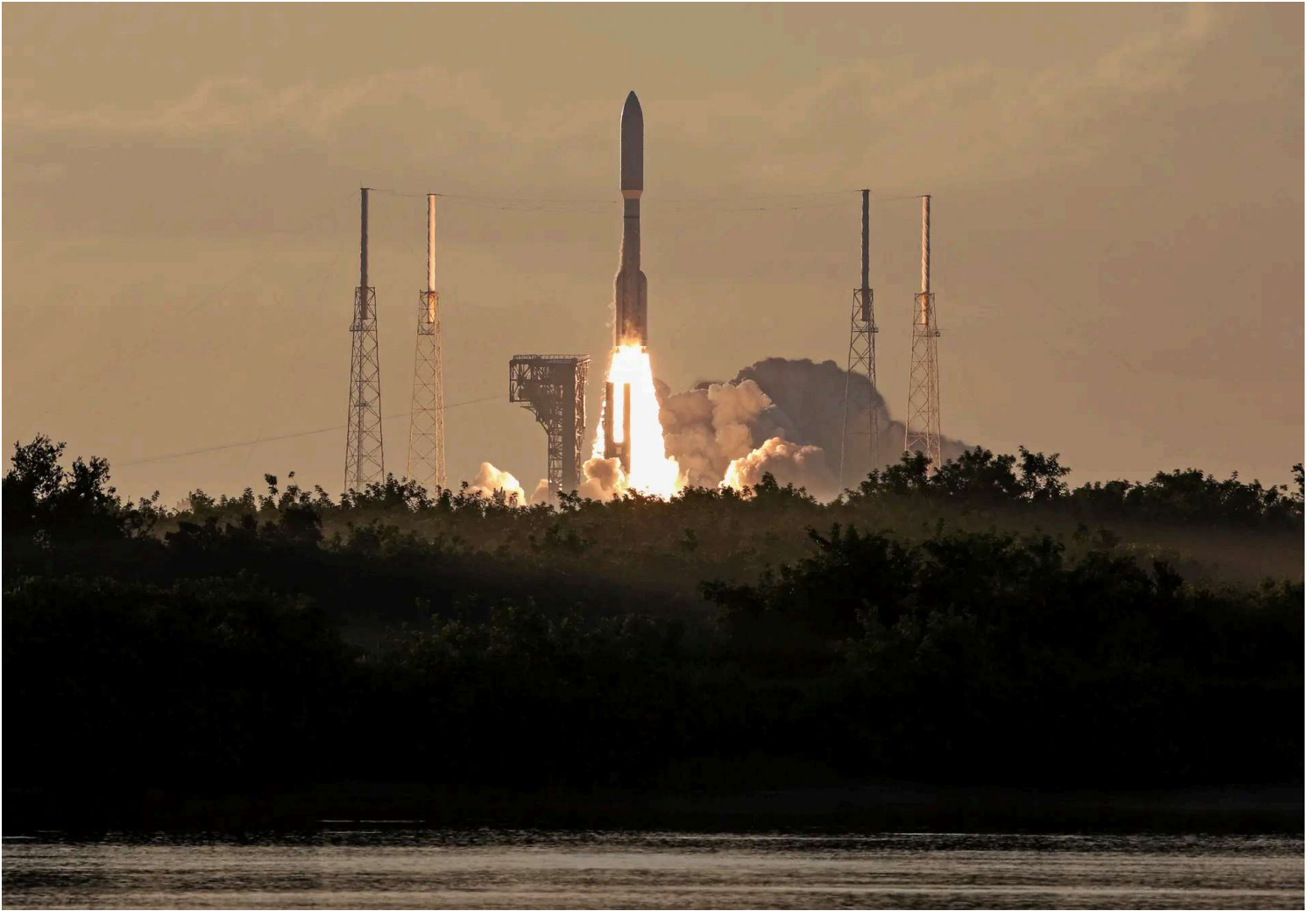
An Atlas V rocket of United Launch Alliance lifts off from Space Launch Complex 41 at the Kennedy Space Center in Cape Canaveral, Fla., on June 23, 2025. Amazon launched its second fleet of 27 Project Kuiper internet satellites, a mega constellation that will offer global broadband internet access. The Kuiper satellites are headed into low Earth orbit, where they will maneuver to join a growing constellation expected to harbor more than 3,200 satellites.