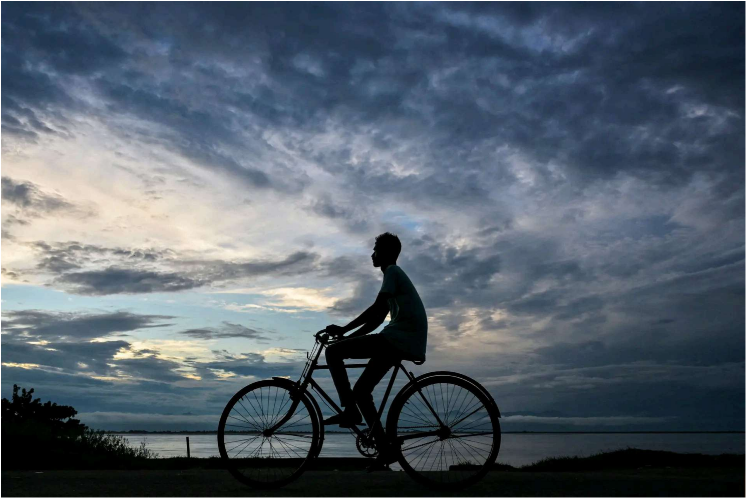
A man paddles his bicycle down an embankment along the river Brahmaputra as dark clouds loom over Dibrugarh in India's northeastern state of Assam on June 23, 2025.