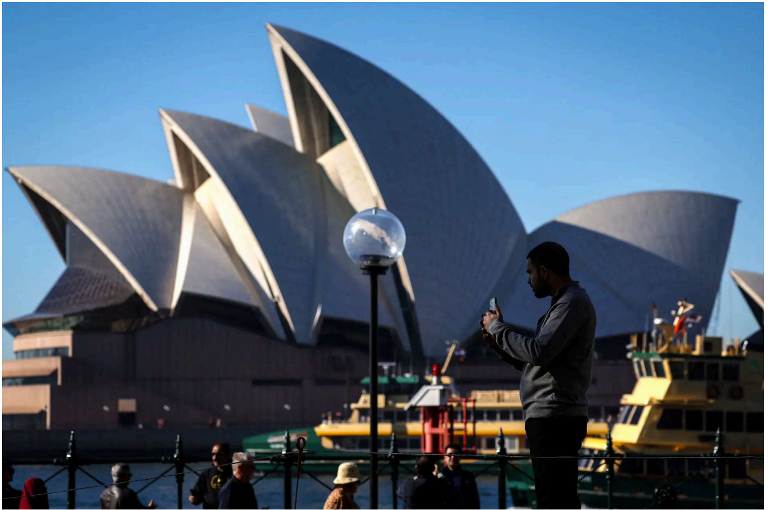
Ferries pass behind a winter tourist taking a photograph on his phone in front of the Sydney Opera House on June 23, 2025.