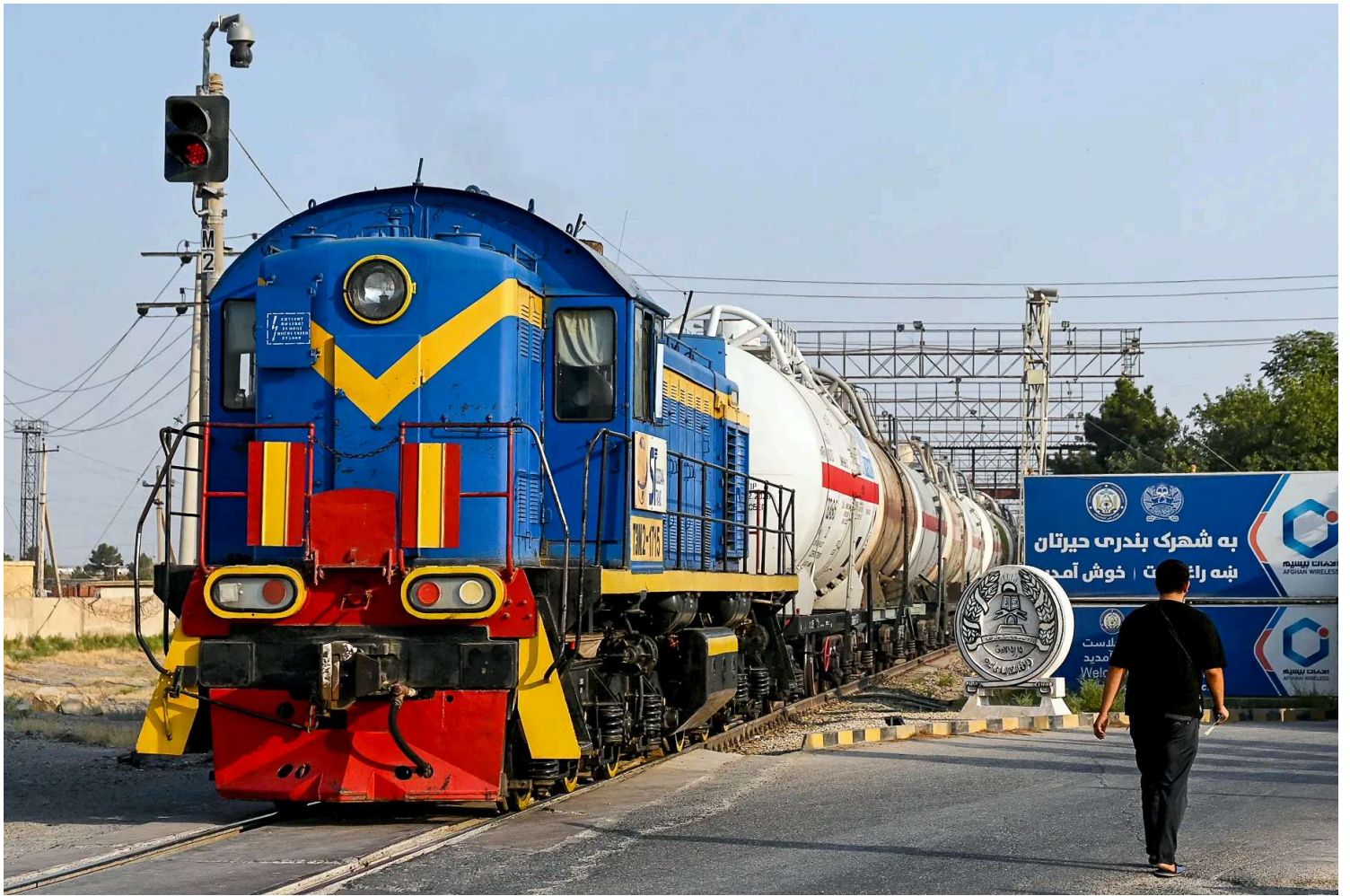
A fuel cargo train leaves Afghanistan at the Afghanistan-Uzbekistan Friendship Bridge in the border town of Hairatan, Balkh province, on June 23, 2025.