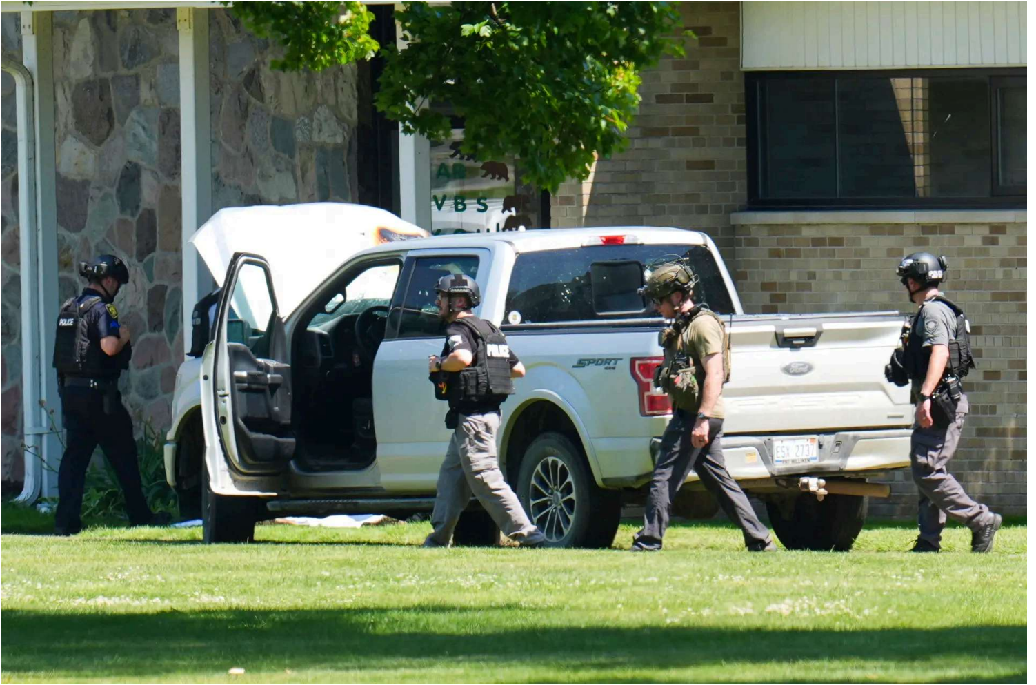
Police walk by an idle vehicle near CrossPointe Community Church in Wayne, Mich., on June 23, 2025. The man who opened fire outside a Michigan church filled with worshippers before he was struck by a vehicle and fatally shot by security staff had attended services there a few times with his mother, the lead pastor said Monday.