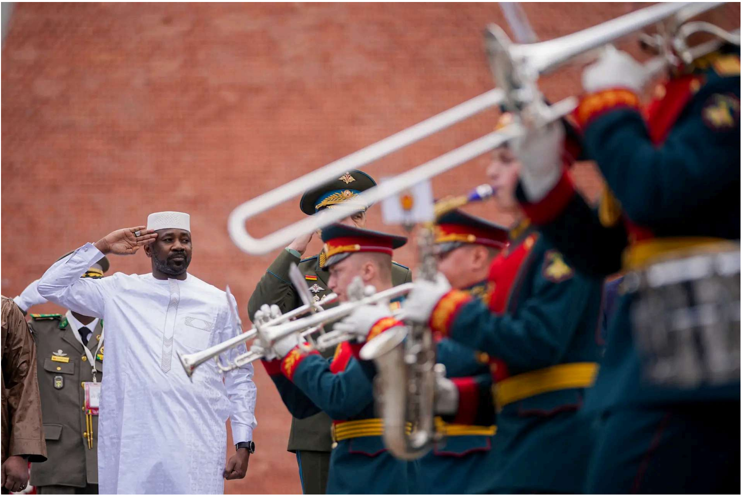
Mali's junta leader Assimi Goita attends a wreath-laying ceremony at the Tomb of the Unknown Soldier near the Kremlin wall in Moscow on June 23, 2025.