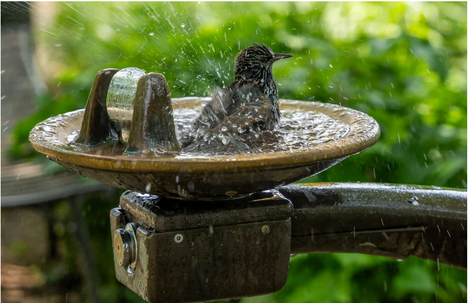
A bird bathes in a fountain in New York City on June 23, 2025. Temperatures in New York reached the high 90s with a heat index of over 100 degrees as the first heat wave of the year moves through parts of the Midwest and East Coast.