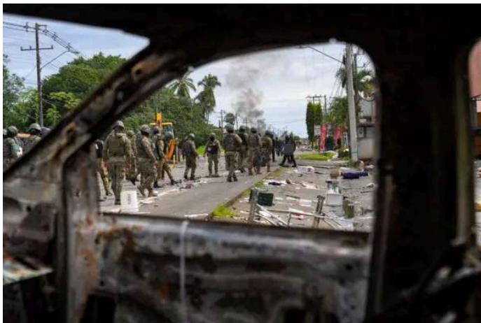
Day in Photos: Iran Strikes Israel, Church Shooting, Protests in Panama