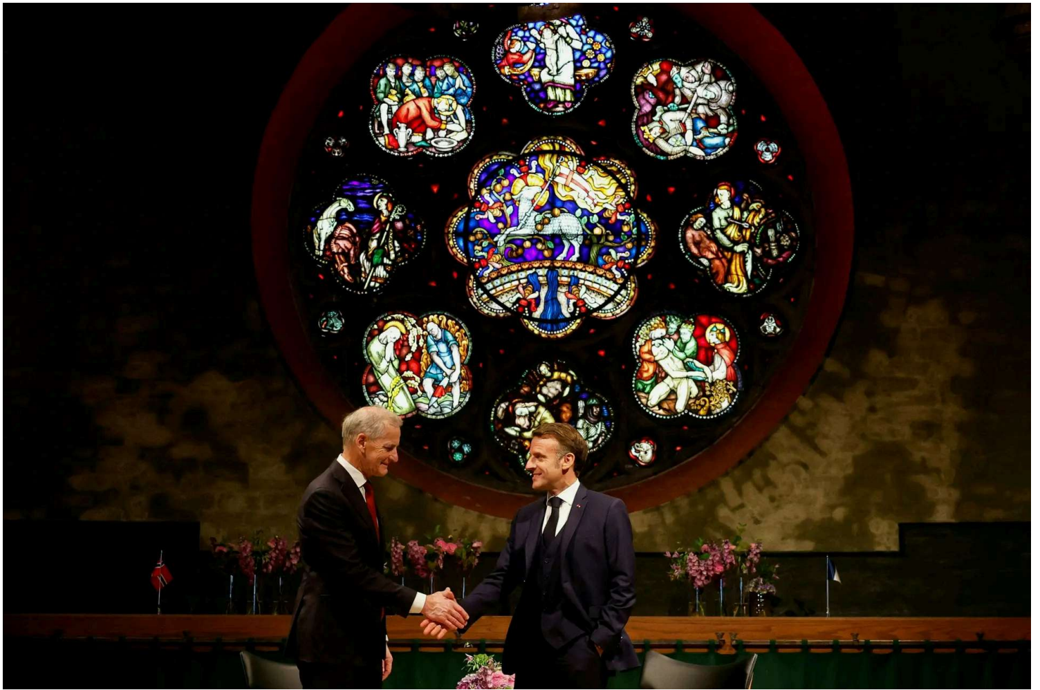
French President Emmanuel Macron and Norwegian Prime Minister Jonas Gahr Store shake hands after a bilateral meeting at Akershus Fortress in Oslo, Norway, on June 23, 2025. Macron's visit is the first by a French head of state to Norway since 1984. The visit will underline France's ongoing commitment to the Nordic and Arctic region, particularly in terms of security. The trip will also provide an opportunity to reaffirm Europe's position on the conflicts in Ukraine and the Near and Middle East.