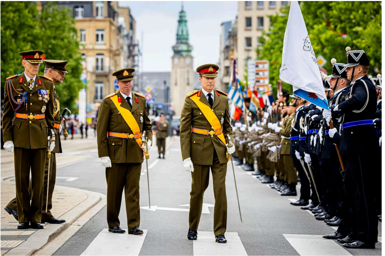
Grand Duke Henri (R) and Hereditary Grand Duke Guillaume of Luxembourg at a military parade during National Day ceremony at Avenue de la Liberte in Luxembourg City on June 23, 2025.