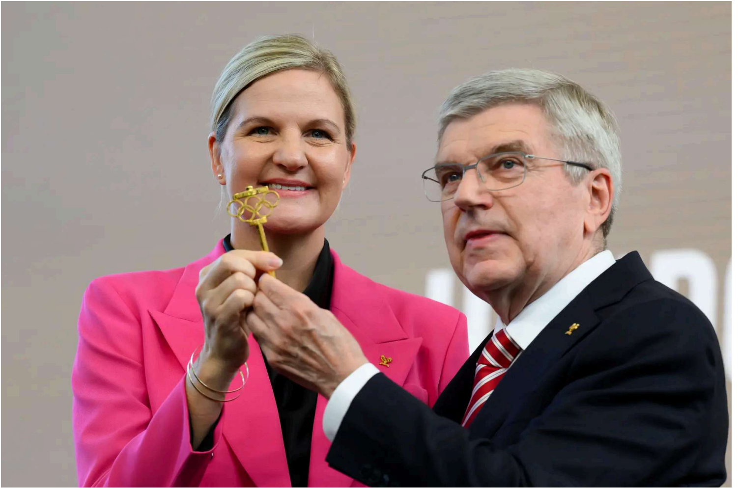
International Olympic Committee (IOC) President Kirsty Coventry is handed the Olympic key from outgoing President Thomas Bach during a handover ceremony at Olympic House in Lausanne, Switzerland, on June 23, 2025, ending Bach's 12-year tenure. Coventry was elected in March 2025 and is the IOC's first female president.