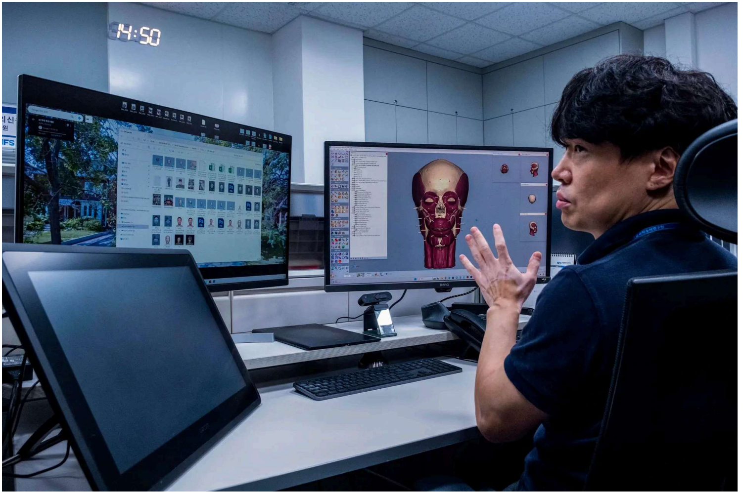
A forensic scientist performs a demonstration of facial reconstruction to identify, from a skull, the recently recovered remains of a soldier from the Korean War (1950–1953) in a laboratory of the Division of Postmortem Investigation at South Korea's National Forensic Service headquarters in Wonju, on June 24, 2025.