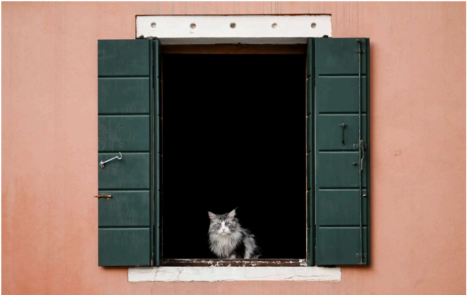
A cat sits at the window of a house, in the early morning in Venice, on June 24, 2025. Celebrities in superyachts sail into Venice this week for the three-day wedding party of Amazon tycoon Jeff Bezos and Lauren Sanchez, despite irate locals who say the UNESCO city is no billionaire's playground.