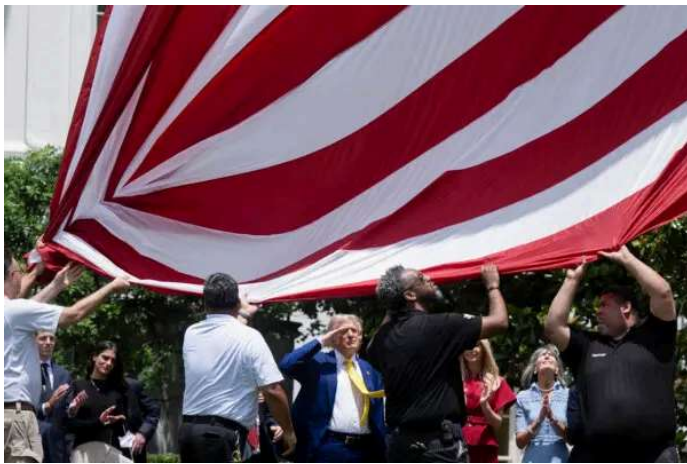
Day in Photos: New Flagpole, Protests in Argentina, and Royal Highland Show