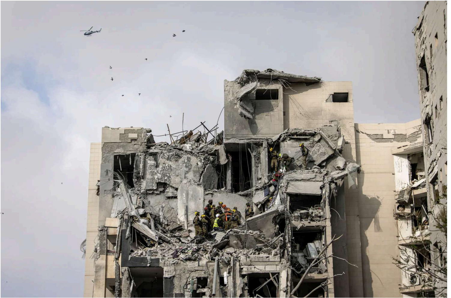
Israeli emergency services and security officers search for casualties in the rubble of a building hit by an Iranian missile in Beersheba in southern Israel, on June 24, 2025. U.S. President Donald Trump announced a phased 24-hour cease-fire process beginning at 12 a.m. EDT on June 24.