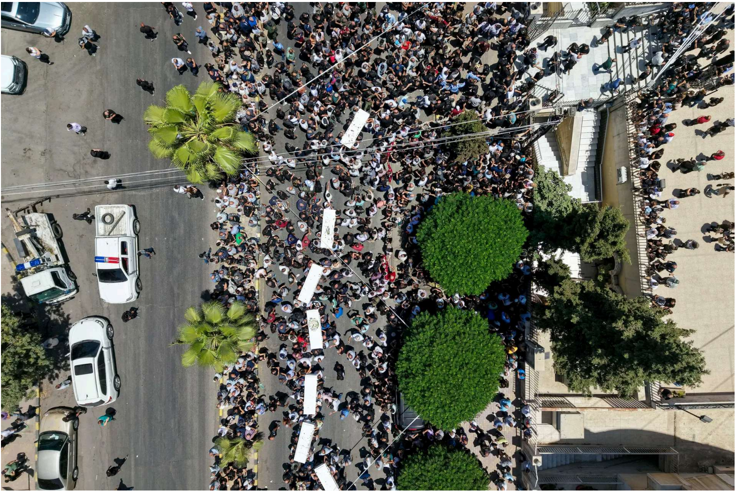
An aerial view shows mourners carrying the coffins of those killed in a suicide attack two days ago, as they arrive at the Church of Holy Cross in Damascus's al-Qassaa neighborhood, on June 24, 2025. At least 22 people were killed in a shooting, authorities said, blaming a member of the ISIS terror group for the unprecedented attack.