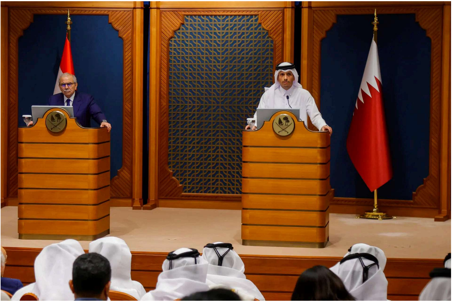
Qatar's Prime Minister Mohammed bin Abdulrahman al-Thani (R) and Lebanese Prime Minister Nawaf Salam hold a press conference in Doha, on June 24, 2025. Mediator Qatar said on June 24 it was working on resuming Gaza cease-fire talks in days.