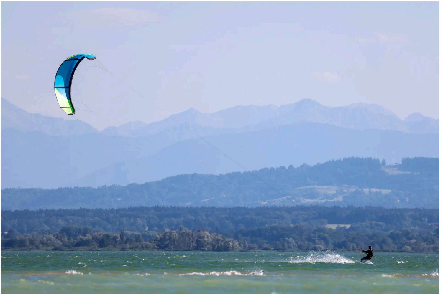
A Kite surfer during a hot day at the lake Ammersee in Herrsching, Germany, on June 24, 2025.