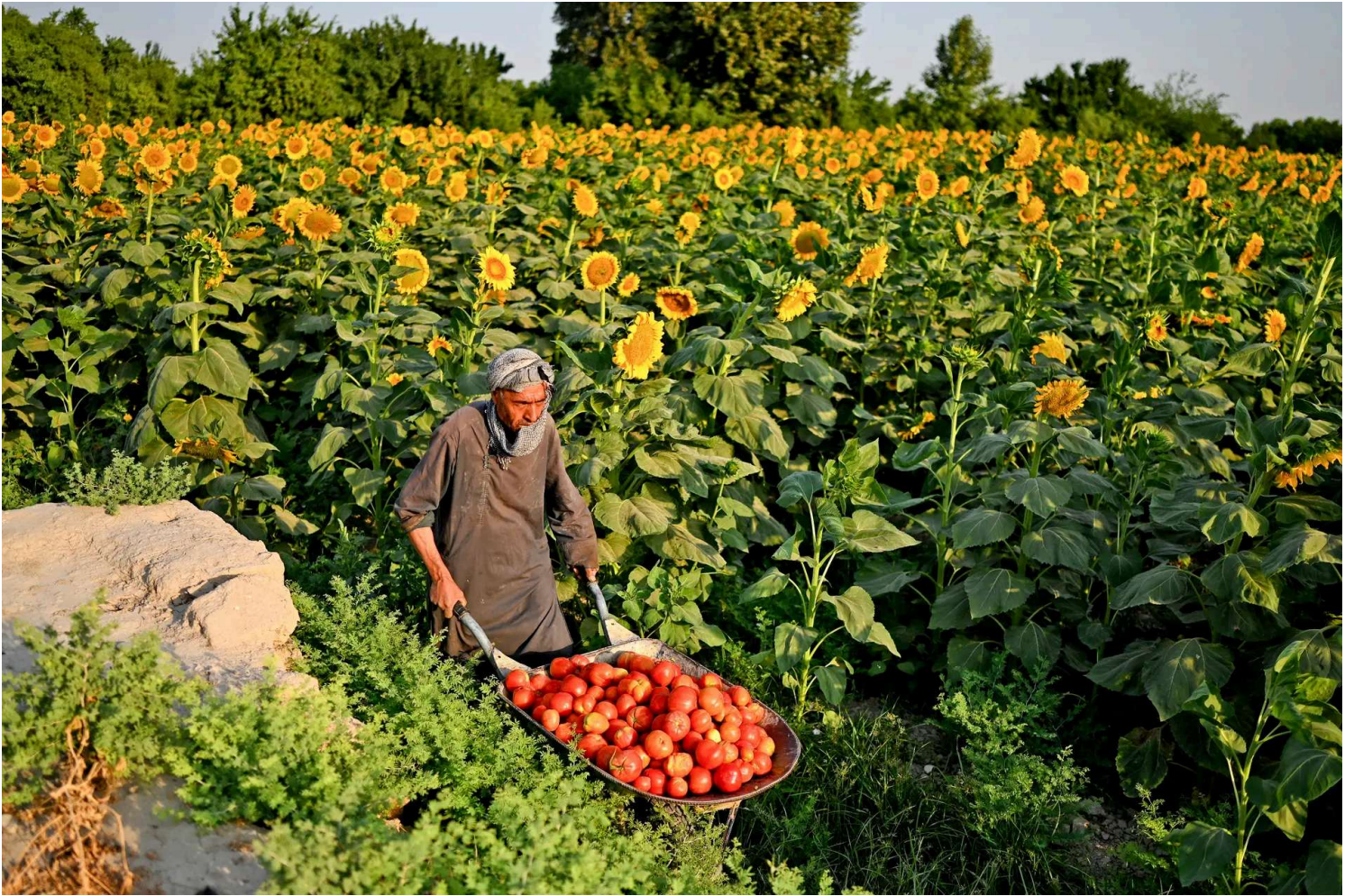
An Afghan farmer pushes his wheelbarrow of tomatoes after harvest on the outskirts of Mazar-i-Sharif, on June 24, 2025.