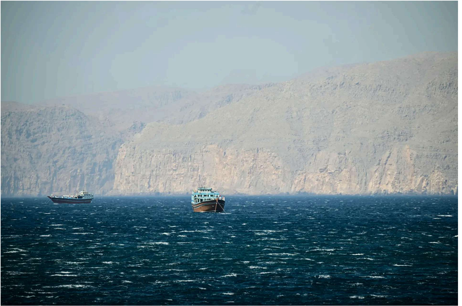
Dhows are anchored off Khasab, on northern Oman's Musandam Peninsula overlooking the Strait of Hormuz, on June 24, 2025. World markets fear that Iran could shut the Strait of Hormuz, a chokepoint for about a fifth of the world's oil supply.