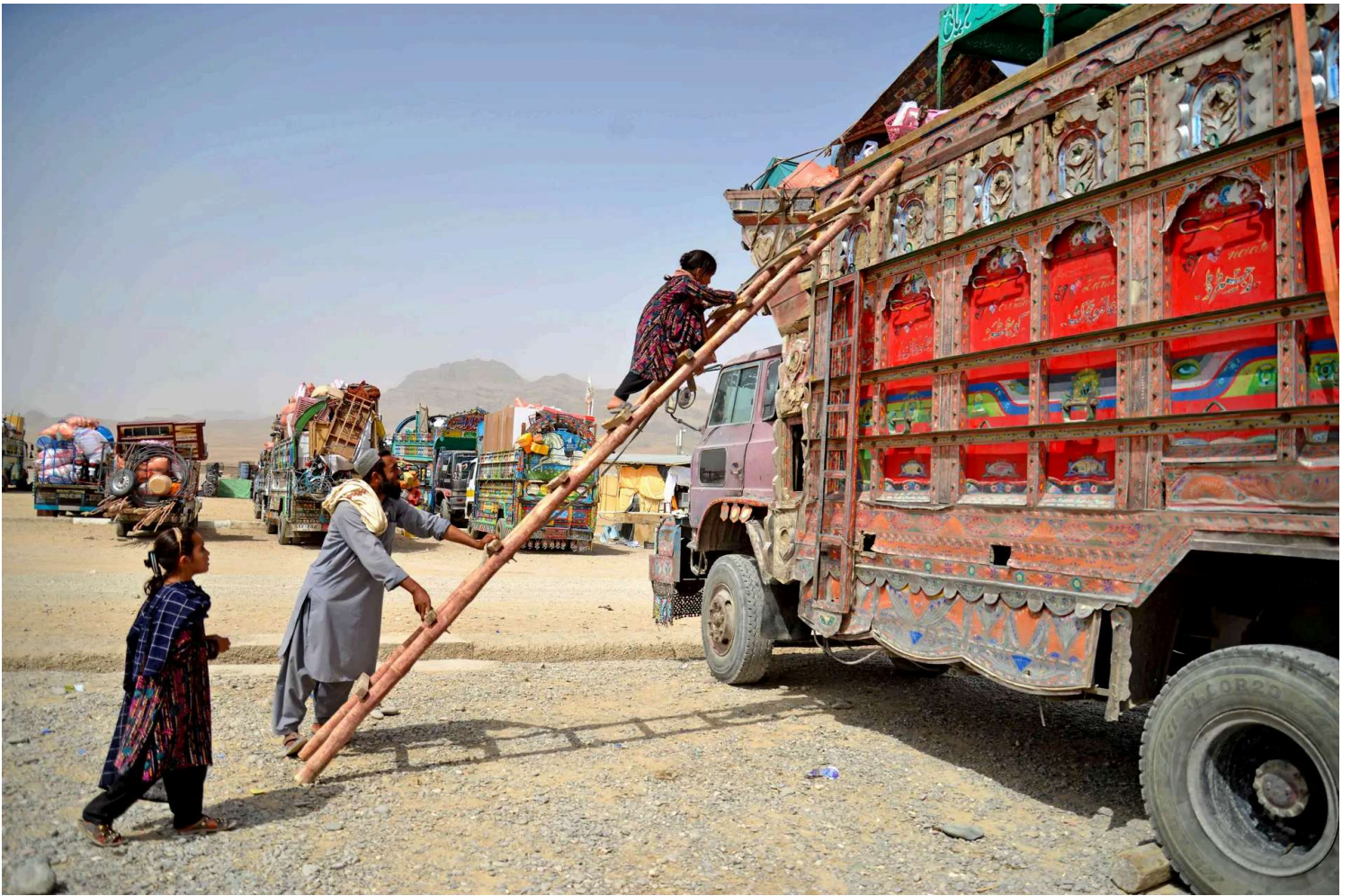
Afghan refugees climb onto a truck upon their arrival from Pakistan, in the Takhta Pul district in Kandahar province, on June 24, 2025.