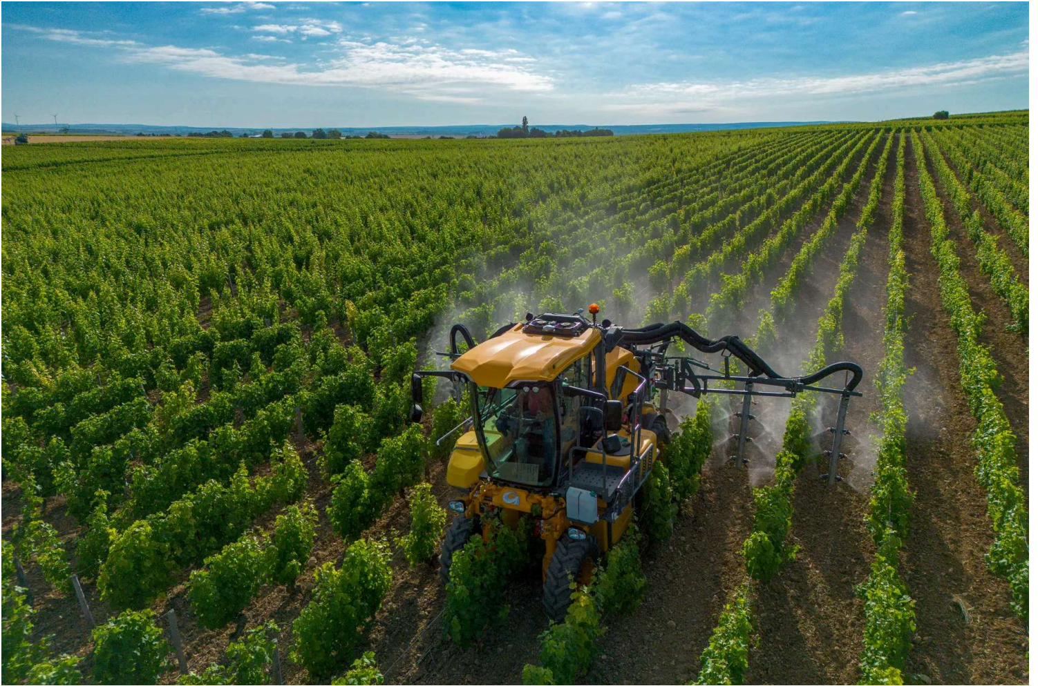
An aerial view of a straddle tractor spraying a treatment in the vineyards of Pouilly-sur-Loire, France, on 24 June 2025.