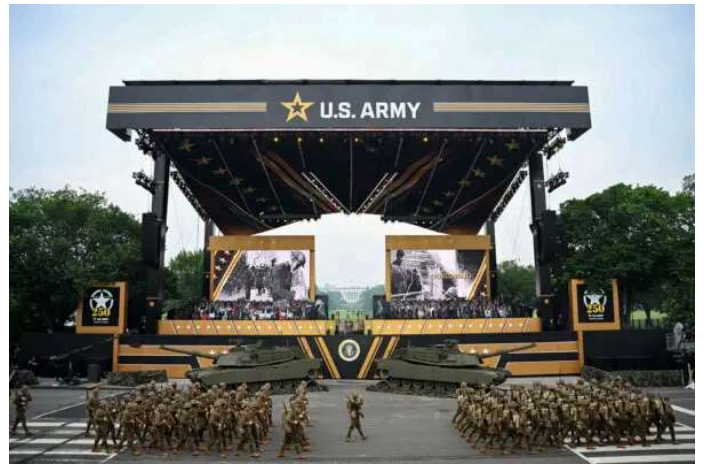
Day in Photos: Army's 250th Birthday Parade, Ivory Coast Protests, and Srinagar Views

Copyright © 2000 - 2025 The Epoch Times Association Inc. All Rights Reserved.