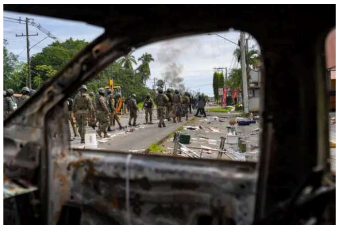
Day in Photos: Iran Strikes Israel, Church Shooting, Protests in Panama