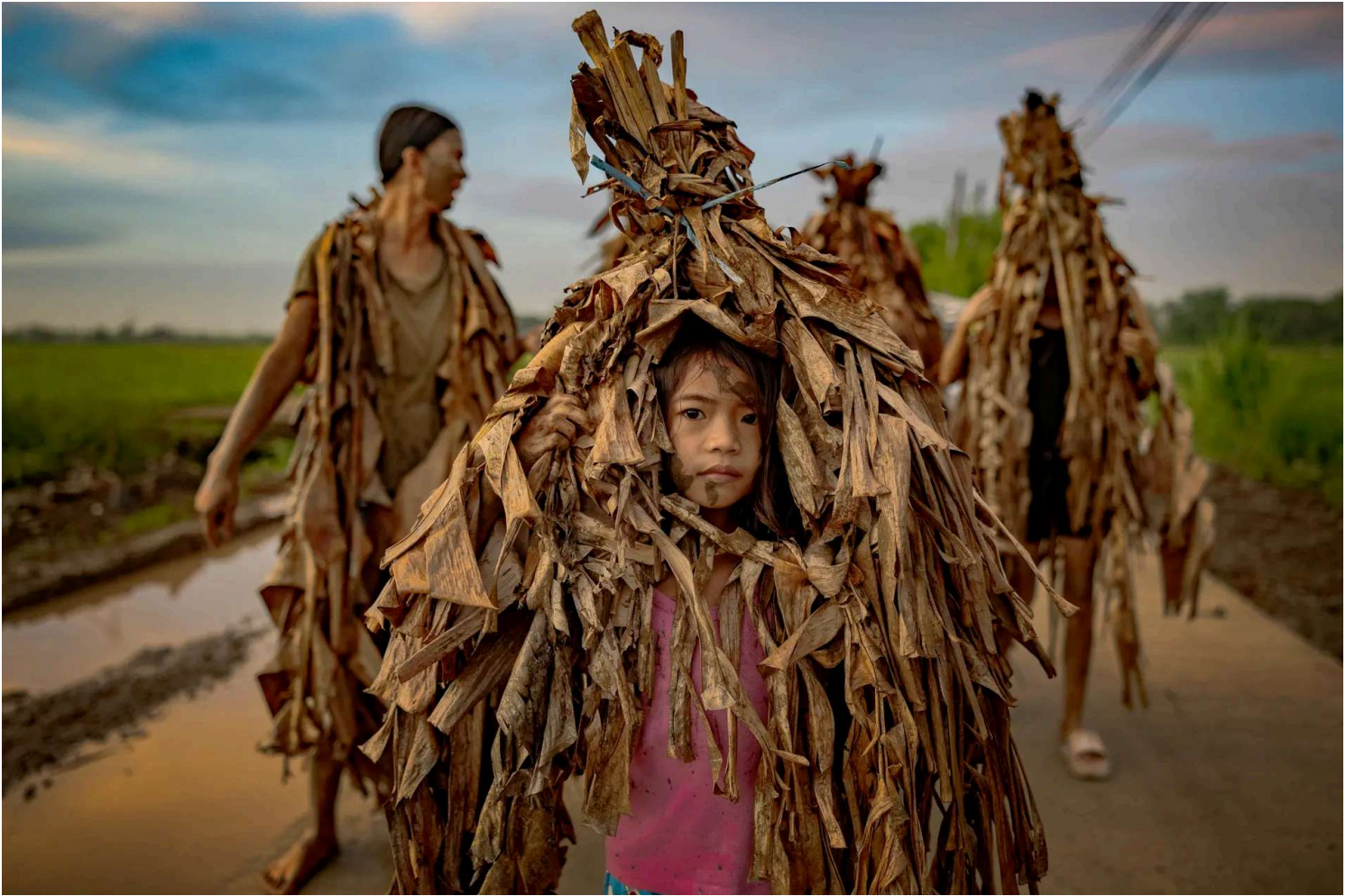
Devotees of the small farming village of Bibiclat celebrate the Feast of Saint John the Baptist while covered in banana leaves and mud in Aliaga, the Philippines, on June 24, 2025.