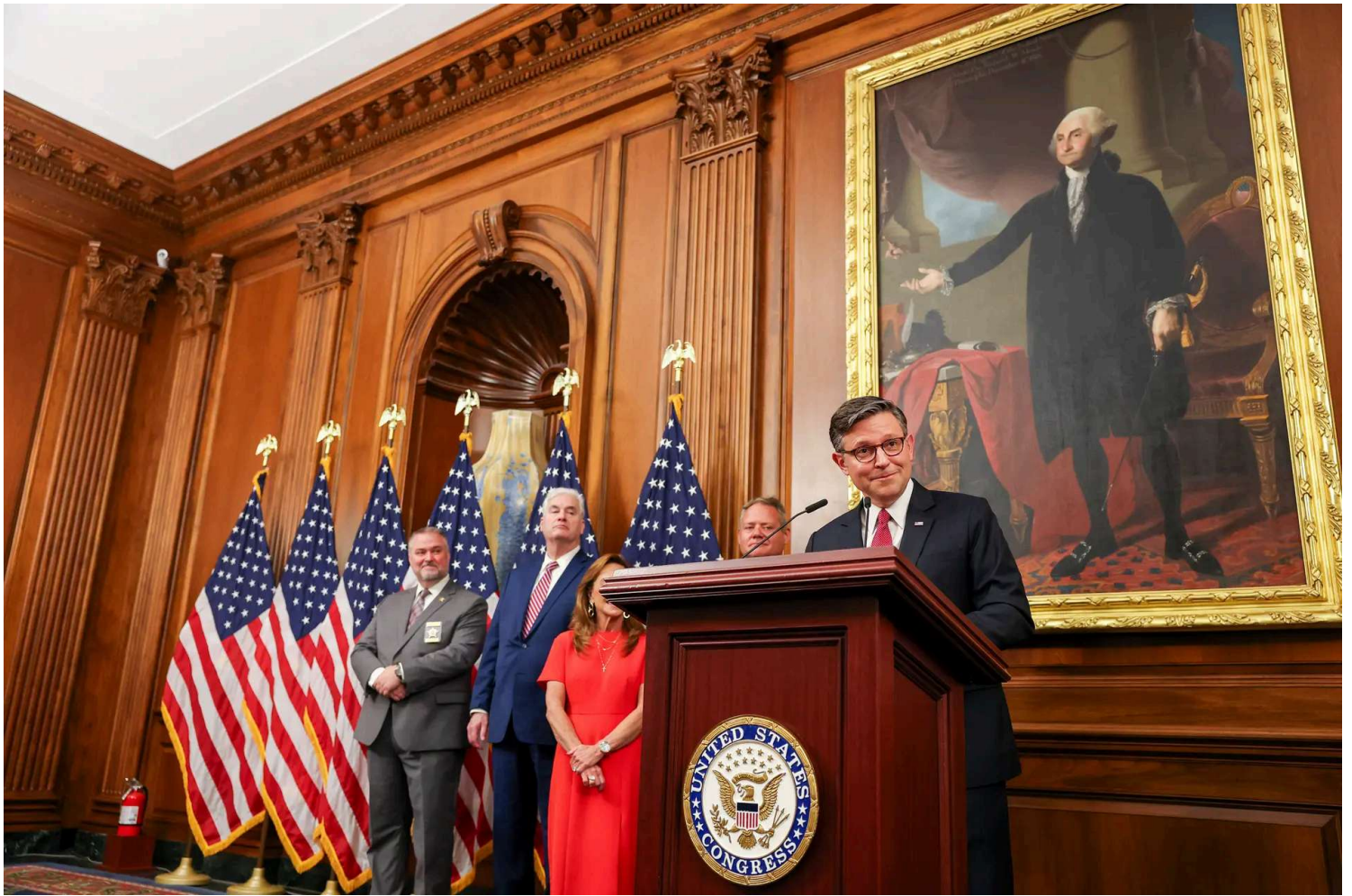
House Speaker Mike Johnson (R-La.) speaks during his weekly press conference at the U.S. Capitol in Washington on June 24, 2025. Johnson spoke on the current situation in the Middle East with Israel and Iran, as well as the hopeful passage of the One Big Beautiful Bill Act.