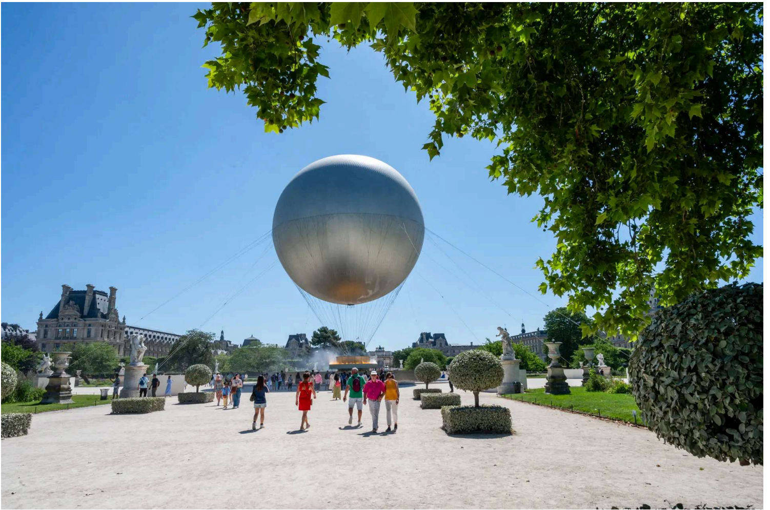
One year after the Olympic and Paralympic Games, the Paris 2024 Olympic cauldron returns to the Paris skyline, from June 21 to Sept. 14, in the Tuileries Gardens, Paris, on June 24, 2025.