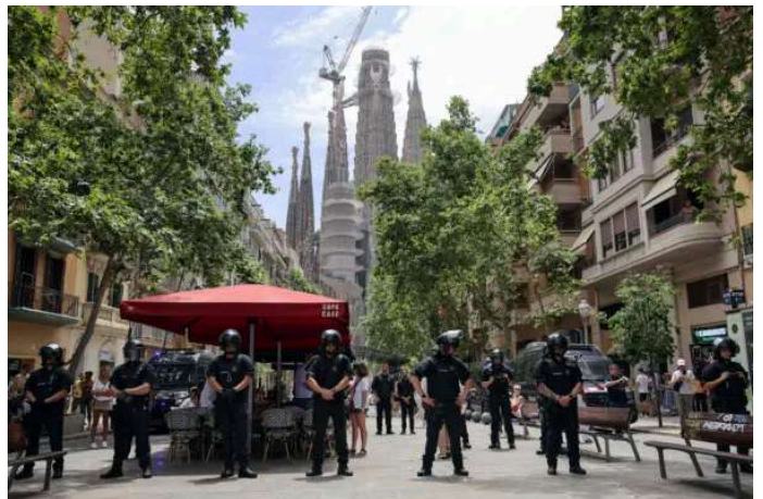
Day in Photos: Protests in Spain, First Veterans Day in Germany, Iran-Israel Strikes Continue