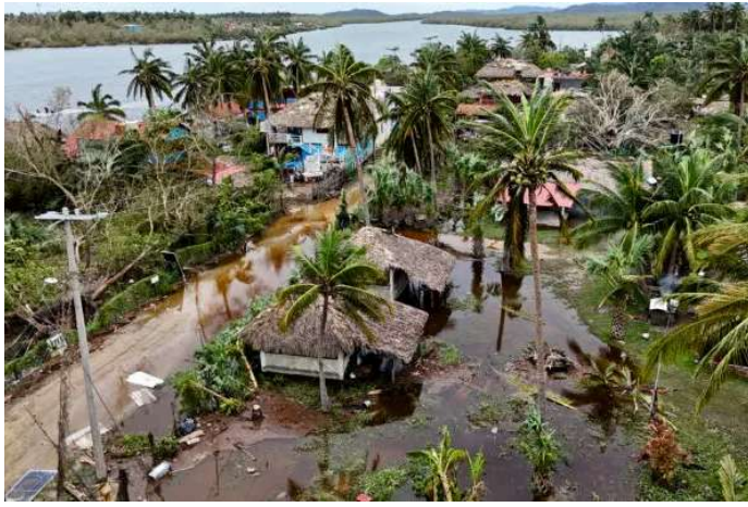
Day in Photos: Hurricane Erick, Flag Day in Argentina, and Solstice Yoga