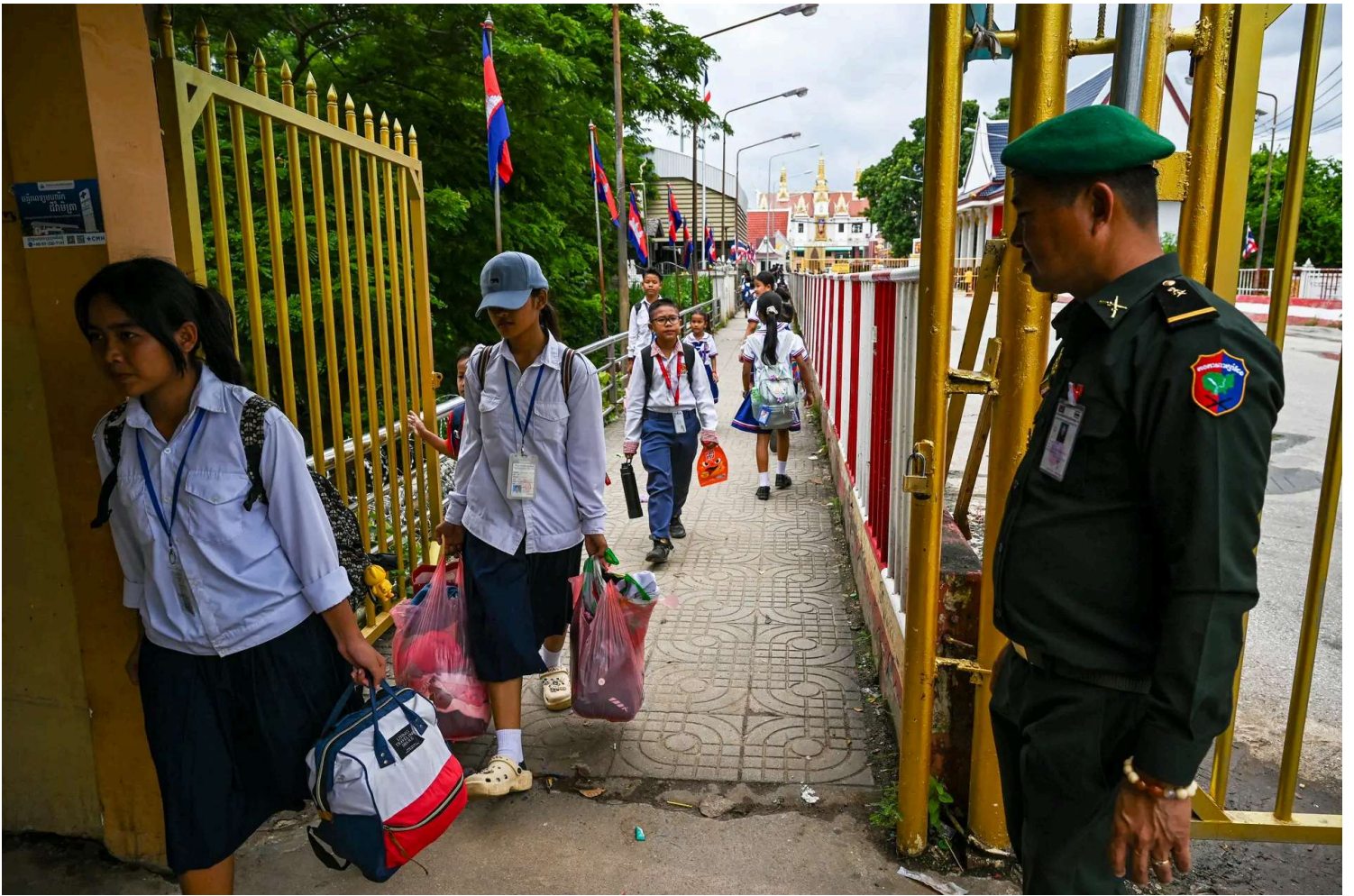
A Cambodian police officer stands guard as students are allowed to cross the closed Poipet International border checkpoint between Cambodia and Thailand, at Poipet town in Cambodia's Banteay Meanchey province, on June 24, 2025. Thailand's army closed border crossings with Cambodia in six provinces on June 23 to all vehicles and foot passengers except students and people seeking medical treatment, as a territorial row between the neighboring countries rages.