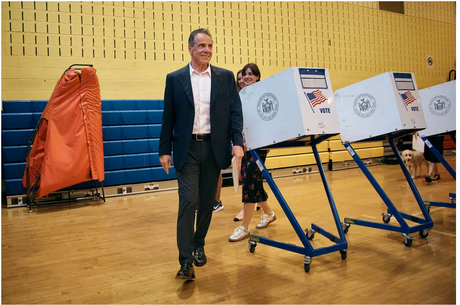
New York mayoral candidate Andrew Cuomo departs after voting in the Democratic primary at the High School of Art and Design in New York City, on June 24, 2025. The latest polls show a near tie between former Gov. Cuomo and his rival to the left, state Assemblymember Zohran Mamdani.