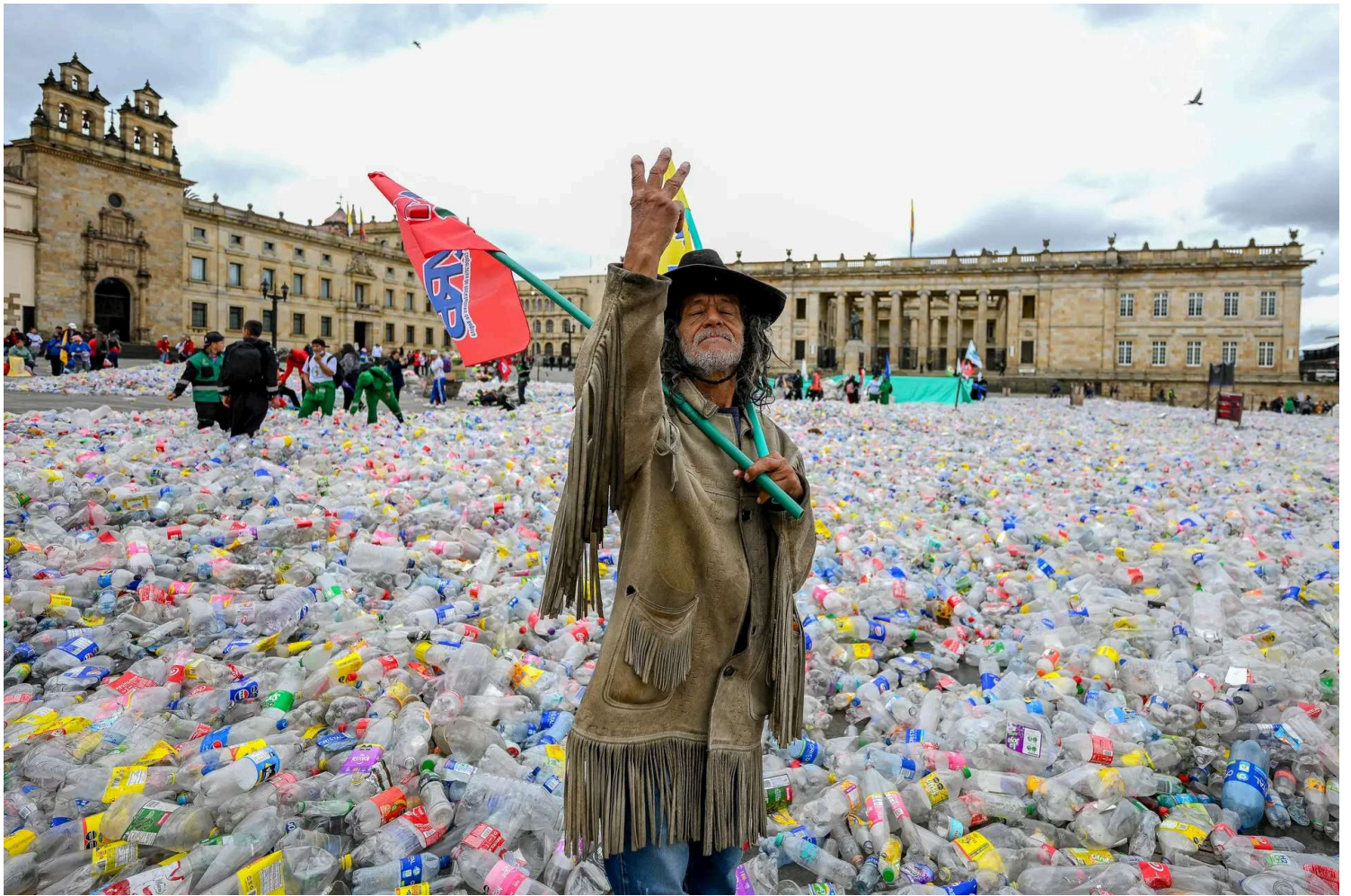
A member of the National Association of Recyclers of Bogota takes part in a protest against government neglect and difficult living conditions at Bolivar Square in Bogota, Colombia, on June 24, 2025.