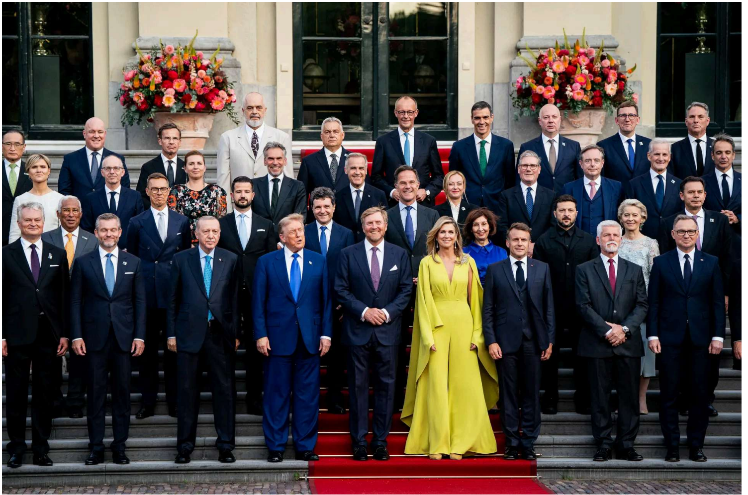
Leaders of NATO member countries pose for a group photo as they attend a social dinner at the Huis ten Bosch Royal Palace during a North Atlantic Treaty Organization (NATO) Heads of State and Government summit in The Hague, on June 24, 2025. NATO leaders are holding a two-day summit on June 24 and 25 in The Hague.