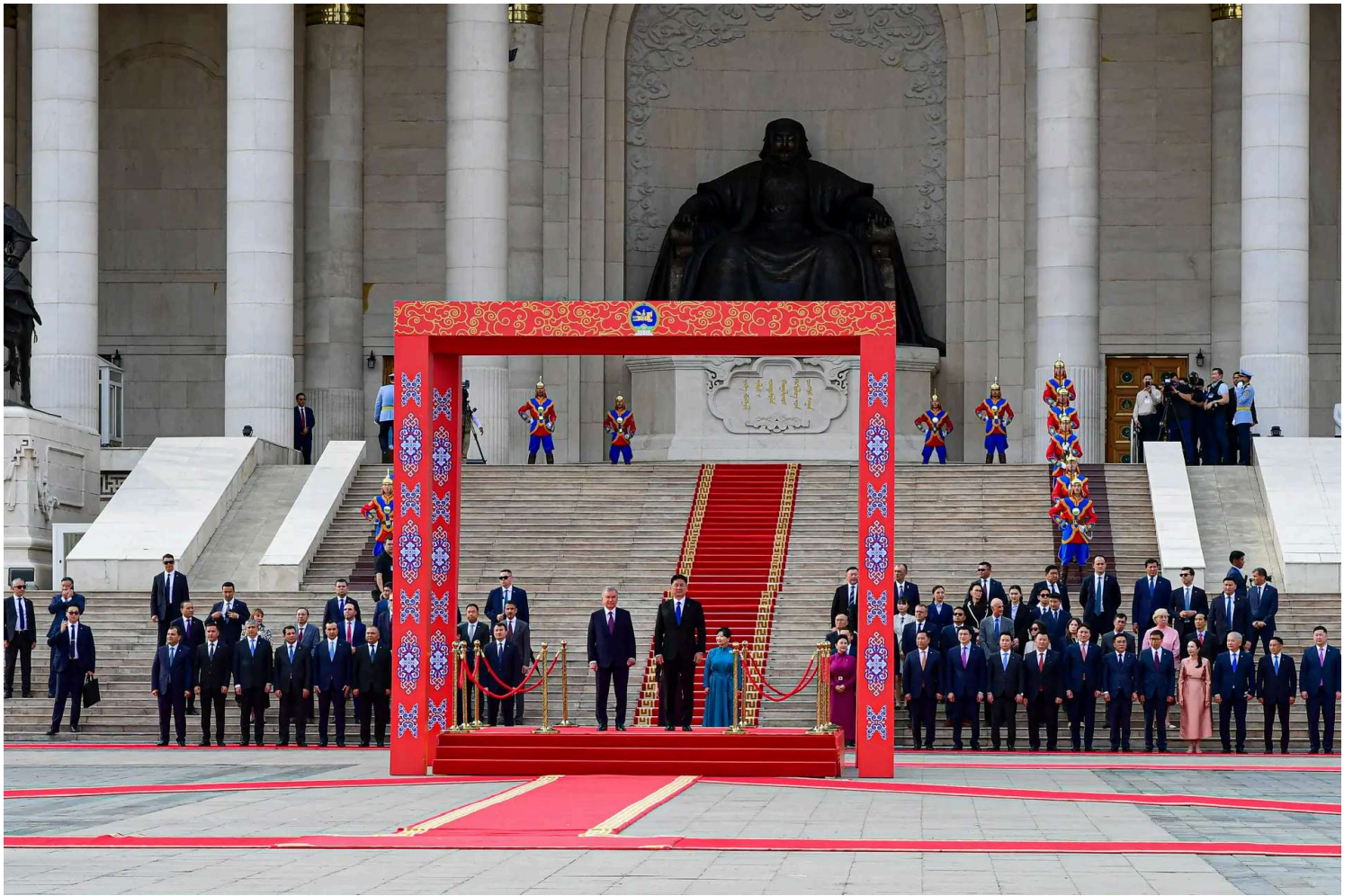
Mongolian President Ukhnaagiin Khurelsukh (R) welcomes Uzbekistan President Shavkat Mirziyoyev (L) in front of the Government Palace in Ulaanbaatar, Mongolia, on June 24, 2025.