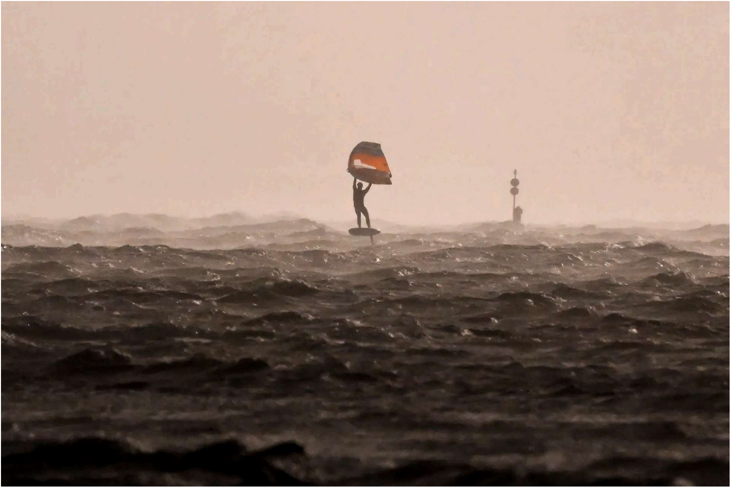
A man wingsurfs in the rain on a stormy winter's day on Melbourne Port Phillip Bay as a cold weather front hits parts of southern Australia, on June 25, 2025.