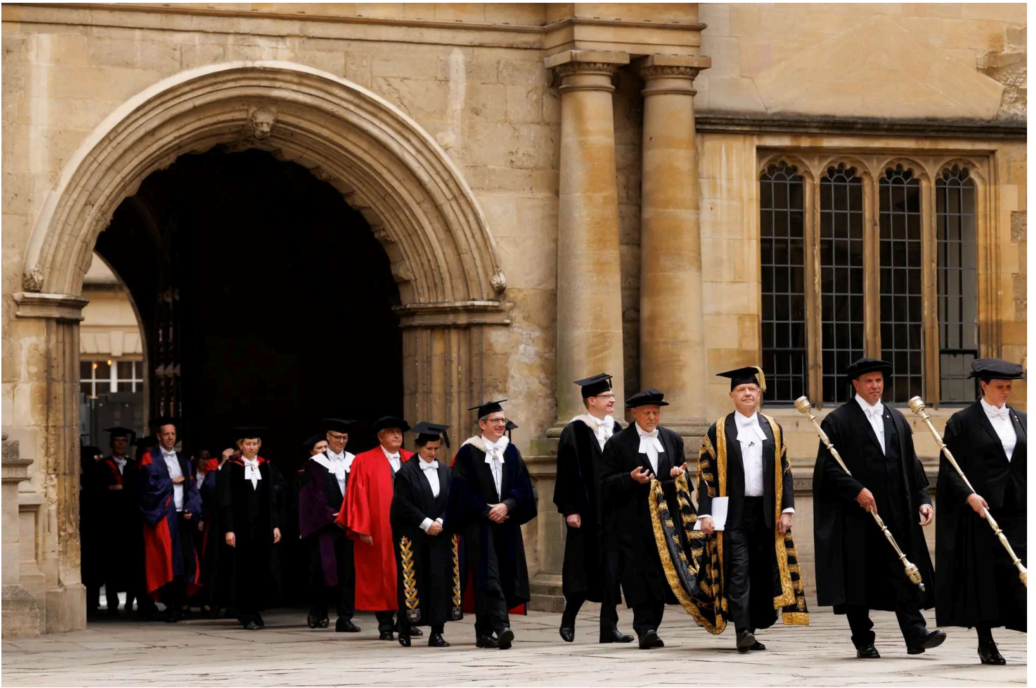
Oxford's 160th Chancellor, Lord William Hague (in black and gold robe) takes part in the procession during the Encaenia ceremony in Oxford, England, on June 25, 2025.