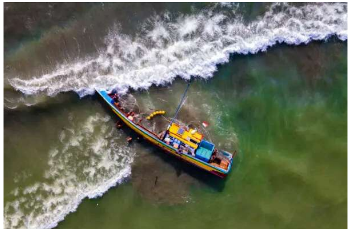
Day in Photos: Ship Capsizes in Indonesia, Forest Fires in Greece, Amazon Launches Satellites