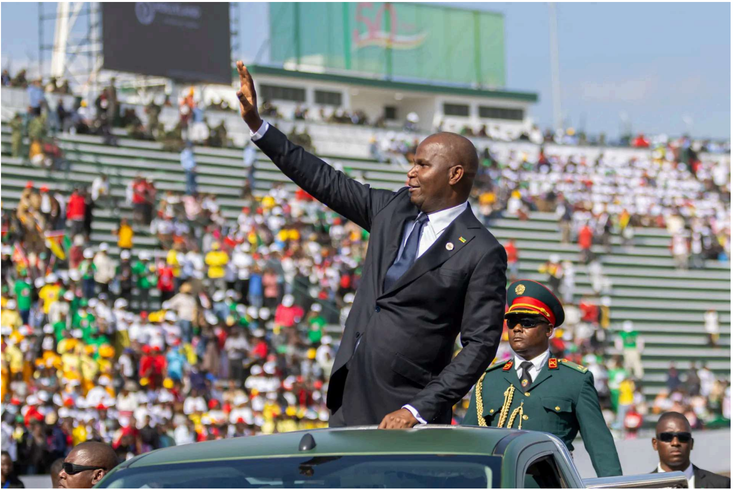
Mozambican President Daniel Chapo of the Mozambican Liberation Front (FRELIMO) party greets supporters during the 50th anniversary celebration of Mozambique's independence at Machava Stadium, Maputo, on June 25, 2025.