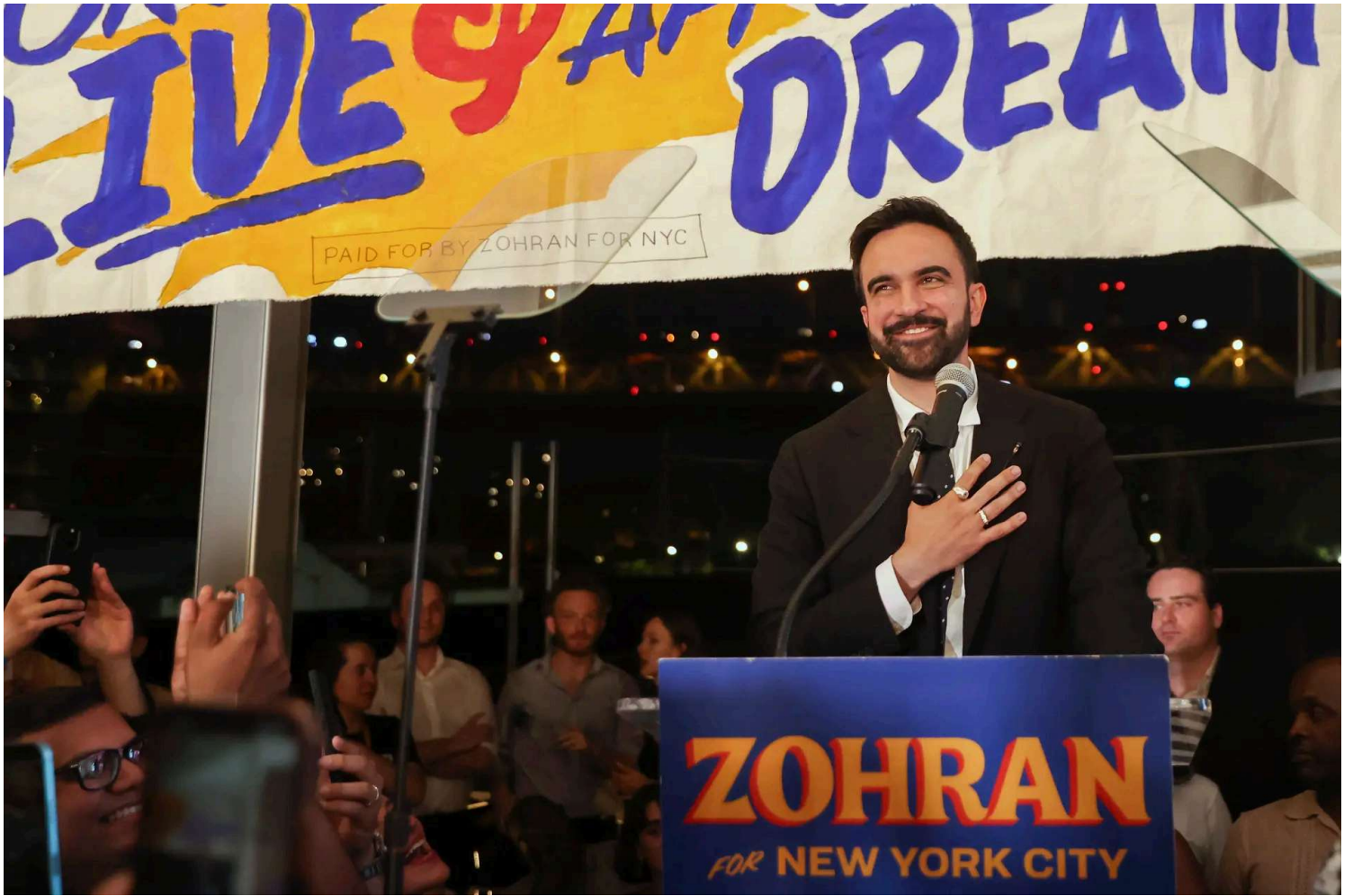
Democratic mayoral candidate Zohran Mamdani takes the stage at his primary election party in New York City, on June 25, 2025.