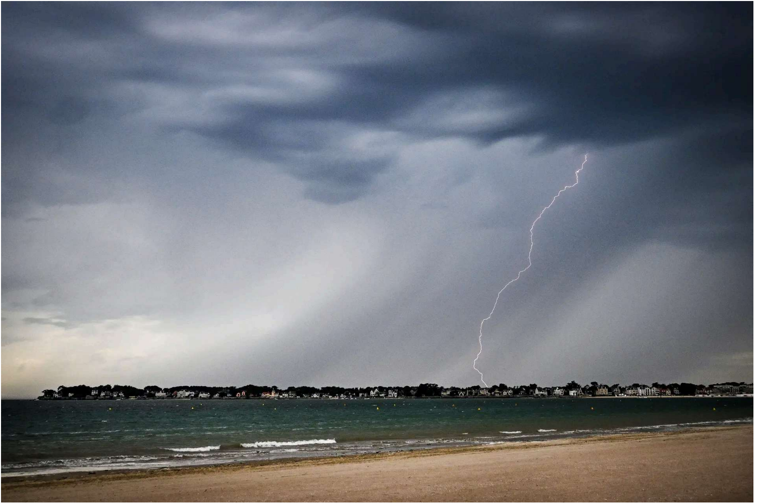
A lightning bolt lights up the sky during a thunder storm over the city of La Baule, France, on June 25, 2025.