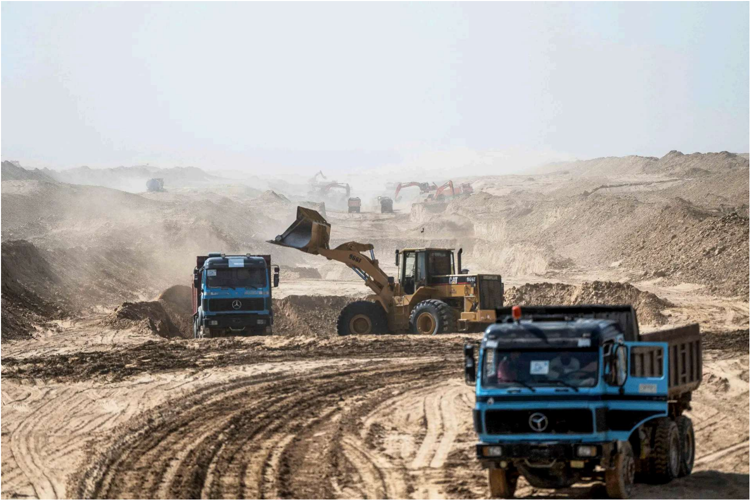
A bulldozer conveys excavated soil from the construction site of the Qosh Tapa Canal project onto a truck, at the Andkhoy district in Faryab province, Afghanistan, on June 22, 2025.