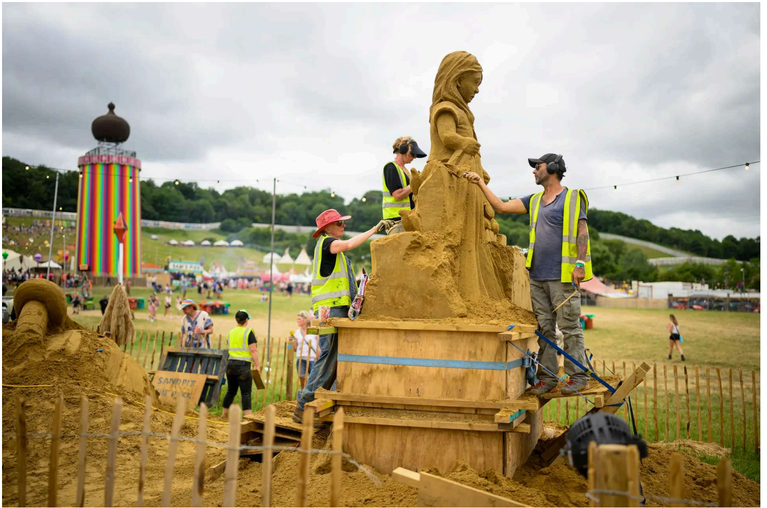
A team works on a sand sculpture during day one of Glastonbury festival 2025 at Worthy Farm, Pilton in Glastonbury, England, on June 25, 2025. Established by Michael Eavis in 1970, Glastonbury has grown into the UK's largest music festival, drawing more than 200,000 fans to enjoy performances on more than 100 stages.

Sign up for Epoch Focus newsletter. Focusing on one key topic at a time, diving into the critical issues shaping our world. Sign up with 1-click >>