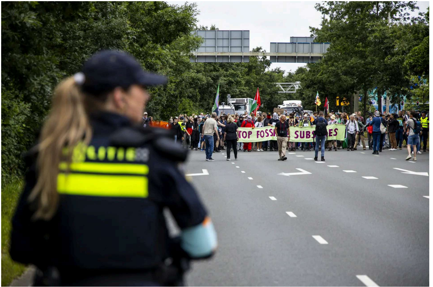
Demonstrators from Extinction Rebellion (XR) organization block a road near the A12 highway to protest the NATO summit in The Hague, Netherlands, on June 25, 2025, as NATO leaders hold a two-day summit there on June 24 and 25.