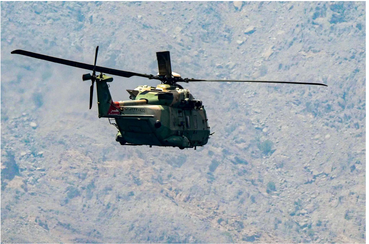
An Omani NH90 military helicopter patrols in the Strait of Hormuz off Khasab in Oman's northern Musandam peninsula, on June 25, 2025.