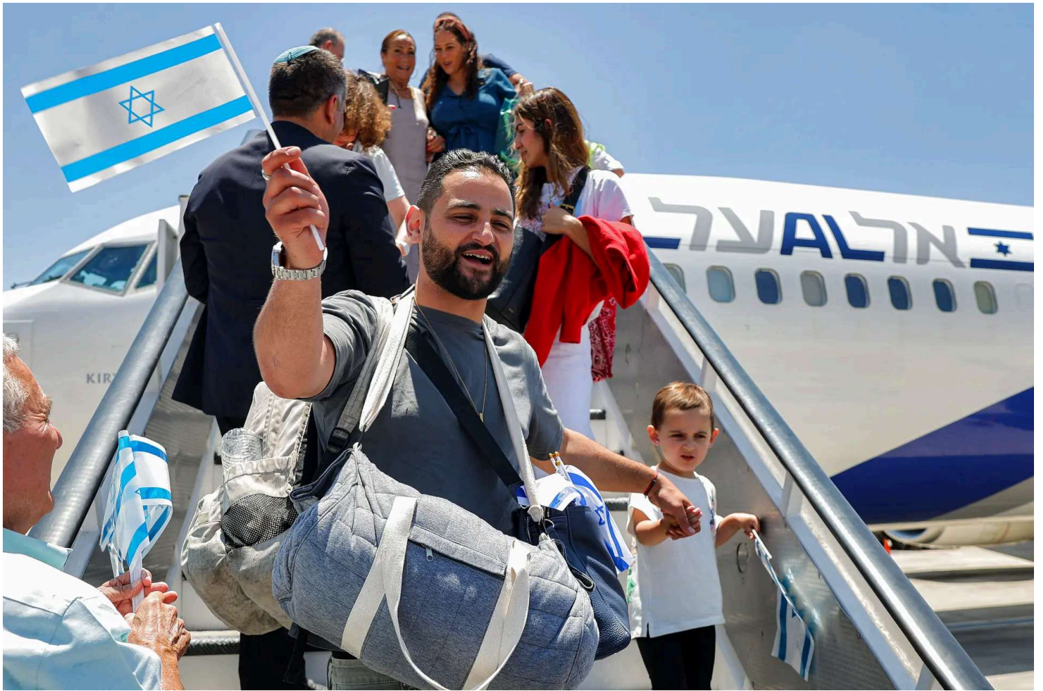
Jewish migrants making Aliyah (immigration to Israel) are handed miniature Israeli flags upon disembarking from an Israeli El Al aircraft after they arrive at Ben Gurion Airport in Lod, on June 25, 2025.