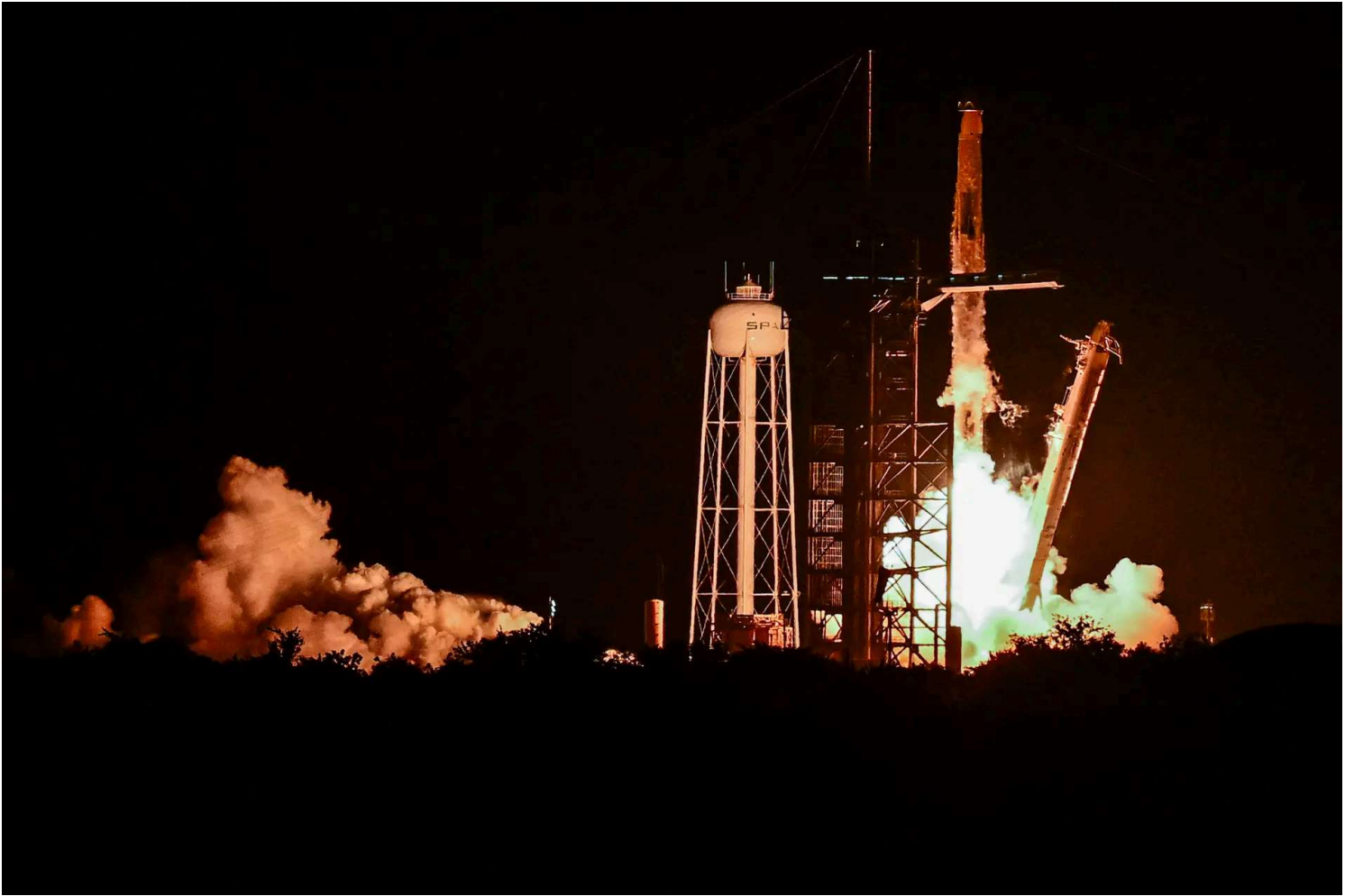
The Axiom-4 mission, with a SpaceX Dragon spacecraft and Falcon 9 rocket, lifts off from Launch Complex 39A at NASA's Kennedy Space Center in Cape Canaveral, Fla., on June 25, 2025. A U.S. commercial mission carrying astronauts from India, Poland, and Hungary lifted off to the International Space Station, taking people from these countries to space for the first time in decades.