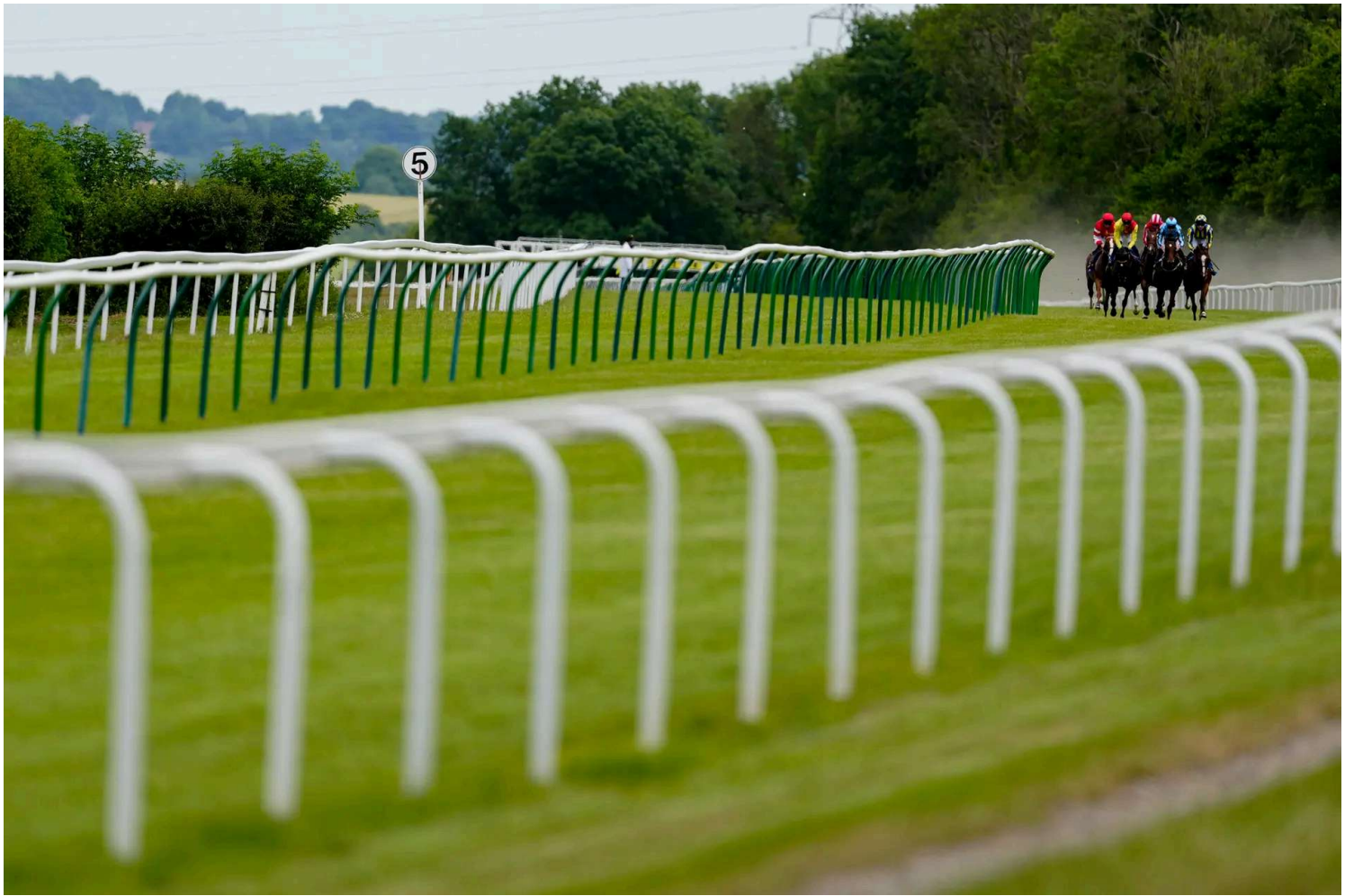
Runners make their way up the course during The Dragon Symbol Standing At Whitsbury Manor British EBF Blagrave Maiden Stakes with Salisbury Cathedral in the background at Salisbury Racecourse in Salisbury, England, on June 25, 2025.