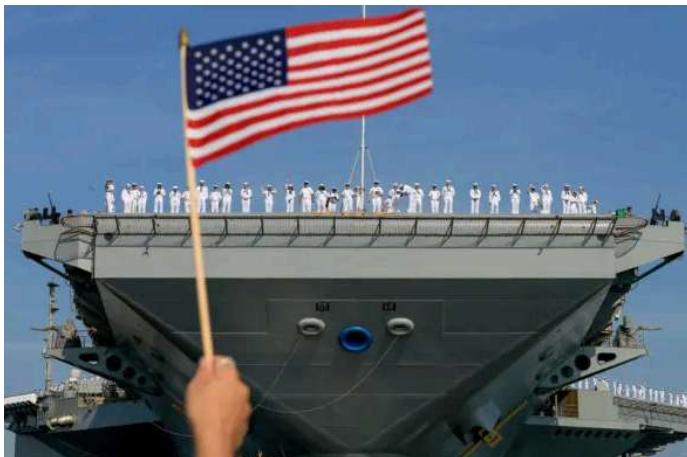
Day in Photos: Aircraft Carrier Departure, NATO Summit, and Olympic Cauldron Returns to Paris