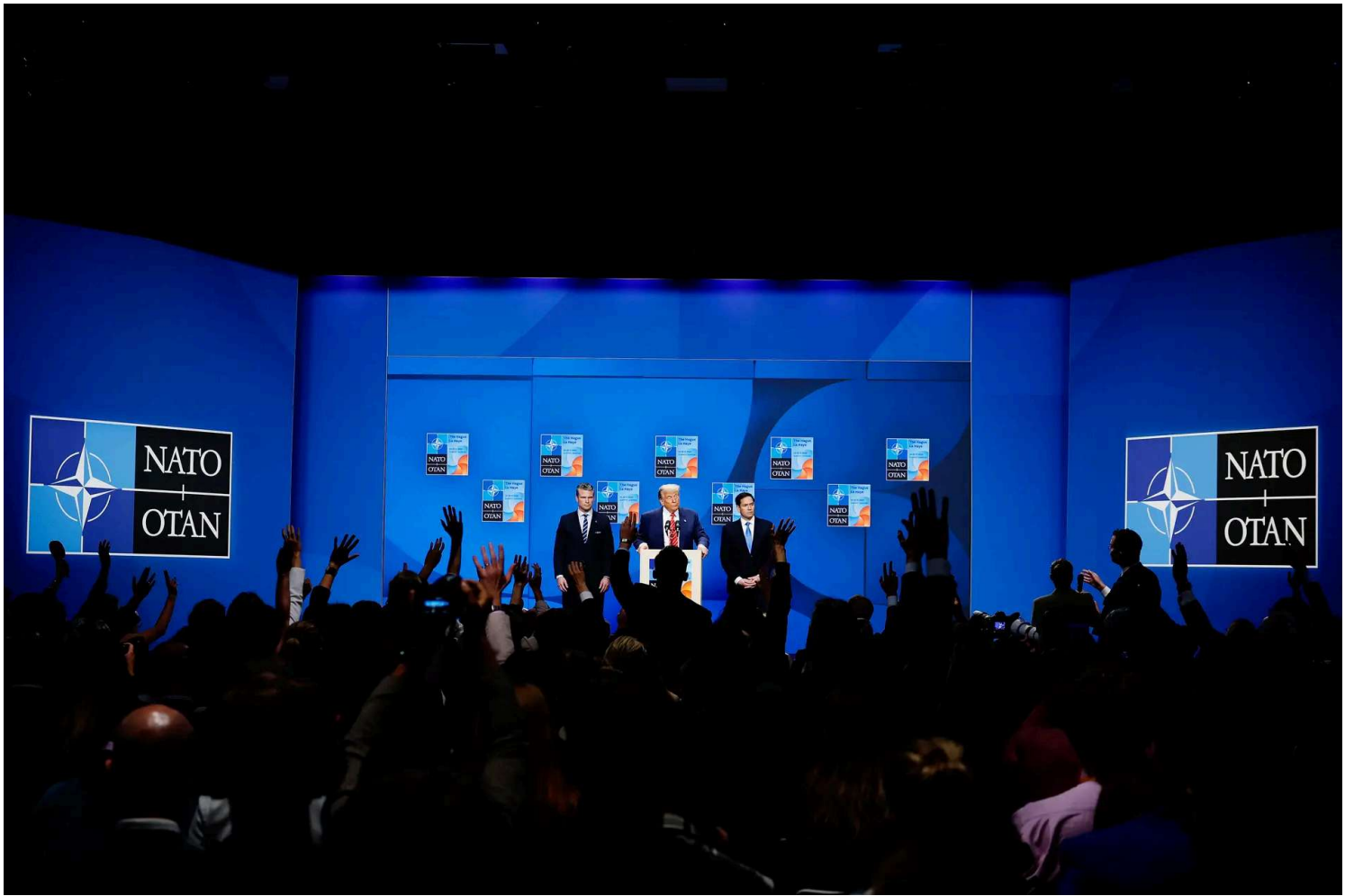
President Donald Trump takes questions during a news conference following the 2025 NATO Summit in The Hague, Netherlands, on June 25, 2025. Among other matters, members are to approve a new defense investment plan that raises the target for defense spending to 5 percent of GDP.