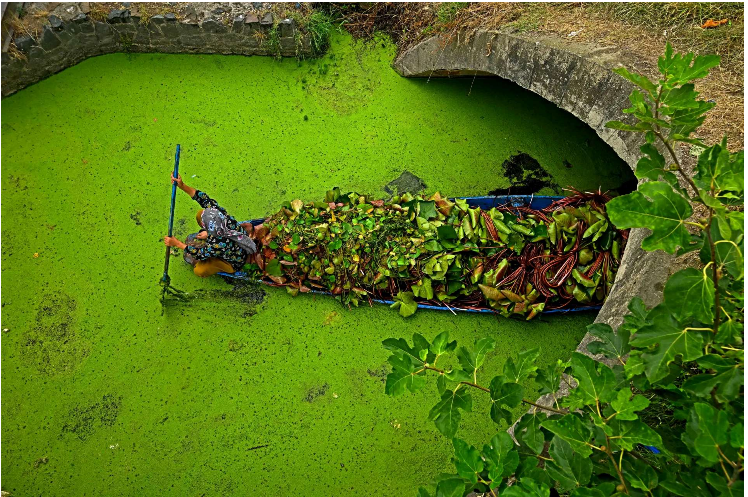
A woman rows a boat carrying lotus roots on Dal Lake in Srinagar, India, on June 25, 2025.