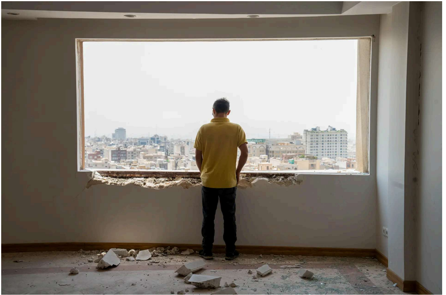
A person looks out of a window amid the remains of a residential building in the Saadat Abad neighborhood that was struck by an Israeli attack on June 13, in Tehran, Iran, on June 26, 2025.