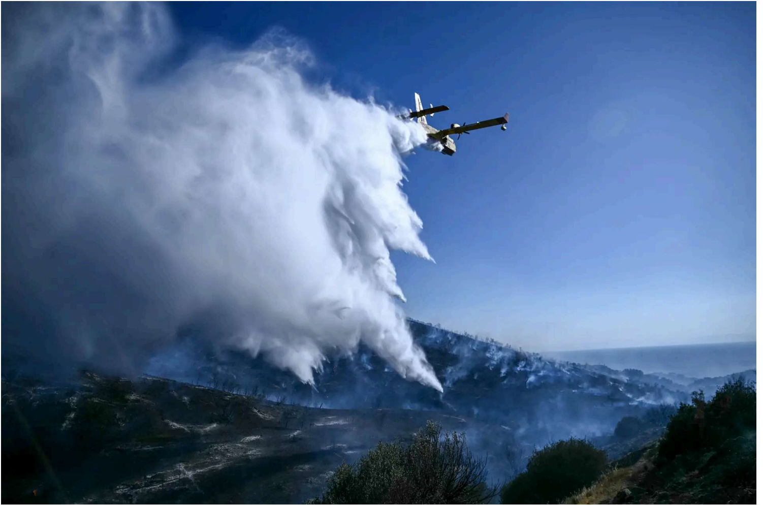
A Canadair firefighting aircraft drops water on a forest fire near Thymari, southeast of Athens, Greece, on June 26, 2025. The fire broke out near the seaside towns of Palaia Fokaia and Thymari, 50 km from Athens, leading to evacuations and damaging houses, according to the Greek fire department and public broadcaster Ert.