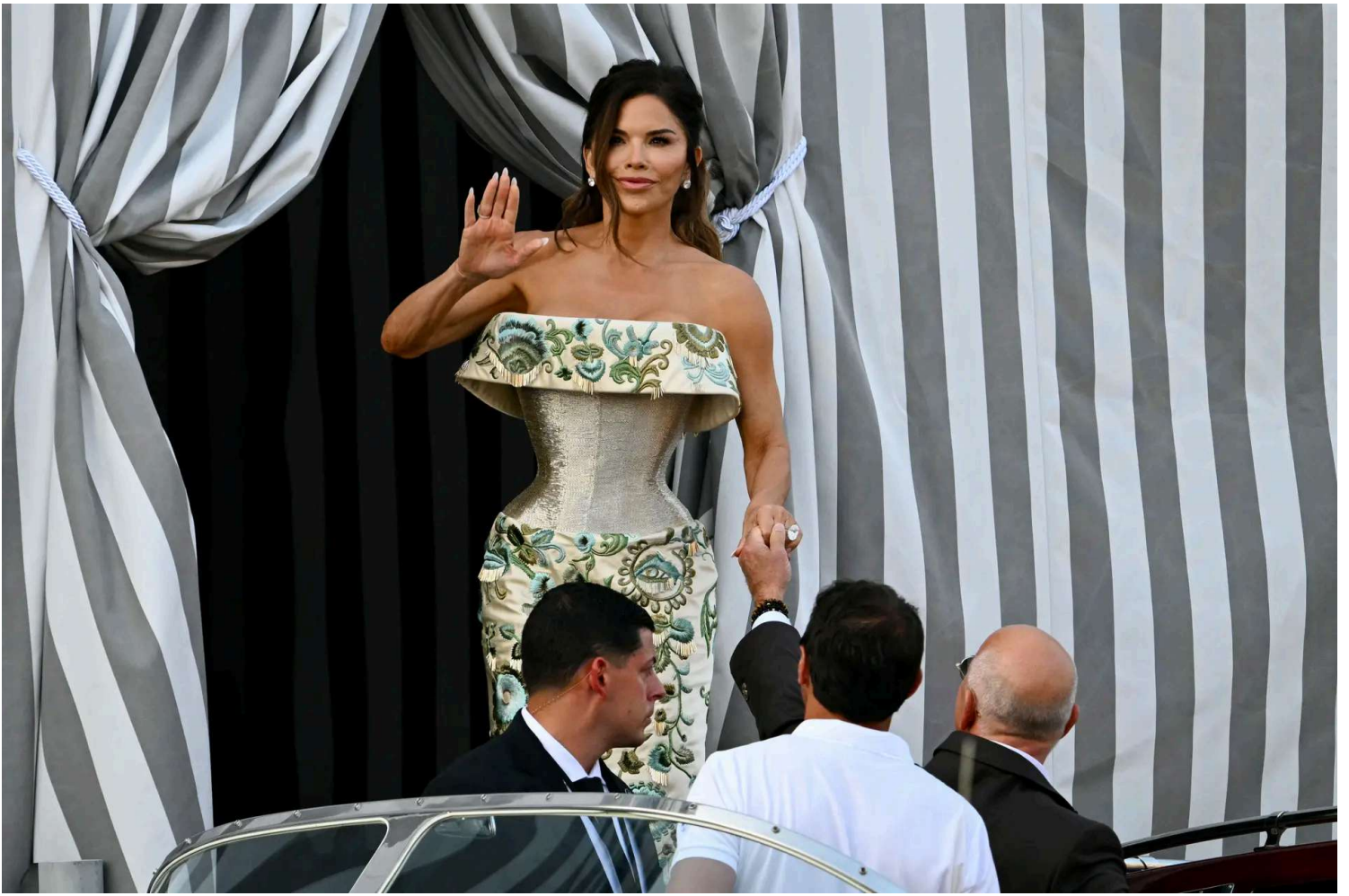
Amazon founder Jeff Bezos and his bride-to-be board a taxi boat at the Aman Hotel in Venice, on June 26, 2026. Celebrities in superyachts are sailing into Venice this week for the three-day wedding party of the tycoon and Lauren Sanchez.