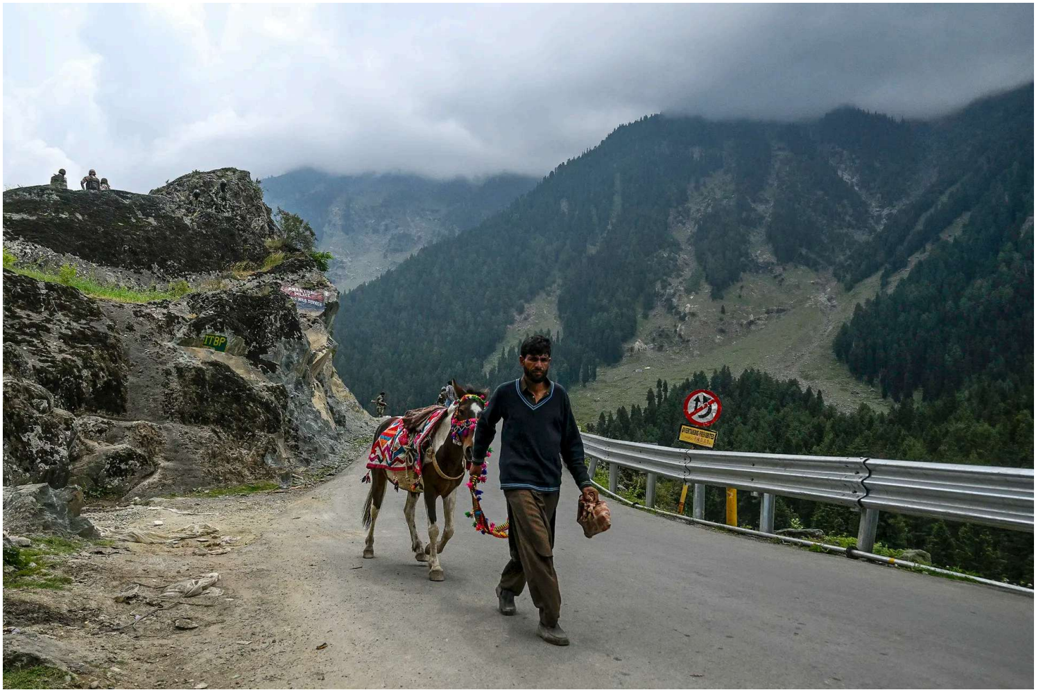
A potter and his horse walk on a road ahead of the annual Hindu pilgrimage to the holy cave shrine of Amarnath at Chandanwari, about 115 km southeast of Srinagar, India, on June 26, 2025.