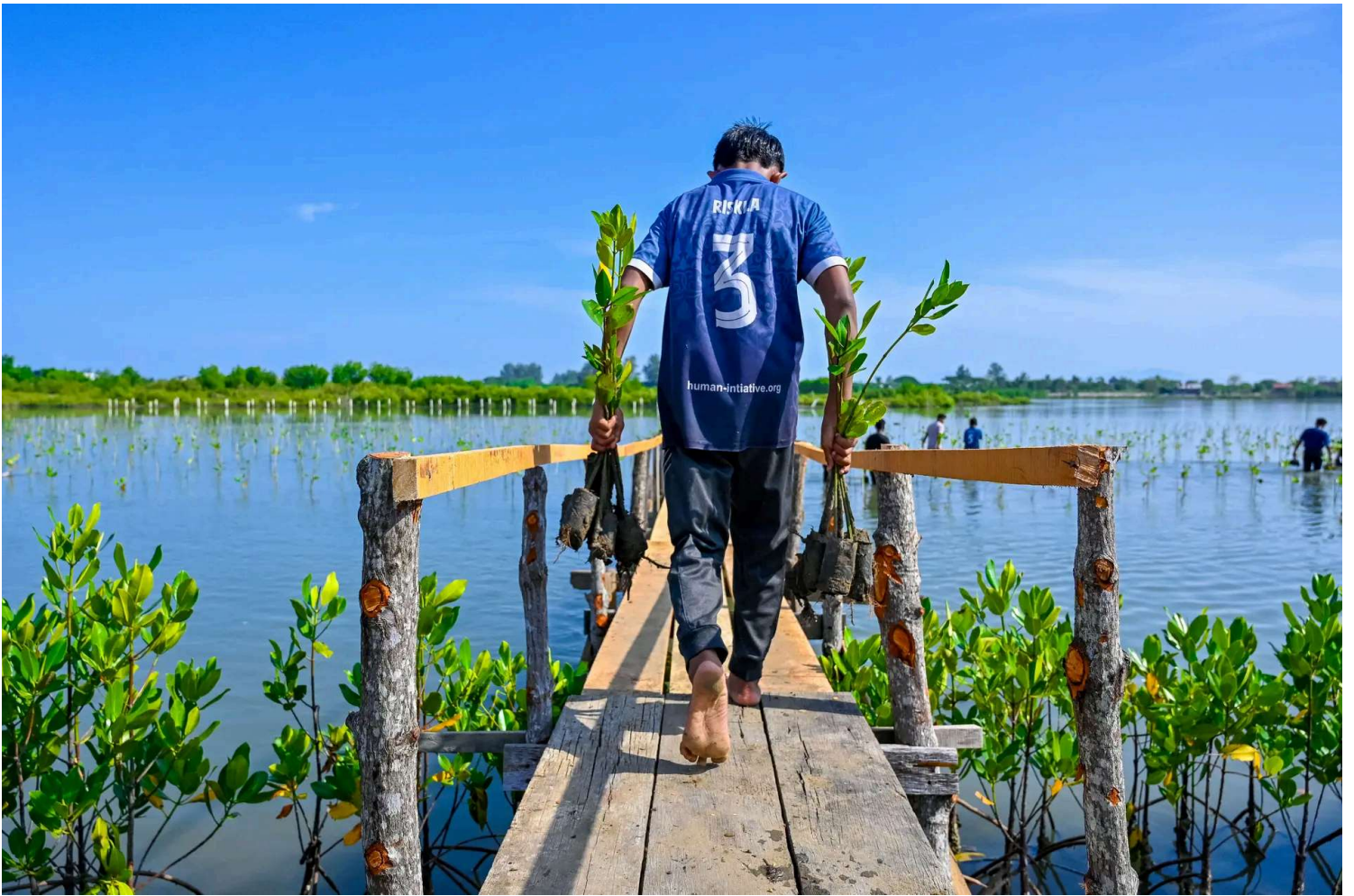
Volunteers plant mangrove seedlings at a beach that was devastated by the Boxing Day 2004 Indian Ocean earthquake and tsunami at Kajhu on the outskirts of Banda Aceh, Indonesia, on June 26, 2025.