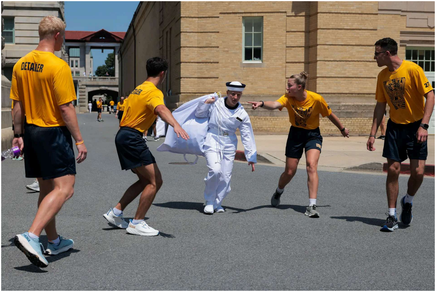
Detailers yell at new arrivals while they move to their next station at the U.S. Naval Academy in Annapolis, Md., on June 26, 2025. To mark the start of Plebe Summer, approximately 1,200 plebes, or freshmen in the Class of 2029, take part in Induction Day, which involves In-processing, medical exams, uniform fittings, haircuts, and learning to salute.