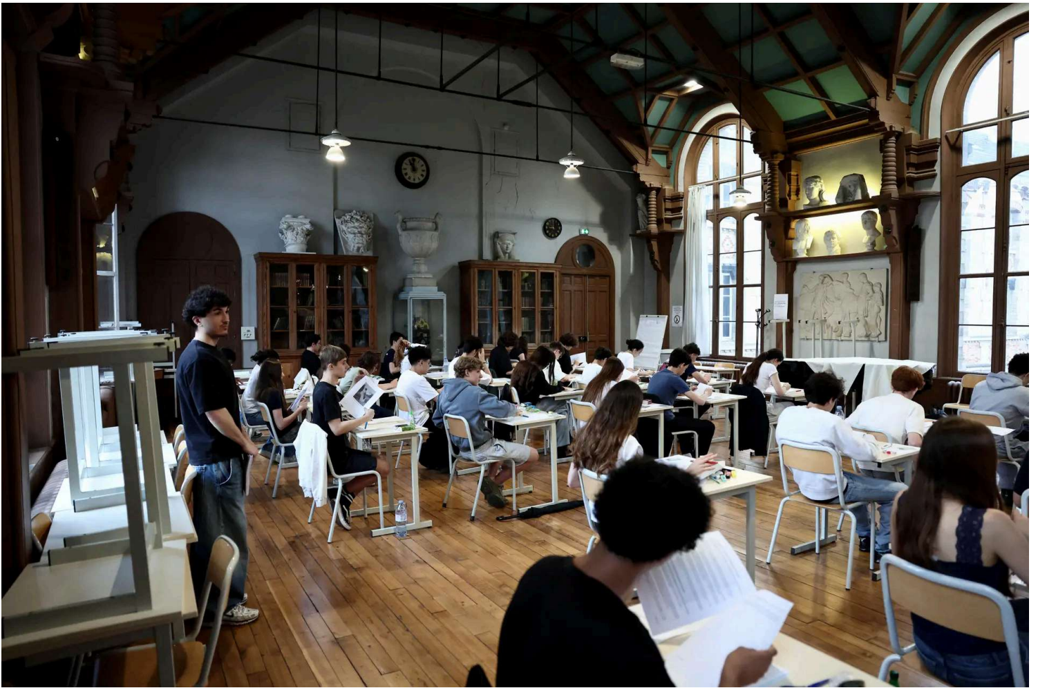
Students take the "Epreuve du Brevet"—secondary school certificate test—at the Chaptal School in Paris, on June 26, 2025.