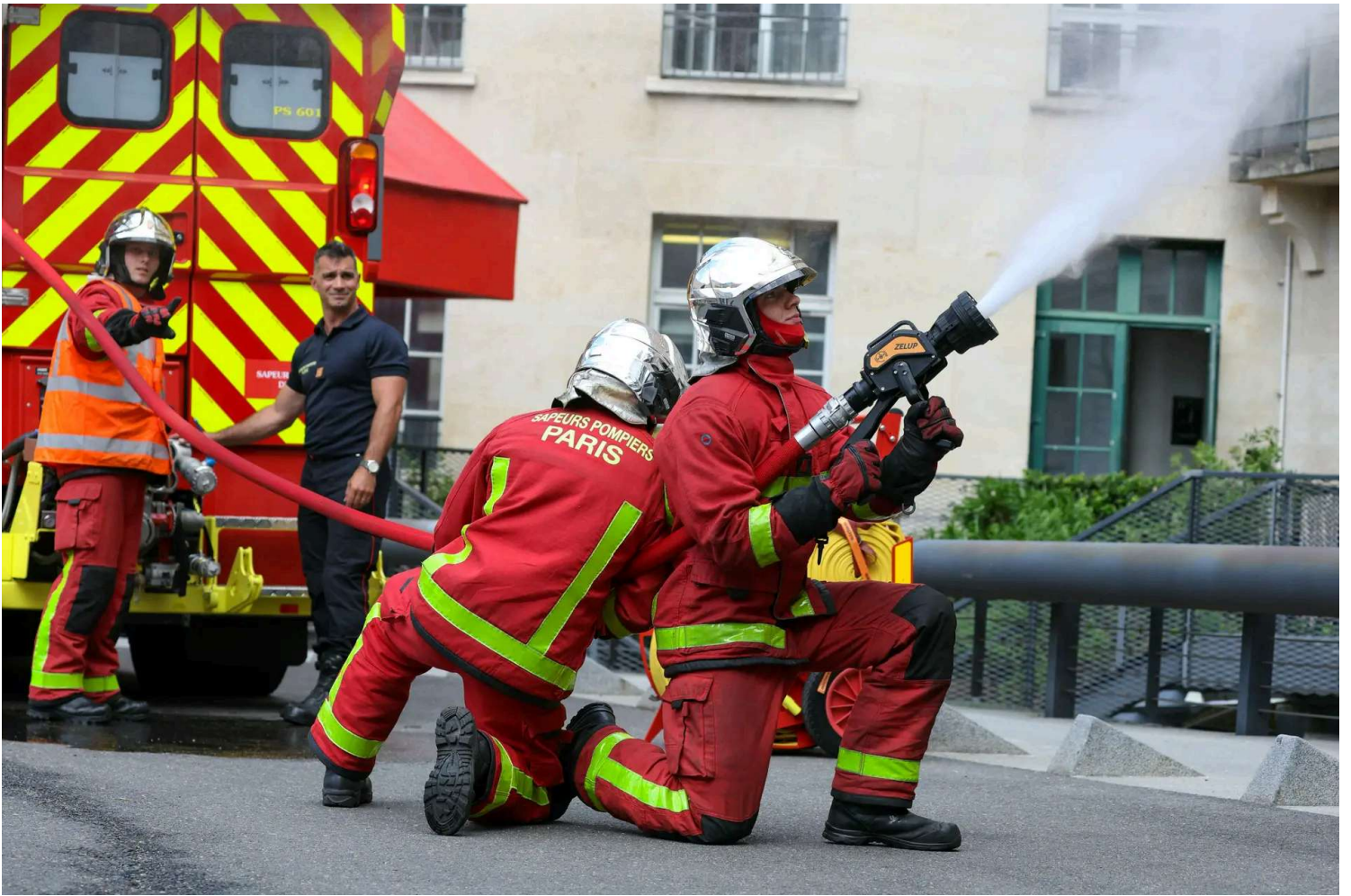
A Paris firefighter operates a firehose with the Zelup nozzle, a new