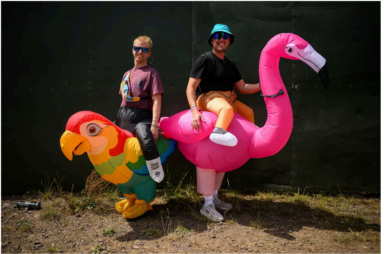
Festival-goers wearing inflatable bird costumes pose for photos during day two of the Glastonbury festival 2025 at Worthy Farm, Pilton in Glastonbury, England, on June 26, 2025. Established by Michael Eavis in 1970, Glastonbury has grown into the UK's largest music festival, drawing more than 200,000 fans to enjoy performances across more than 100 stages.

Sign up for the Morning Brief newsletter. Join 200,000+ Canadians who receive truthful news without bias or agenda, investigative reporting that matters, and important stories other media ignore. Sign up with 1-click >>