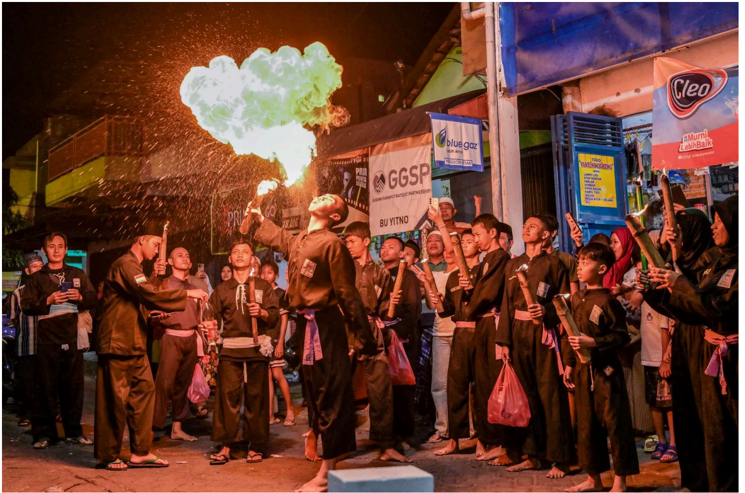
An Indonesian Muslim youth performs a fire-breathing act during a parade marking the beginning of the Islamic new year in Surabaya, Indonesia, on June 26, 2025.