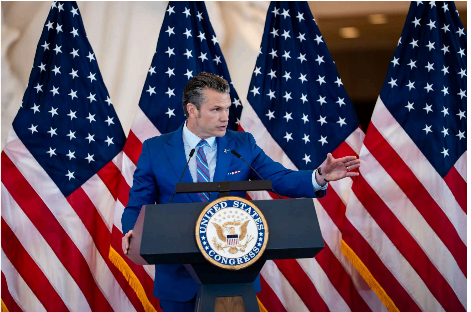
Defense Secretary Pete Hegseth speaks during the gold medal ceremony for the U.S. Army Rangers of WWII in the Emancipation Hall of the U.S. Capitol building in Washington, on June 26, 2025.