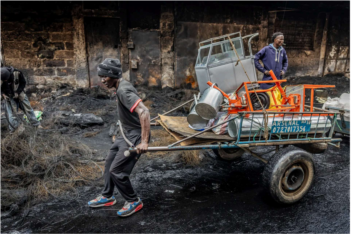
A worker pushes a cart carrying items through a commercial area that was vandalized and torched during deadly protests marking one year since the storming of parliament by anti-tax demonstrators in Nairobi, Kenya. At least 16 people died in protests across Kenya on June 25, 2025, Amnesty International said on June 26, 2025, as businesses and residents were left to clean up the devastation in the capital and beyond.