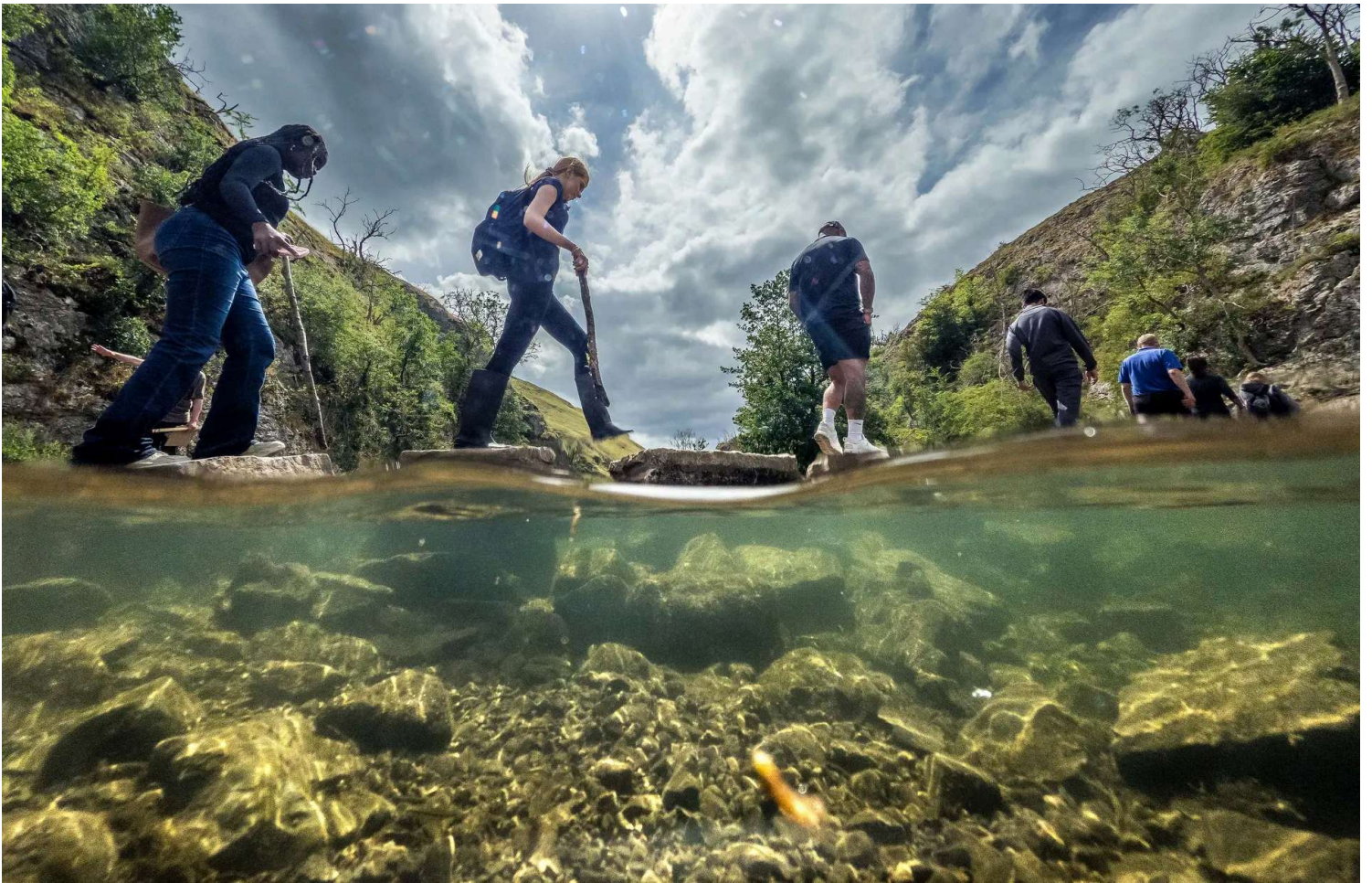
People cross the stepping stones in the River Dove at Dovedale in the Peak District National Park in Ashbourne, England, on June 26, 2025. Water companies will now have to use nature-based solutions when managing wastewater, as the Water (Special Measures) Act 2025 comes into force.