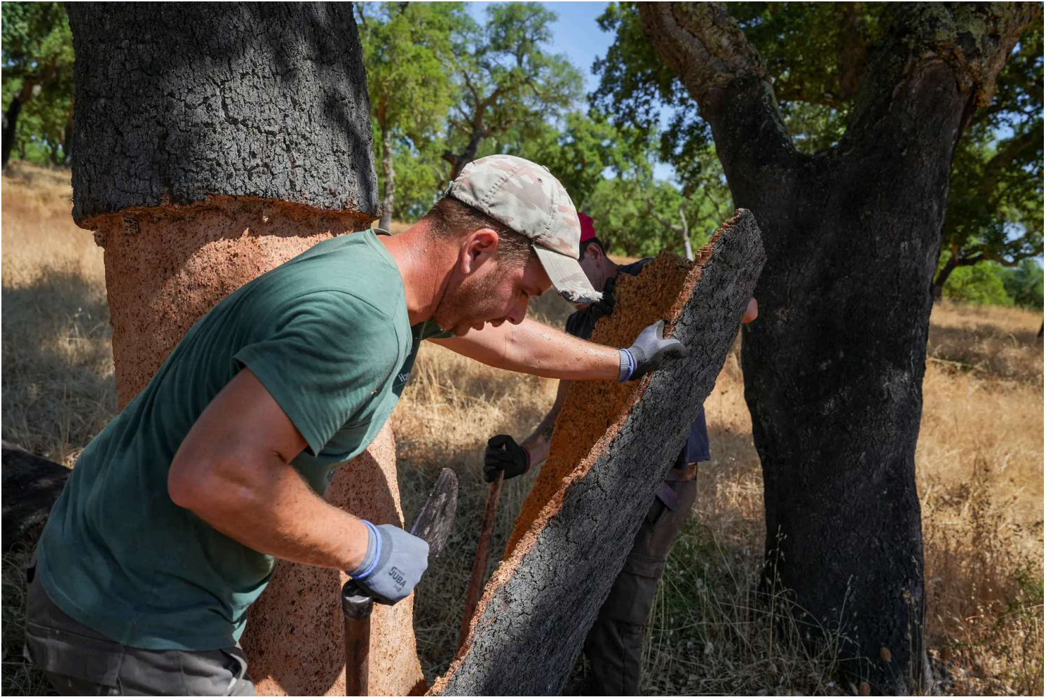
Workers manually harvest cork, a task that requires a lot of effort due to the high temperatures and physical demands, on a farm near Couço, Portugal, on June 26, 2025. Portuguese cork producers, part of one of the country's most important export sectors, are facing growing uncertainty as the United States moves forward with plans to introduce new tariffs on a range of European products.