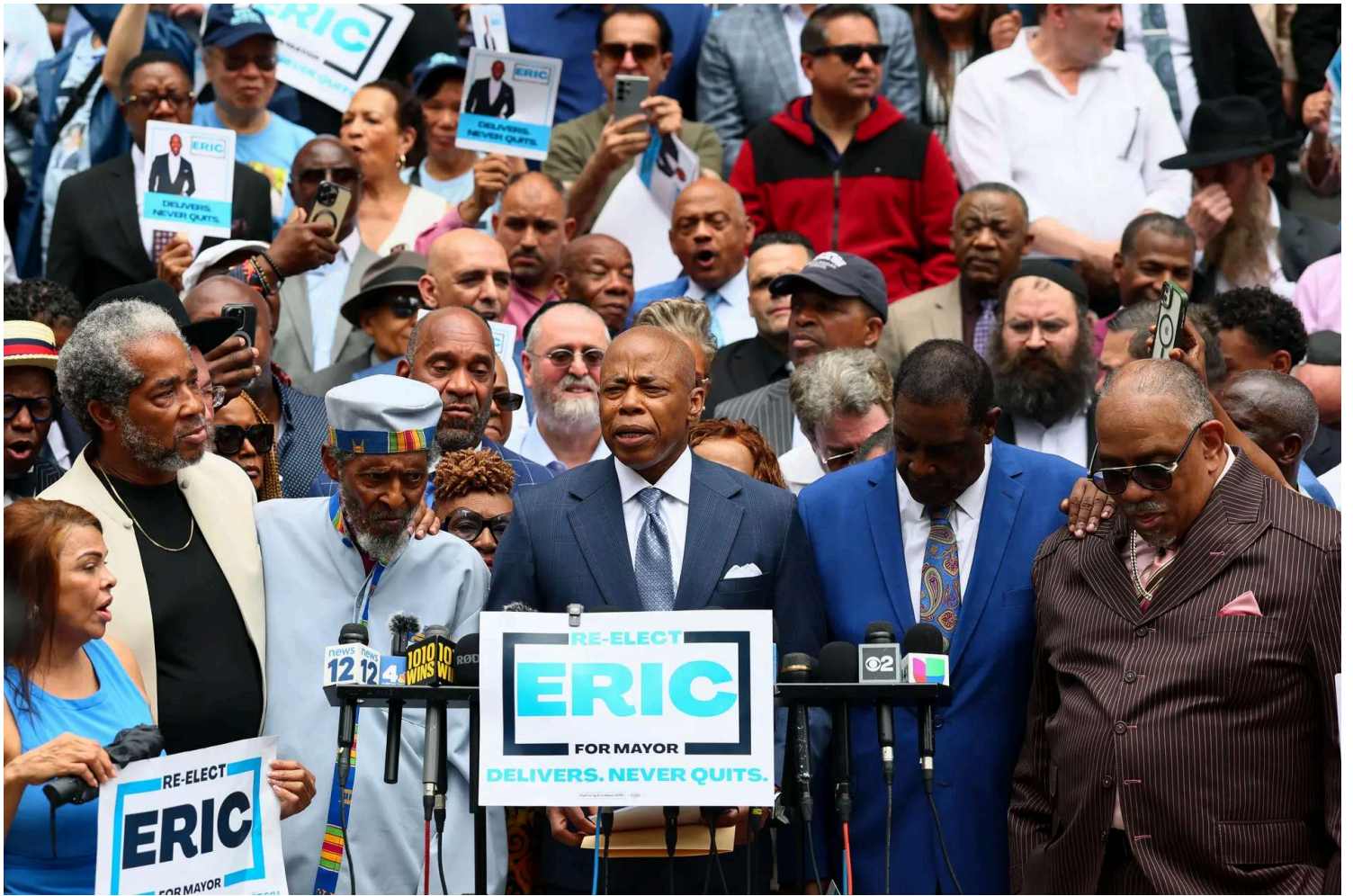
New York City Mayor Eric Adams speaks during a press conference at City Hall in New York, on June 26, 2025. Adams announced his reelection campaign on the steps of City Hall days after state Assemblyman Zohran Mamdani won the Democratic primary.