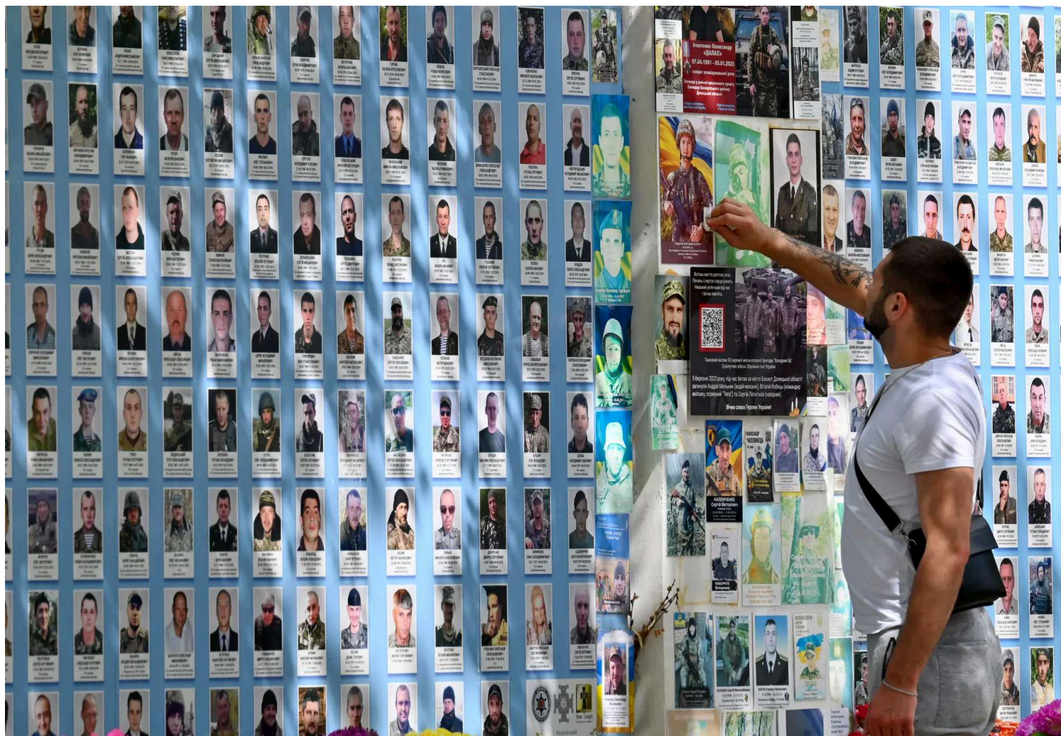
A man cleans dust from the portrait of a fallen brother-in-arms on the Memorial Wall of Fallen Defenders of Ukraine in the Russia-Ukraine war outside Saint Michael's Golden-Domed Cathedral amid the Russian invasion, in Kyiv, Ukraine, on June 26, 2025.