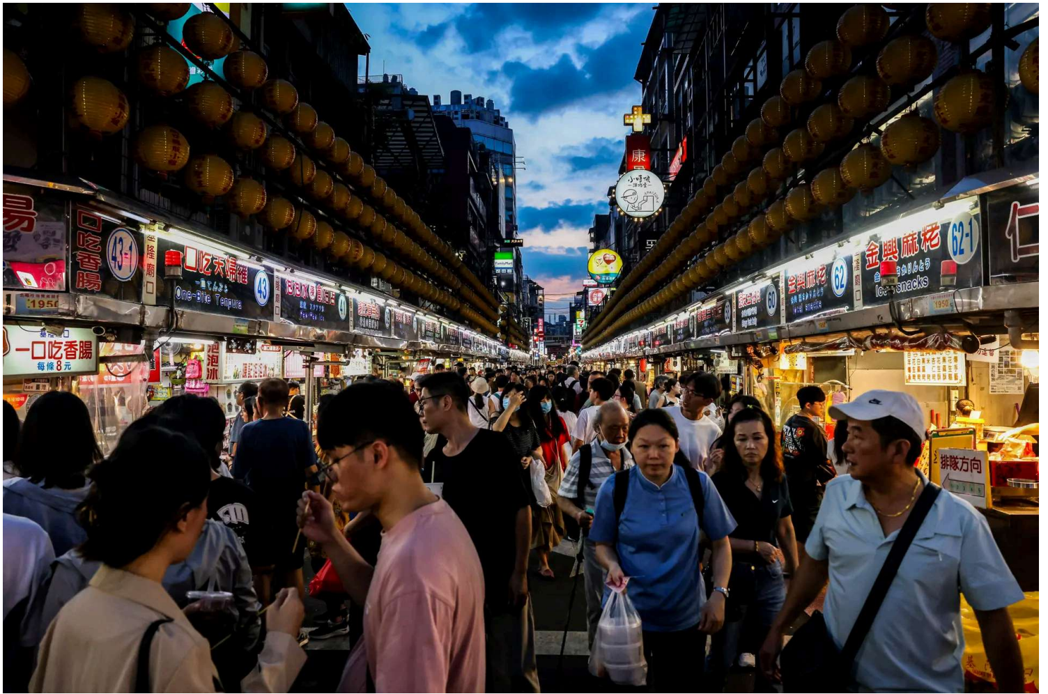
Visitors walk around a local night market in Keelung, Taiwan, on June 26, 2025.