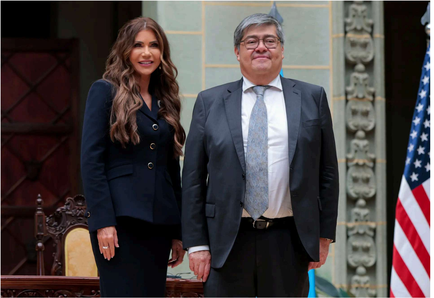
U.S. Homeland Security Secretary Kristi Noem and Guatemala Minister of Governance Francisco Jimenez stand together after signing a memorandum of understanding on a joint security program agreement at the Palacio Nacional de la Cultura in Guatemala City, Guatemala, on June 26, 2025.