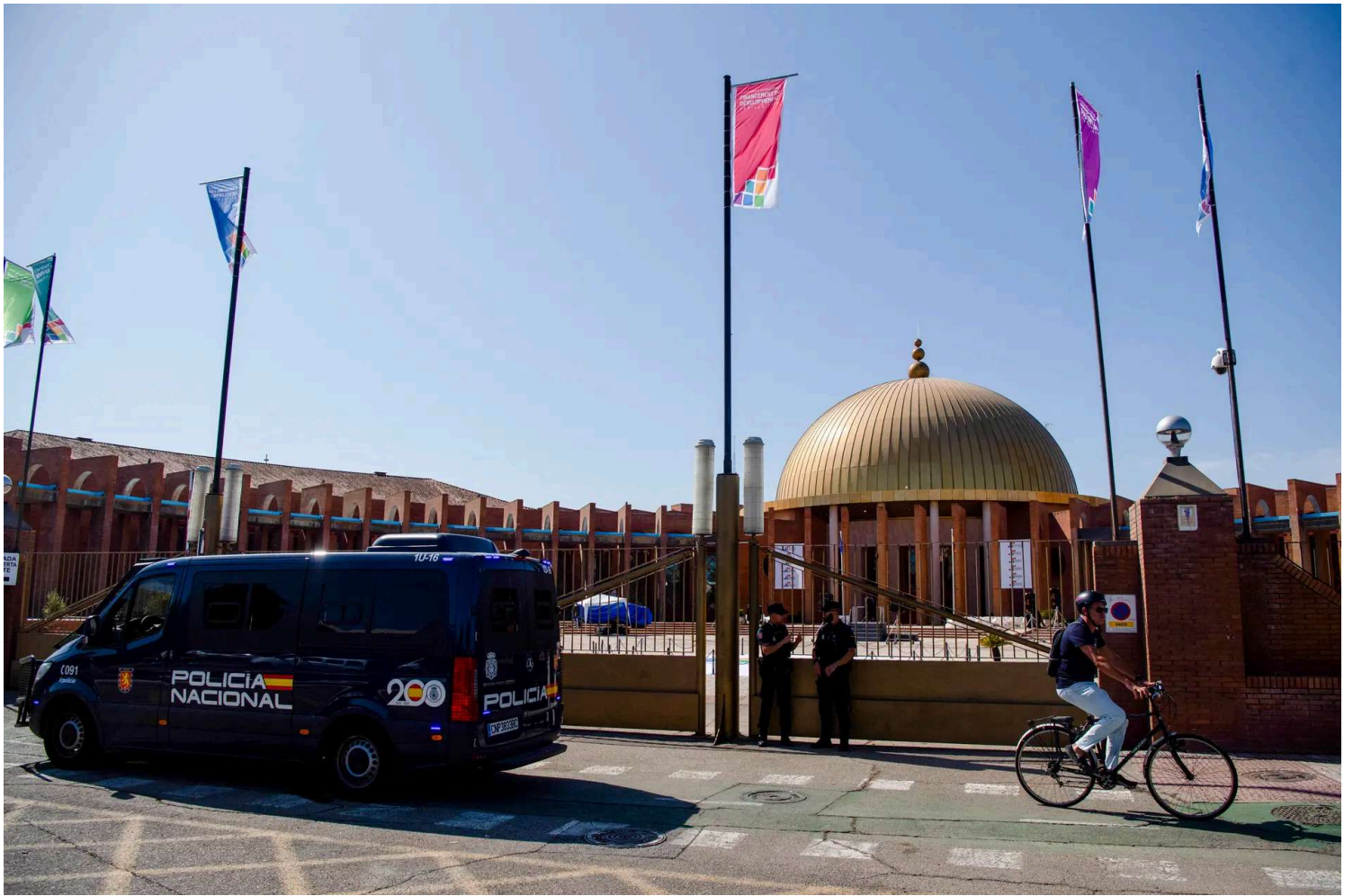
A cyclist passes by police officers at the entrance of the Palacio de Congresos y Exposiciones hall, venue for the upcoming United Nations International Conference on Financing and Development in Seville, Spain, on June 27, 2025.