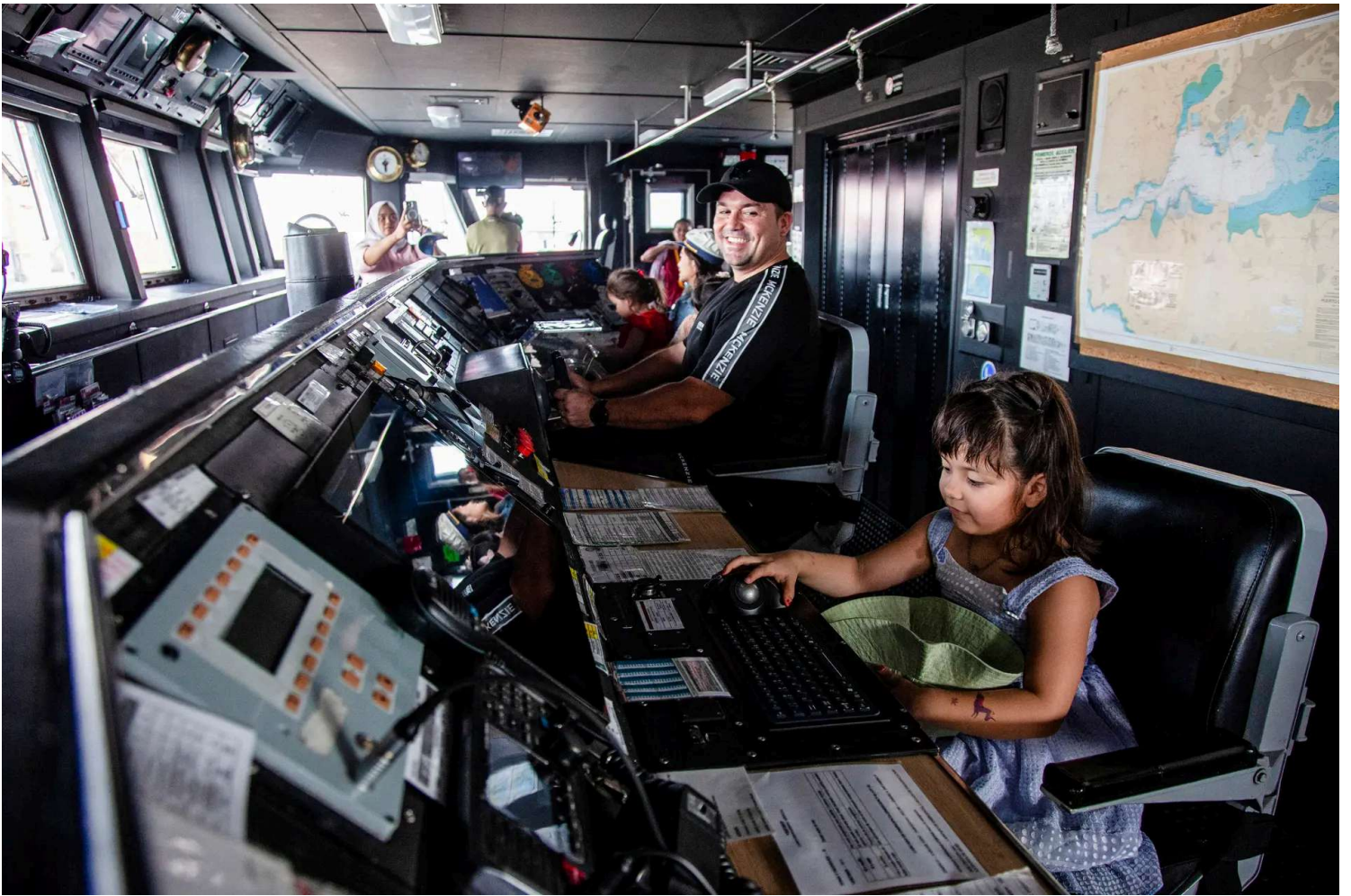
Visitors tour the bridge of the Spanish Navy frigate Mendez Nunez during the ship's goodwill visit to Indonesia, at Tanjung Priok port in Jakarta on June 27, 2025.