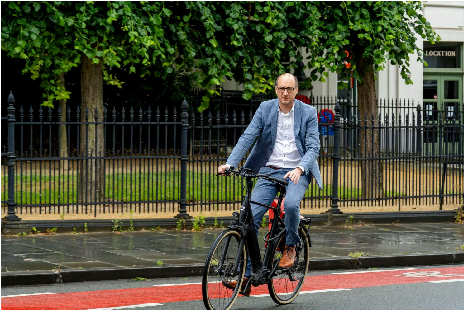
Vice-prime minister and Budget Minister Vincent Van Peteghem pictured ahead of a 'Kern' meeting of selected Ministers of the Federal Government, in Brussels, on June 27, 2025.