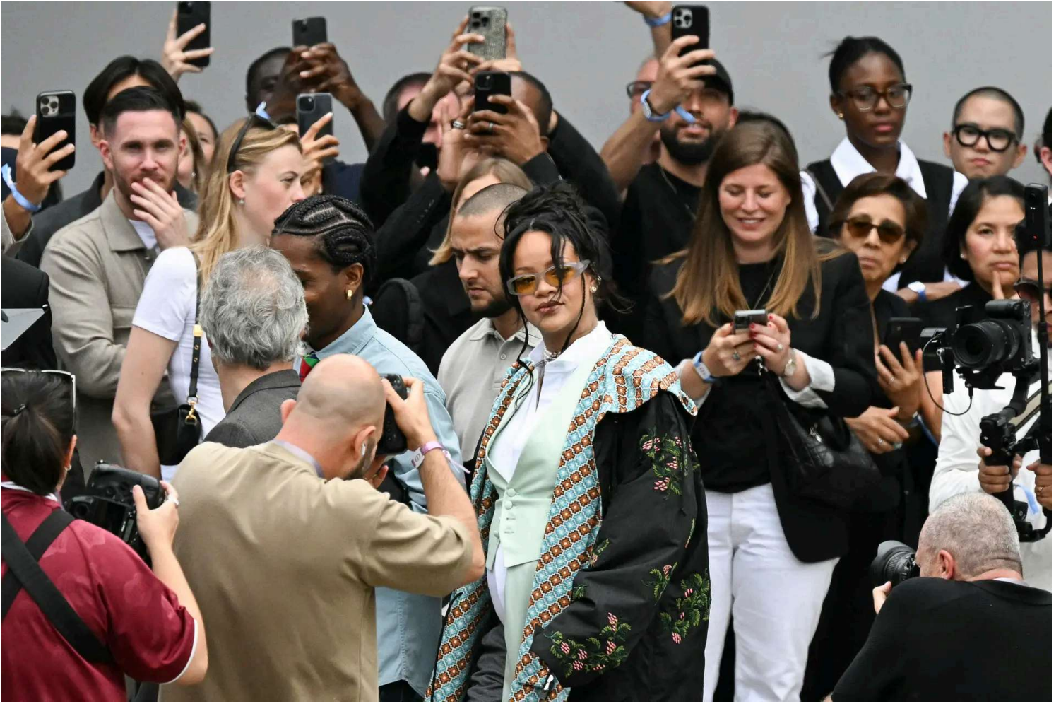
U.S. actor and singer ASAP Rocky (center L) and Barbadian singer and actress Rihanna (center R) arrive for Dior Homme's Menswear Ready-to-wear Spring-Summer 2026 collection fashion show as part of the Paris Fashion Week in Paris, on June 27, 2025.