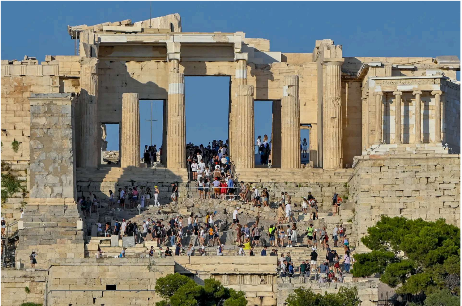
Tourists walk in front of the ancient Parthenon temple at the Acropolis Hill in Athens, Greece, on June 27, 2025. People in Greece are experiencing the first major heatwave of the summer, with sweltering temperatures expected through Friday.