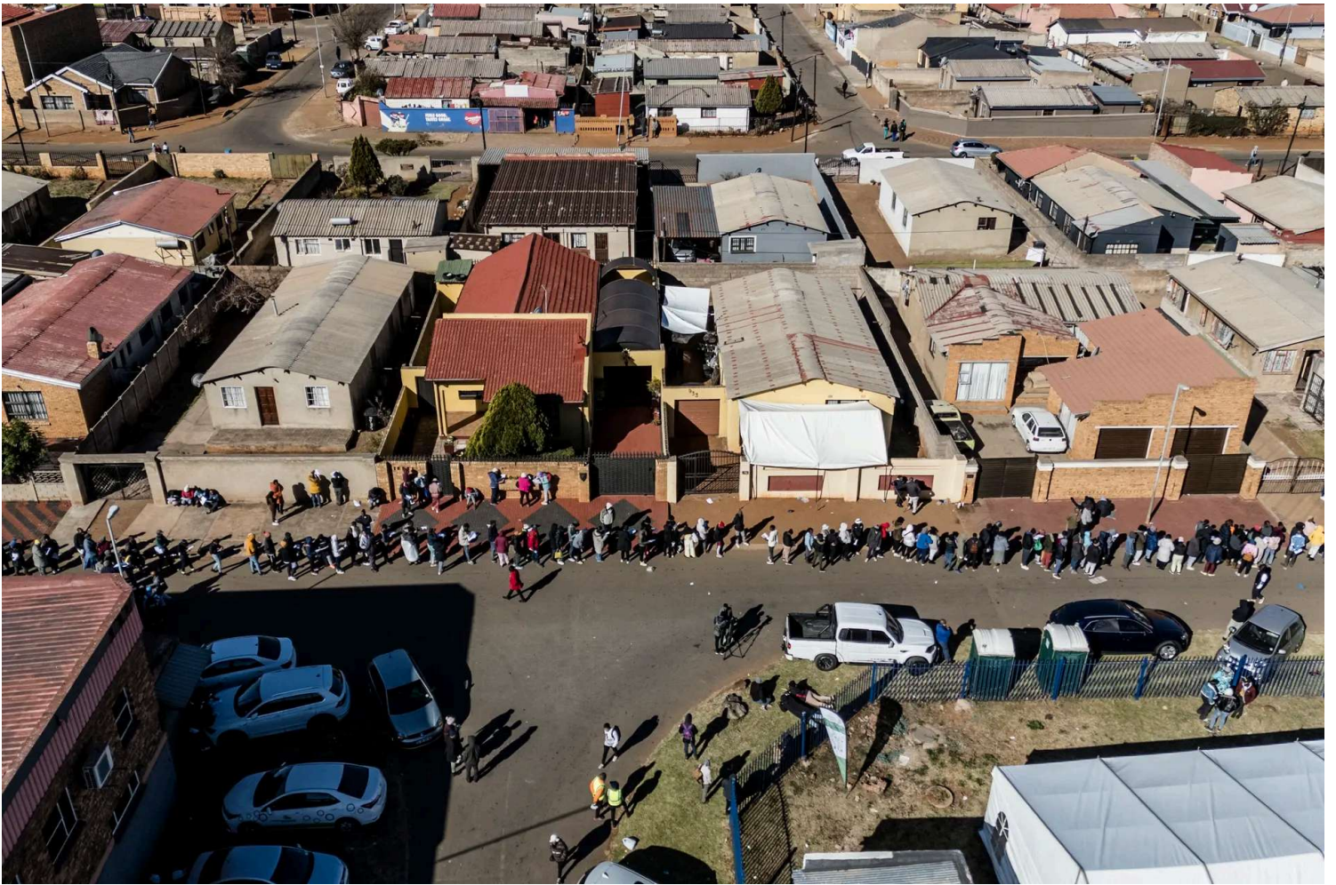
Unemployed people queue to submit the Department of Unemployment and Labour work seeking registration forms at a center in Chiawelo, Soweto, on June 27, 2025, as they look to be added into the department's database.