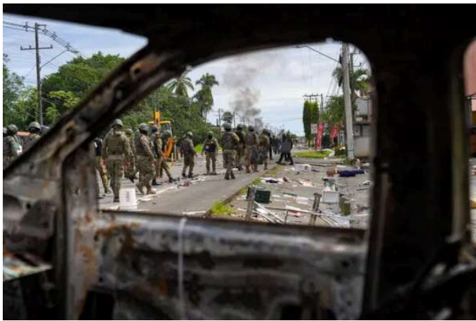
Day in Photos: Iran Strikes Israel, Church Shooting, Protests in Panama