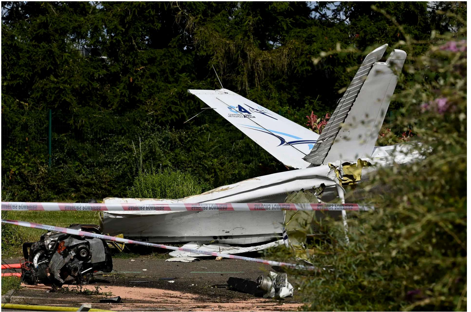
The wreckage of a crash in which three people died, in Champhol, north of Chartres, France, on June 27, 2025.