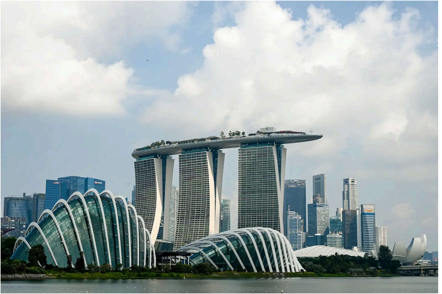
The Marina Bay Sands hotels resort and Garden by the Bay domes is backdropped by the city skyline in Singapore on June 27, 2025.