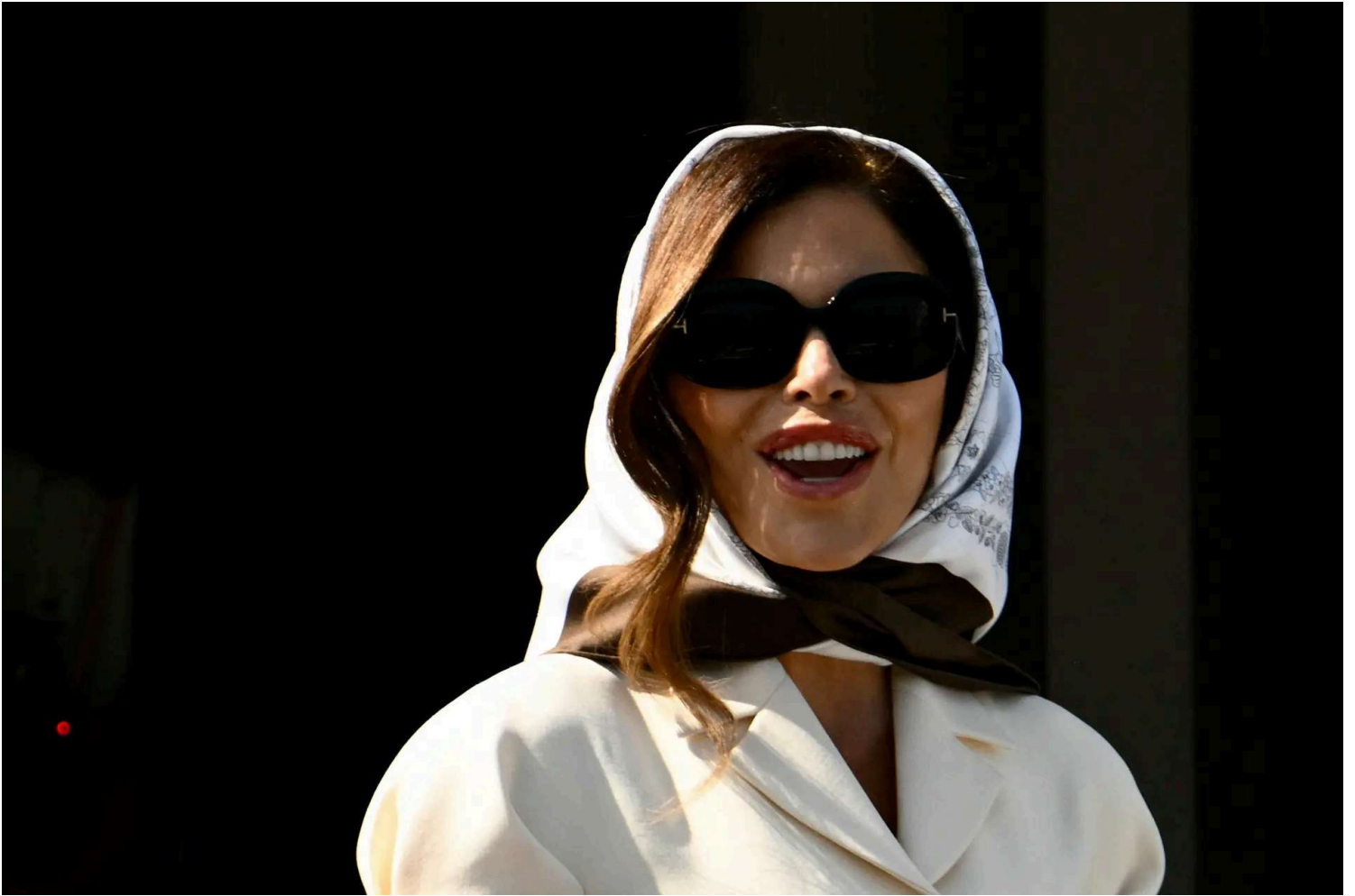
Lauren Sanchez leaves the Aman Hotel on her wedding day with Amazon's founder Jeff Bezos, in Venice, Italy, on June 27, 2025.