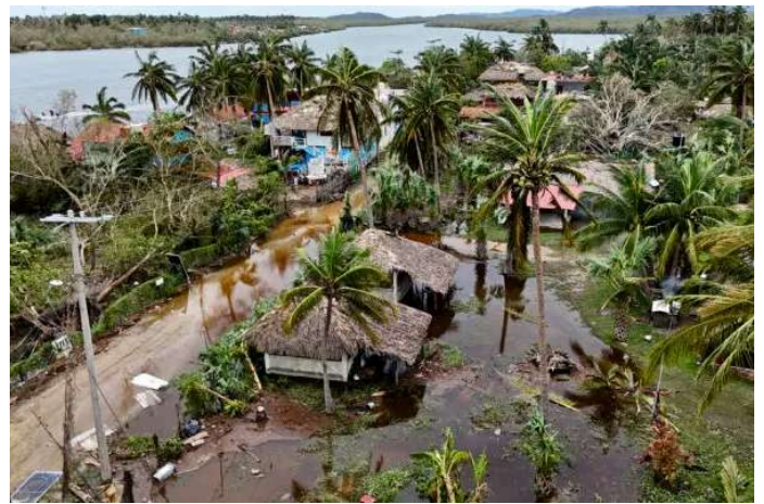
Day in Photos: Hurricane Erick, Flag Day in Argentina, and Solstice Yoga