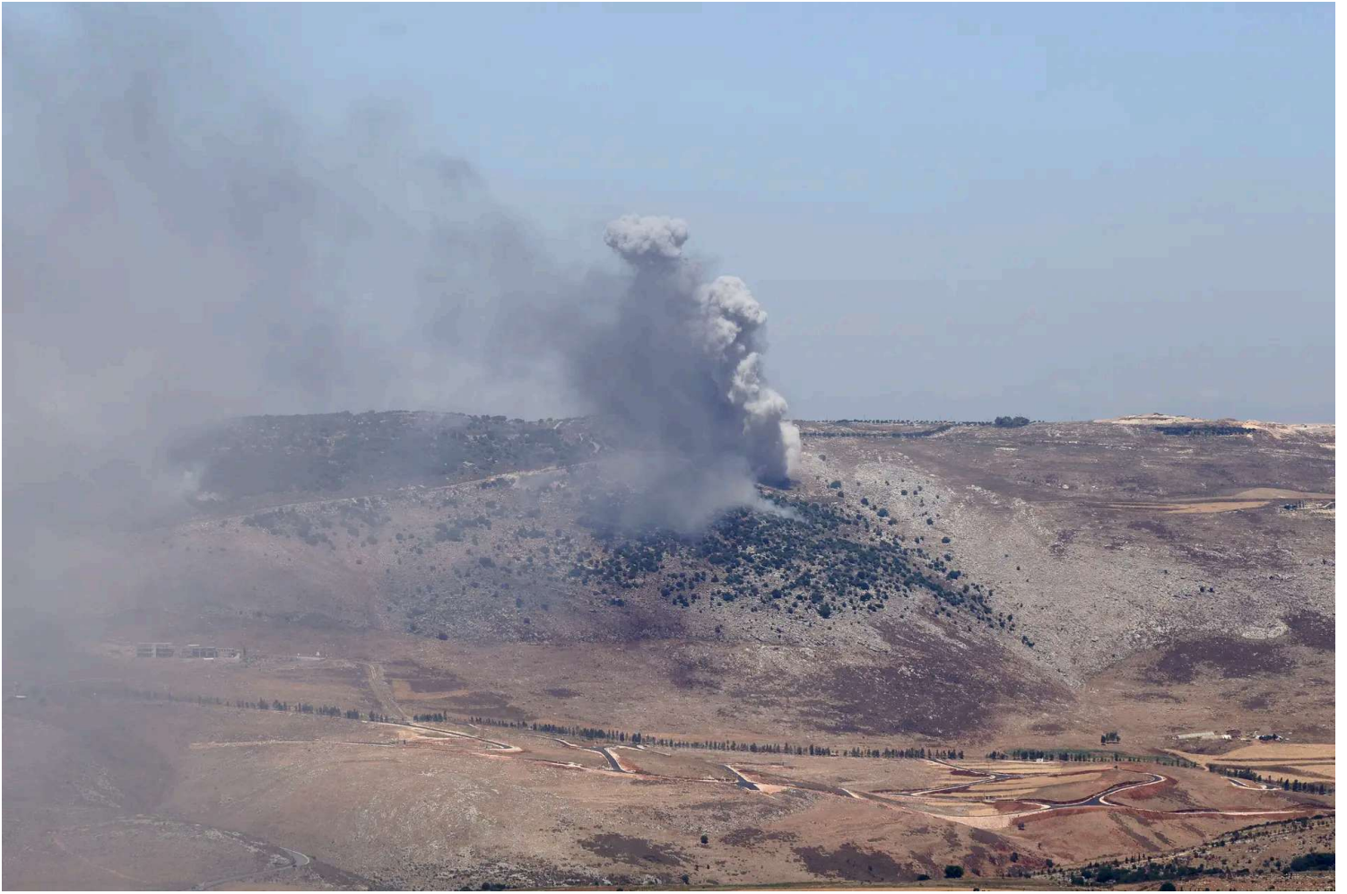
Smoke rises after Israeli airstrikes near Nabatieh in southern Lebanon on June 27, 2025.