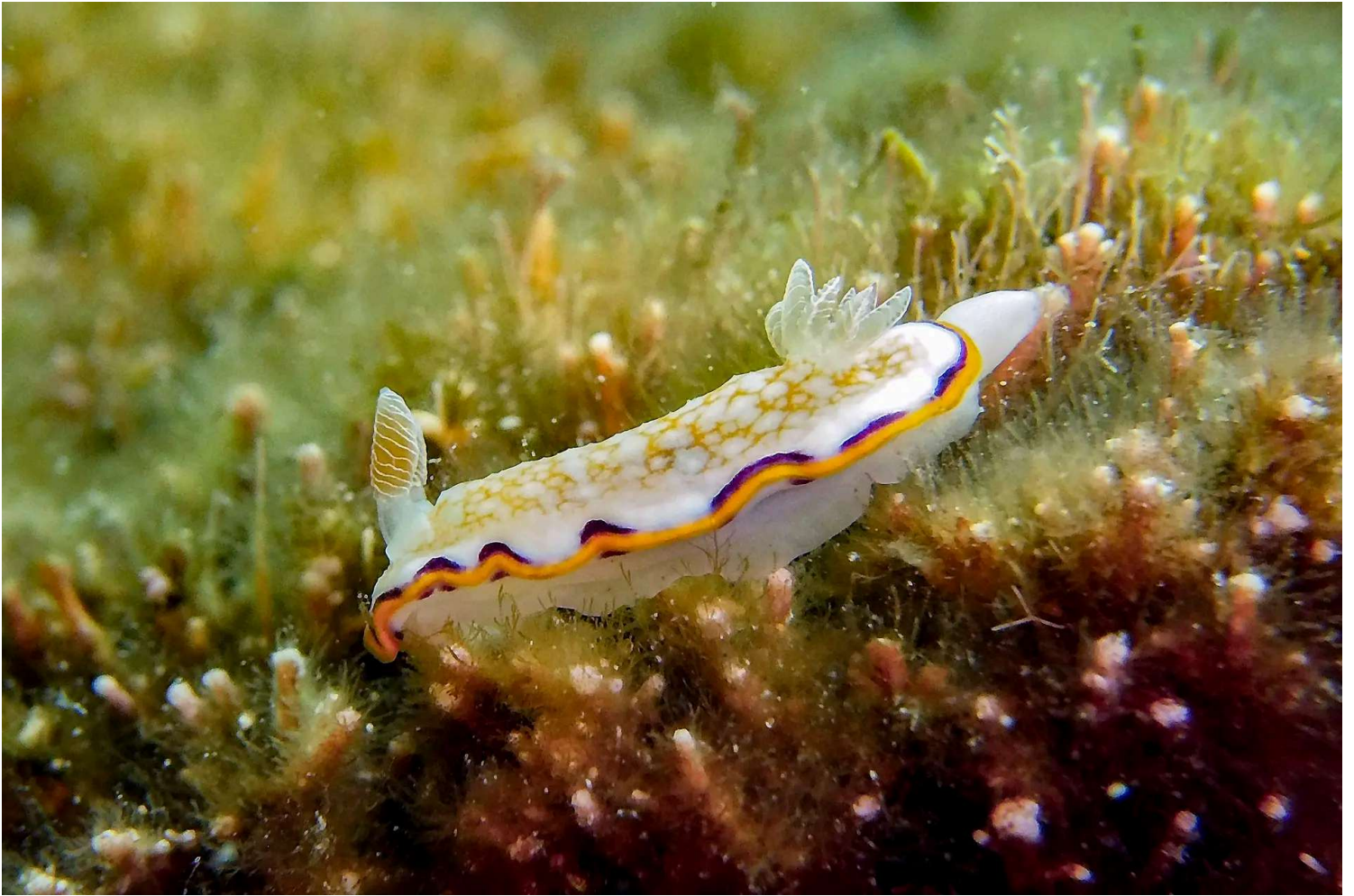
A gem sea slug ( Goniobranchus nudibranch ), a soft-bodied gastropod mollusc, feeds on a rock in the Mediterranean sea off the coast of Lebanon's northern city of Batroun on June 27, 2025.