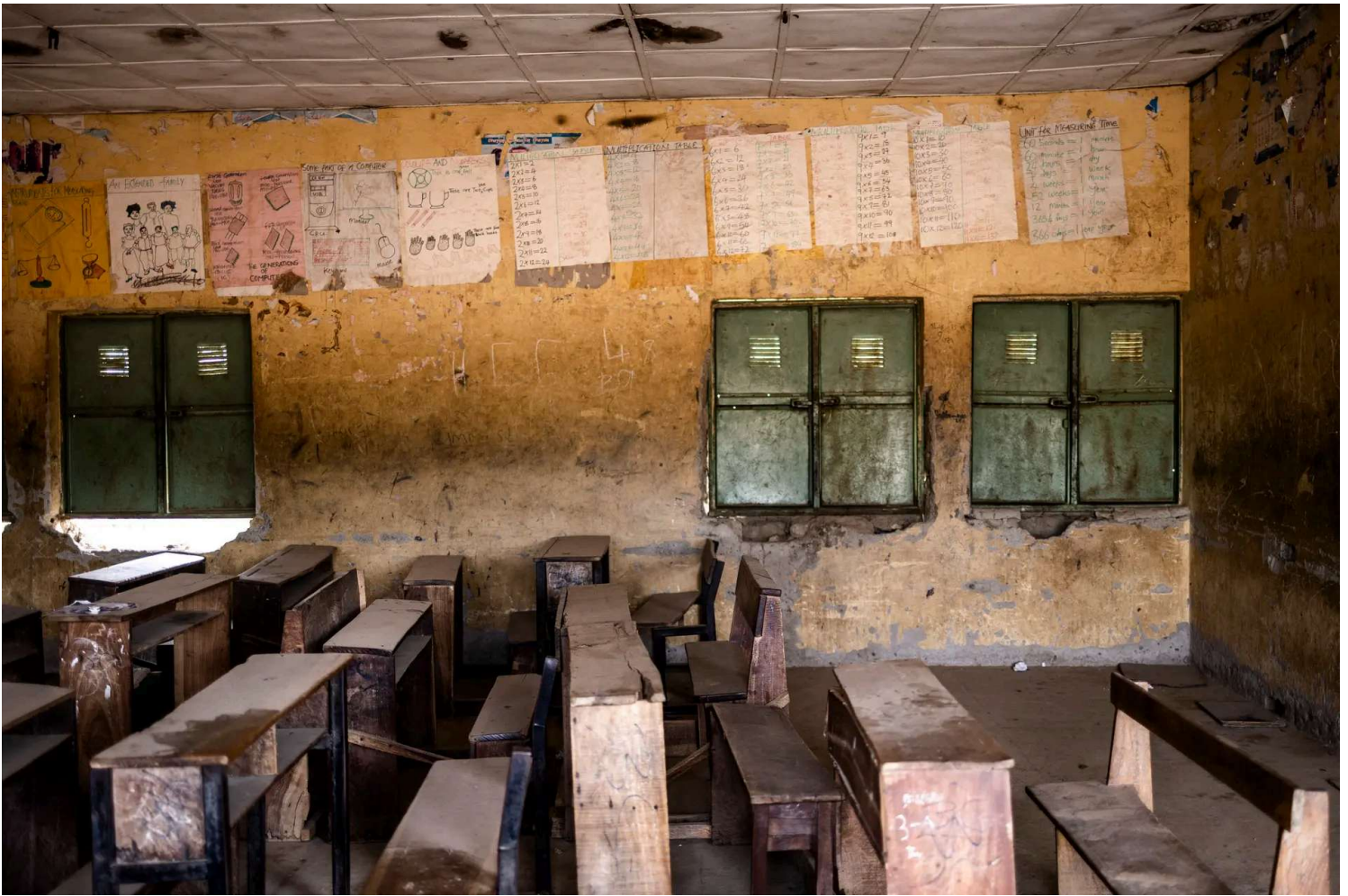
The empty classroom of a Local Education Authority (LEA) Primary School in Abuja, Nigeria, on June 27, 2025. A strike by elementary school teachers in Nigeria's capital Abuja is dragging into its fourth month as workers demand to be paid the new federal minimum wage—enacted almost a year ago but yet to be implemented by local governments. The prolonged closure, affecting more than 400 schools in Abuja's six area councils, has left over 50,000 pupils out of classrooms in a country where more than 20 million children are already out of school.