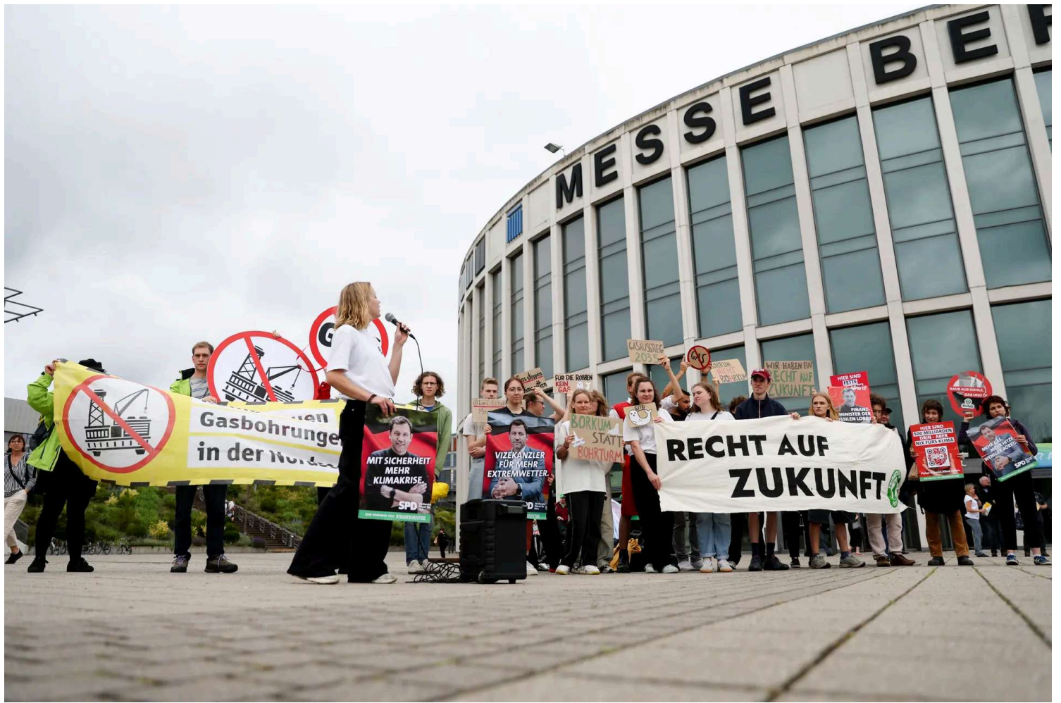
Climate activists hold a placard reading, 'Get out of coal, gas, and oil,' in front of the CityCube venue during the SPD (Social Democratic Party) congress in Berlin, Germany, on June 27, 2025.