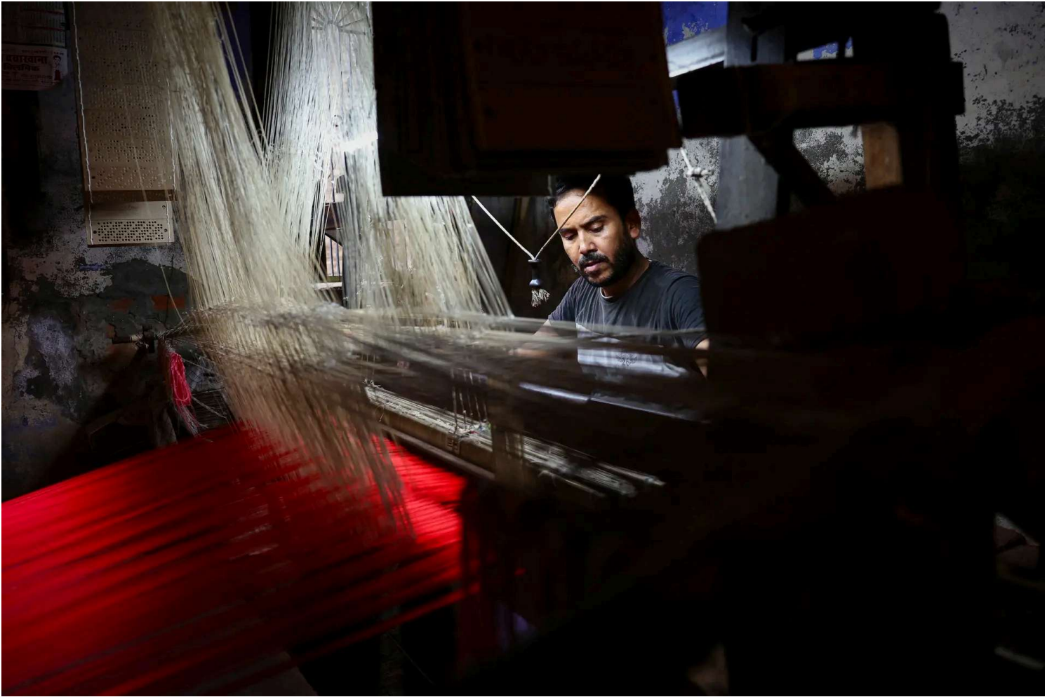
An artisan weaves a Banarasi saree on a handloom at a workshop in Varanasi, India, on June 27, 2025.

Sign up for the Morning Brief newsletter. Join 200,000+ Canadians who receive truthful news without bias or agenda, investigative reporting that matters, and important stories other media ignore. Sign up with 1-click >>