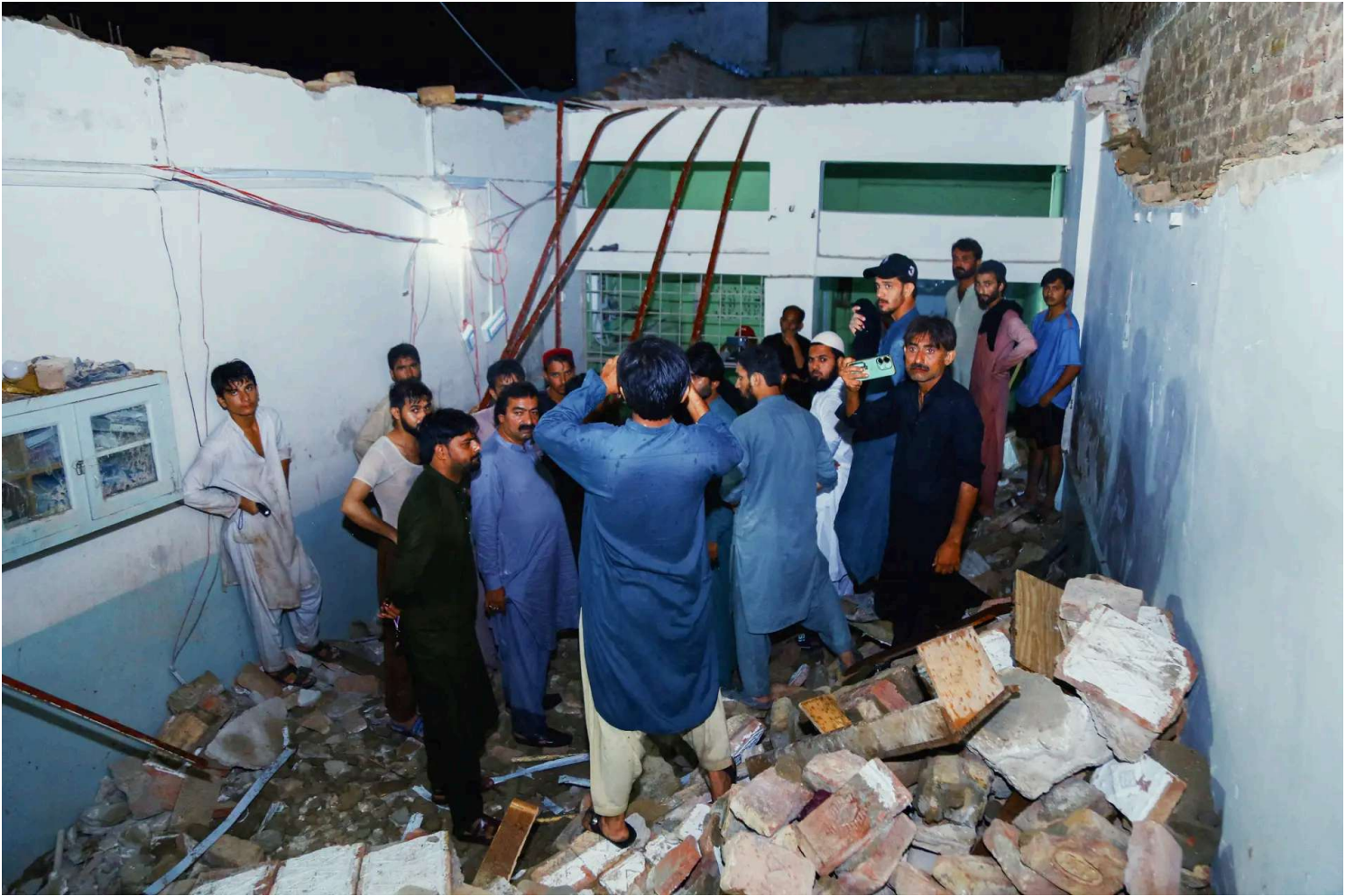
People gather inside a religious school (madrassa) in Tando Jam, Pakistan, on June 27, 2025. A roof collapse caused by heavy rains killed two children and injured more than ten others, who are now receiving treatment at a civil hospital.