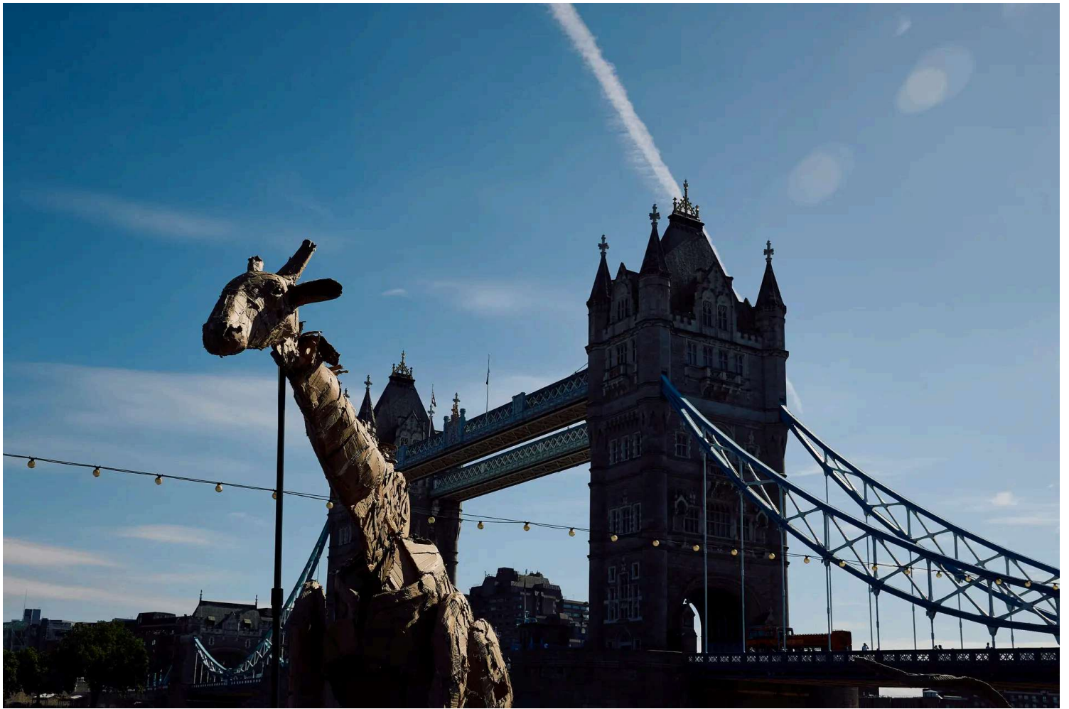
A life-size animal puppet, part of 'The Herds,' is seen against Tower Bridge, during their journey from the Congo Basin to the Arctic Circle, in London, England, on June 27, 2025, in an effort to demonstrate climate concerns.