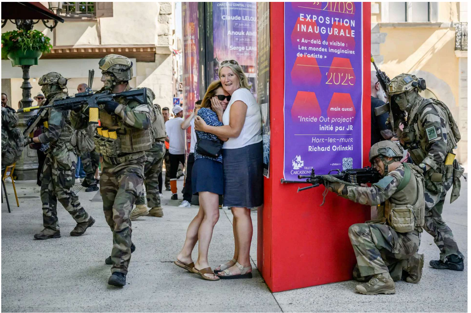
Local residents stand next to soldiers of the 3rd Marine Infantry Parachute Regiment as they take part in a military exercise entitled 'Cathare 25', involving over 800 active and reserve military personnel, in the historic city of Carcassonne, France, on June 27, 2025.