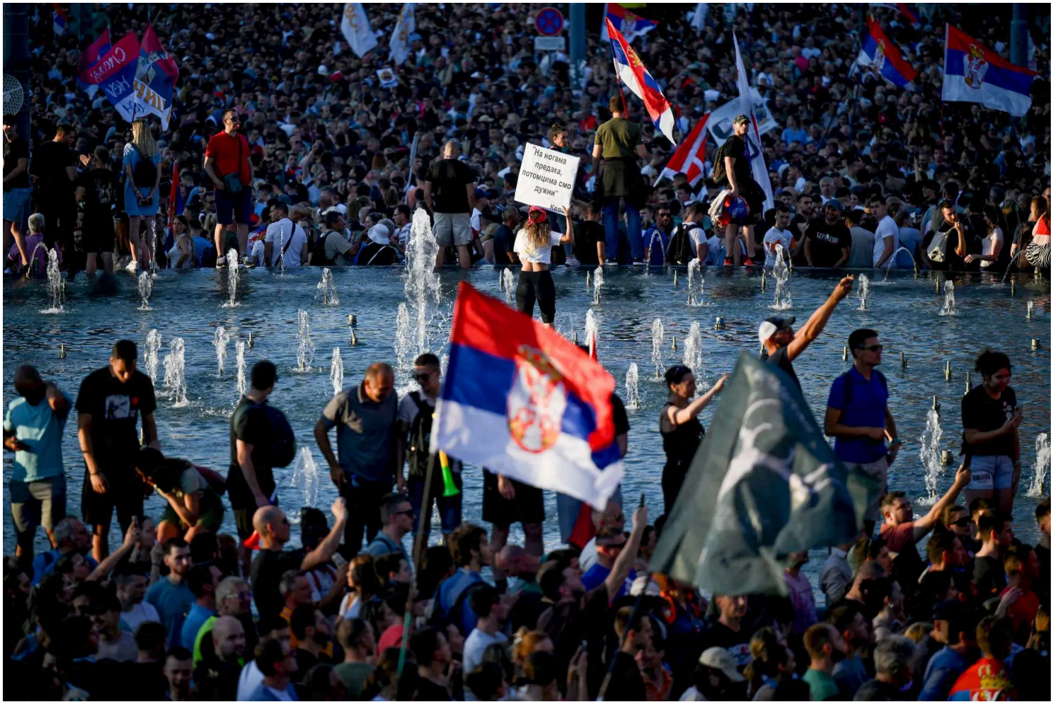
People wave Serbian national flags as tens of thousands of protesters gather in central Belgrade as they issue an “ultimatum” to the populist government to call early elections after months of student-led strikes across the country, in Belgrade, on June 28, 2025.