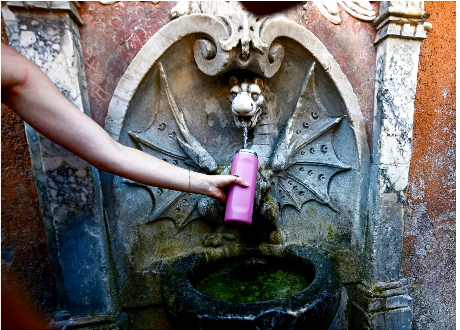
A person fills a bottle at a fountain on a hot summer day in Rome near the Vatican, on June 28, 2025. Italy's health ministry warned residents and tourists the previous day of soaring temperatures across the country, issuing a red alert for 21 cities this weekend.