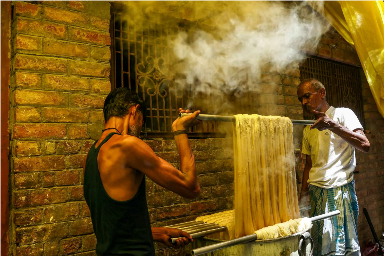
Artisans dye threads used to weave Banarasi sarees at a workshop in Varanasi, India, on June 28, 2025.