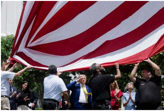
Day in Photos: New Flagpole, Protests in Argentina, and Royal Highland Show