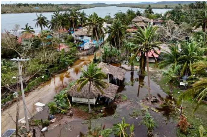
Day in Photos: Hurricane Erick, Flag Day in Argentina, and Solstice Yoga