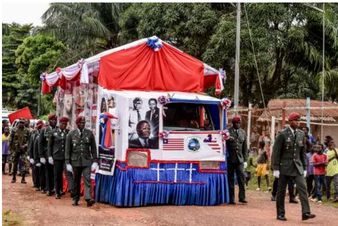
Day in Photos: Liberian President's Funeral, Plane Crash in Chartres, and Nigerian Teachers' Strike