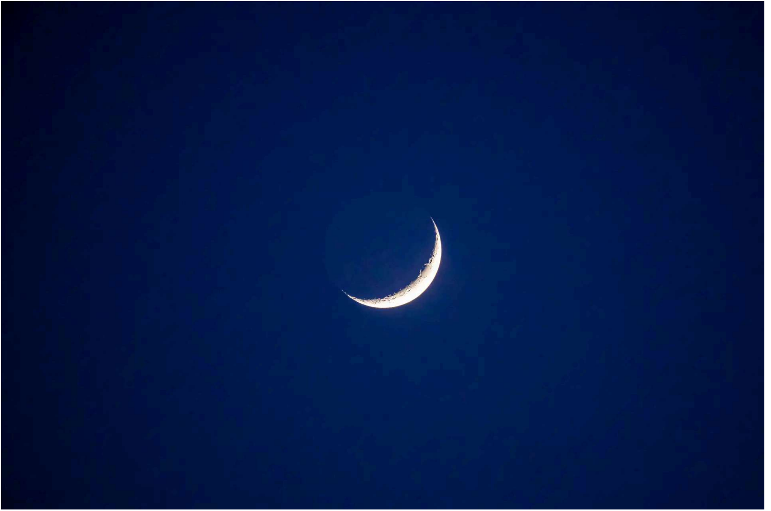
The waxing crescent moon is seen above the southern Iraqi city of Basra, on June 28, 2025.