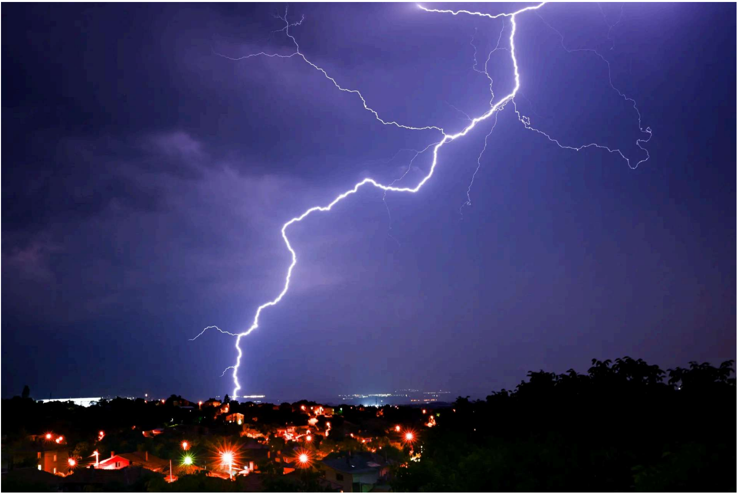
A lighting bolt lights up the sky over a suburb of Sofia, Bulgaria, during a thunderstorm, on June 28, 2025.