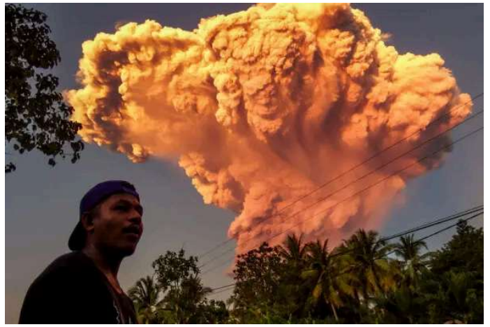
Day in Photos: Volcanic Eruption in Indonesia, Protests in Kenya, and Royal Races

Copyright © 2000 - 2025 The Epoch Times Association Inc. All Rights Reserved.