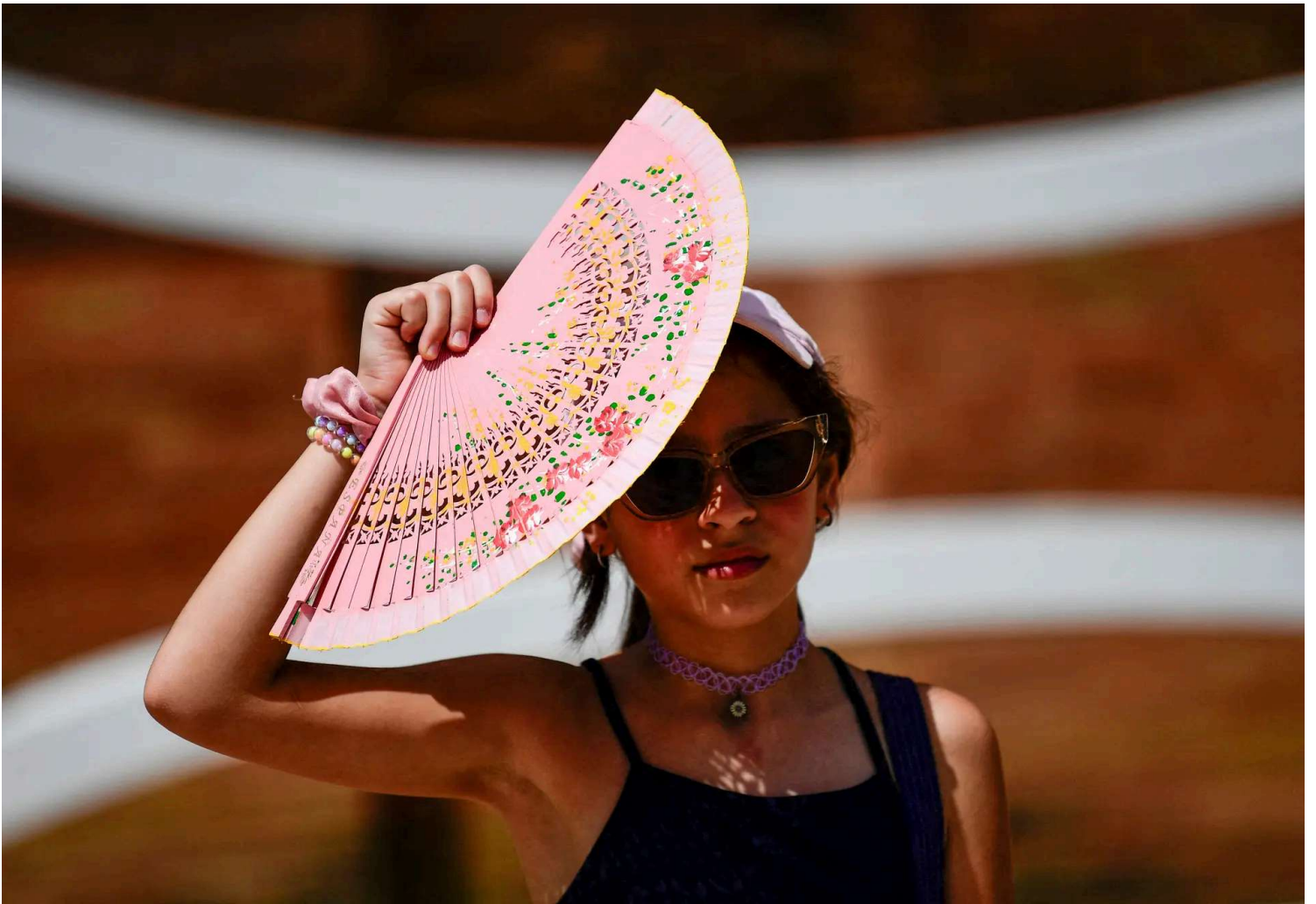
A woman protects herself from the sun with a fan during the first heatwave of the summer in Seville, Spain, on June 28, 2025.