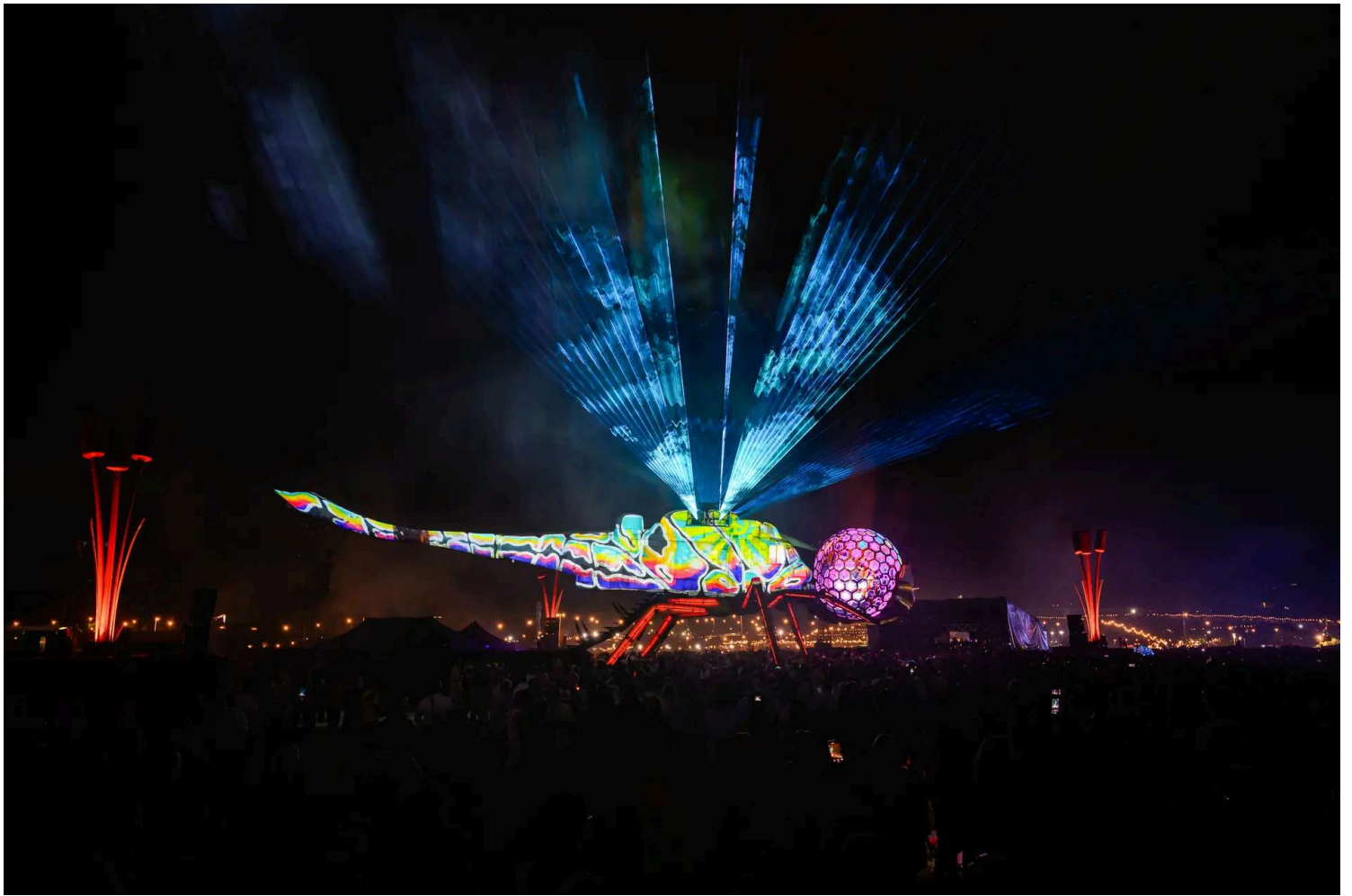
The Arcadia Dragonfly is unveiled to mark the launch of "Build the Peace," a new initiative transforming military machines into unifying art across post-conflict zones during the early hours of day four of the Glastonbury Festival 2025 at Worthy Farm, Pilton, in Glastonbury, England, on June 28, 2025.