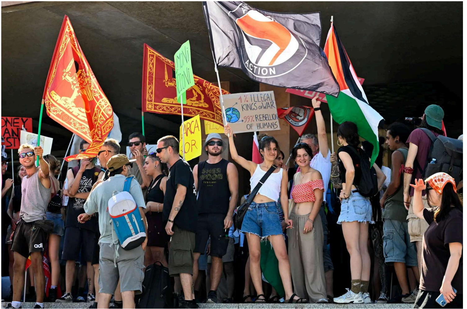
People take part in a protest “No Space for Bezos” a day after the wedding ceremony of Jeff Bezos and Lauren Sanchez in Venice, at Venice's train station, on June 28, 2025.