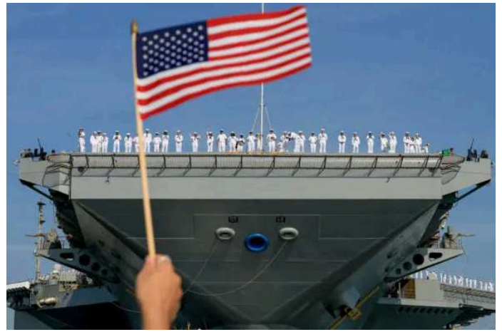
Day in Photos: Aircraft Carrier Departure, NATO Summit, and Olympic Cauldron Returns to Paris