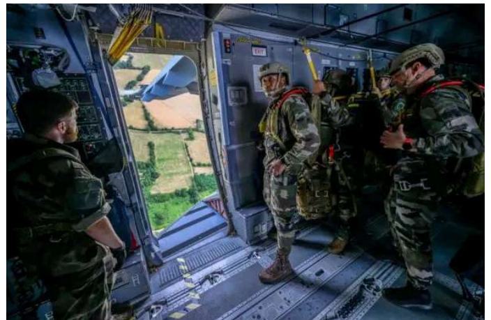
Day in Photos: Military Exercise in France, Navy Induction Day, and Saint Bernard Museum