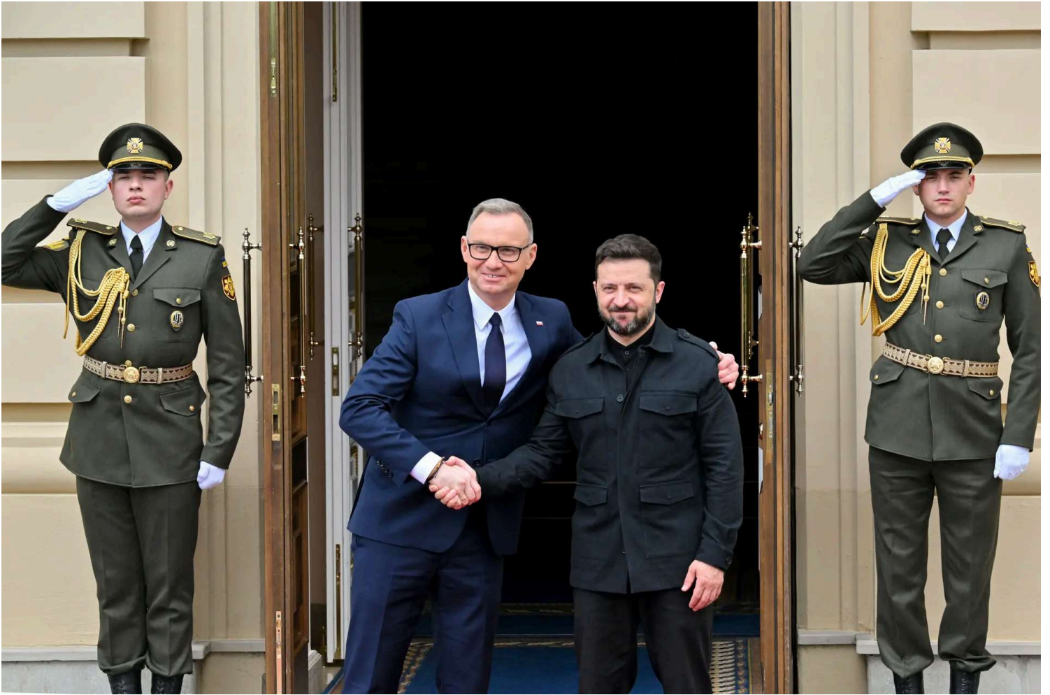
Ukrainian President Volodymyr Zelenskyy and Poland's President Andrzej Duda shake hands as they arrive for their meeting outside Mariinskyi Palace in Kyiv, on June 28, 2025.