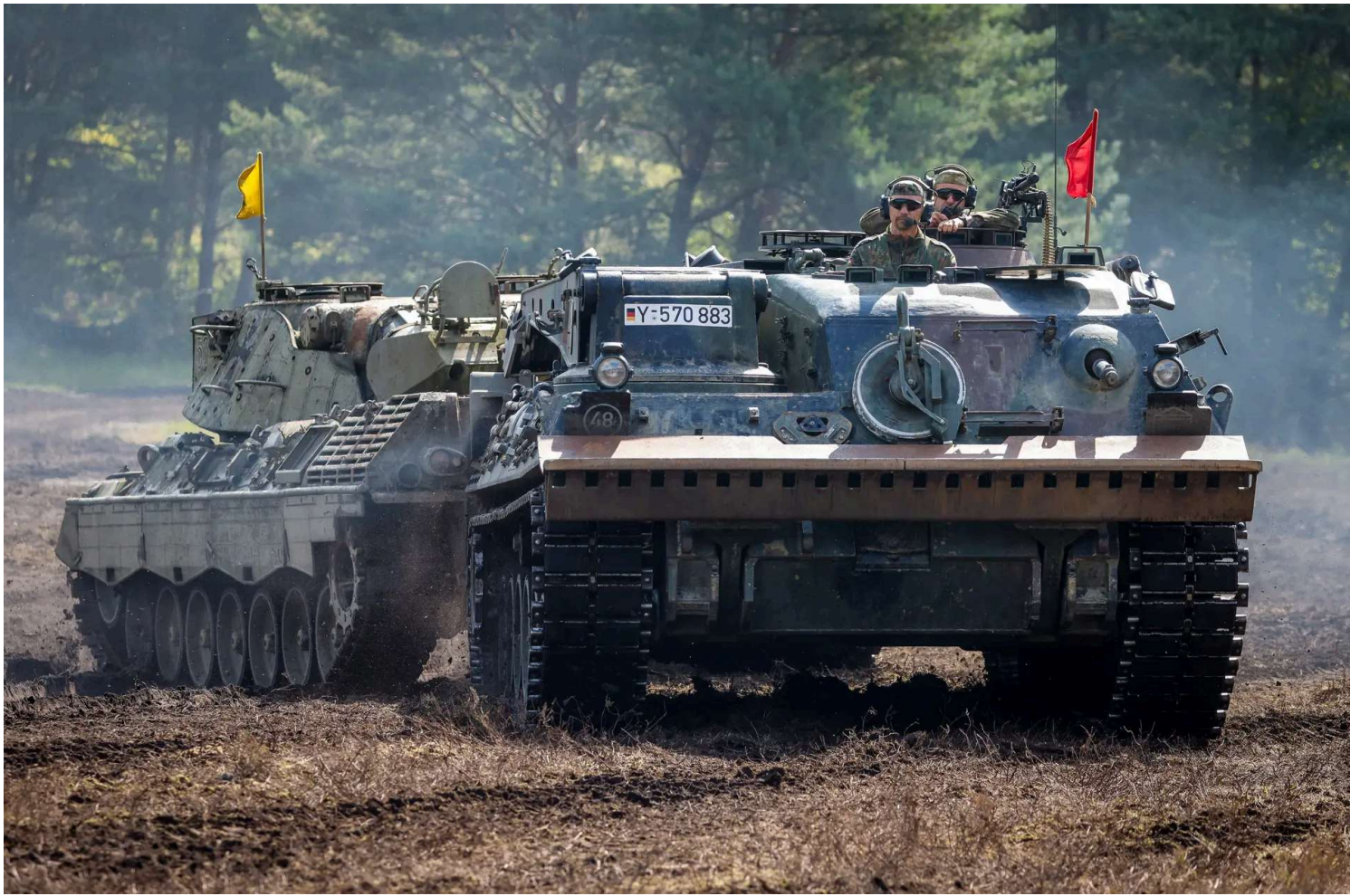
An armored recovery vehicle hauls a damaged tank during an exercise on the Tag der Bundeswehr (Bundeswehr Day) at the Bundeswehr Logistics School at Lucius D. Clay barracks in Garlstedt near Osterholz-Scharmbeck, Germany, on June 28, 2025. On Bundeswehr Day, the German armed forces demonstrate their capabilities to a wide audience at ten locations throughout Germany.