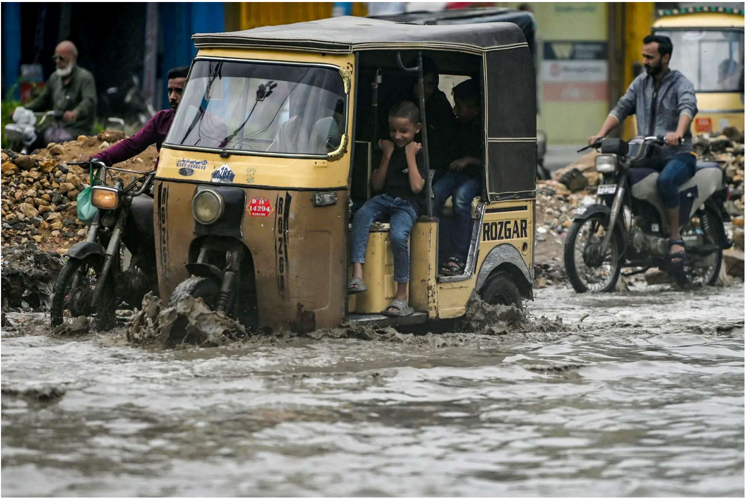
Commuters make their way through a flooded street after heavy rainfall in Karachi, Pakistan, on June 28, 2025.