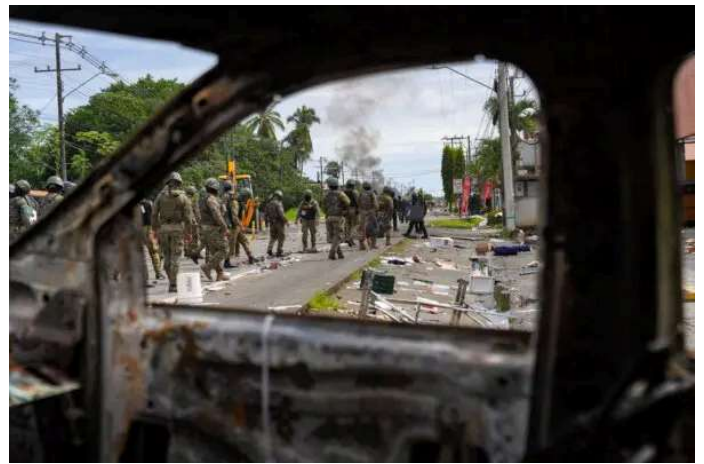
Day in Photos: Iran Strikes Israel, Church Shooting, Protests in Panama