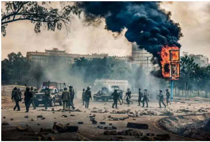
Day in Photos: Protests in Kenya, Astronauts Fly to ISS, and UK's Largest Music Festival