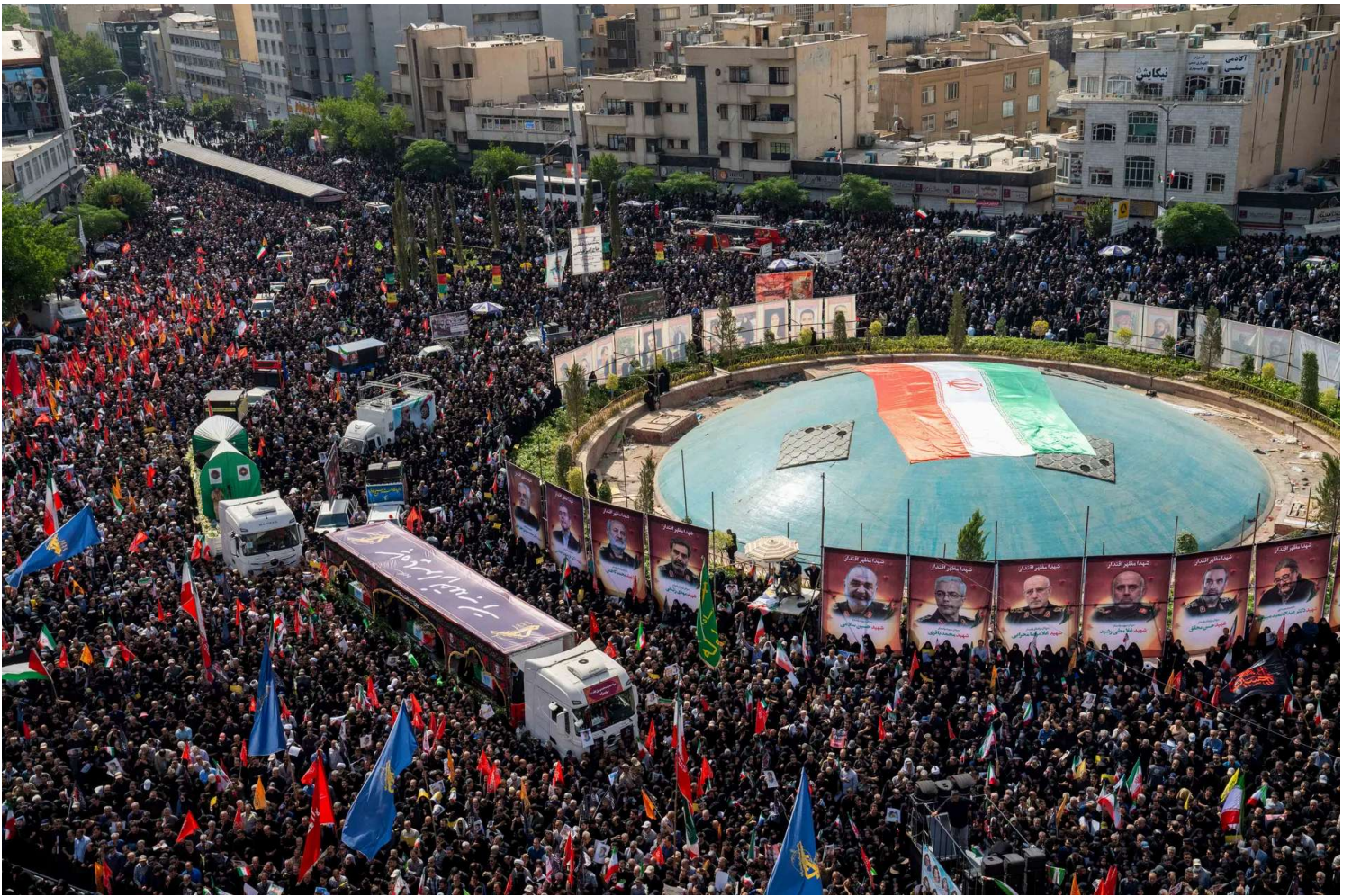
Thousands of Iranians attend the funeral ceremony for approximately 60 people killed in Israeli strikes on Iran, including high-ranking military officials, nuclear scientists, and civilians, during a state funeral service in Enqelab Square in Tehran, Iran, on June 28, 2025.