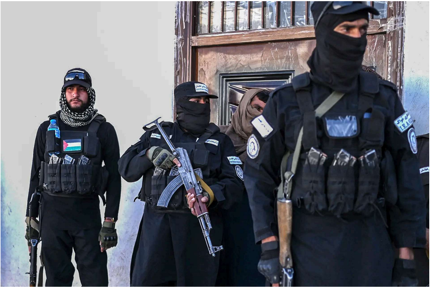
Taliban security personnel stand guard outside a mosque at the Islam Qala border crossing between Afghanistan and Iran, on June 28, 2025, amid the ongoing deportation of Afghans from Iran.