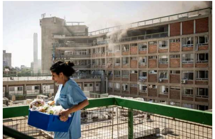
Day in Photos: Attack on Hospital in Israel, Hurricane Erick, and Heat in Europe