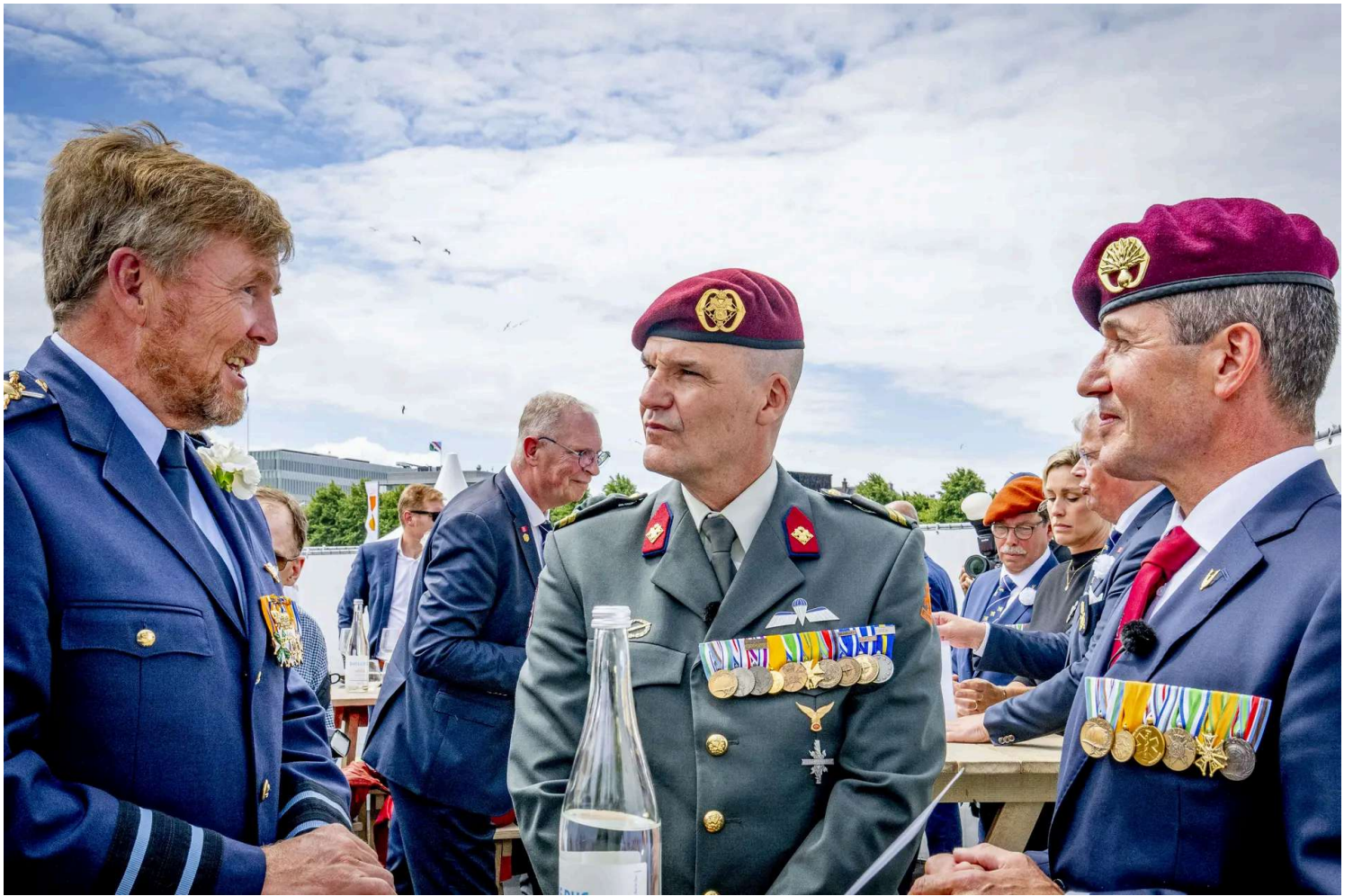
King Willem-Alexander talks to veterans during the 21st edition of Veterans Day in The Hague, Netherlands, on June 28, 2025.