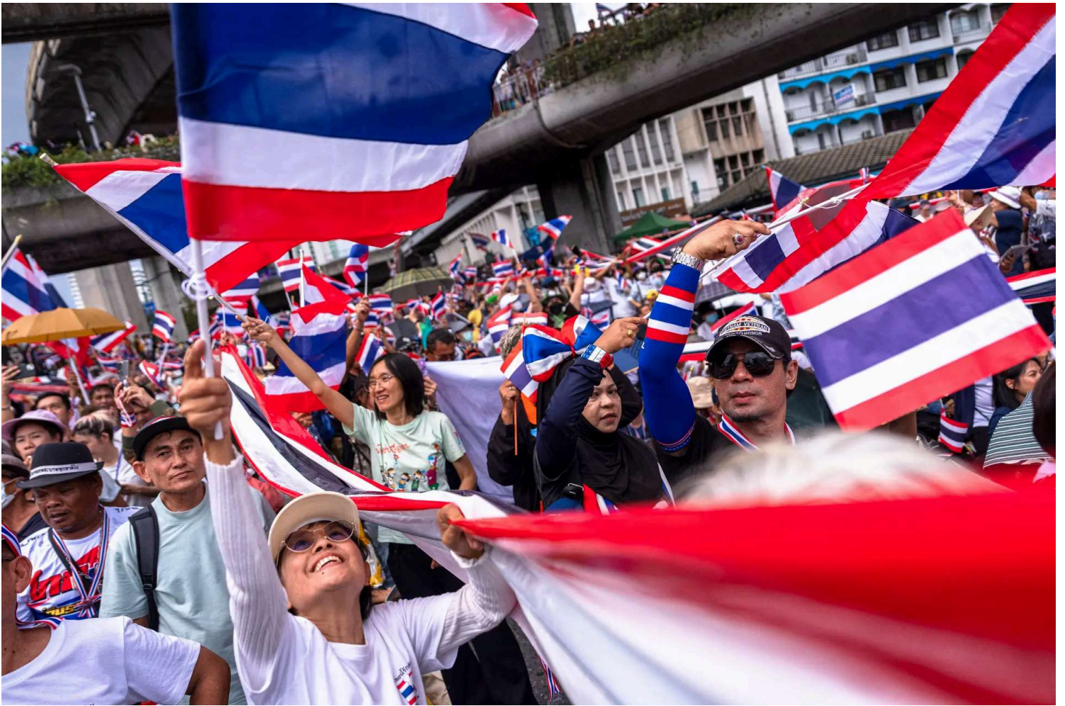
Anti-government protesters rally to demand the removal of Thailand's Prime Minister Paetongtarn Shinawatra from office at Victory Monument in Bangkok, Thailand, on June 28, 2025.