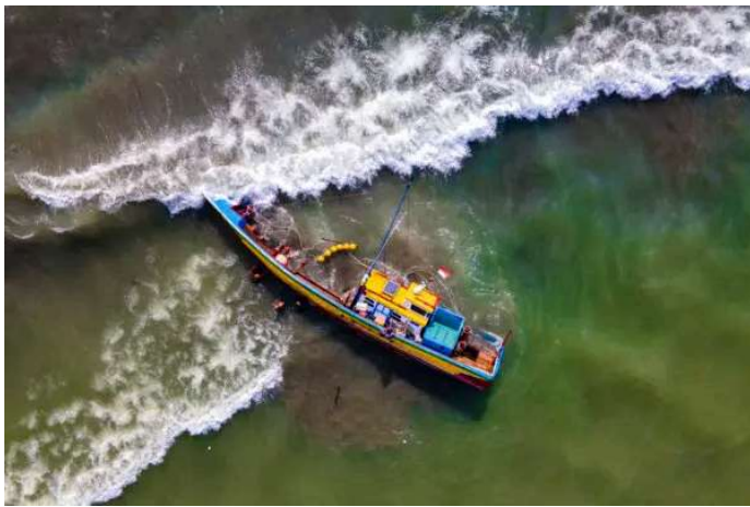
Day in Photos: Ship Capsizes in Indonesia, Forest Fires in Greece, Amazon Launches Satellites