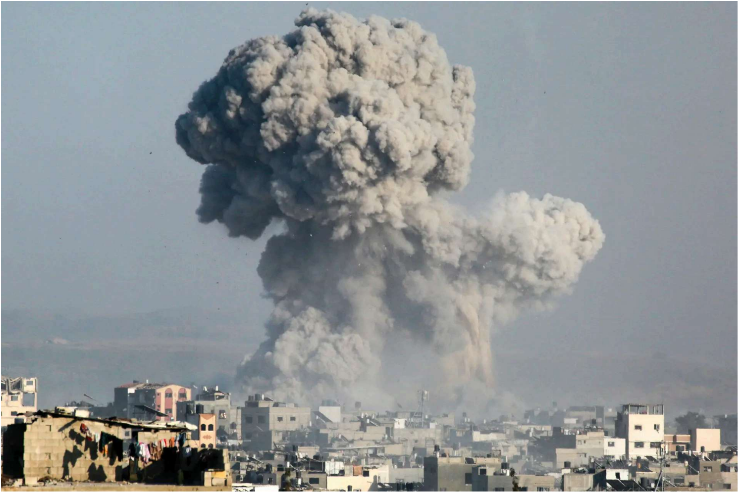
Smoke billows after an Israeli strike on Jabalia in the northern Gaza Strip, on June 28, 2025, amid the ongoing conflict between Israel and the Hamas terrorist group.