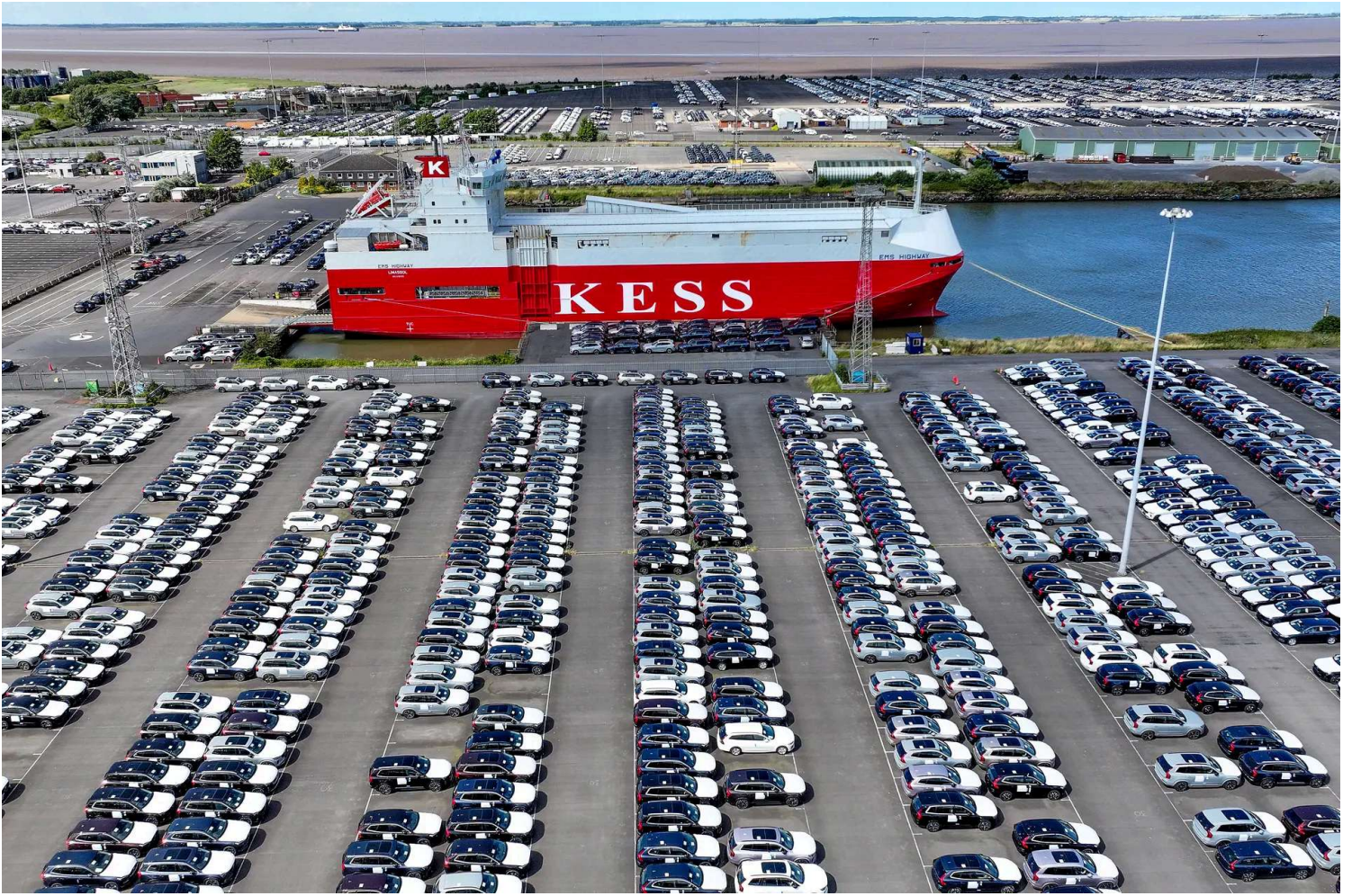
An aerial view of the Ems Highway vehicle cargo ship and imported new cars on the quayside of Alexandra Dock at Grimsby Port in Grimsby, England, on June 28, 2025.