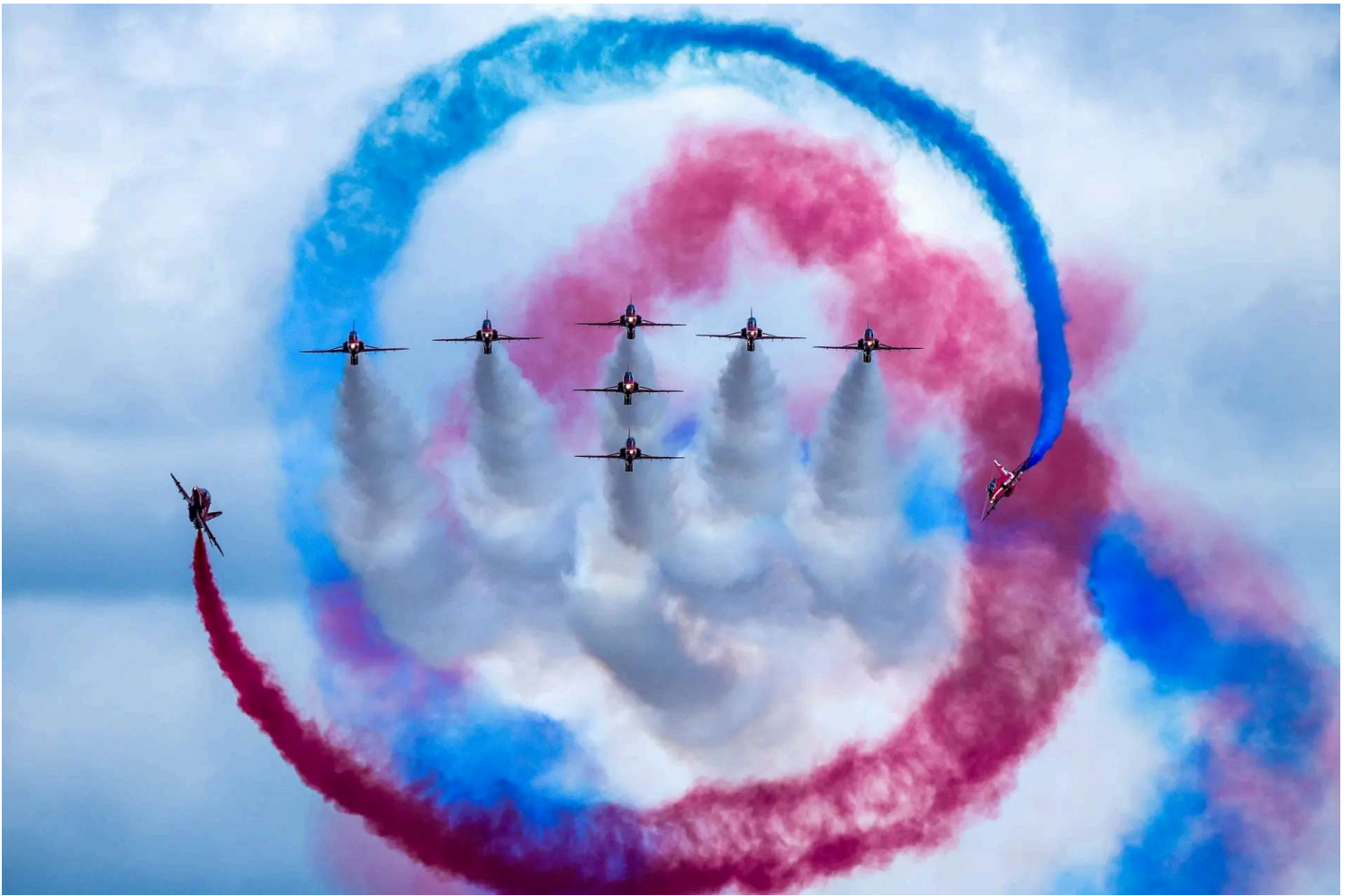
The Red Arrows perform a display during Armed Forces Day in Cleethorpes, England, on June 28, 2025. Armed Forces Day is held annually across the UK in a show of support and appreciation for the Armed Forces community.