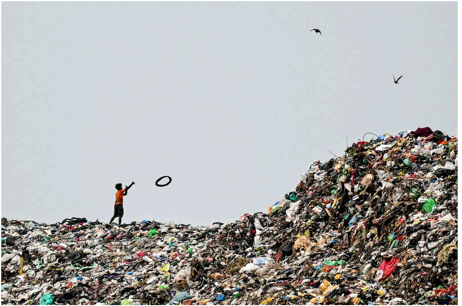
A rag picker looks for recyclable materials at a garbage disposal site, in Chennai, India, on June 30, 2025.