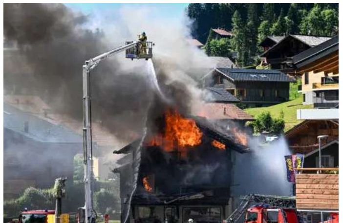
Day in Photos: Fire in Switzerland, Armed Forces Day, and Protests in Thailand