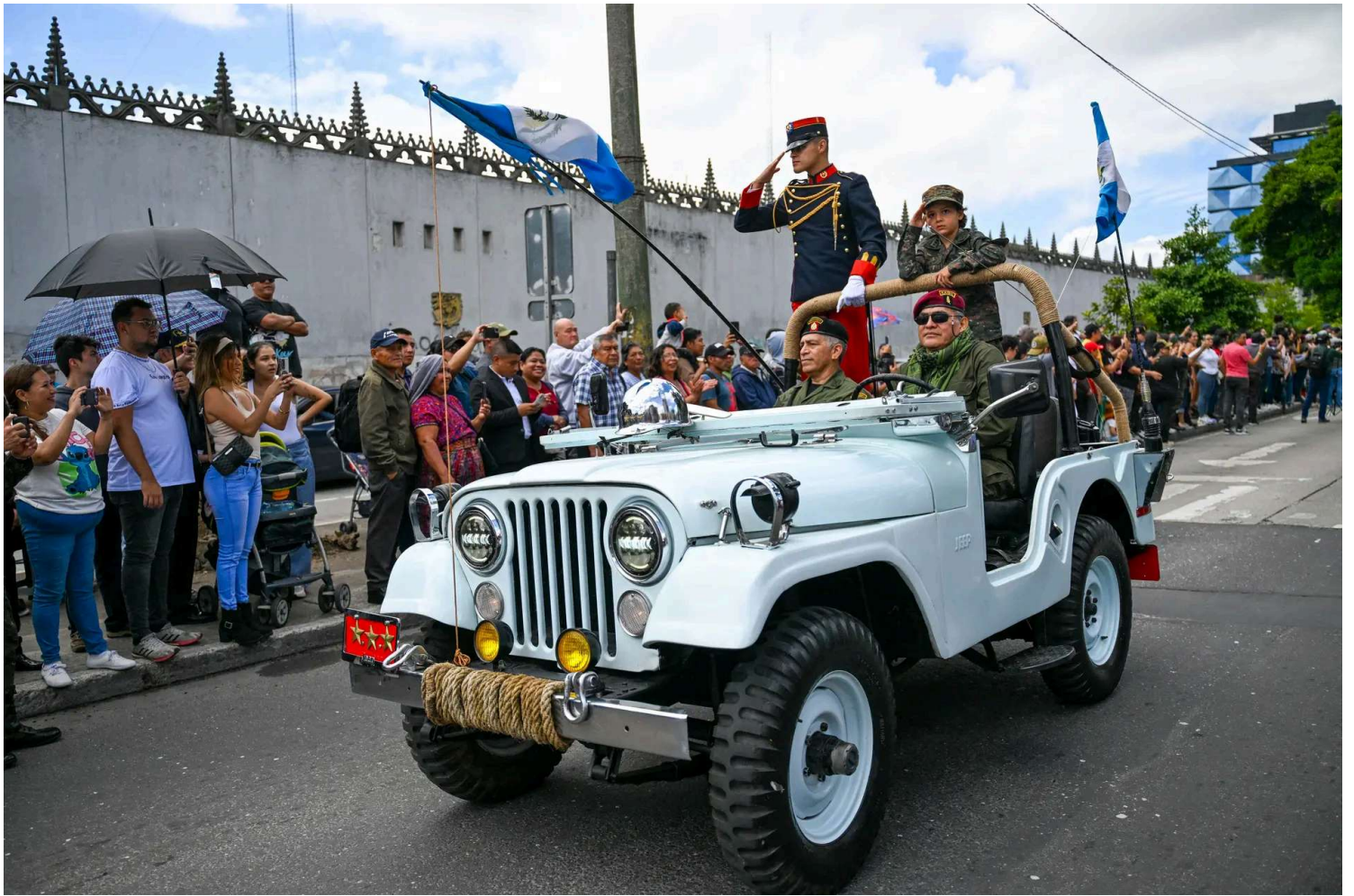
Members of the Guatemalan Army ride on jeeps during the parade marking Army Day in Guatemala City, on June 30, 2025.