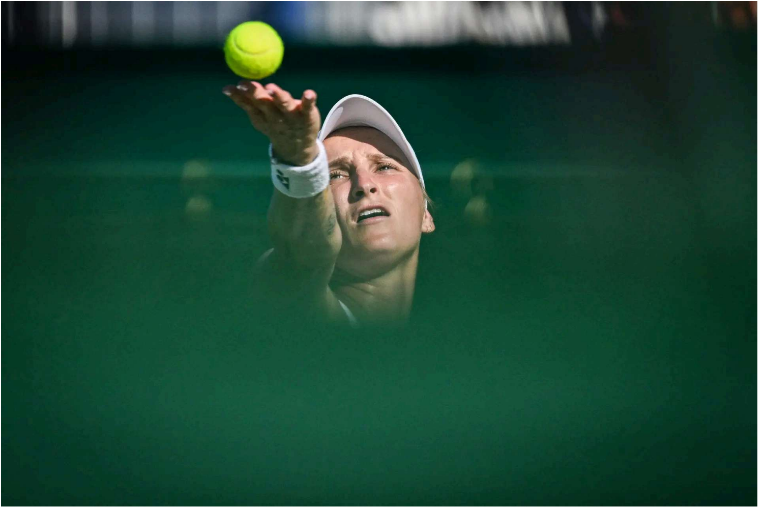
Czech Republic's Marketa Vondrousova serves to U.S. player McCartney Kessler during their women's singles first round tennis match on the first day of the 2025 Wimbledon Championships at The All England Lawn Tennis and Croquet Club in Wimbledon, London, on June 30, 2025.