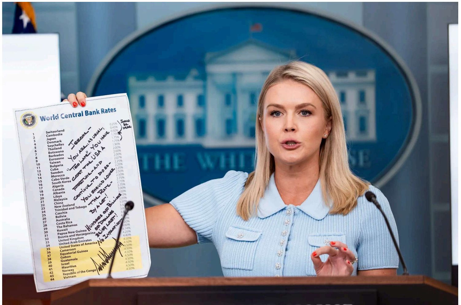
White House press secretary Karoline Leavitt speaks during a press briefing at the White House on June 30, 2025.