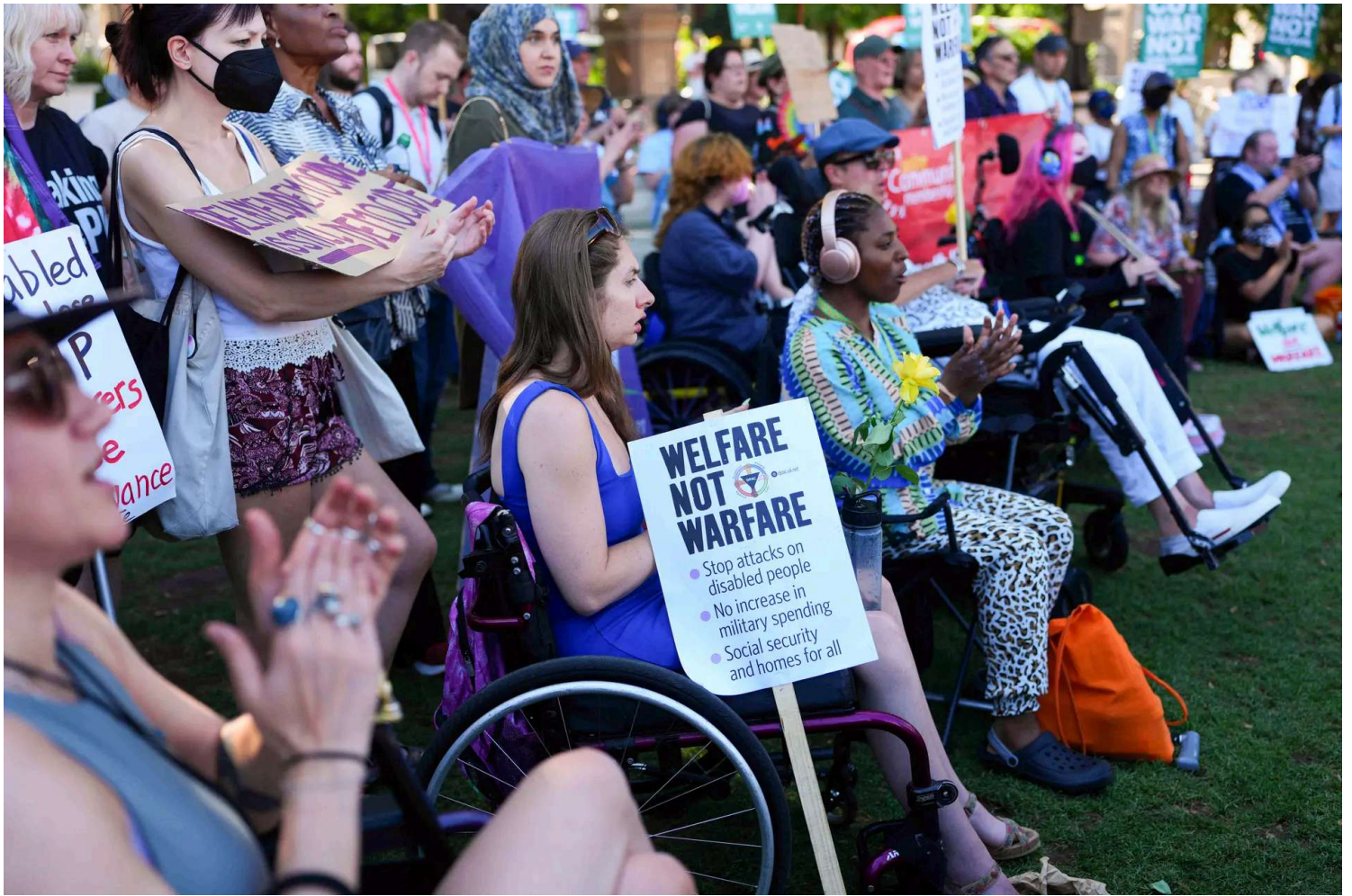
People protest cuts in disability payments in London on June 30, 2025. Campaigners have said the planned cuts to public services and restrictions on social welfare would be detrimental to people receiving disability assistance.