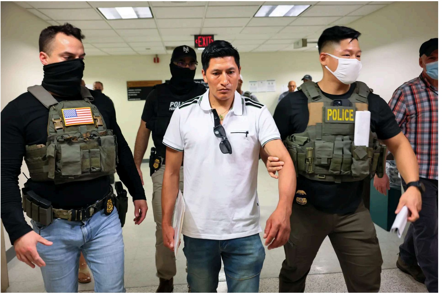
Federal agents detain a man after he attended a hearing at the immigration court at the Jacob K. Javitz Federal Building in New York City, on June 30, 2025. Immigration and Customs Enforcement has continued its stepped-up immigration enforcement efforts.