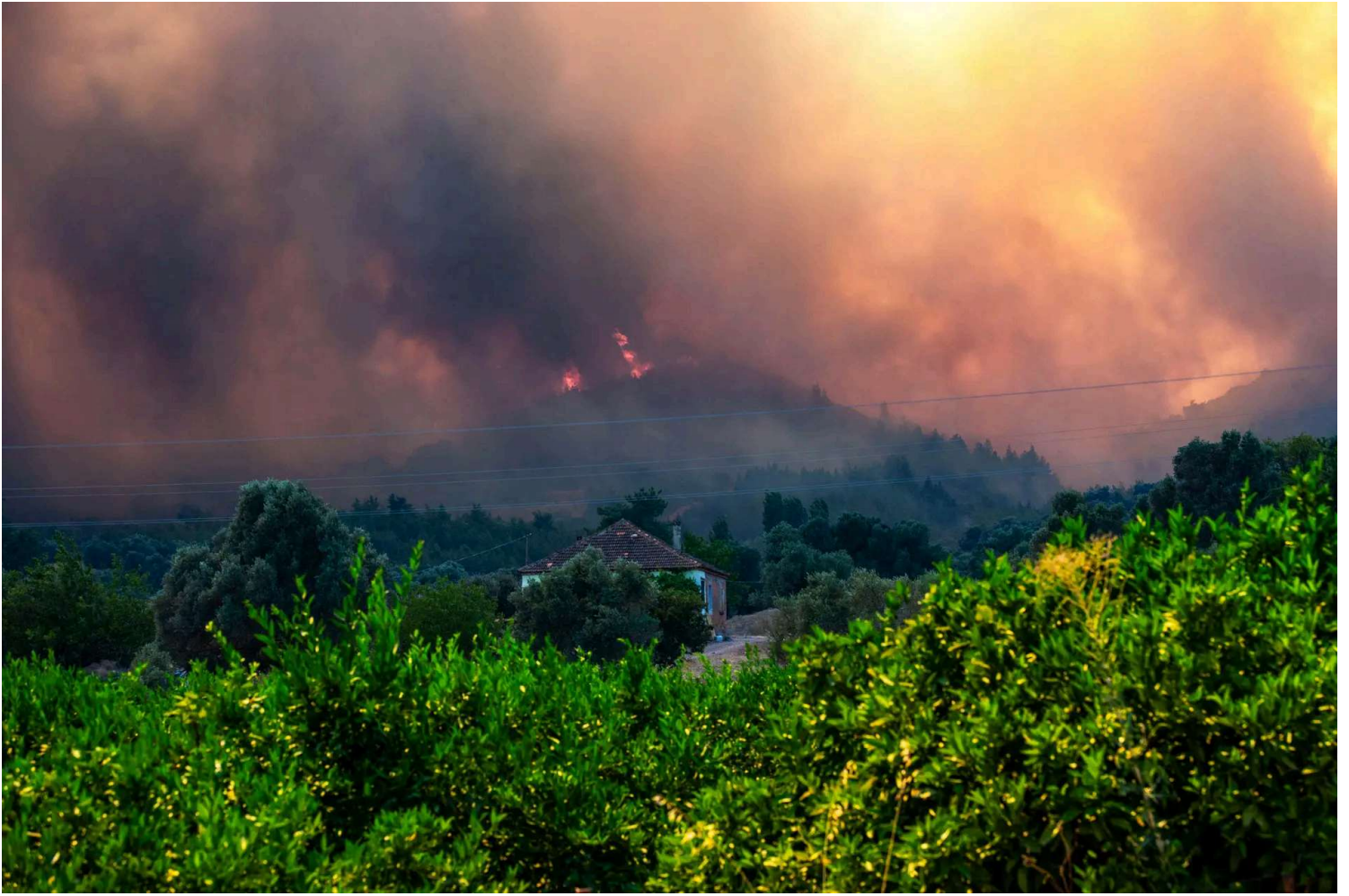
Smoke and flares rise from the forest after a wildfire broke out in Seferihisar district in Izmir, Turkey, on June 30, 2025. Rescuers have evacuated more than 50,000 people, mostly from Turkey's western Izmir province, as firefighters battled a string of wildfires, the AFAD disaster agency said.