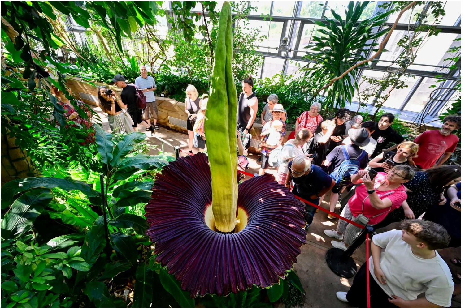
Visitors crowd around a titan arum ( Amorphophallus titanum ) plant in bloom at the Botanical Garden in Berlin on June 30, 2025. According to the Botanical Garden, the inflorescence measures 2.36 meters, making it the largest ever measured in Berlin. The flower blooms infrequently and releases an intense odor to attract carrion insects. The spectacle lasts only three days.