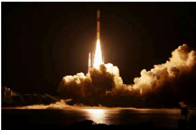
Day in Photos: Rocket Launch, National Paddy Day, and Fifa Club World 2025