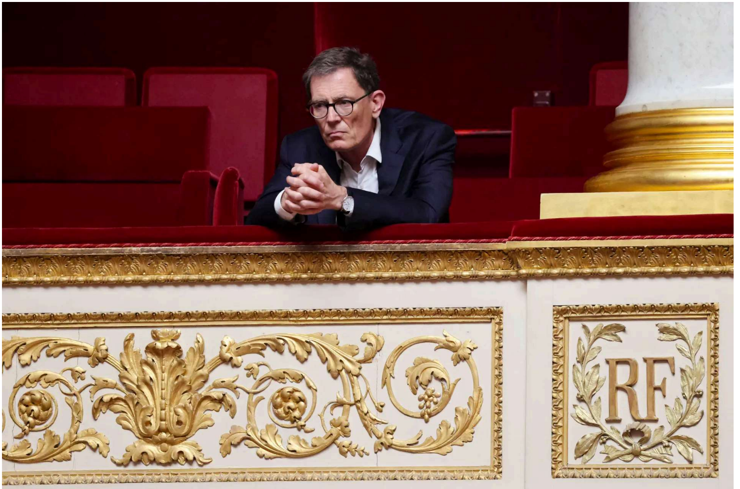
Chairman of the Committee on Culture, Education, Communication, and Sport and member of the Union Centriste group Laurent Lafon attends a session to debate the draft law, adopted by the Senate, on the reform of public broadcasting and audiovisual sovereignty at the National Assembly, the French Parliament's lower house, in Paris on June 30, 2025.