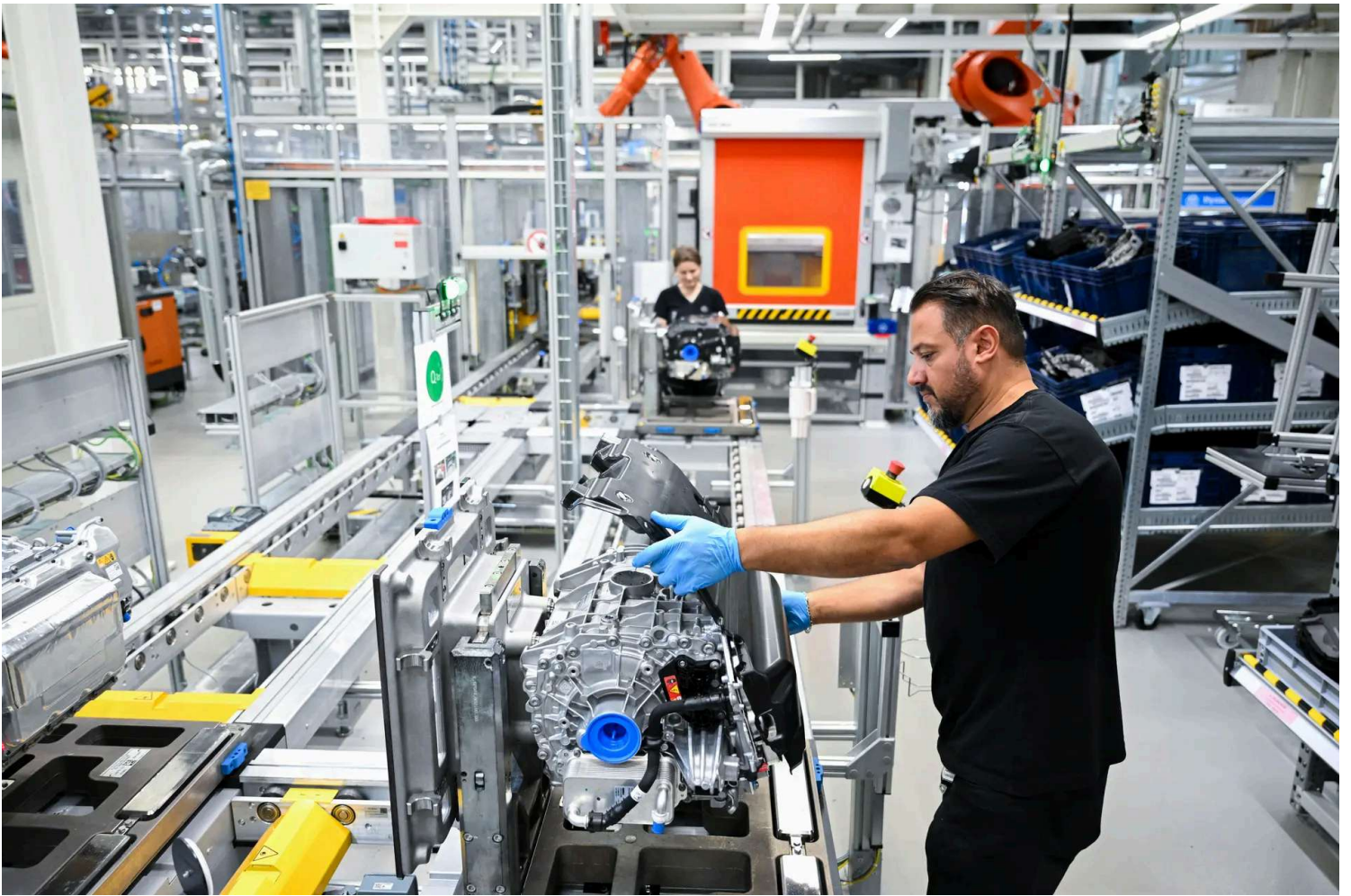
A worker assembles electric drive units for CLA class vehicles at the Mercedes-Benz Unterturkheim plant in Stuttgart, Germany, on June 30, 2025.