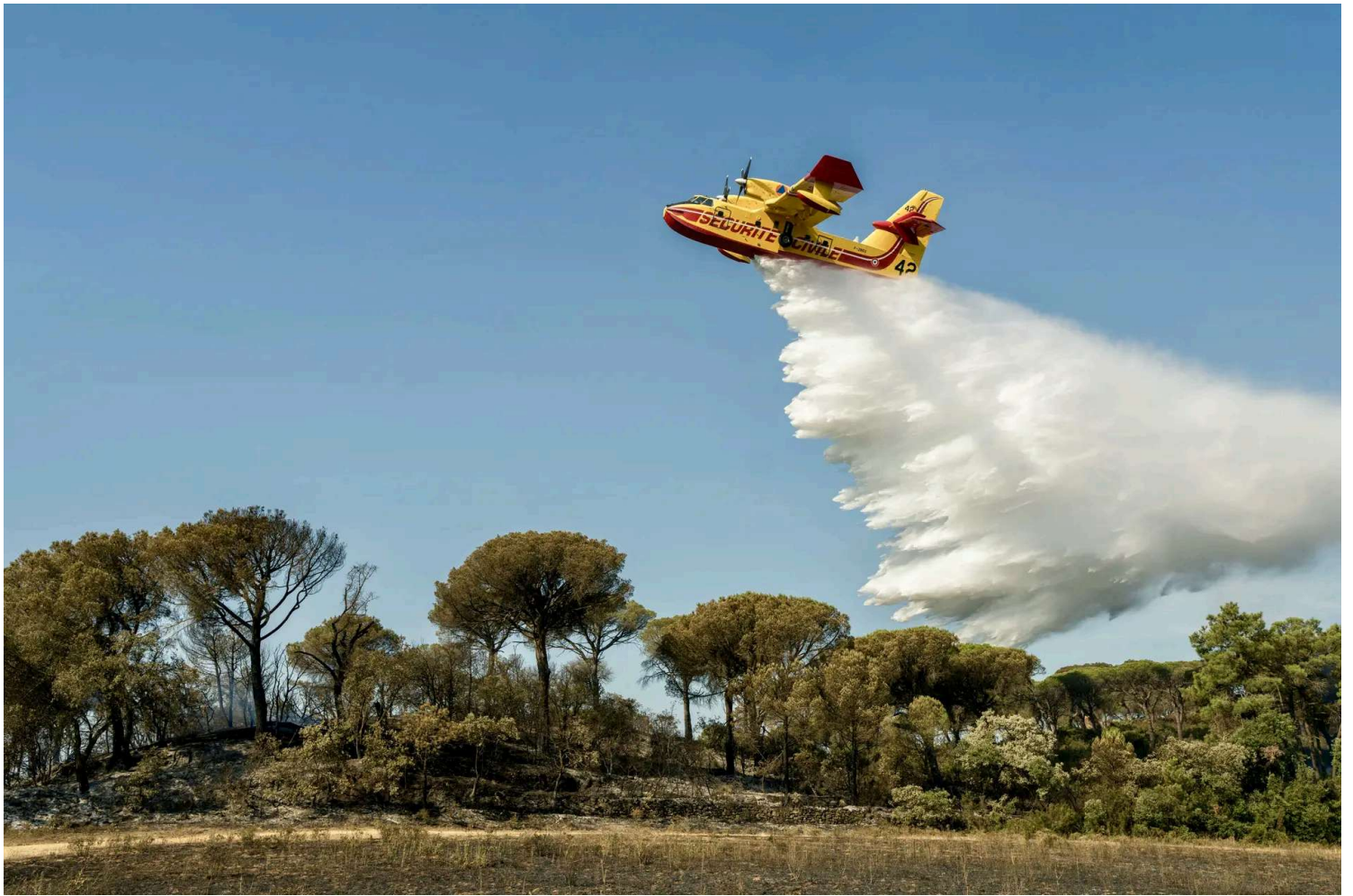
A CL-415 Canadair aircraft drops water over trees a day after a wildfire near Bizanet, France, on June 30, 2025.