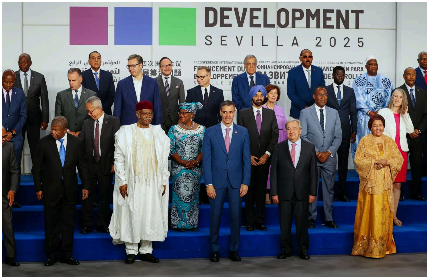
Spanish Prime Minister Pedro Sanchez (C) and U.N. Secretary-General Antonio Guterres with national leaders and representatives at the start of the four-day Financing for Development meeting, in Sevilla, Spain, on June 30, 2025.