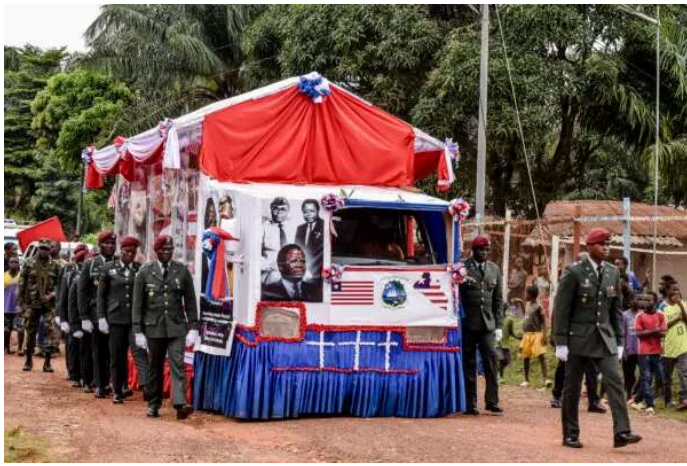
Day in Photos: Liberian President's Funeral, Plane Crash in Chartres, and Nigerian Teachers' Strike