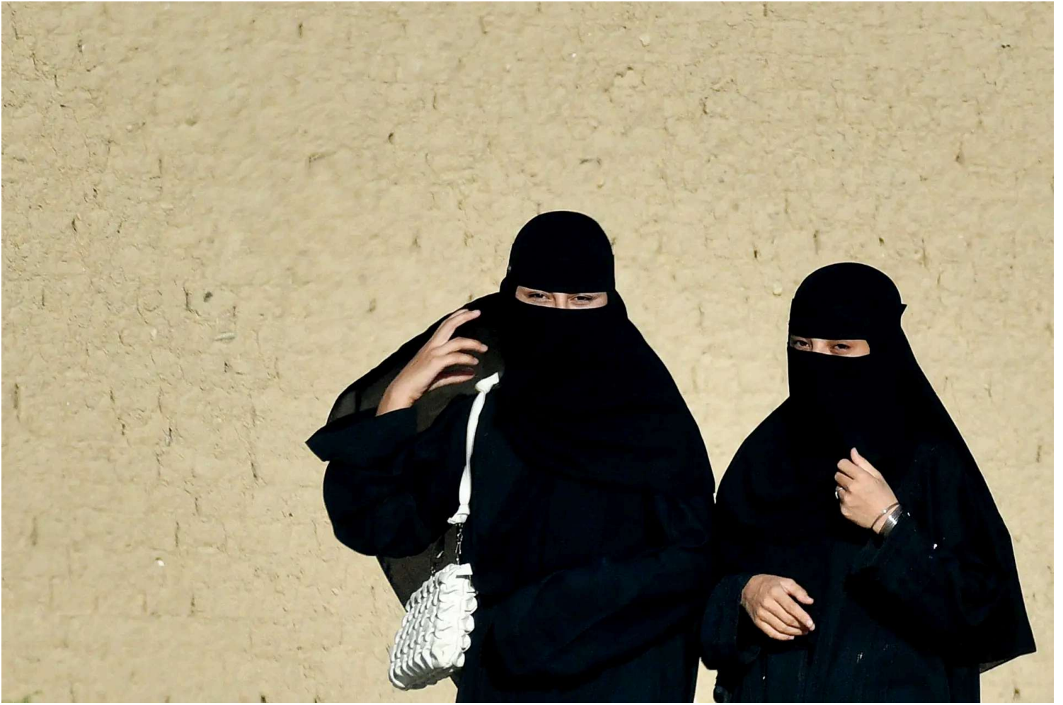
Afghan women walk along a road in the Nawabad area of Balkh Province, Afghanistan, on June 30, 2025.