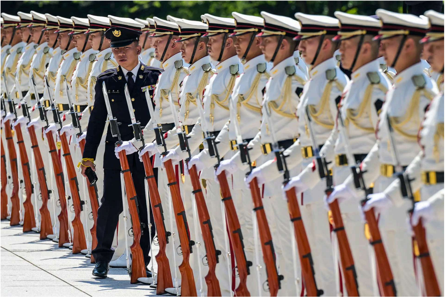
A senior member checks an honor guard before the arrival of Japanese Prime Minister Shigeru Ishiba for a visit to the Ministry of Defense in Tokyo on June 30, 2025.