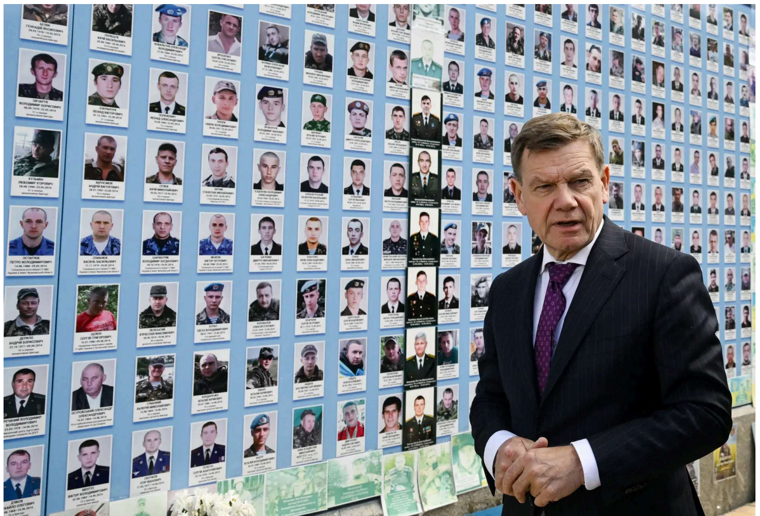
German Foreign Minister Johann Wadepful stands in front of the Memory Wall of Fallen Ukrainian Defenders before talks with his Ukrainian counterpart, amid the Russian invasion, in Kyiv, Ukraine, on June 30, 2025