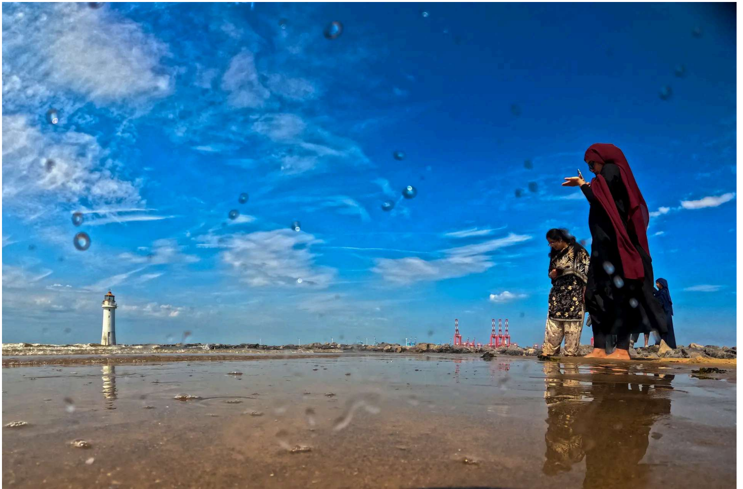
People paddle in the sea on New Brighton beach at the confluence of the River Mersey and the Irish Sea in New Brighton, England, on June 30, 2025. Up to 85 percent of sewers in Merseyside are combined overflow outlet pipes, meaning sewage and wastewater can flow into rivers and watercourses during periods of heavy rain. Water companies will now have to use nature-based solutions when managing wastewater, as the Water (Special Measures) Act 2025 comes into force.