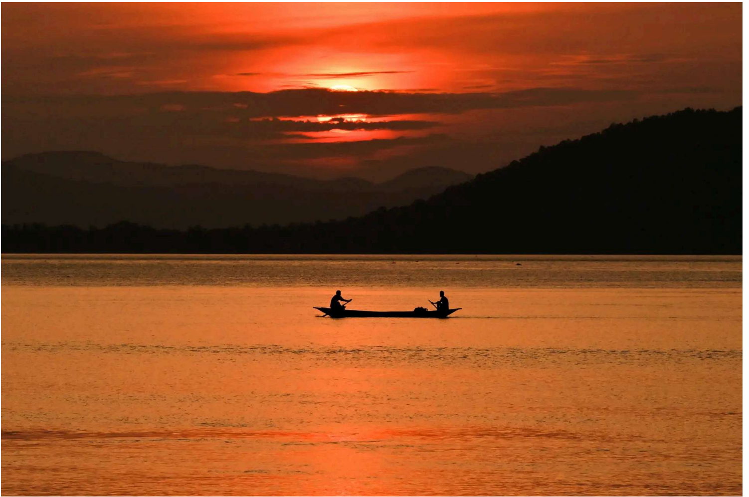
Fishermen paddle in the Brahmaputra River during sunset in Guwahati, India, on June 30, 2025.