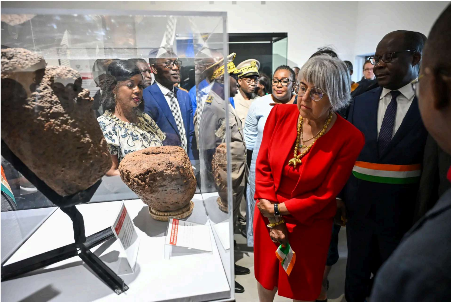
Swiss Interior Minister Elisabeth Baume-Schneider (3rd R) looks at an exhibit next to Ivorian Minister of Health Pierre Demba (2nd R) during the inauguration of an extension of Ivory Coast's first archaeological museum in the village of Singrobo-Ahouty near Tiassale on June 30, 2025. Ivory Coast inaugurated a new extension of its first archaeological museum after Stone Age relics surfaced when a dam was being built in the south of the country.