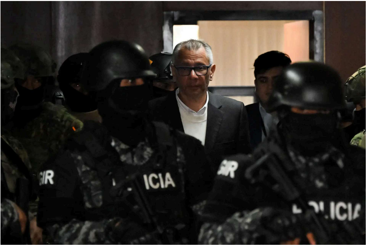
Former Ecuadorian Vice President Jorge Glas is heavily escorted as he arrives for a hearing at the National Court of Justice in Quito, Ecuador, on June 30, 2025. Glas, who had been serving a corruption conviction since 2017 and is at the center of a diplomatic dispute between Mexico and Ecuador, is facing a new trial on charges of alleged misappropriation of public funds.