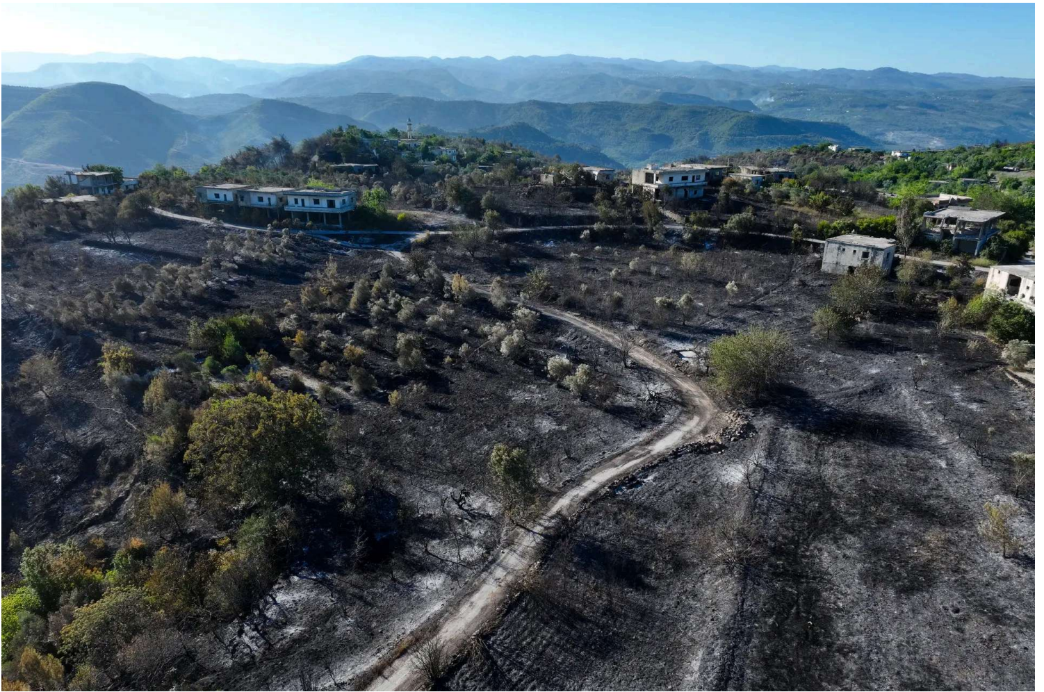
An aerial view shows burnt fields outside the village of Rihaniya in the Latakia province amid efforts to contain wildfires sweeping through the area in Syria's Mediterranean west, on July 1, 2025. Syria is suffering from the worst drought in decades as a heatwave hits the region in the early weeks of summer.