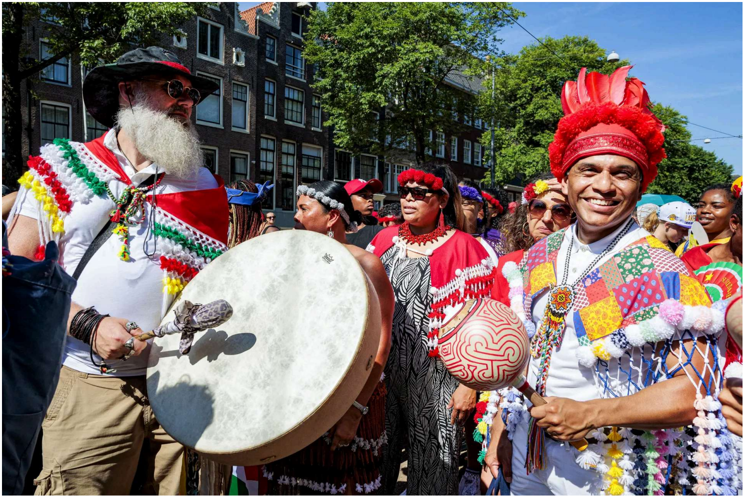
People take part in a parade known as “Ketikoti”—meaning the chains are broken—commemorating the abolition of slavery in Dutch former colony Surinam in 1863, in Amsterdam, Netherlands, on July 1, 2025.