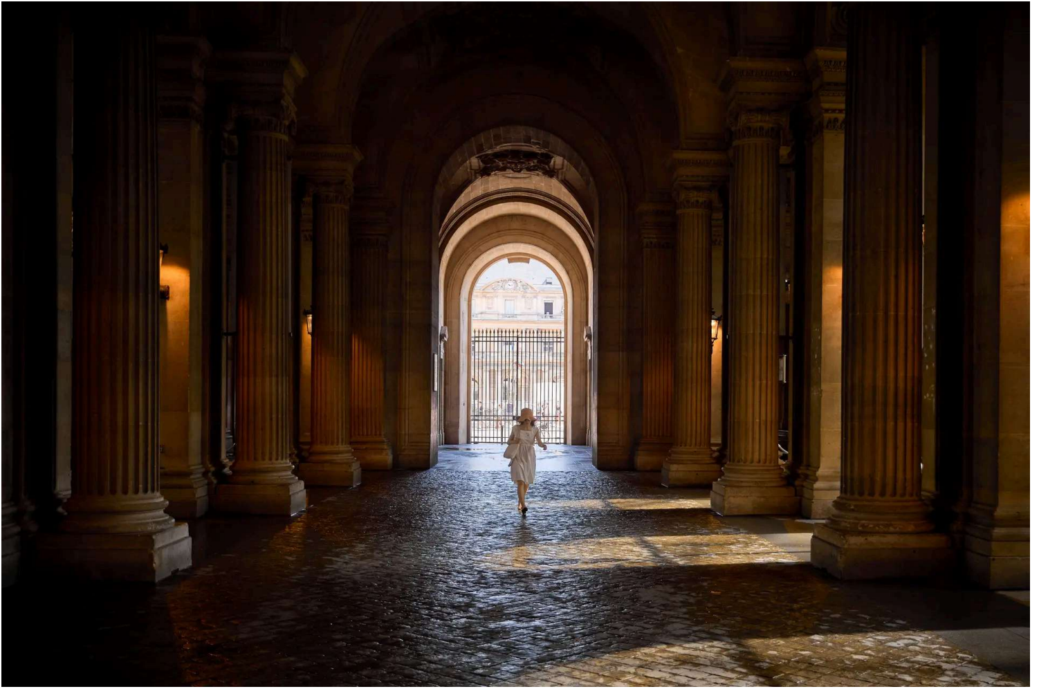
A woman walks in the shade of the Richelieu passageway in the Musee du Louvre as the French capital experiences temperatures of 38 degrees Celsius in Paris, France, on July 1, 2025.