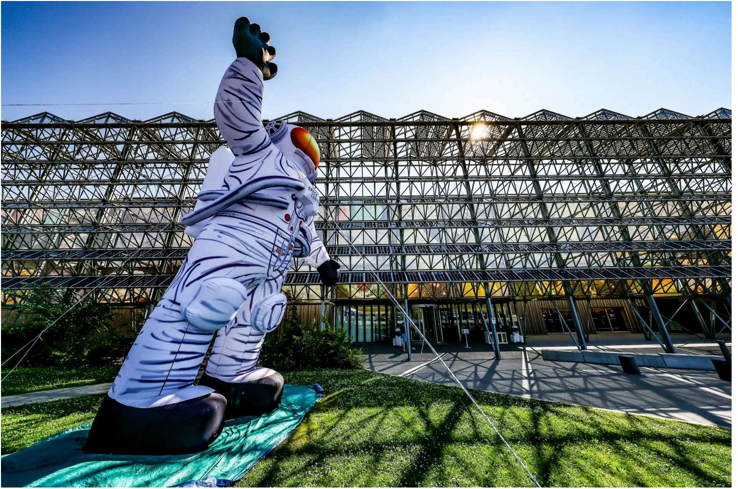
The Euro Space Center ahead of the official inauguration of "Lunar-X," the new attraction at the Euro Space Center, in Transinne, Belgium, on July 1, 2025.