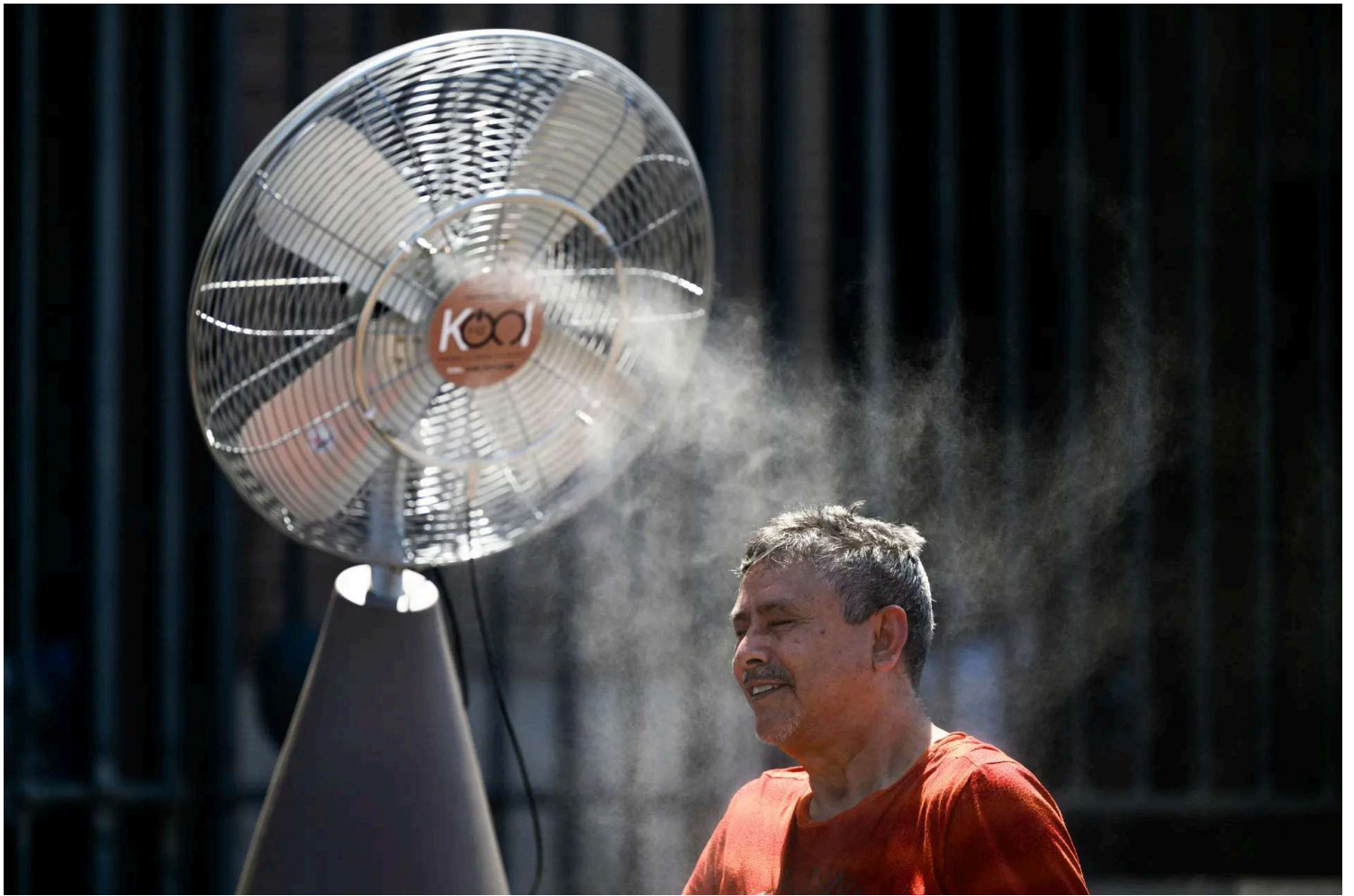
A man cools down with a fan during an ongoing heat wave with temperatures reaching 40 degrees Celsius, at Colosseo area in Rome, Italy, on July 1, 2025. Rome is one of 17 regions across Italy that have been issued a Level 3 heat risk for Tuesday, indicating emergency conditions that pose a risk to health.