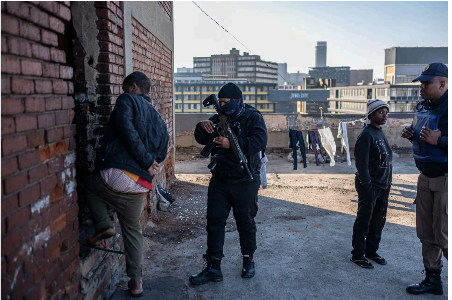
A private security officer follows a suspected illegal immigrant after detaining him on the rooftop of a hijacked building in the Johannesburg CBD, on July 1, 2025, during an operation called "Nomakanjani Manje Namhlanje." Led by the South African Police Service (SAPS), the Johannesburg Metro Police Department (JMPD), Johannesburg City Power, and private security, it is aimed at cracking down on illegal immigrants, hijacked buildings, illegal electrical connections, and general crime.