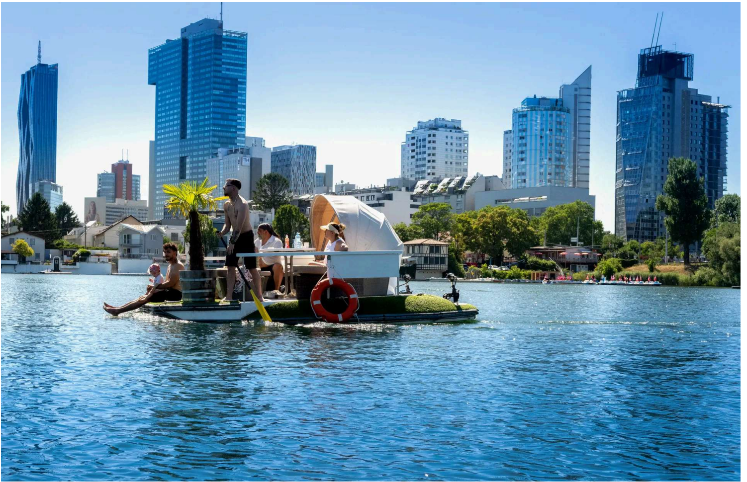
People sail their floating island along the Old Danube river during a hot summer day in Vienna, Austria, on July 1, 2025.