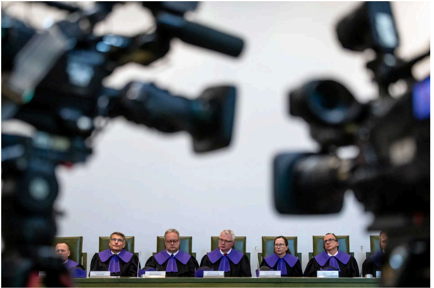
Judges of the Supreme Court of Poland are seen behind two broadcast cameras in the courtroom in Warsaw, on July 1, 2025, during the ruling on the validity of the vote won by the nationalist opposition candidate in last month's presidential election.