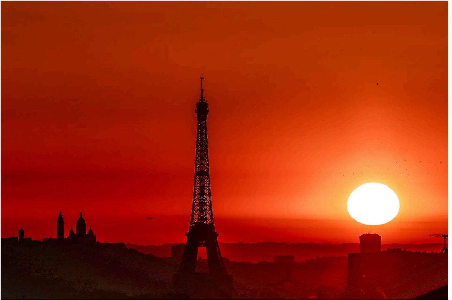
The sun rises behind the Eiffel Tower and the Sacre Coeur Basilica atop the Montmartre hill in Paris, on July 1, 2025, as the city is on red alert for high temperatures. The top of the Eiffel Tower has been closed, polluting traffic is banned, and speed restrictions are in place as a searing heatwave grips Europe.