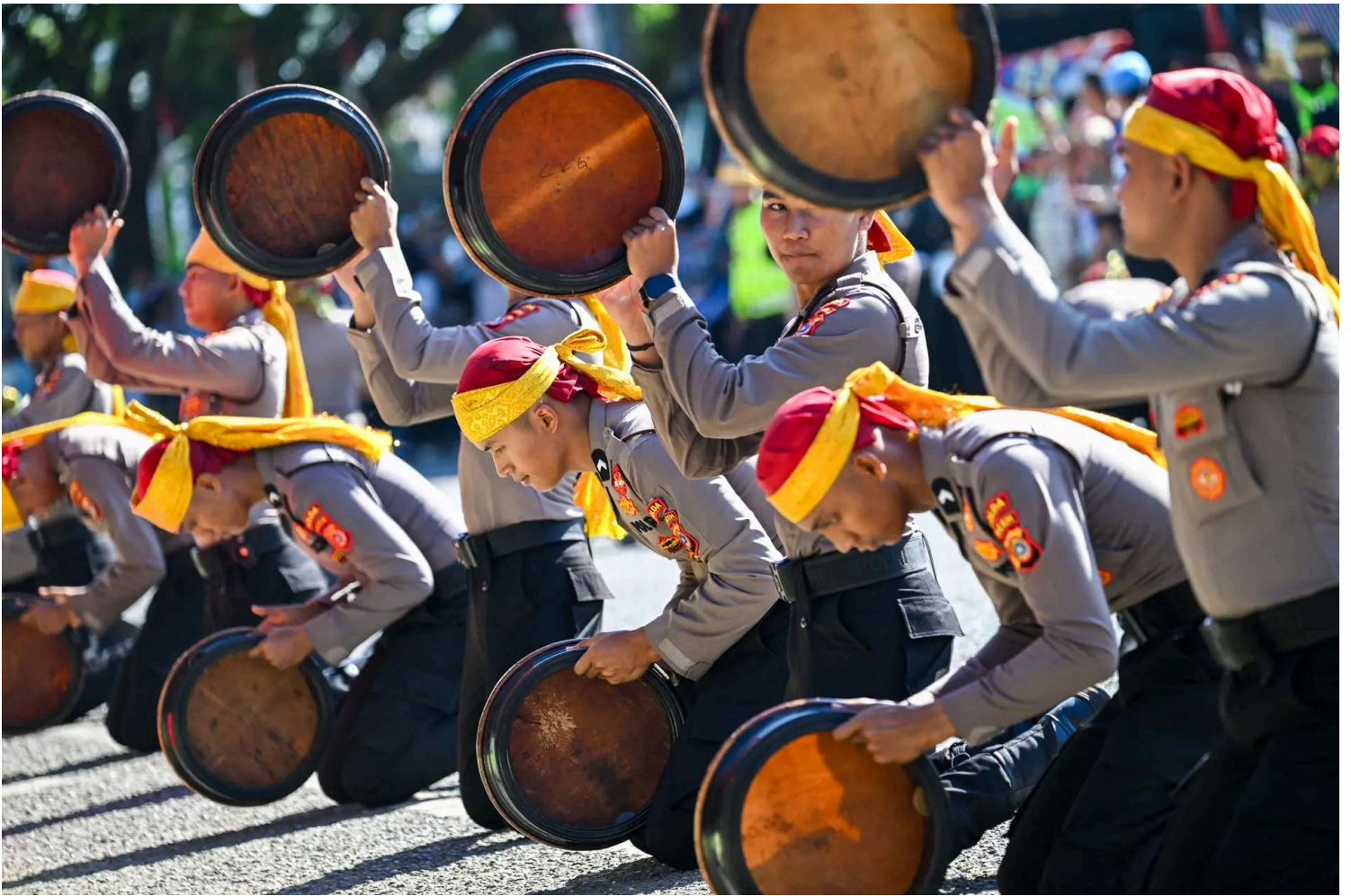
Police officers perform a traditional dance during a ceremony to commemorate the 79th anniversary of the Indonesian National Police in Banda Aceh, on July 1, 2025.