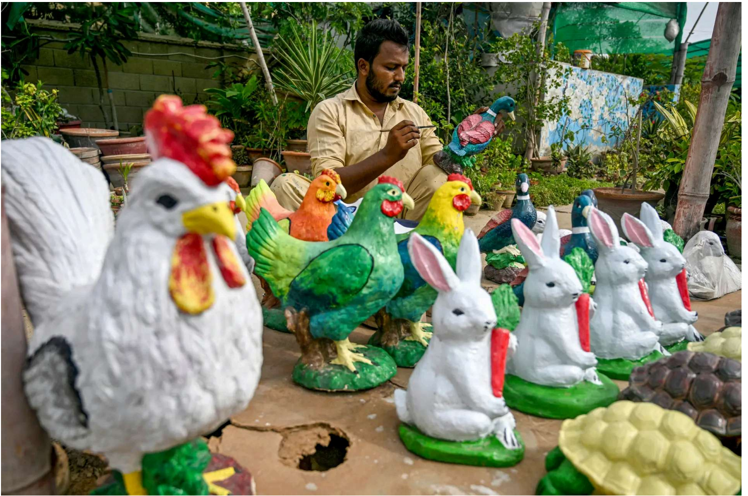
An artist paints as he prepares decorative clay items at a workshop in Karachi, Pakistan, on July 1, 2025.