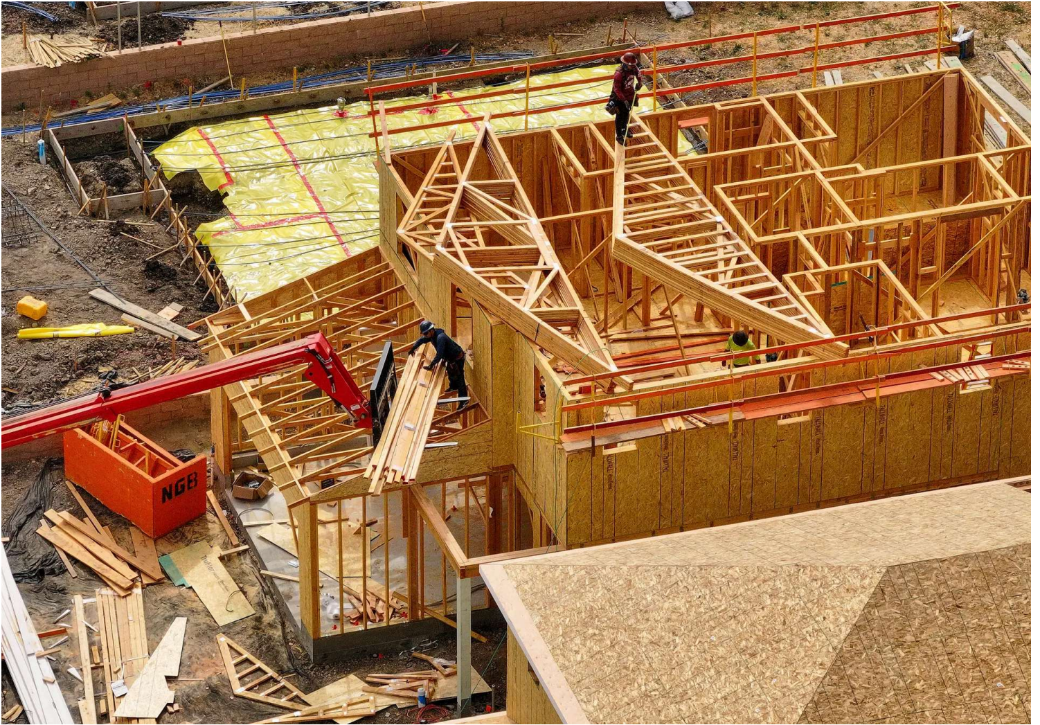
Construction workers build a home at a new housing development in Hercules, Calif., on July 1, 2025. According to a report by the U.S. Commerce Department's Census Bureau, U.S. construction spending fell 0.3 percent in May as higher mortgage rates and rising inventory impacted single-family housing projects.