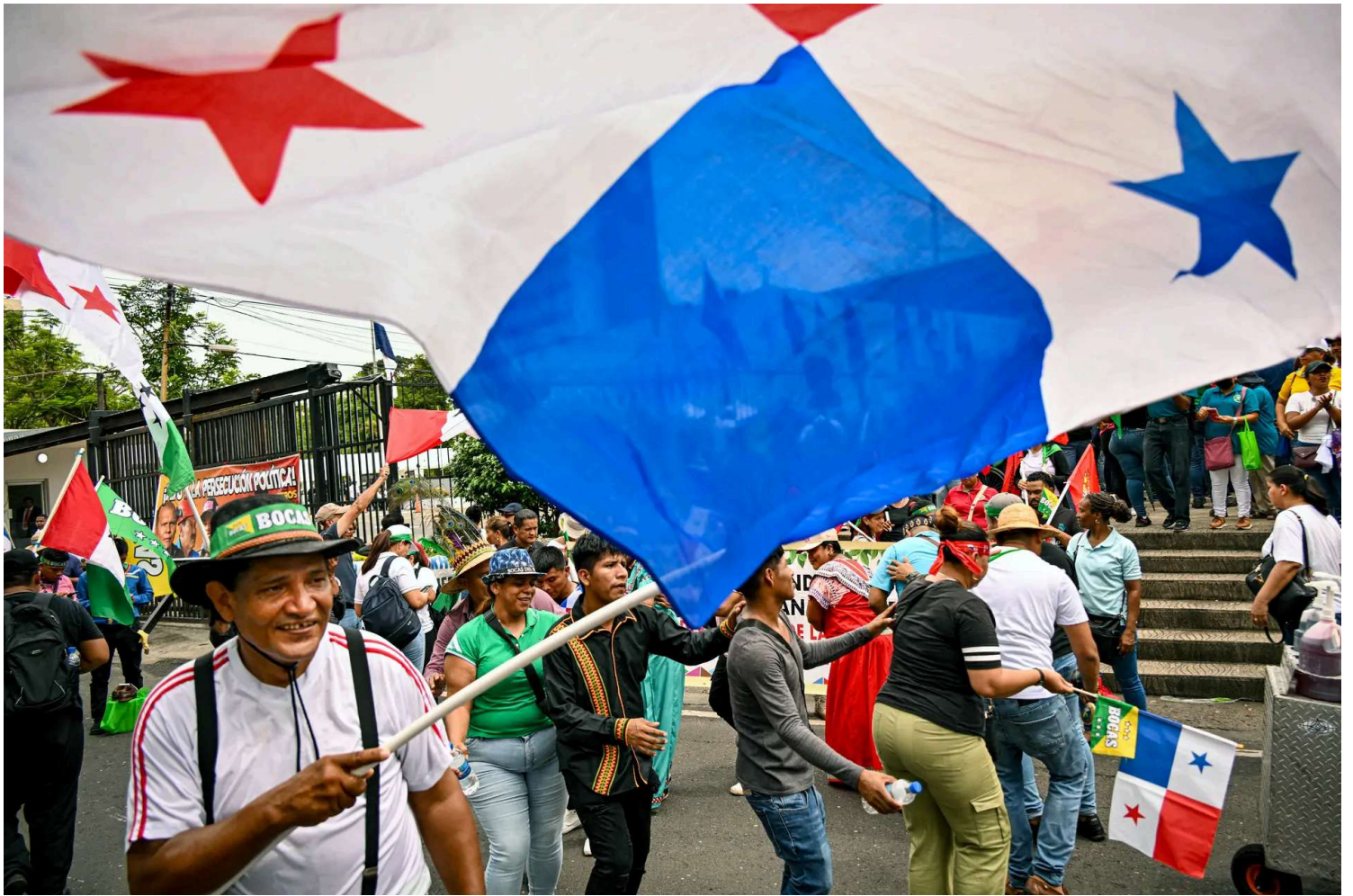
A demonstrator waves a Panamanian flag during a rally outside the National Assembly to protest the government of Panama's President Jose Raul Mulino just before he addresses the nation on his first anniversary in office, in Panama City, on July 1, 2025.