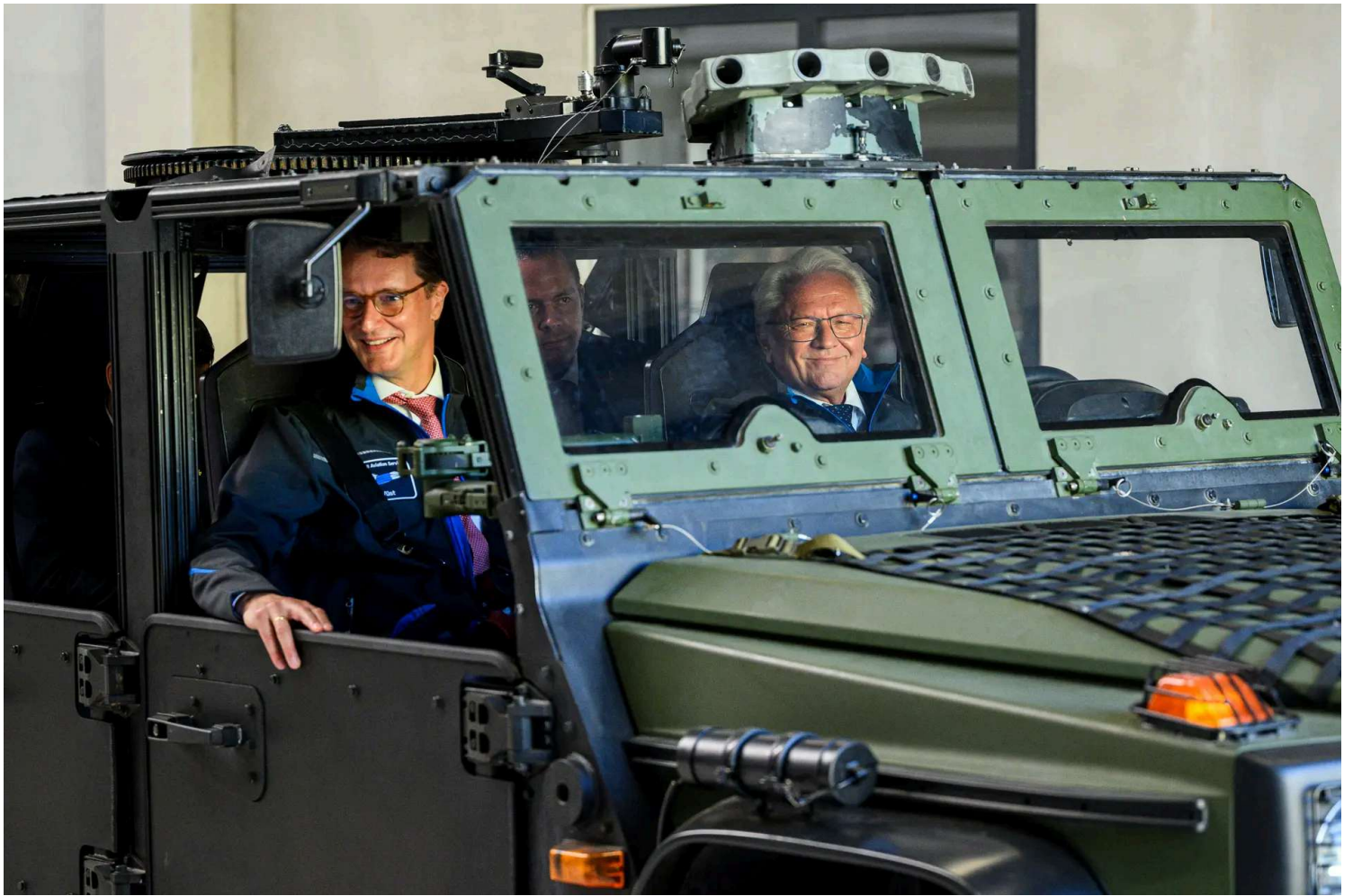
Hendrik Wuest, Premier of North Rhine-Westphalia, (L) and Armin Papperger, CEO of Rheinmetall AG, (R) ride in a military vehicle in Weeze, Germany, on July 1, 2025. Rheinmetall, Germany's biggest weapons manufacturer, is cooperating with Lockheed Martin to manufacture the fuselage sections for planes ordered by the Luftwaffe, Germany's air force.