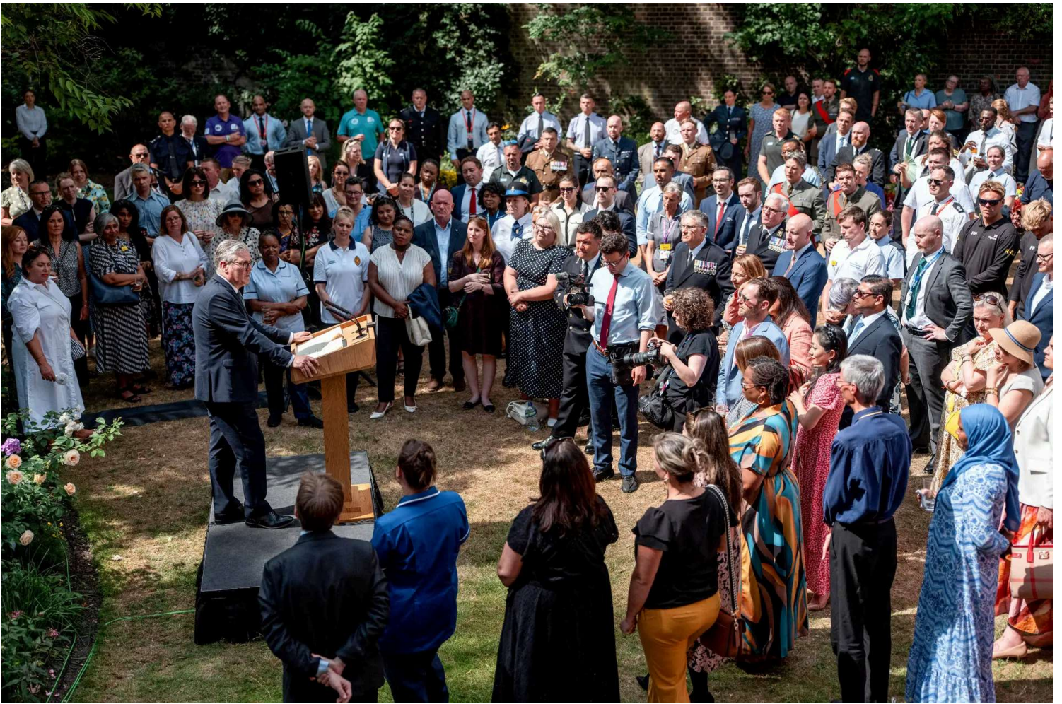
Britain's Prime Minister Keir Starmer speaks during a reception for public sector workers at 10 Downing Street in London, on July 1, 2025.