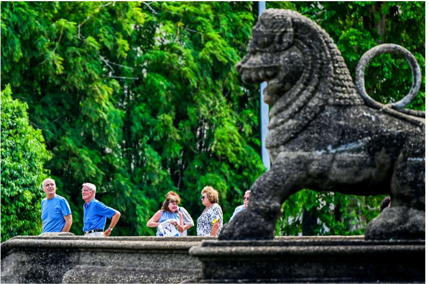
Tourists walk past a stone lion at the Independence Memorial Hall, built to commemorate Sri Lanka's independence from British rule, in Colombo, on July 1, 2025.

Sign up for the News Alerts newsletter. You'll get the biggest developing stories so you can stay ahead of the game. Sign up with 1-click >>