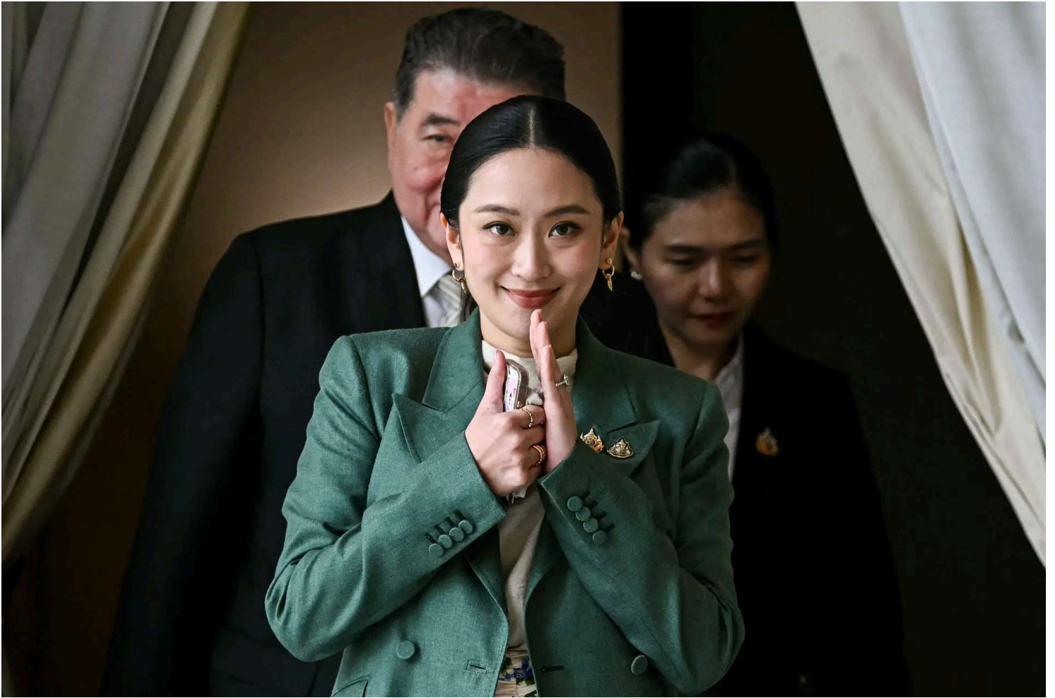
Thailand's Prime Minister Paetongtarn Shinawatra arrives for a press conference following her suspension by the country's Constitutional Court at Government House in Bangkok, on July 1, 2025. The prime minister was suspended as the court opened a probe into her conduct in a diplomatic spat with Cambodia.