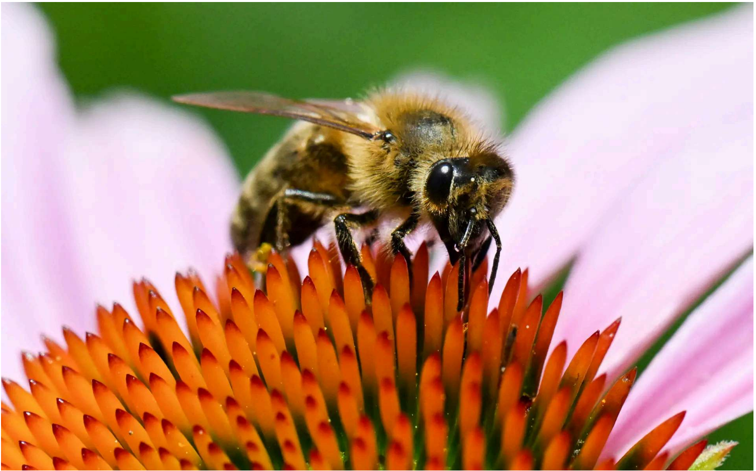
A honeybee collects pollen on a blooming coneflower ( echinacea purpurea ) in Ludwigsburg, Germany, on July 1, 2025.