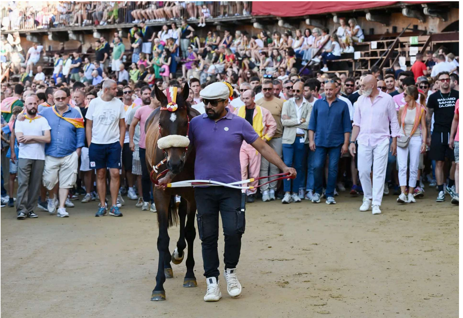
The groom of the Valdimontone district escorts the horse 'Comancio' after the practices ahead of the historical Italian horse race Palio di Siena in Tuscany, on July 1, 2025.