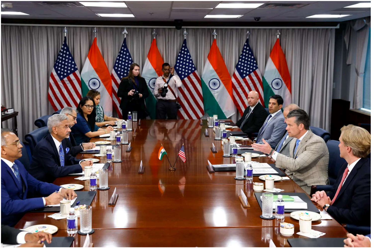
U.S. Secretary of Defense Pete Hegseth meets with Indian Minister of External Affairs Subrahmanyam Jaishankar at the Pentagon in Arlington, Va., on July 1, 2025, to discuss defense initiatives and military cooperation.