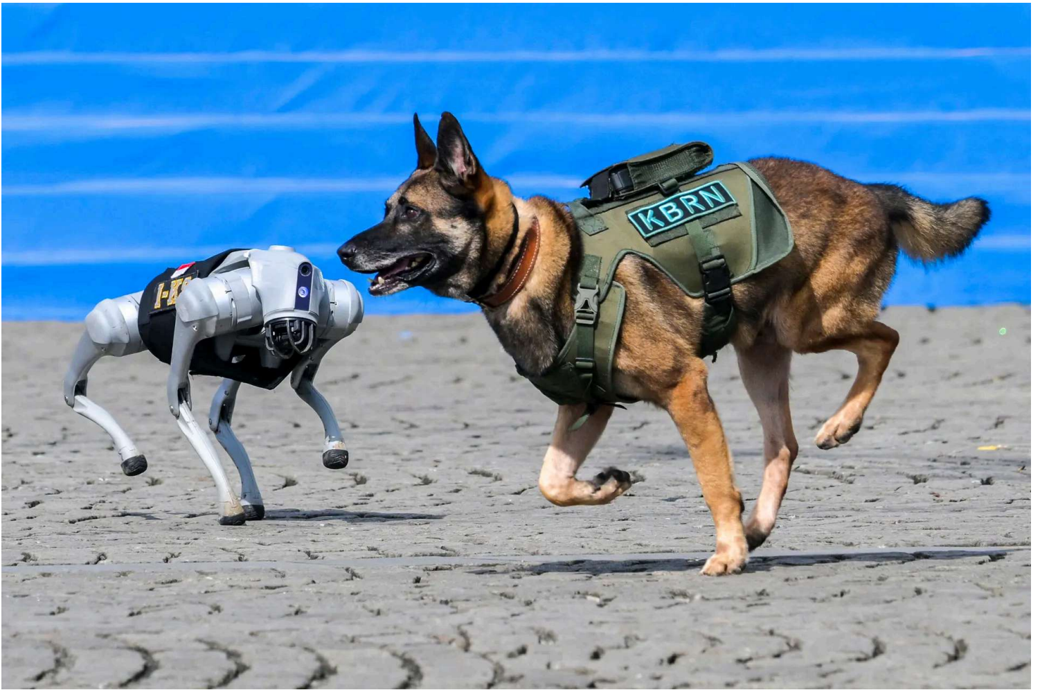
A robotic police dog and a K9 police dog work together in a crime-handling skill demonstration during the 79th anniversary celebration of the Indonesian National Police held at the National Monument, known as Monas, in Jakarta, on July 1, 2025.