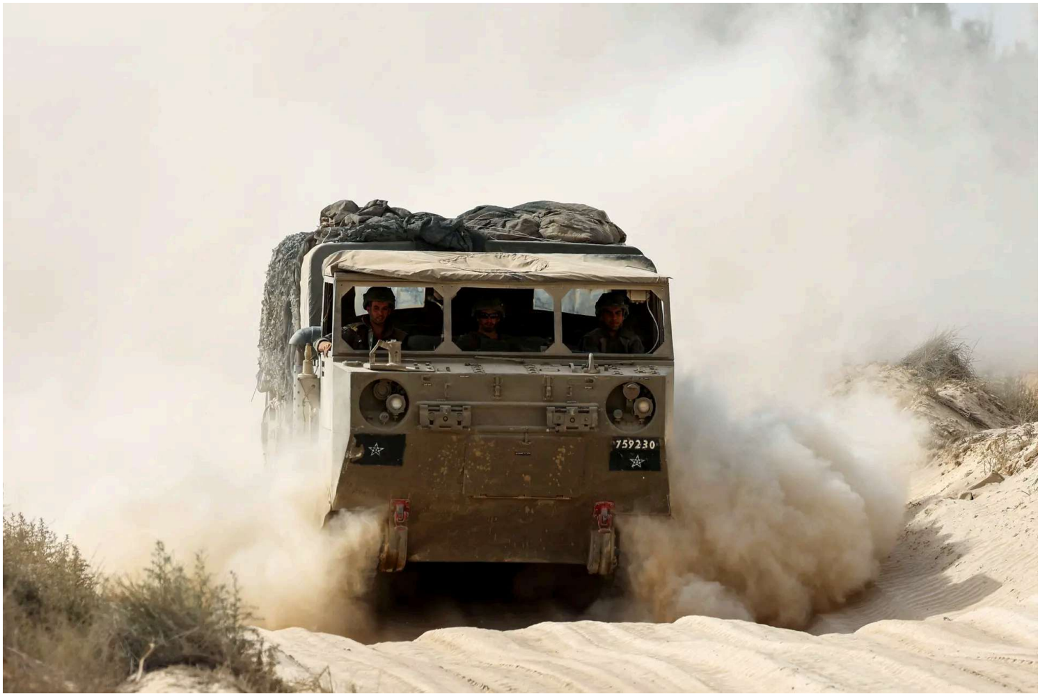
Israeli troops deploy at a position on Israel's border with the Gaza Strip, on July 1, 2025. Israel's military said on July 1 that it had expanded its operations in Gaza, where residents reported fierce gunfire and shelling days ahead of Prime Minister Benjamin Netanyahu's planned trip to Washington.