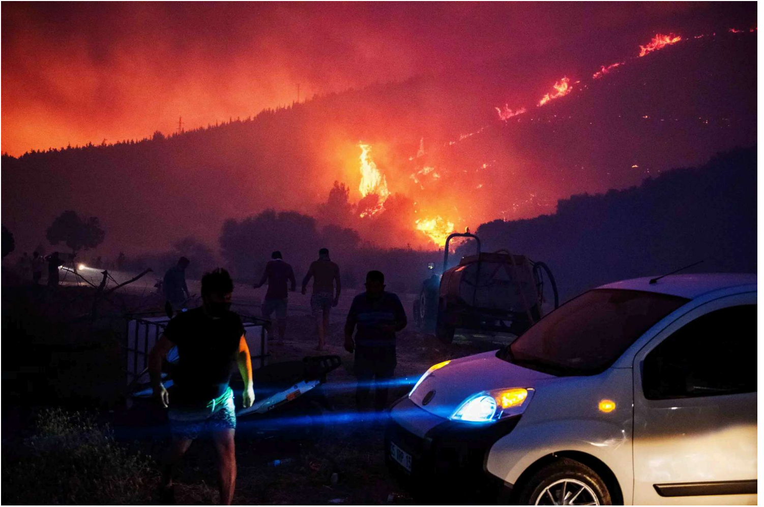
People and firefighters attempt to extinguish the flames as smoke and flares rise from a forested area following a wildfire in the Seferihisar district of Izmir, Turkey, on June 30, 2025.