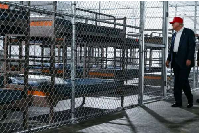
Day in Photos: ‘Alligator Alcatraz,’ Extreme Heat in Europe, and Slavery Abolition Parade