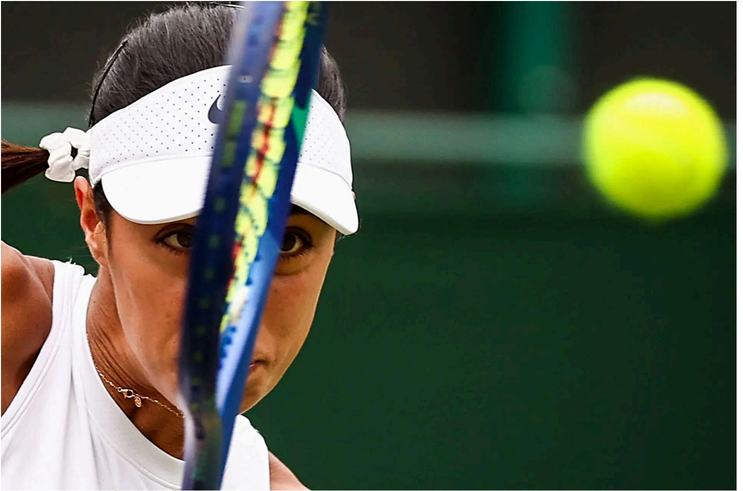
Serbia's Olga Danilovic plays a backhand return to American Madison Keys during their women's singles second round tennis match on the third day of the 2025 Wimbledon Championships at The All England Lawn Tennis and Croquet Club in Wimbledon, London, on July 2, 2025.