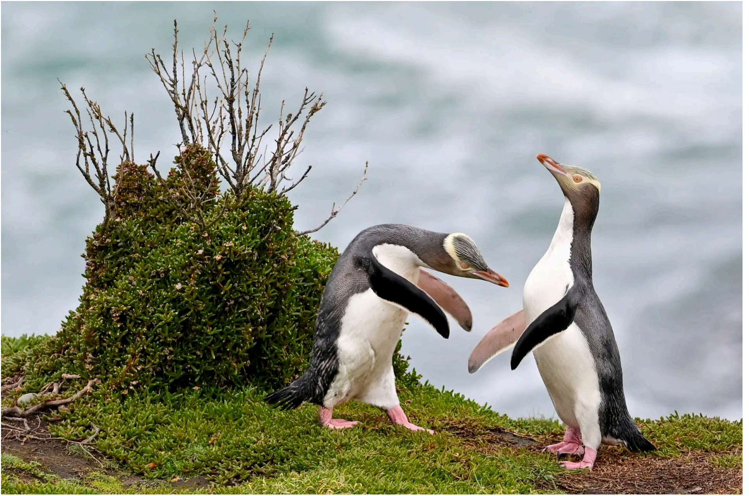
Yellow-eyed penguins rest after returning to their colony from the sea in Katiki Point, on the southern end of the Moeraki Peninsula in New Zealand's South Island, about 80 kilometers north of Dunedin, on July 2, 2025.