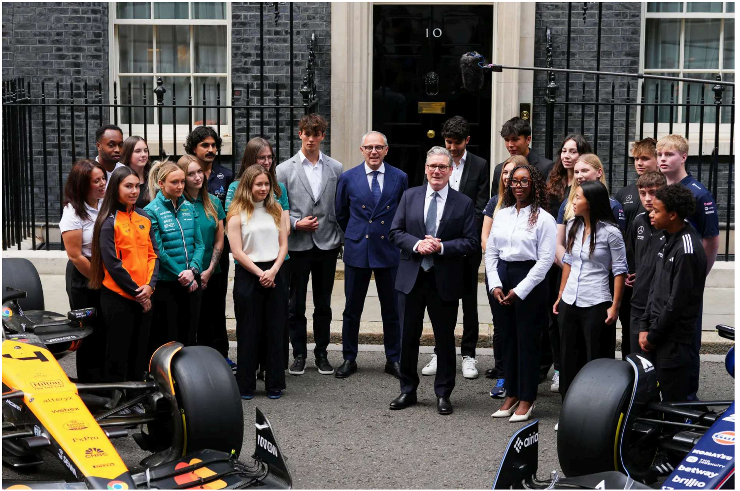
British Prime Minister Keir Starmer talks with Formula One team apprentices outside 10 Downing Street as he hosts F1 VIPs ahead of the British Grand Prix in London, England, on July 2, 2025. This weekend, the British Grand Prix will be held at Silverstone as the sport celebrates its 75th anniversary in 2025.