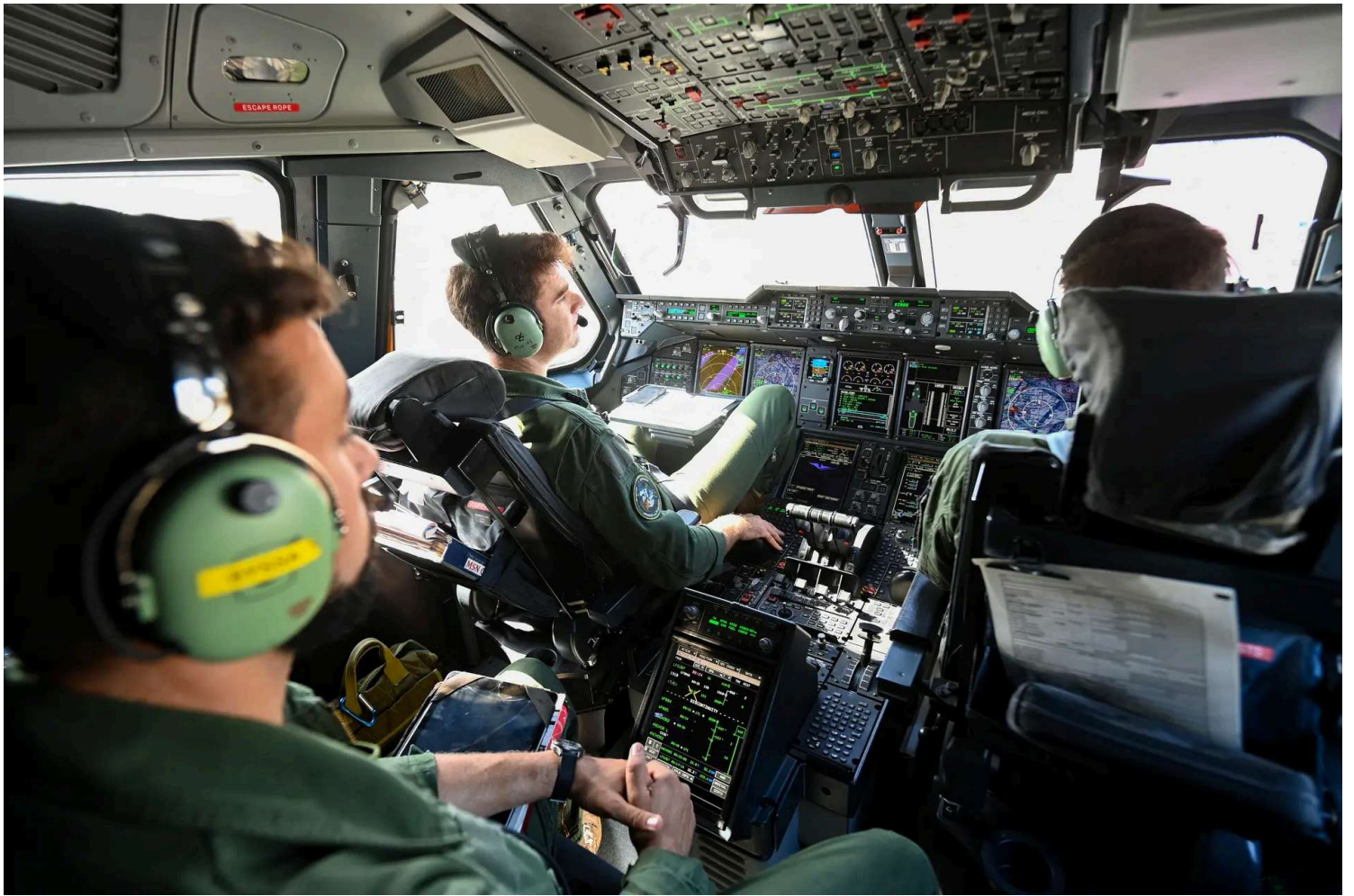
Airbus A400M Atlas commander Dorian (C) takes part in a rehearsal for the annual Bastille Day military parade, near the Orleans-Bricy air base, some 20 km (13 miles) from Orleans, France, on July 2, 2025.