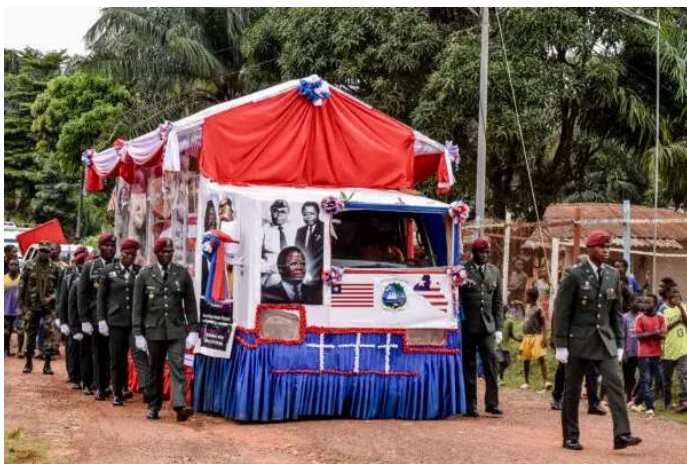
Day in Photos: Liberian President's Funeral, Plane Crash in Chartres, and Nigerian Teachers' Strike