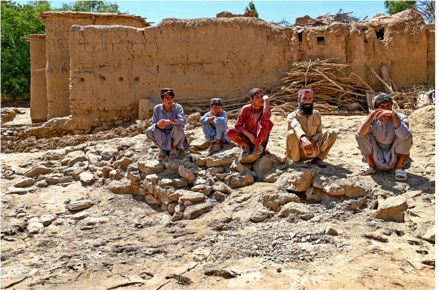
Afghan residents sit in a flash flood affected area in Nirkh district, Maidan Wardak province, Afghanistan, on July 2, 2025.

Sign up for the News Alerts newsletter. You'll get the biggest developing stories so you can stay ahead of the game. Sign up with 1-click >>