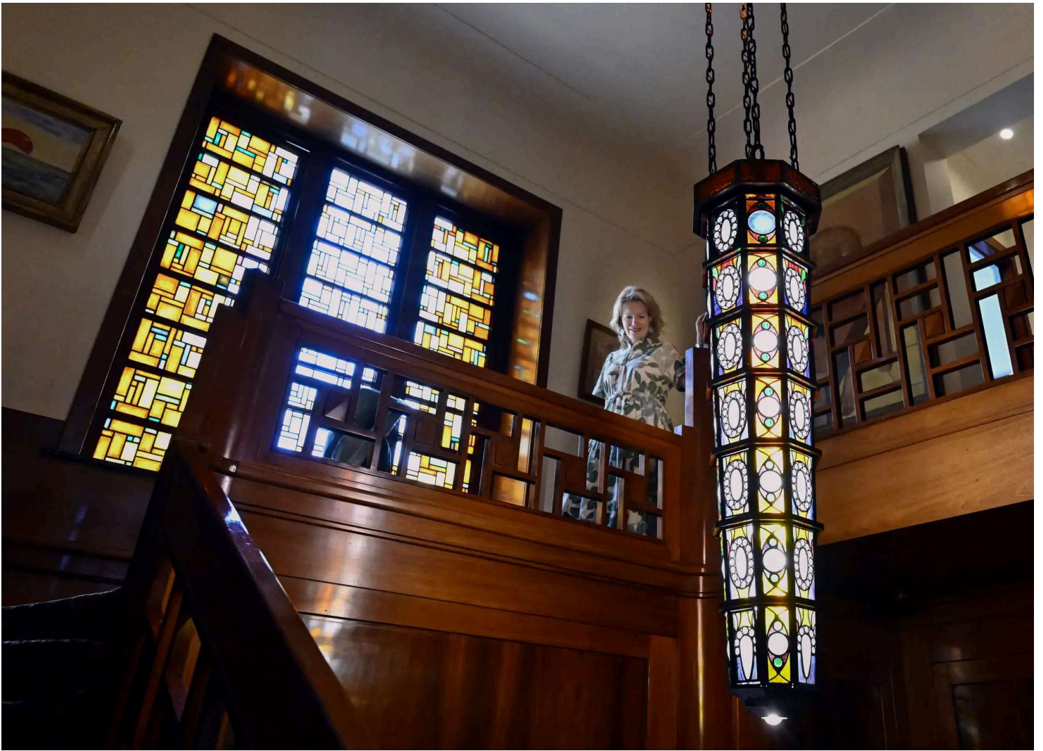
Queen Mathilde of Belgium pictured during a royal visit the "Museum & Gardens van Buuren" in Uccle, an Art Deco museum owned by art collectors David and Alice van Buuren, on July 2, 2025.