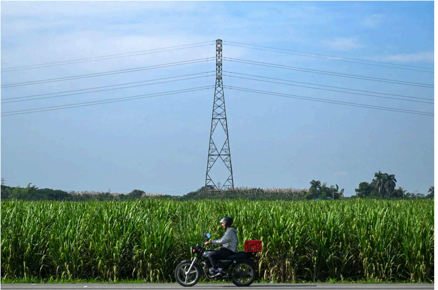
A man rides a motorcycle past a high voltage post at a sugar cane field in Yumbo, near Cali, Colombia, on July 2, 2025.