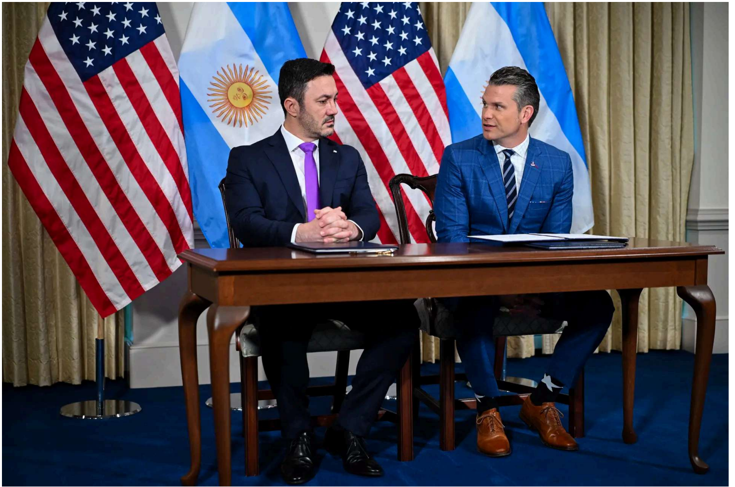
U.S. Defense Secretary Pete Hegseth speaks as Argentine Defense Minister Luis Petri looks on during a signing agreement for the sale of M1126 Stryker vehicles to Argentina at the Pentagon in Washington on July 2, 2025.