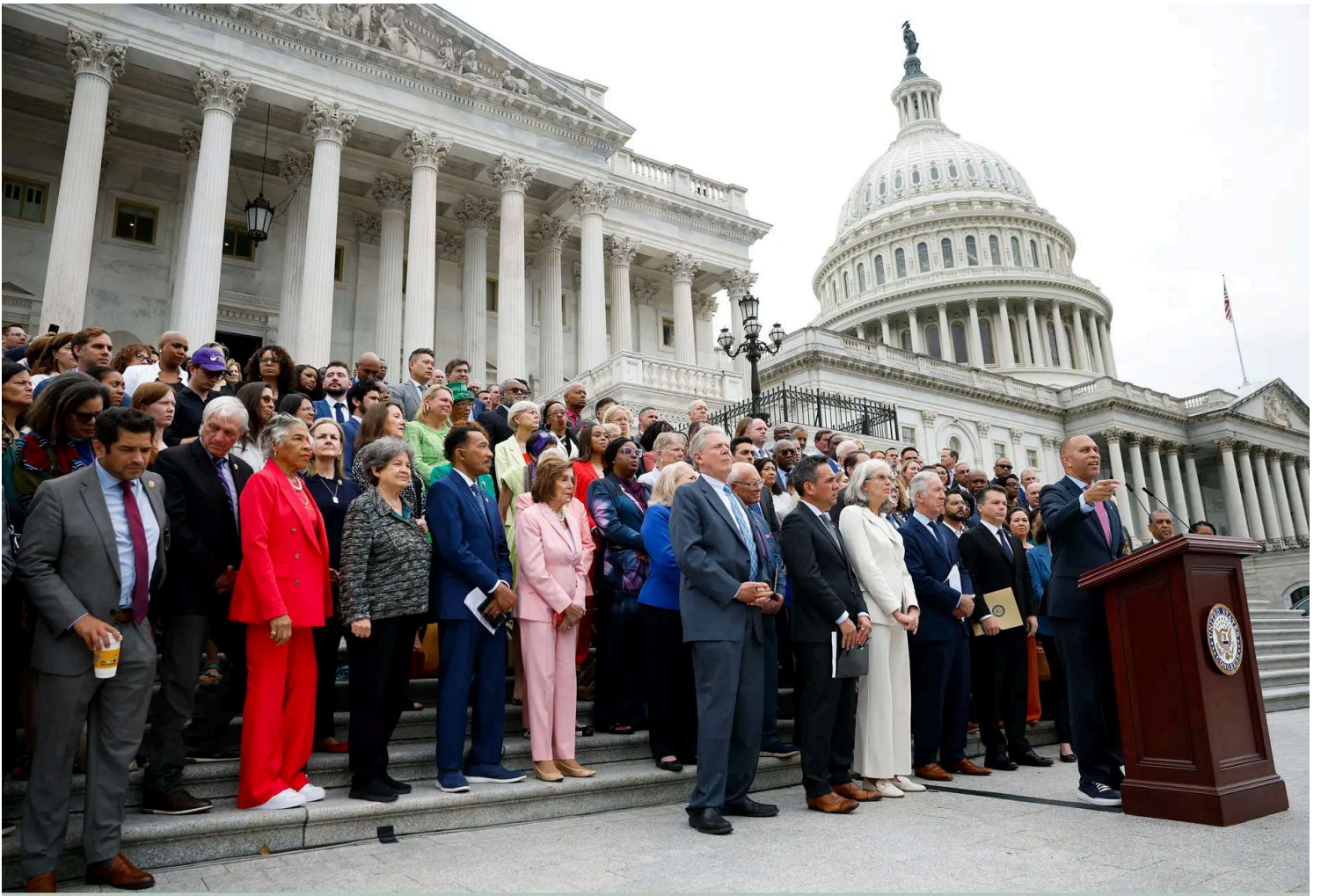
House Minority Leader Rep. Hakeem Jeffries (D-N.Y.), joined by fellow Democrats, speaks out against the One Big Beautiful Bill Act at a press conference outside the U.S. Capitol in Washington, on July 2, 2025. House Republicans continue their work to pass the Senate version of President Donald Trump's sweeping tax and spending bill.