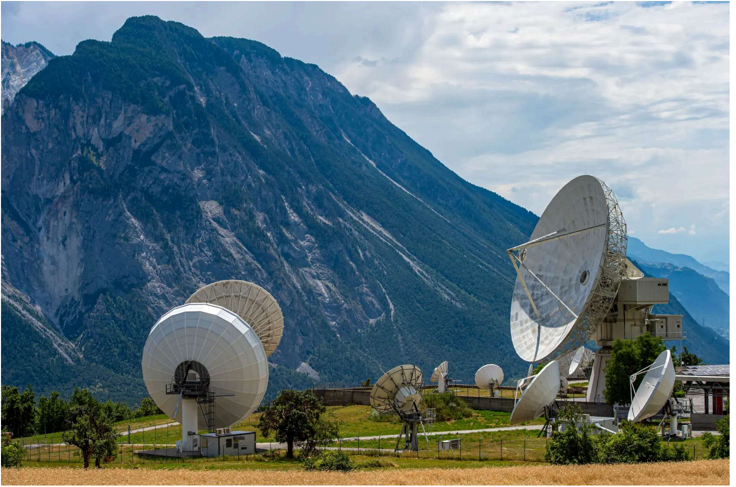
Satellite dishes belonging to local communications provider Leuk Teleport and Data Centre AG stand on a mountainside in Wallis canton near Leuk, Switzerland, on July 2, 2025. SpaceX, owned by Elon Musk, is seeking to build 40 satellite dishes for the Starlink satellite network at the site, with construction to possibly begin in September.