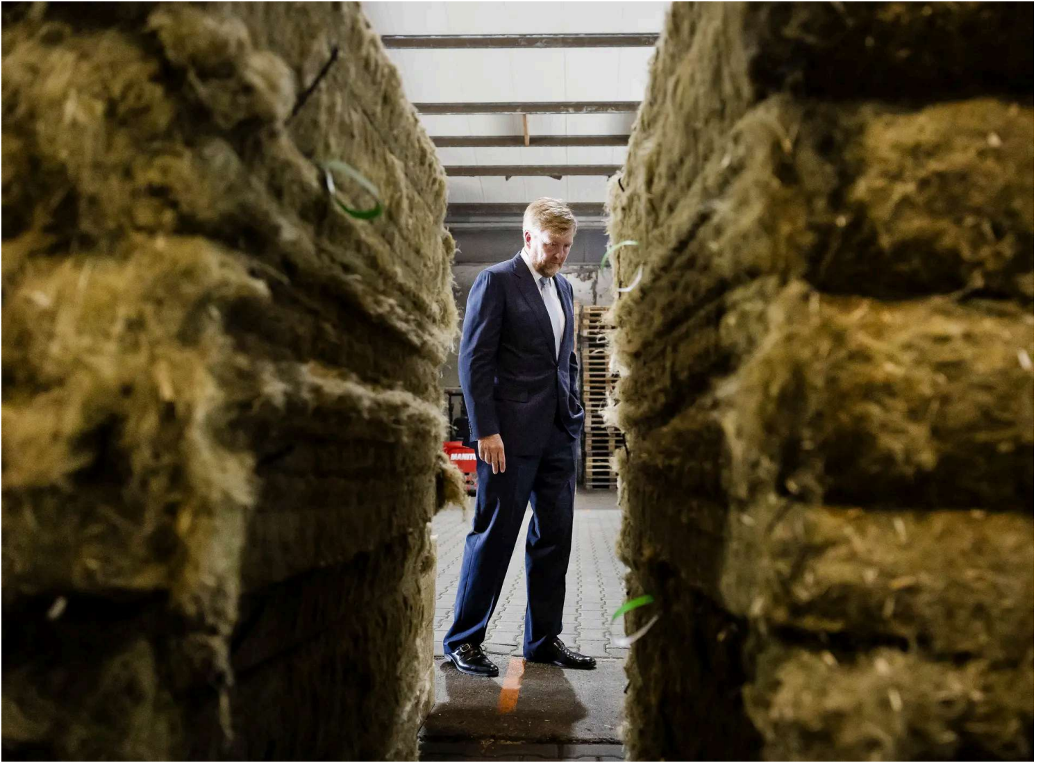
King Willem-Alexander of the Netherlands looks on during a tour of the Dun Agro Hemp Group, which produces hemp products, in the Groningen village of Oude Pekela, on July 2, 2025.