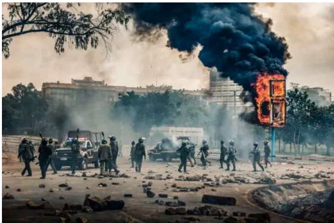
Day in Photos: Protests in Kenya, Astronauts Fly to ISS, and UK's Largest Music Festival