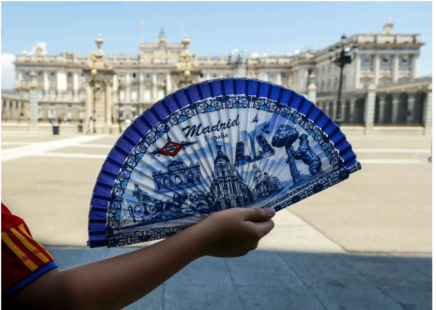
A hand fan offers little relief in front of the Royal Palace during a heatwave in Madrid, on July 2, 2025. The heatwave across Europe this week broke high temperature records, caused the closure of schools, and increased the risk of fire.