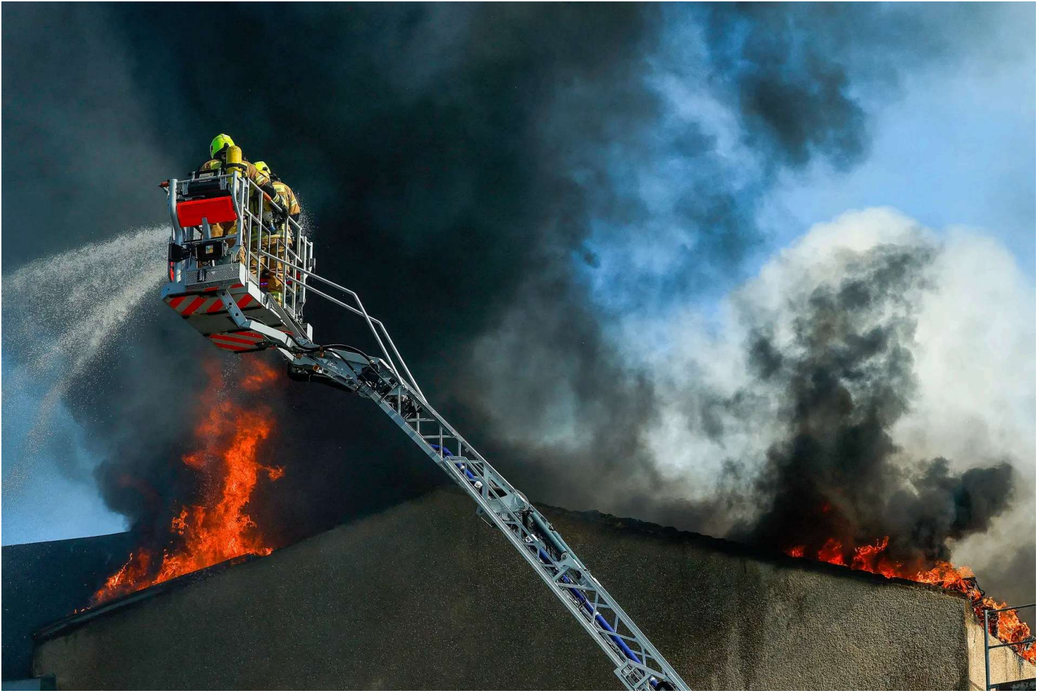
Members of the fire brigade work to extinguish a blaze at an apartment building in Berlin, on July 2, 2025.