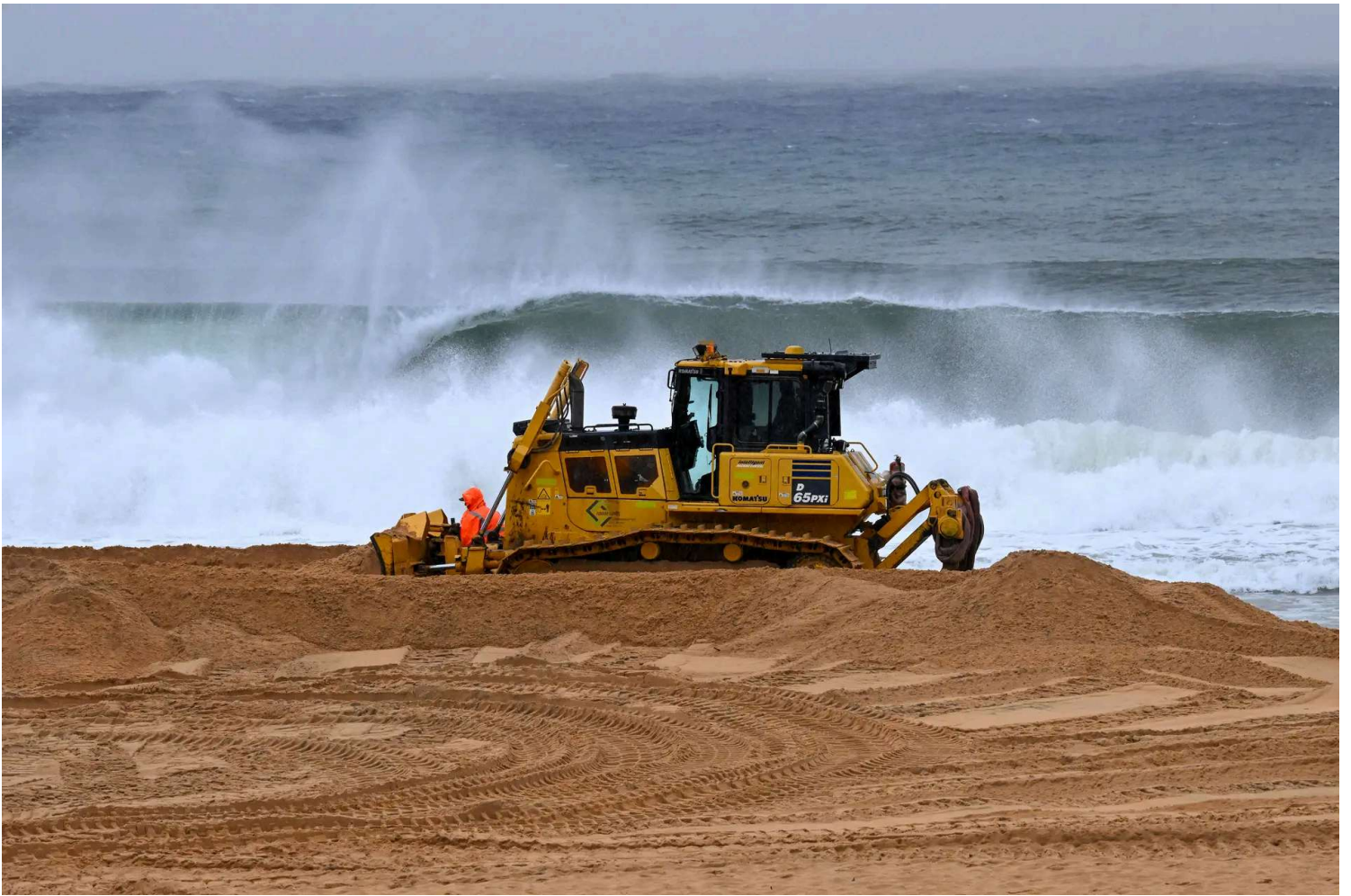
Workers operate heavy machinery to stabilize Wamberal Beach as a low-pressure cyclone lashes the Central Coast, forcing residents to evacuate beachfront homes amid growing erosion fears in Australia, on July 2, 2025.