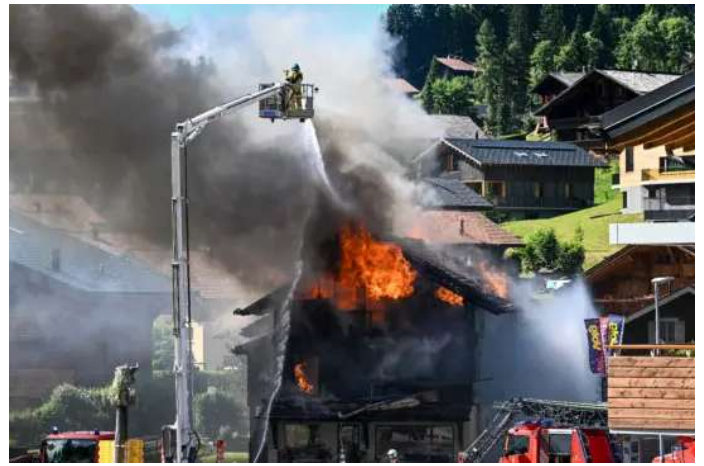
Day in Photos: Fire in Switzerland, Armed Forces Day, and Protests in Thailand