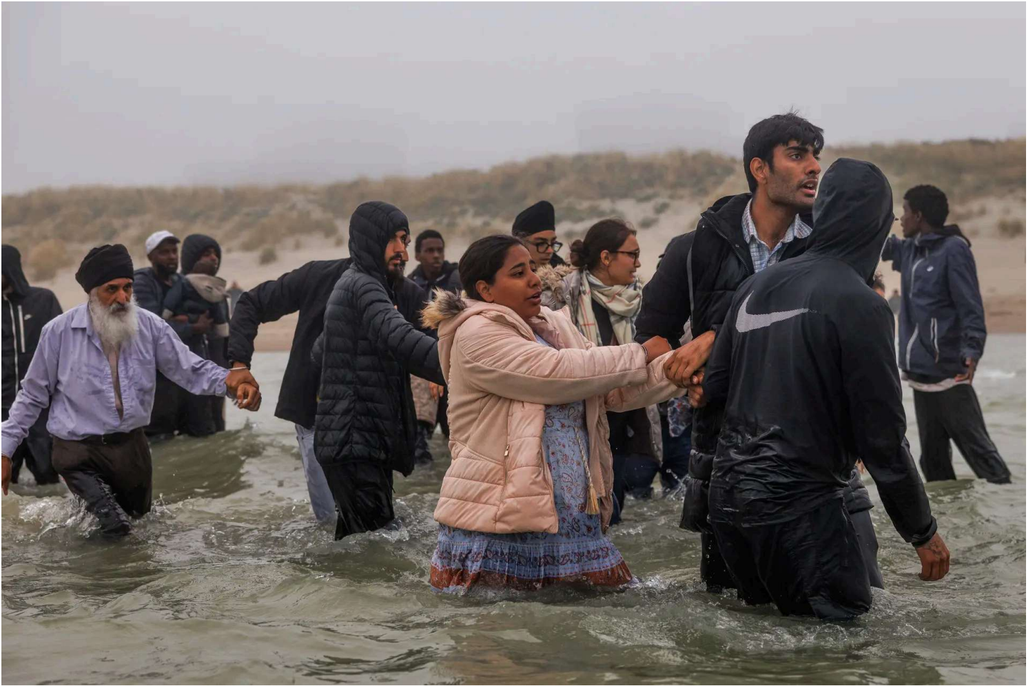
Families are led to a small boat by traffickers in Gravelines, France, on July 02, 2025. Most, including a couple at the center, were unsuccessful in boarding and made their way back to the shore to try on another day.