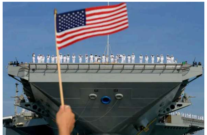
Day in Photos: Aircraft Carrier Departure, NATO Summit, and Olympic Cauldron Returns to Paris