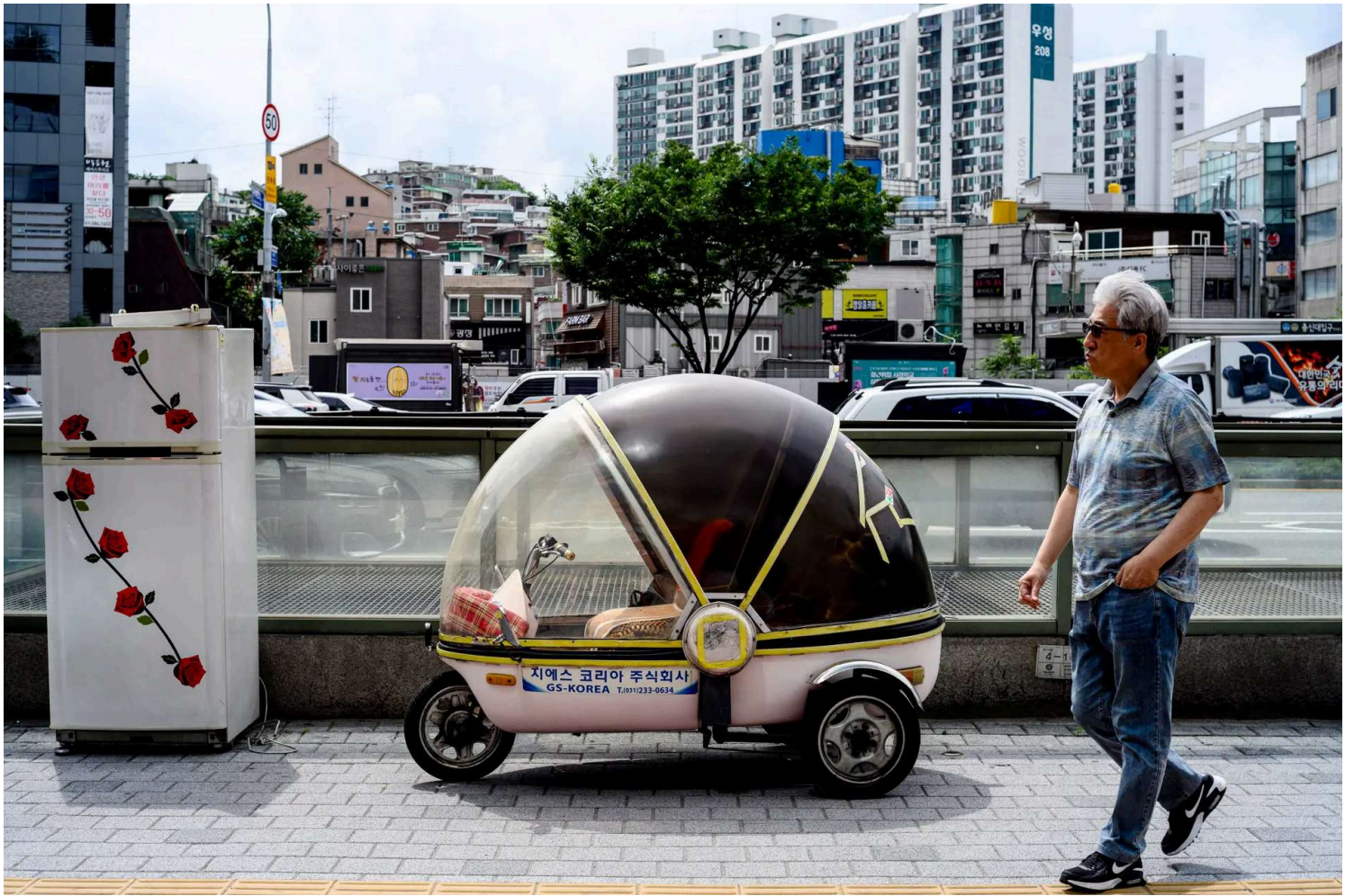
A man walks past a three-wheeled vehicle parked next to a discarded fridge in Seoul, South Korea, on July 2, 2025.