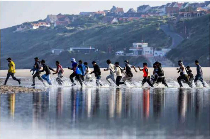
Day in Photos: Migrants Crossing English Channel, Forest Fires in Turkey, and Largest Flower Bloomed