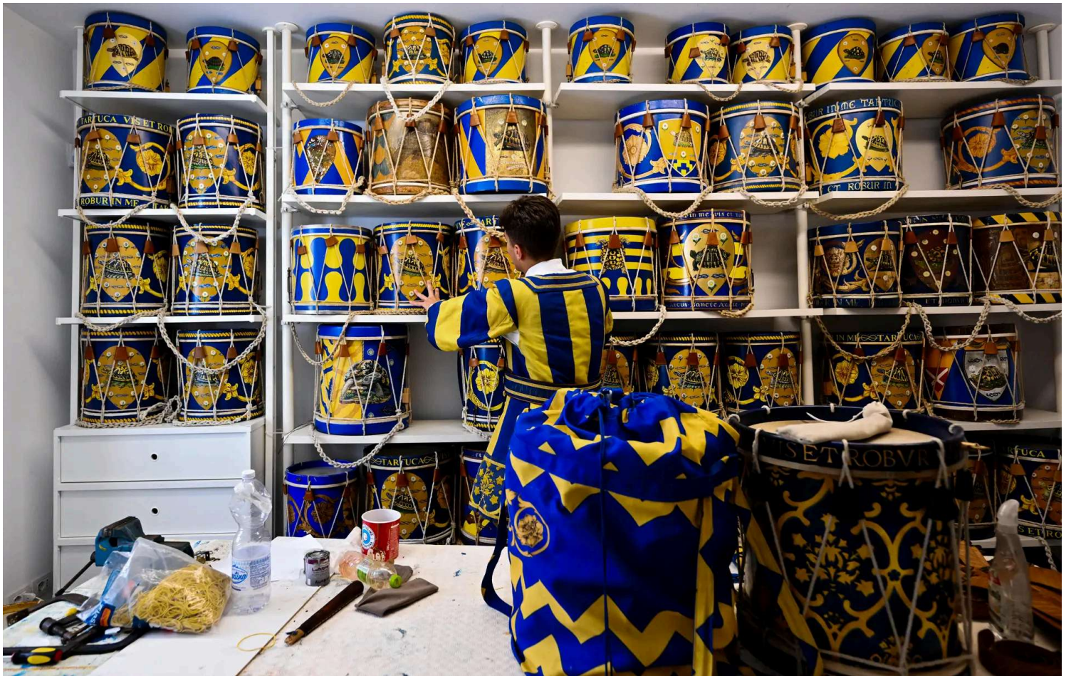
A tamburine of the Tartuca (Turtle) district checks the drums for the parade ahead of the historical Italian horse race "Palio di Siena" in Siena, Tuscany, on July 2, 2025.