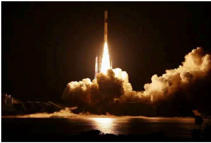
Day in Photos: Rocket Launch, National Paddy Day, and Fifa Club World 2025