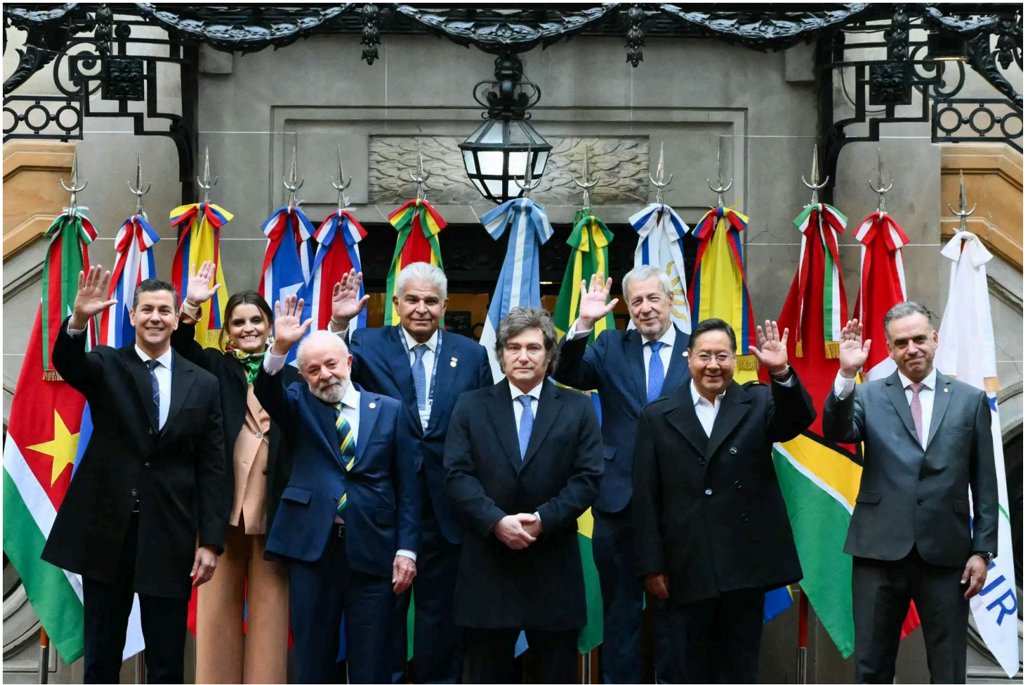
(L to R back) Ecuador's Vice President Maria Jose Pinto, Panama's President Jose Raul Mulino, and Chile's Foreign Minister Alberto van Klaveren; (L to R front) Paraguay's President Santiago Pena, Brazil's President Luiz Inacio Lula da Silva, Argentina's President Javier Milei, Bolivia's President Luis Arce Catacora, and Uruguay's President Yamandu Orsi wave as they pose for a group photo at the 66th Summit of Leaders of Mercosur and Associated States at the San Martin Palace in Buenos Aires, Argentina, on July 3, 2025.