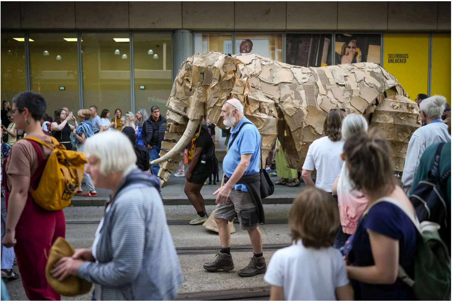
An animal puppet group, 'The Herds', makes its way through Manchester City center, England, on July 3, 2025. 'The Herds' is a touring public art performance of life-size puppet animals designed to call attention to the climate emergency.