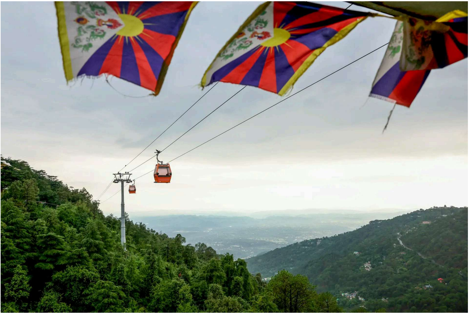
People travel in cable cars on a rainy day in McLeod Ganj, India, on July 3, 2025.

Sign up for the Epoch Opinion newsletter. Our team of Canadian and international thought leaders take you beyond the headlines and trends that shape our world. Sign up with 1-click >>