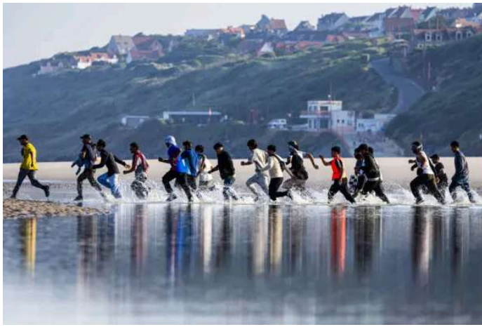
Day in Photos: Migrants Crossing English Channel, Forest Fires in Turkey, and Largest Flower Bloomed