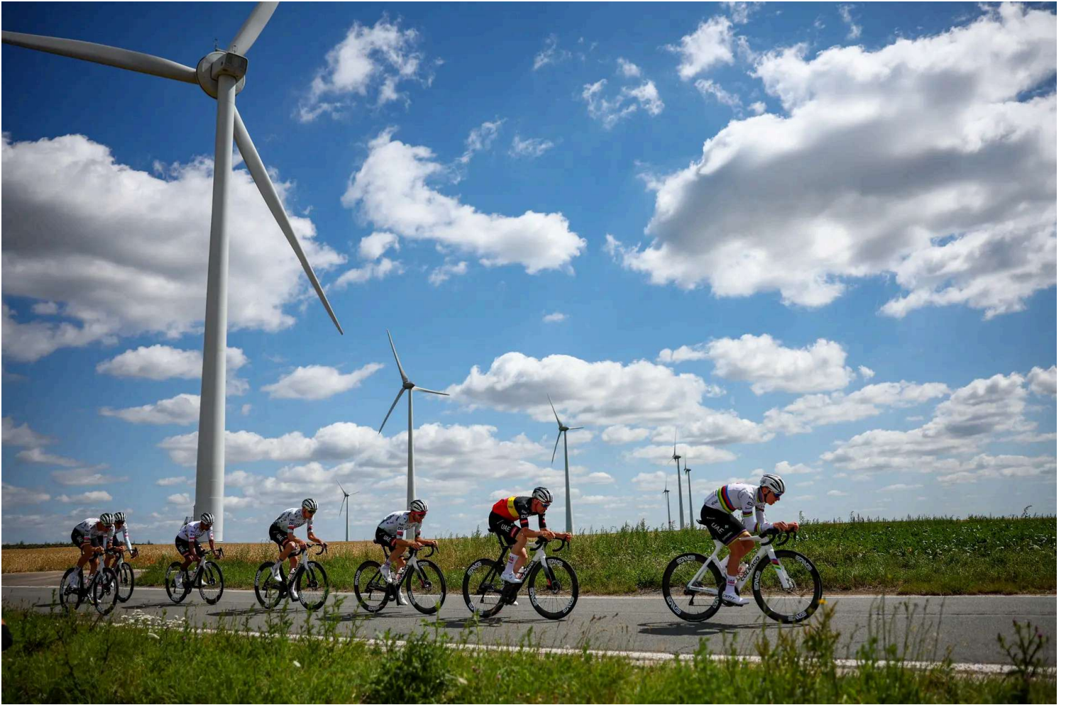
UAE Team Emirate—XRG team's Slovenian rider Tadej Pogacar (R) and other riders cycle in a training session, days before the start of the 112th Tour de France cycling race, near Valenciennes, France, on July 3, 2025.