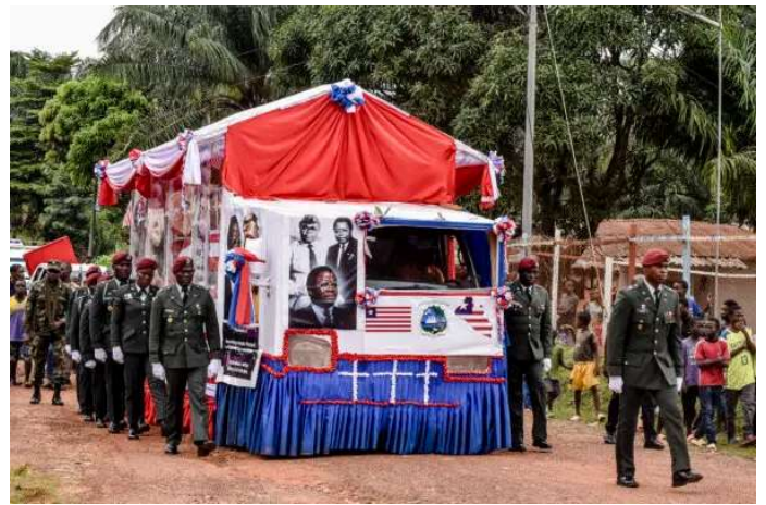
Day in Photos: Liberian President's Funeral, Plane Crash in Chartres, and Nigerian Teachers' Strike