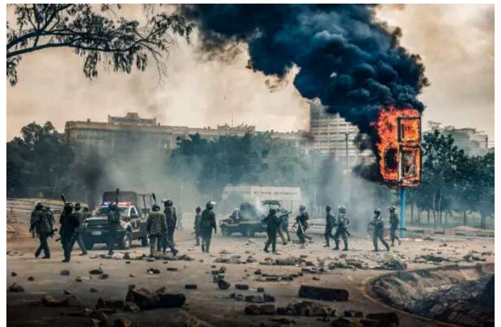
Day in Photos: Protests in Kenya, Astronauts Fly to ISS, and UK's Largest Music Festival