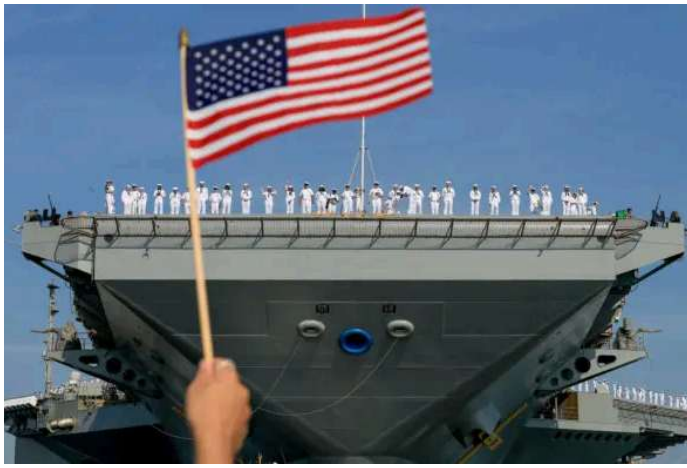
Day in Photos: Aircraft Carrier Departure, NATO Summit, and Olympic Cauldron Returns to Paris