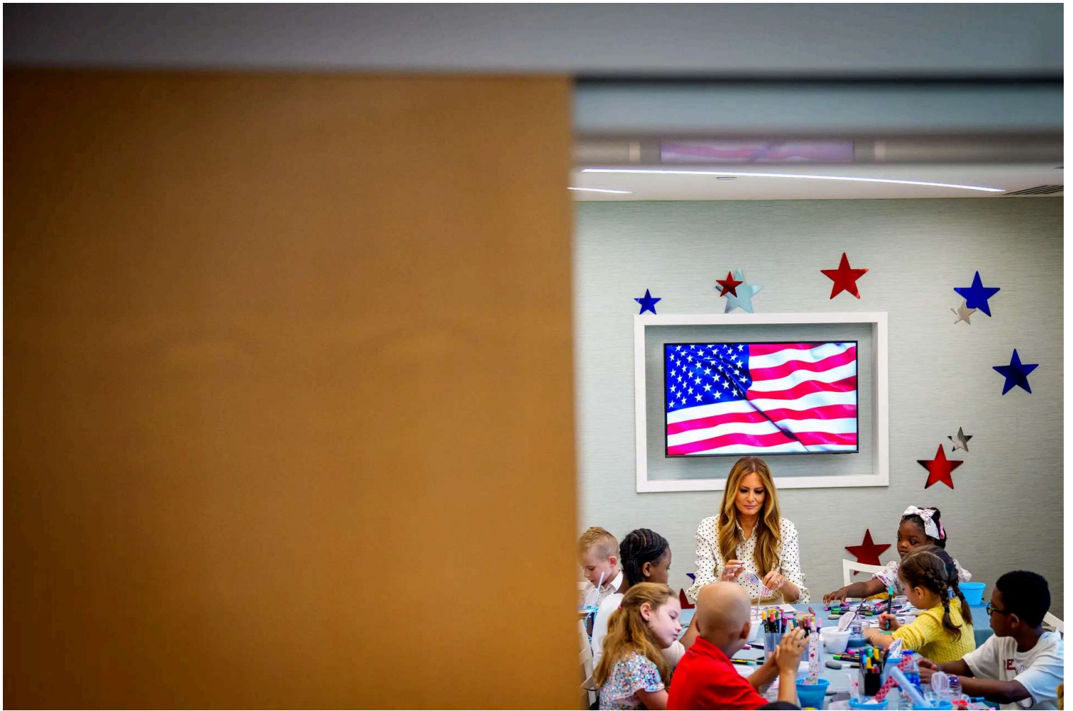
First Lady Melania Trump visits with children at Children's National Hospital in Washington on July 3, 2025. The day before the July 4th holiday, the first lady visited the hospital to greet patients, participate in arts and crafts, oversee a hybrid tea rose bush from the White House being planted in the hospital's Bunny Mellon Healing Garden, and spend time with a 3-month-old transplant patient and his family.