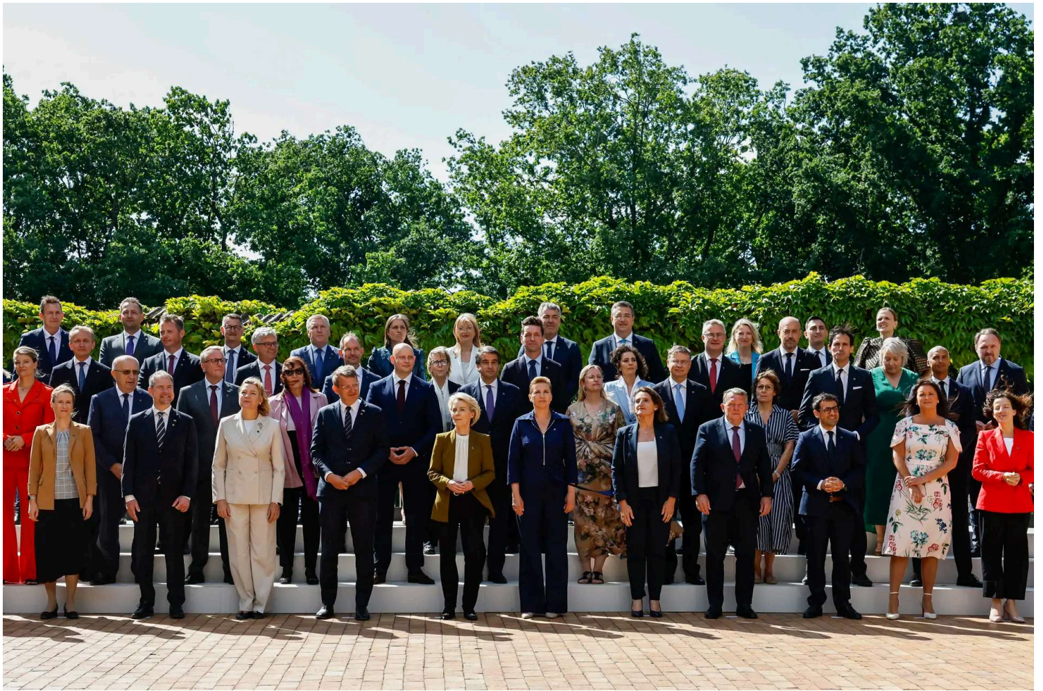
Denmark's Prime Minister Mette Frederiksen (first row, center R), European Commission President Ursula von der Leyen (first row, center L) and ministers pose for a group photo during the official opening of Denmark's EU presidency in Aarhus, on July 3, 2025, as Denmark takes over the European Union's rotating presidency.