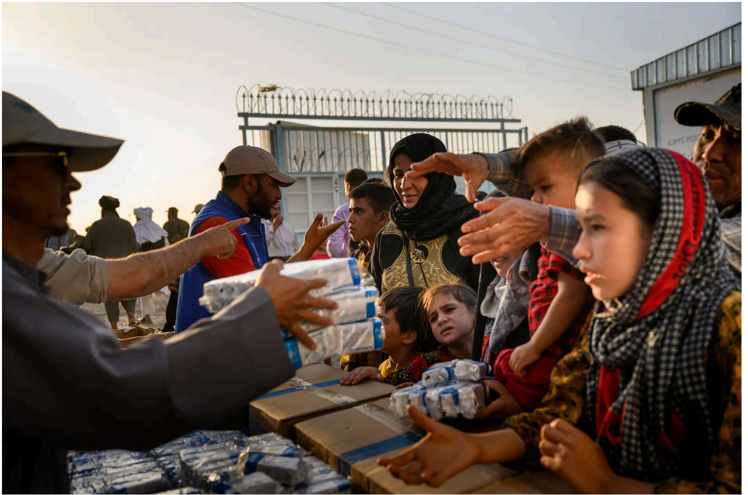
Local NGO workers working with the World Food Programme distribute high-energy biscuits to returnees at the Iranian border in Islam Qala, Afghanistan, on July 2, 2025. More than 256,000 Afghans left Iran for Afghanistan last month, according to the UN's International Organization for Migration, ahead of a July 6 deadline imposed by the Iranian government for all undocumented Afghans to leave the country.