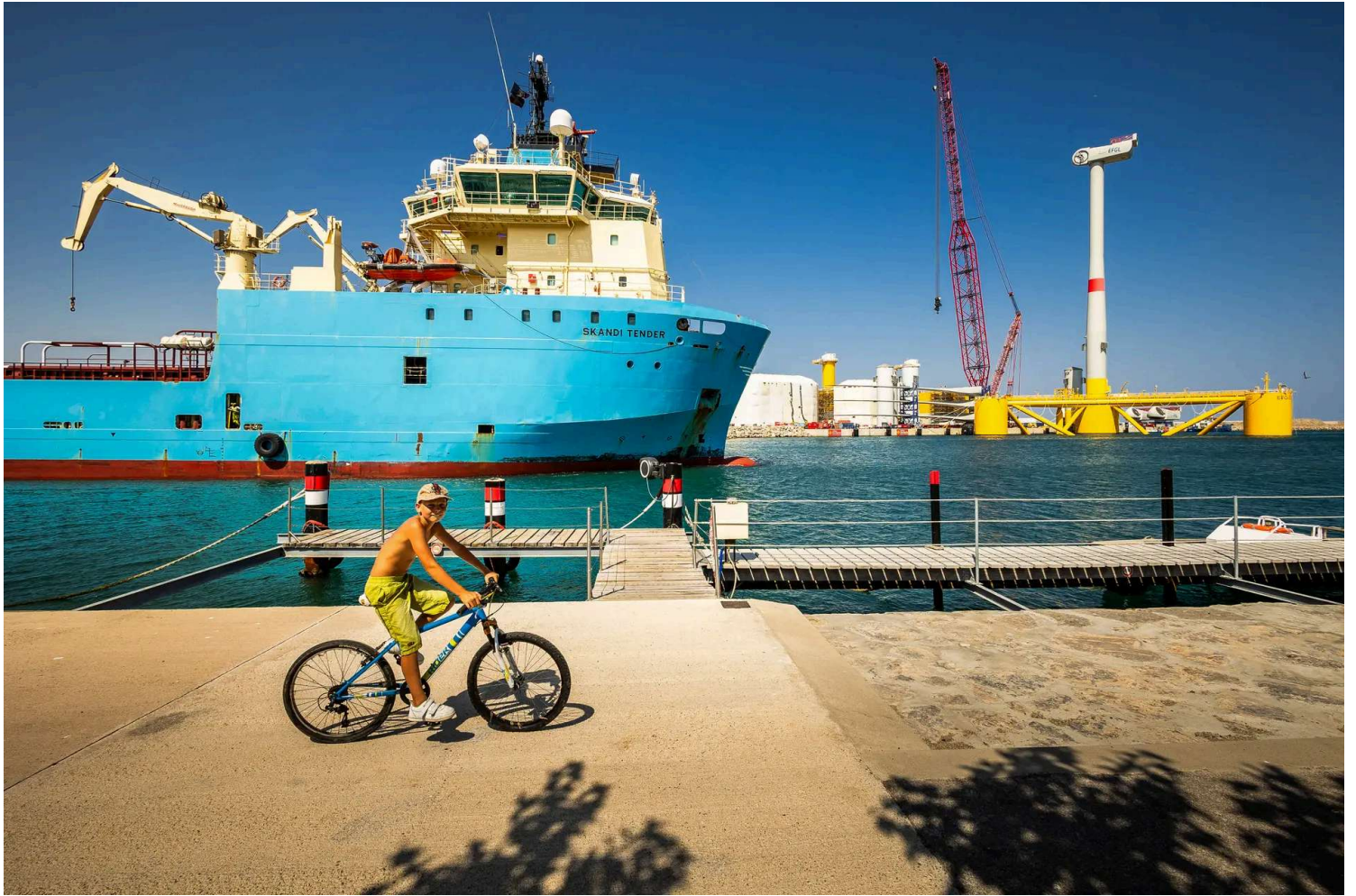
A view of the wind turbine assembly site shows a young man on his bicycle and a supply ship or offshore tug from the Port-la-Nouvelle in the Aude department in southern France, on July 3, 2025. The Occitanie region has ordered six floating 328-foot-high wind turbines to be located 10 miles off the coast of the Mediterranean Sea to generate renewable electricity.