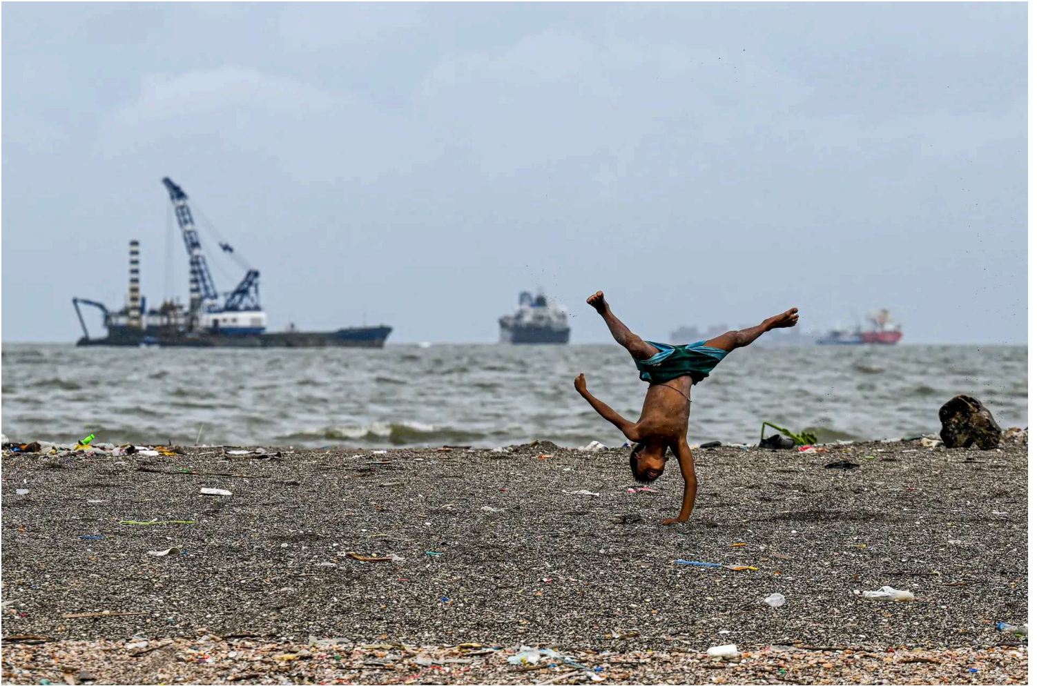
A child plays along Manila Bay, Philippines, on July 3, 2025.