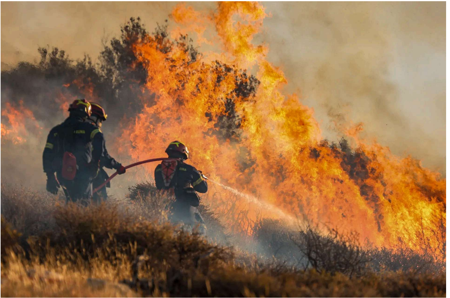
Firefighters battle a wildfire that broke out in Ierapetra on the southern Greek island of Crete, on July 3, 2025. A forest fire fanned by gale-force winds led to the evacuation of locals and tourists on the popular holiday island, officials said.