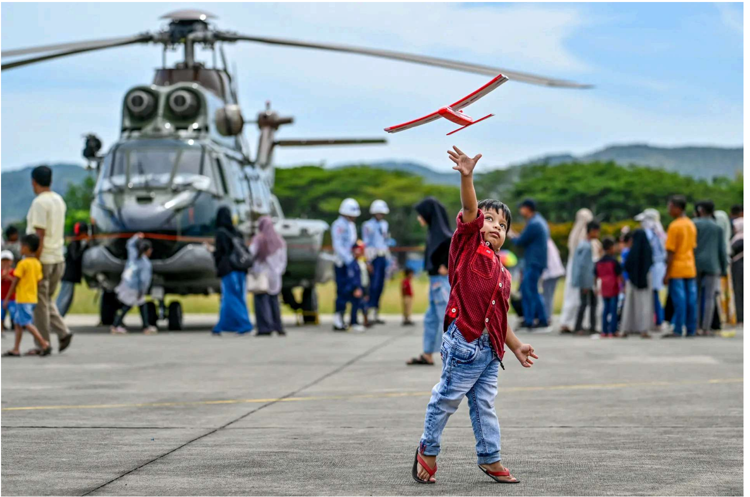
A child plays with an airplane kite during an air base open day following a military exercise held at the Sultan Iskandar Muda Air Force Base in Blang Bintang, Aceh Province, Indonesia, on July 3, 2025.