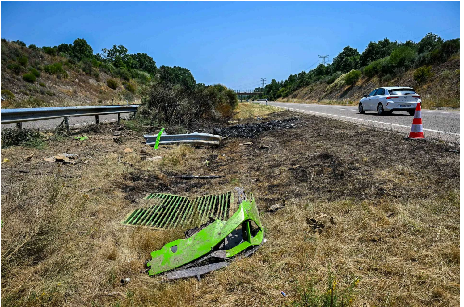
A view of the crash site where Liverpool FC player Diogo Jota and his brother André Silva lost their lives just after midnight on Thursday shows the wreckage of their Lamborghini Huracan at kilometre 65 of the A-52, near the town of Cernadilla, close to Zamora, Spain, on July 3, 2025. Spanish authorities said the vehicle left the road and caught fire upon impact, killing both occupants.