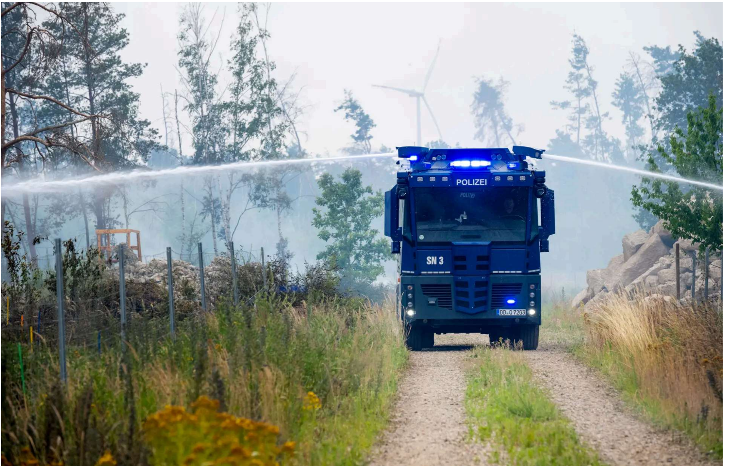
A police water cannon is used to fight a wildfire in a forest at Gohrischheide near Zeithain, Germany, on July 3, 2025. Record-breaking high temperatures accelerated the spread of the fire yesterday to almost 500 acres.