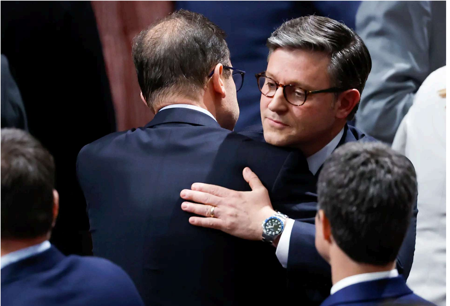
Speaker of the House Mike Johnson (R-La.) hugs a colleague as the House of Representatives meets to vote on H.R. 1, the One Big Beautiful Bill Act, in the House of Representatives at the U.S. Capitol on July 3, 2025.