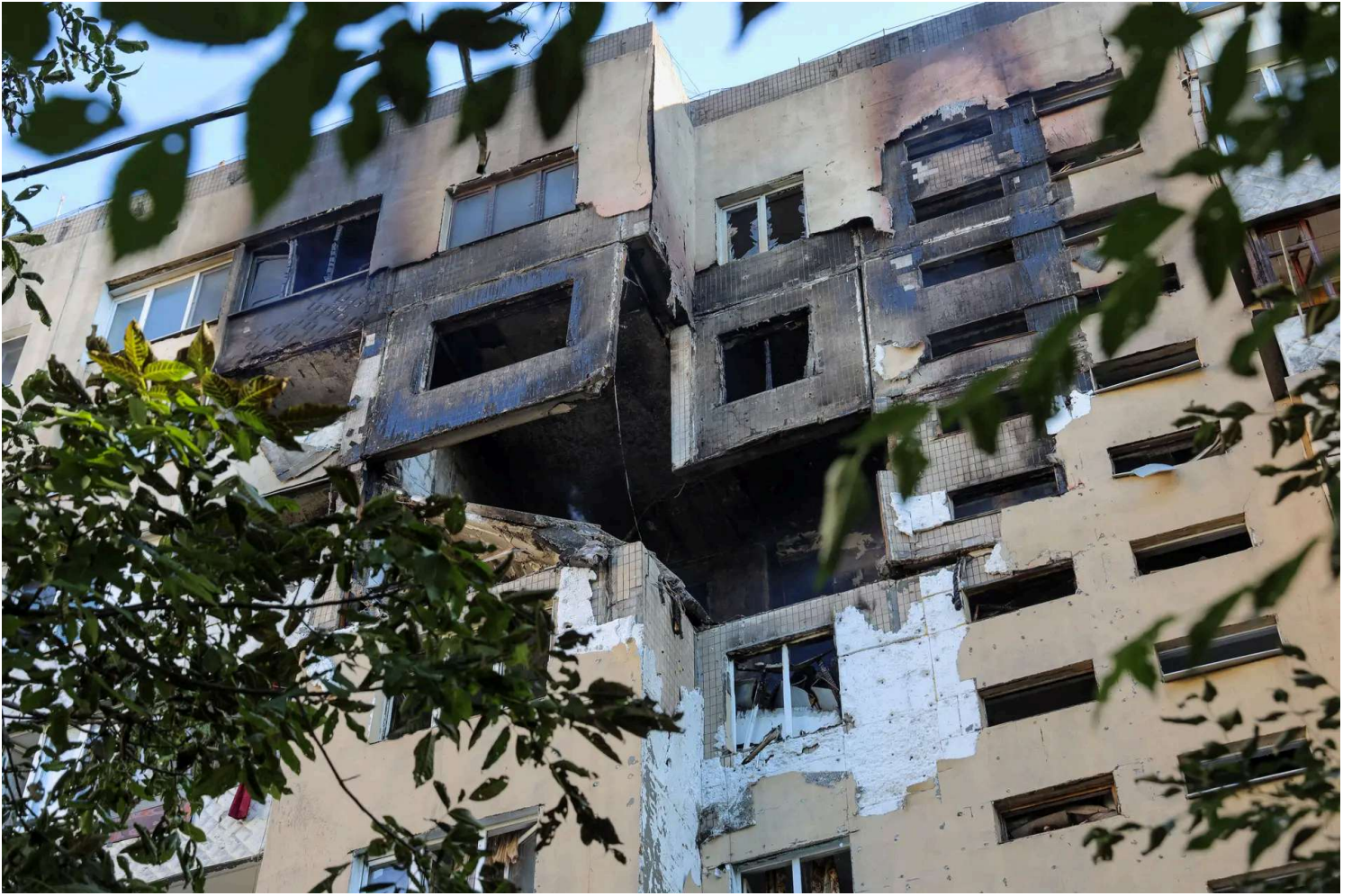
A multi-story residential building is shown after a Russian strike in Odesa, Ukraine, on July 3, 2025.