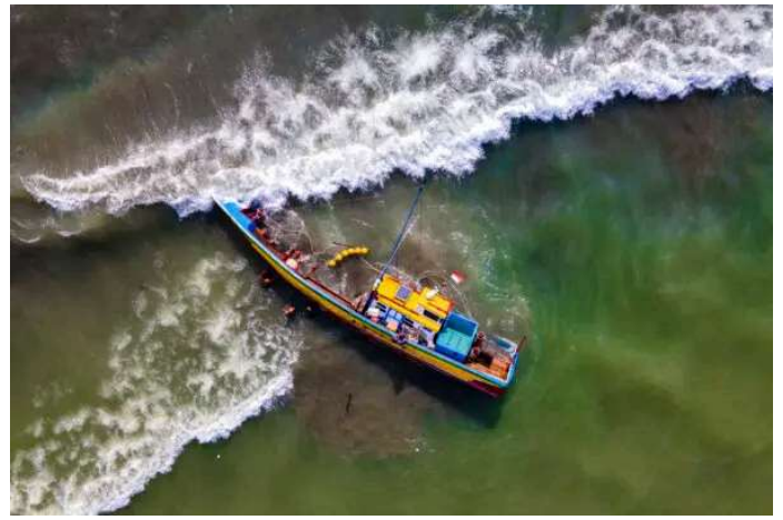
Day in Photos: Ship Capsizes in Indonesia, Forest Fires in Greece, Amazon Launches Satellites

Copyright © 2000 - 2025 The Epoch Times Association Inc. All Rights Reserved.