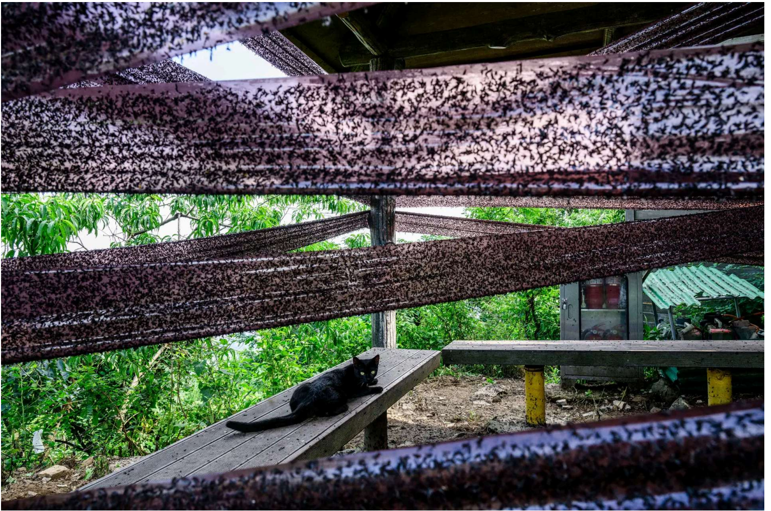
A black cat rests among sticky traps used to catch lovebugs at Mount Gyeyang summit in Incheon, South Korea, on July 3, 2025.