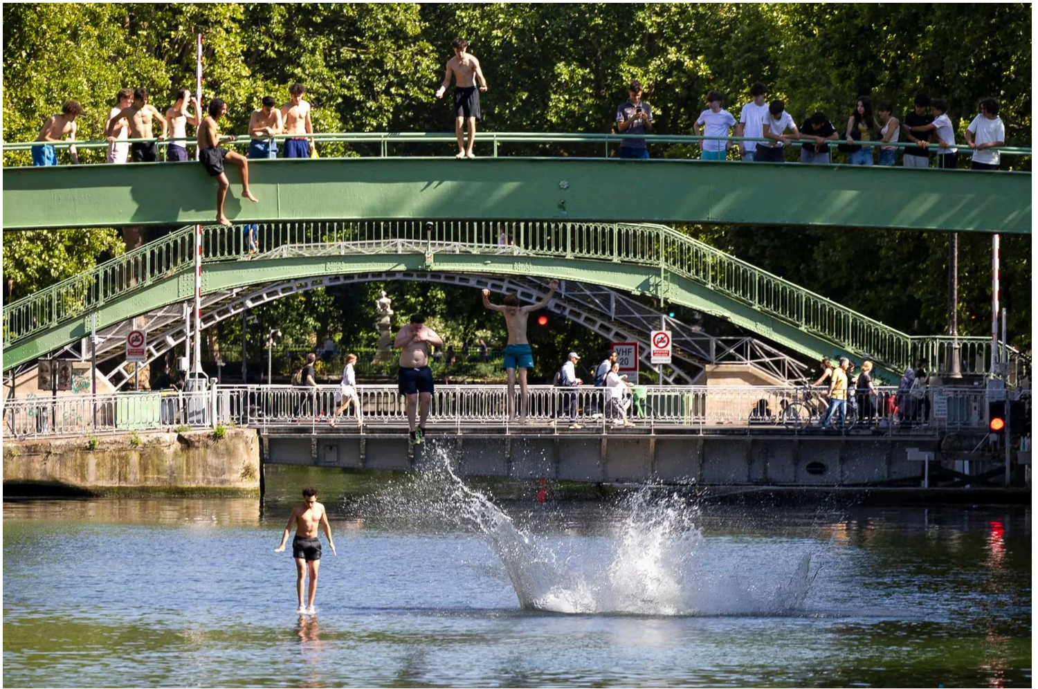
People dive from a bridge over the Canal Saint-Martin in Paris, on July 3, 2025.