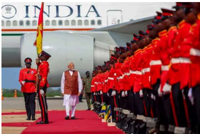
Day in Photos: Narendra Modi Visits Ghana, SpaceX to Build Antennas in Switzerland, and Yellow-Eyed Penguins