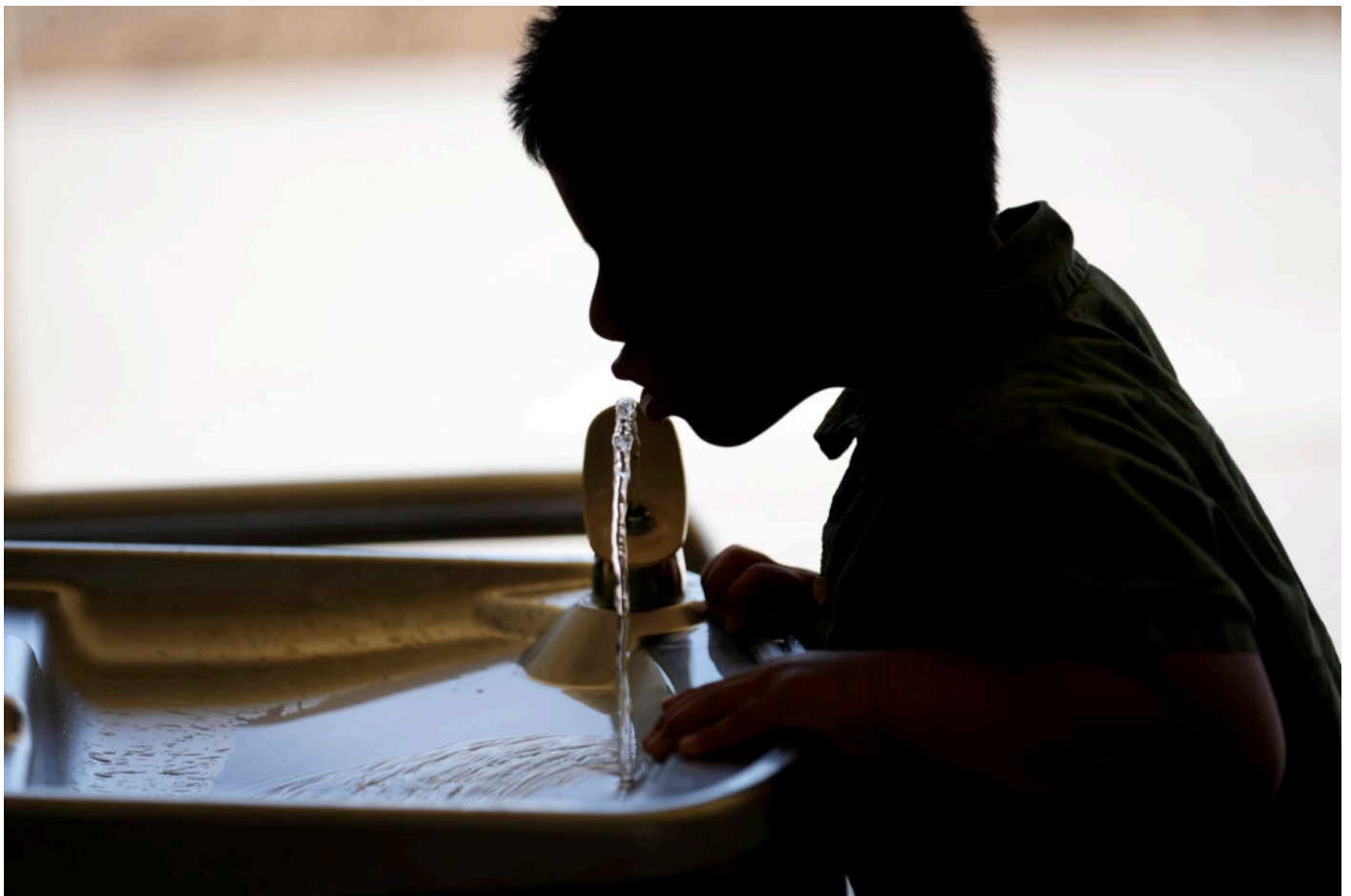
A student drinks from a water fountain at an elementary school in California on Sept. 20, 2023.