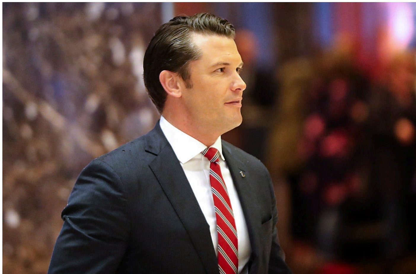
Fox News contributor Pete Hegseth arrives at Trump Tower in New York City on Nov. 29, 2016.