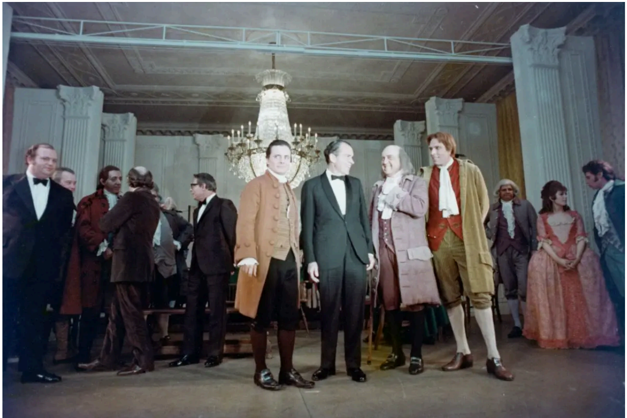
President Richard Nixon with the cast of "1776," after a performance in the East Room of the White House.

We should be using the arts to offer a counterargument to the art we are seeing, putting our values out there in the “arena of contention” and demanding that they be considered. We can't even begin to deliberate on more traditional points of view if they're not presented.