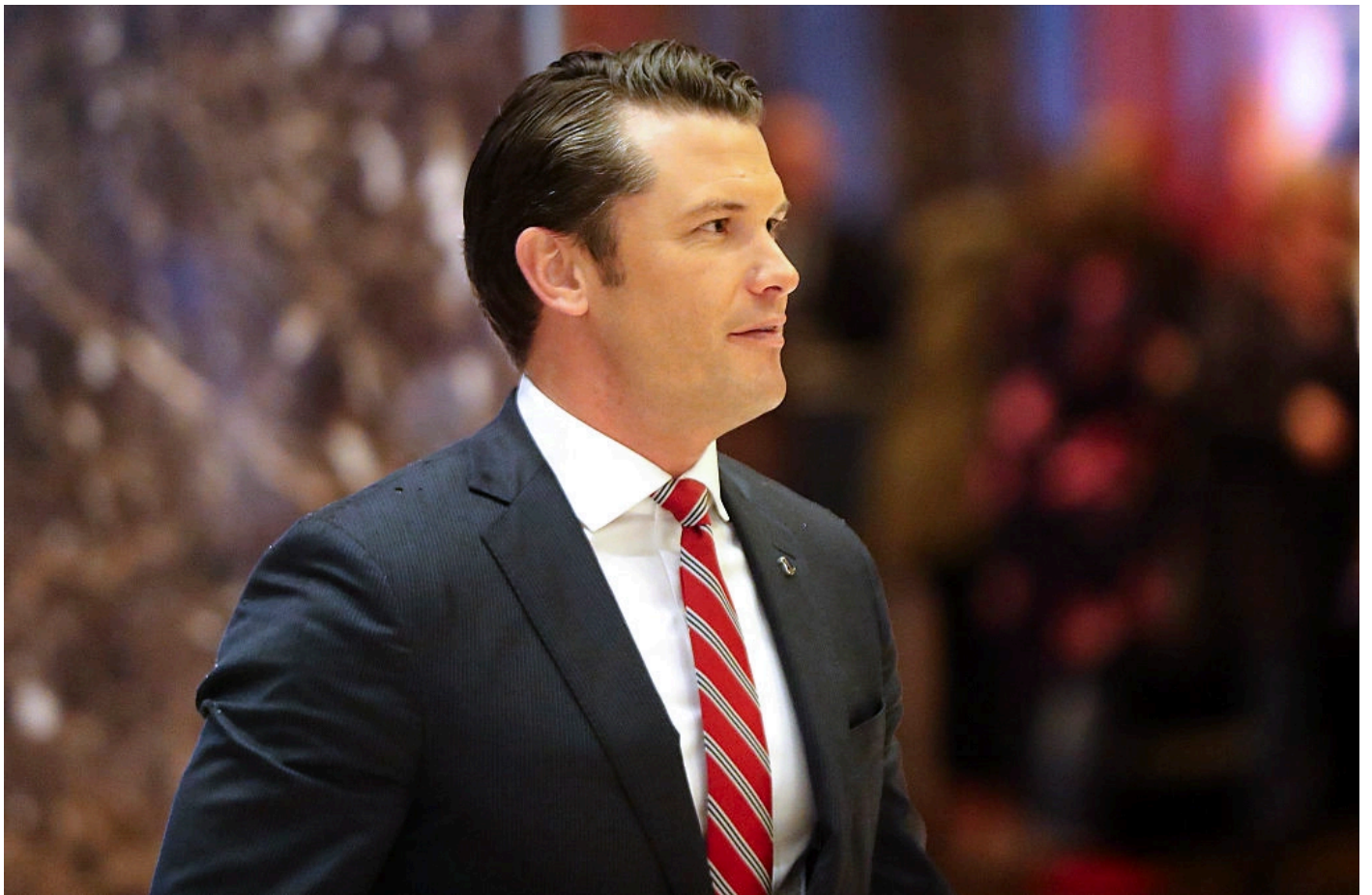
Fox News contributor Pete Hegseth arrives at Trump Tower in New York City on Nov. 29, 2016.