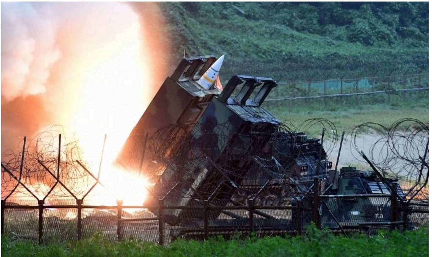
U.S. Army Tactical Missile System (ATACMS) fires a missile into the East Sea during a South Korea-U.S. joint missile drill aimed to counter North Korea's ICBM test, in East Coast, South Korea, on July 29, 2017.