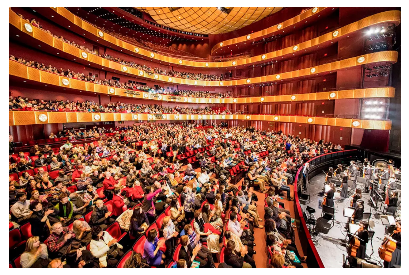
The curtain call for Shen Yun Performing Arts at the David H. Koch Theater at Lincoln Center in New York on Jan 11, 2015.