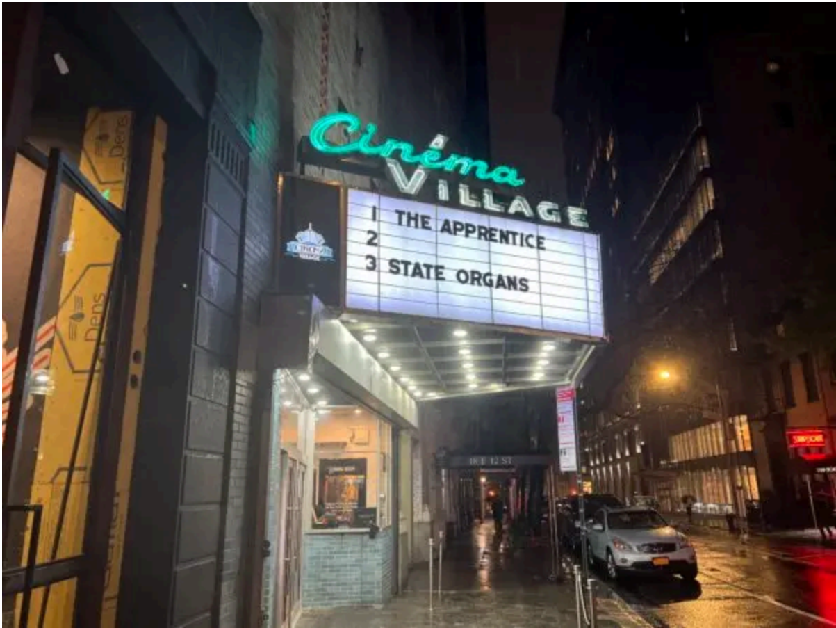
Cinema Village in New York City on Nov. 21, 2024.