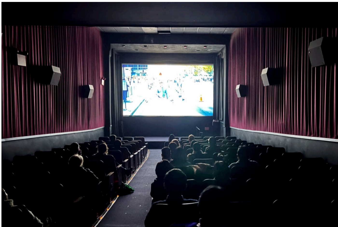
Cinema Village holds a screening of the documentary “State Organs” in New York City on Nov. 21, 2024.