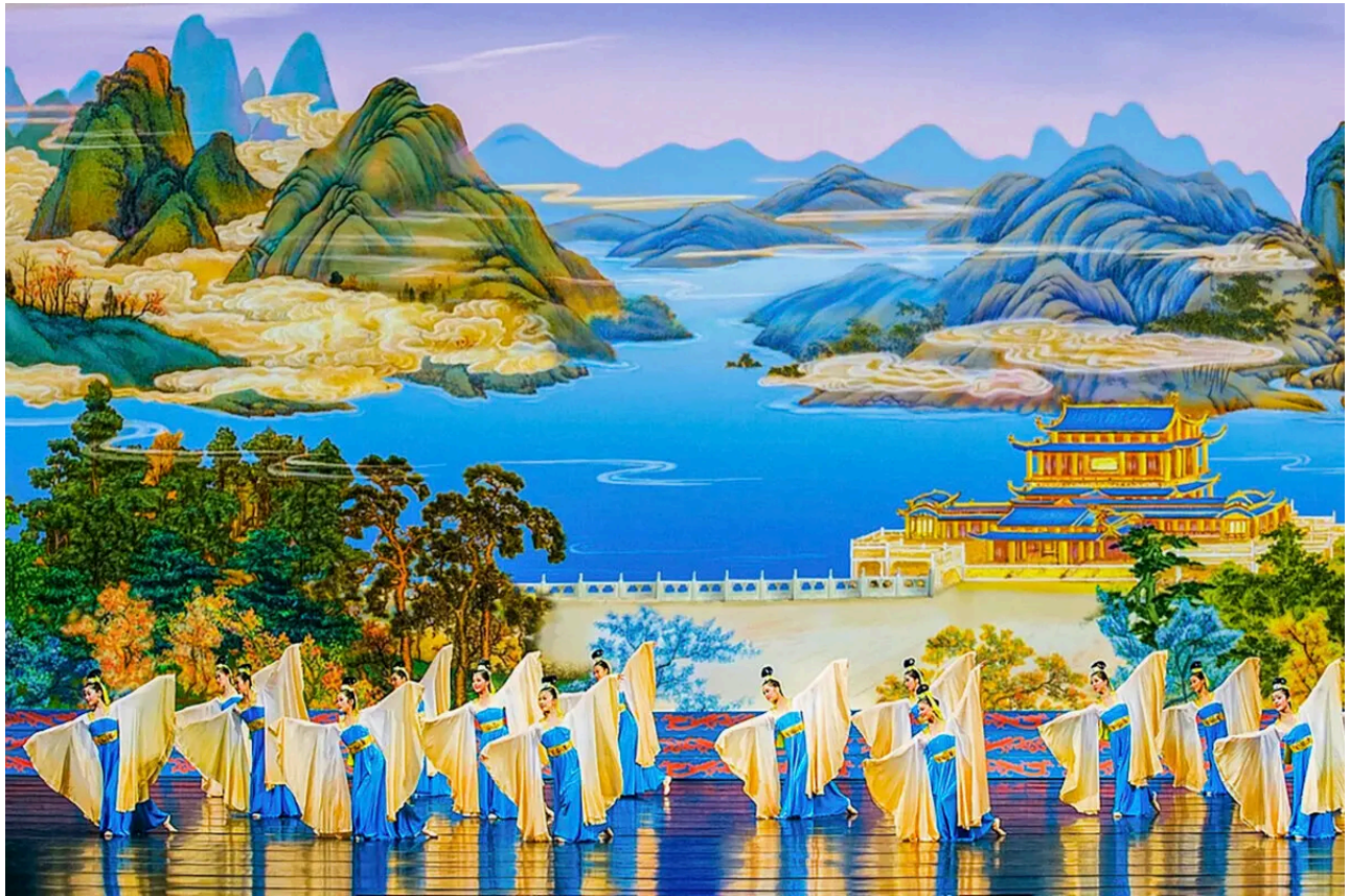
The performance, "Flowing Sleeves," from the 2009 Shen Yun Performing Arts program. Shen Yun Performing Arts