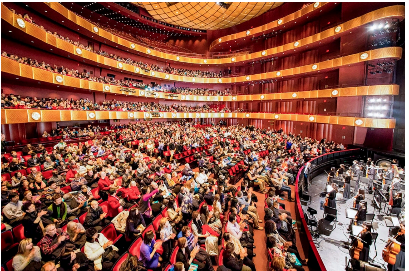
The curtain call for Shen Yun Performing Arts at the David H. Koch Theater at Lincoln Center in New York on Jan 11, 2015.