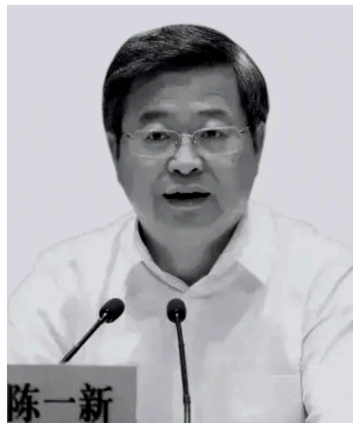
Chen Yixin, the head of China's Ministry of State Security, has been identified by a whistleblower as the orchestrator

After failing with several of his domestic initiatives, Chen turned to the Falun Gong campaign as a source of political capital, according to the whistleblower.