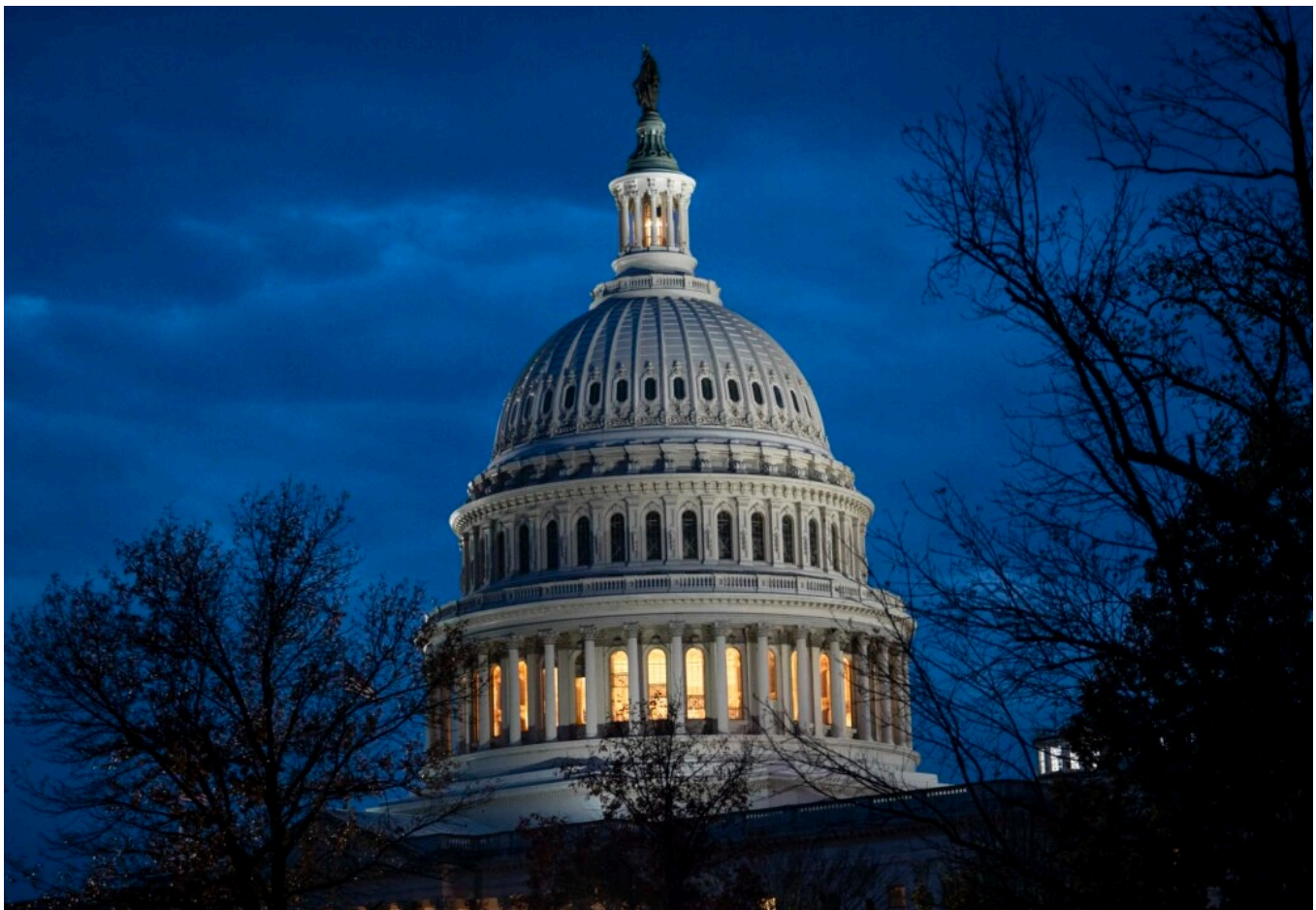
The U.S. Capitol at dusk on Nov. 19, 2024.