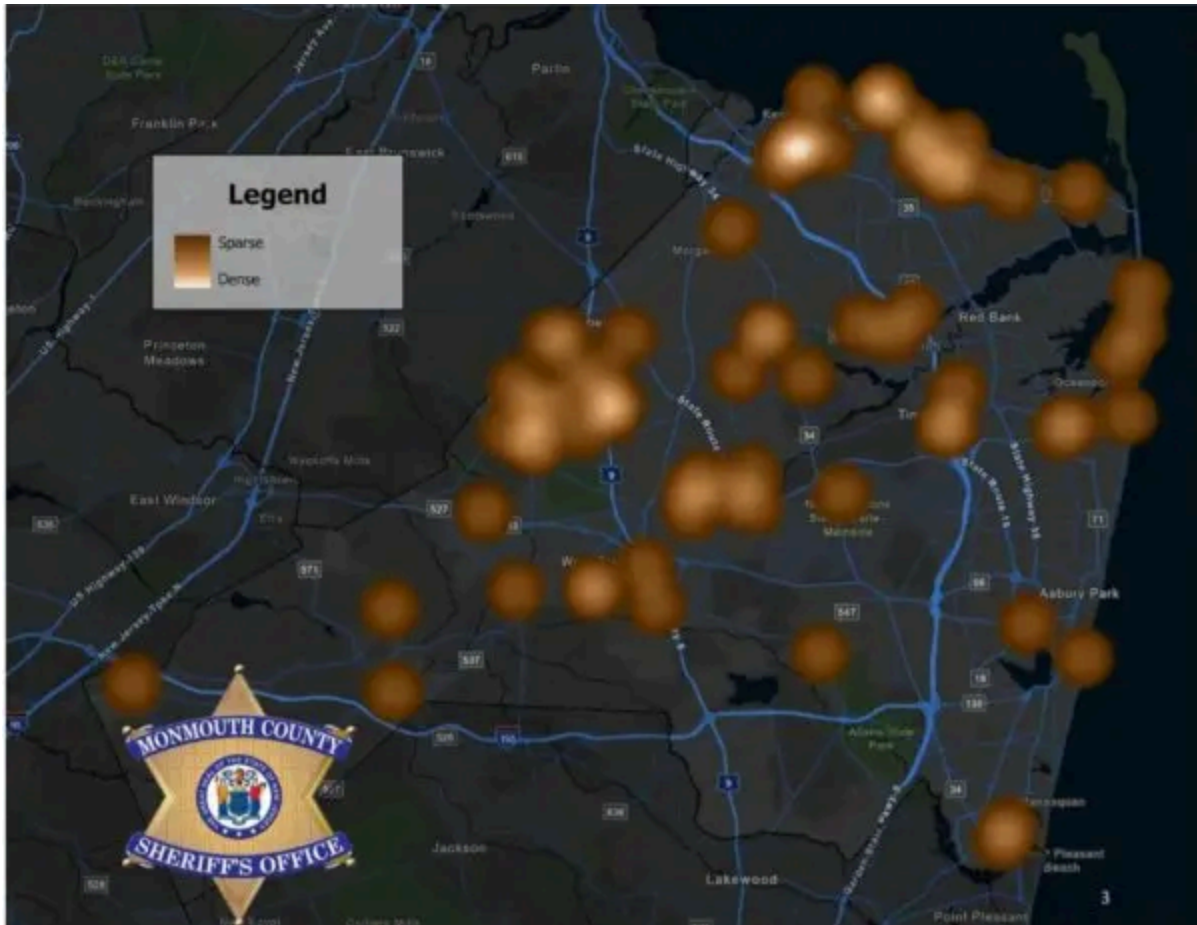
A map of drone sightings across Monmouth County, New Jersey.