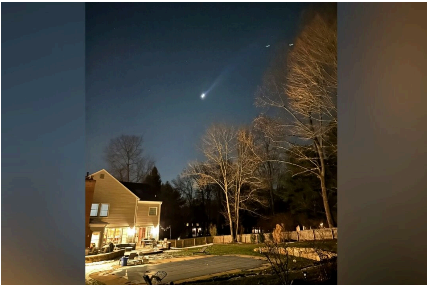
Multiple drones are seen over Bernardsville, N.J., on Dec. 5, 2024