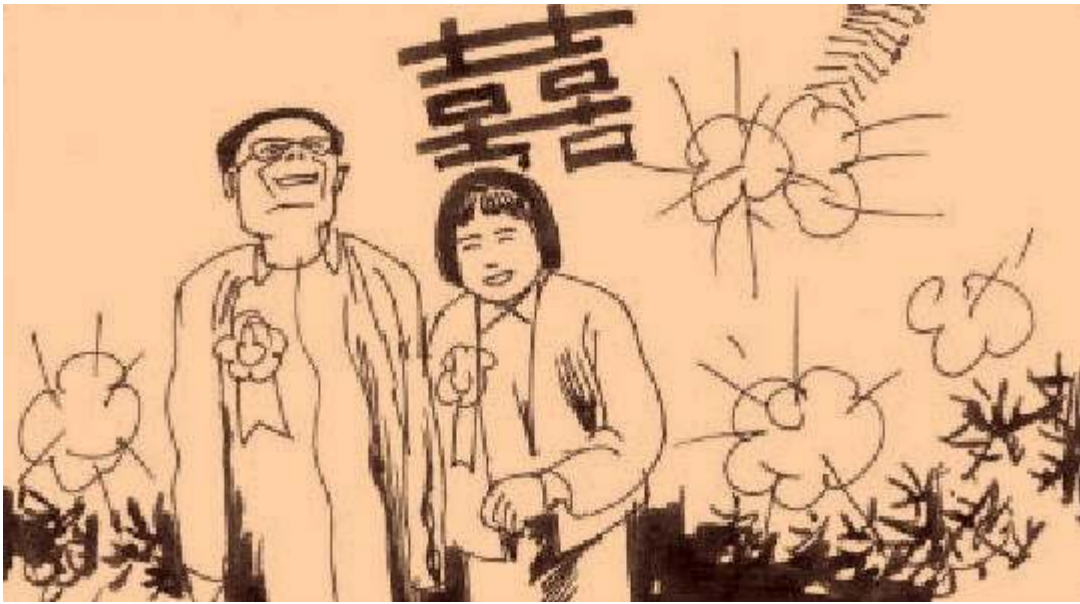
In December of 1949, Jiang Ze-min swiftly married Wang Ye-ping.