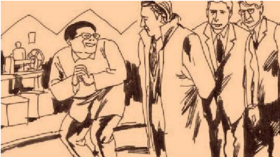
In 1956, soon after Jiang Ze-min returned to Changchun from the Soviet Union, his wife, Wang Ye-pin, and their two young sons moved from Shanghai to Changchun. He first became the head of the department, and then was promoted to deputy director and concurrently the party branch secretary. In terms of technical skills, his colleagues knew that he wasn't good at his job. Jiang Ze-min's forte was not so much resolving technical problems, as accompanying delegations visiting the plant.