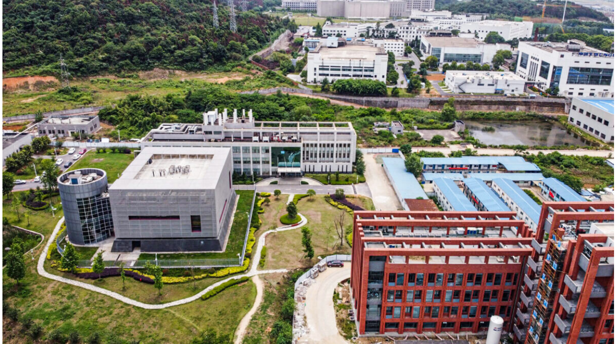
The P4 laboratory on the campus of the Wuhan Institute of Virology in Wuhan, Hubei Province, China, on May 13, 2020.

It cannot be repeated too many times that China is a closed society. The CCP tightly controls all information, particularly anything that may be damaging or embarrassing to the regime.