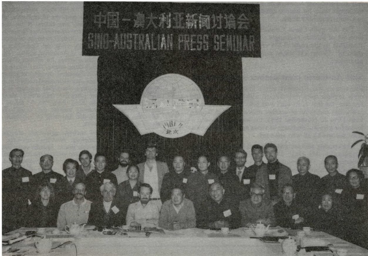
Australian and Chinese participants at the press seminar in Beijing.

first trip to China over forty years ago, when I ran a conference between Australian and Chinese journalists in November 1981.