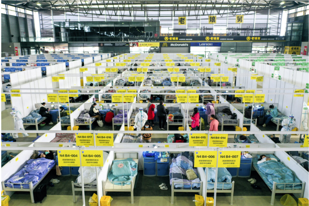
People with mild and symptomatic cases of COVID-19 are quarantined at the Shanghai New International Expo Center in Shanghai, China, on April 1, 2022.

Despite wielding all of its tyrannical power to crack down in an ostensible bid to reduce the virus's effect on society, has the CCP still exhibited malfeasance in protecting Shanghai's most vulnerable citizens?