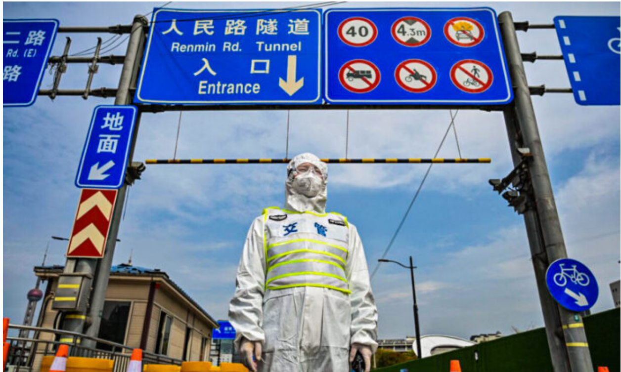
A transit officer, wearing protective gear, controls access to a tunnel in the direction of Shanghai's Pudong district in lockdown on March 28, 2022.