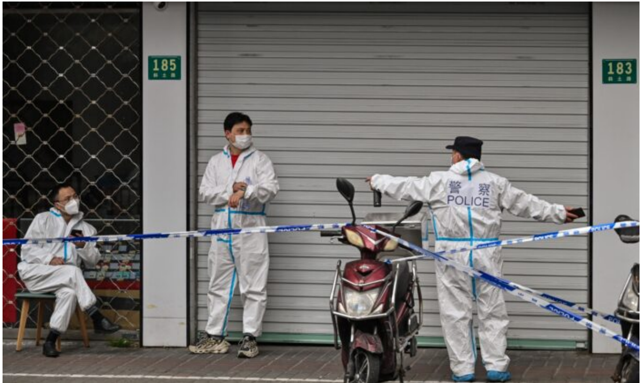
Police and workers in protective gear next to some lockdown areas after the detection of new cases of COVID-19 in Shanghai on March 14, 2022.