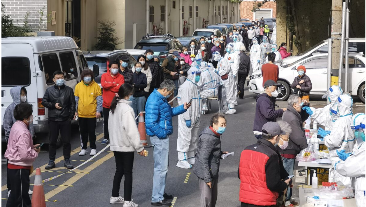
People line up for nucleic acid testing at a residential block during a citywide COVID-19 testing campaign in Shanghai, China, on April 1, 2022.

Shanghai is the latest case study in this hypochondriac-engineering societal schemata. With cases spiking at over 13,000 on April 5, the city has chosen to extend lockdowns that were scheduled to end on April 8. Testing in Shanghai is mandatory for all of its 25 million residents. This major metropolitan area accounts for over two-thirds of China's total cases.