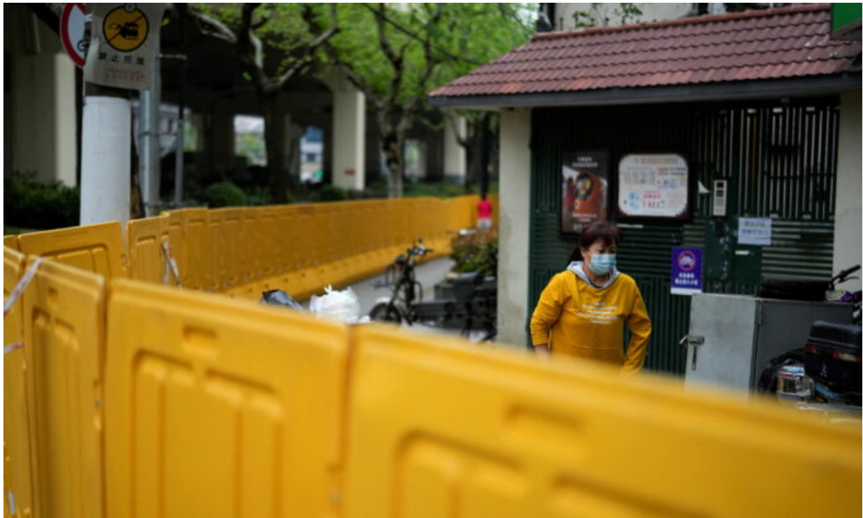
A resident behind barriers sealing off an area under lockdown in Shanghai on April 14, 2022.