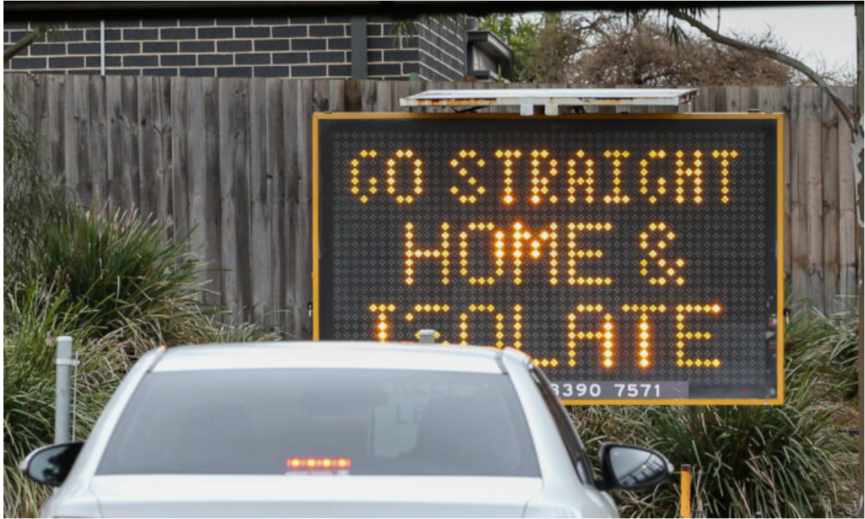
A sign reading 'Go straight home and Isolate' in Australia.