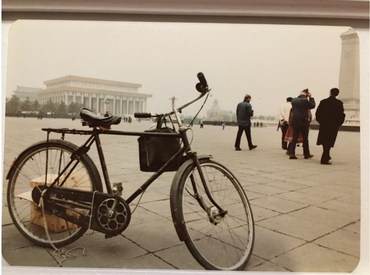
Figure 2: The Australian journalists stroll through Tiananmen Square in November 1981.