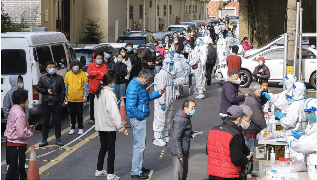
People line up for nucleic acid testing at a residential block during a citywide COVID-19 testing campaign in Shanghai, China, on April 1, 2022.

Note that the CCP tacitly acknowledged that the “zero-COVID” policy had to be renamed to account for the increasing number of cases detected. The recent outbreaks made “zero COVID” into an oxymoron.