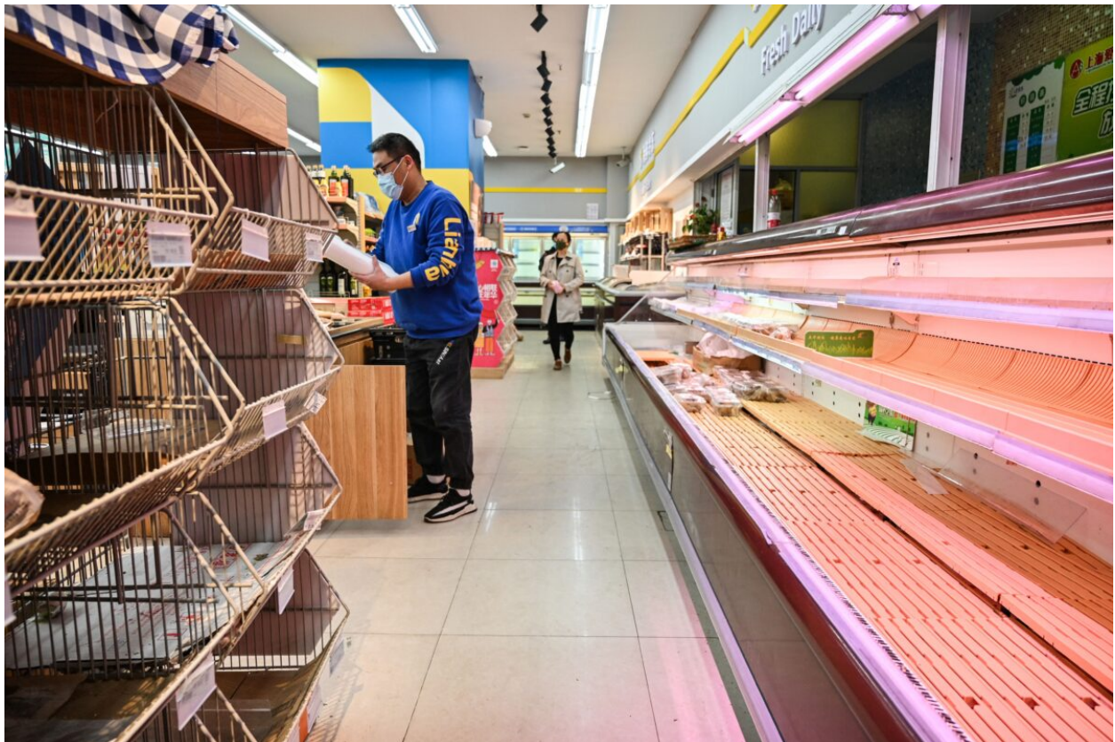
Shoppers rummage through empty shelves in a supermarket before a lockdown as a

Factories are also closed as manufacturing and industry take a severe hit. The impact on the global supply chain is something that even those in the United States and Europe are learning to understand all too well.