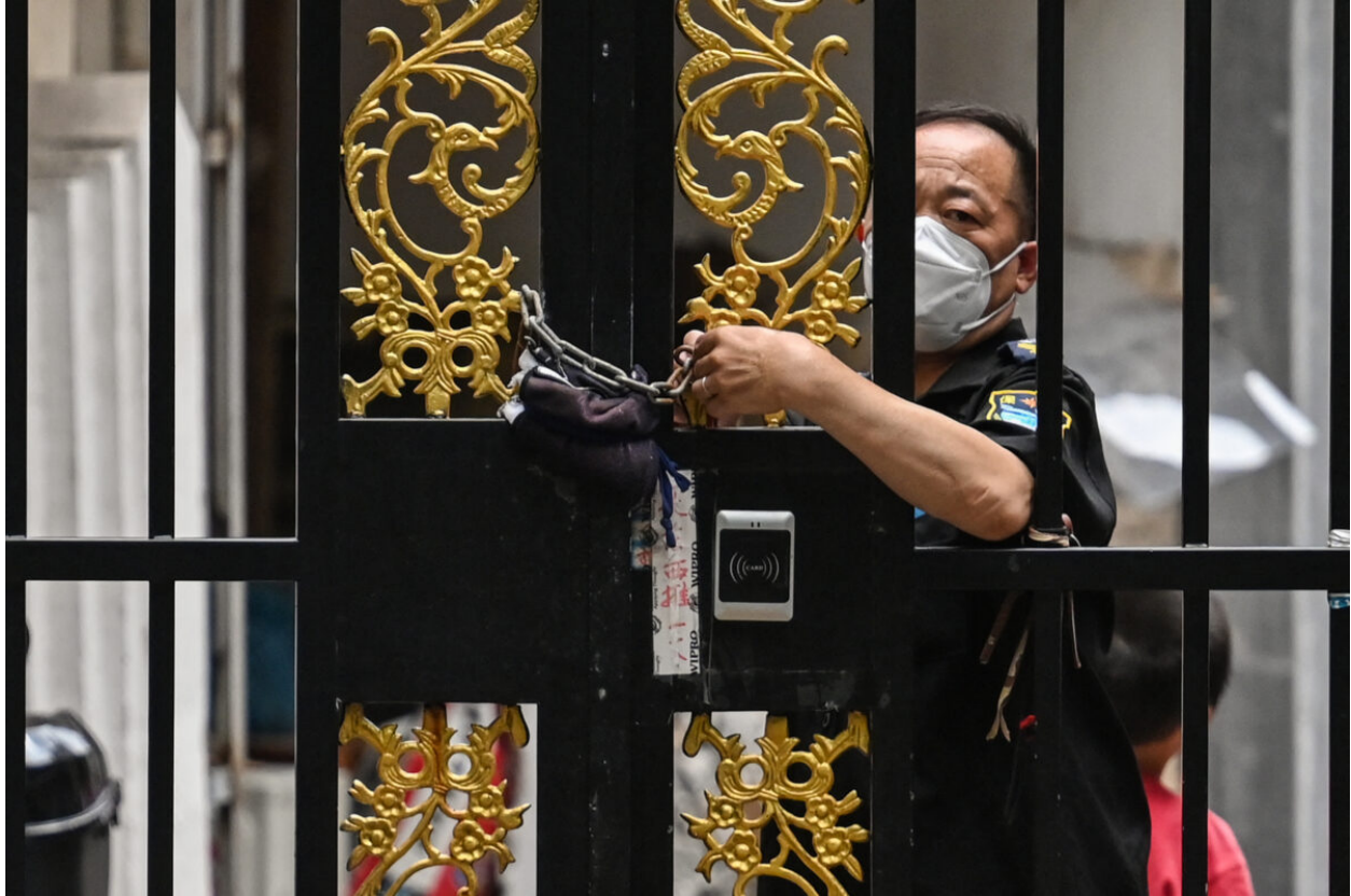
A security worker locks a door with a chain in a neighborhood under a COVID-19 lockdown in the Jing'an district of Shanghai on June 2, 2022.

Is the patience of the people wearing thin into the eighth week of the lockdowns in Shanghai and other Chinese cities?