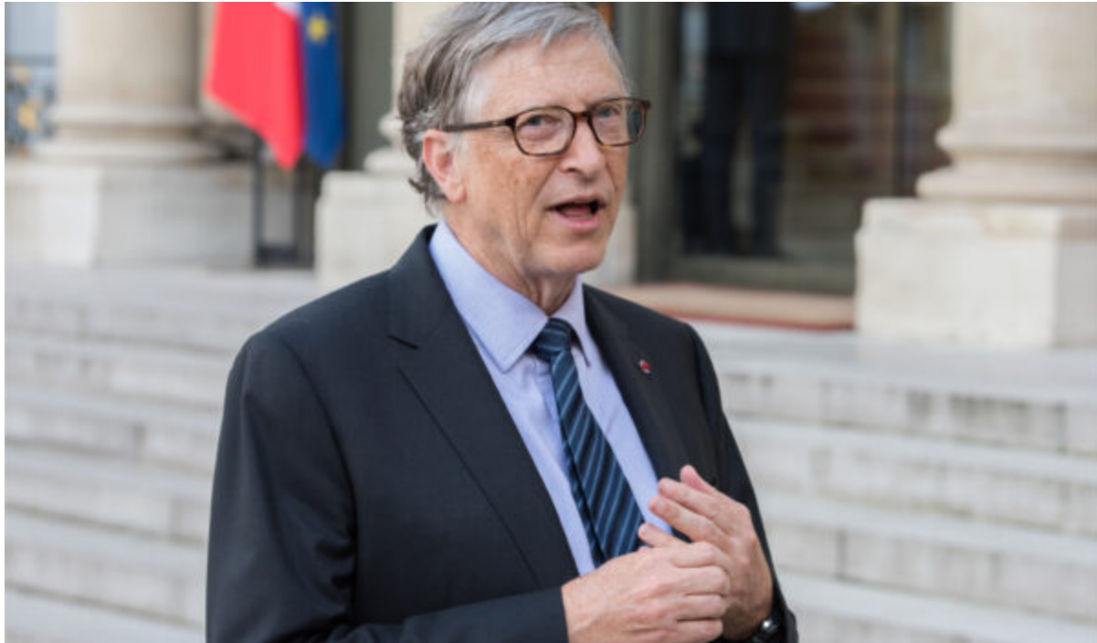
Bill Gates at the Élysée Palace to encounter the French president to speak about Bill & Melinda Gates Foundation (BMGF), in Paris, on April 16, 2018.

The Nuclear Threat Initiative (NTI) partnered with the Munich Security Conference to imagine a pandemic scenario with monkeypox. Following the hypothetical warning from Gates, the germ game imagined a strain of monkeypox, released through a bioterrorist attack, that had been altered to be resistant to vaccines.