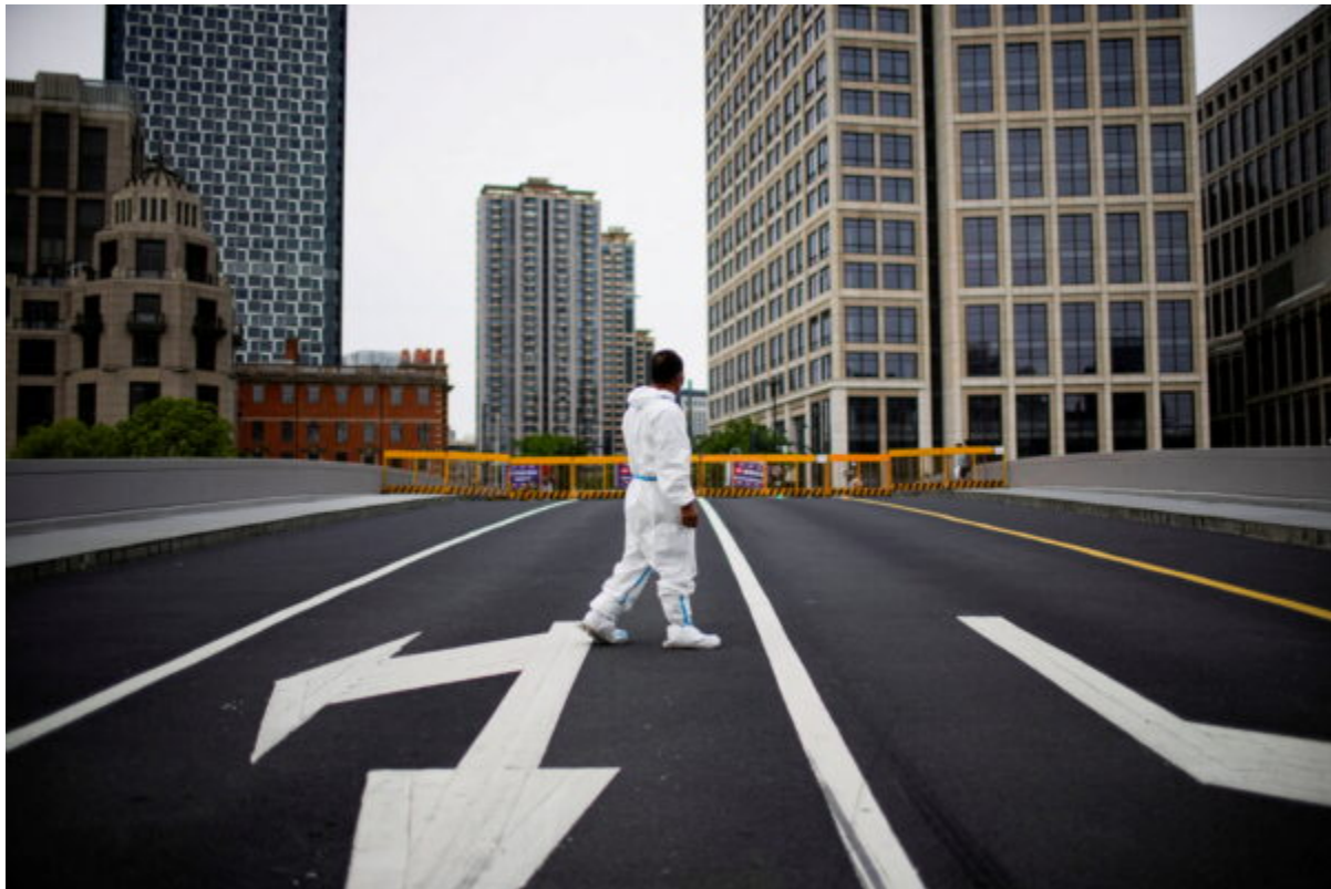
worker in a protective suit walks on a closed bridge during lockdown in Shanghai, China, May 18, 2022.

Under Xi Jinping , China has been implementing a zero-COVID policy to varying degrees since the beginning of the pandemic, using it to boost the regime’s “success” in controlling the spread of the virus as being superior to Western democracies.