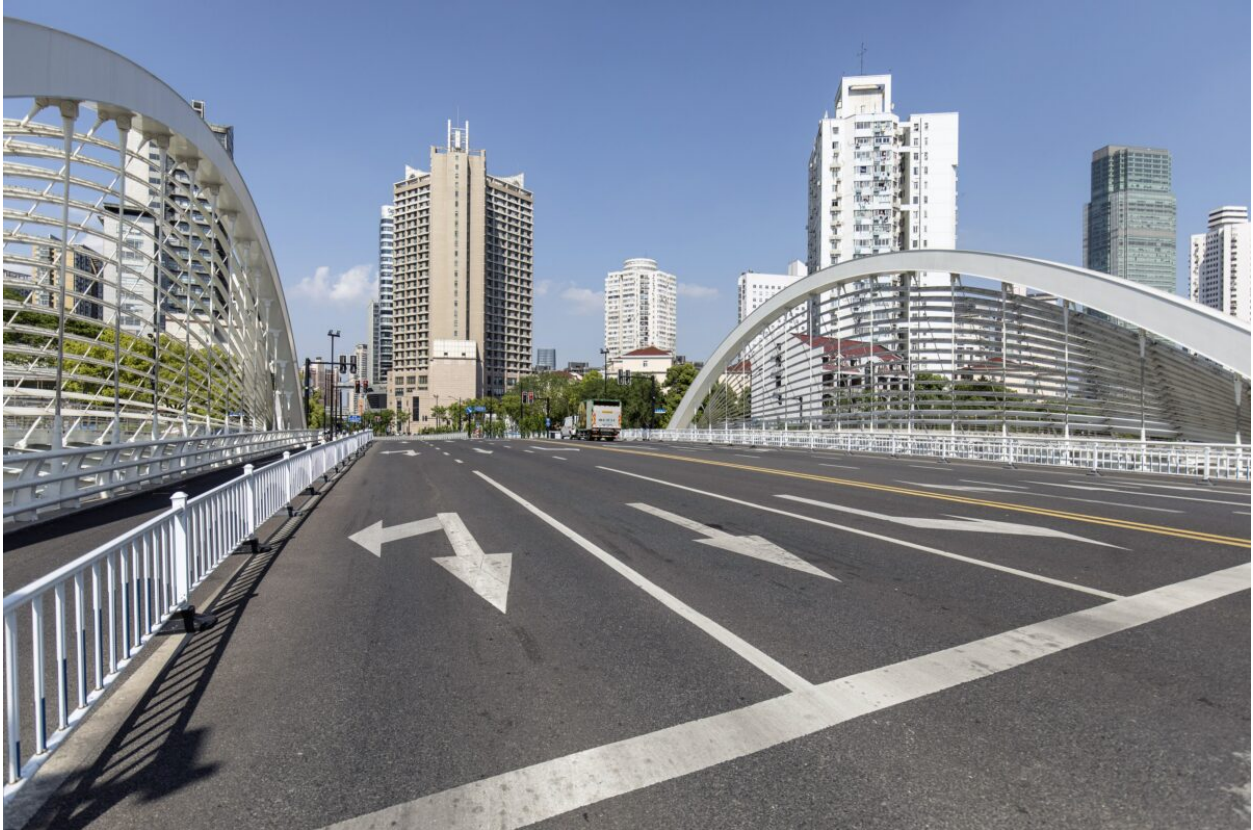
A nearly-empty road during a lockdown due to COVID-19 in Shanghai, China , on May 5, 2022.

As Mao Zedong famously said, “A single spark can start a prairie fire.” And the classical Chinese works beyond Sunzi (Sun-Tzu) are replete with references to a regime that loses favor with the people being undermined. As I’ve explained , legalist scholars, like Han Feizi and Lord Shang, believed in a strong government that could compel people. But they failed to account for the idea that they could only compel bodies, and the minds would resist such a naked use of power.